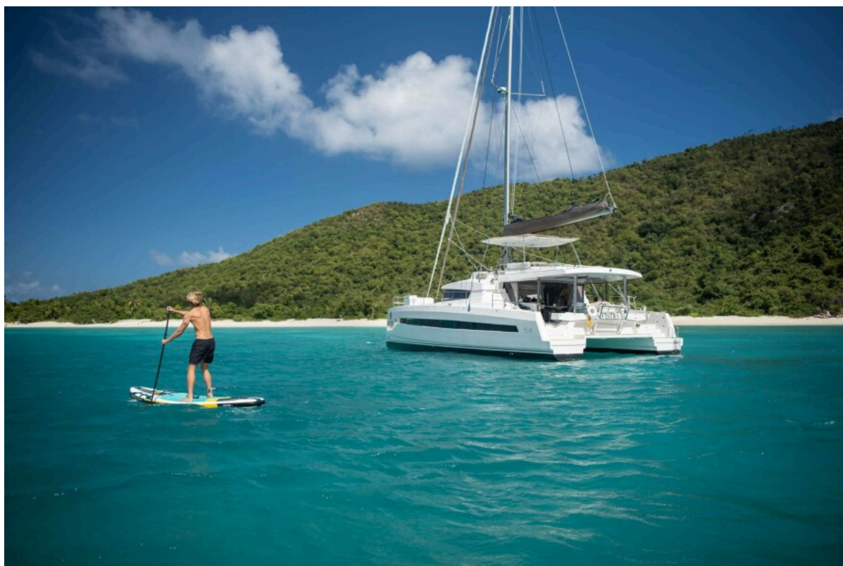
Used Sail Catamaran for sale 2020 BALI CATAMARANS Bali 5.4 - AD ASTRA