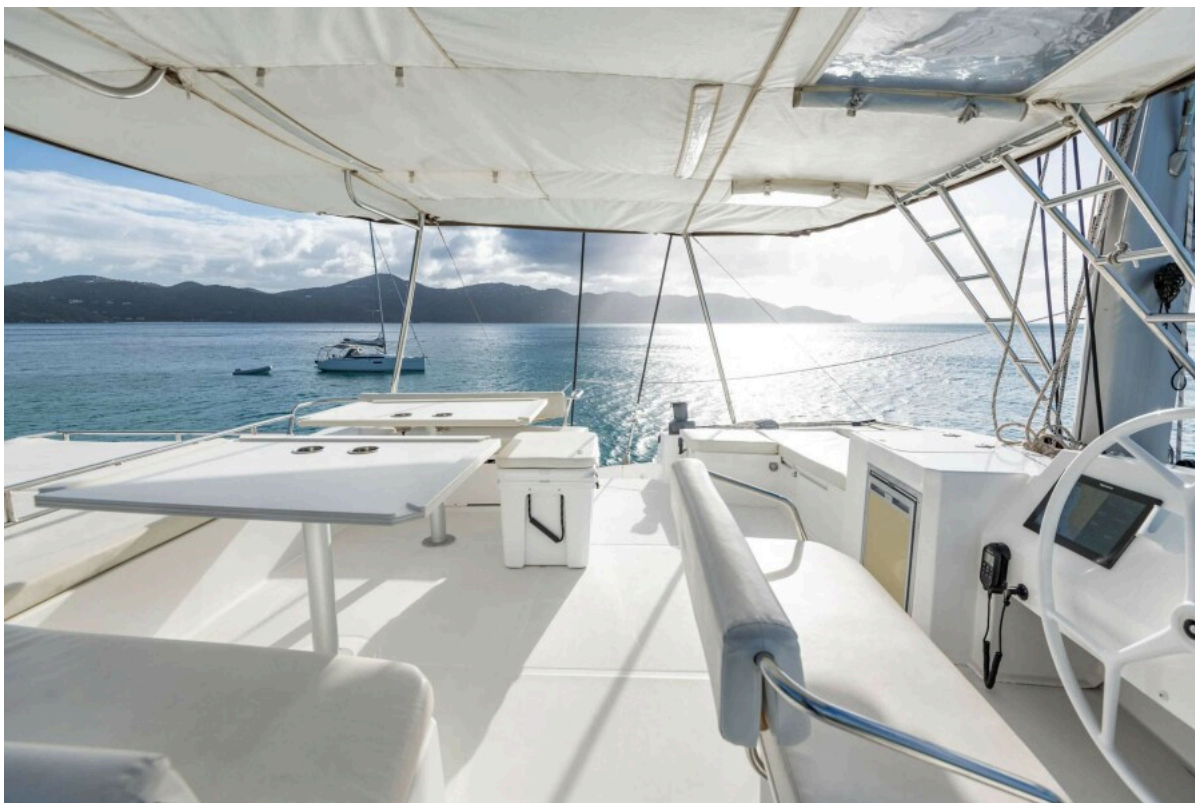
Used Sail Catamaran for sale 2020 BALI CATAMARANS Bali 5.4 - AD ASTRA