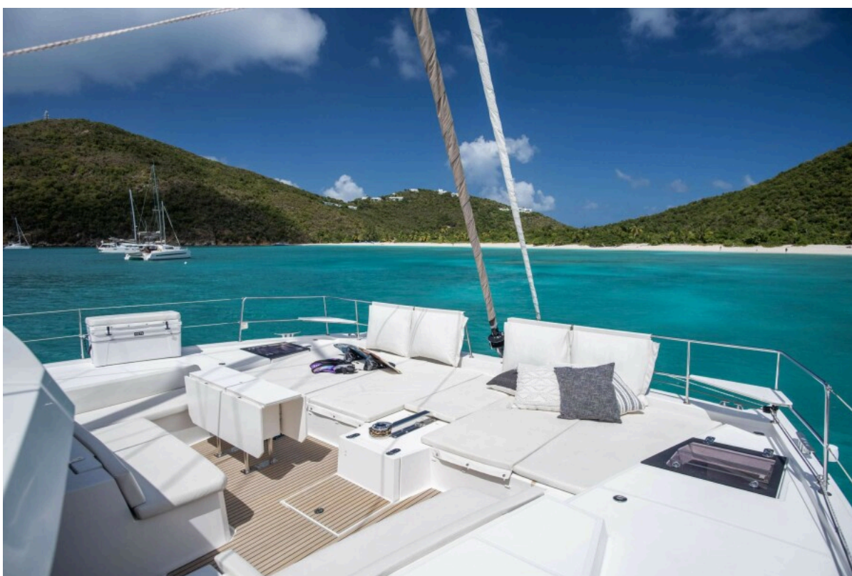
Used Sail Catamaran for sale 2020 BALI CATAMARANS Bali 5.4 - AD ASTRA