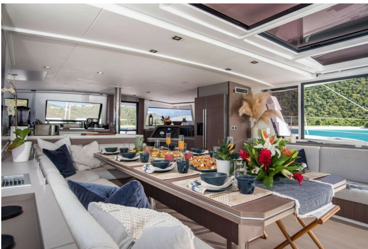
Used Sail Catamaran for sale 2020 BALI CATAMARANS Bali 5.4 - AD ASTRA