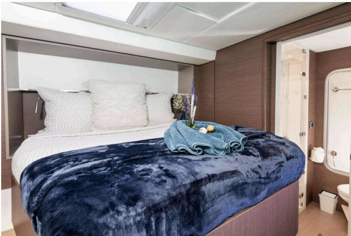
Used Sail Catamaran for sale 2020 BALI CATAMARANS Bali 5.4 - AD ASTRA