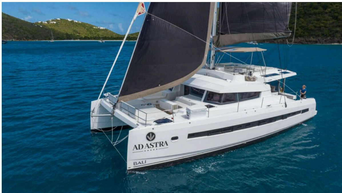
Used Sail Catamaran for sale 2020 BALI CATAMARANS Bali 5.4 - AD ASTRA