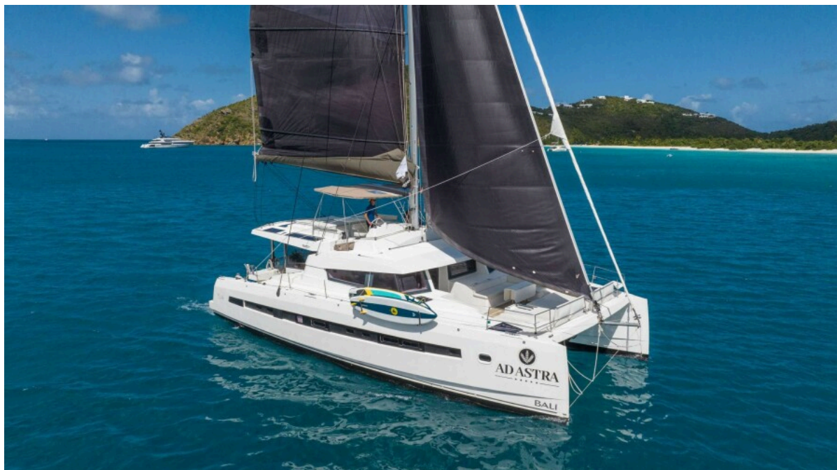
Used Sail Catamaran for sale 2020 BALI CATAMARANS Bali 5.4 - AD ASTRA