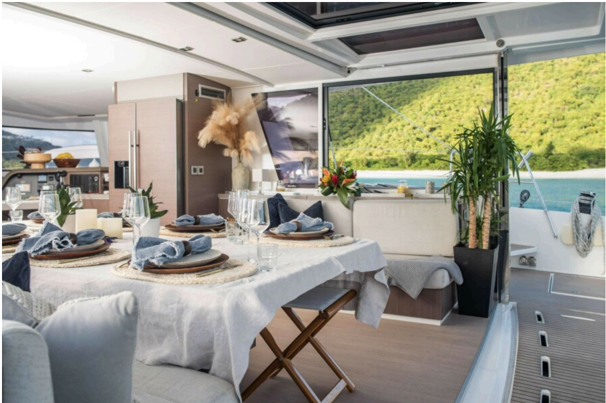
Used Sail Catamaran for sale 2020 BALI CATAMARANS Bali 5.4 - AD ASTRA