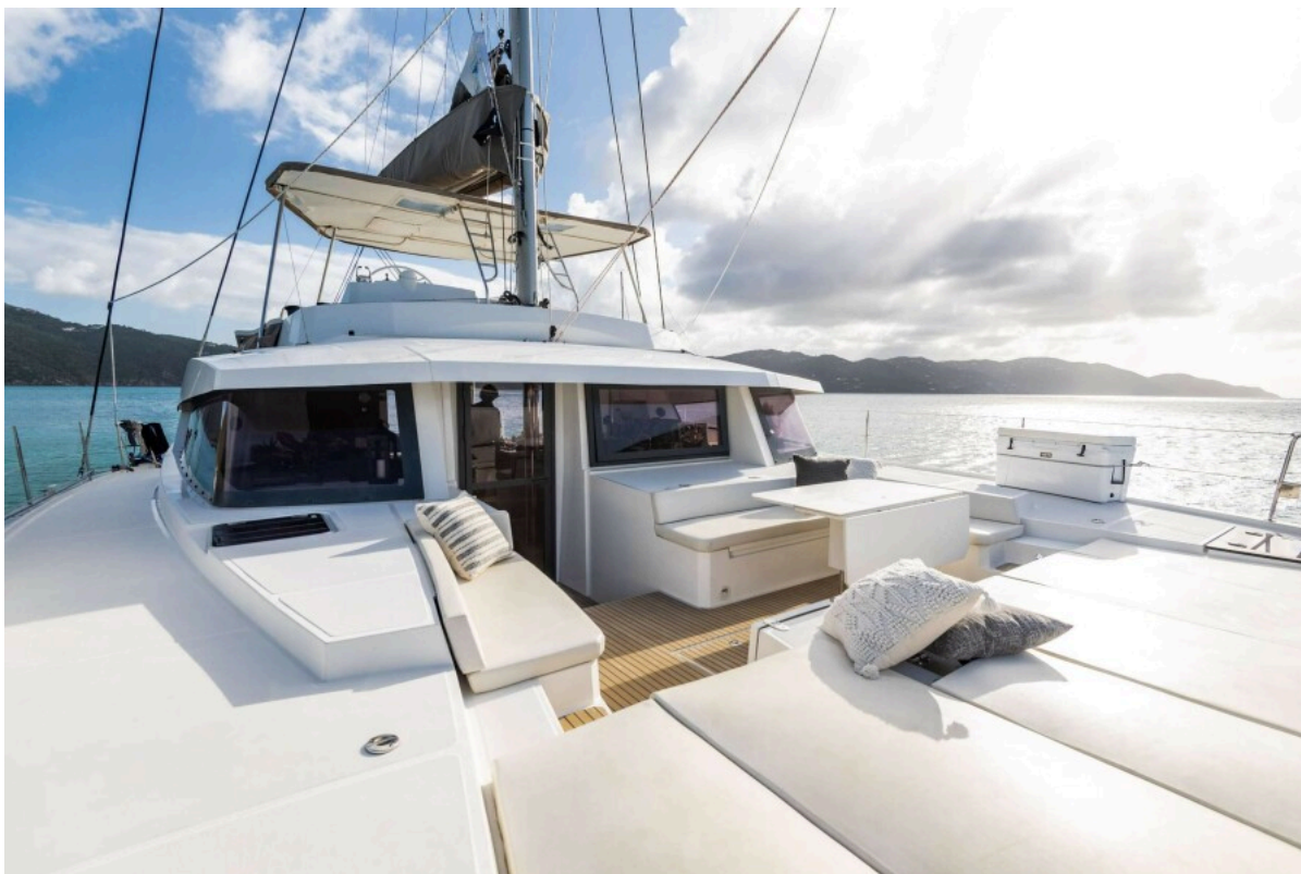
Used Sail Catamaran for sale 2020 BALI CATAMARANS Bali 5.4 - AD ASTRA