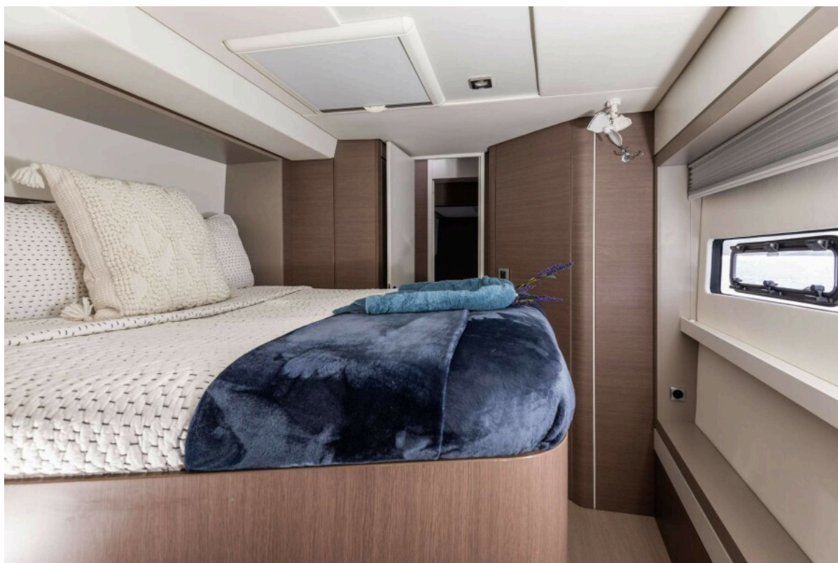
Used Sail Catamaran for sale 2020 BALI CATAMARANS Bali 5.4 - AD ASTRA