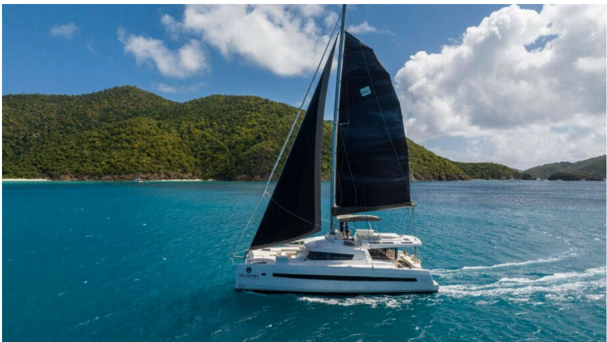
Used Sail Catamaran for sale 2020 BALI CATAMARANS Bali 5.4 - AD ASTRA