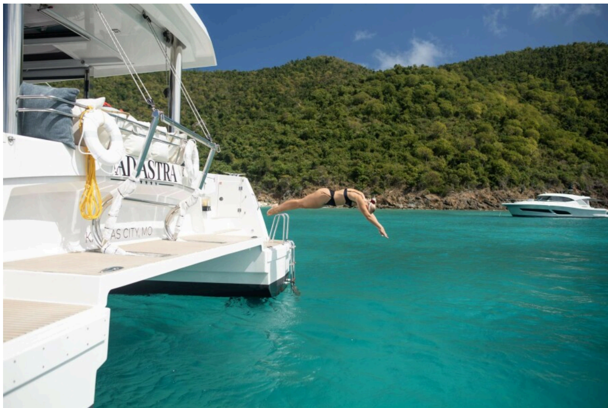
Used Sail Catamaran for sale 2020 BALI CATAMARANS Bali 5.4 - AD ASTRA