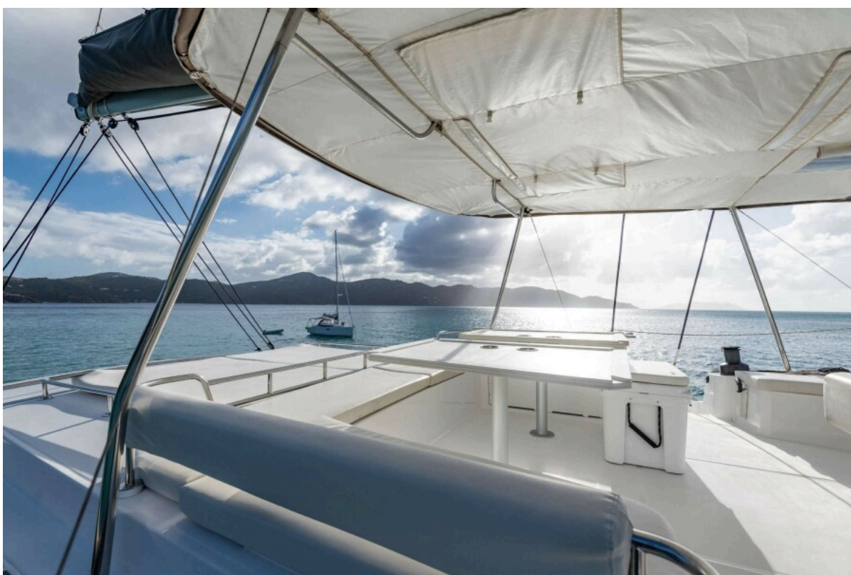
Used Sail Catamaran for sale 2020 BALI CATAMARANS Bali 5.4 - AD ASTRA