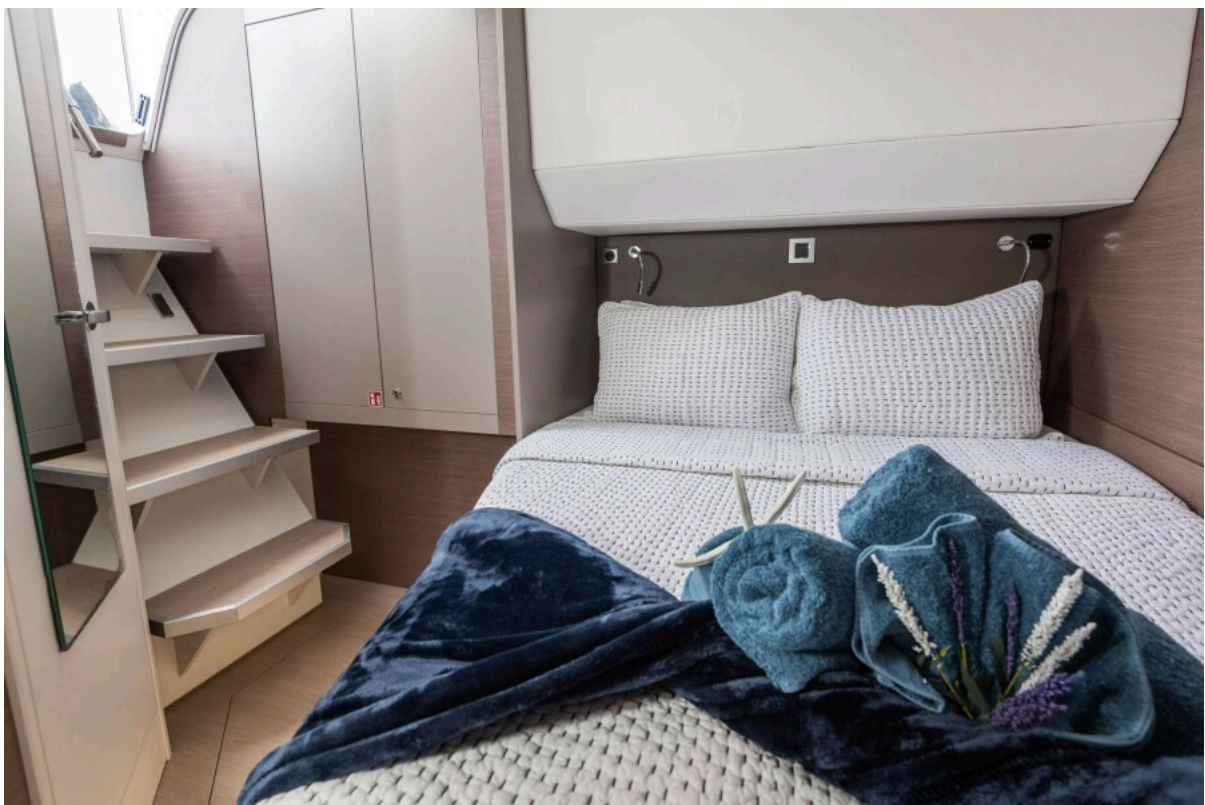
Used Sail Catamaran for sale 2020 BALI CATAMARANS Bali 5.4 - AD ASTRA