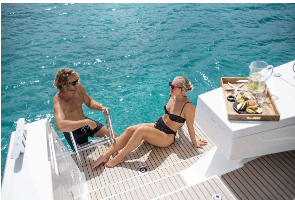
Used Sail Catamaran for sale 2020 BALI CATAMARANS Bali 5.4 - AD ASTRA