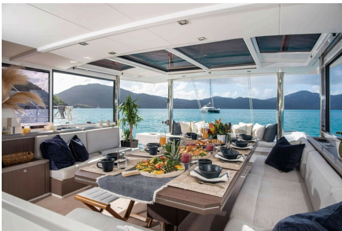
Used Sail Catamaran for sale 2020 BALI CATAMARANS Bali 5.4 - AD ASTRA