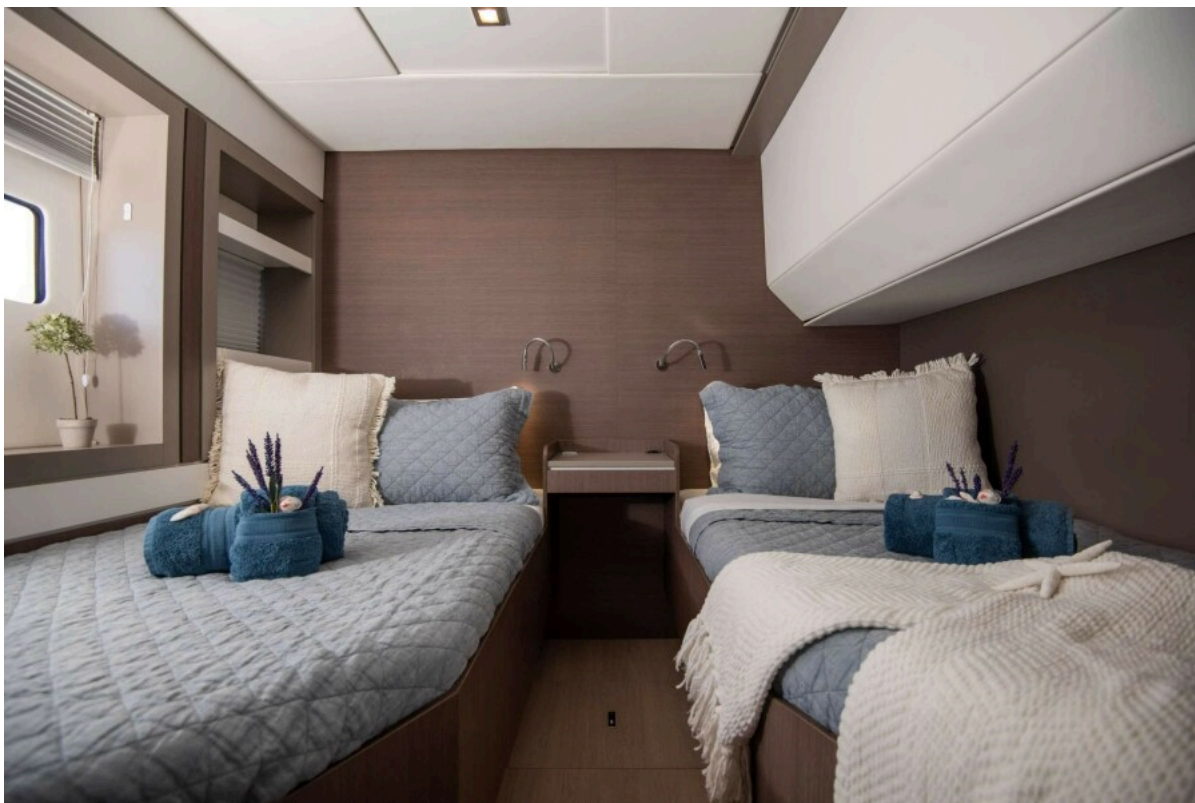
Used Sail Catamaran for sale 2020 BALI CATAMARANS Bali 5.4 - AD ASTRA