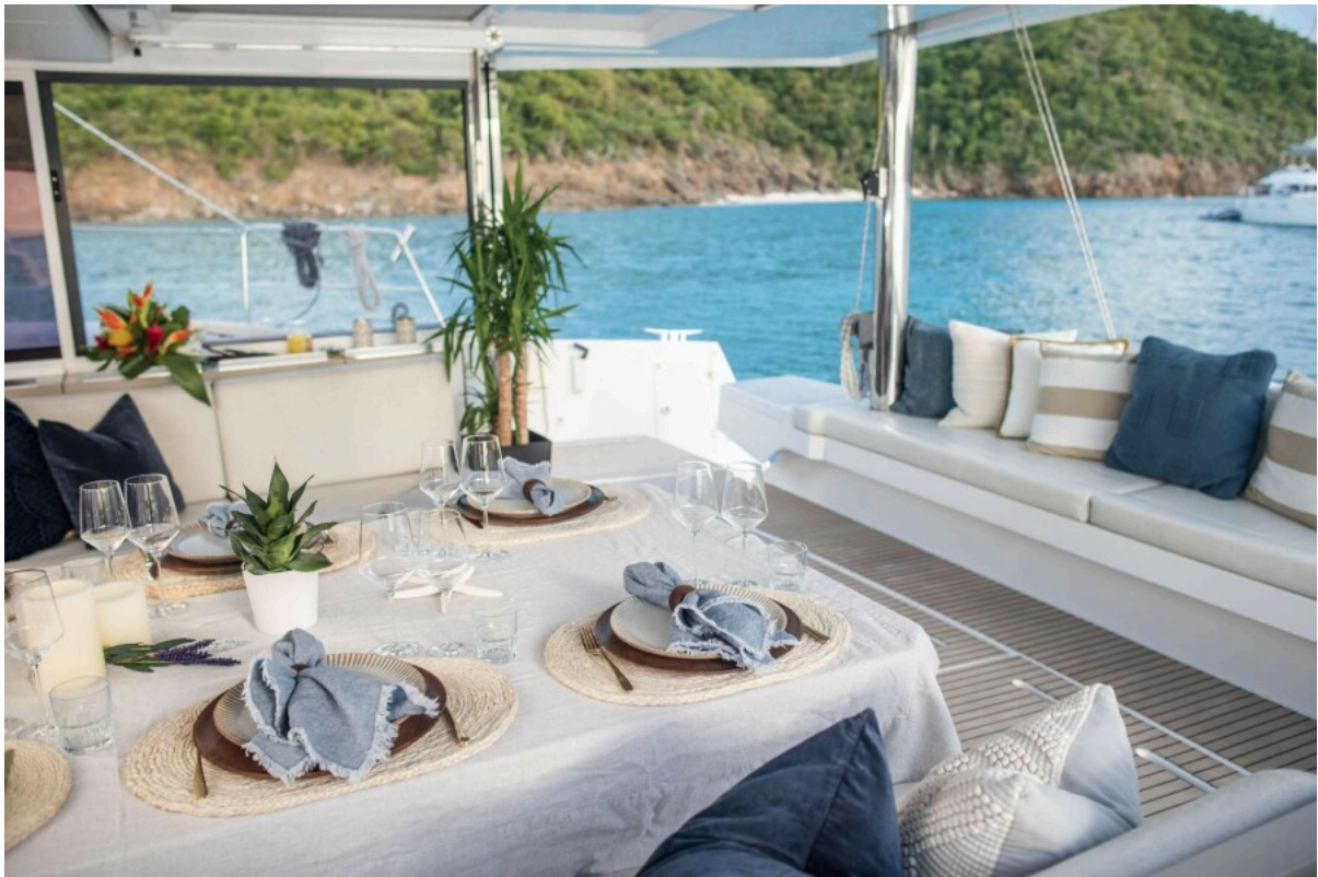
Used Sail Catamaran for sale 2020 BALI CATAMARANS Bali 5.4 - AD ASTRA