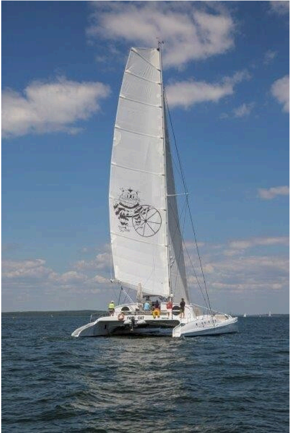
Used Sail Catamaran for sale 1991 CUSTOM US BUILT Morelli/Miller - FAT CAT