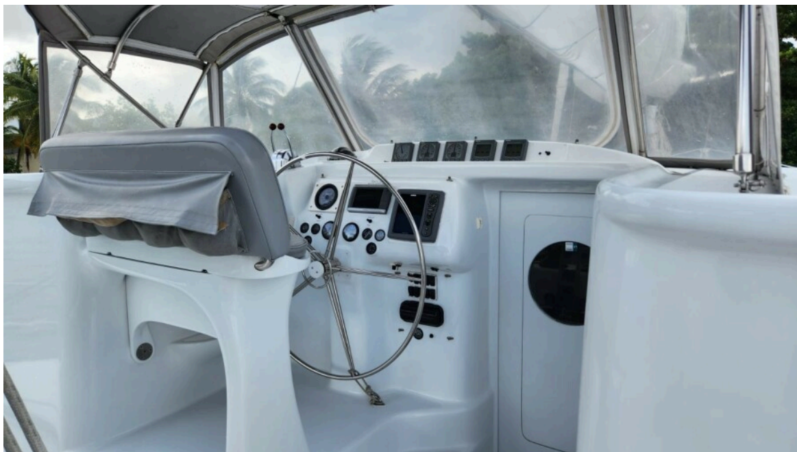
Used Sail Catamaran for sale 1991 CUSTOM US BUILT Morelli/Miller - FAT CAT