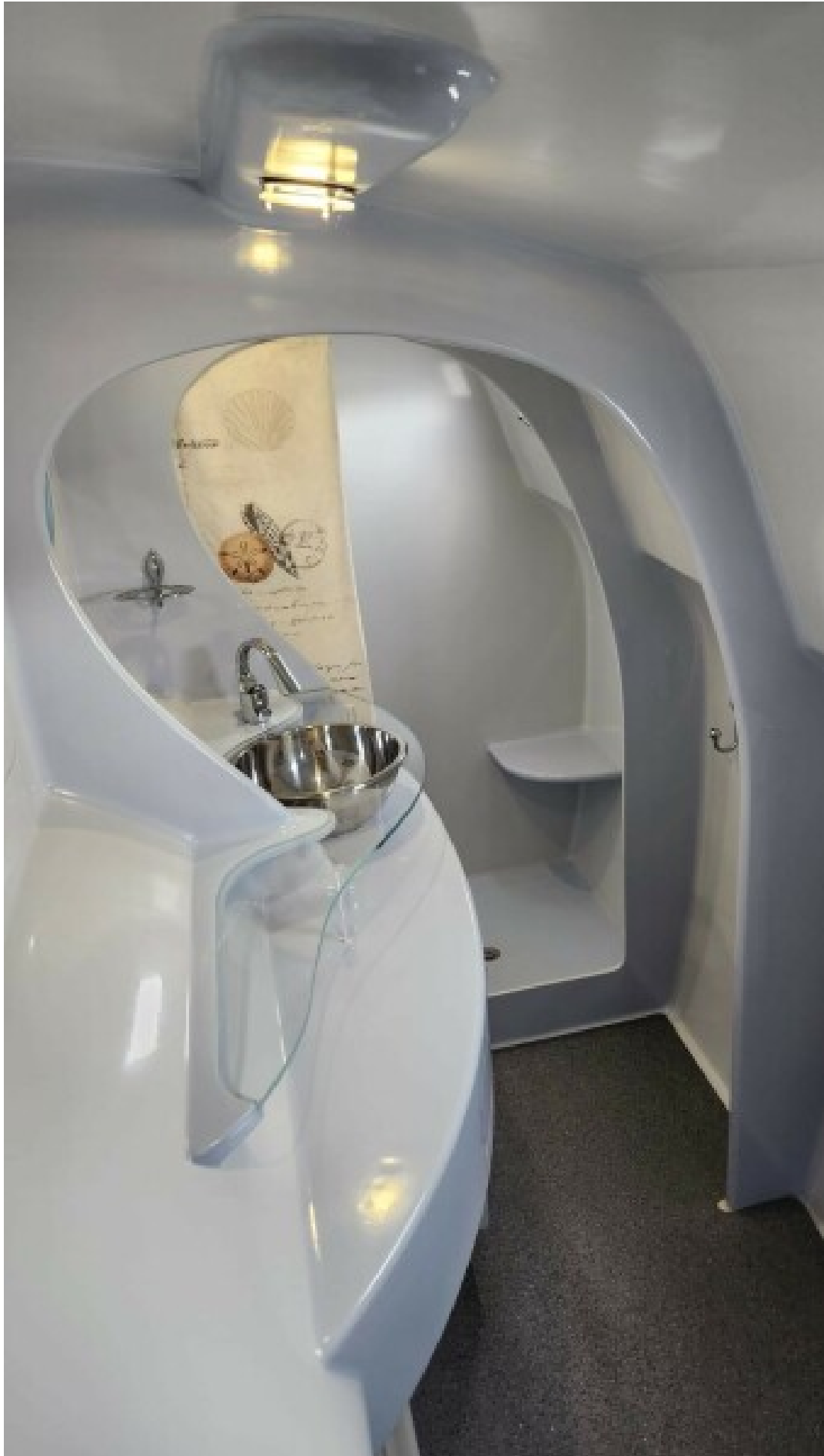
Used Sail Catamaran for sale 1991 CUSTOM US BUILT Morelli/Miller - FAT CAT