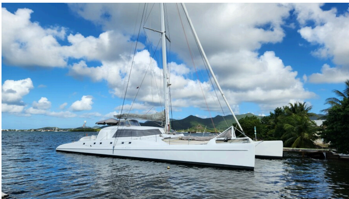
Used Sail Catamaran for sale 1991 CUSTOM US BUILT Morelli/Miller - FAT CAT