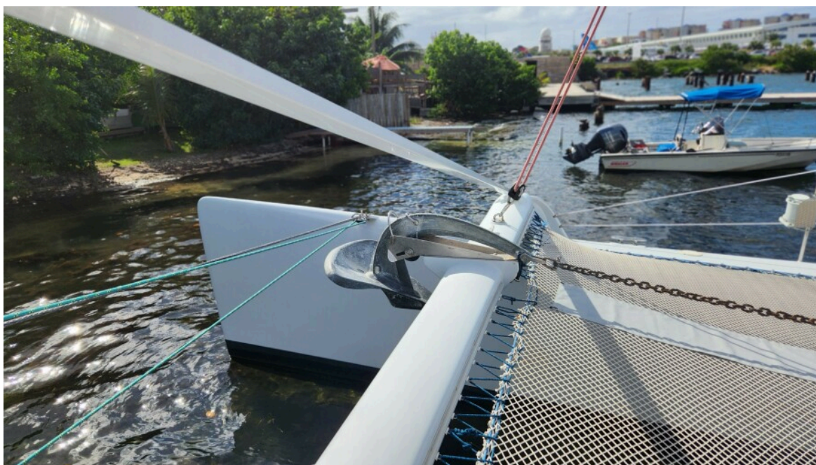
Used Sail Catamaran for sale 1991 CUSTOM US BUILT Morelli/Miller - FAT CAT