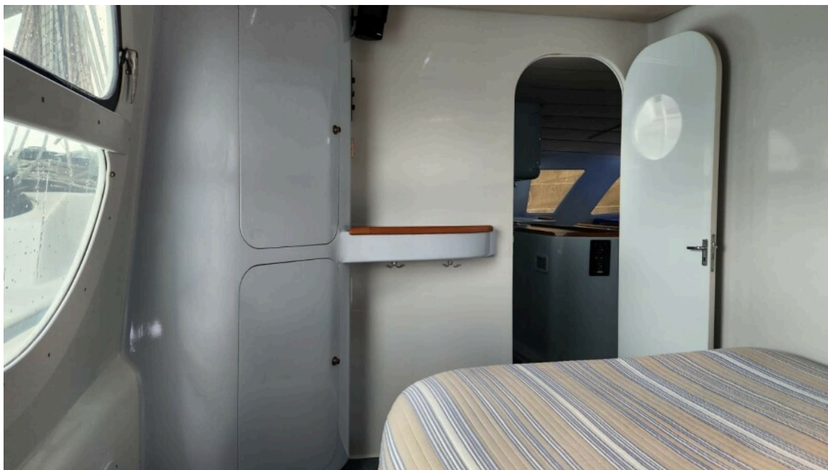
Used Sail Catamaran for sale 1991 CUSTOM US BUILT Morelli/Miller - FAT CAT