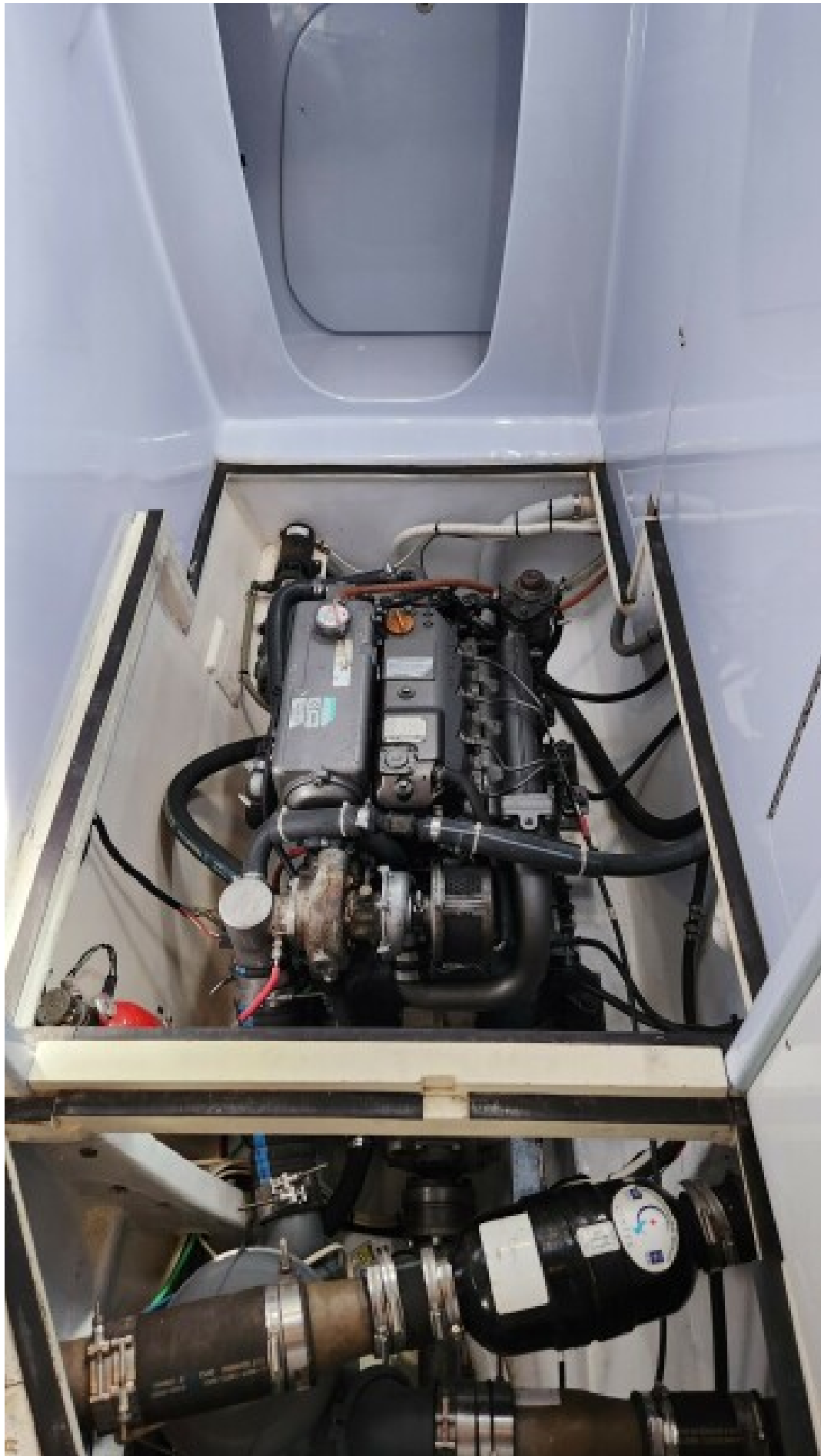
Used Sail Catamaran for sale 1991 CUSTOM US BUILT Morelli/Miller - FAT CAT