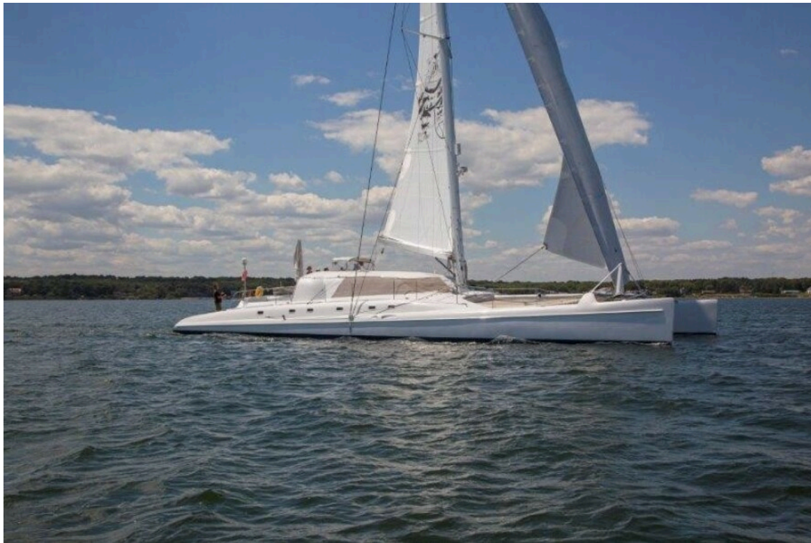
Used Sail Catamaran for sale 1991 CUSTOM US BUILT Morelli/Miller - FAT CAT