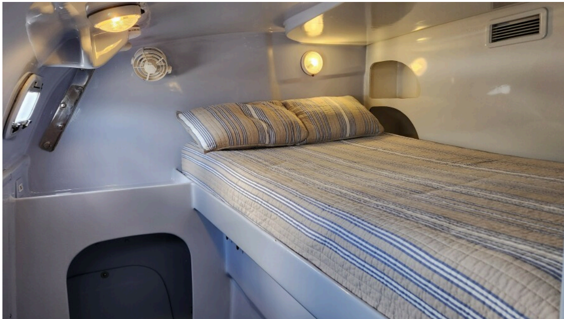
Used Sail Catamaran for sale 1991 CUSTOM US BUILT Morelli/Miller - FAT CAT