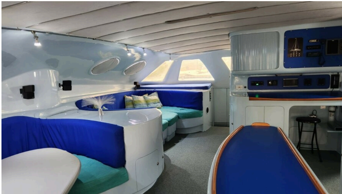
Used Sail Catamaran for sale 1991 CUSTOM US BUILT Morelli/Miller - FAT CAT