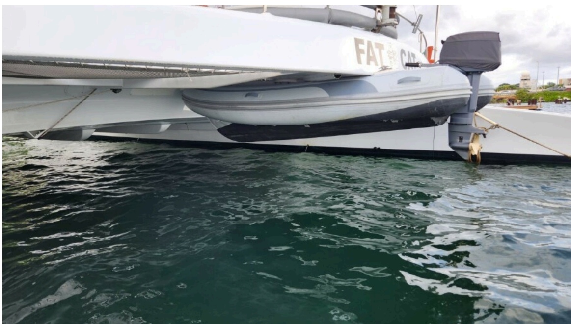
Used Sail Catamaran for sale 1991 CUSTOM US BUILT Morelli/Miller - FAT CAT