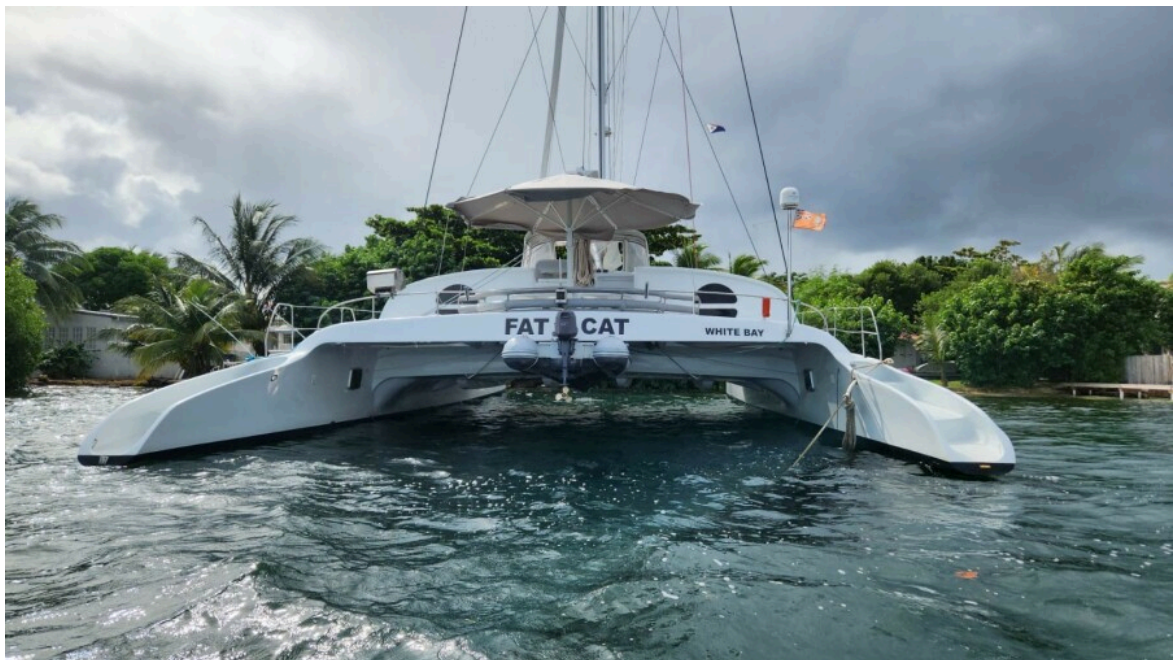
Used Sail Catamaran for sale 1991 CUSTOM US BUILT Morelli/Miller - FAT CAT