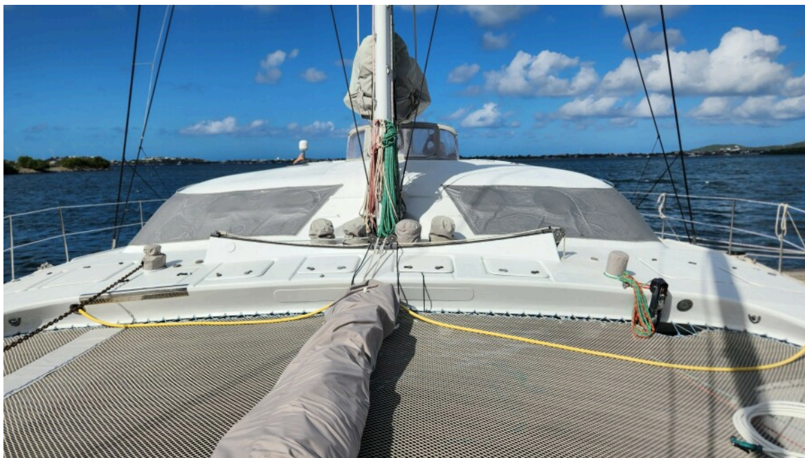
Used Sail Catamaran for sale 1991 CUSTOM US BUILT Morelli/Miller - FAT CAT