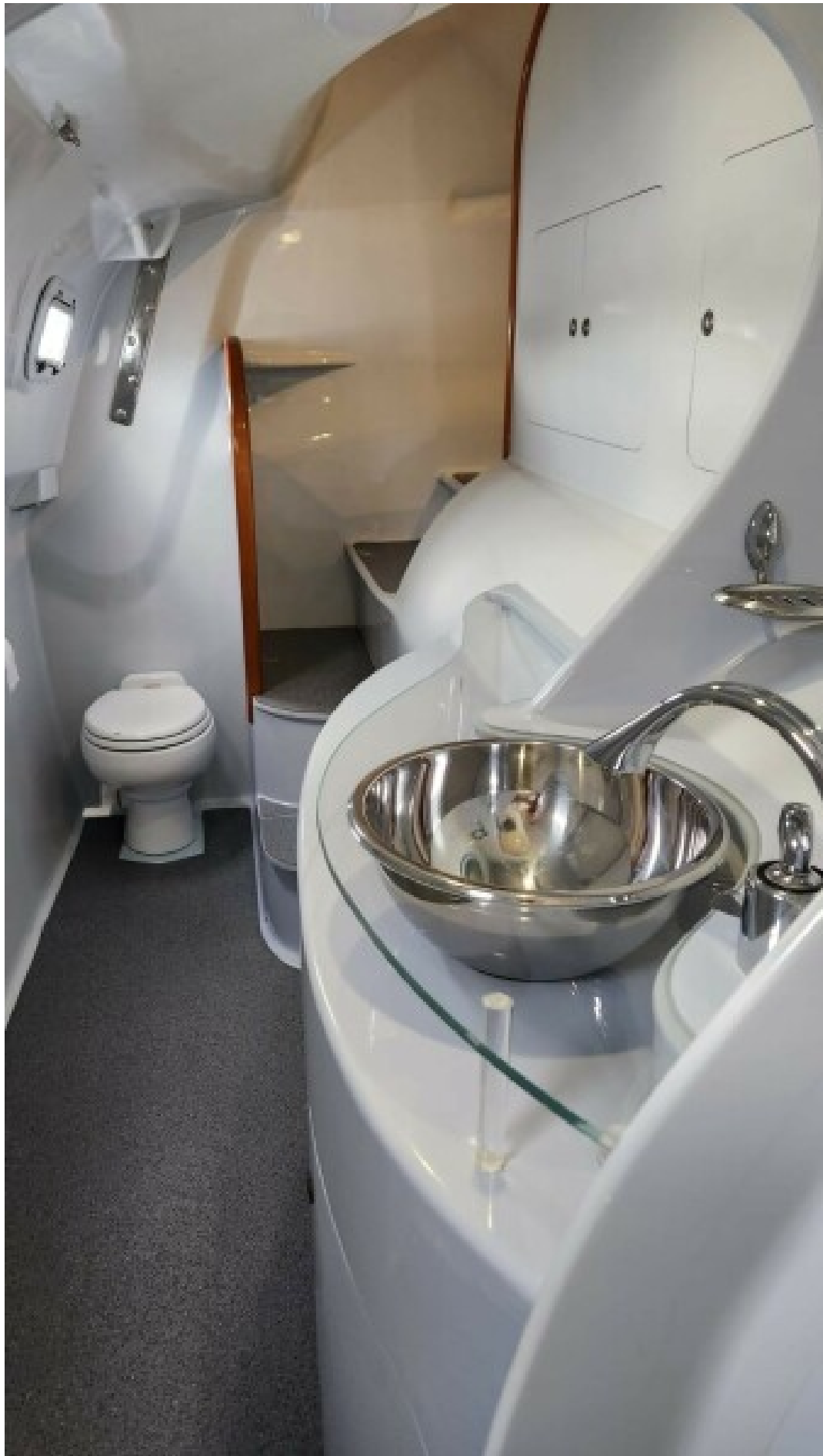
Used Sail Catamaran for sale 1991 CUSTOM US BUILT Morelli/Miller - FAT CAT