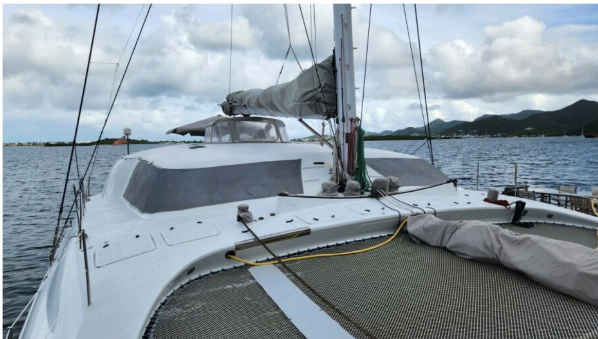
Used Sail Catamaran for sale 1991 CUSTOM US BUILT Morelli/Miller - FAT CAT