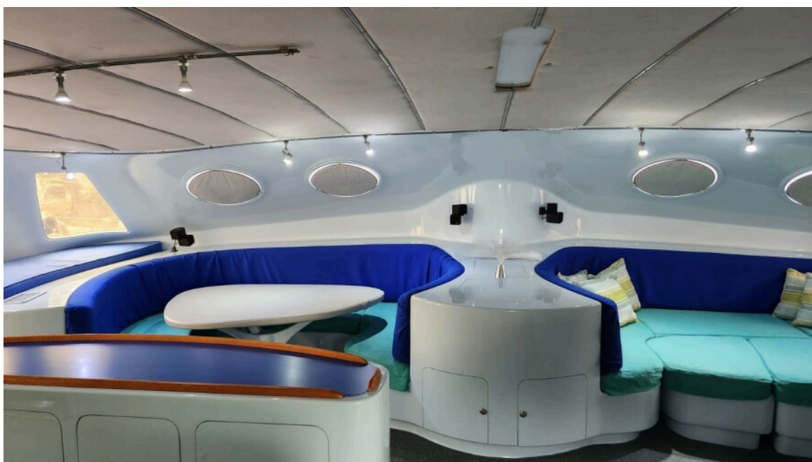
Used Sail Catamaran for sale 1991 CUSTOM US BUILT Morelli/Miller - FAT CAT