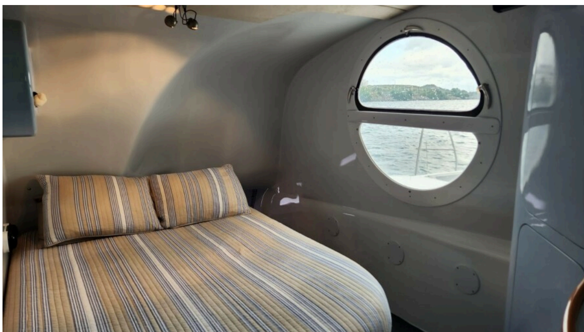
Used Sail Catamaran for sale 1991 CUSTOM US BUILT Morelli/Miller - FAT CAT