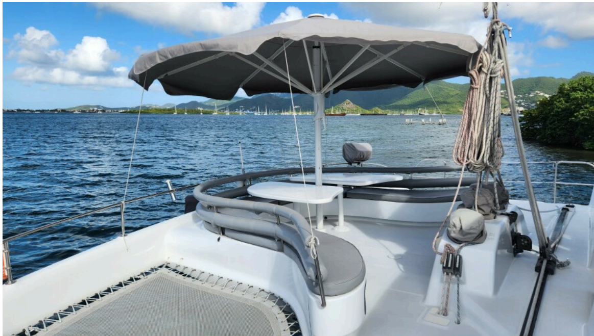
Used Sail Catamaran for sale 1991 CUSTOM US BUILT Morelli/Miller - FAT CAT