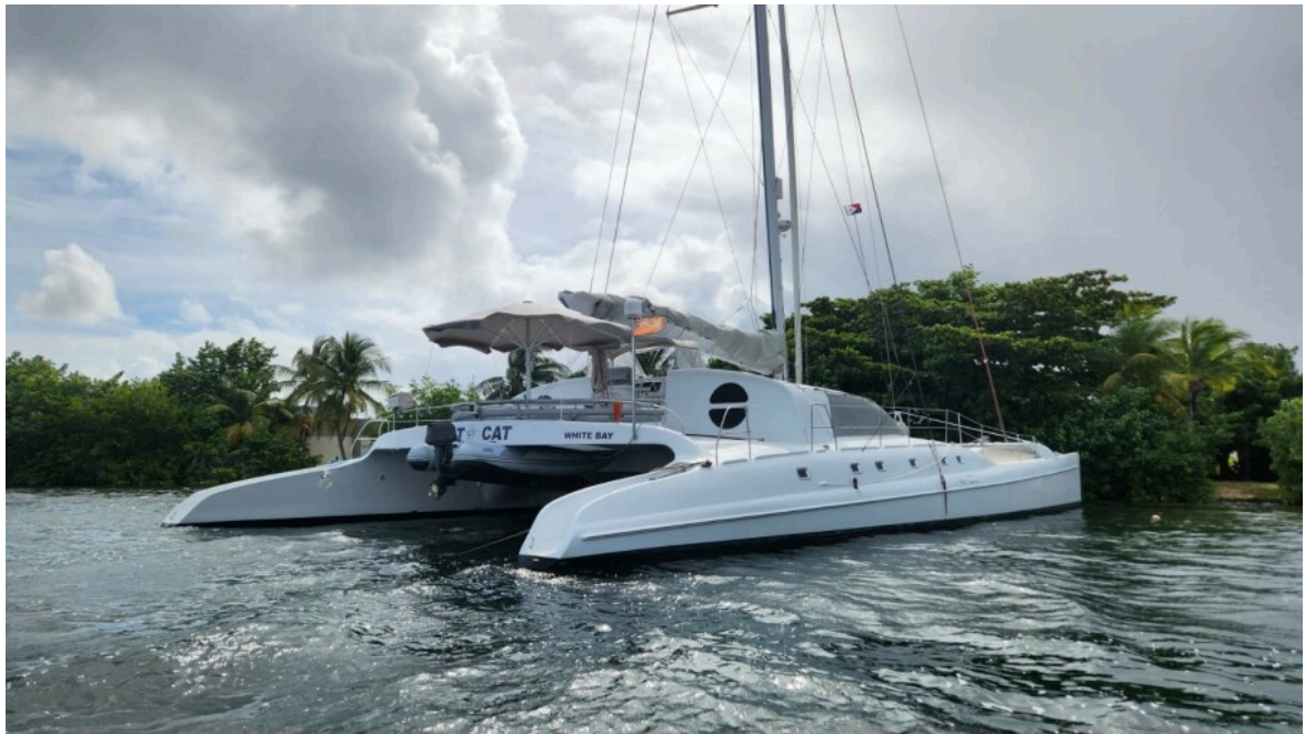
Used Sail Catamaran for sale 1991 CUSTOM US BUILT Morelli/Miller - FAT CAT