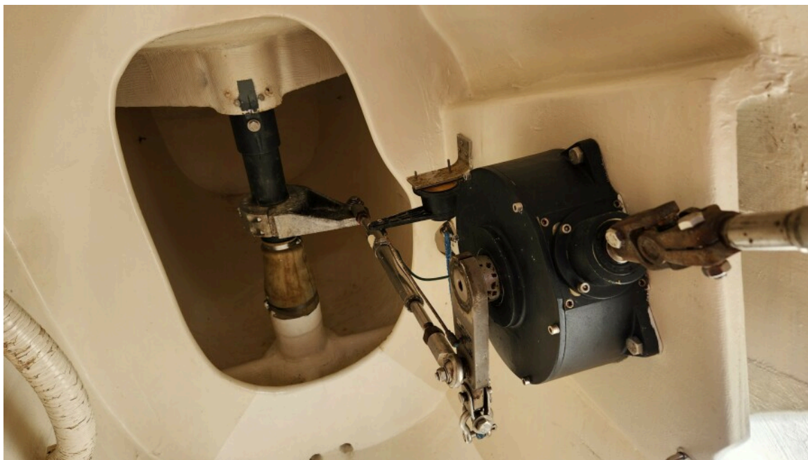
Used Sail Catamaran for sale 1991 CUSTOM US BUILT Morelli/Miller - FAT CAT