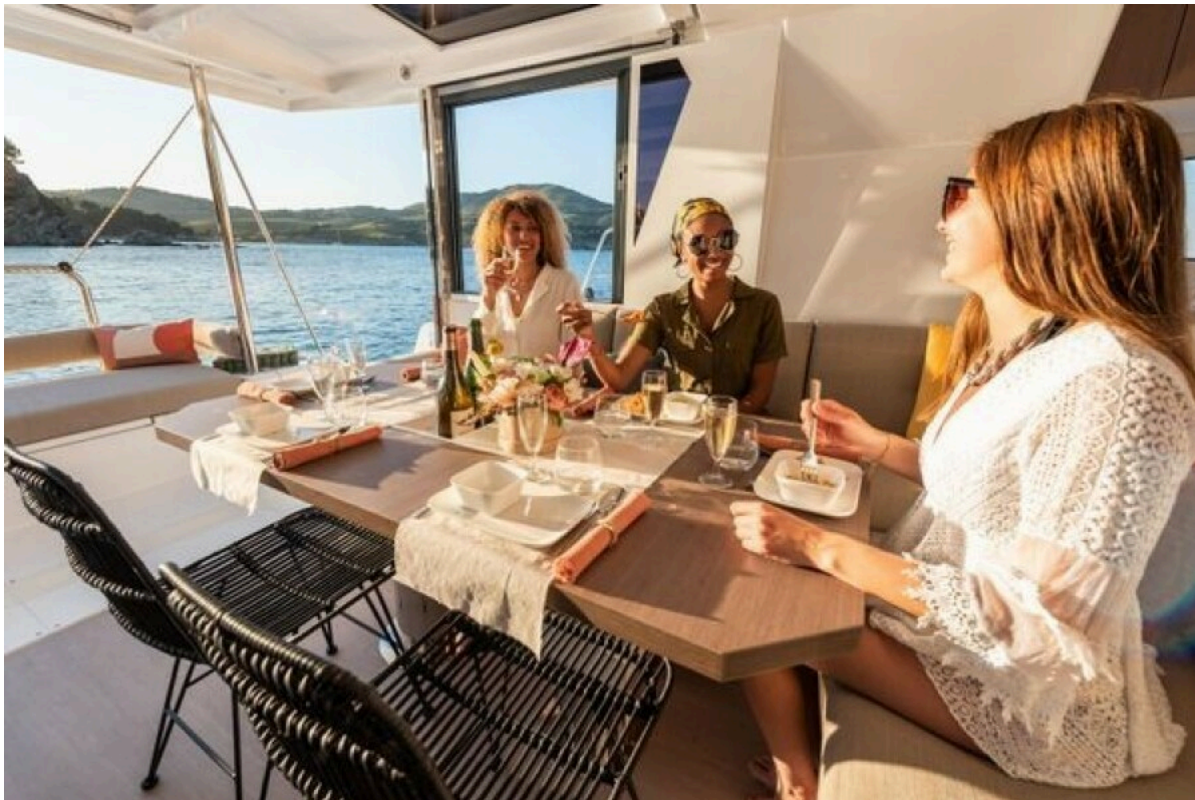
New Sail Catamaran for sale 2024 BALI CATAMARANS Bali 4.2 - BIMINI