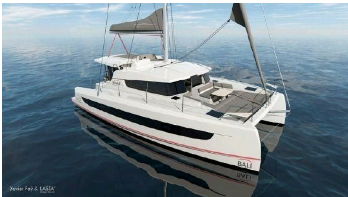
New Sail Catamaran for sale 2024 BALI CATAMARANS Bali 4.2 - BIMINI