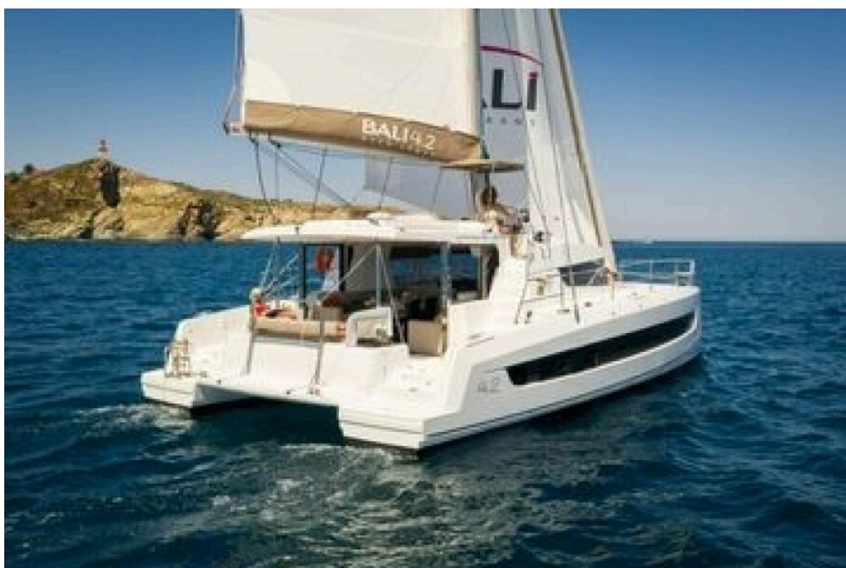
New Sail Catamaran for sale 2024 BALI CATAMARANS Bali 4.2 - BIMINI