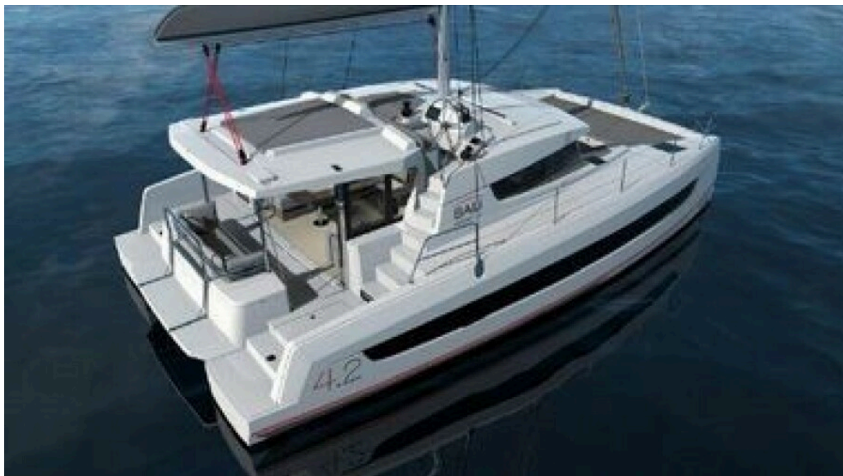
New Sail Catamaran for sale 2024 BALI CATAMARANS Bali 4.2 - BIMINI