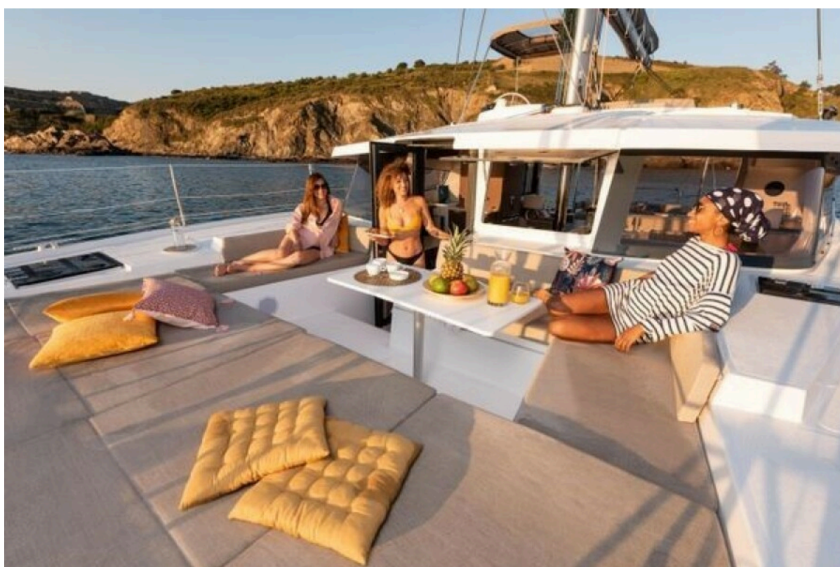
New Sail Catamaran for sale 2024 BALI CATAMARANS Bali 4.2 - BIMINI