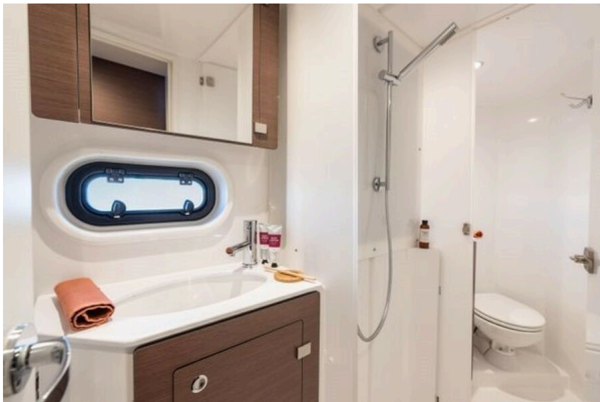
New Sail Catamaran for sale 2024 BALI CATAMARANS Bali 4.2 - BIMINI