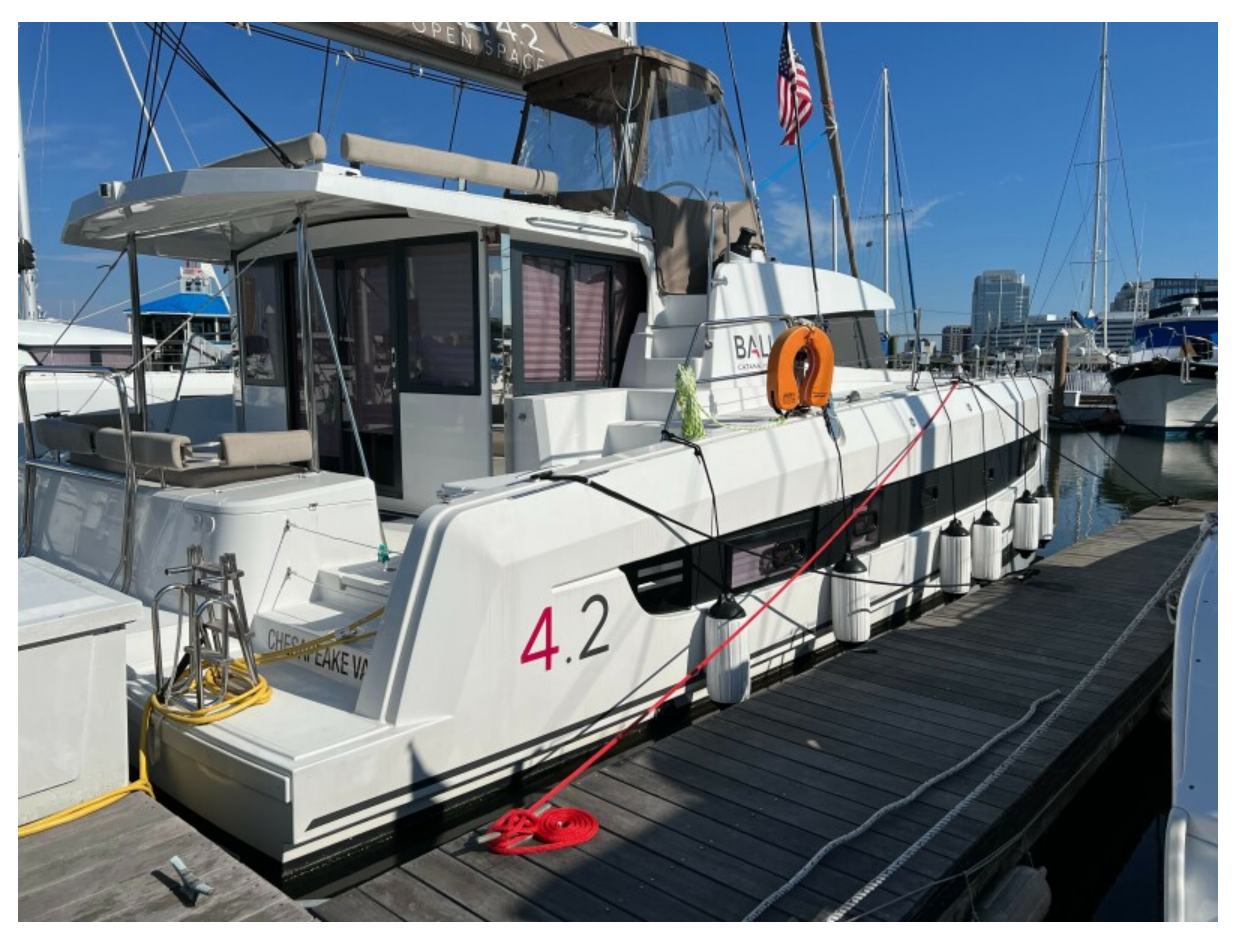
Used Sail Catamaran for sale 2023 BALI CATAMARANS Bali 4.2 - ADVENTEURE II