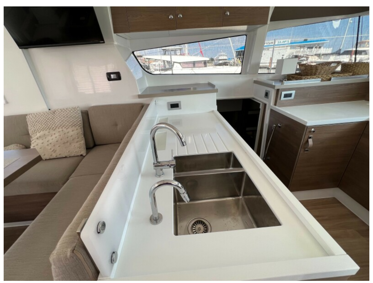
Used Sail Catamaran for sale 2023 BALI CATAMARANS Bali 4.2 - ADVENTEURE II