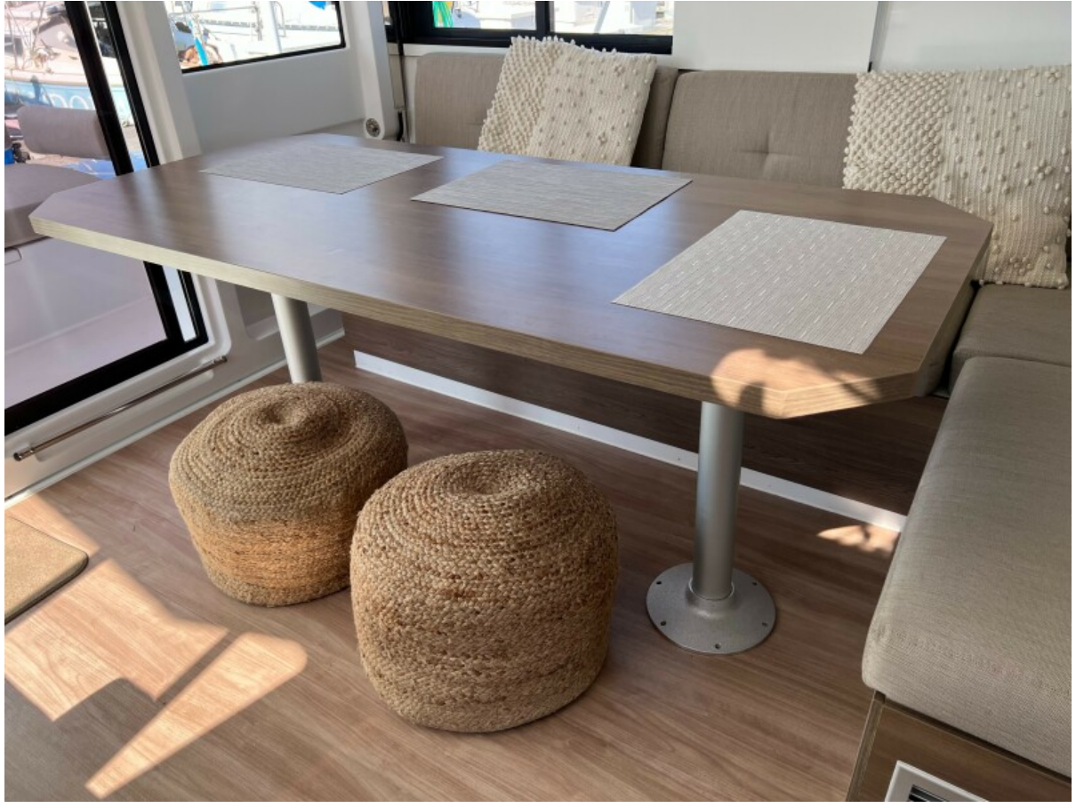
Used Sail Catamaran for sale 2023 BALI CATAMARANS Bali 4.2 - ADVENTEURE II