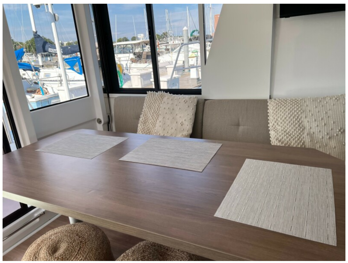
Used Sail Catamaran for sale 2023 BALI CATAMARANS Bali 4.2 - ADVENTEURE II