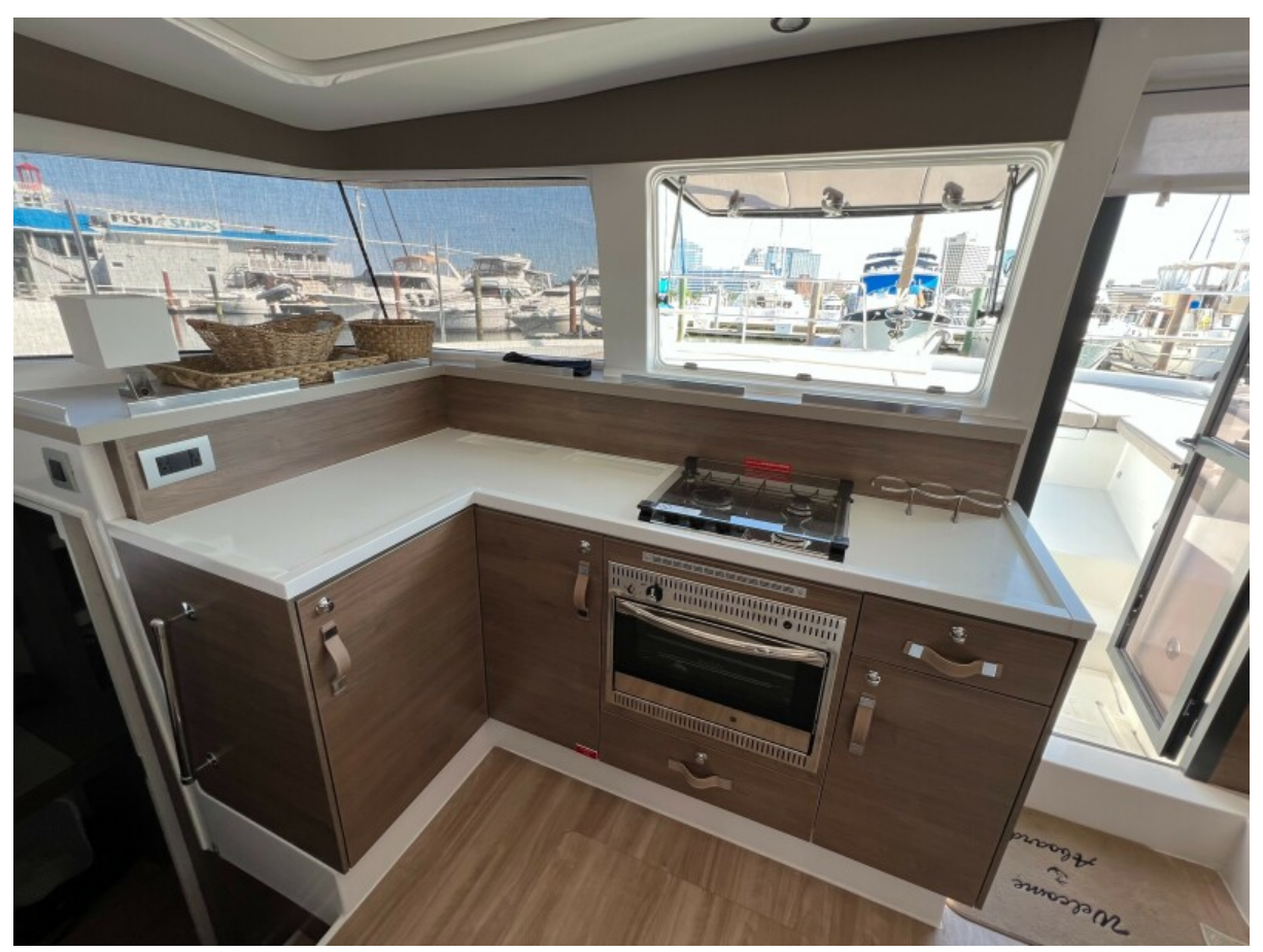
Used Sail Catamaran for sale 2023 BALI CATAMARANS Bali 4.2 - ADVENTEURE II