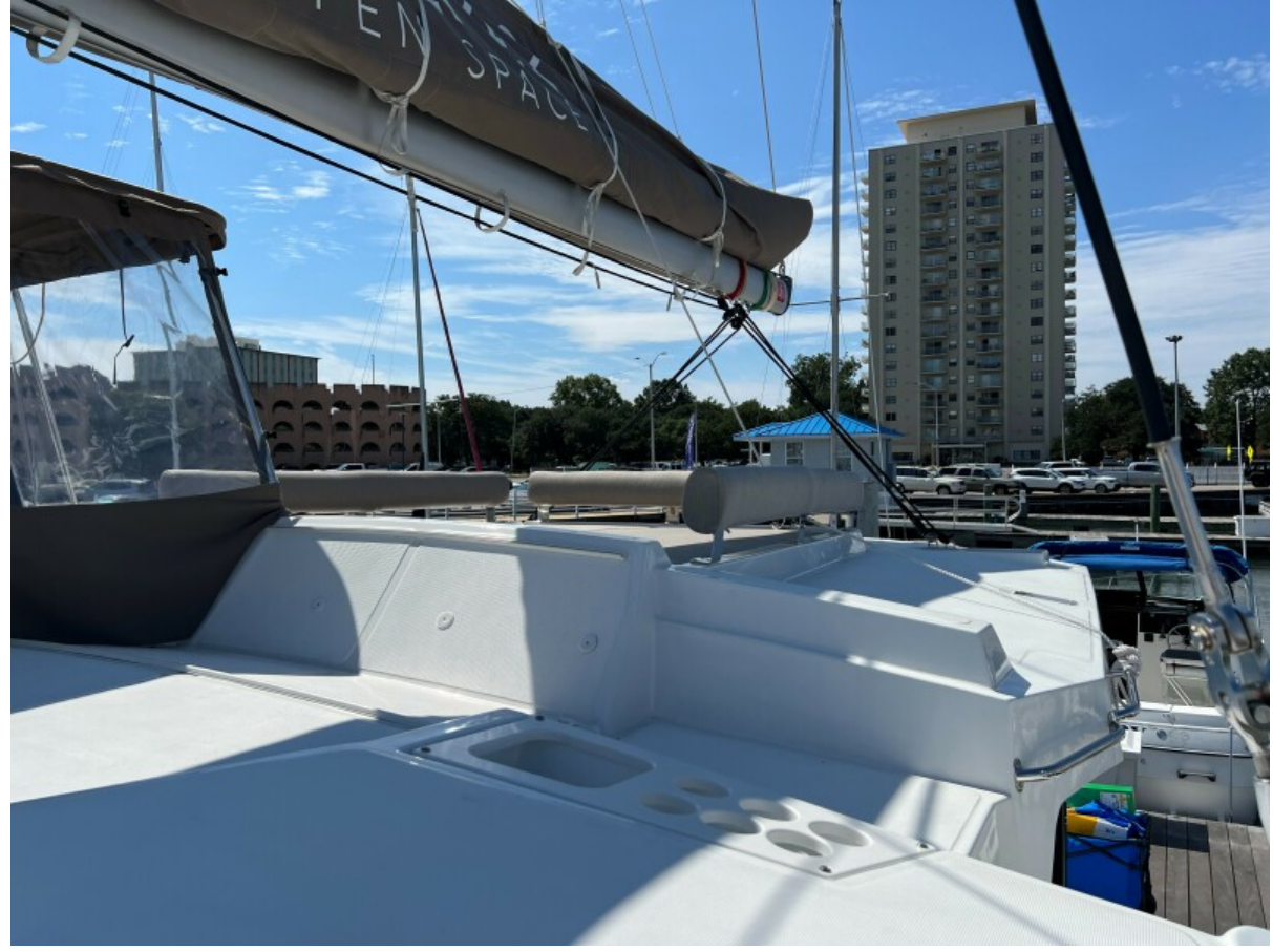
Used Sail Catamaran for sale 2023 BALI CATAMARANS Bali 4.2 - ADVENTEURE II