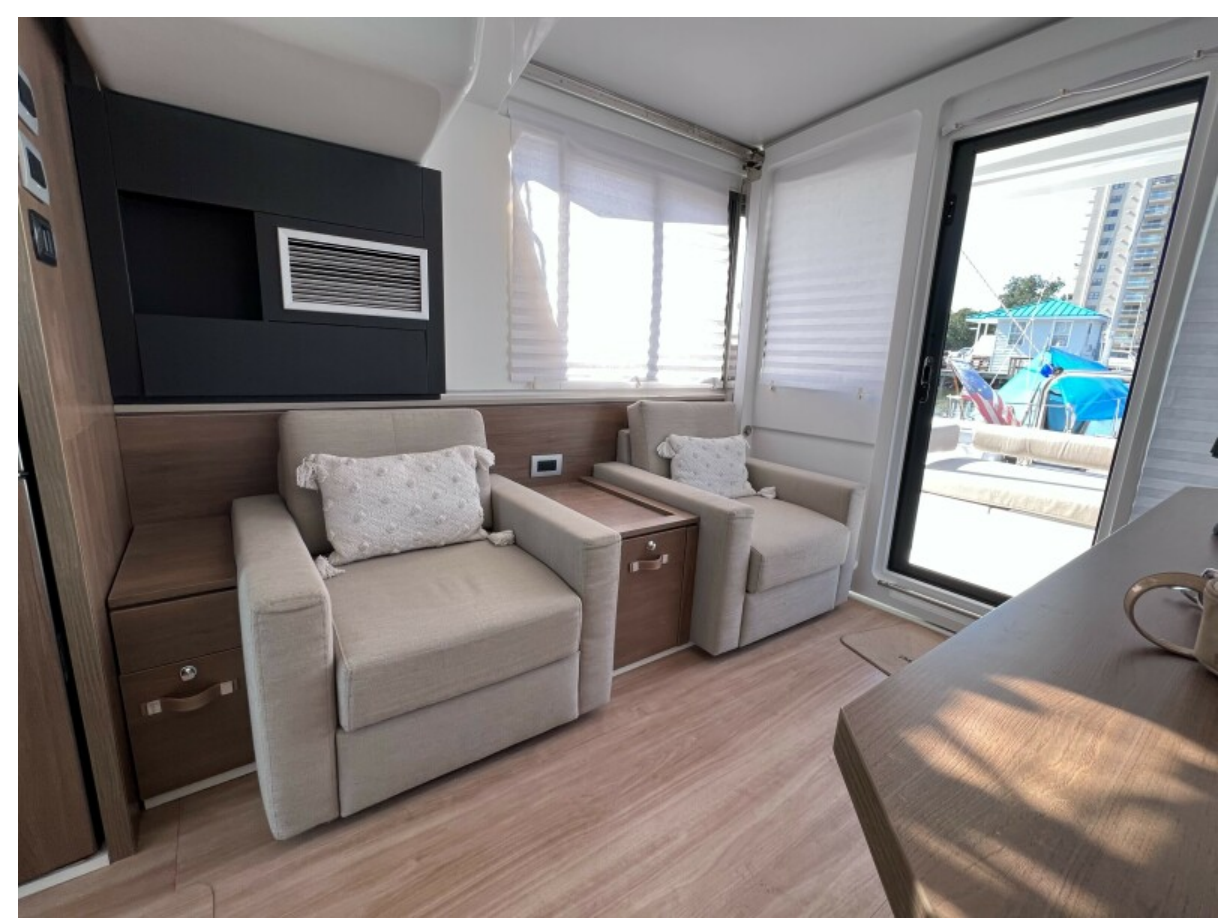
Used Sail Catamaran for sale 2023 BALI CATAMARANS Bali 4.2 - ADVENTEURE II