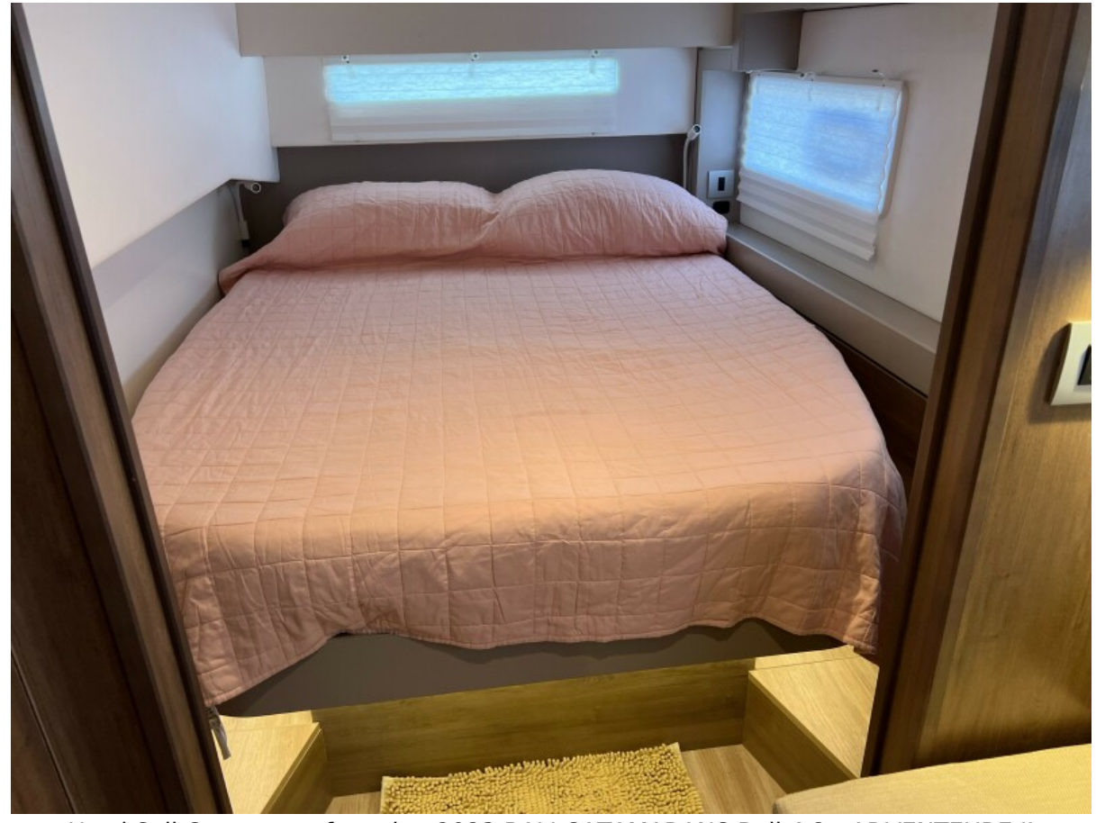
Used Sail Catamaran for sale 2023 BALI CATAMARANS Bali 4.2 - ADVENTEURE II