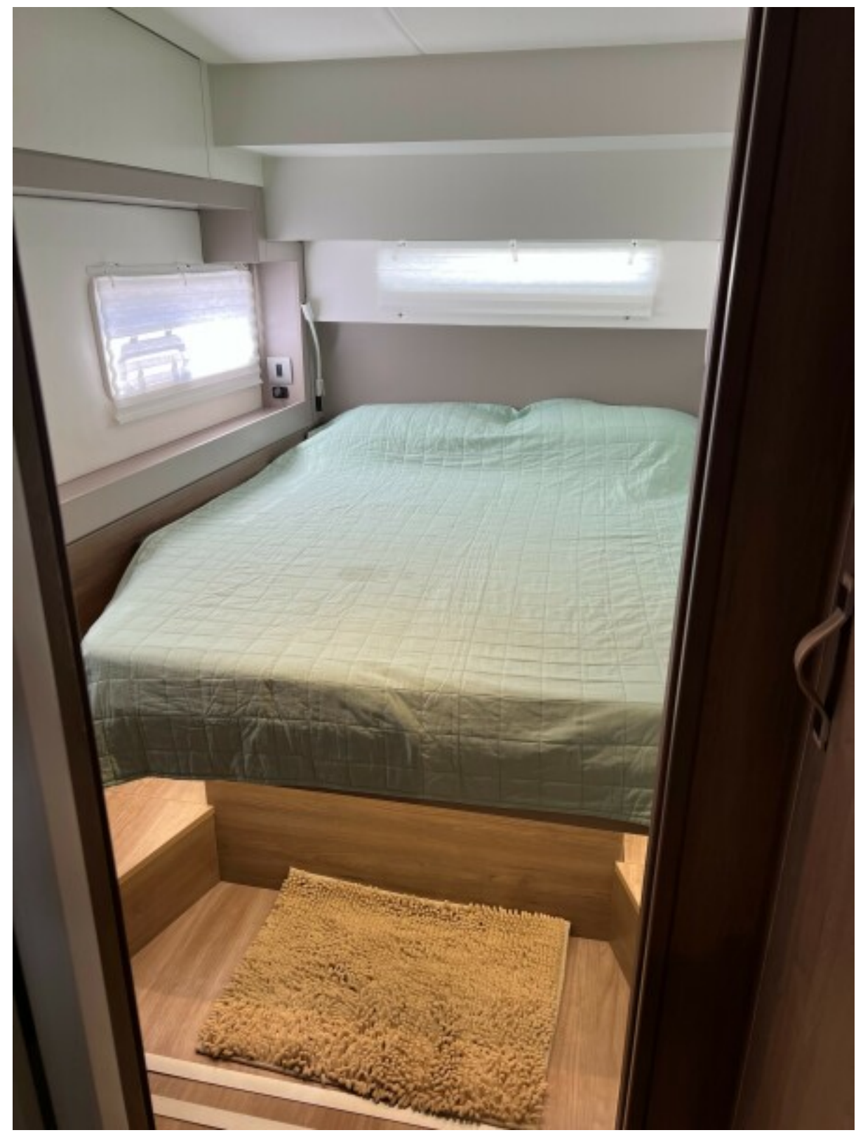
Used Sail Catamaran for sale 2023 BALI CATAMARANS Bali 4.2 - ADVENTEURE II