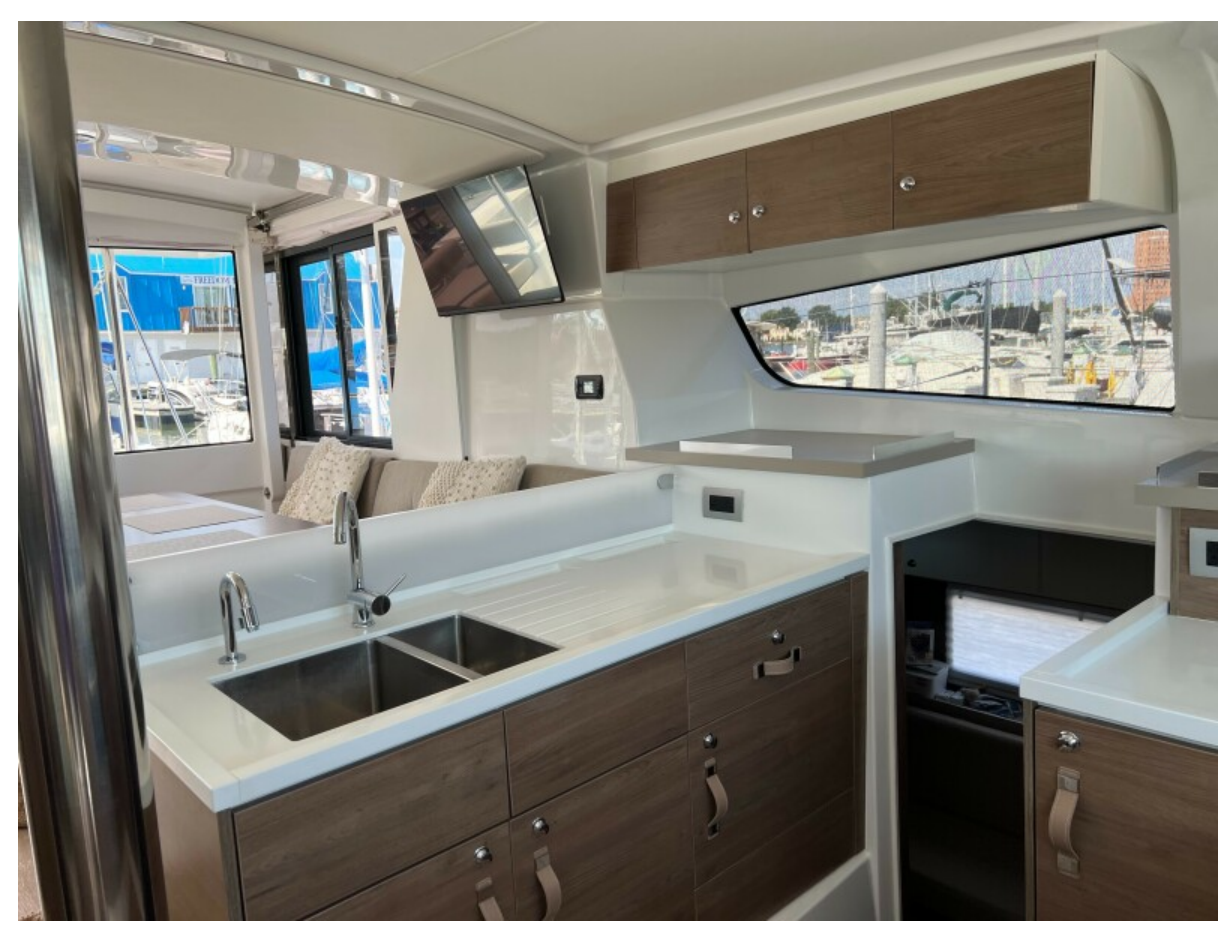
Used Sail Catamaran for sale 2023 BALI CATAMARANS Bali 4.2 - ADVENTEURE II