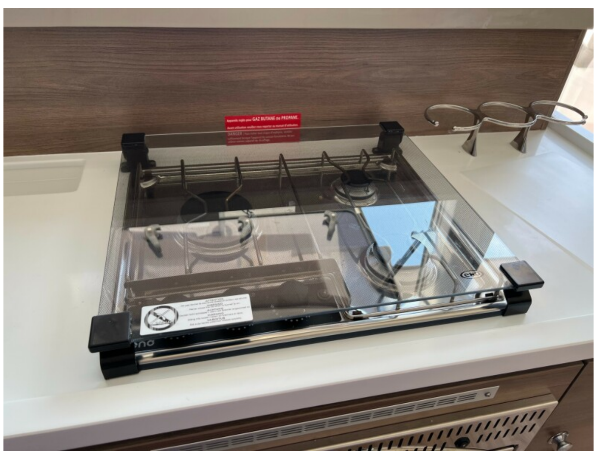
Used Sail Catamaran for sale 2023 BALI CATAMARANS Bali 4.2 - ADVENTEURE II