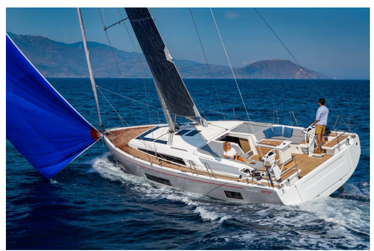
2024 Beneteau Oceanis 46.1