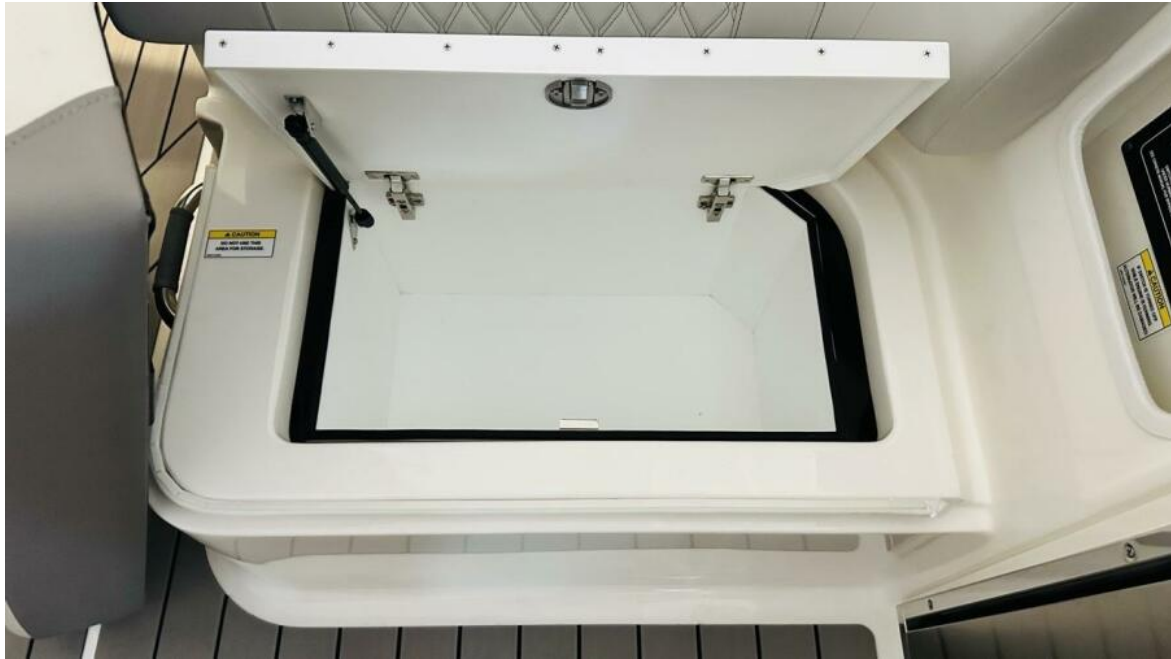
Sea Ray 400 SLX