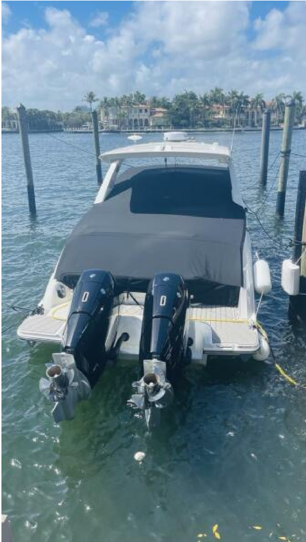
Sea Ray 400 SLX