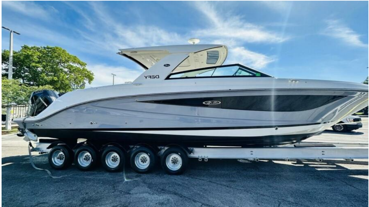
Sea Ray 400 SLX