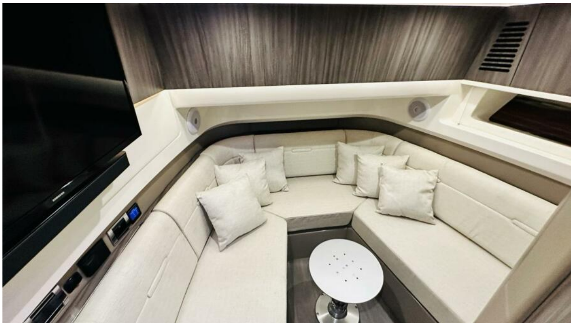
Sea Ray 400 SLX