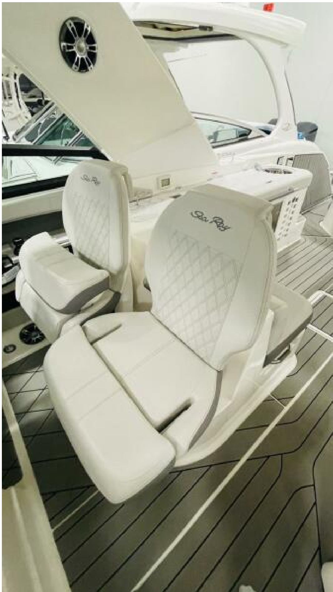
Sea Ray 400 SLX