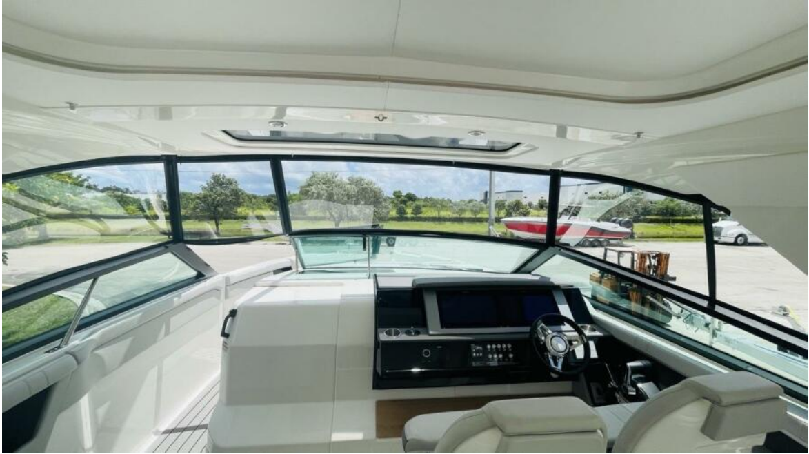
Sea Ray 400 SLX