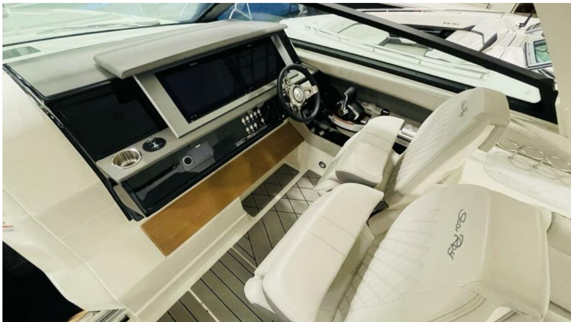
Sea Ray 400 SLX