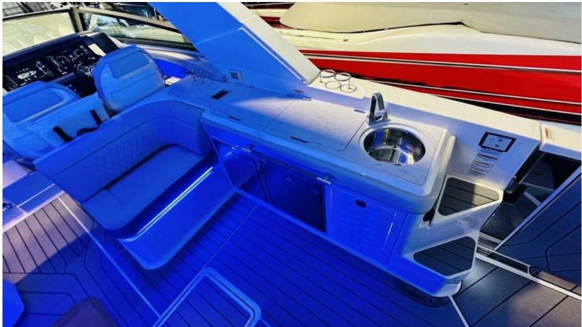
Sea Ray 400 SLX