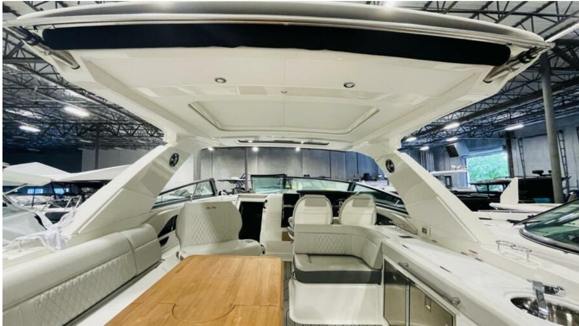
Sea Ray 400 SLX