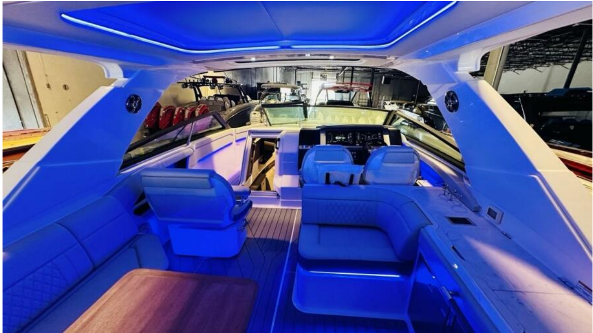
Sea Ray 400 SLX