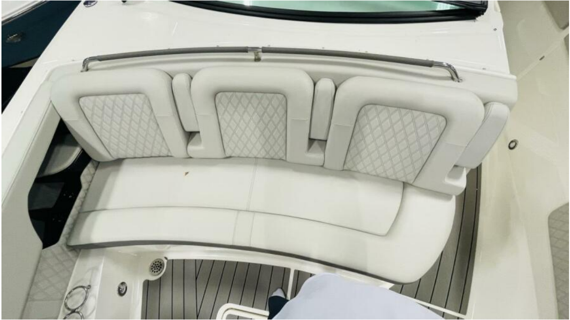
Sea Ray 400 SLX