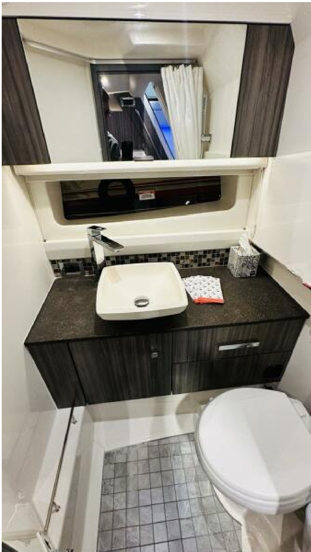
Sea Ray 400 SLX