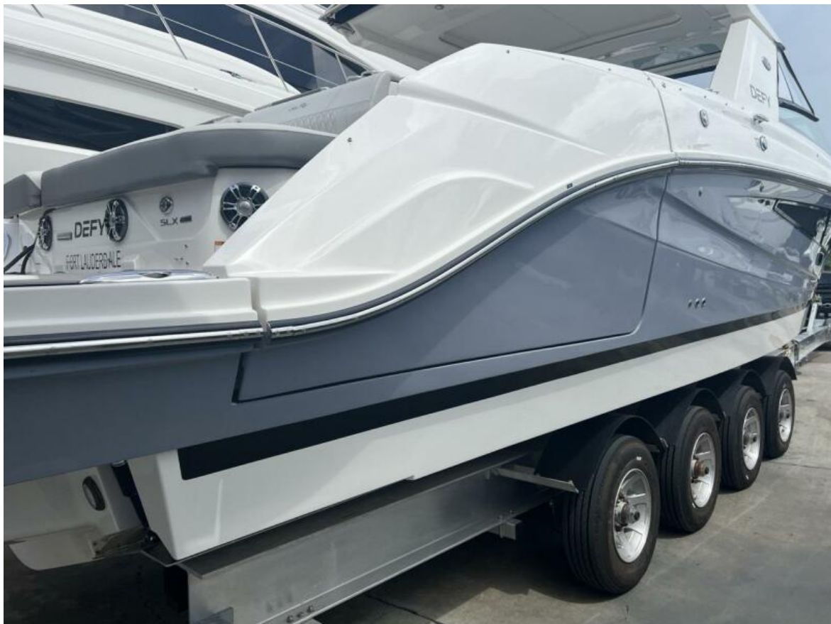
Sea Ray 400 SLX