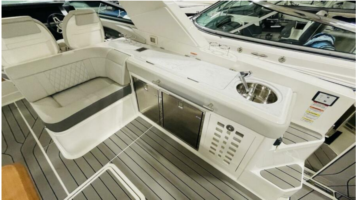
Sea Ray 400 SLX