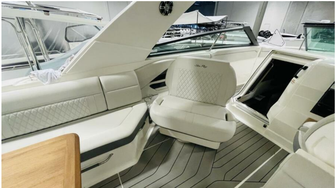
Sea Ray 400 SLX