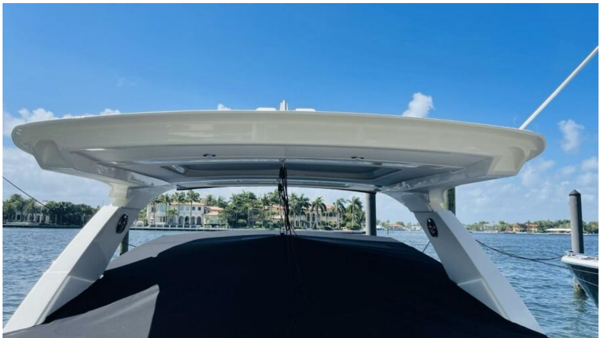
Sea Ray 400 SLX