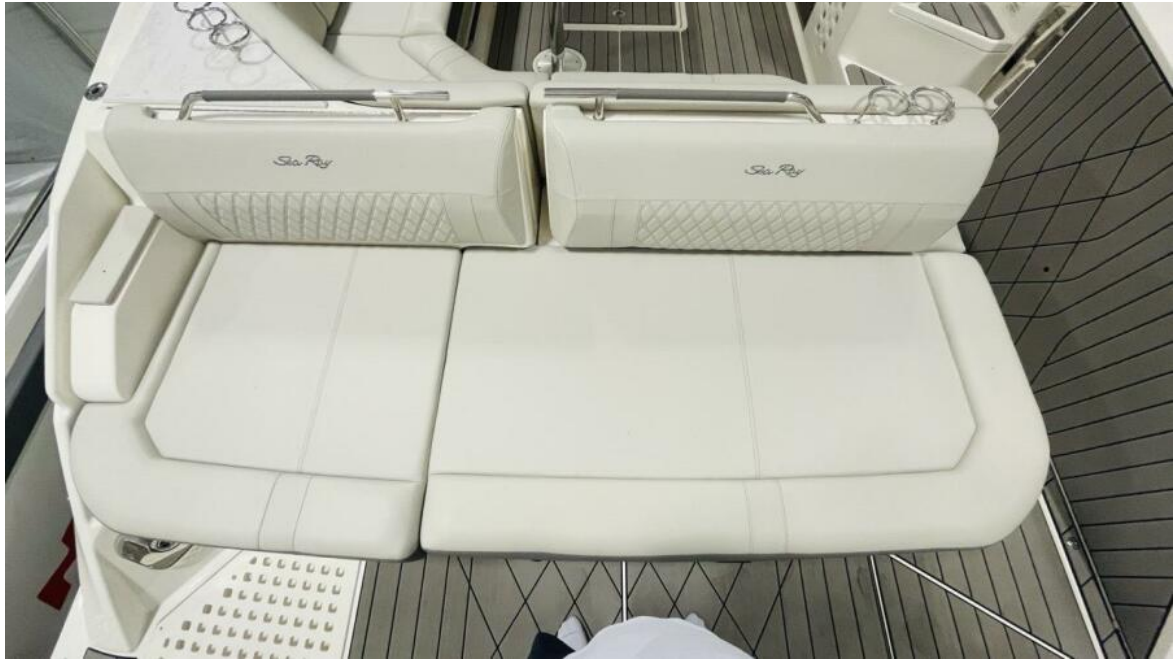
Sea Ray 400 SLX