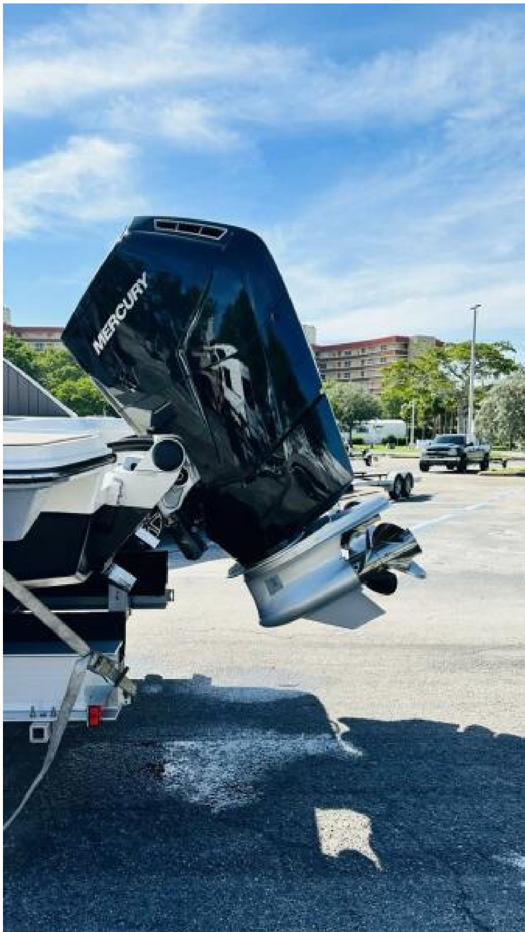
Sea Ray 400 SLX