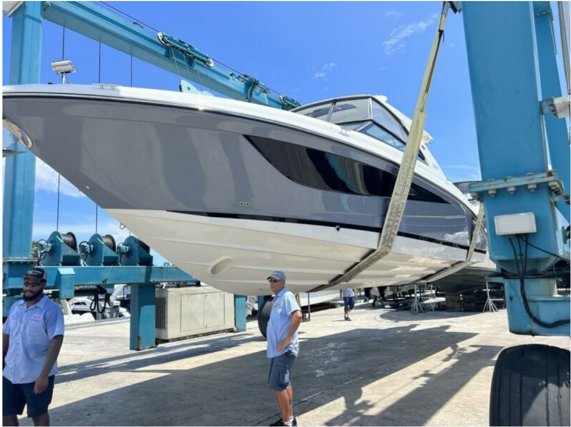
Sea Ray 400 SLX