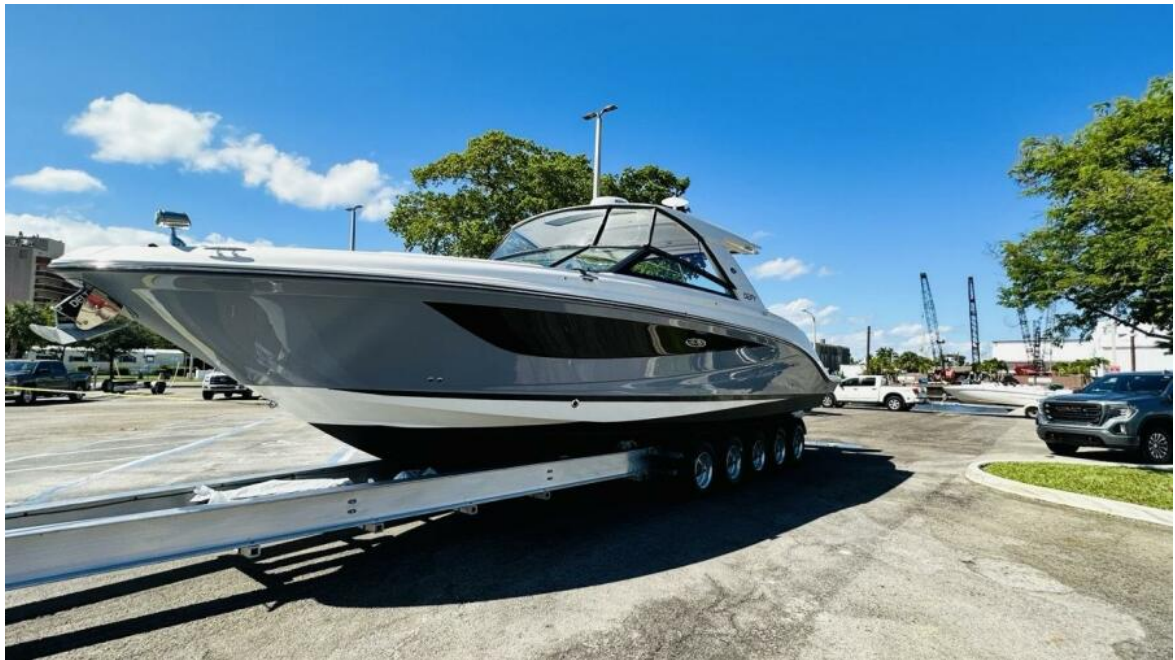
Sea Ray 400 SLX