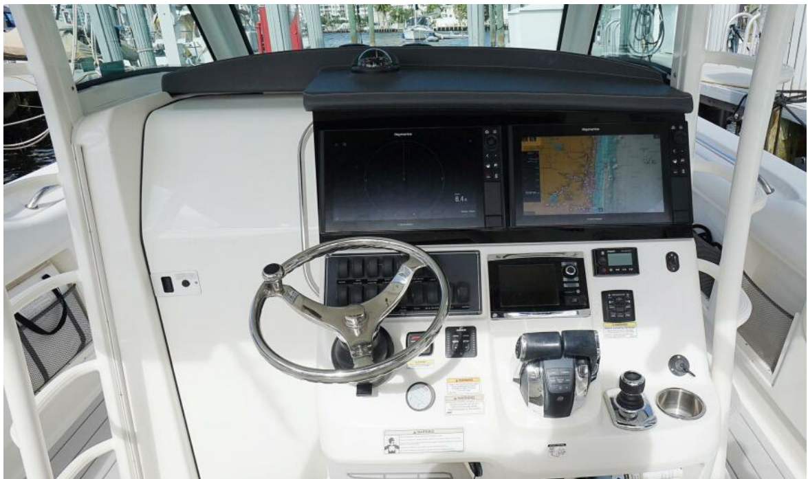
37' Boston Whaler - Helm TALAN'T 37 Helm