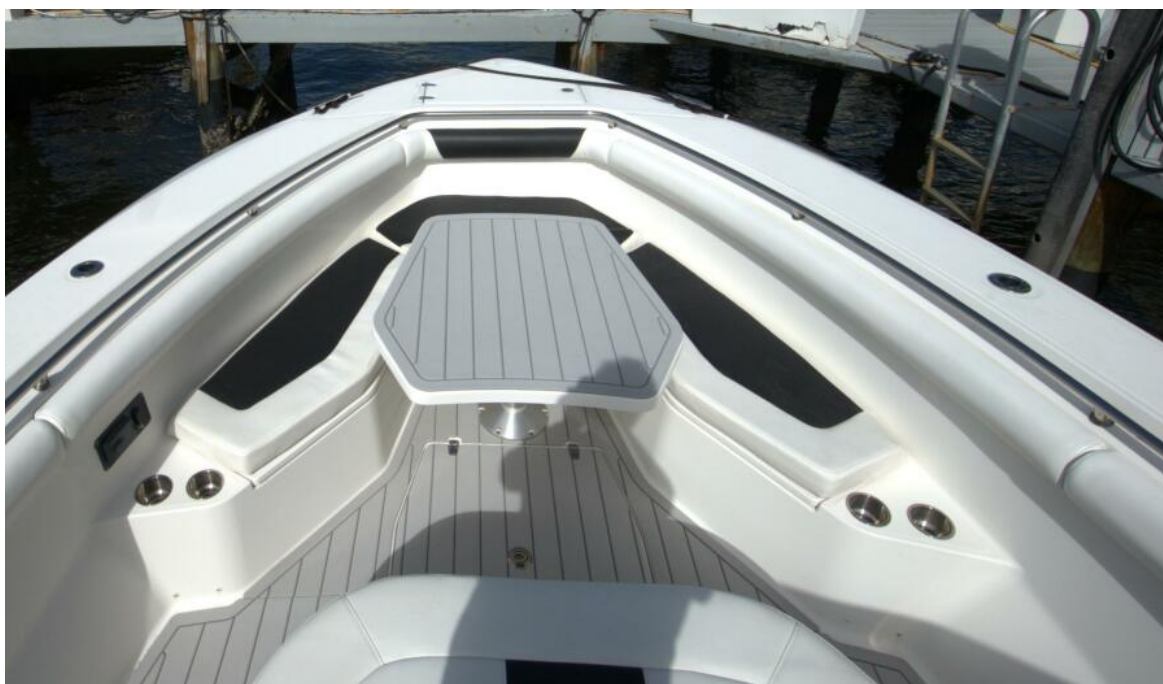
37' Boston Whaler - Bow TALAN'T 37 Bow Seating