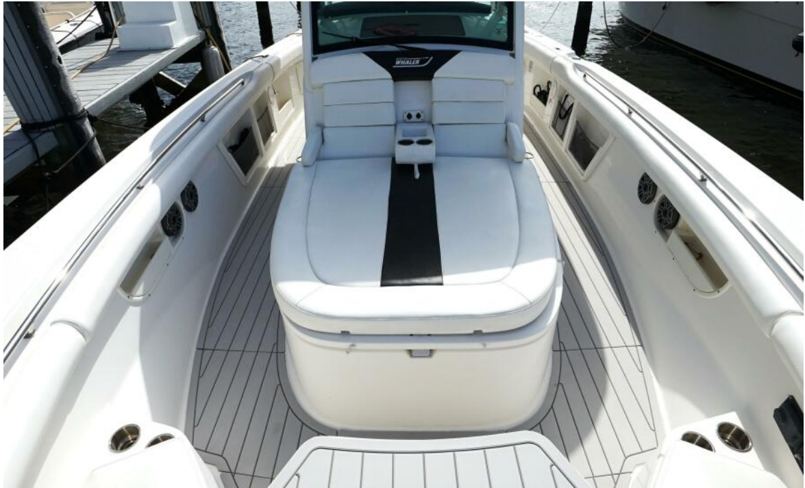
37' Boston Whaler TALAN'T 37 Fwd Sunbed