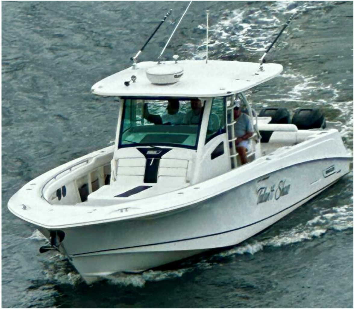
37' Boston Whaler TALAN'T 37 Running Pic