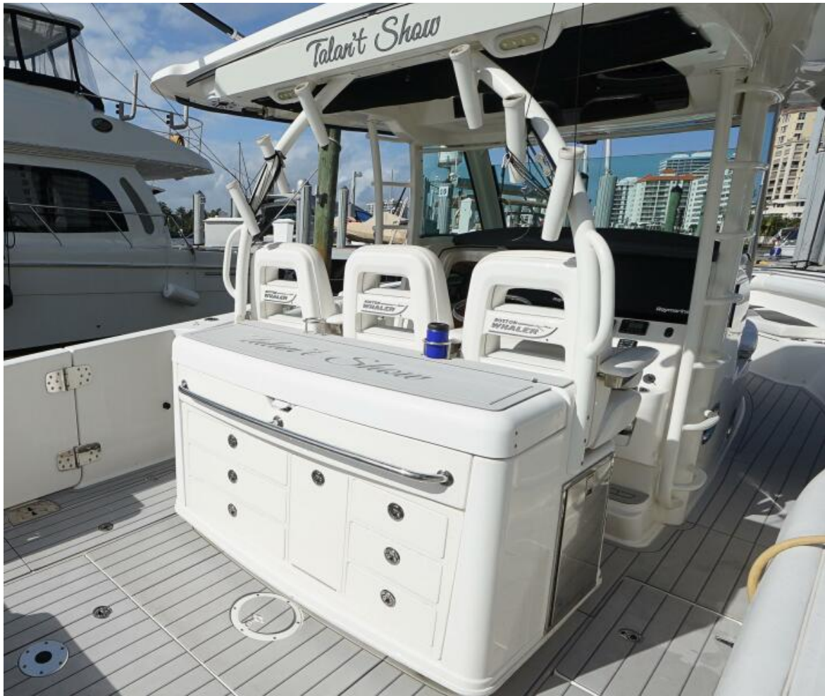
37' Boston Whaler TALAN'T 37 Tackle Center