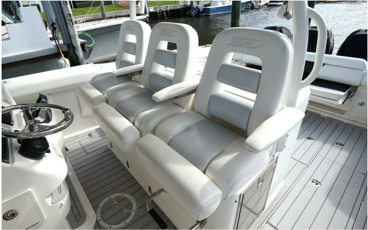
37' Boston Whaler - Helm TALAN'T 37 Captain Chairs