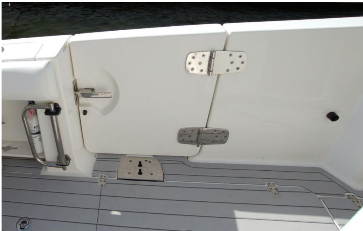
37' Boston Whaler TALAN'T 37 Dive Door