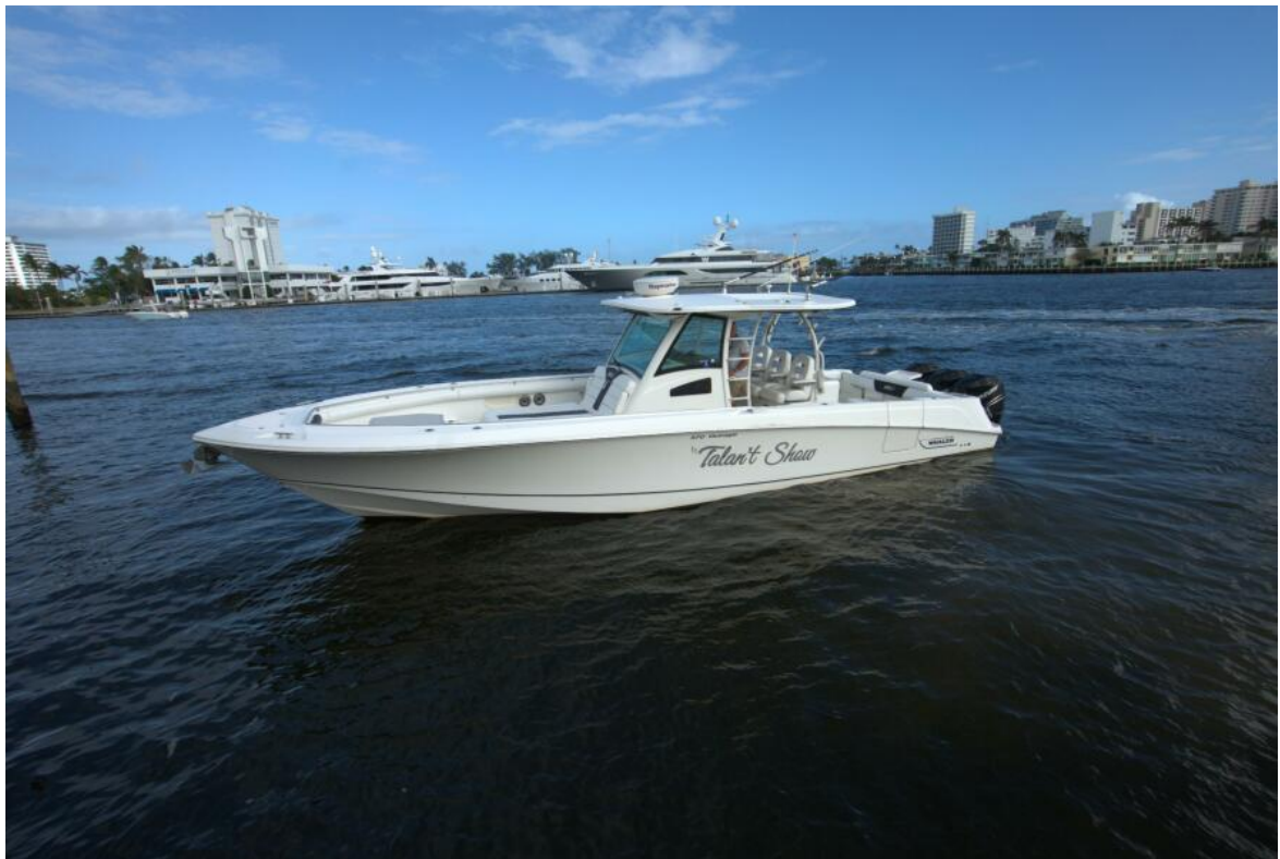
37' Boston Whaler TALAN'T 37 Port Side