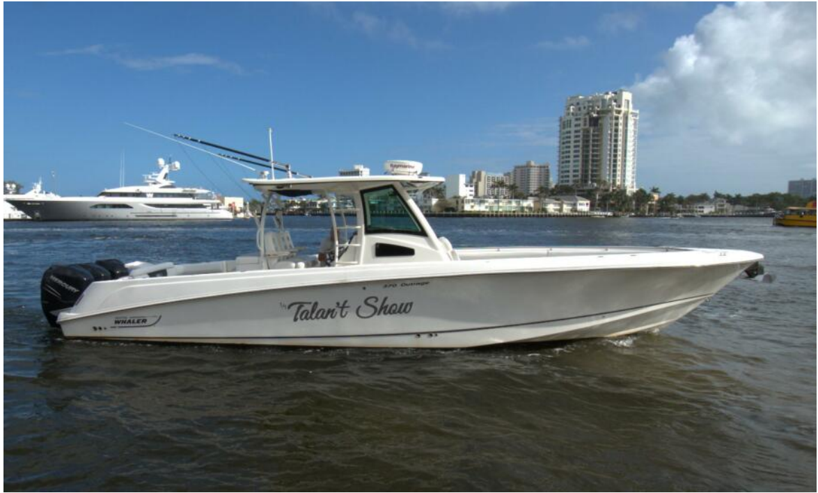
37' Boston Whaler