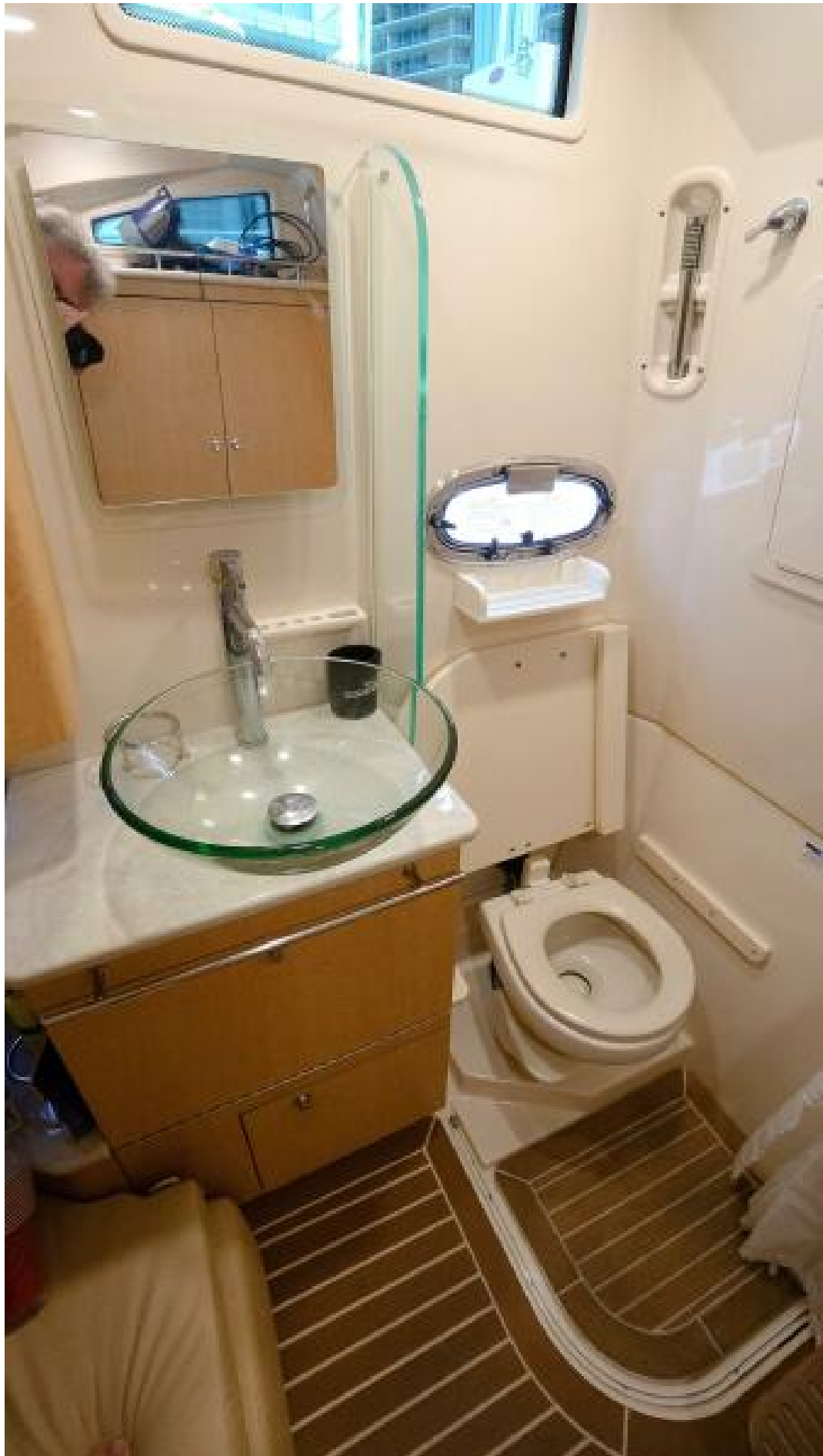
37' Boston Whaler