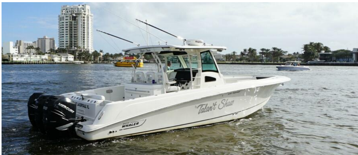
37' Boston Whaler TALAN'T 37 Std