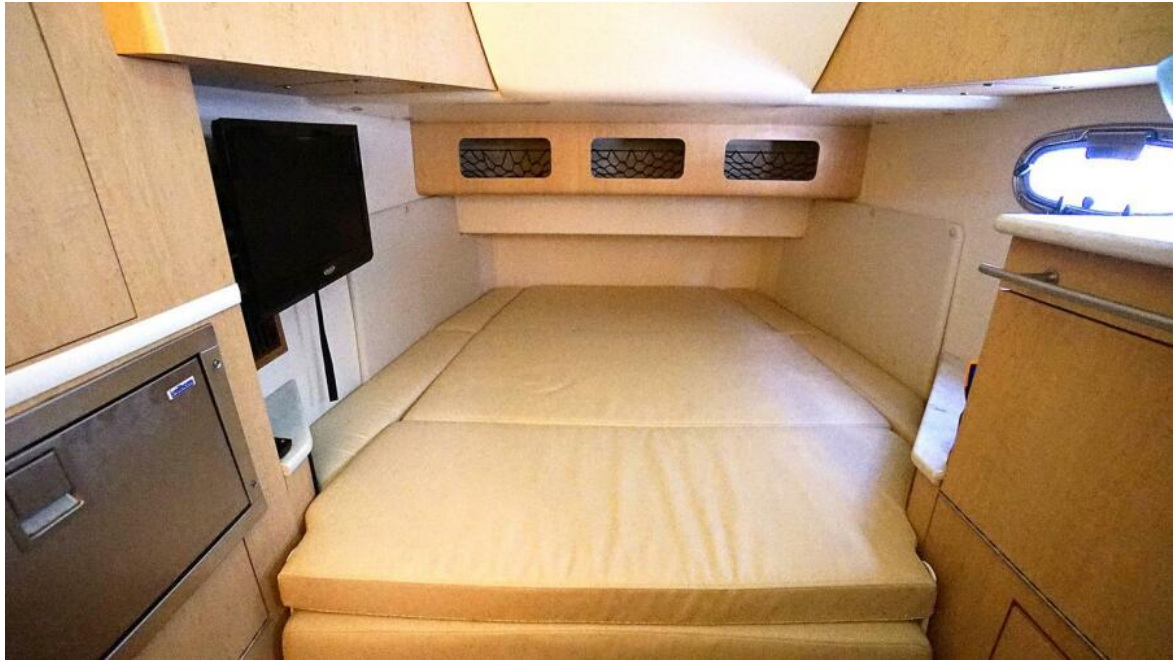
37' Boston Whaler - Cabin TALAN'T 37 Cabin