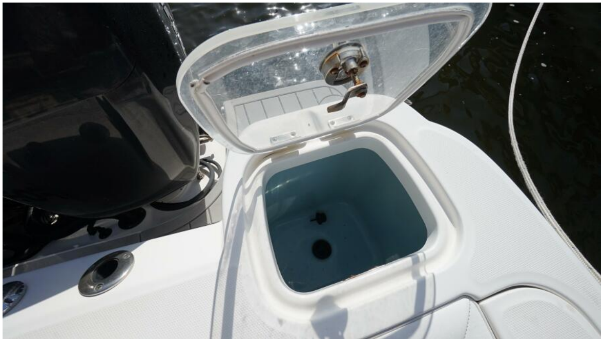
37' Boston Whaler TALAN'T 37 Live Well