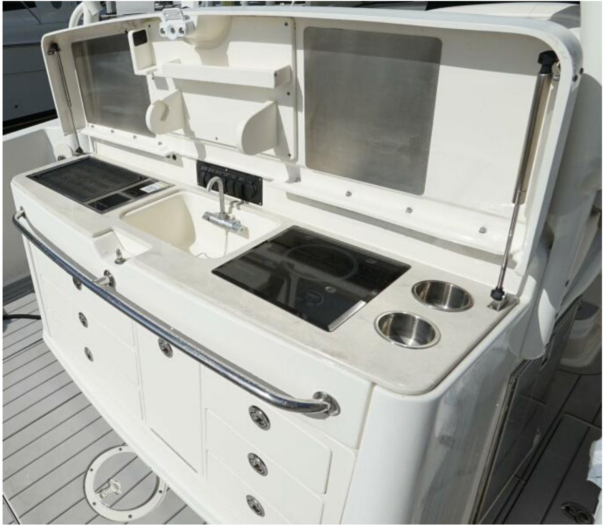
37' Boston Whaler TALAN'T 37 Stove And Grill