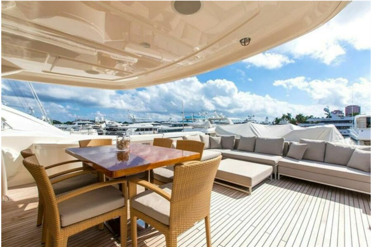
Slainte III_86 Flybridge2