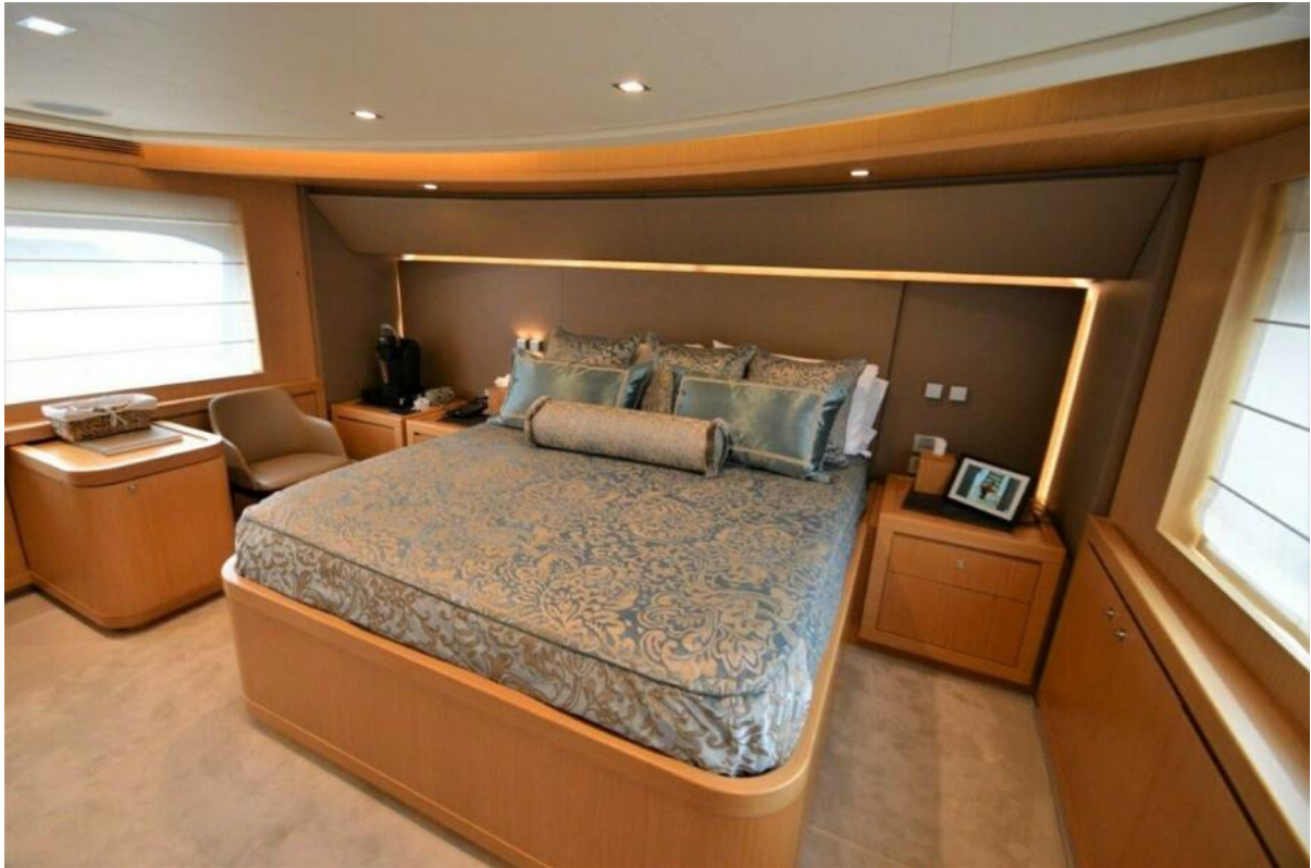
Slainte III_86 Master