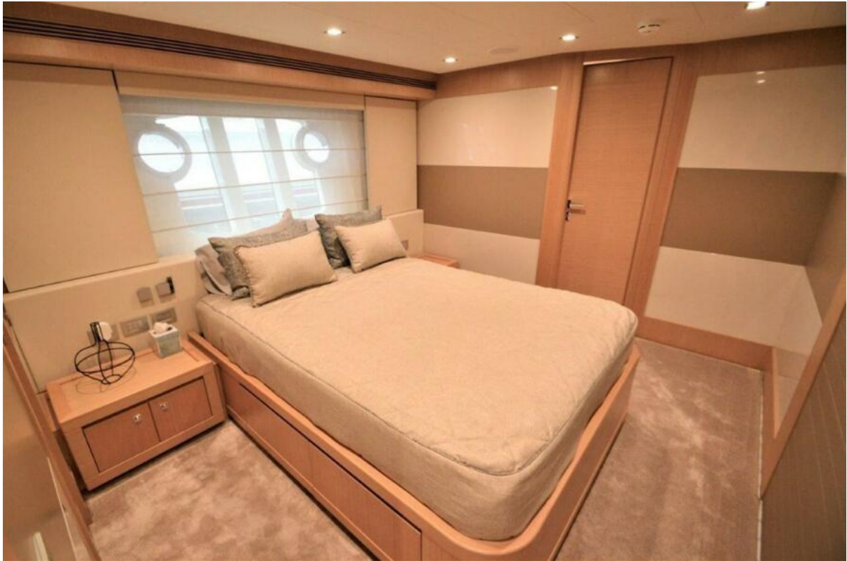
Slainte III_86 Guest 2