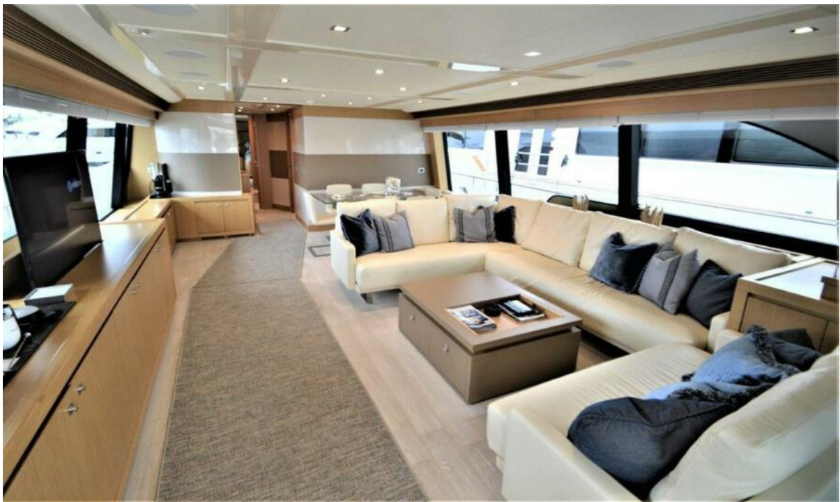
Slainte III_86 Salon