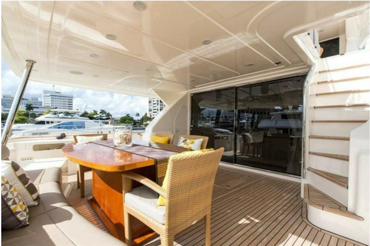
Slainte III_86 AftDeck