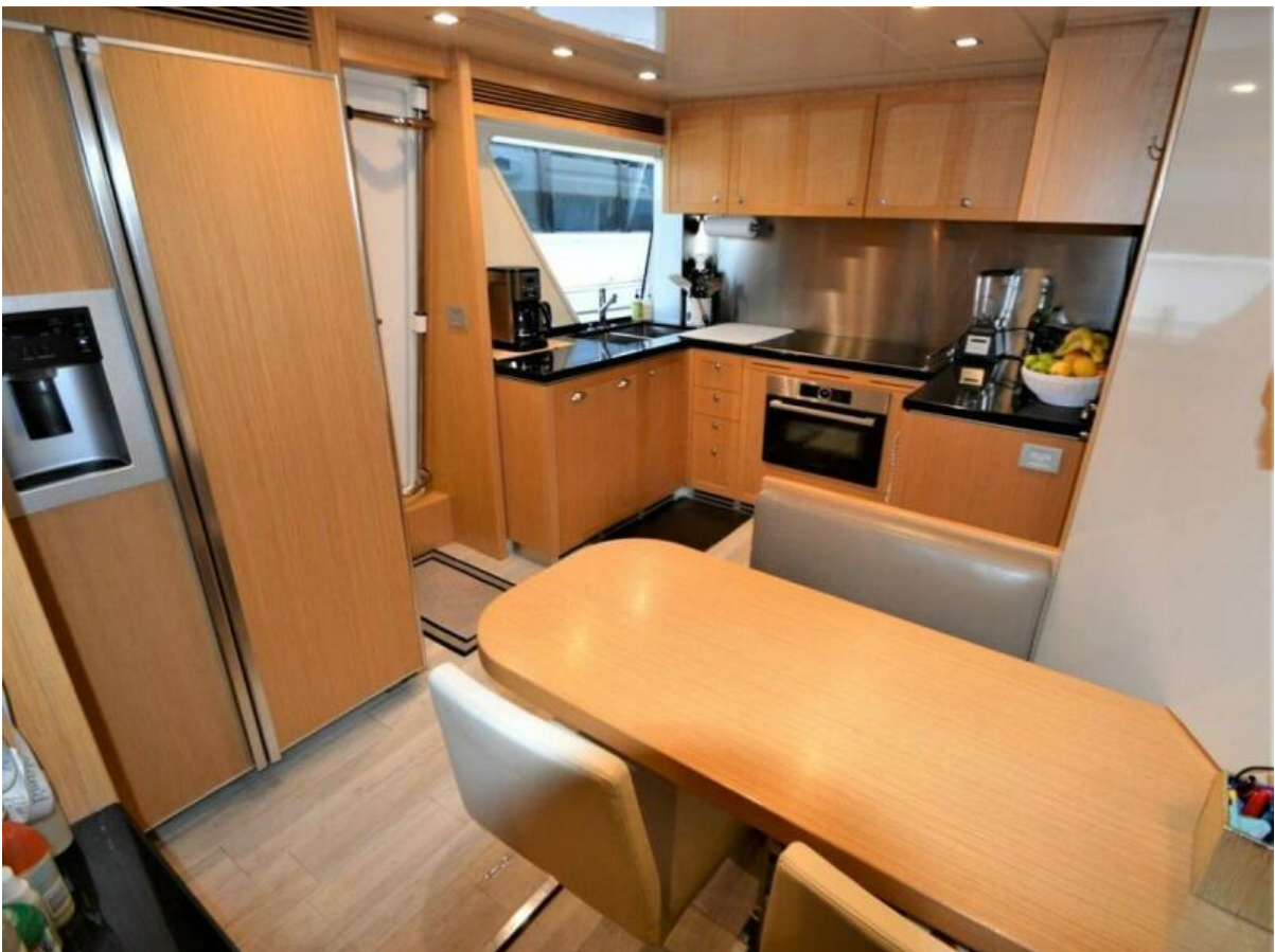
Slainte III_86 Galley