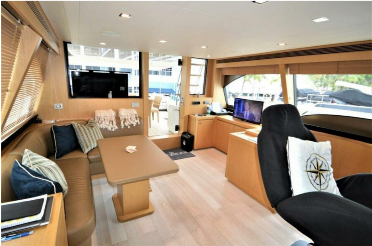
Slainte III_86 Skylounge