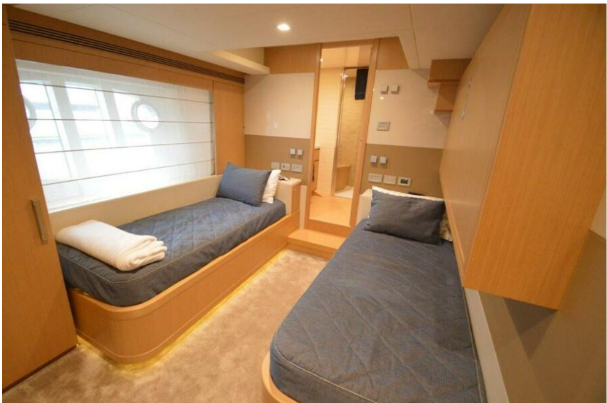
Slainte III_86 Twin