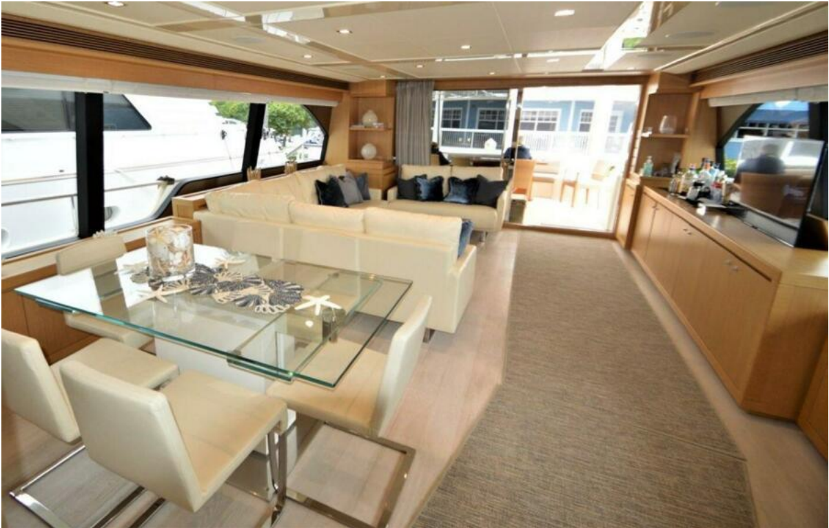
Slainte III_86 Dining