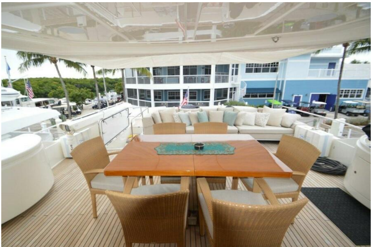
Slainte III_86 Flybridge