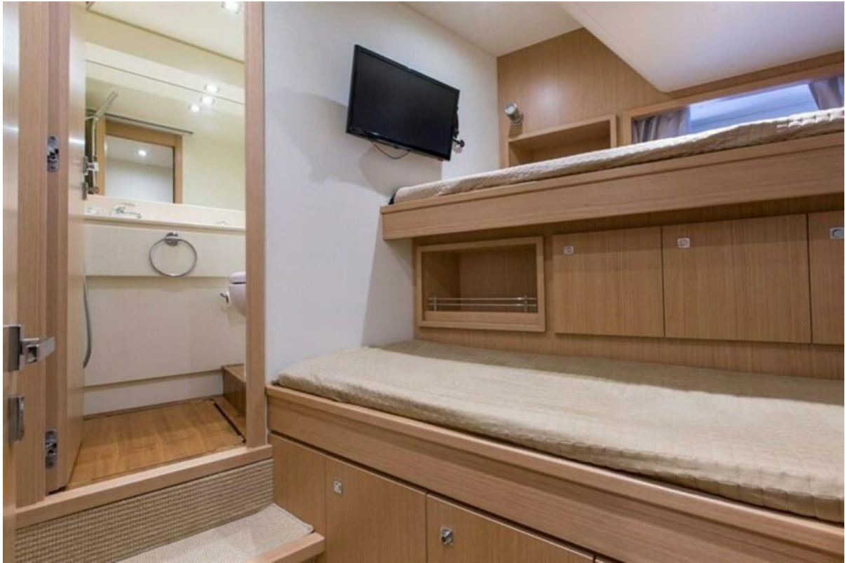
Slainte III_86 Crew