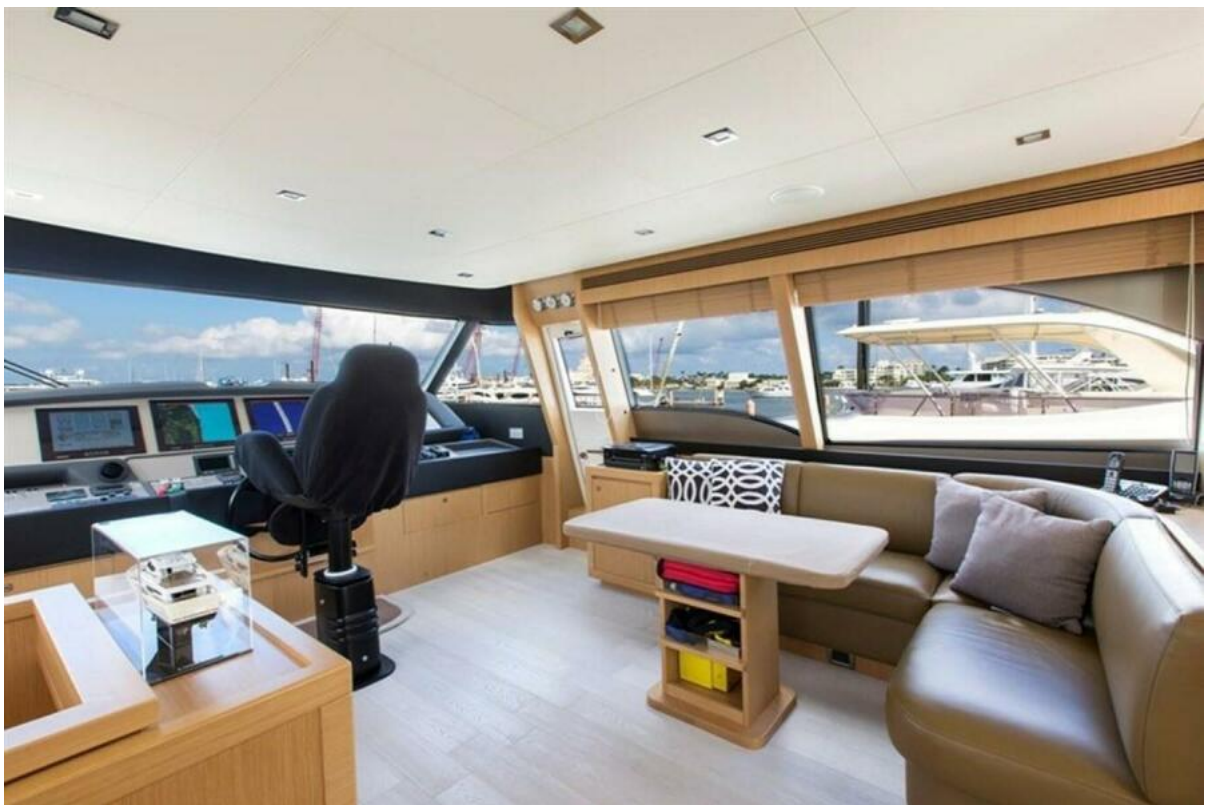
Slainte III_86 Skylounge2