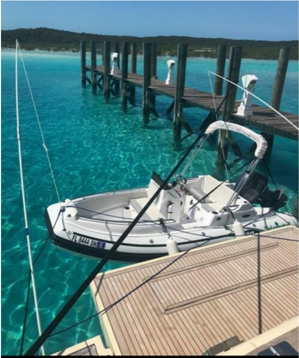
Slainte III_86 Tender