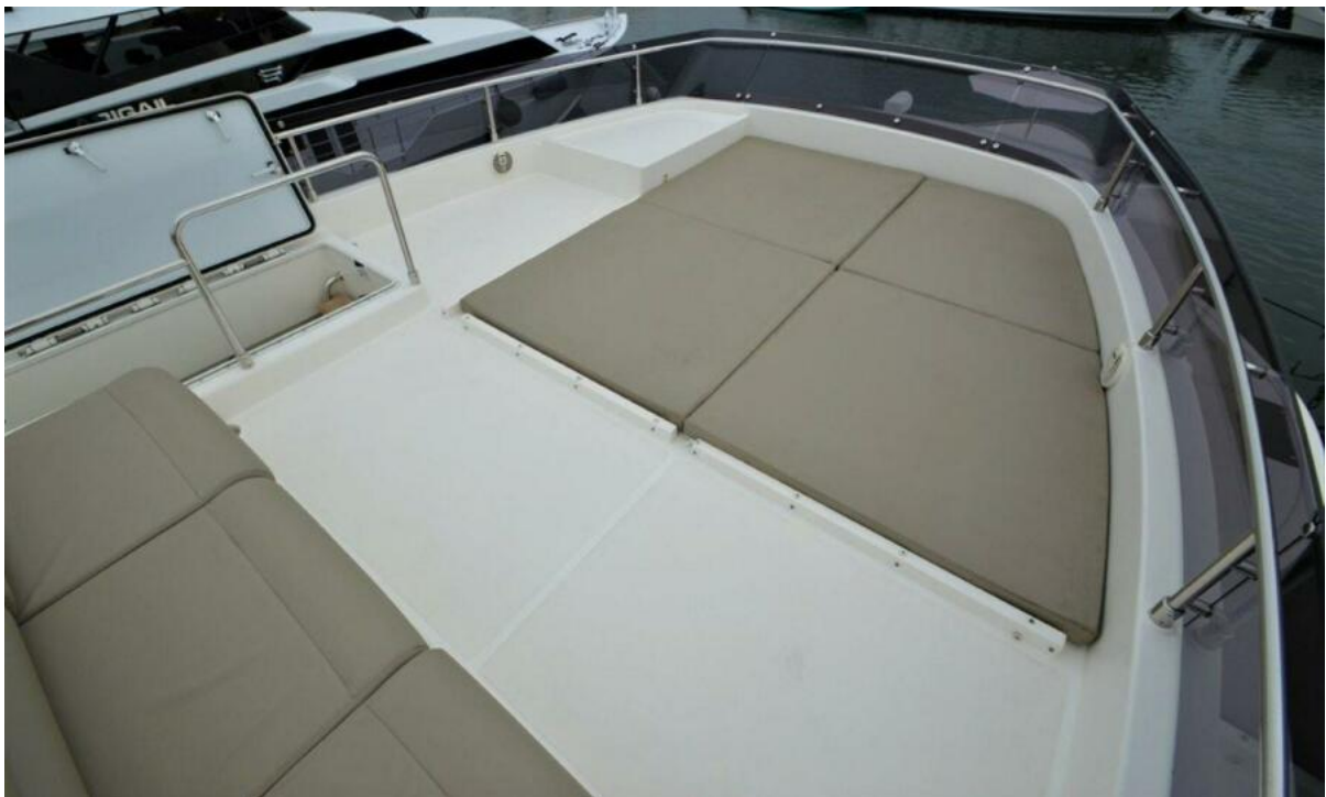
Slainte III_86 SunDeck