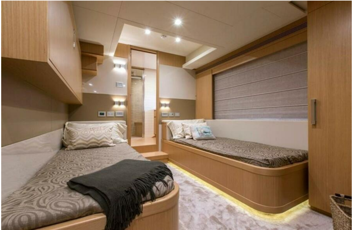
Slainte III_86 Twin 2