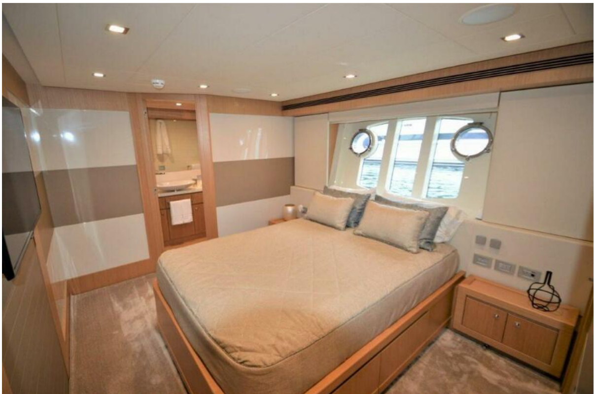
Slainte III_86 Guest