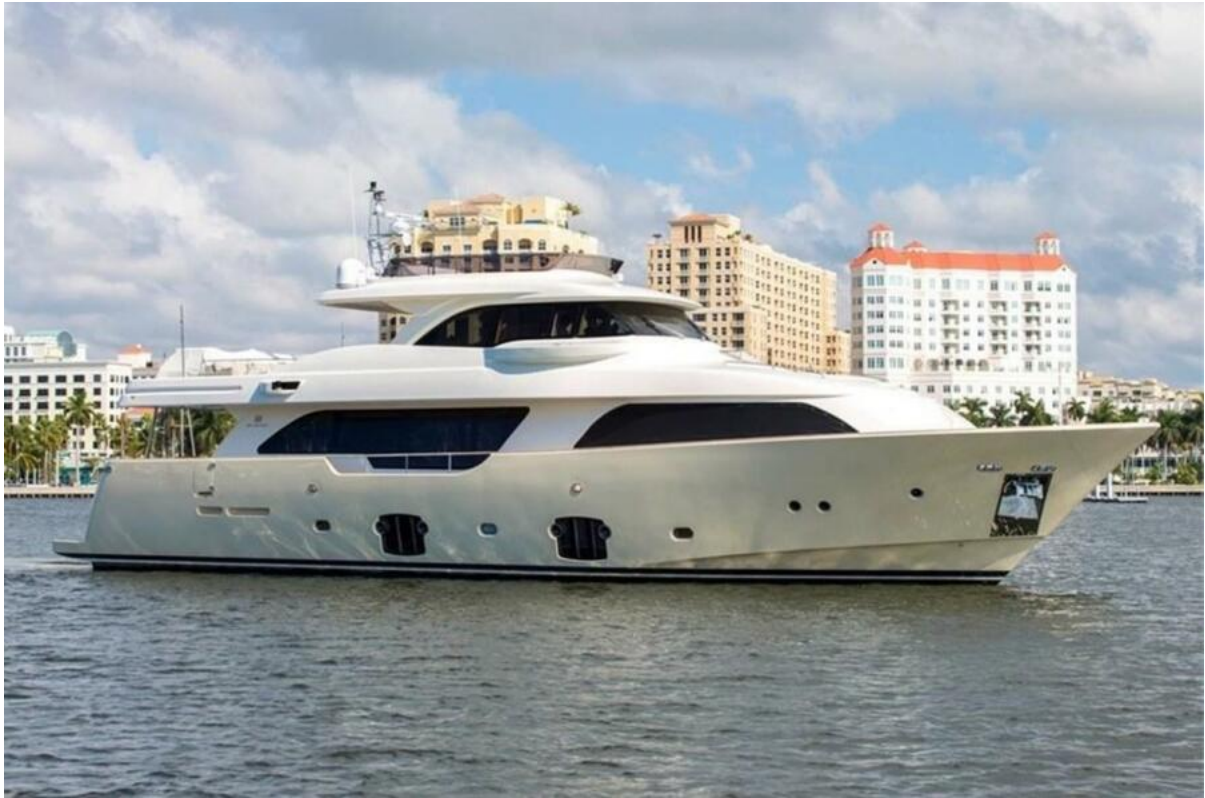
SLAINTE III 86' (26.21m) Custom Line Motoryacht, 2013