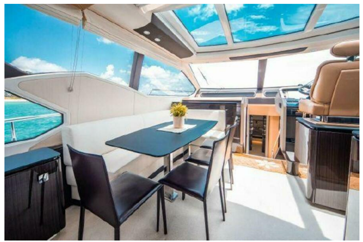
Fantastic_77 Main Deck Dining