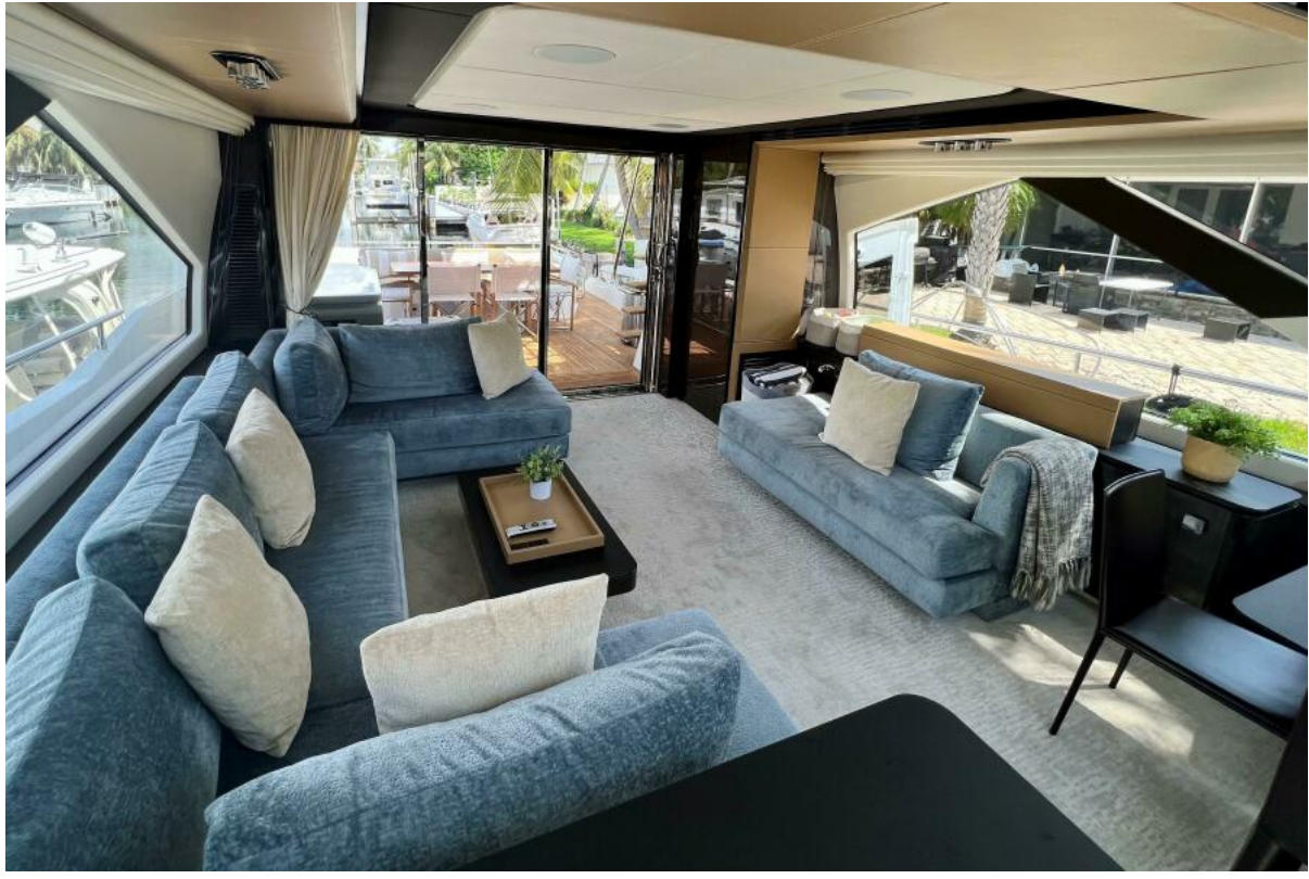
Fantastic_77 Main Deck Salon