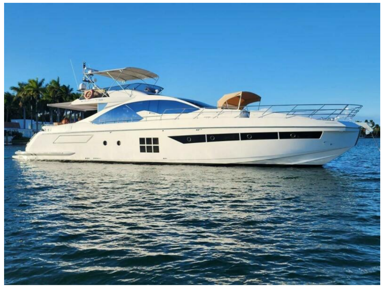
FANTASTIC 77' (23.47m) Azimut Motoryacht, 2019