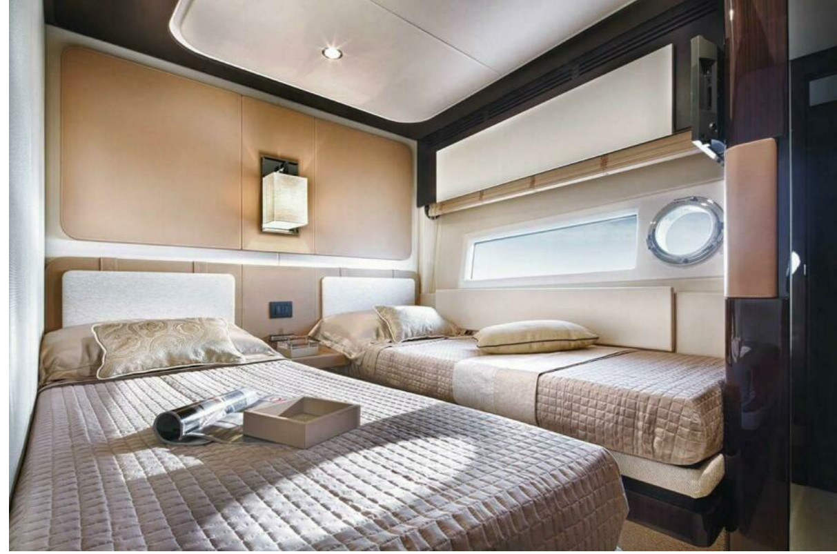
Fantastic_77 Lower Deck Guest Stateroom