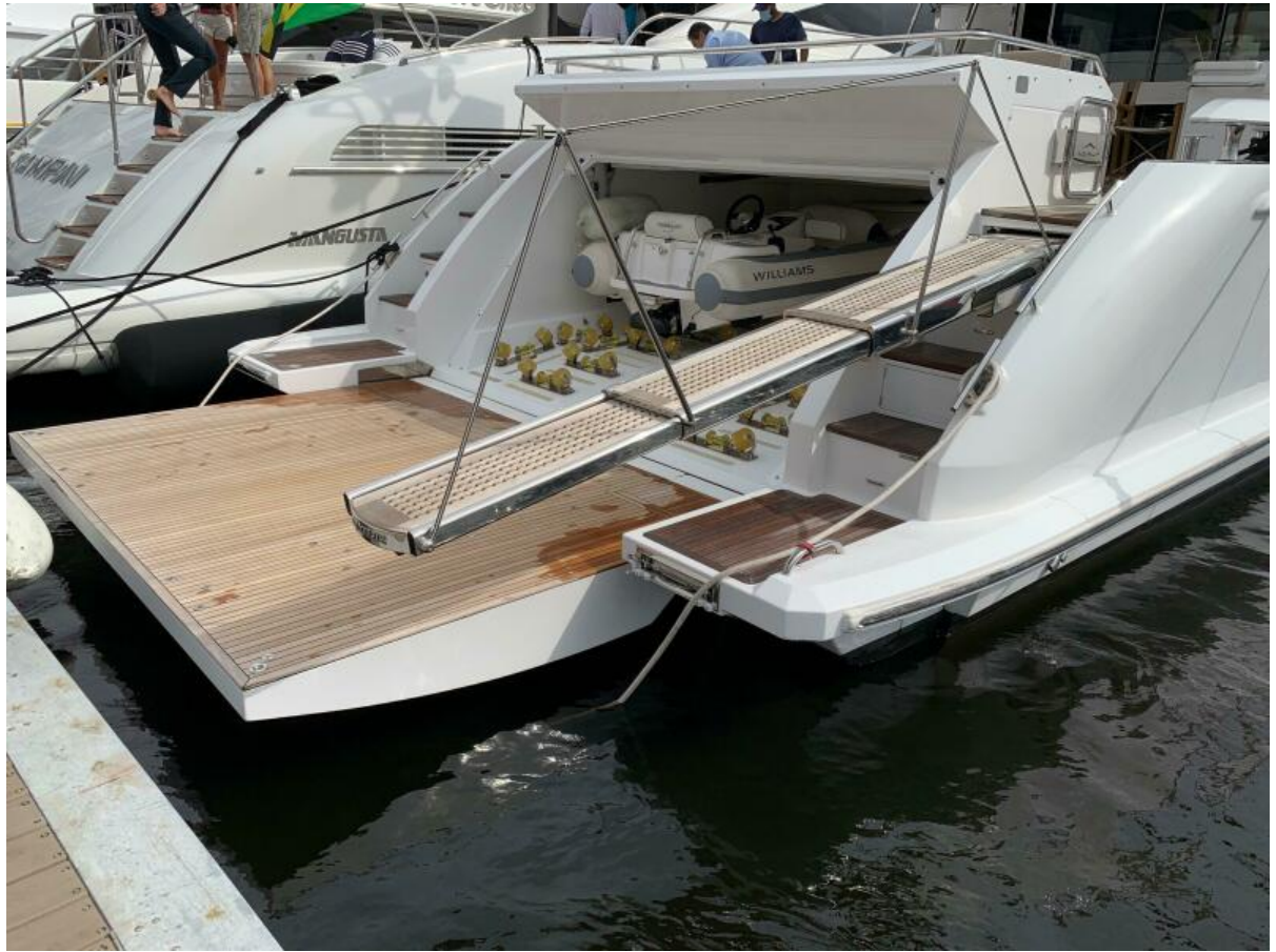
Fantastic_77 Beach Club