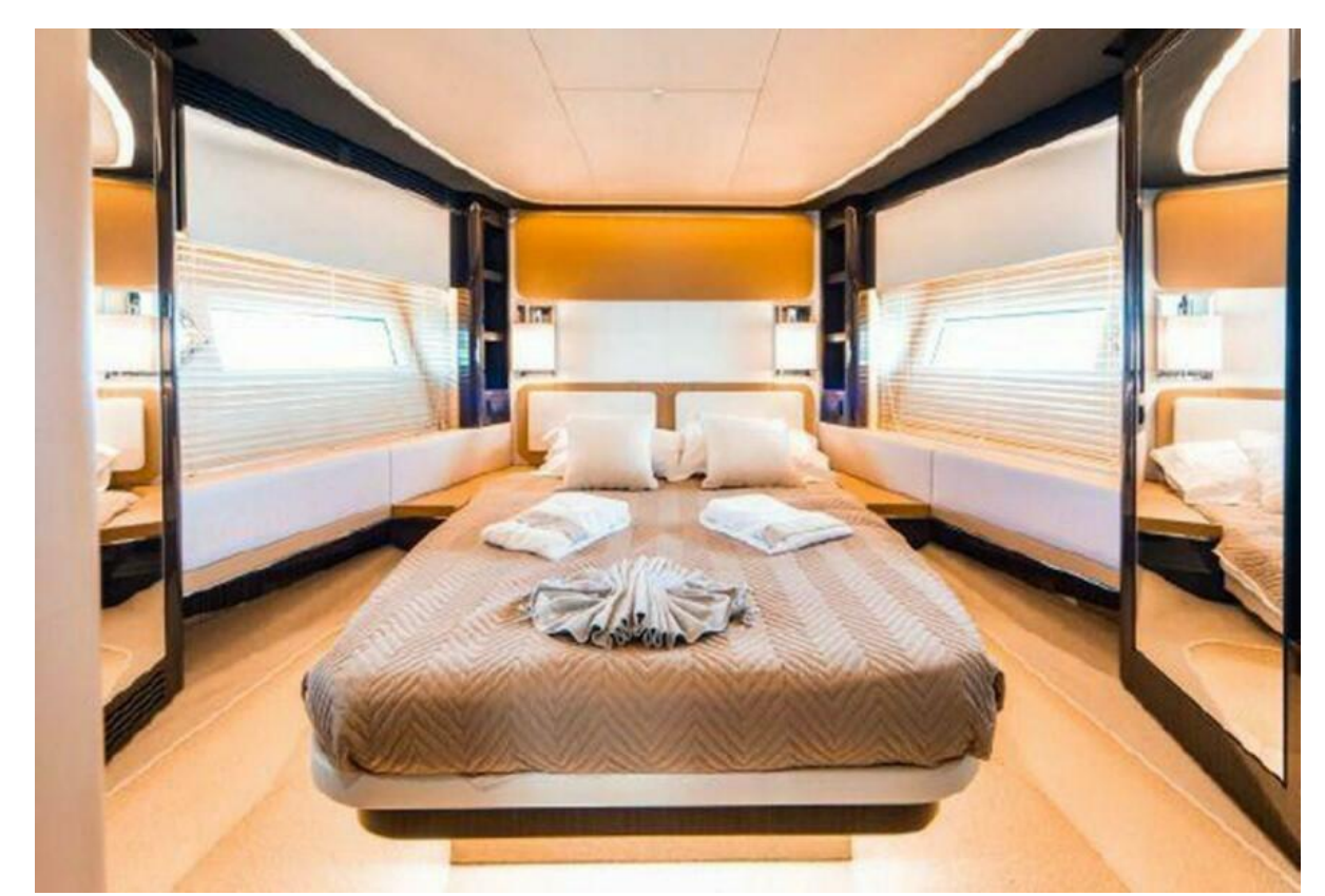
Fantastic_77 Lower Deck Guest Ensuite