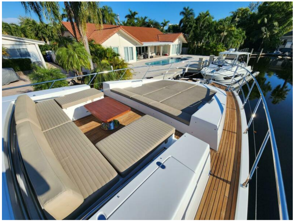
Fantastic_77 Bow Lounge