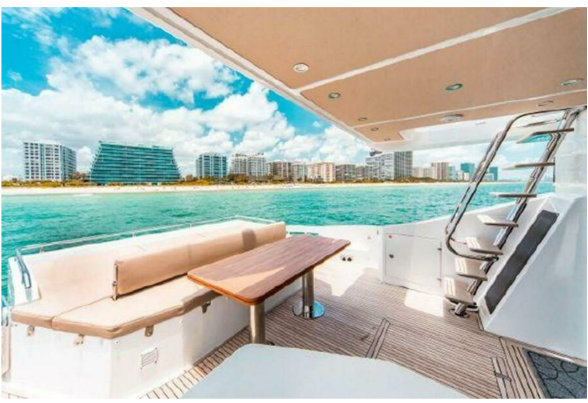
Fantastic_77 Aft Deck Dining