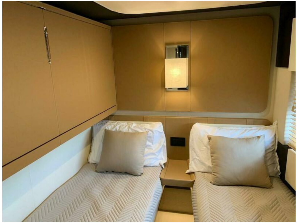
Fantastic_77 Lower Deck Guest Stateroom