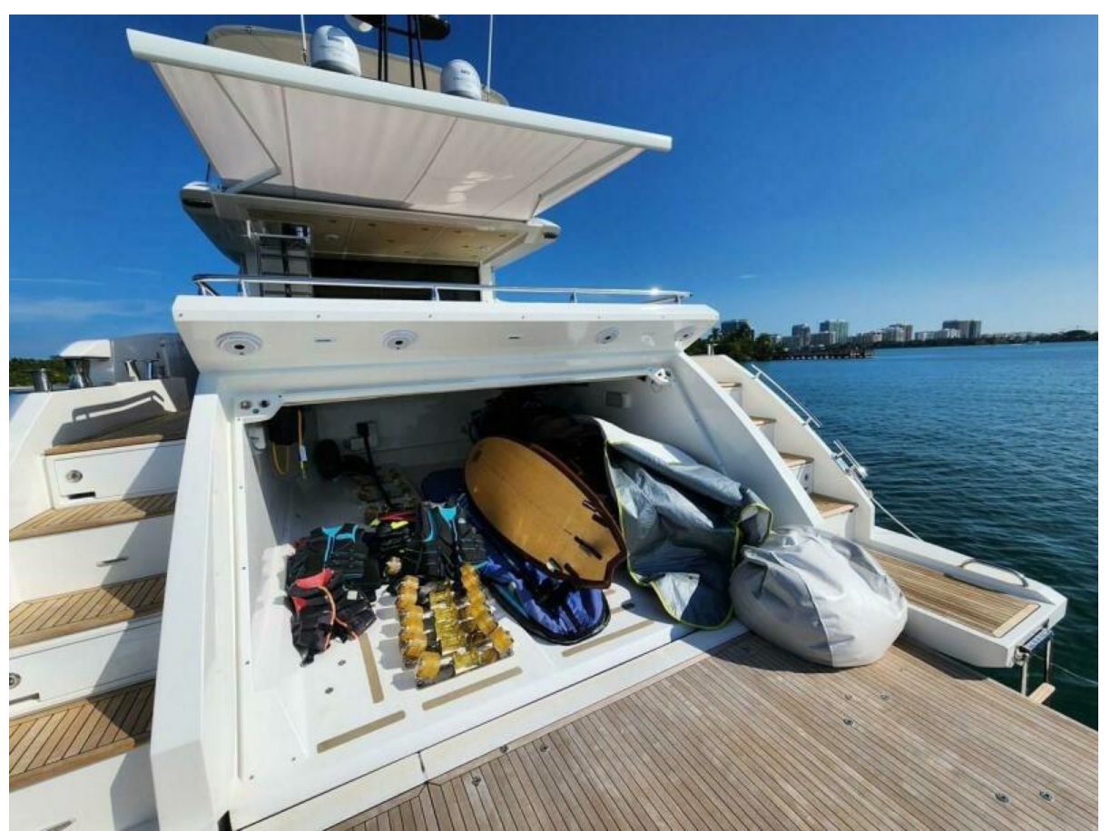
Fantastic_77 Beach Club