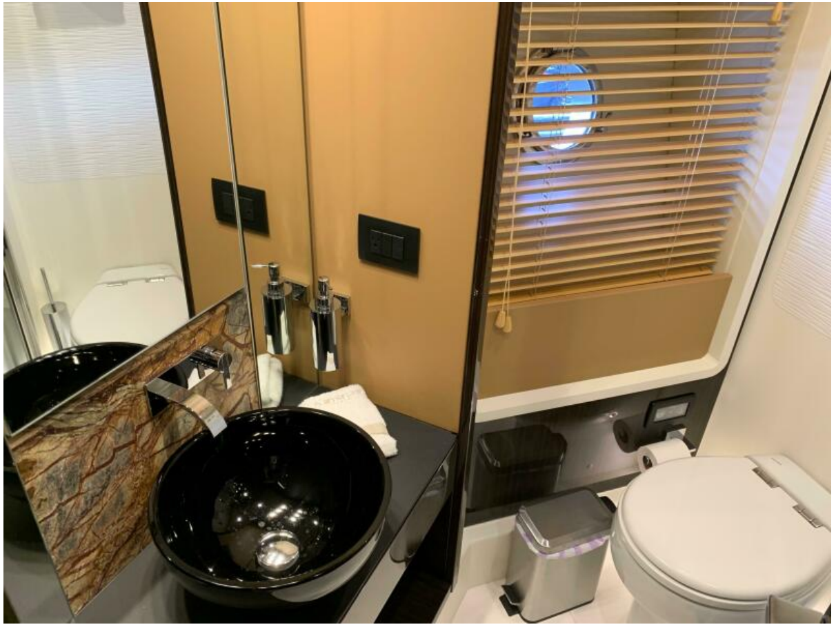
Fantastic_77 Lower Deck Guest Ensuite