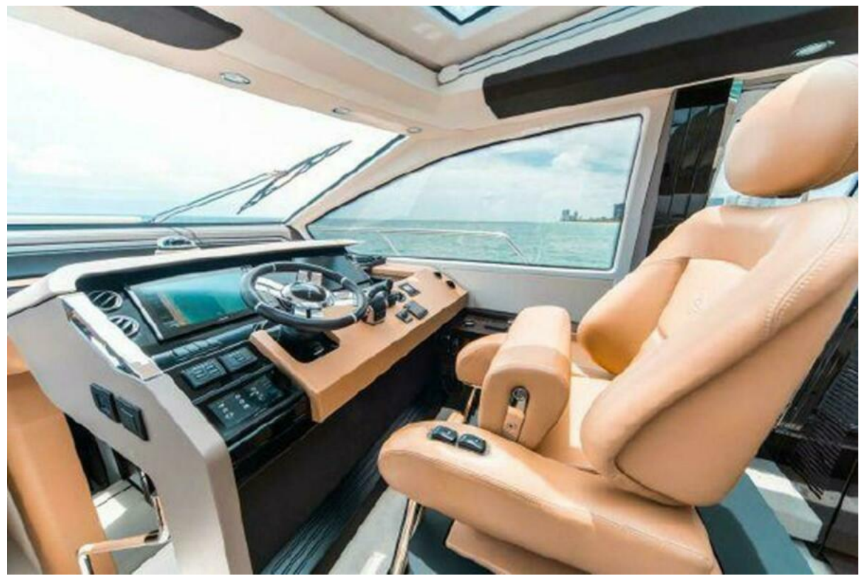
Fantastic_77 Main Deck Helm