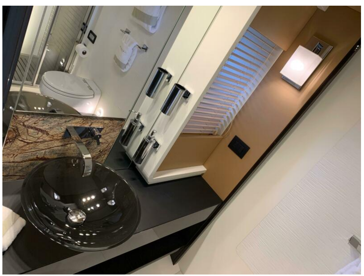
Fantastic_77 Lower Deck Master Ensuite