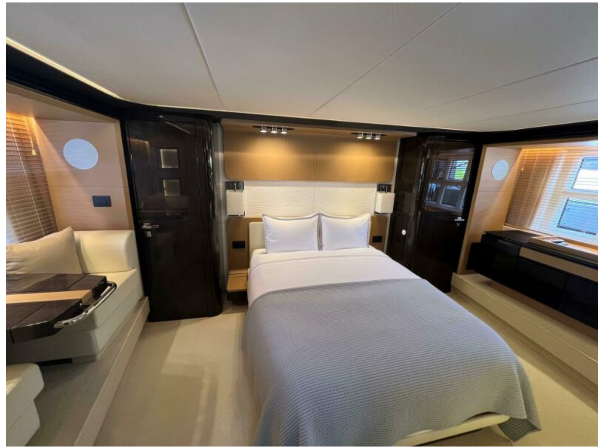
Fantastic_77 Lower Deck Master Stateroom