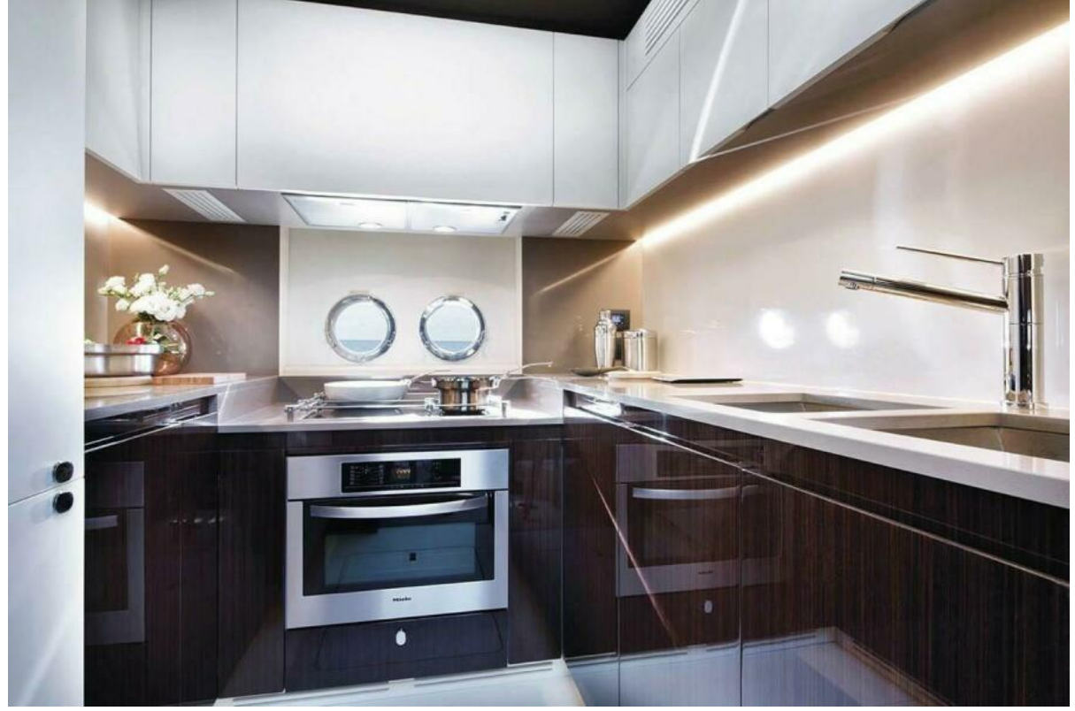
Fantastic_77 Main Deck Galley