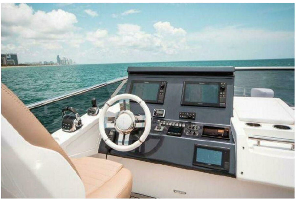
Fantastic_77 Flybridge Helm