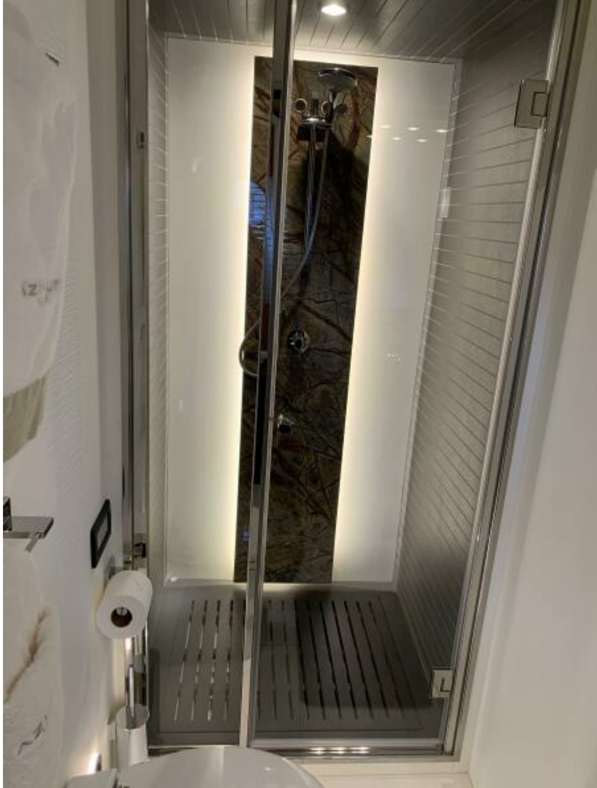
Fantastic_77 Lower Deck Master Ensuite