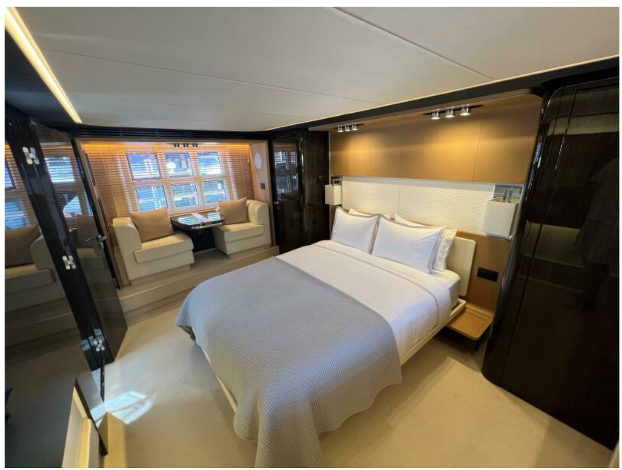
Fantastic_77 Lower Deck Master Stateroom