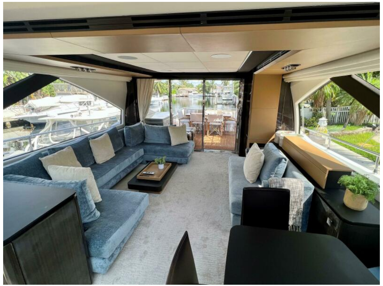
Fantastic_77 Main Deck Salon