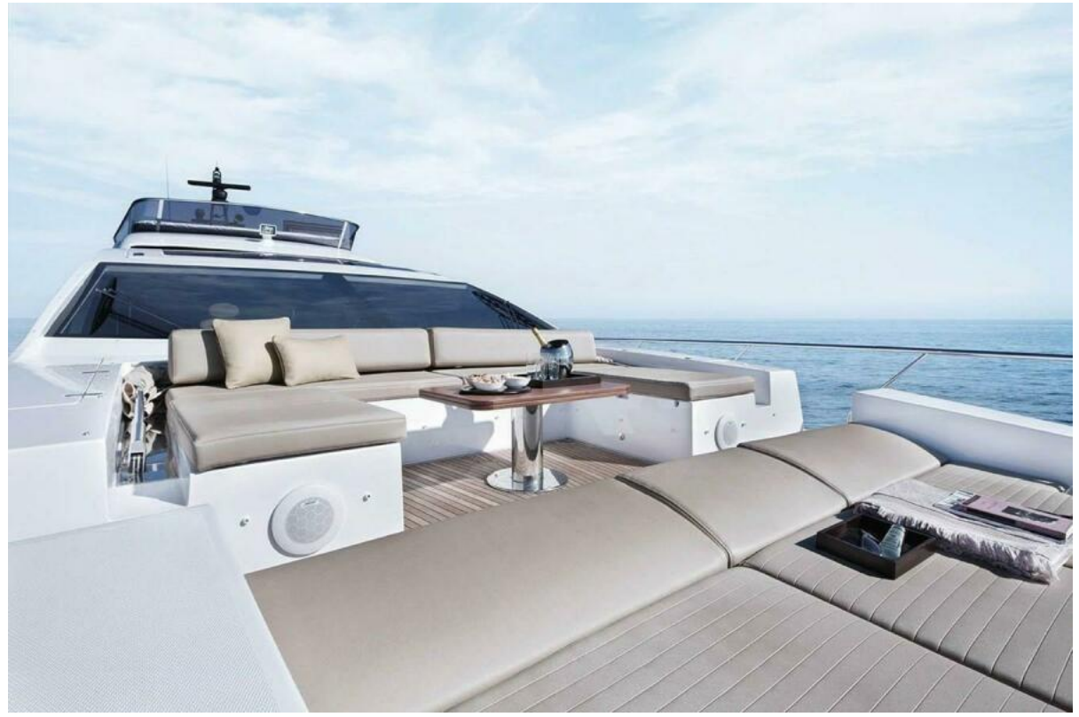
Fantastic_77 Bow Lounge