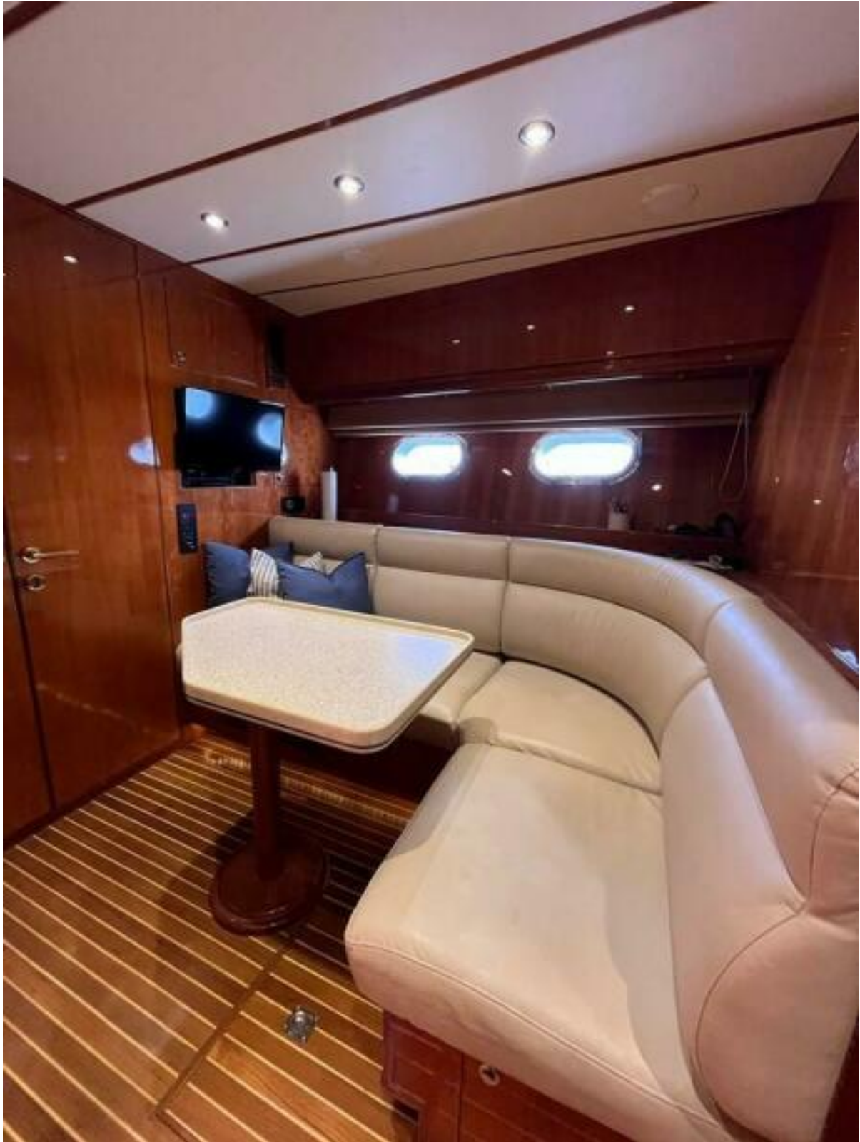
Crew Area 1