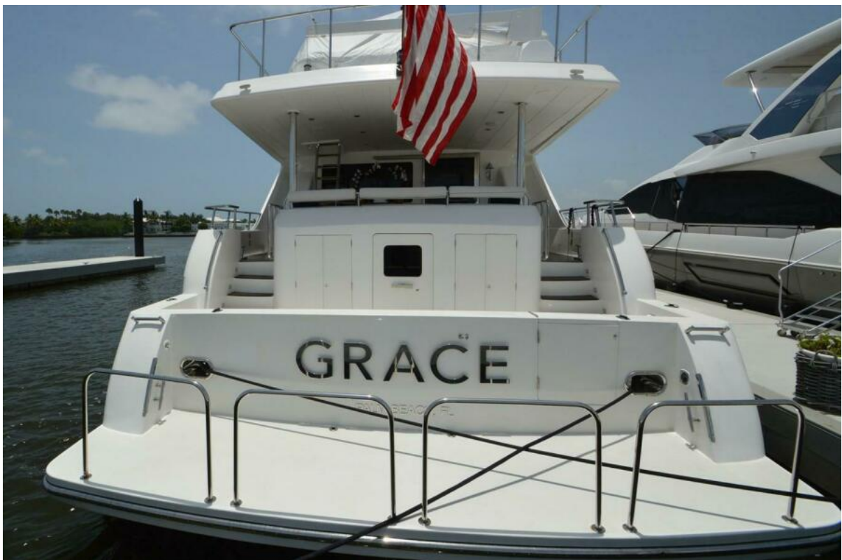
Swim Platform 2