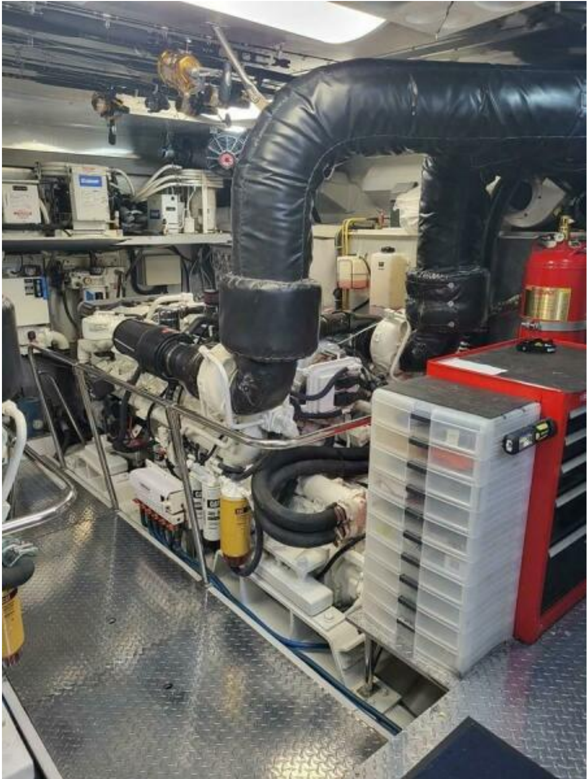
Engine room 1