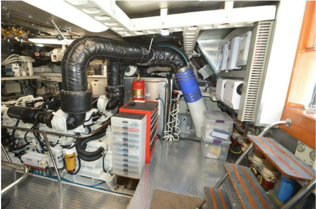
Engine room 6