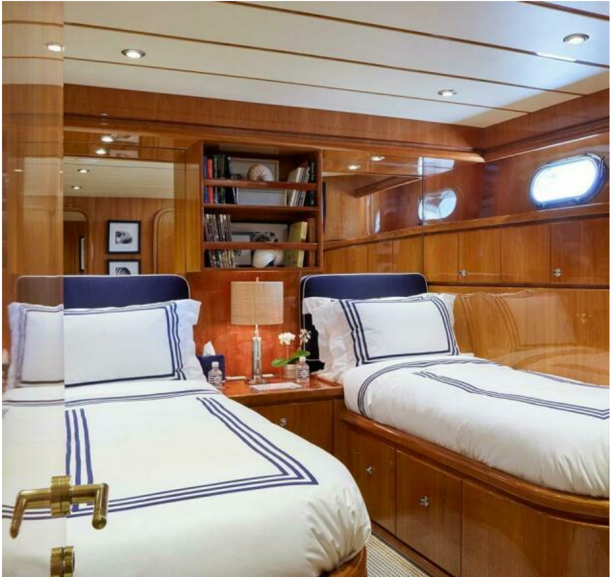
Guest Sateteroom 3