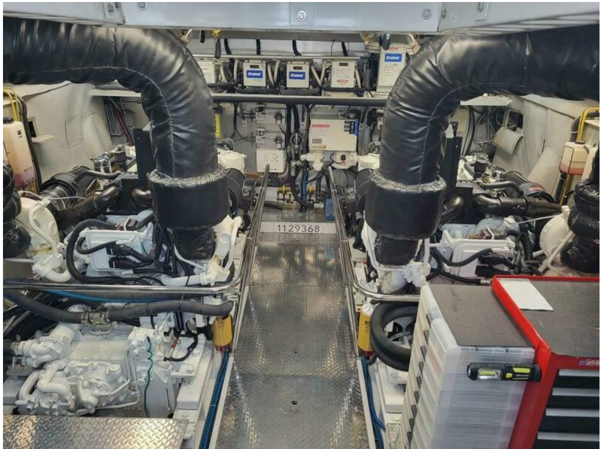
Engine room 2