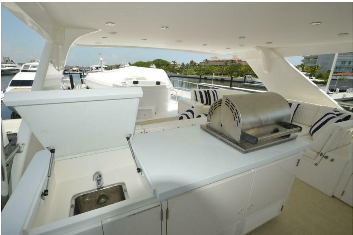
Sink And Grill