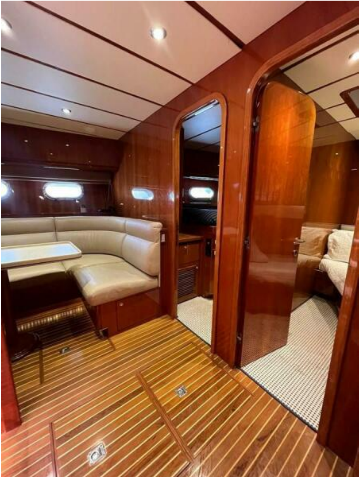
Crew Area 2