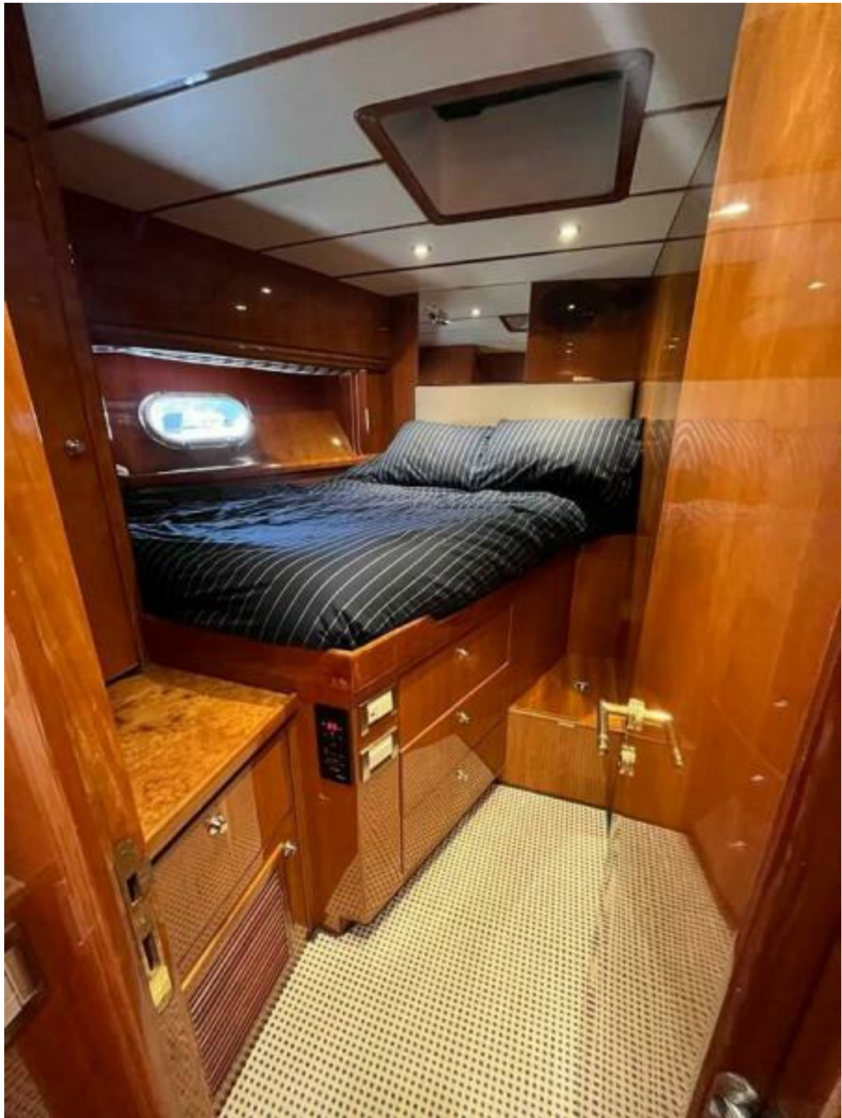
Capt Double Berth