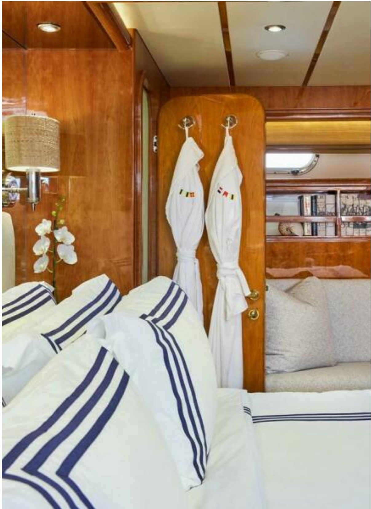
Main Stateroom 2