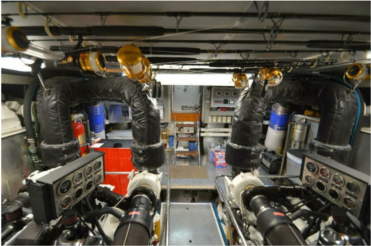
Engine room 4