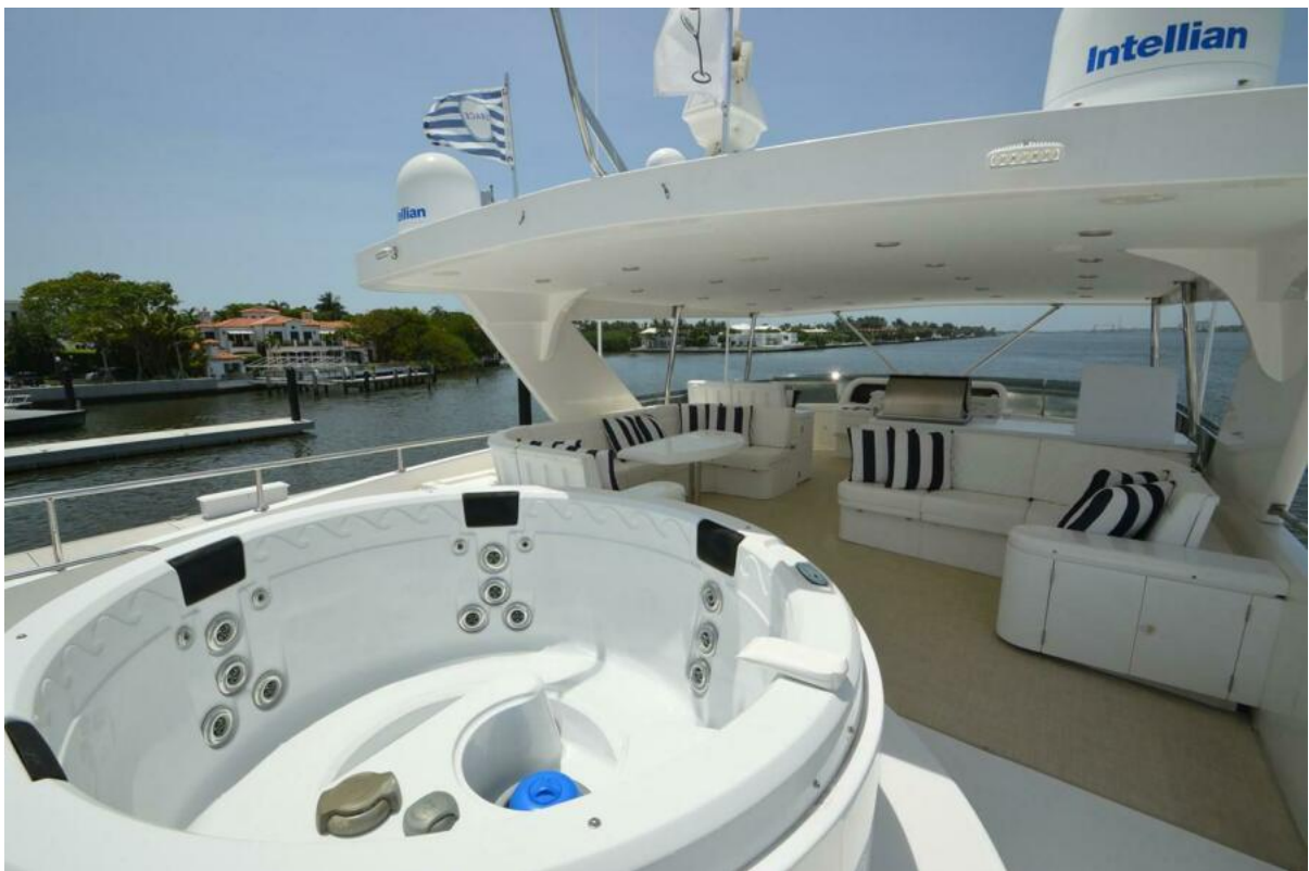
Aft Deck 4