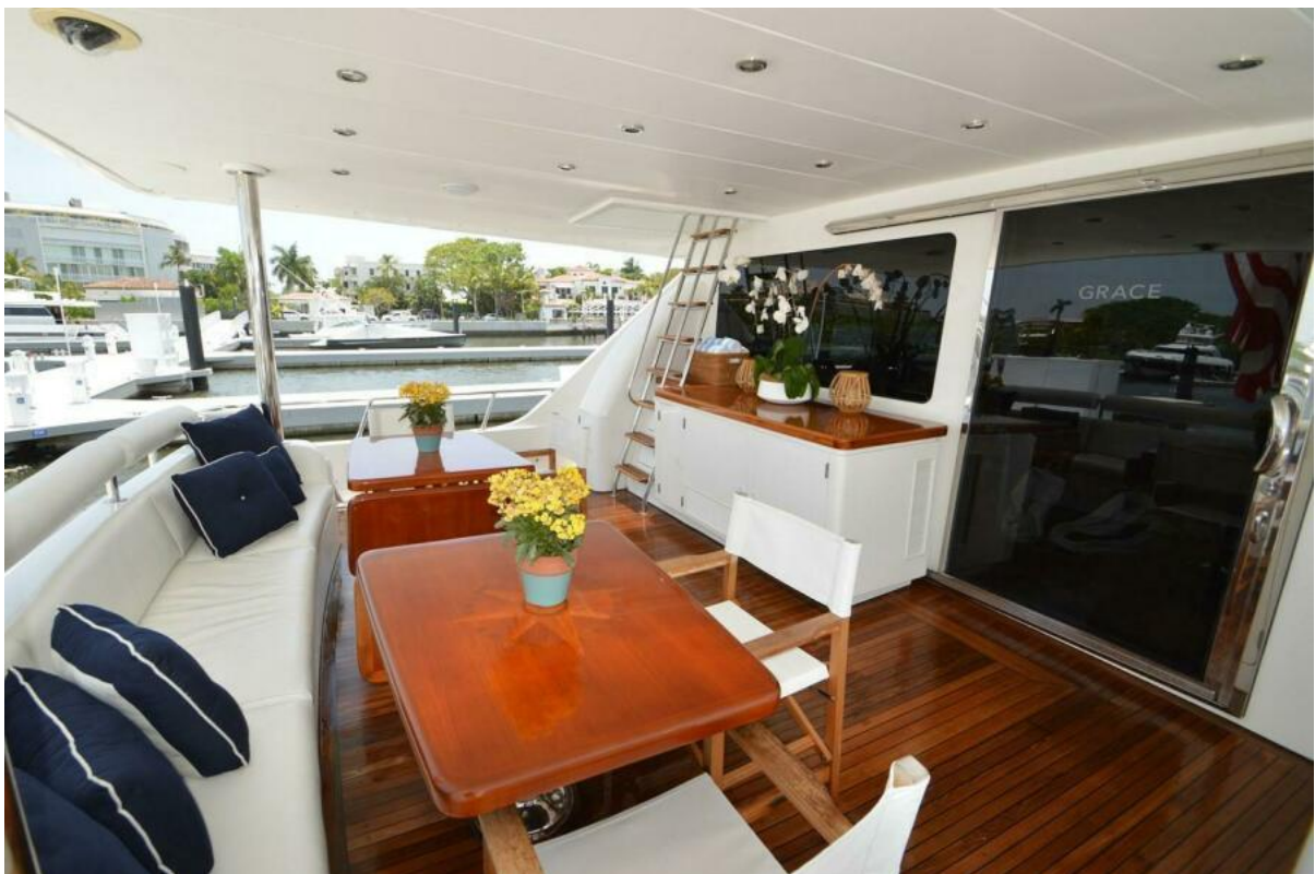
Aft Deck 2