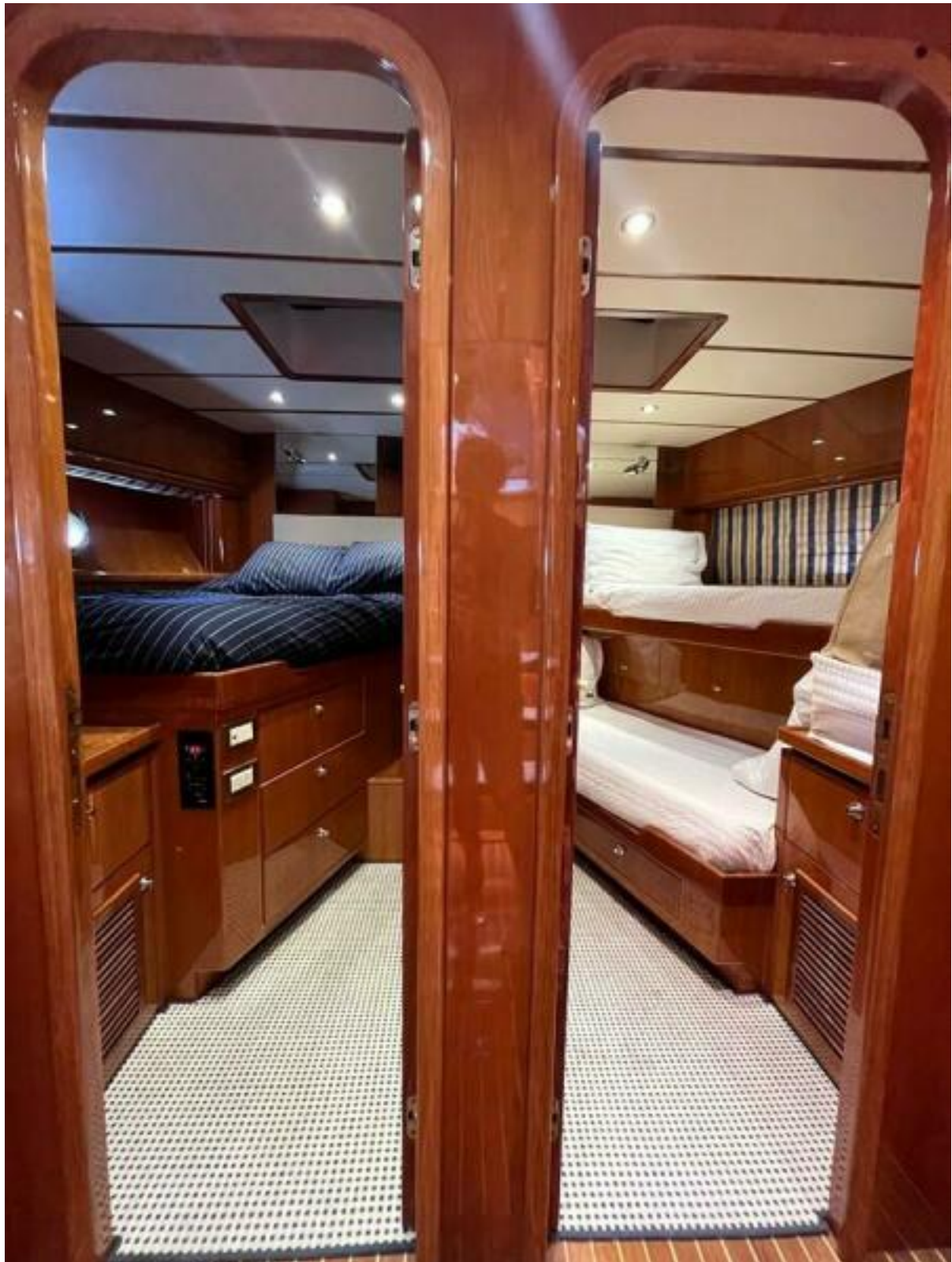
Crew Bow Stateroom