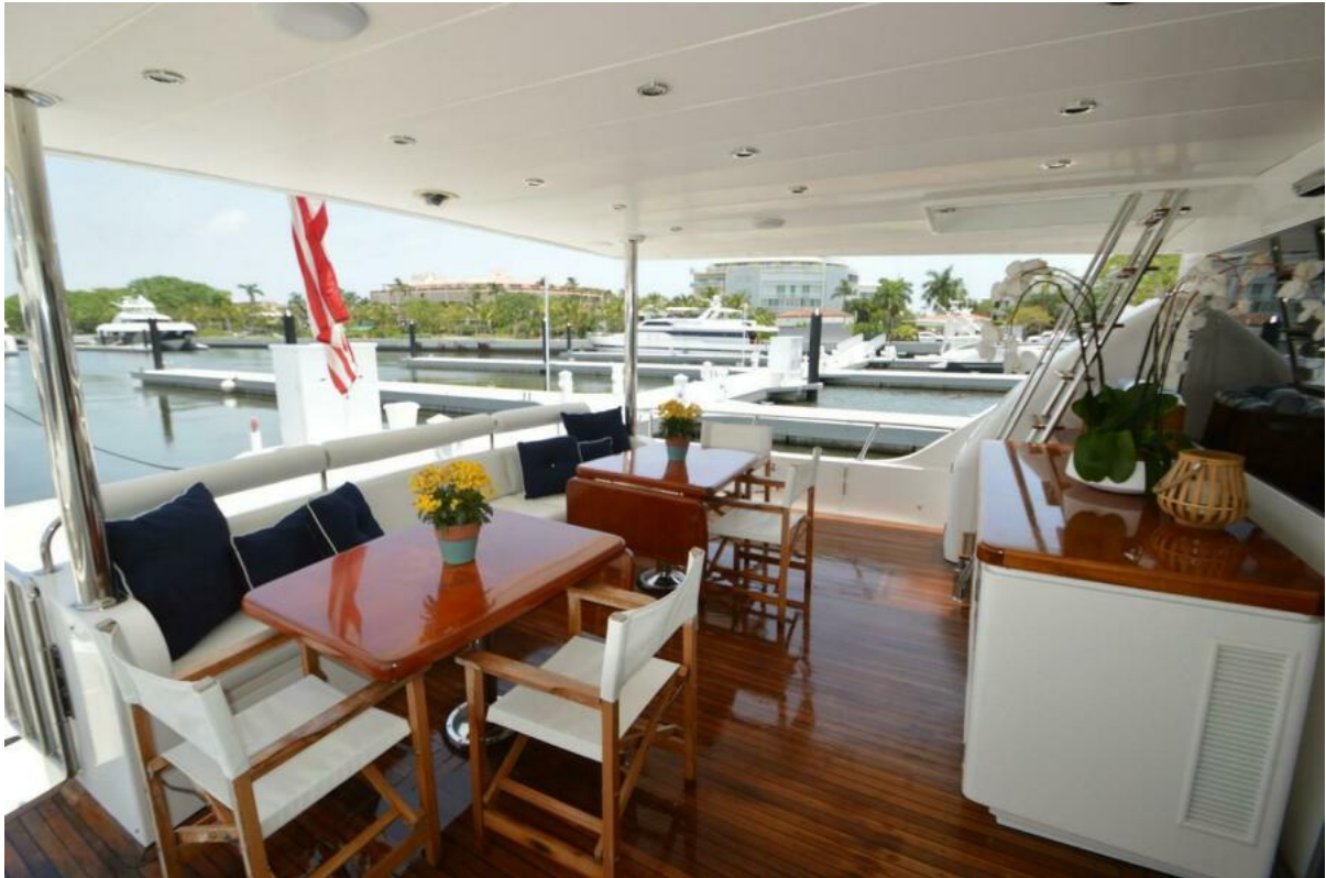
Aft Deck 1