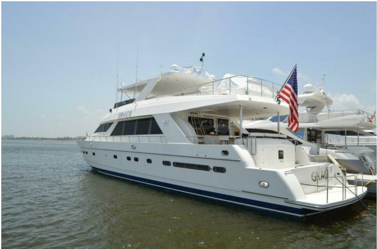
GRACE - 82' Hargrave Capri