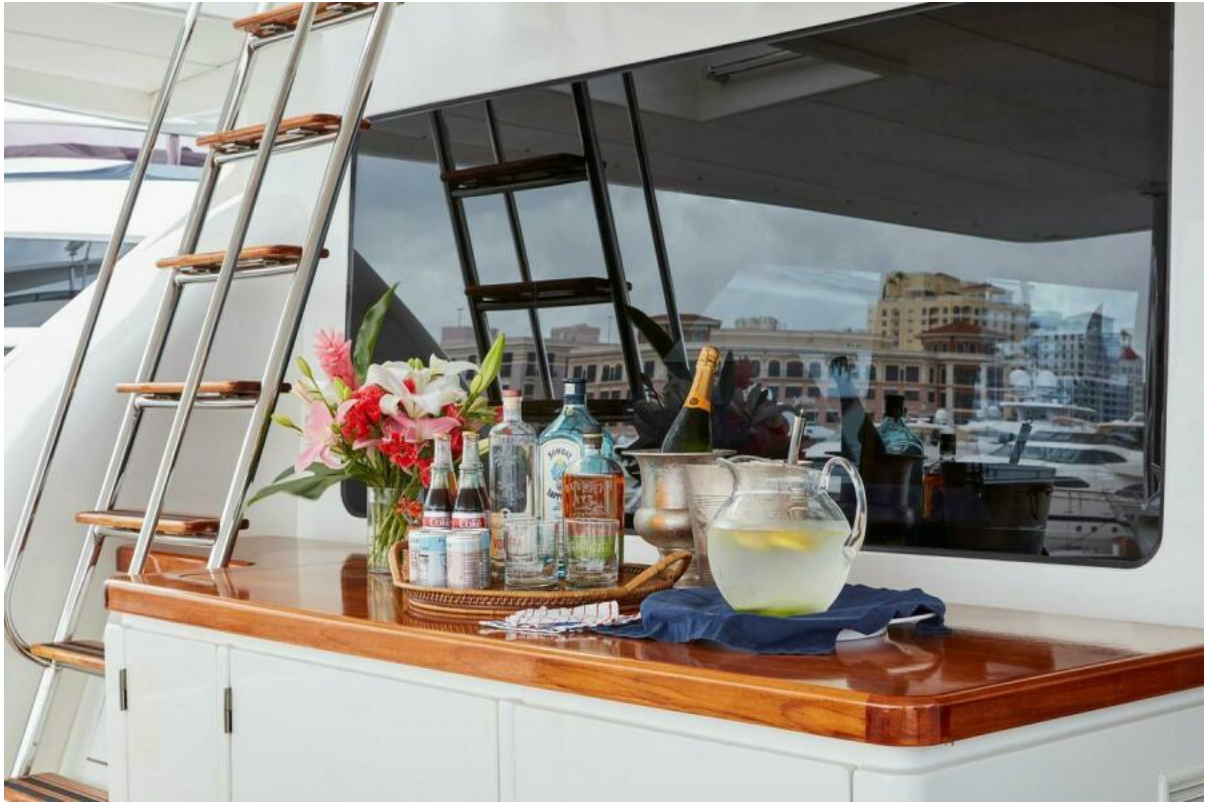
Aft Deck 3