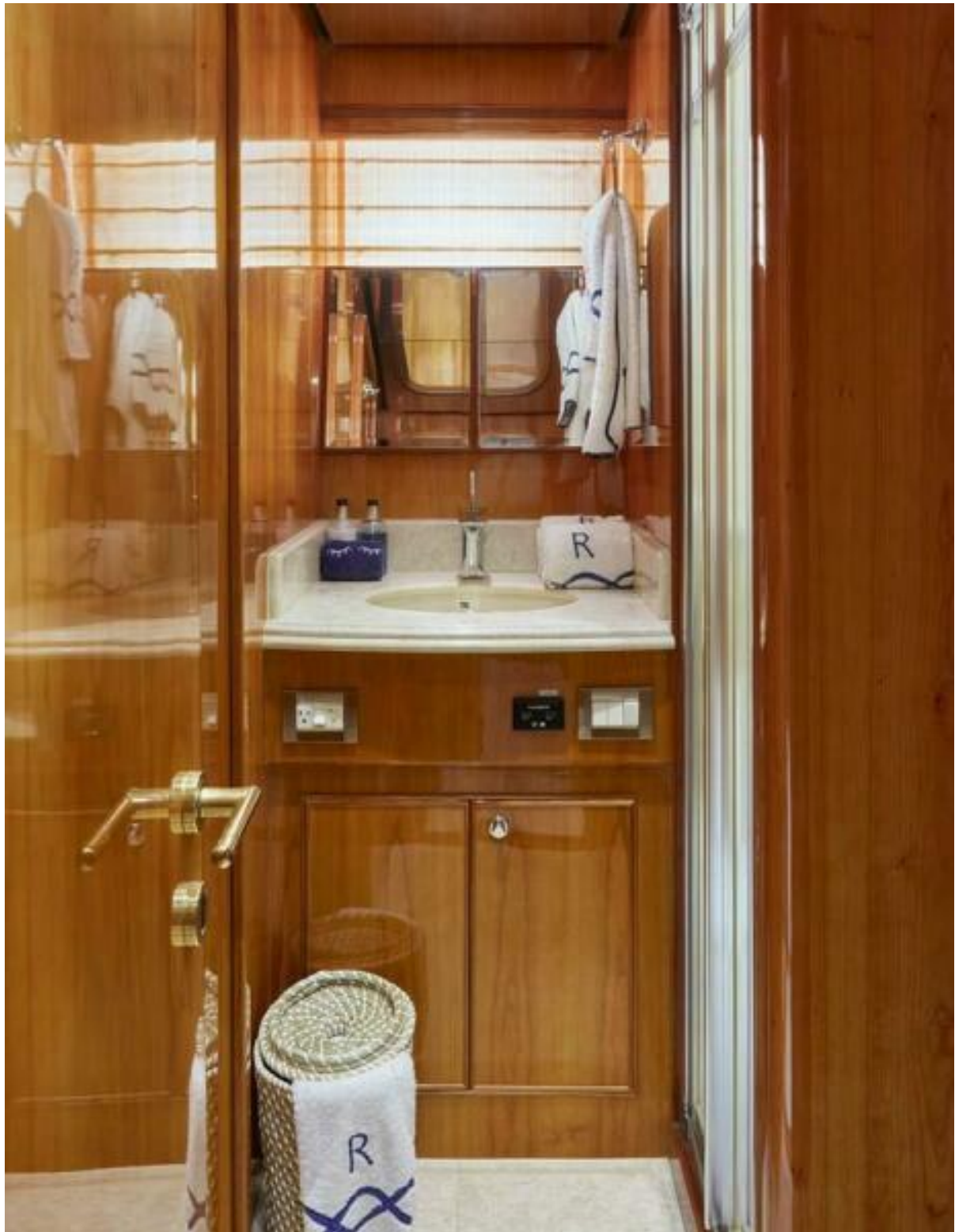
Guest Stateroom Ensuite