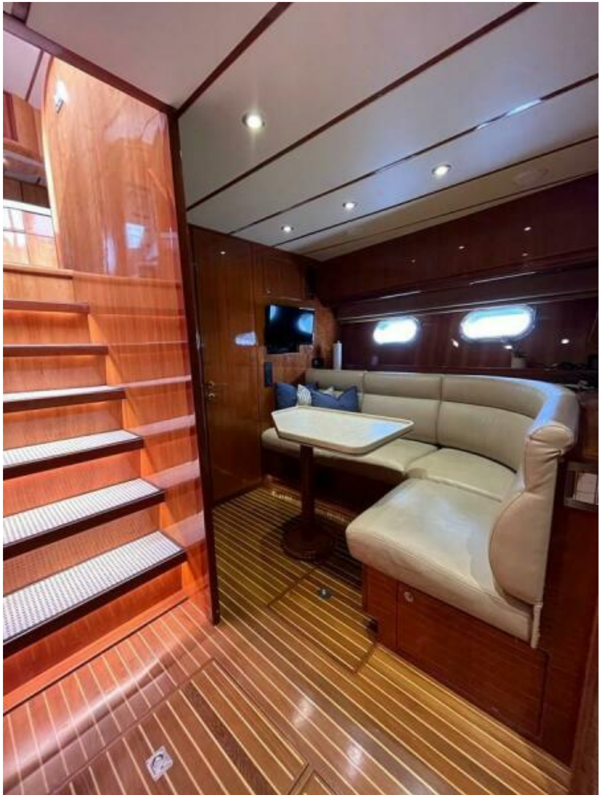
Crew Area Stairs 1