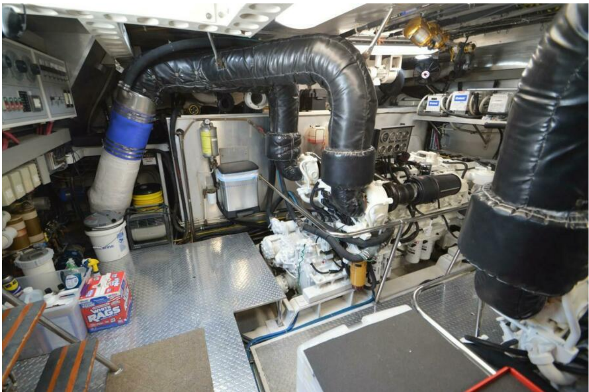
Engine room 5