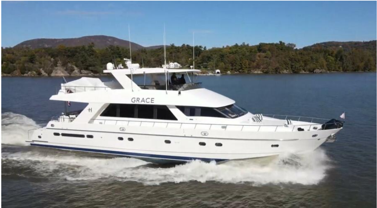
GRACE - 82' Hargrave Capri 82' (24.99m) Hargrave Motoryacht, 2002/2017