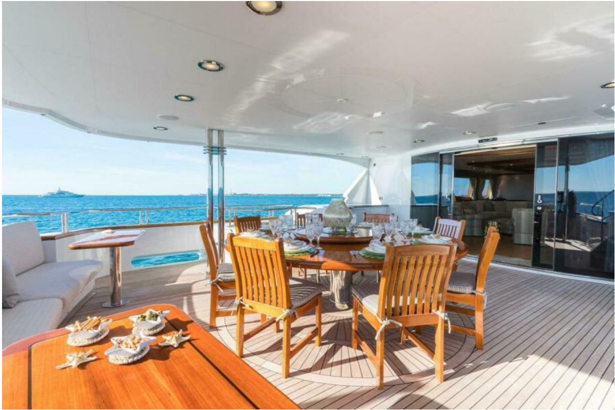
Bridge Aft Deck