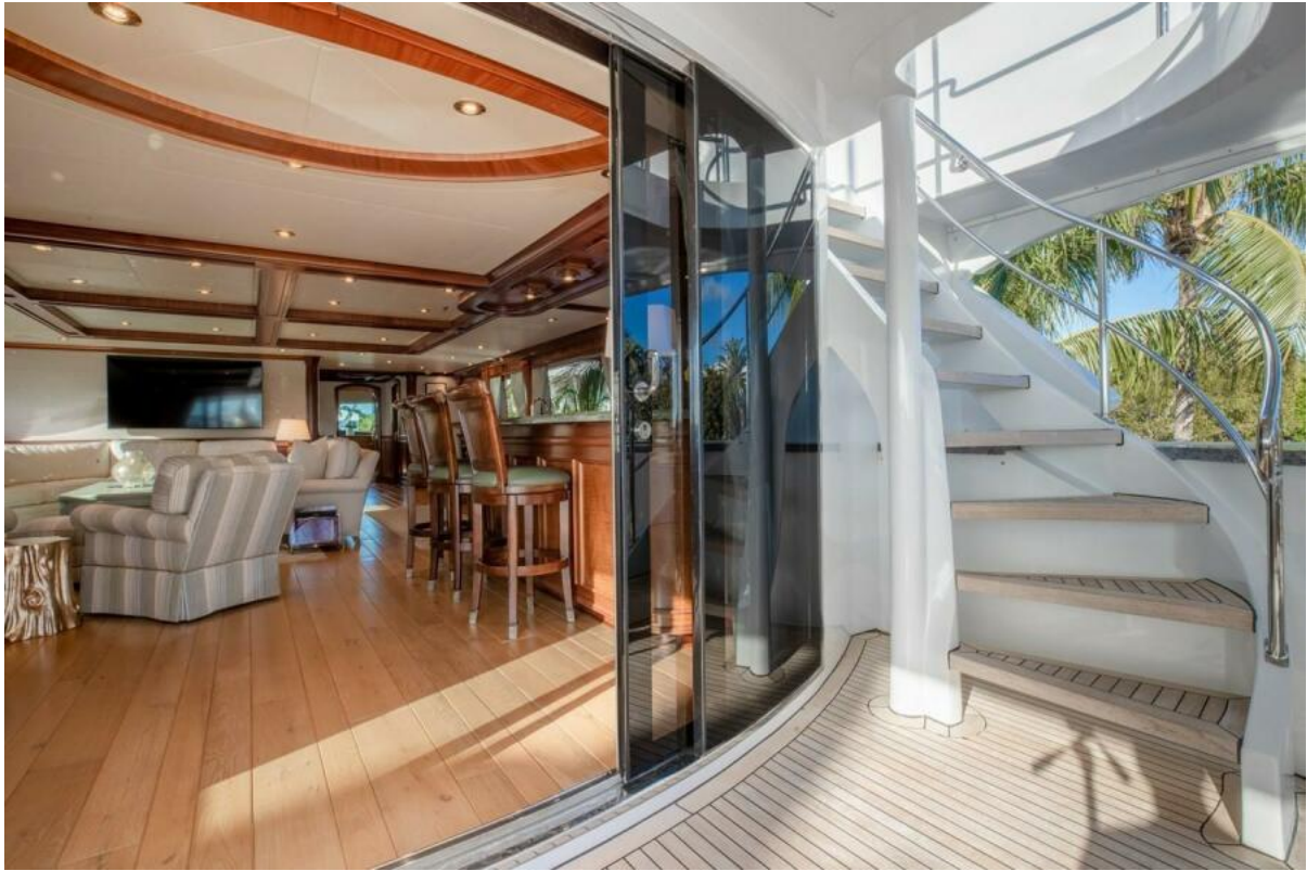
Bridge Aft Deck and Fly Bridge Stairs