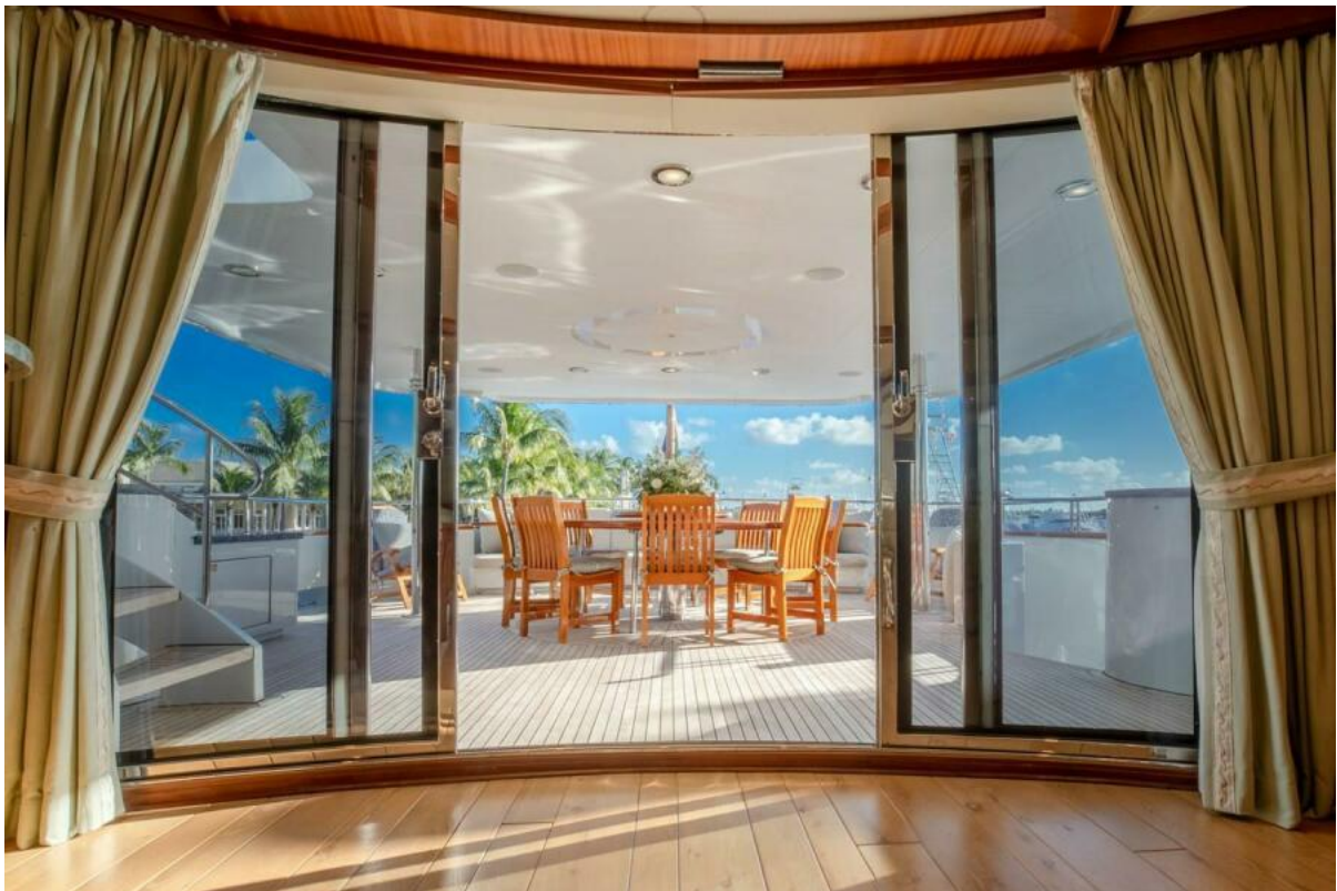
Bridge After Deck