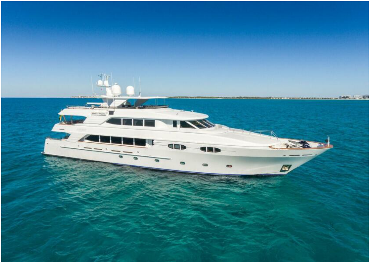
MISS STEPHANIE 138' (42m) Richmond Motoryacht, 2004/2023