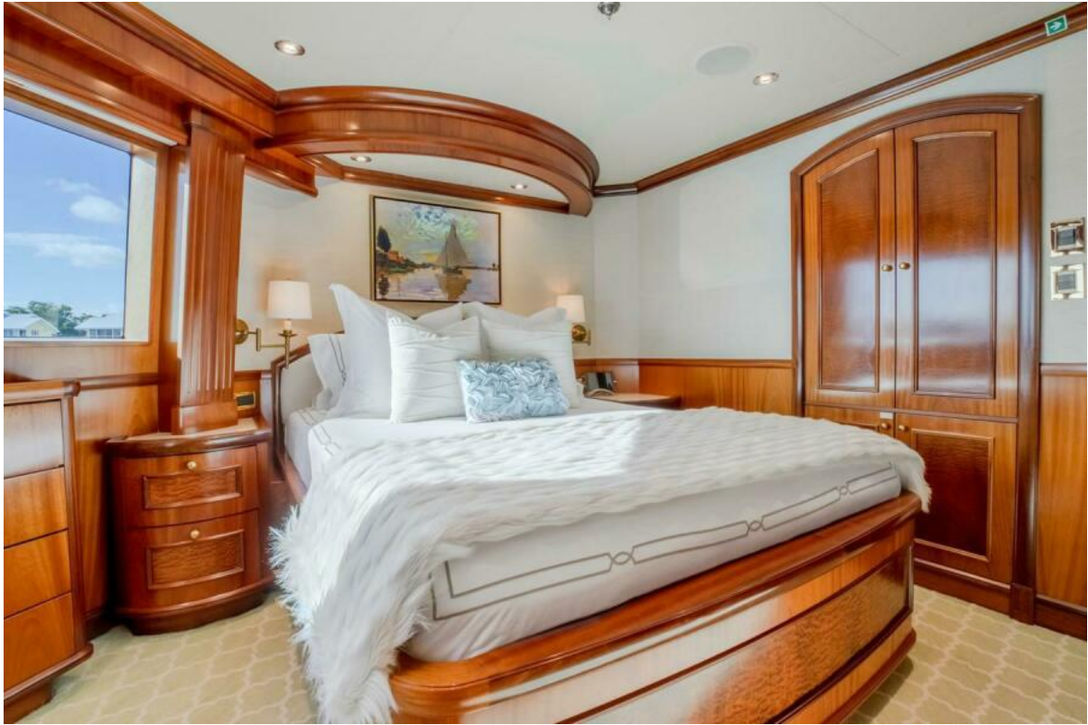
VIP Stateroom on Bridge Deck