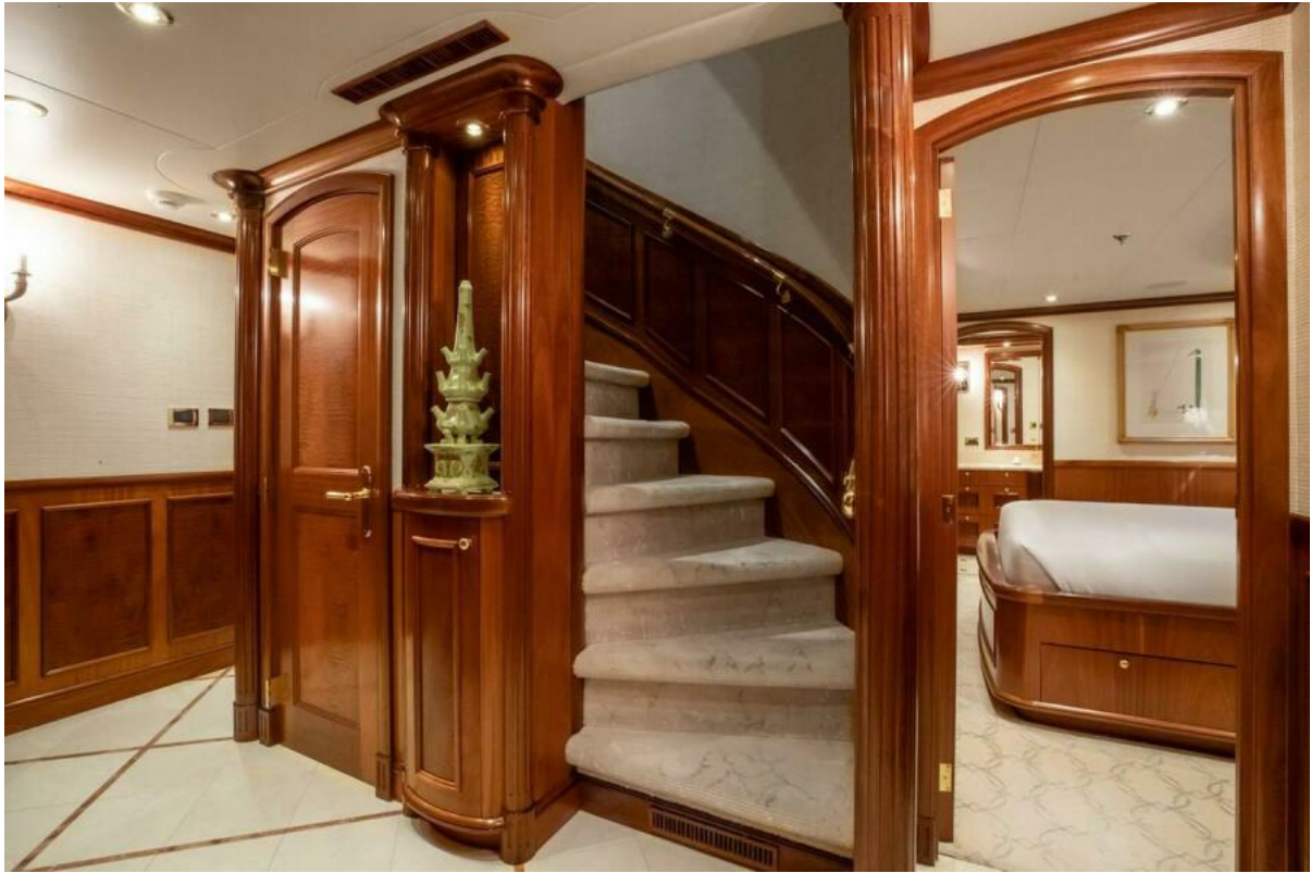
Stairs to Lower Deck