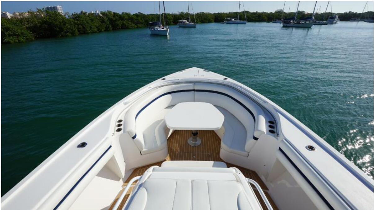
BOW - FRONT SEATING