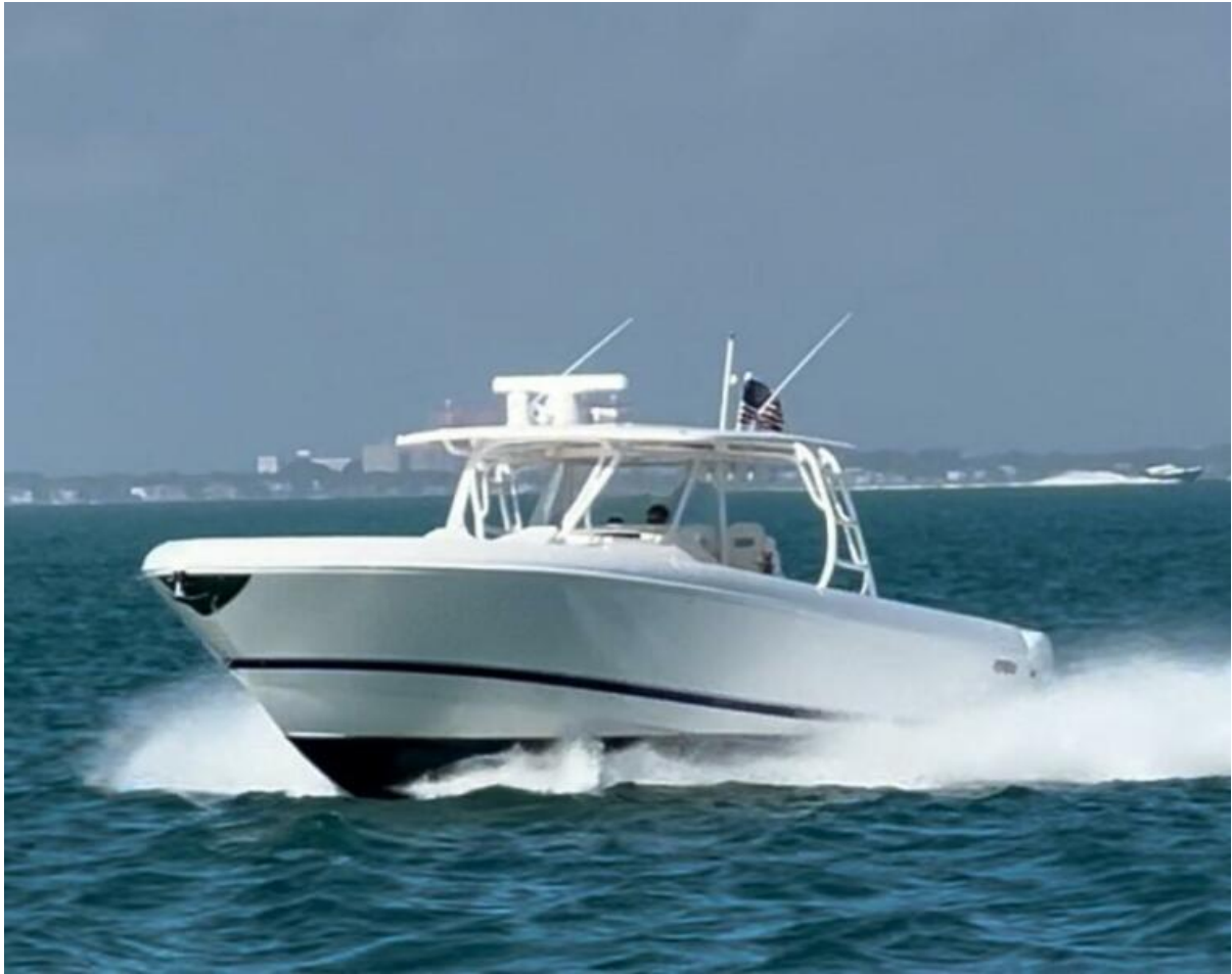
AUDACIOUS 47' (14.33m) Intrepid, 475 Panacea, 2016