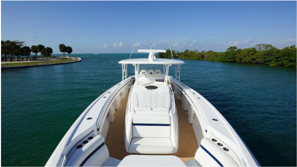
FWD SUNBED 7 FWD FACING SEATING