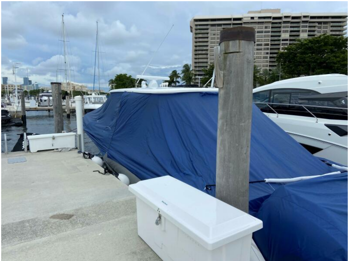
COVER FOR THE ENTIRE BOAT