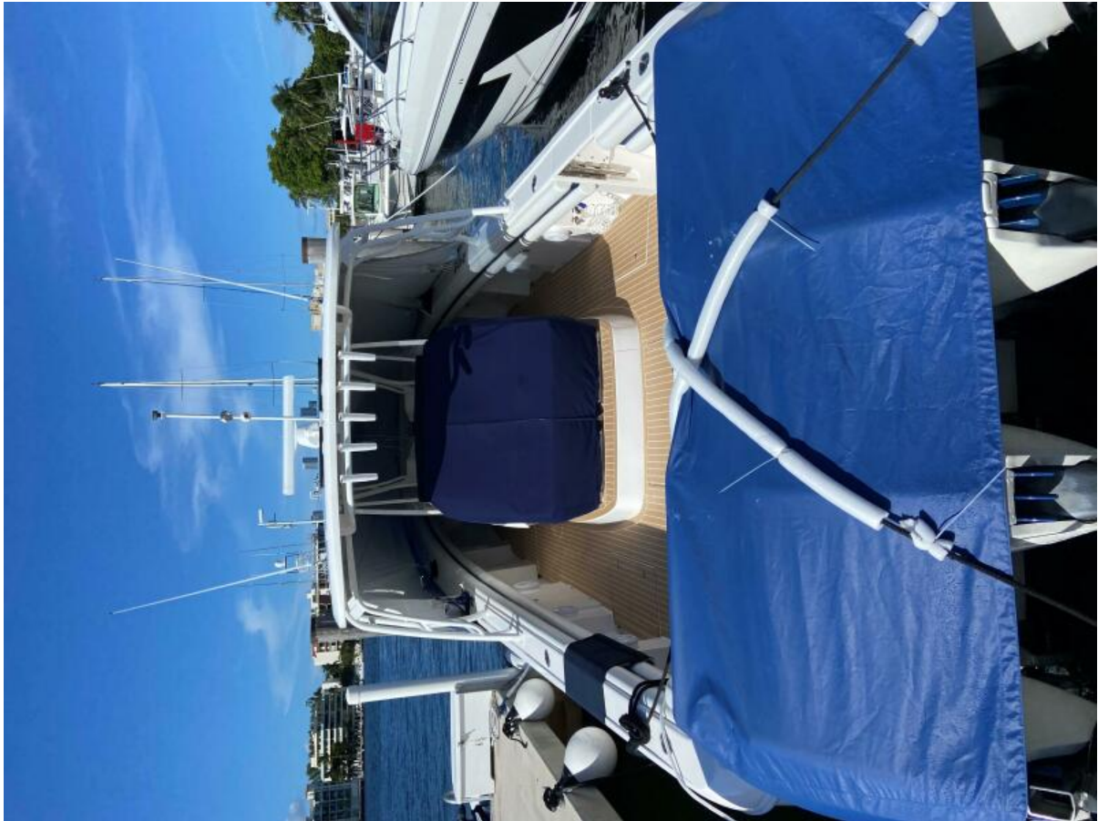
CPVERS FOR THE ENGINES