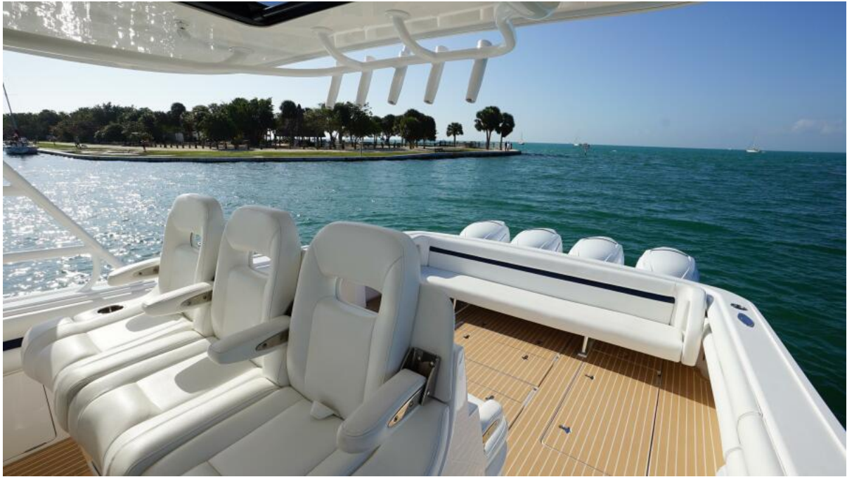
HELM AND AFT SEATING