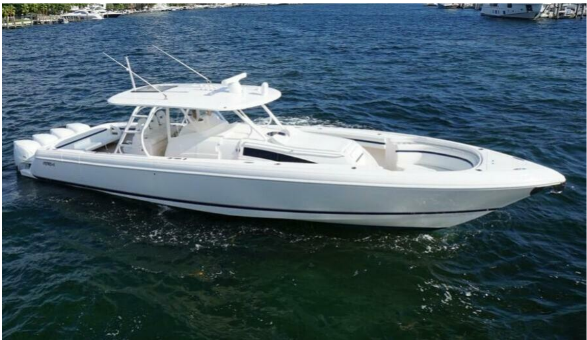
AUDACIOUS 47' (14.33m) Intrepid, 475 Panacea, 2016