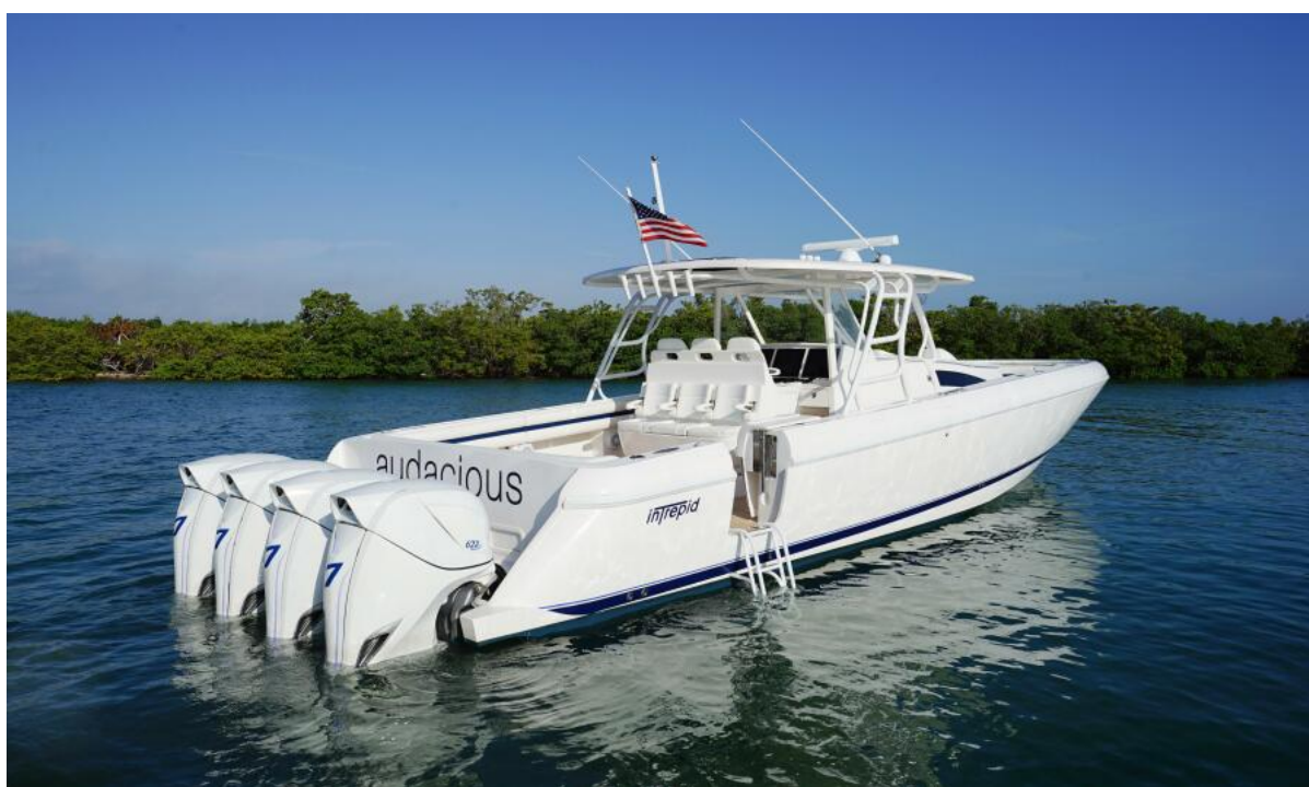
ENGINES (4) Seven Marine 627 SV Dual Prop (627 HP)