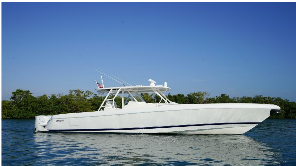
AUDACIOUS 47' (14.33m) Intrepid, 475 Panacea, 2016