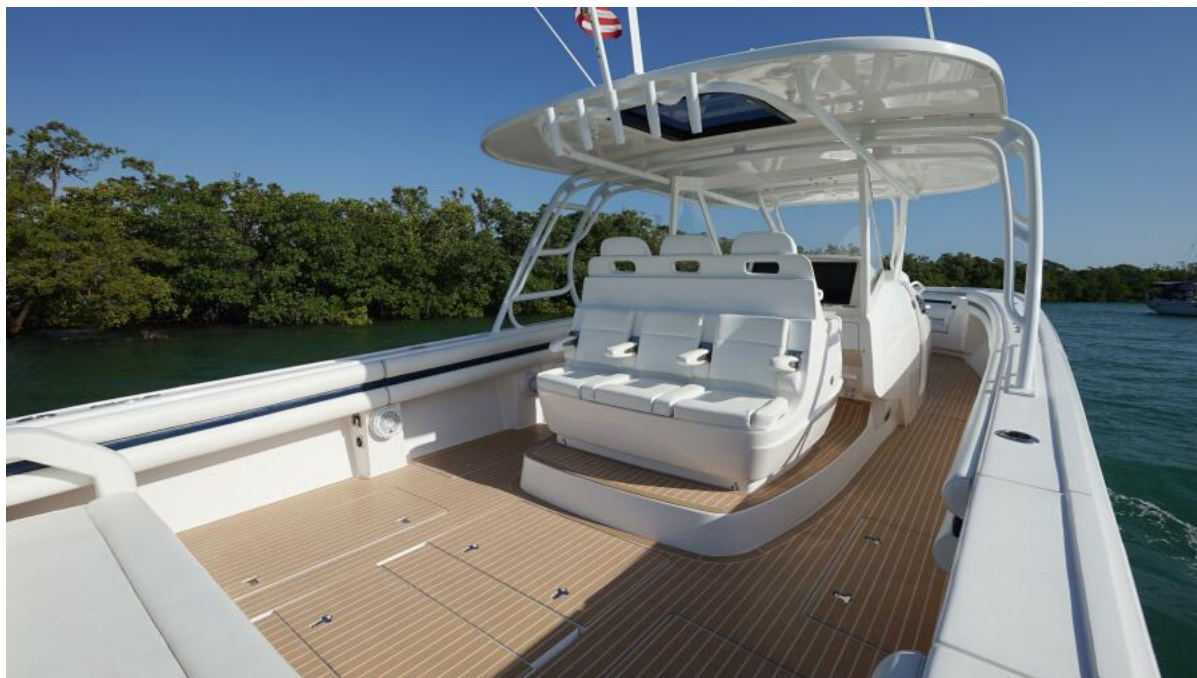
AFT FACING SEATING