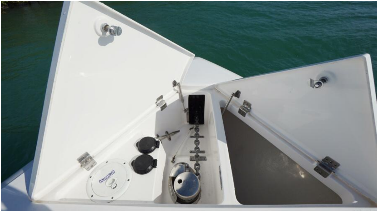
WIDLASS AND ANCHOR CHAIN LOCKER