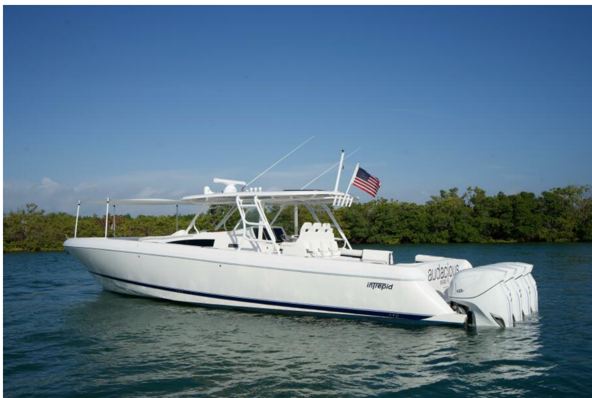
PORT 47' (14.33m) Intrepid, 475 Panacea, 2016