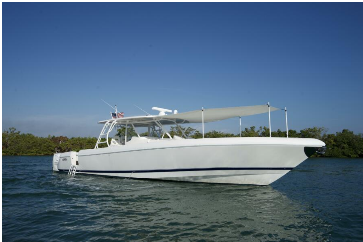
STBD. & SUNSHADE 47' (14.33m) Intrepid, 475 Panacea, 2016