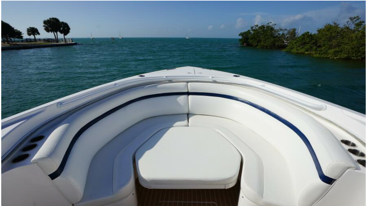
BOW - FRONT SEAT FILLER