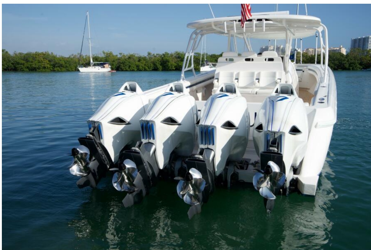
ENGINES DUAL PROP 47' (14.33m) Intrepid, 475 Panacea, 2016 - (4) Seven Marine 627 SV Dual Prop (627 HP)