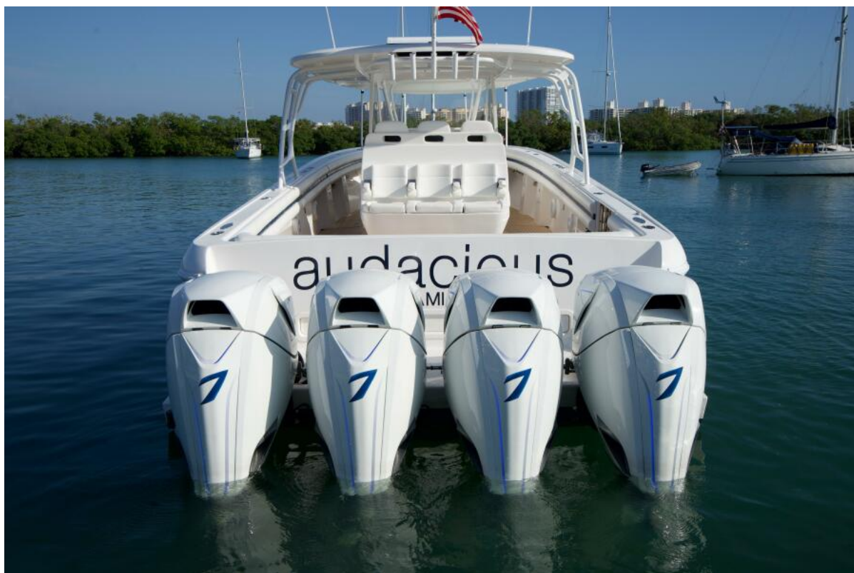
ENGINES 47' (14.33m) Intrepid, 475 Panacea, 2016 - (4) Seven Marine 627 SV Dual Prop (627 HP)