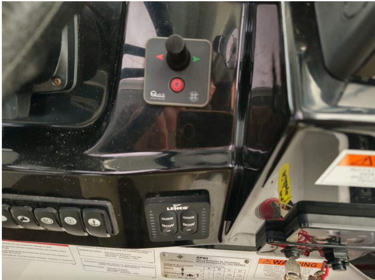
Knot Shore bow thruster and trim tabs