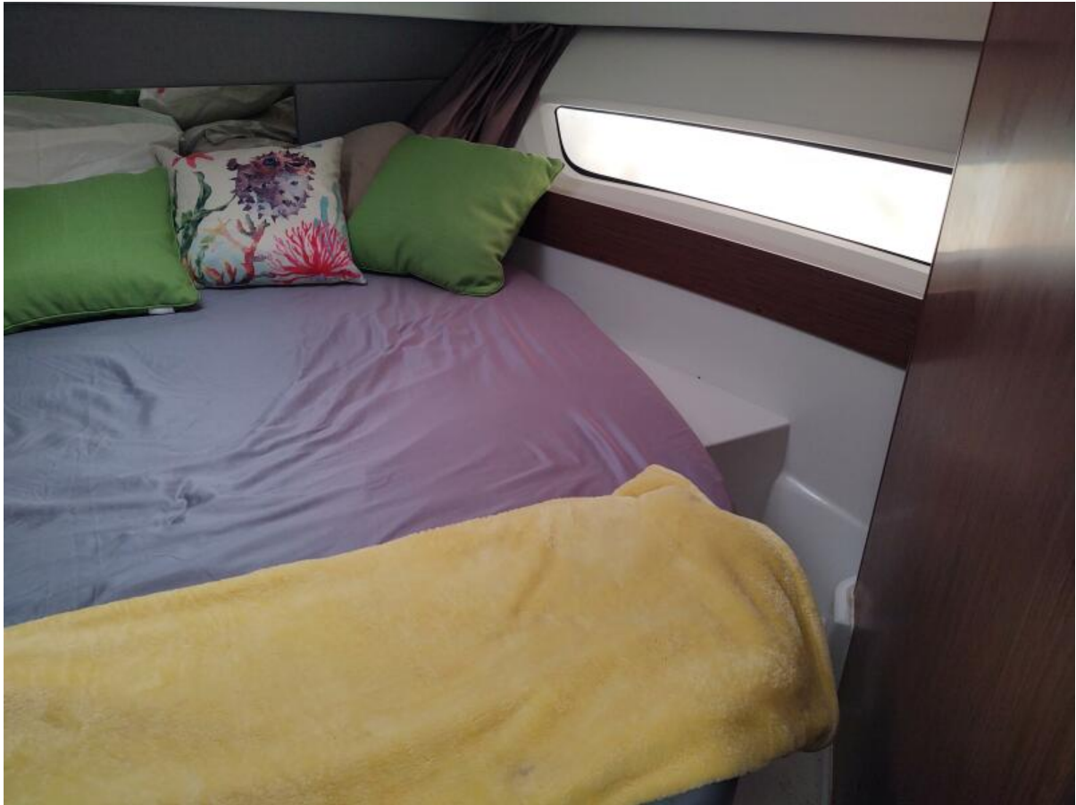
Knot Shore Fwd berth stbd