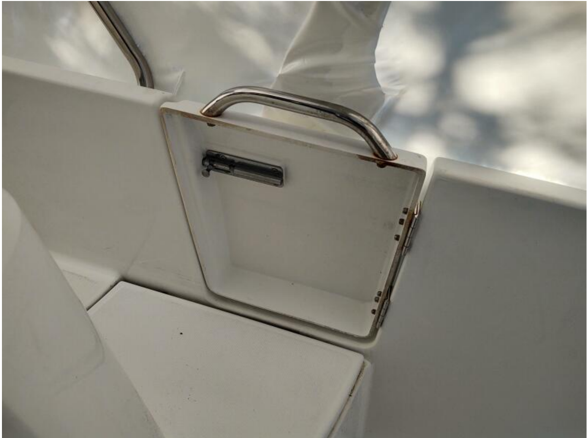
Knot Shore side door