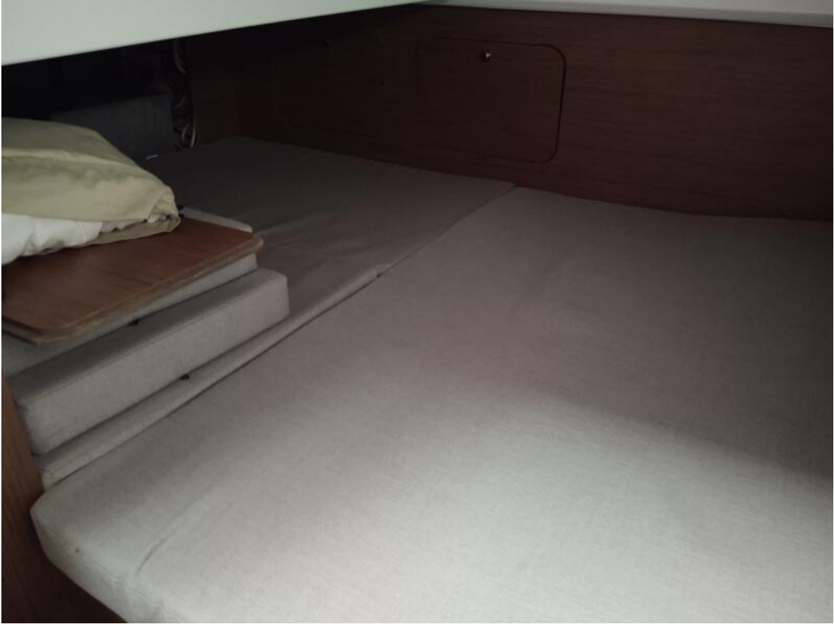
Knot Shore Aft berth