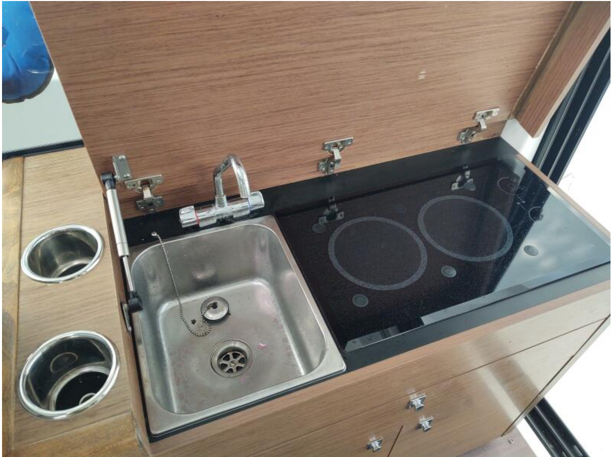
Knot Shore Galley sink and cooktop