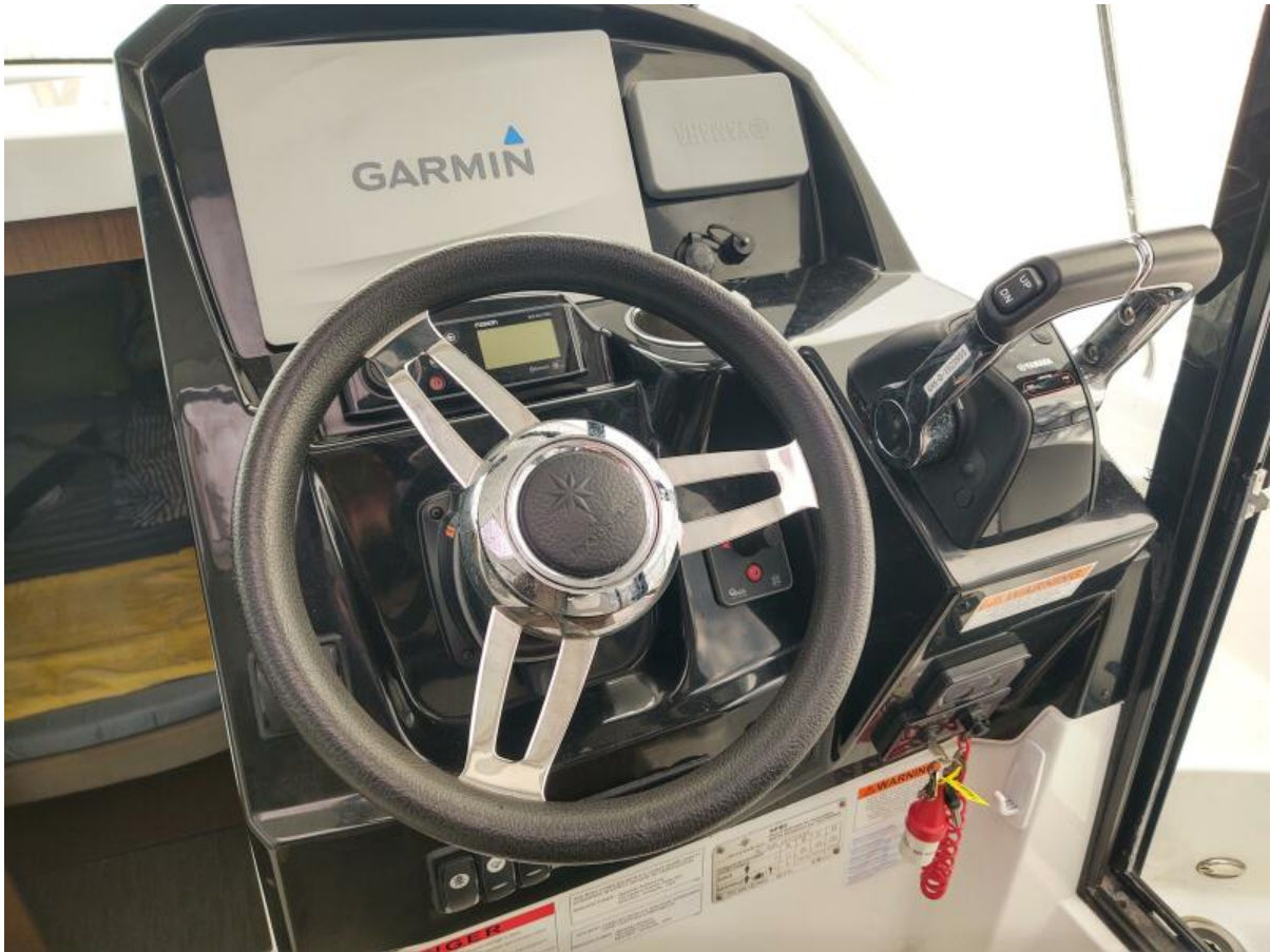
Knot Shore Helm console