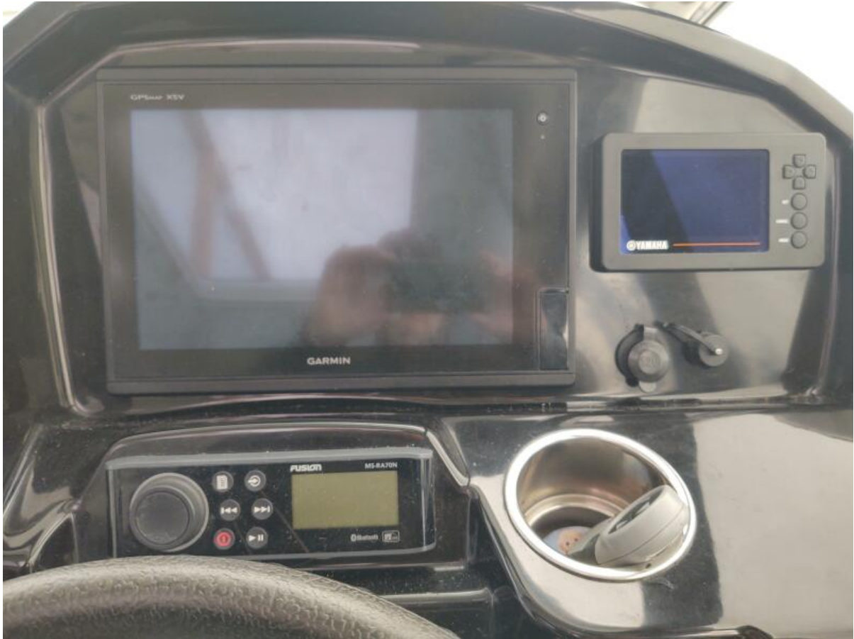
Knot Shore Chartplotter