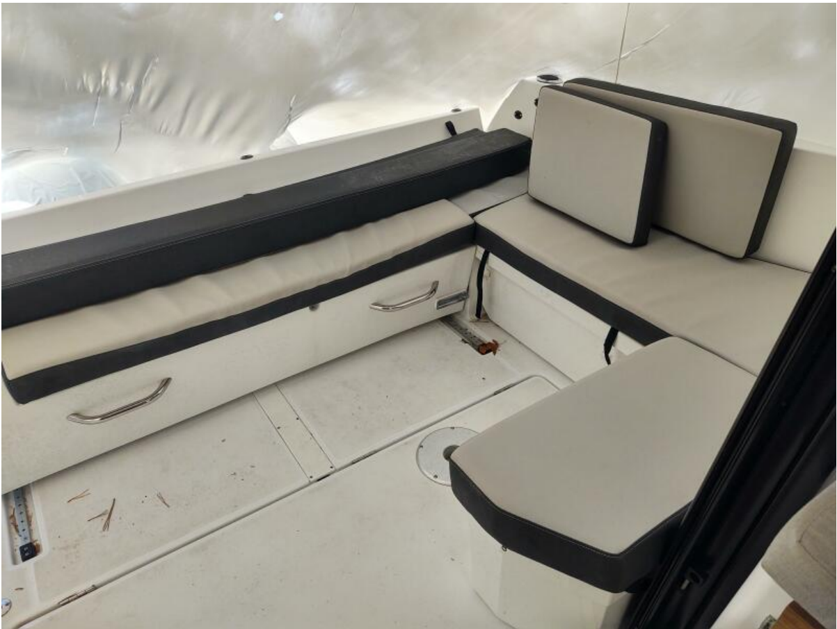
Knot Shore Cockpit