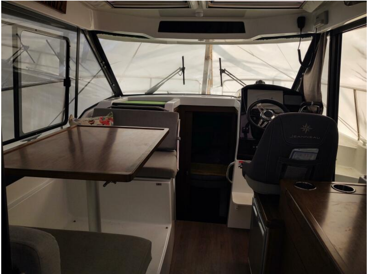
Knot Shore Interior