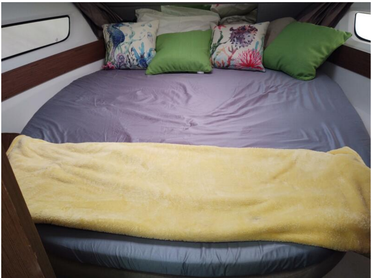
Knot Shore Fwd berth center