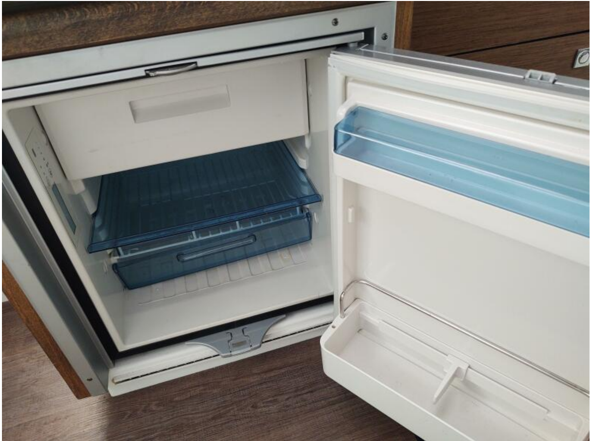
Knot Shore Refrigerator