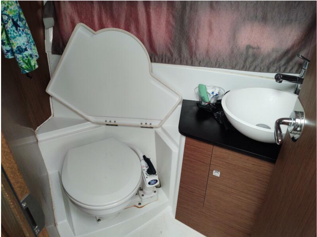
Knot Shore Head and vanity