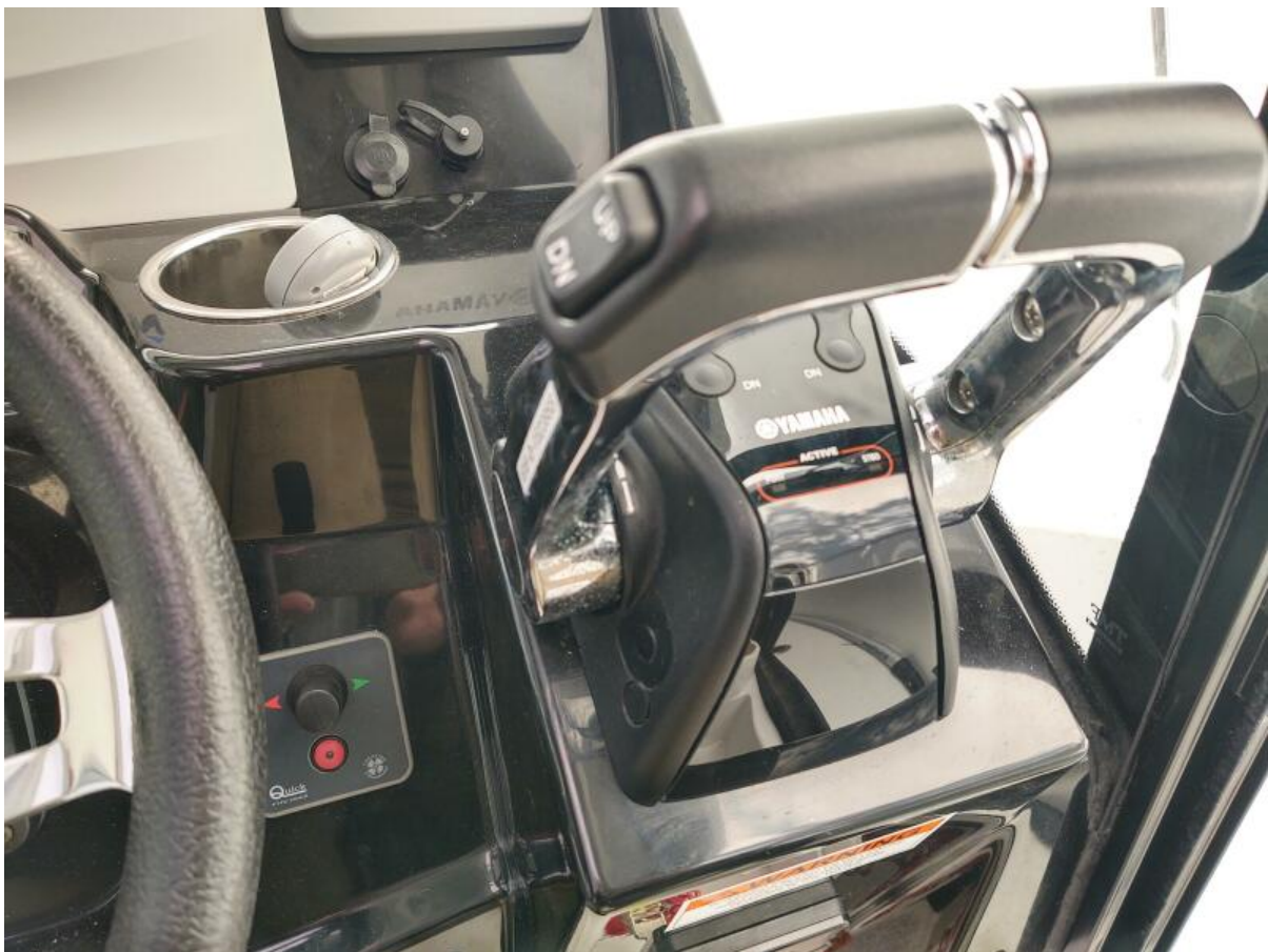
Knot Shore engine controls