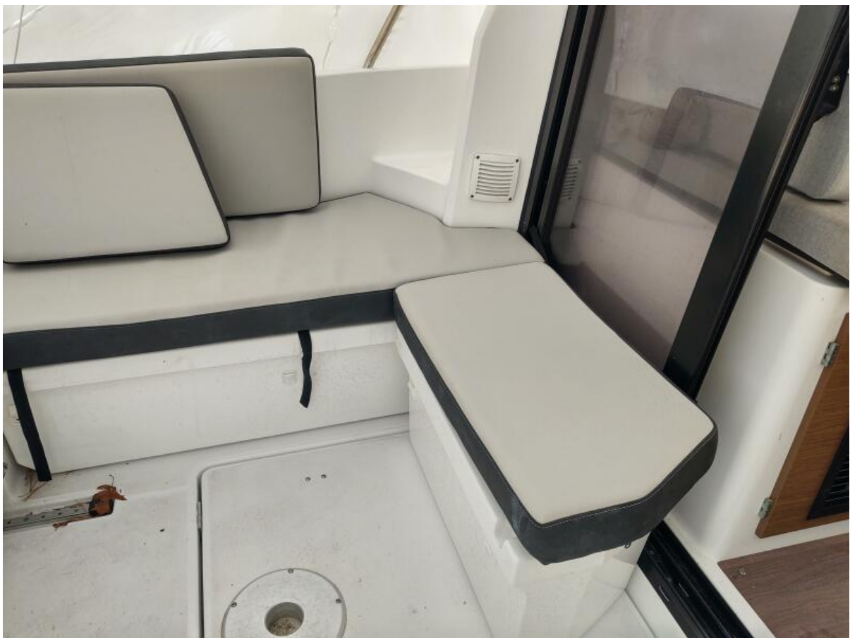
Knot Shore Cockpit cushions