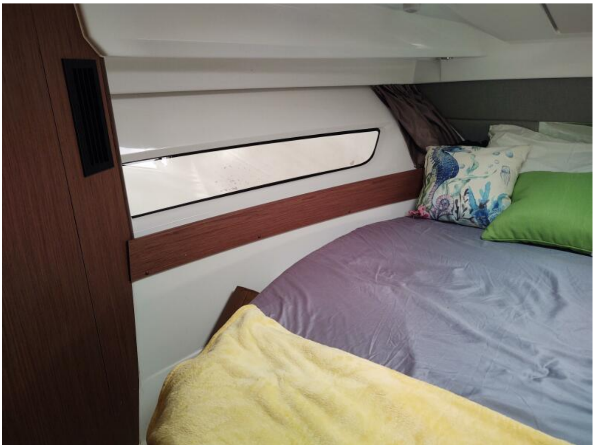
Knot Shore Fwd berth port