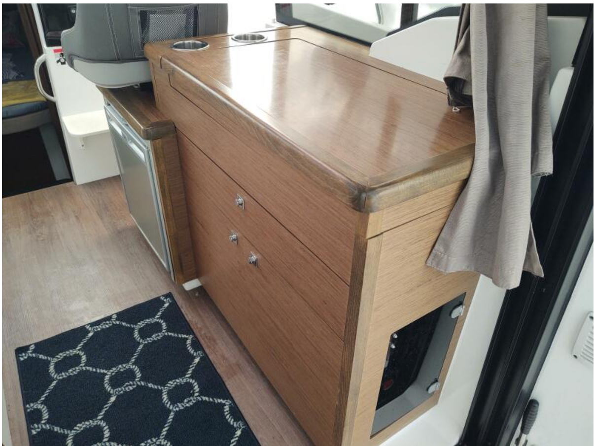
Knot Shore Galley