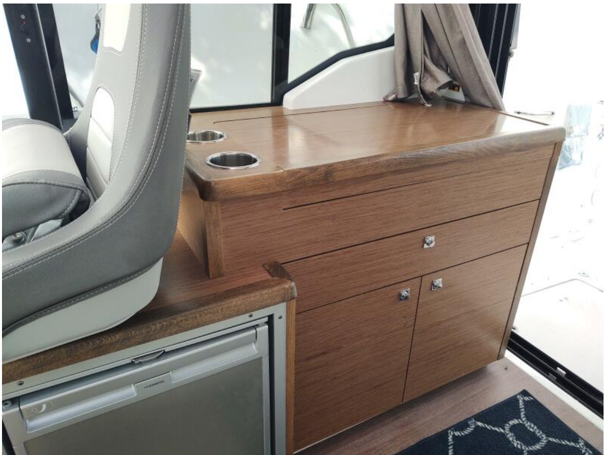
Knot Shore galley from fwd