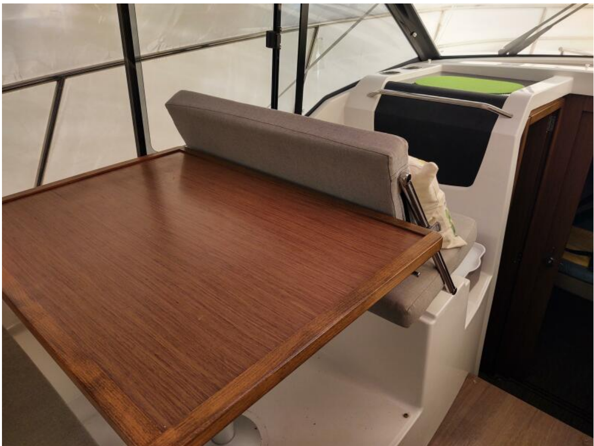
Knot Shore Companion seat