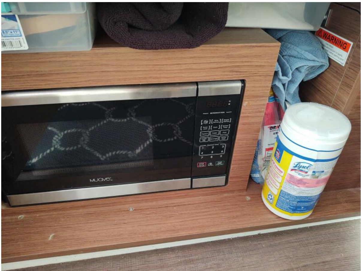
Knot Shore microwave