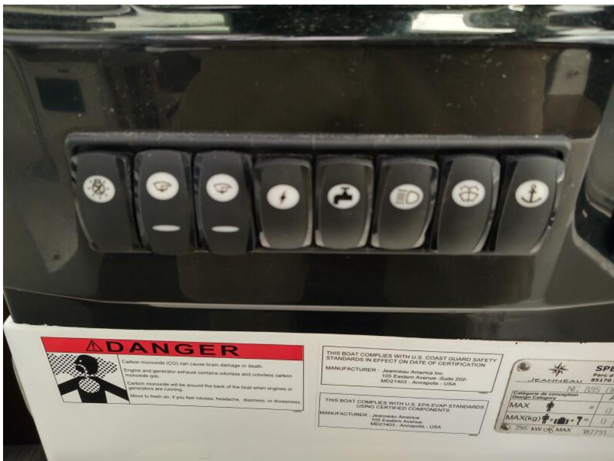
Knot Shore switch panel