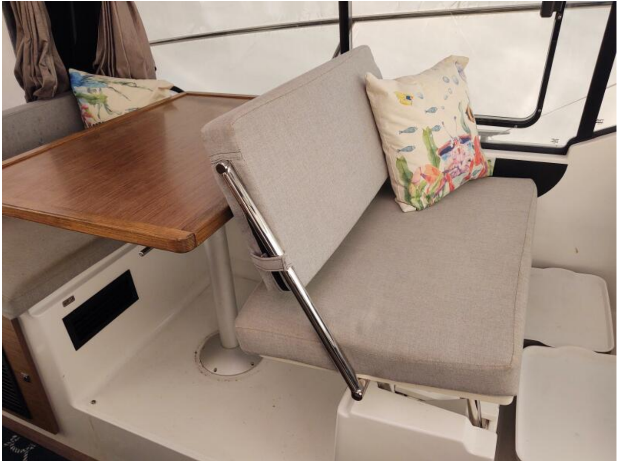
Knot Shore companion seat back