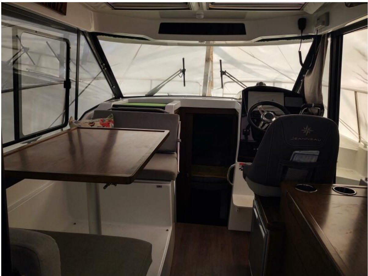
Knot Shore Interior