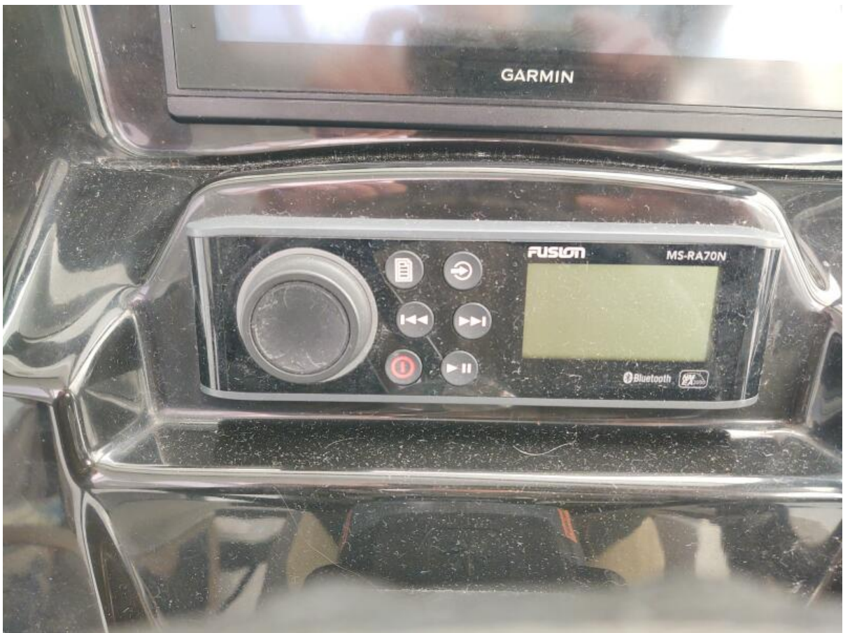
Knot Shoreo Fursion stereo