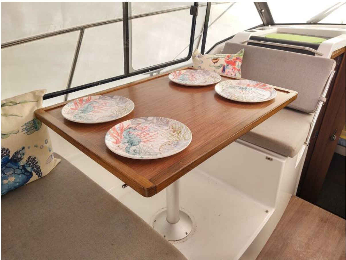
Knot Shore table set