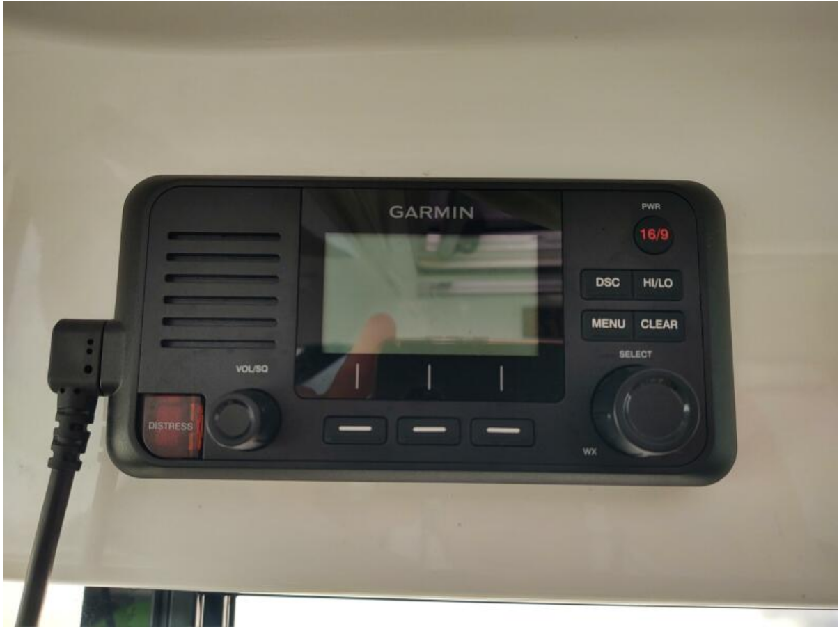
Knot Shore VHF radio