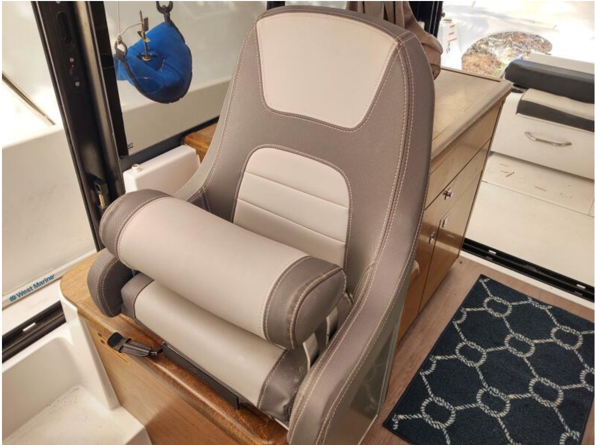
Knot Shore Helm seat bolster up