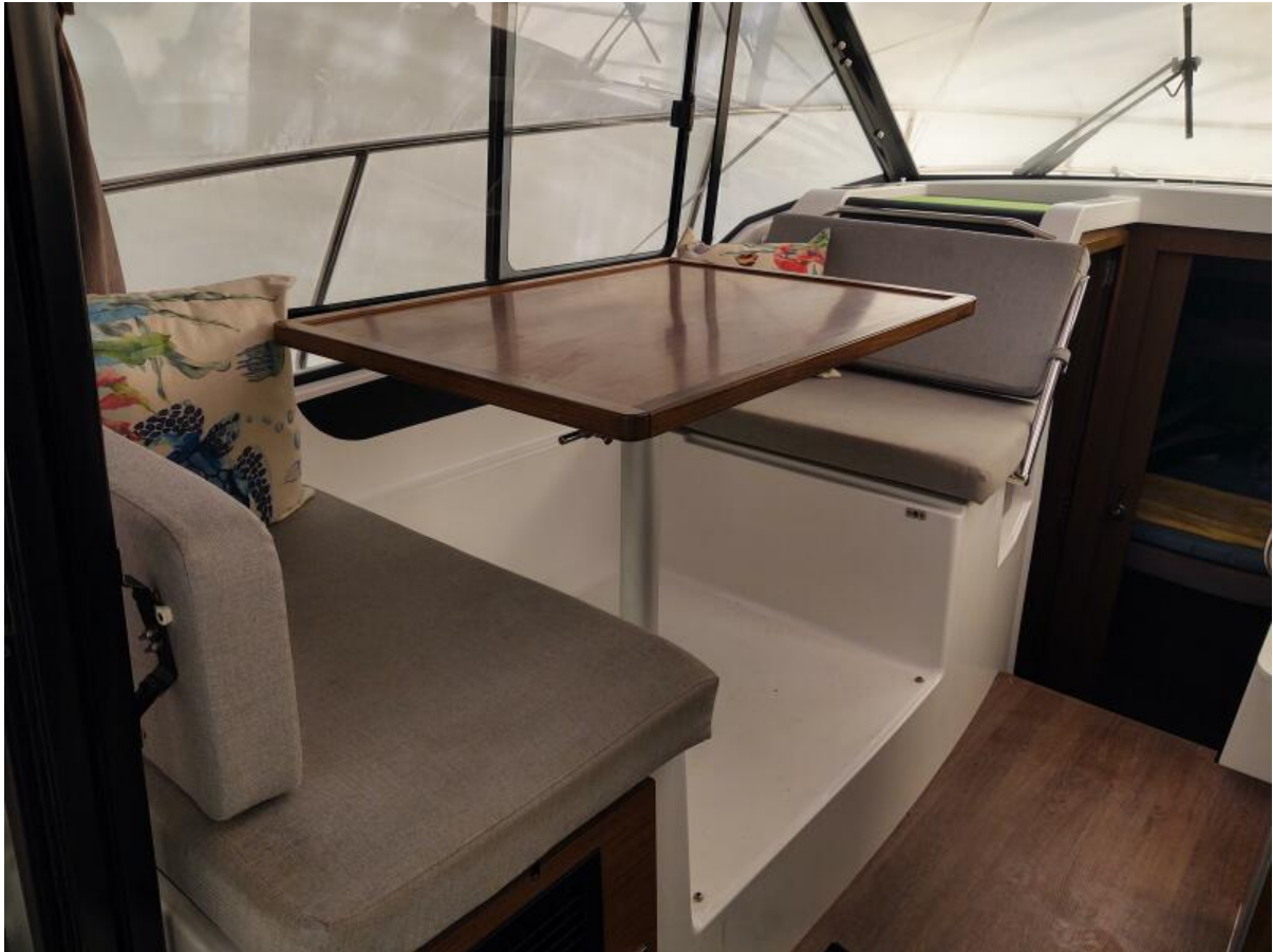
Knot Shore Dinette