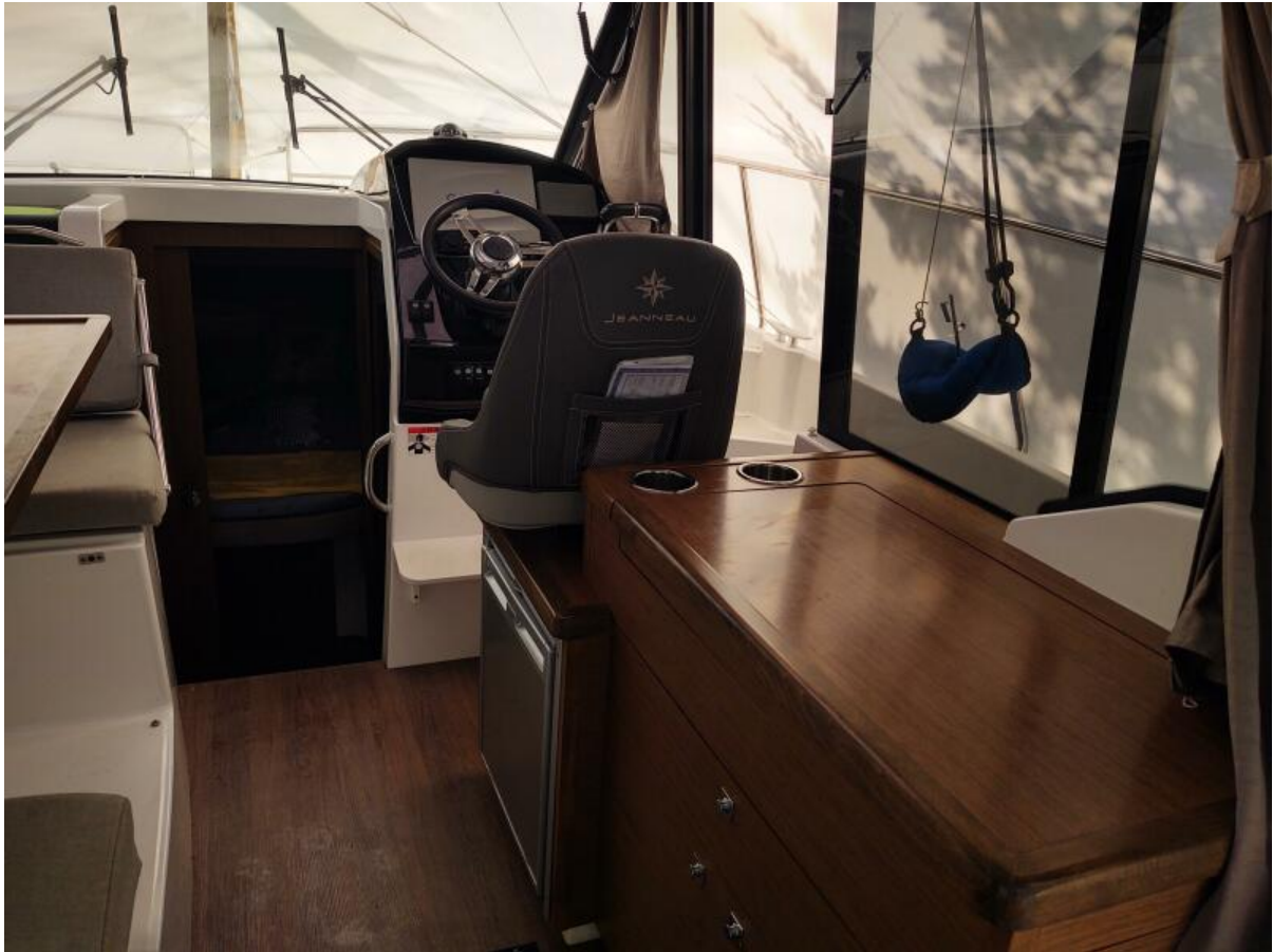
Knot Shore Interior stbd