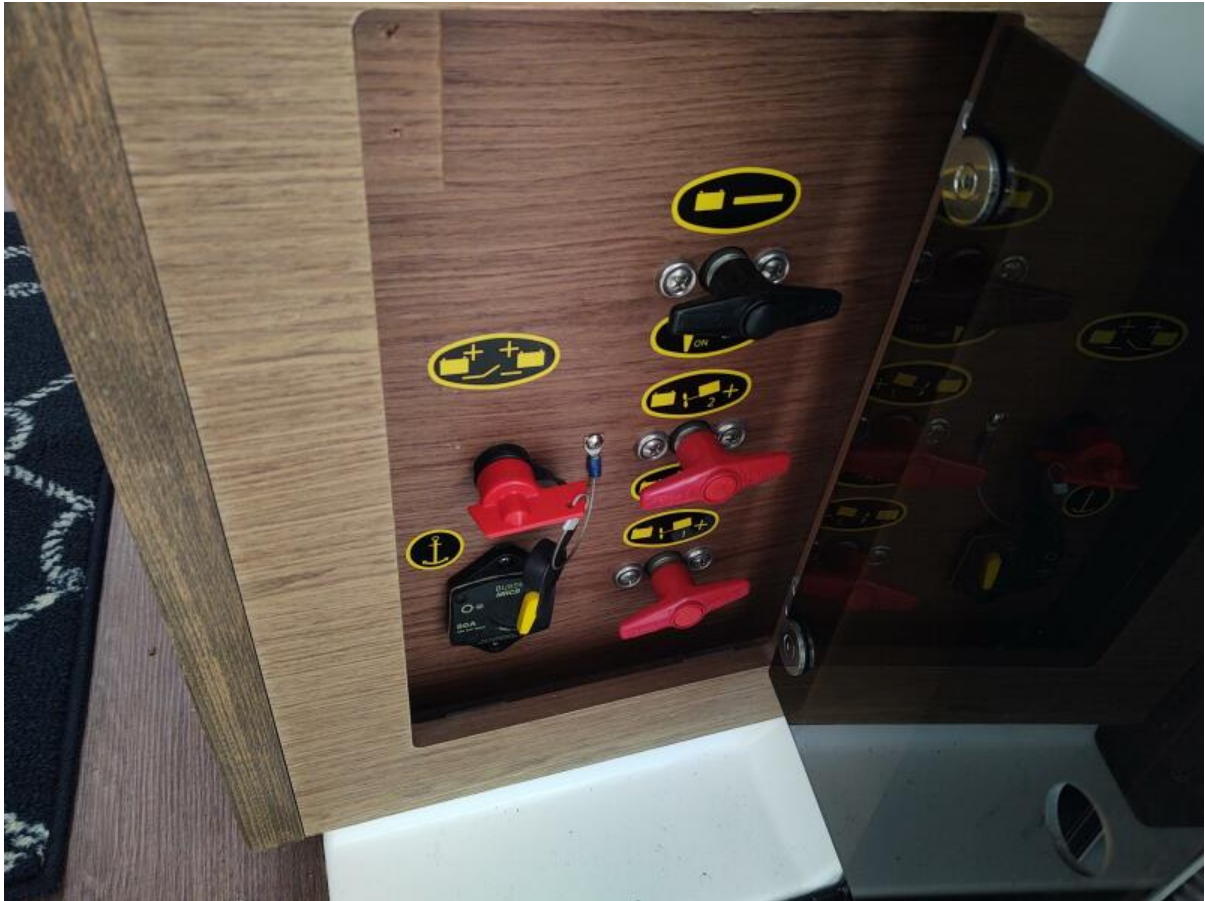
Knot Shore Battery switches