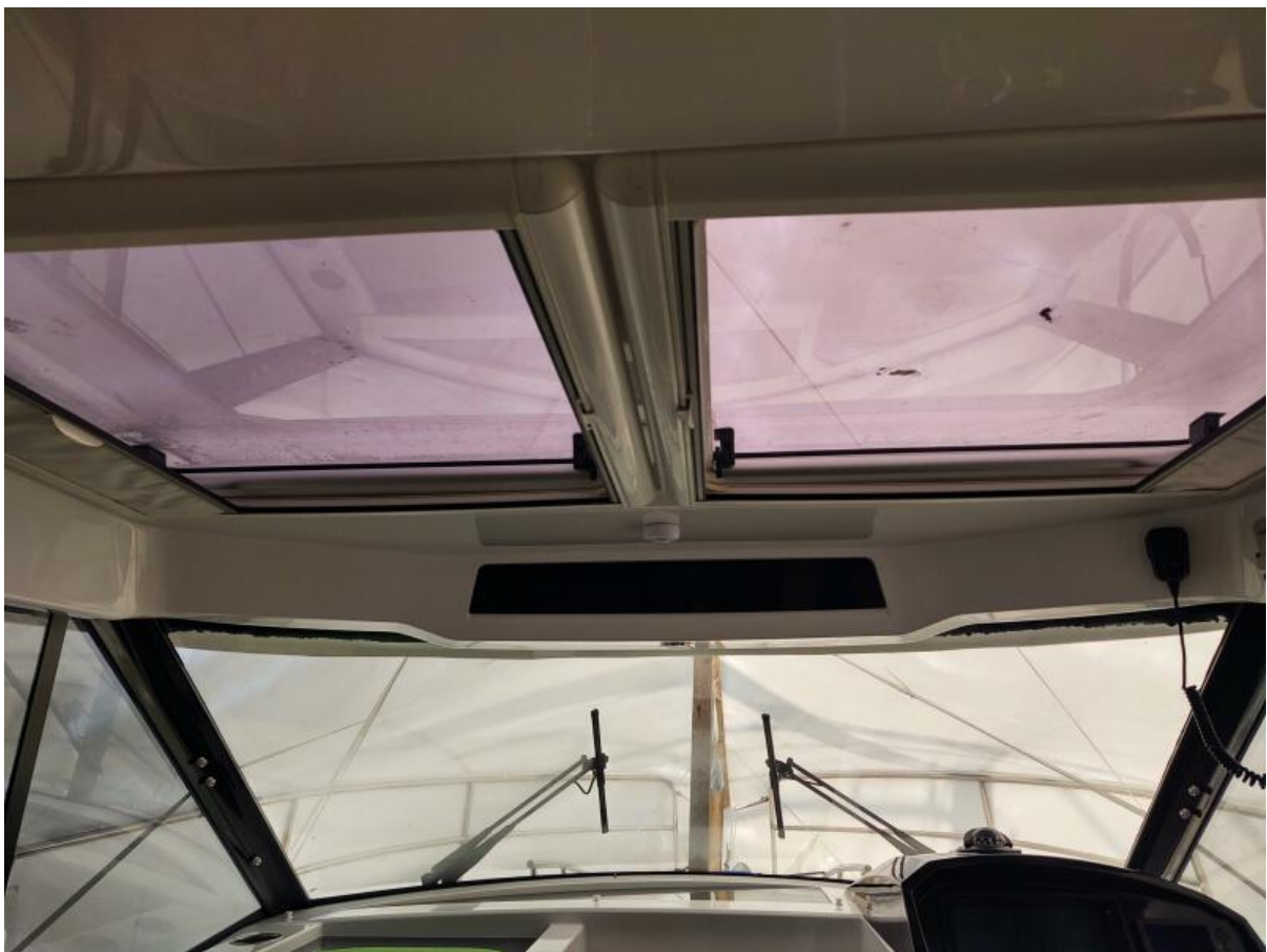
Knot Shore twin sliding hatches