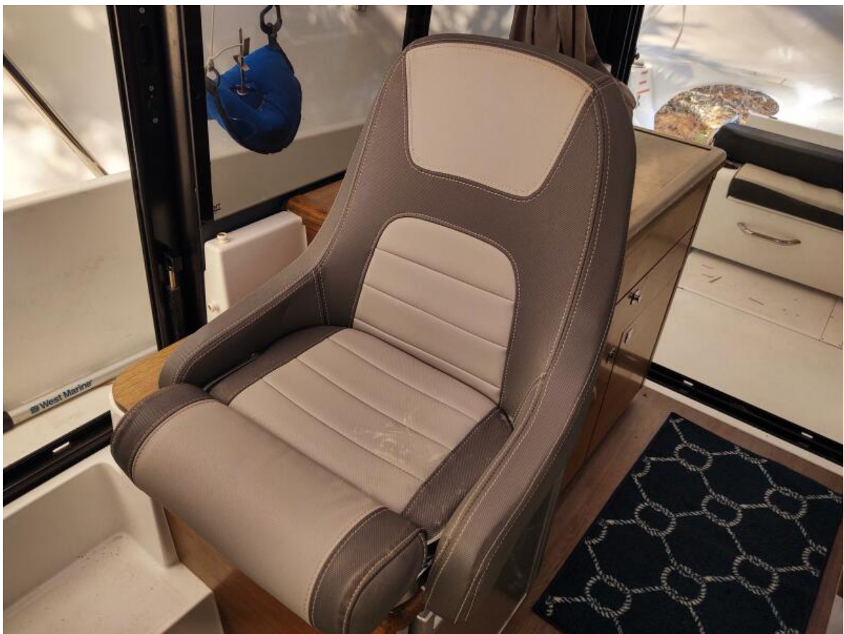
Knot Shore helm seat