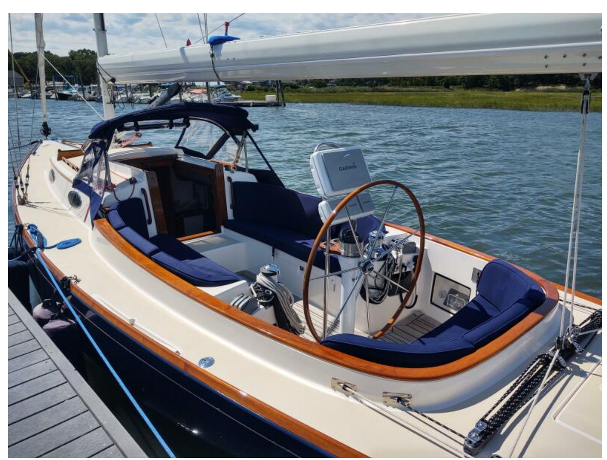
Phoenix cockpit from aft