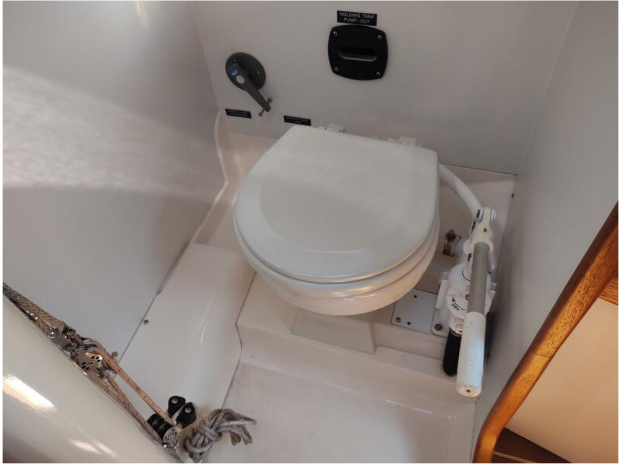
Phoenix Marine toilet