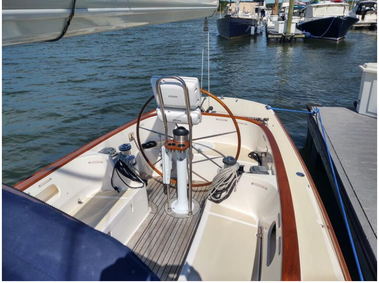
Phoenix Cockpit from fwd