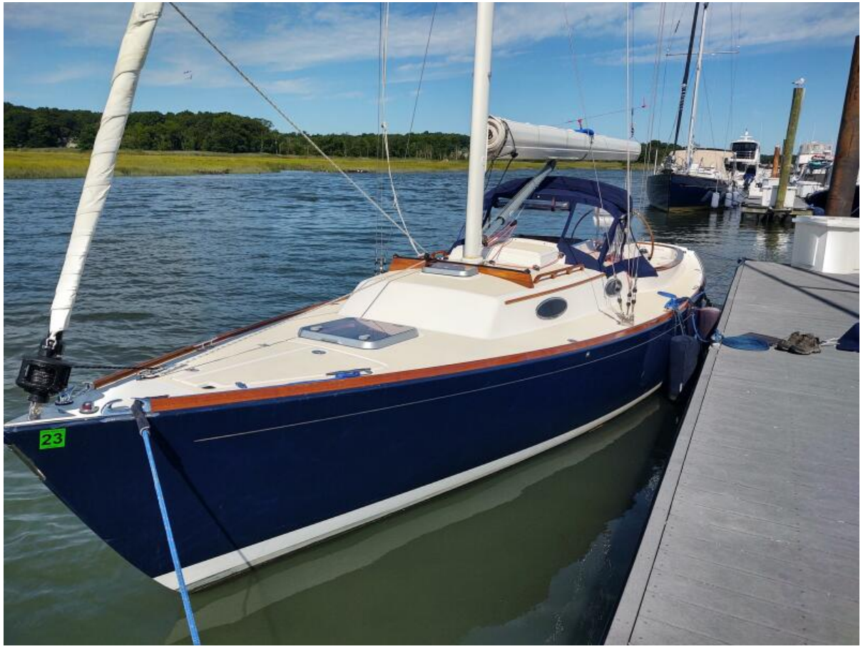
Phoenix at the dock