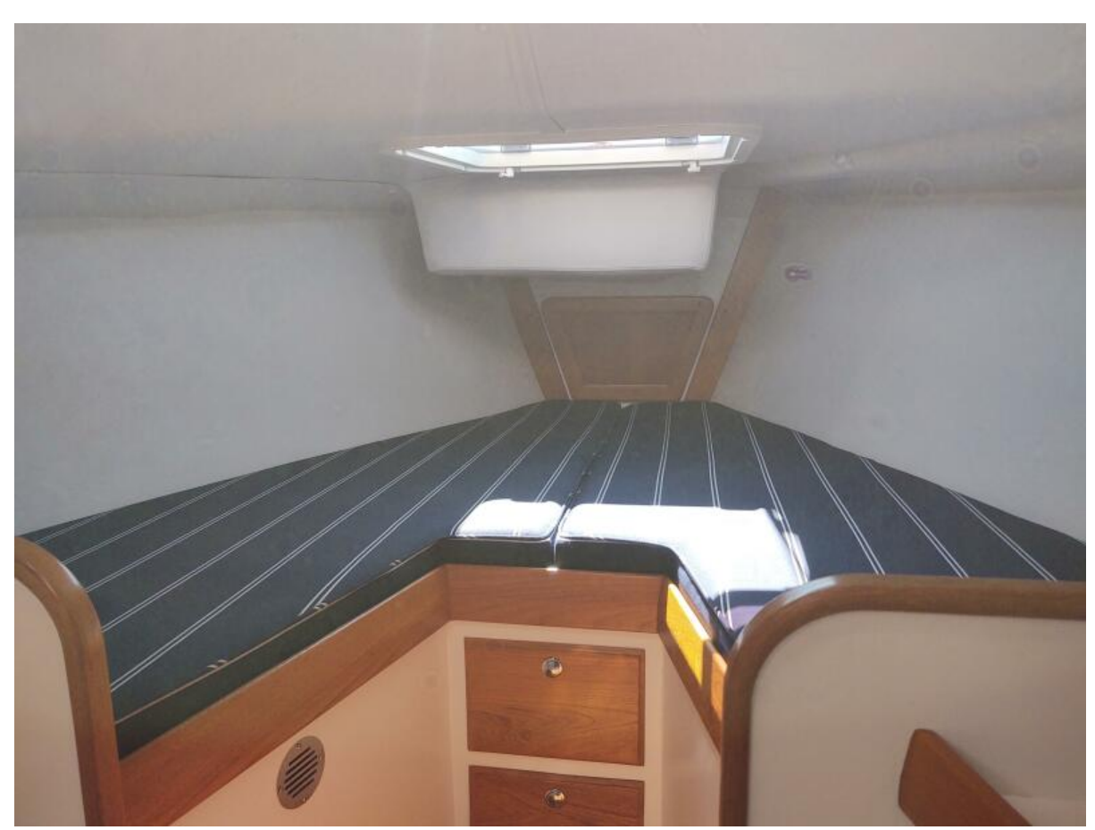
Phoenix Vee Berth