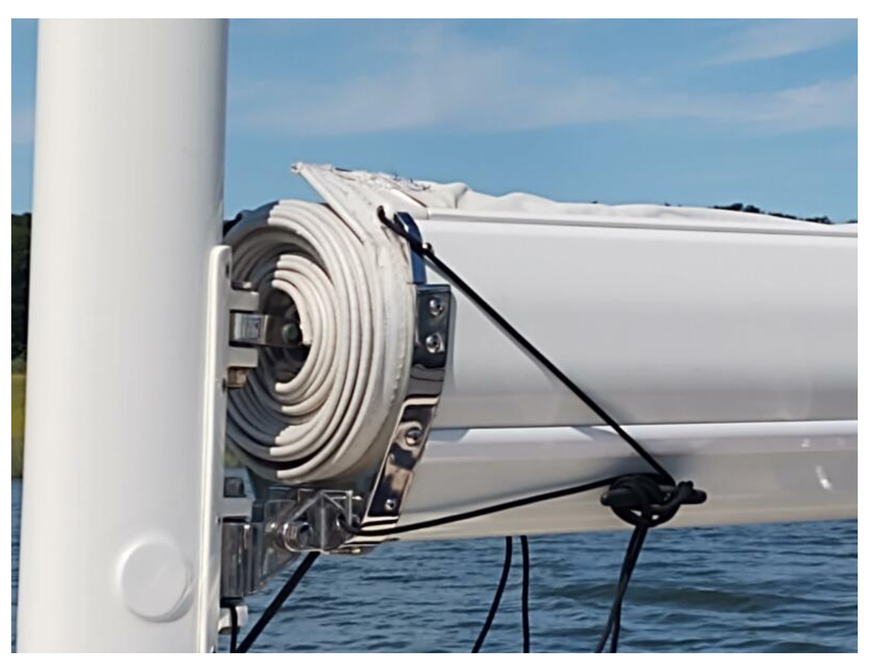
Phoenix Leisurefurl boom