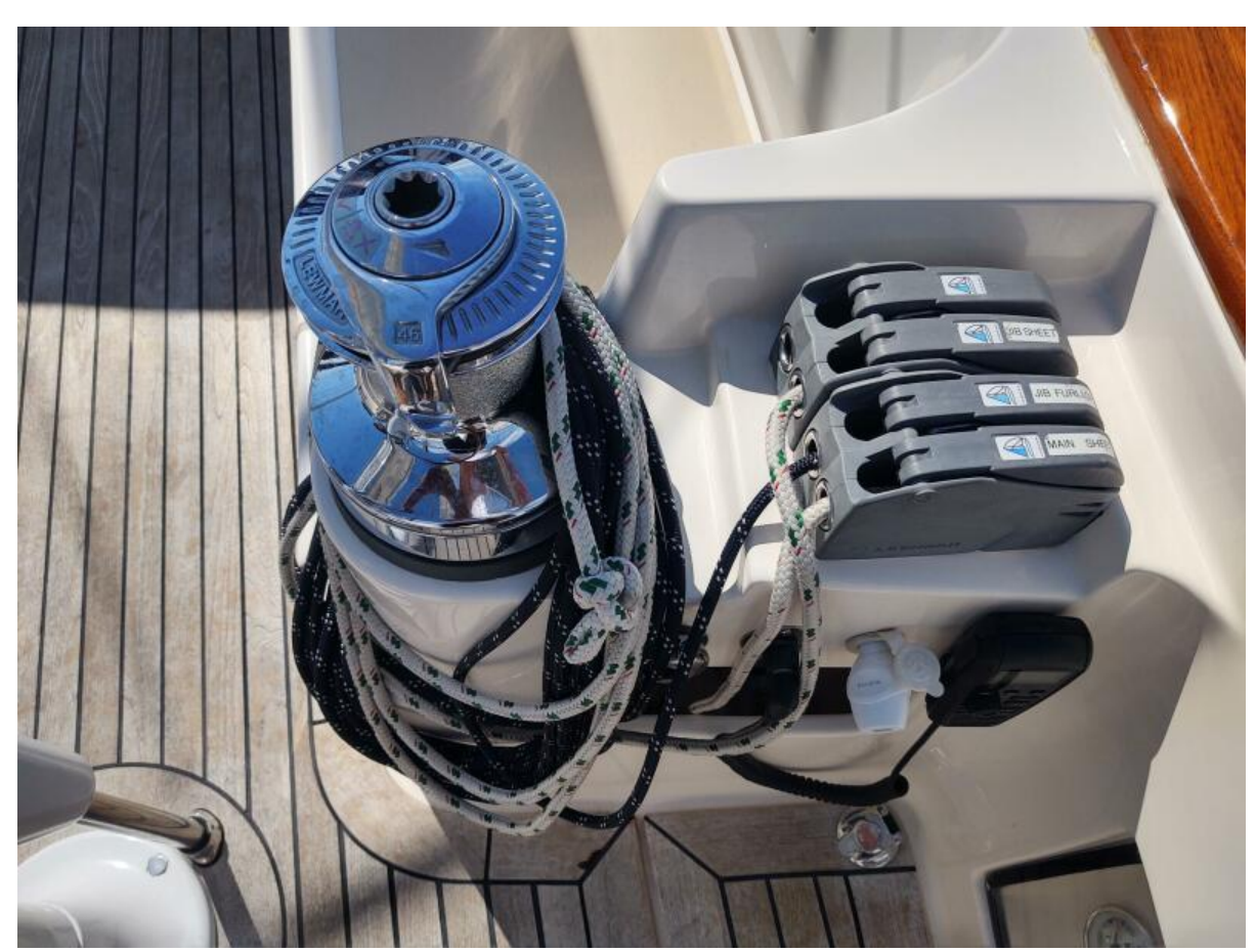
Phoenix winch stbd