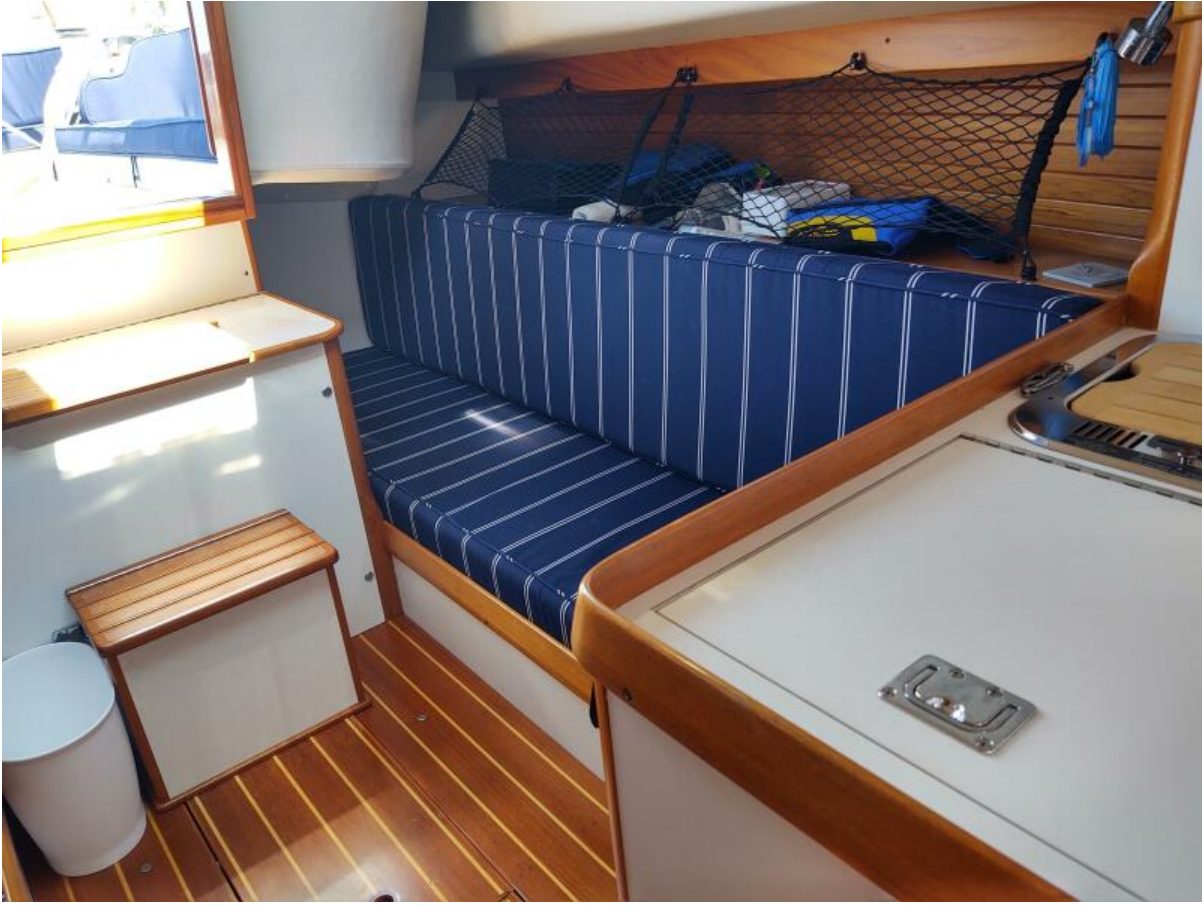
Phoenix port settee