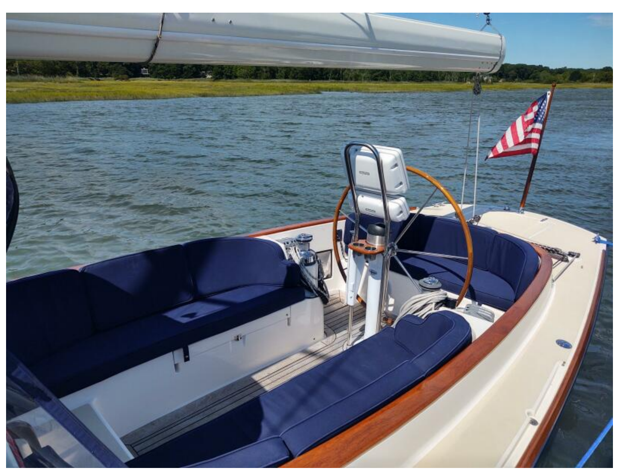
Phoenix cockpit with cushions