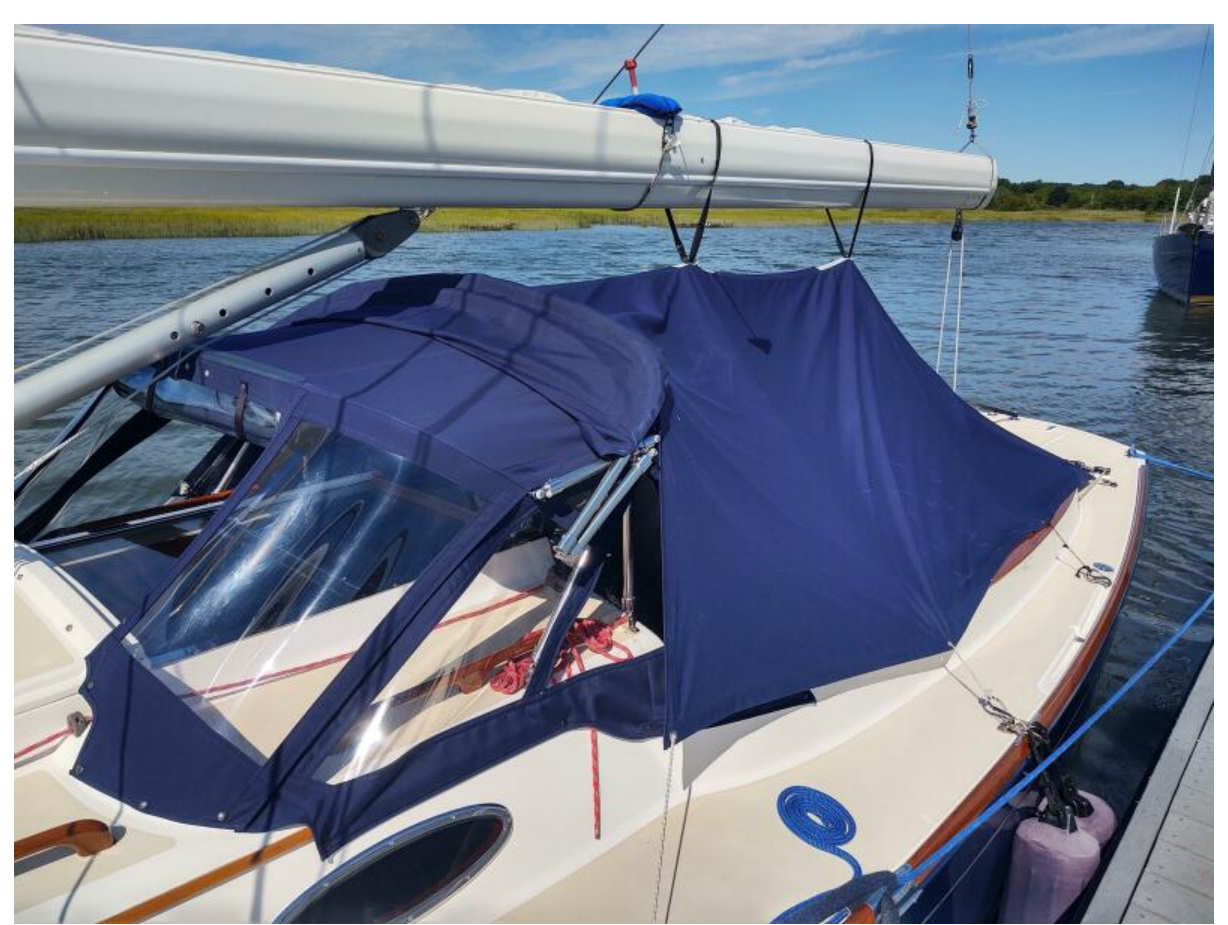
Phoenix cockpit cover