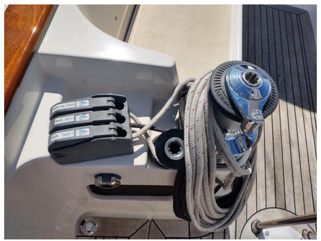
Phoenix winch port