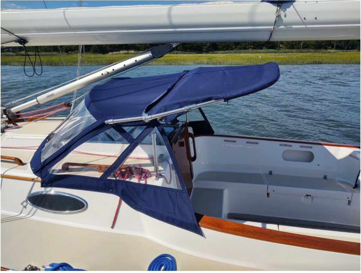
Phoenix dodger with extention