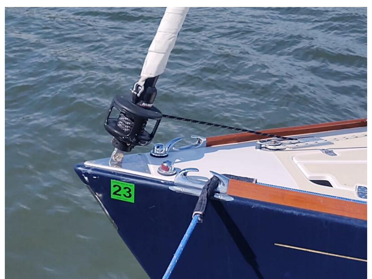
Phoenix jib furler