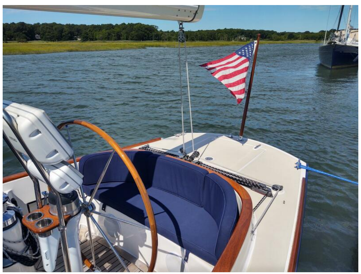
Phoenix helm seat