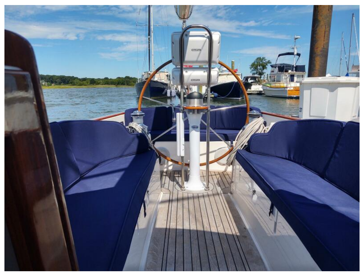
Phoenix cockpit from fwd