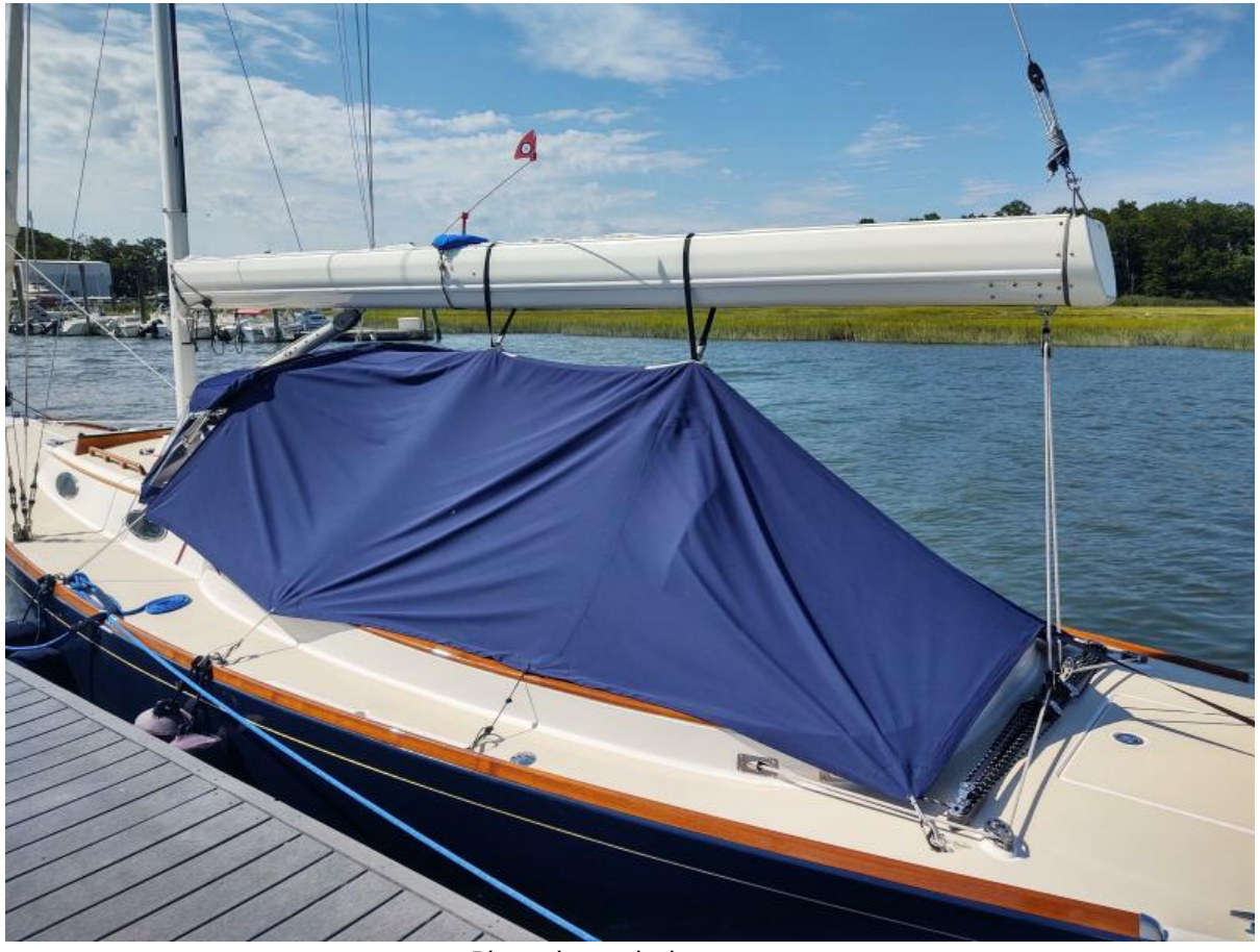
Phoenix cockpit cover