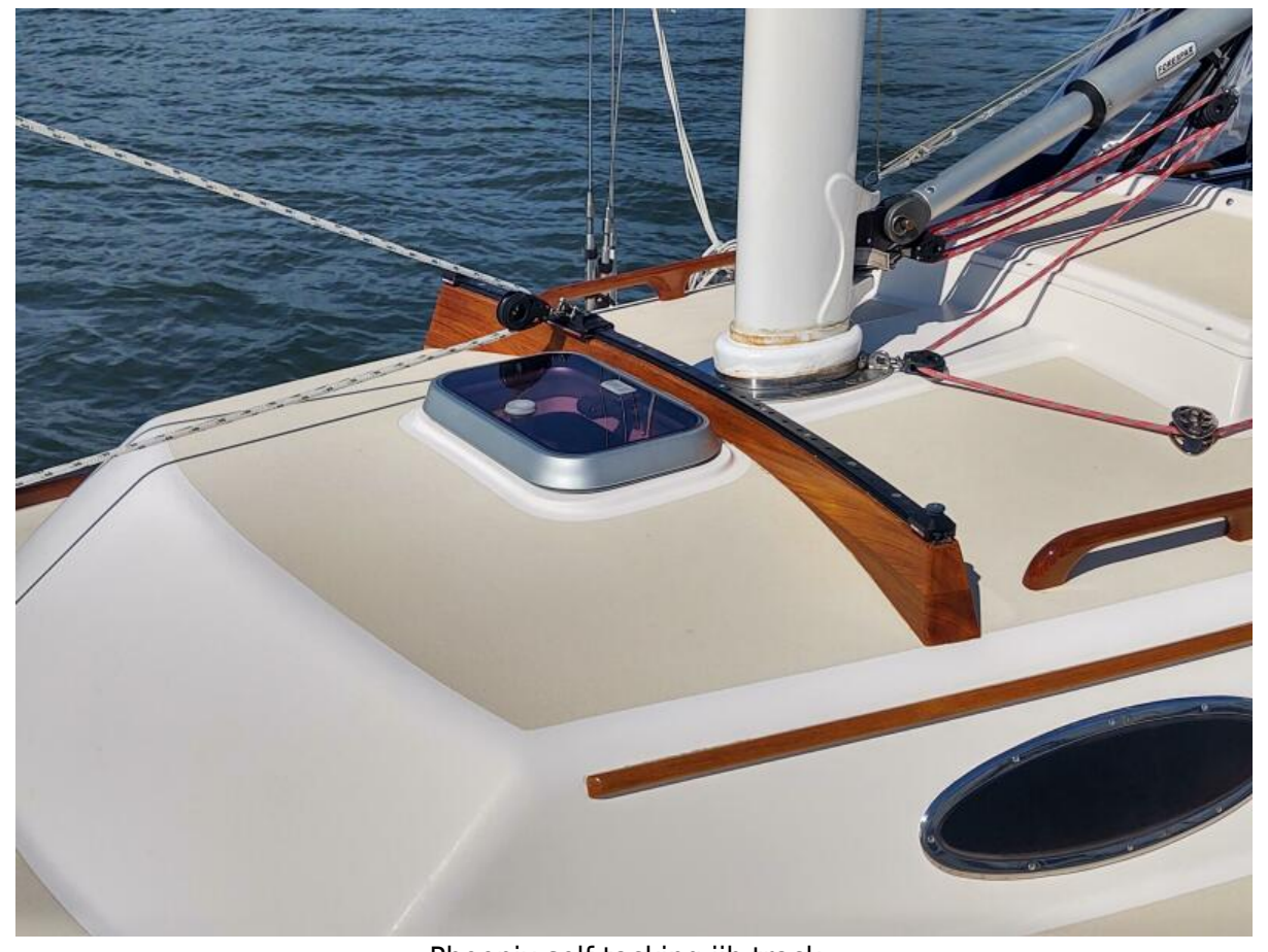
Phoenix self tacking jib track