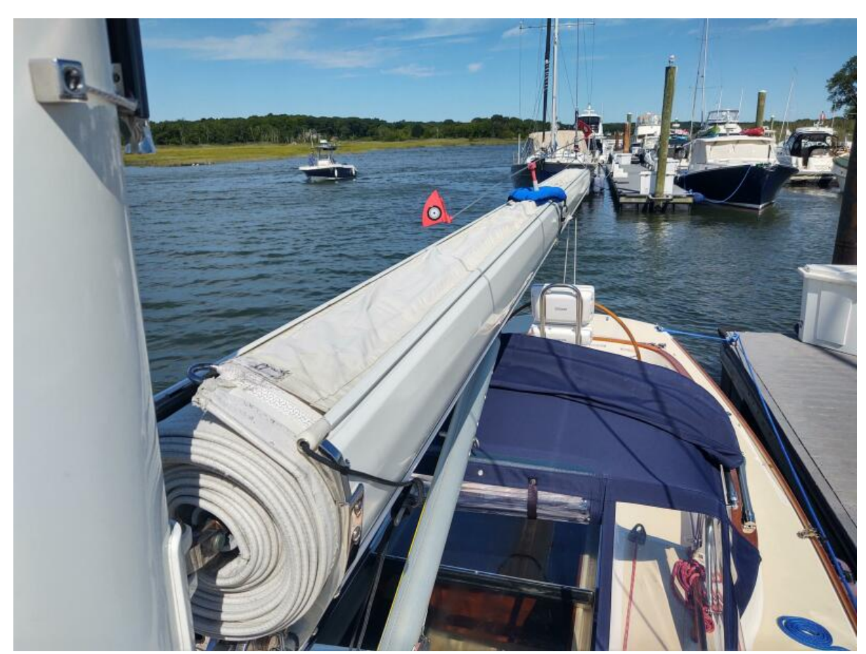
Phoenix Leisurefurl boom