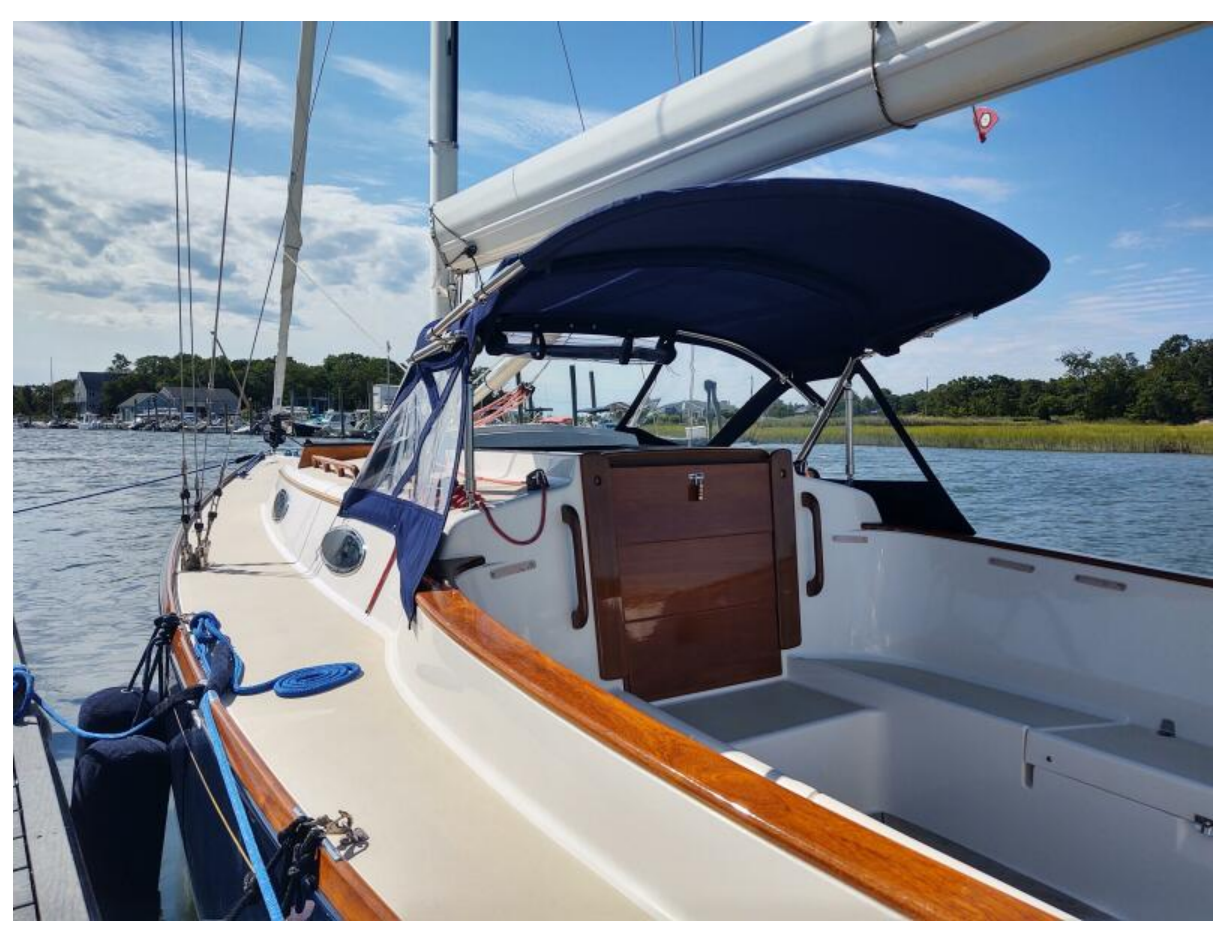
Phoenix dodger with extention