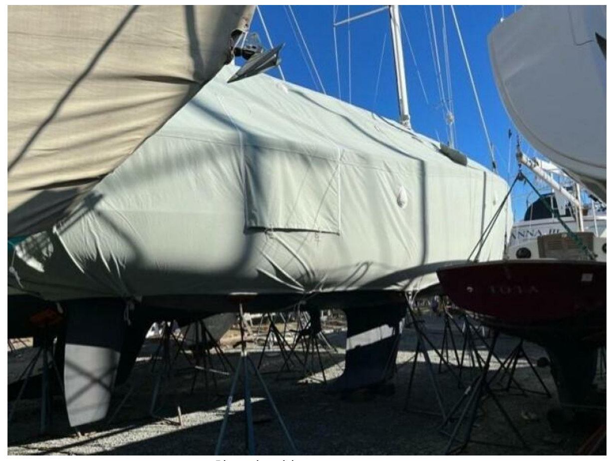
Phoenix with canvas cover