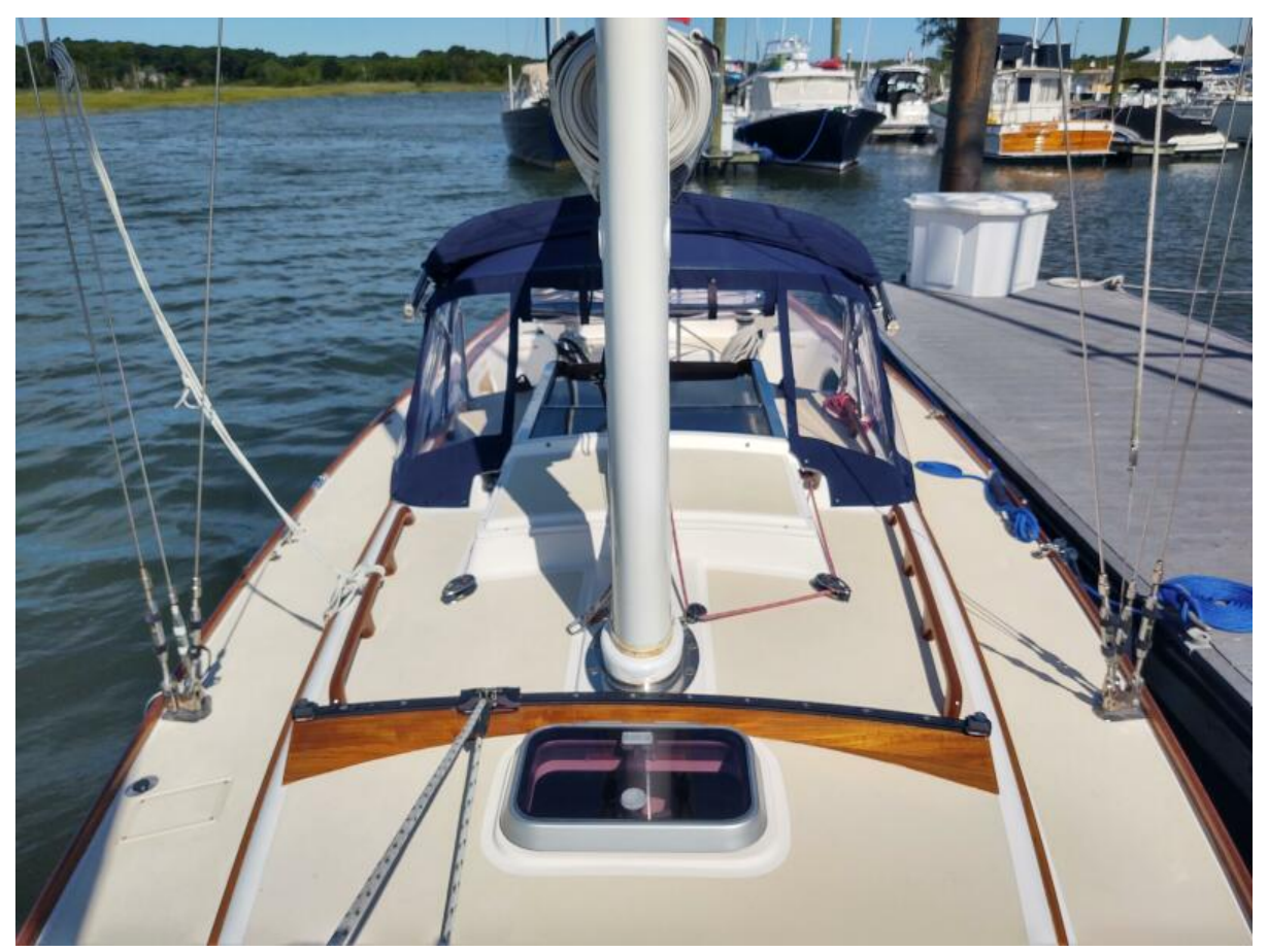
Phoenix deck from fwd