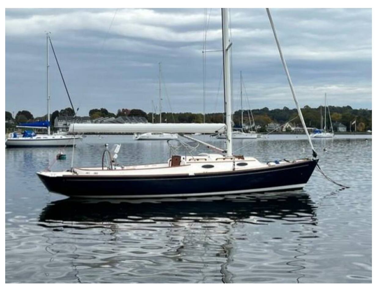
Phoenix on her mooring