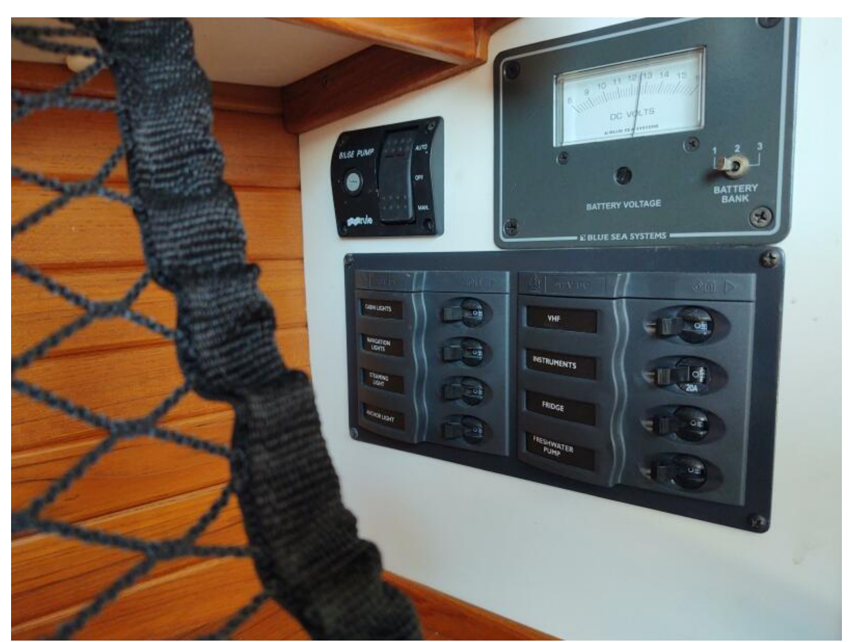
Phoenix electrical panel