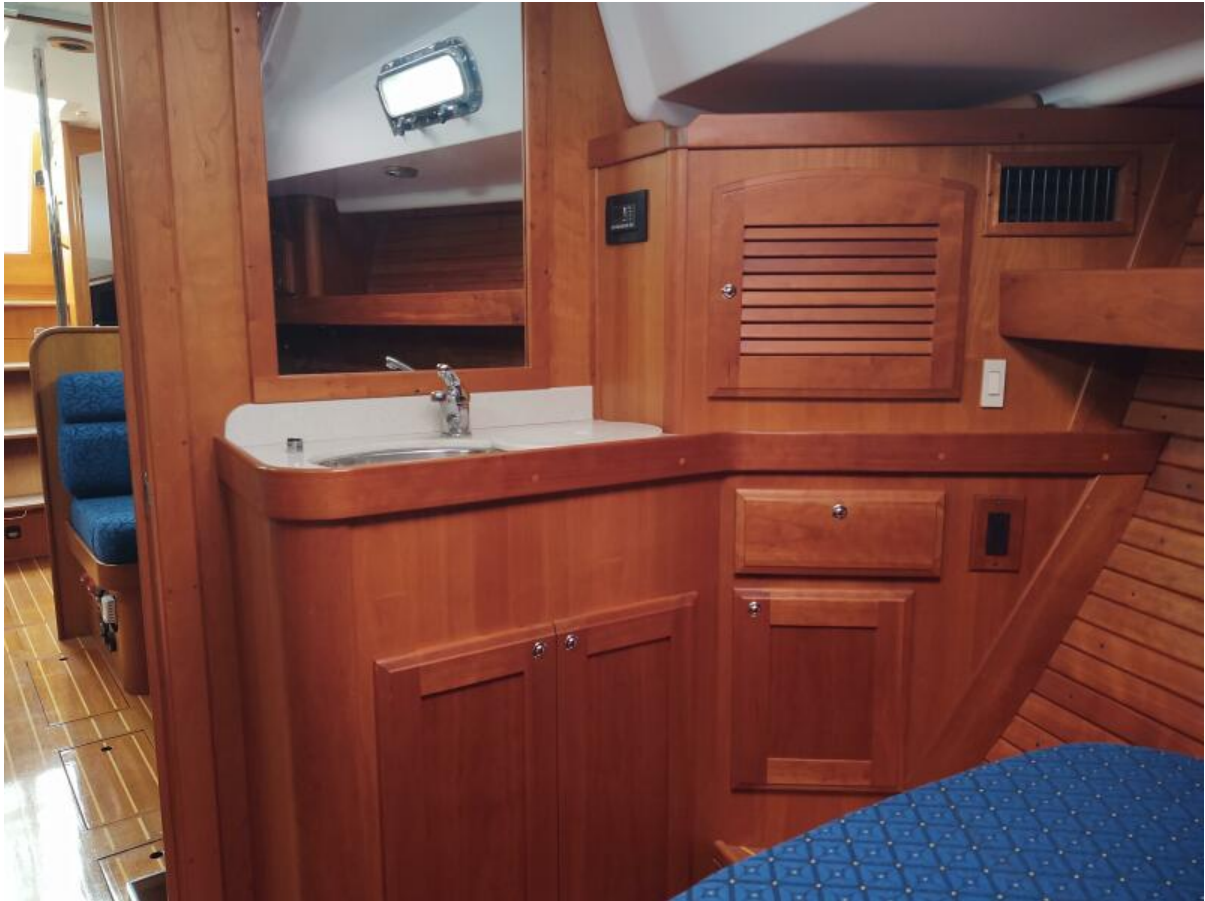
Synergy Fwd Cabin