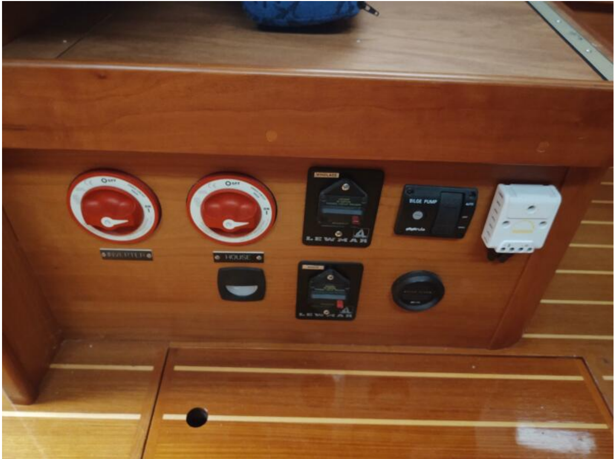
Synergy battery switches