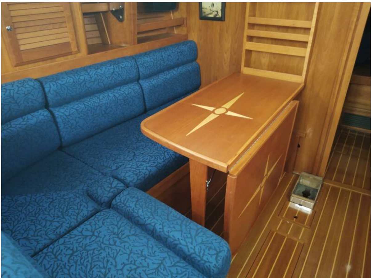
Synergy Port settee and table