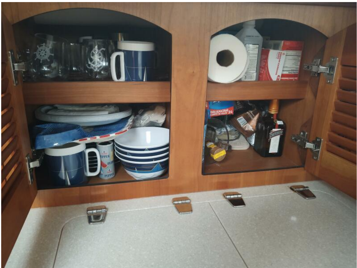
Synergy Galley locker