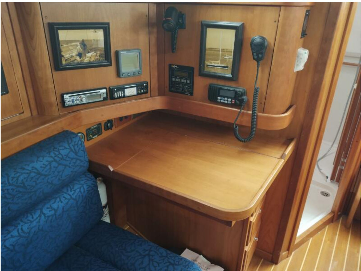
Synergy nav table