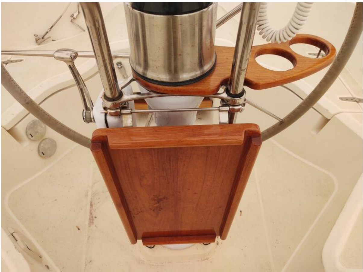
Synergy cockpit table