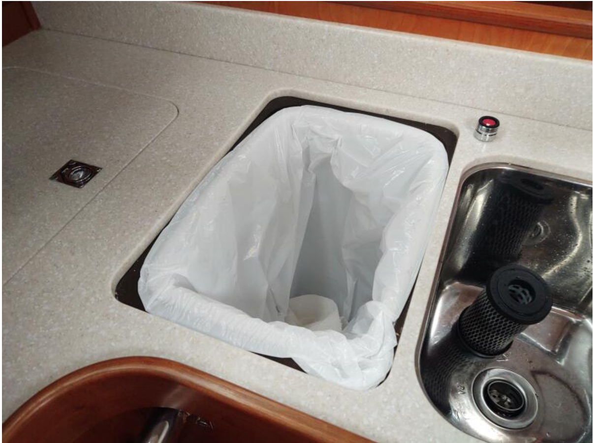
Synergy galley waste