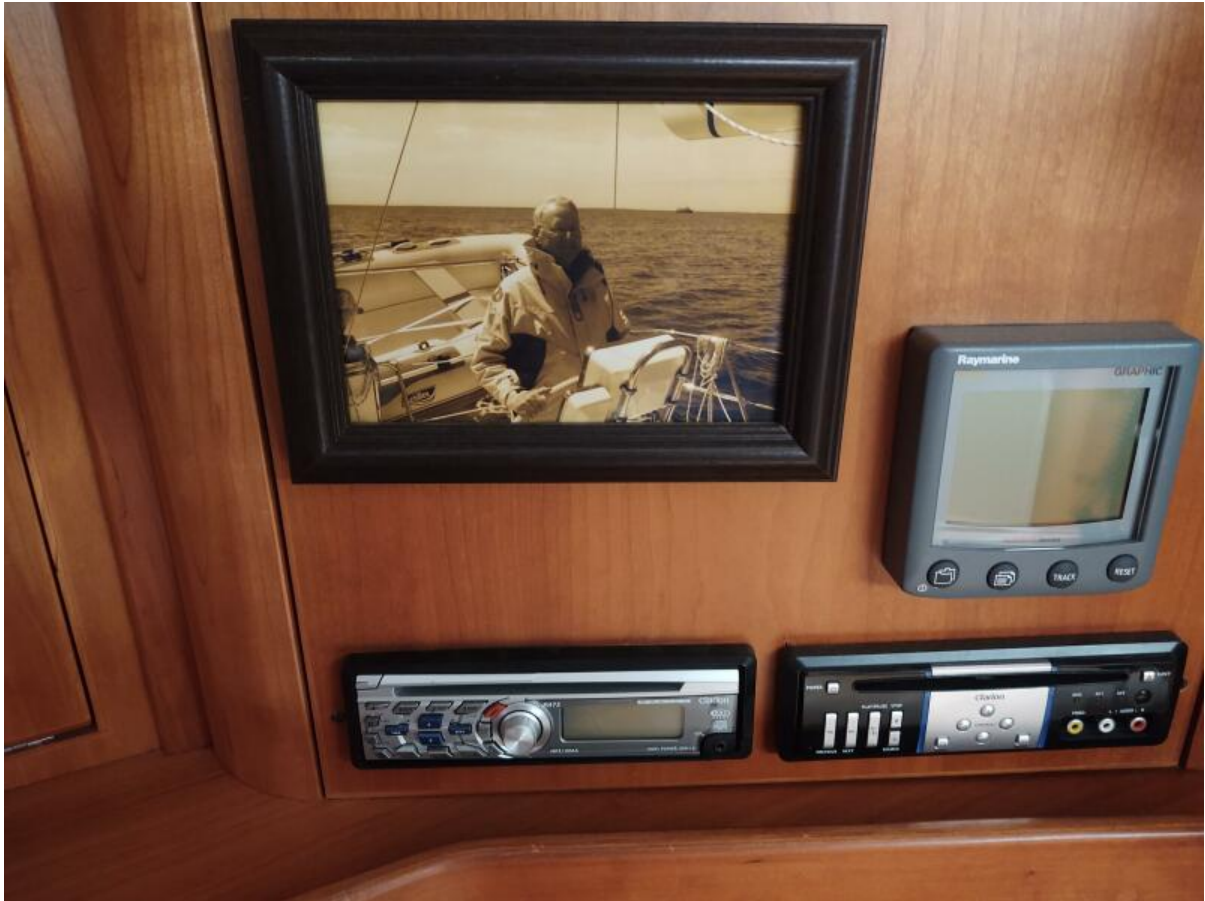
Synergy Nav Station