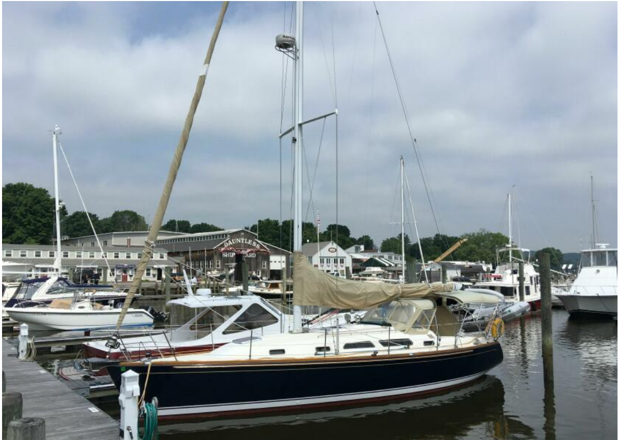
Synergy at the dock