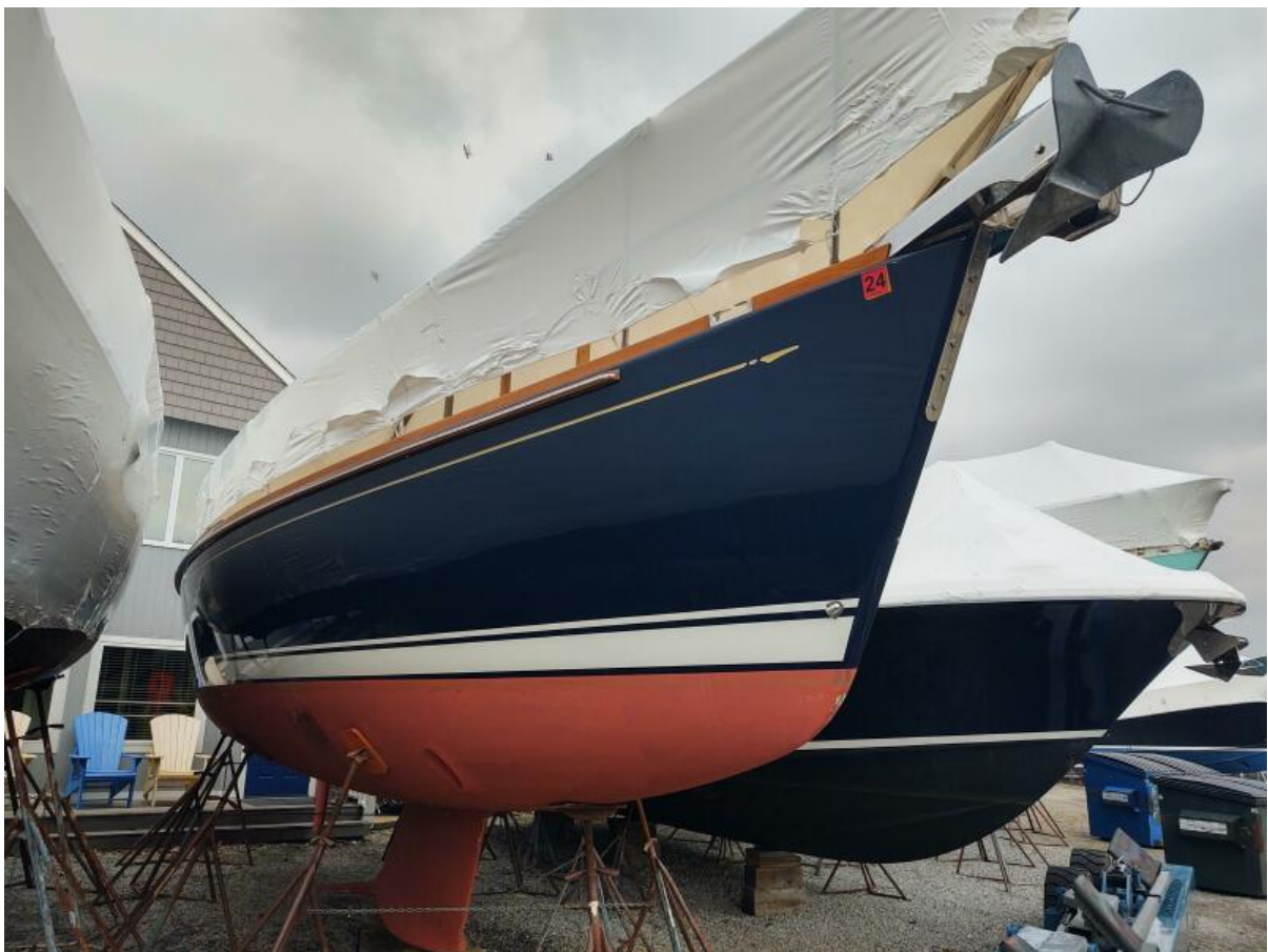
Synergy hull stbd