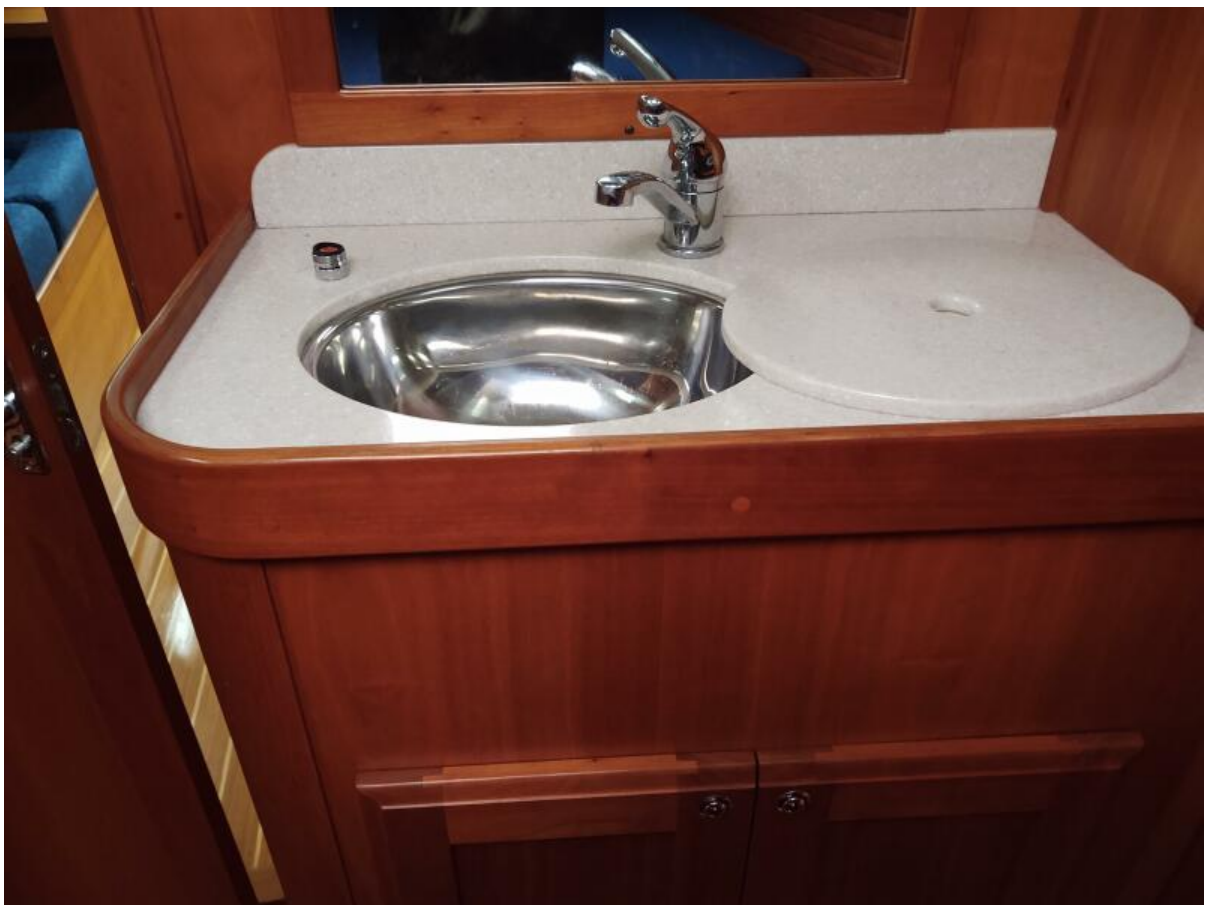
Synergy Fwd cabin vanity