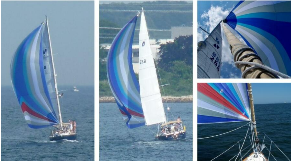
Synergy spinnaker collage