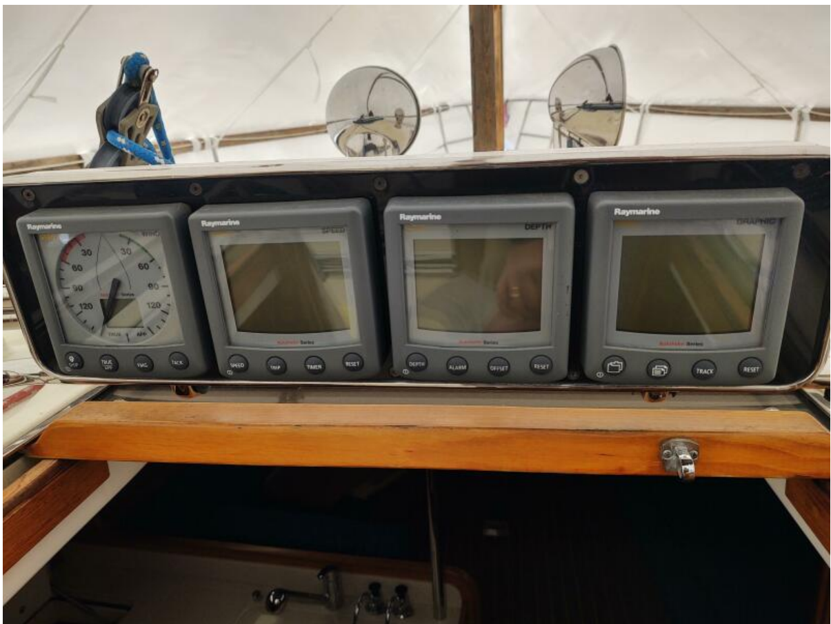
Synergy electronics displays