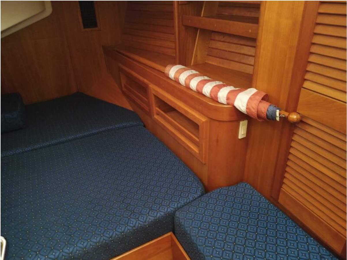
Synergy Aft cabin berth