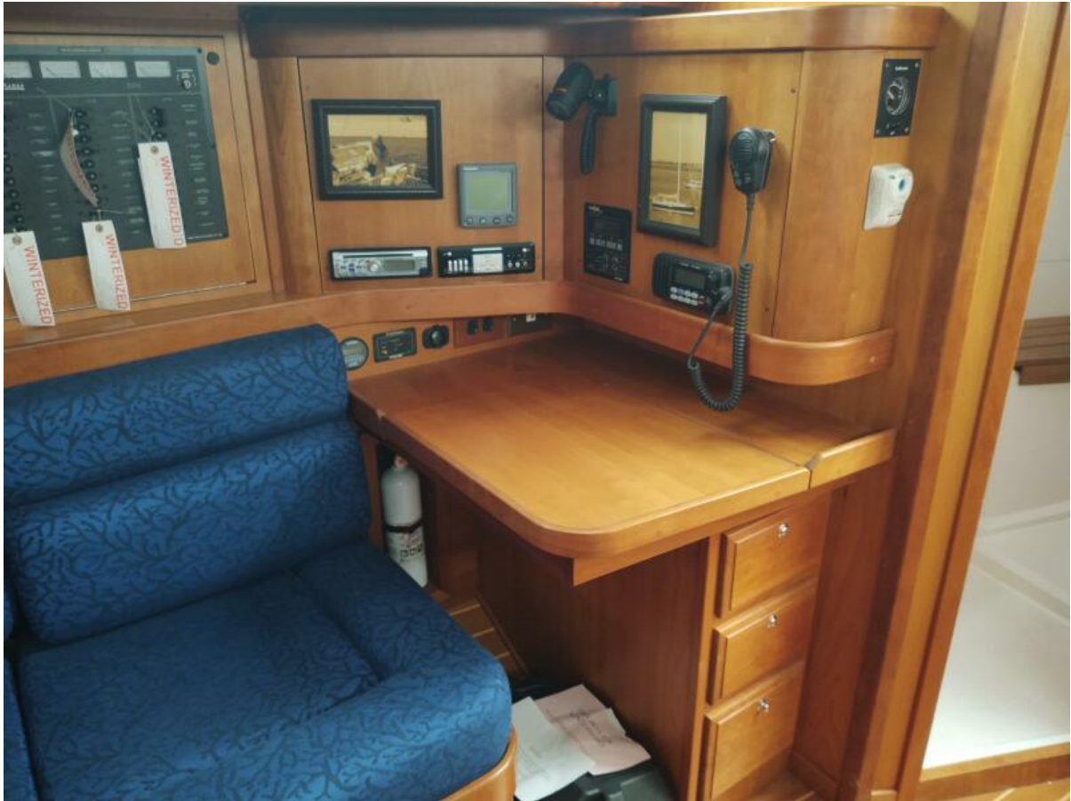
Synergy Nav Station