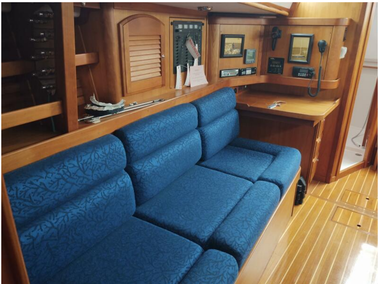
Synergy Stbd settee