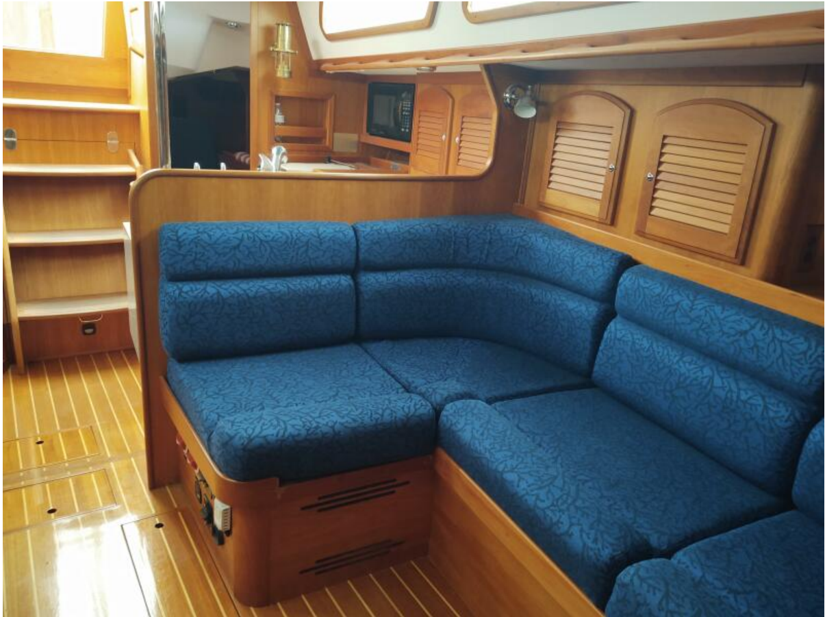
Synergy Port settee