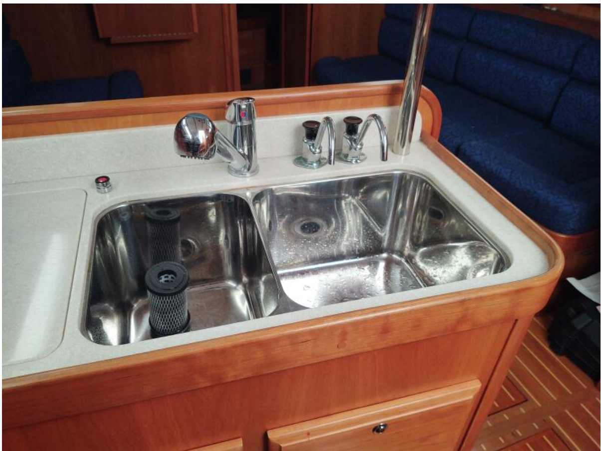
Synergy galley sink