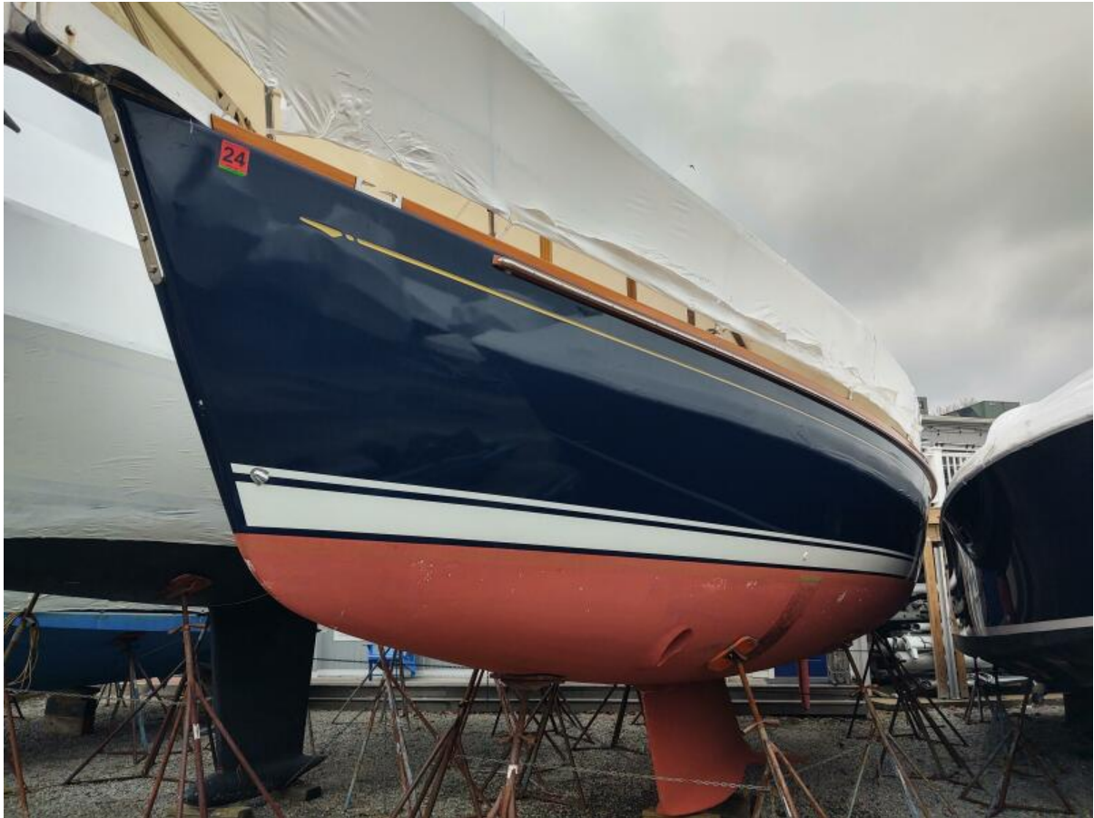
Synergy hull port