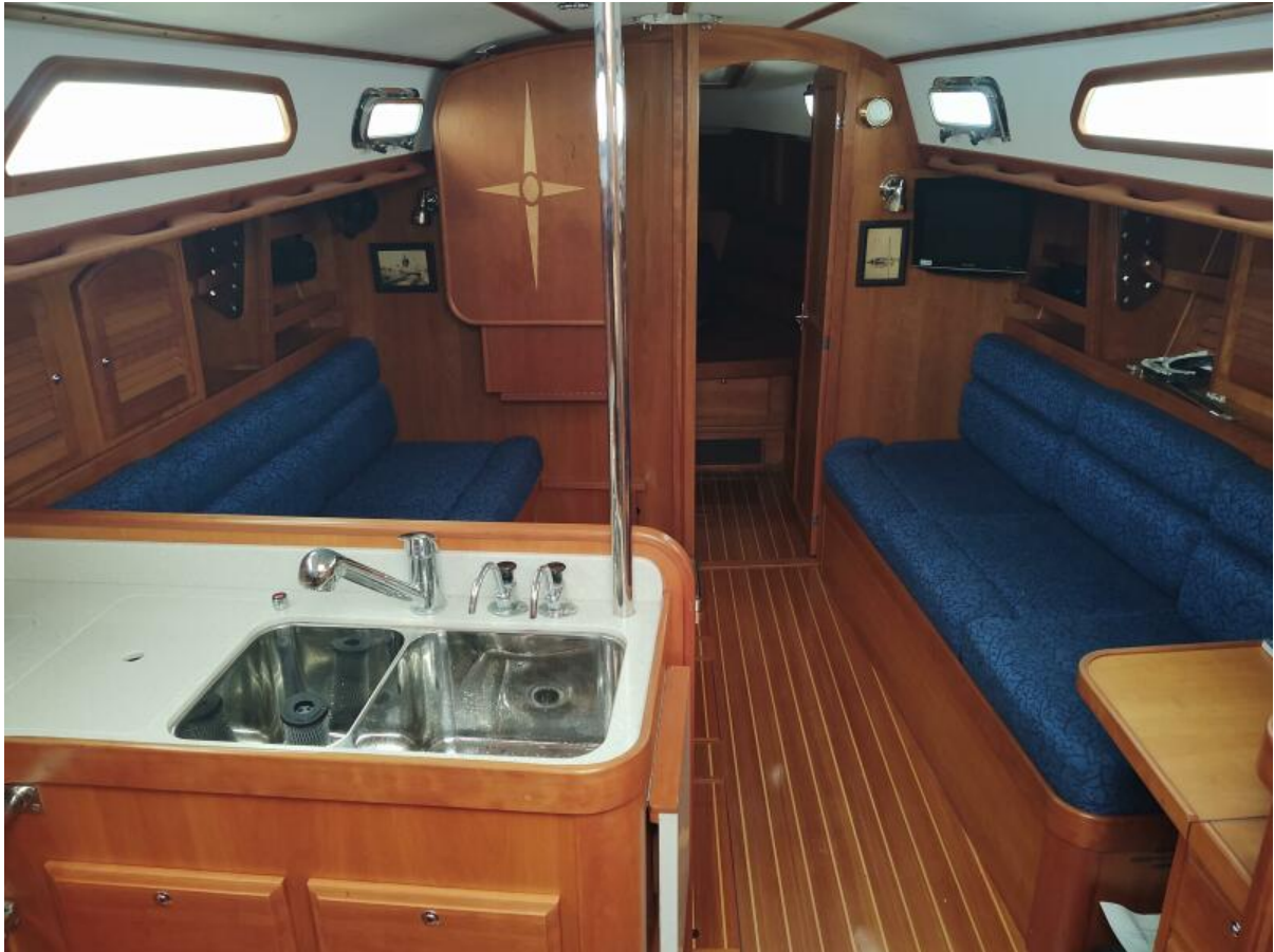
Synergy Main salon