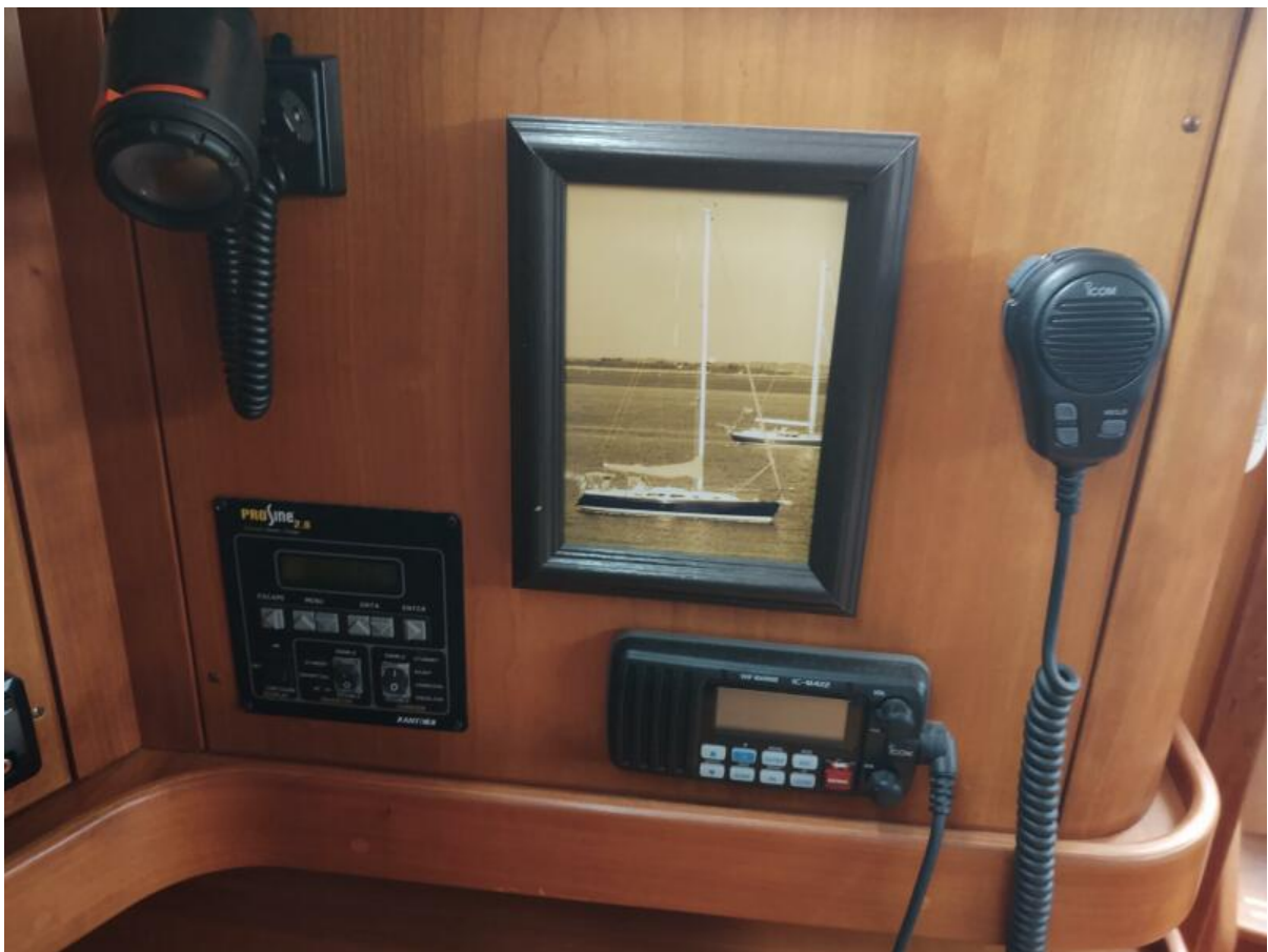
Synergy Nav Station