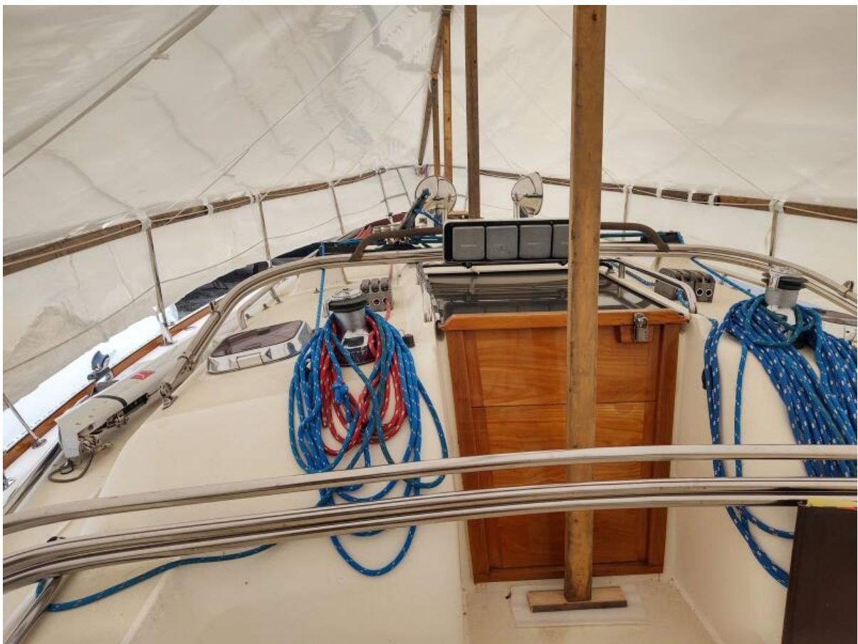
Synergy Deck fwd