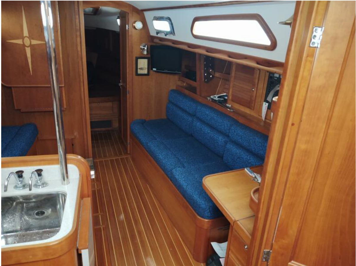
Synergy salon stbd