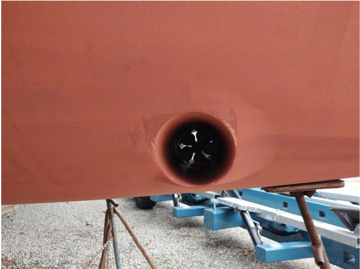
Synergy bow thruster