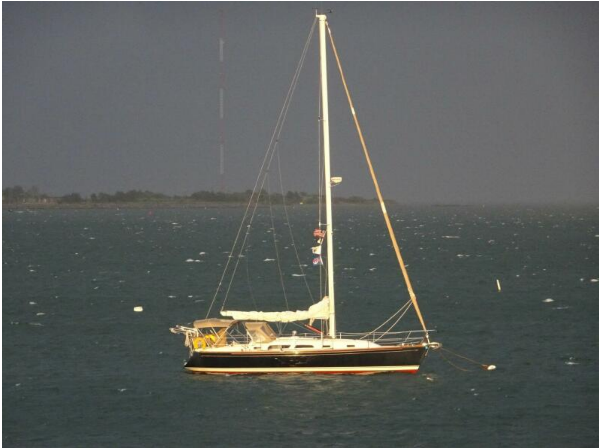
Synergy on the mooring