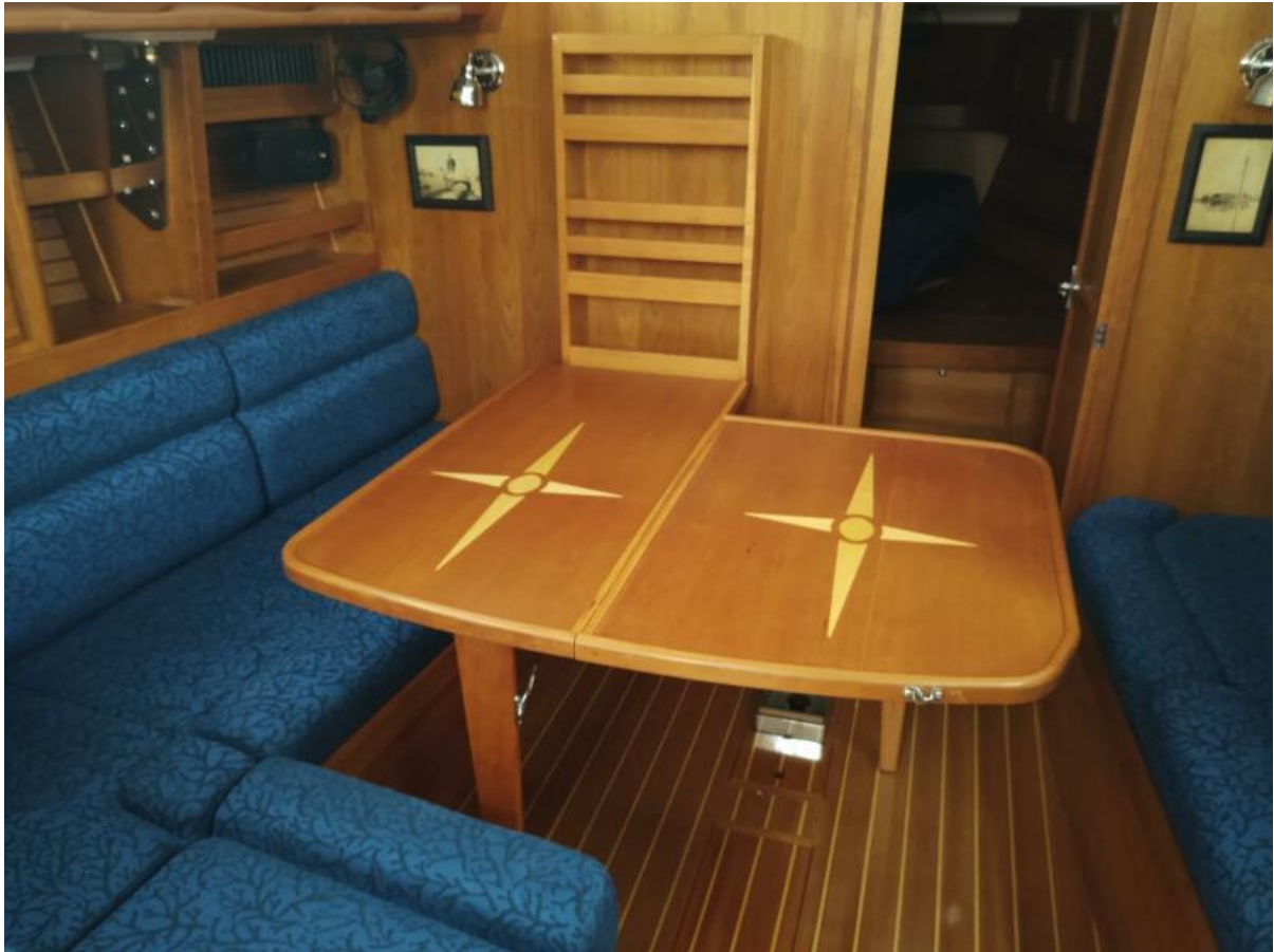
Synergy table both leaves out