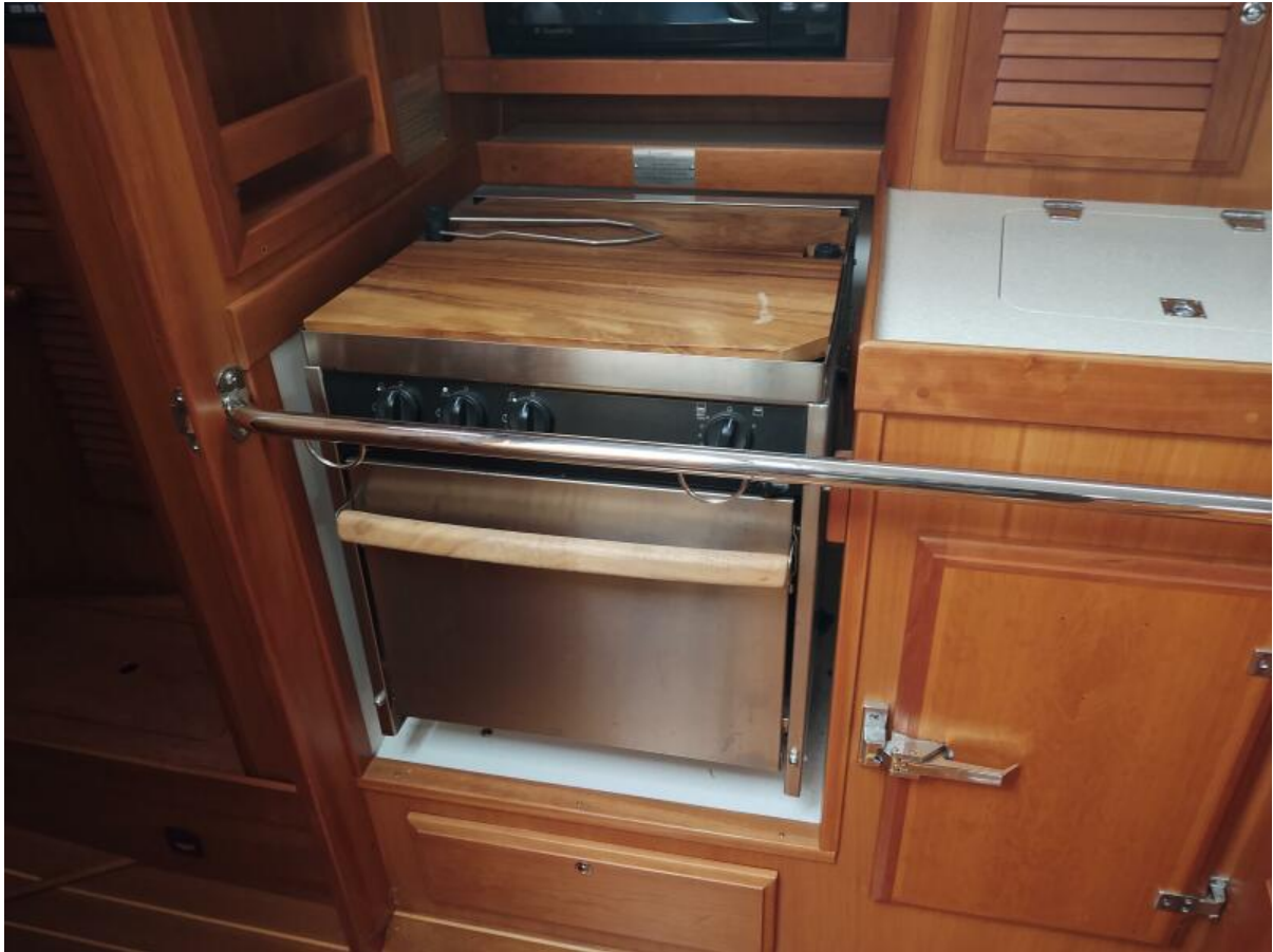
Synergy galley stove