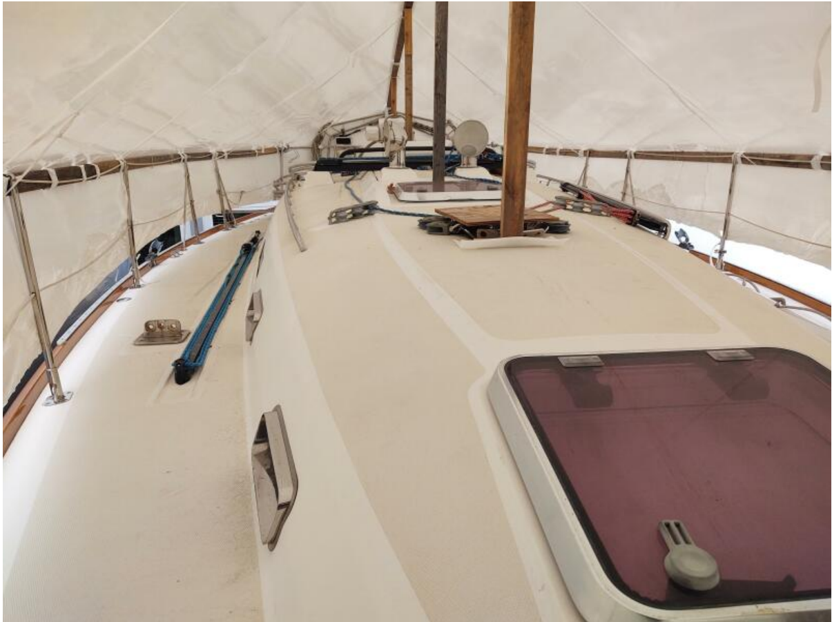
Synergy Deck from fwd