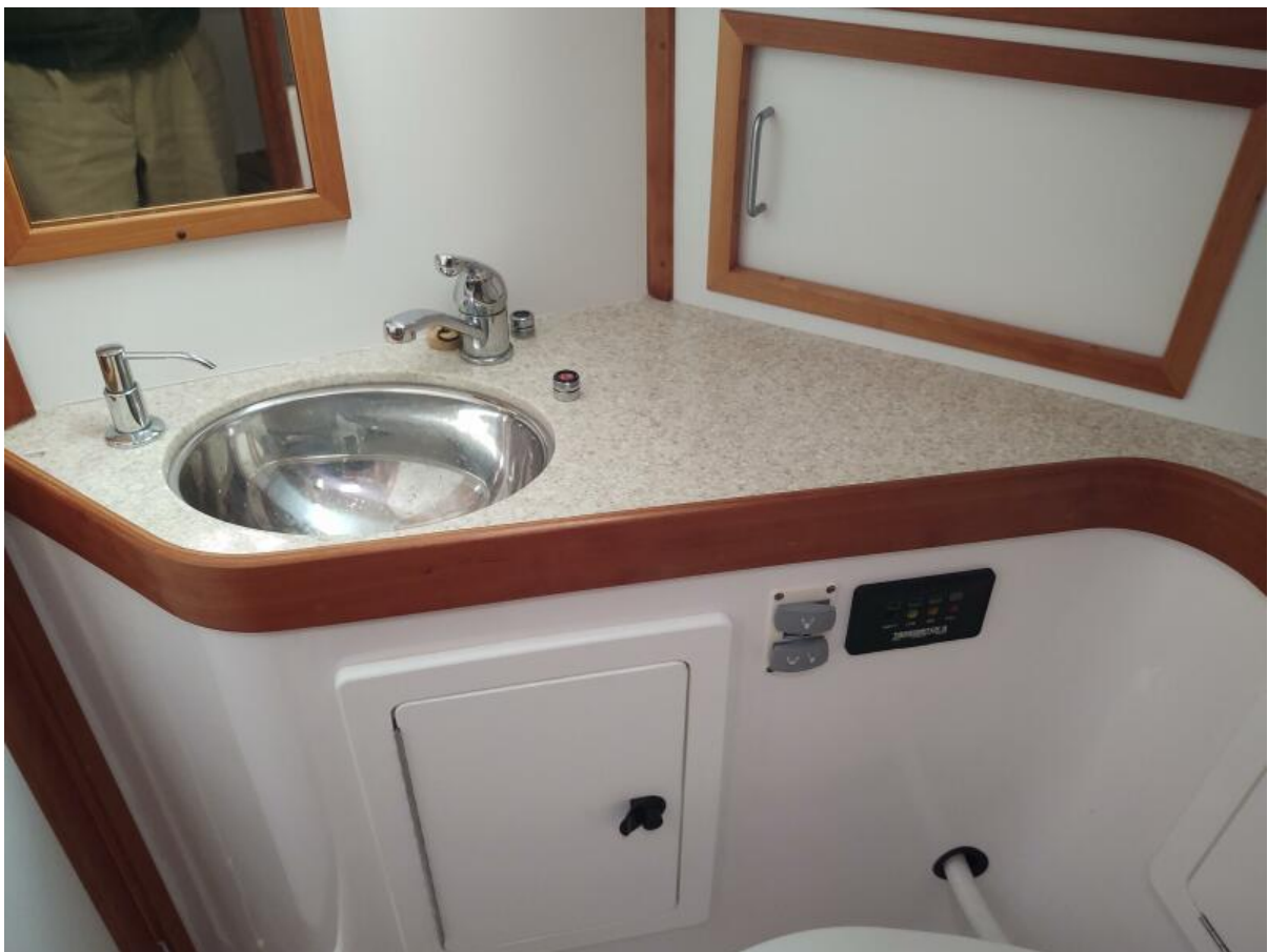
Synergy Head vanity