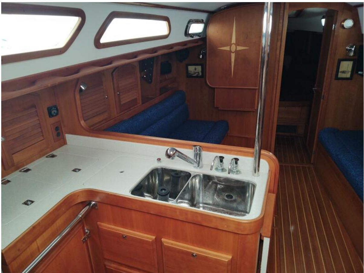
Synergy salon port