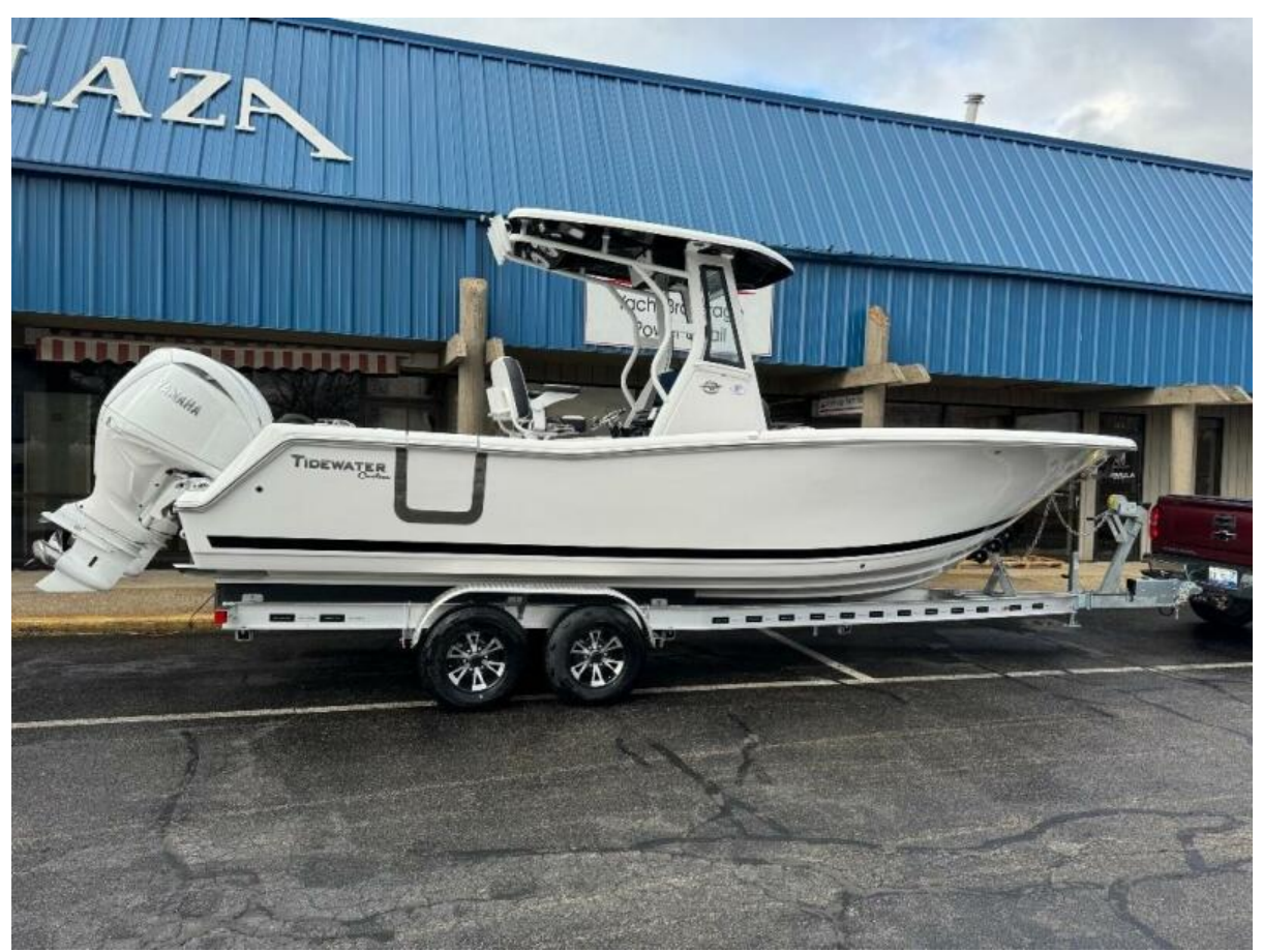
2024 256 TW Exterior 2