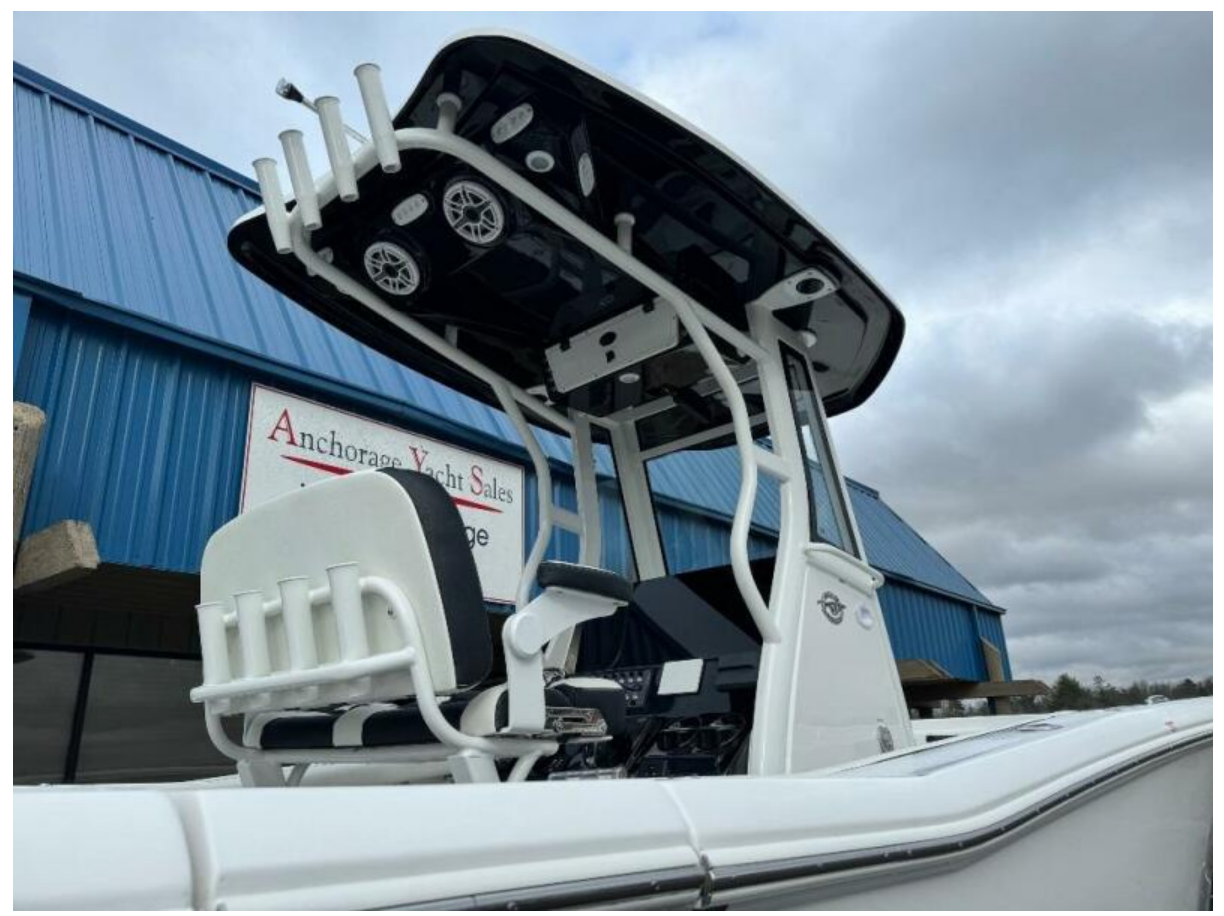
2024 256 TW Hard Top