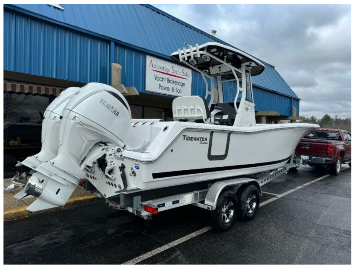
2024 256 TW Exterior 3