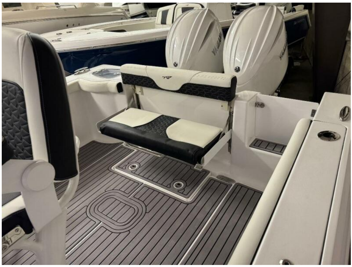
2024 256 TW Aft Cockpit Seat