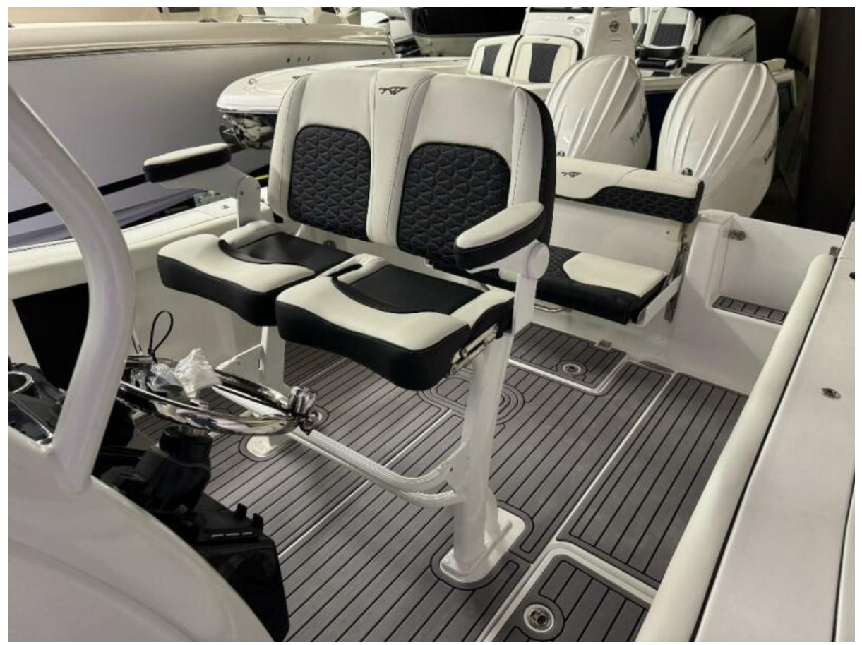
2024 256 TW Helm Seat