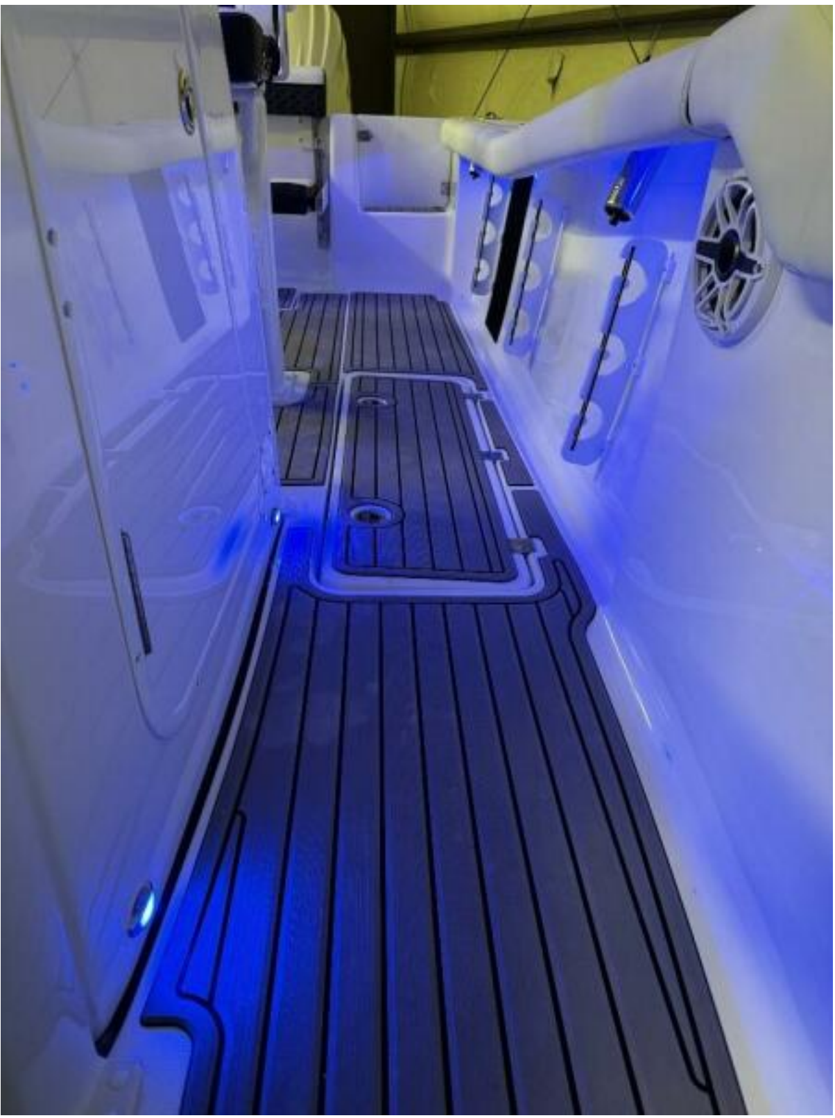
2024 256 TW Soft Grip Floor