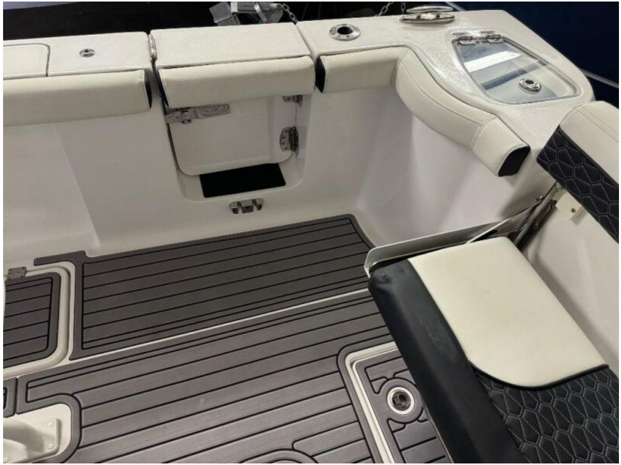
2024 256 TW Side Door