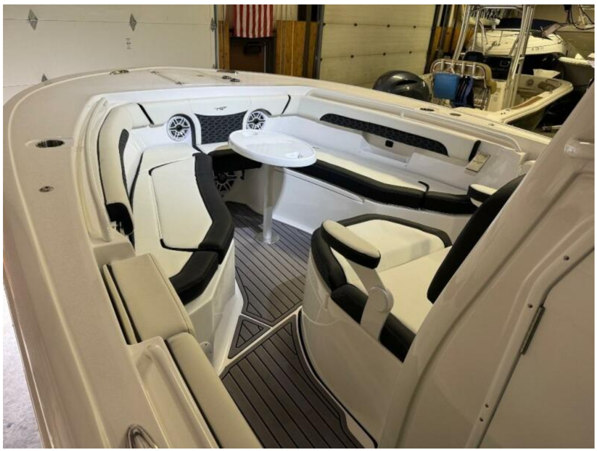
2024 256 TW Bow Seating 1