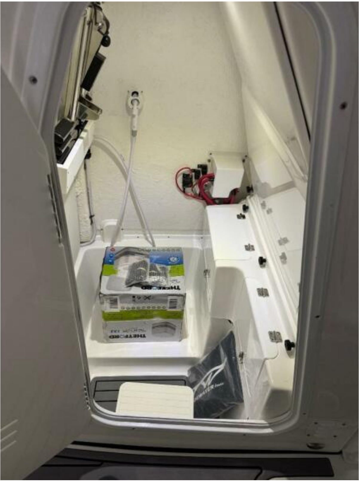
2024 256 TW Head