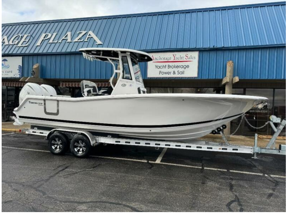
2024 256 TW Exterior 1