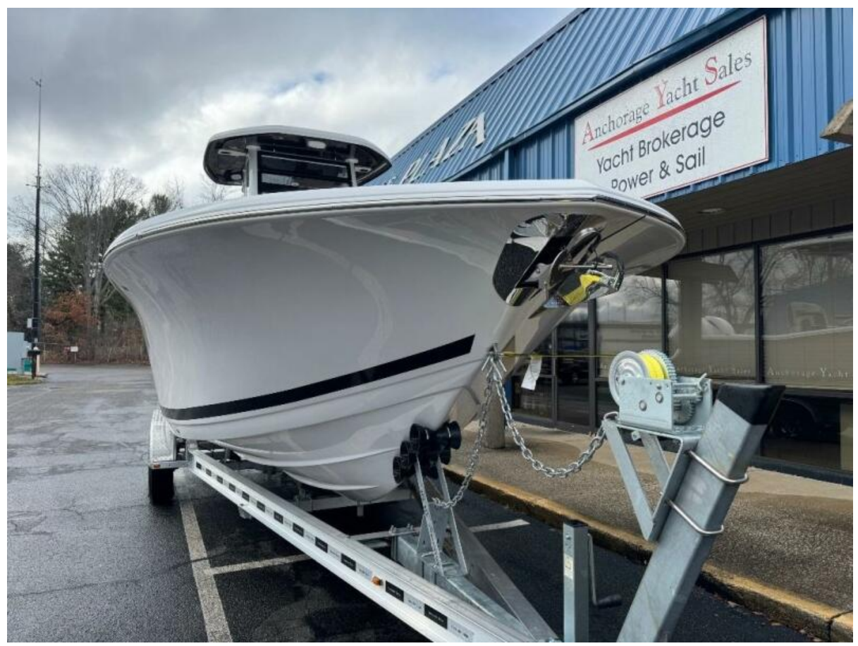
2024 256 TW Bow Flare