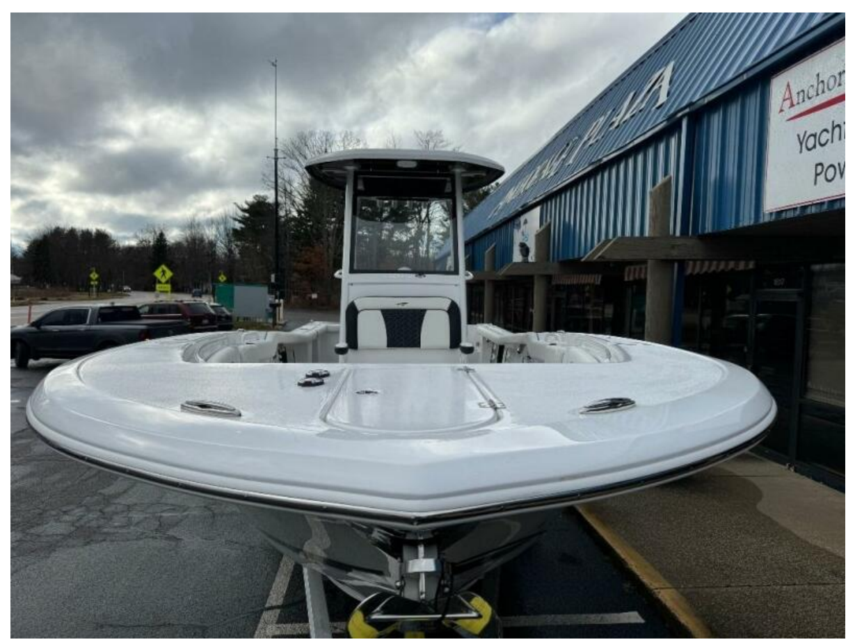
2024 256 TW Bow