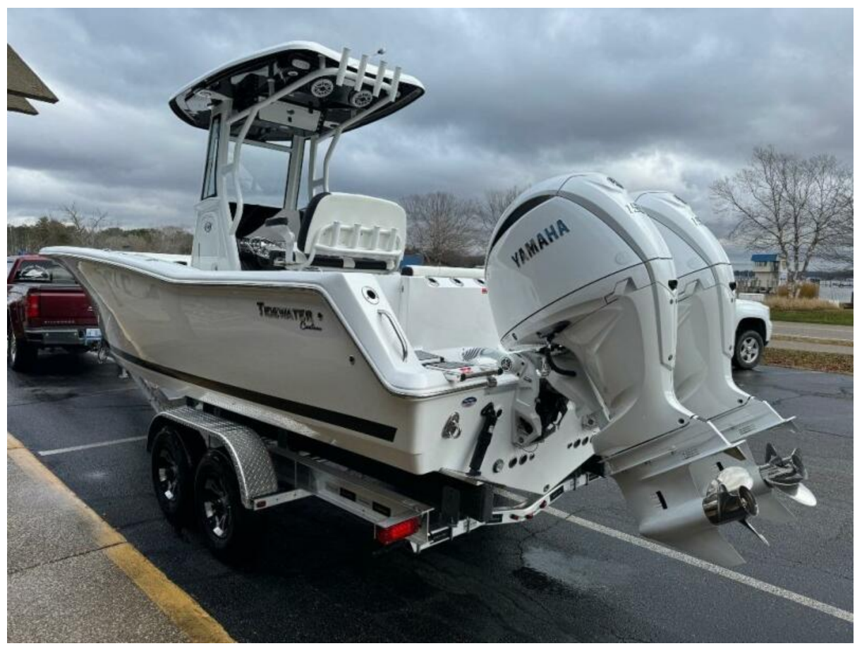
2024 256 TW Exterior 5