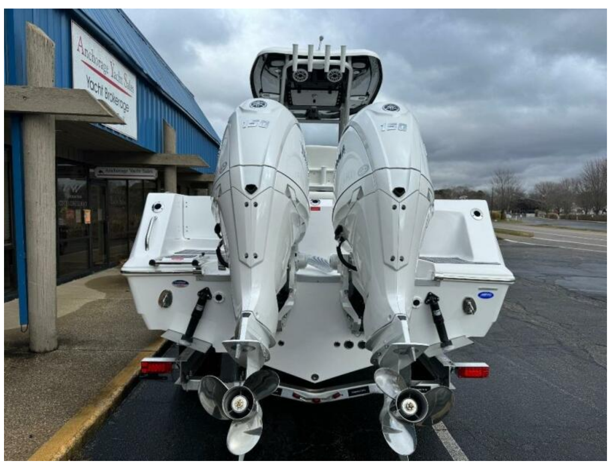
2024 256 TW Exterior 4