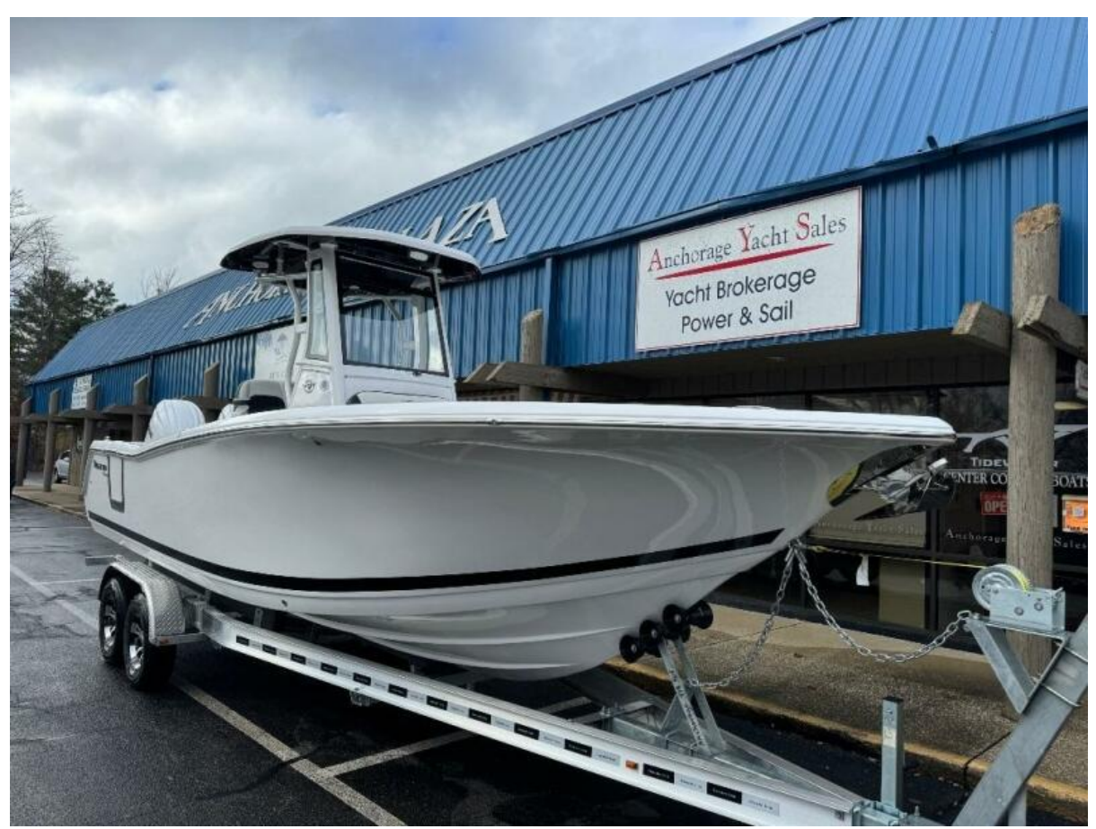
2024 256 TW Exterior 6