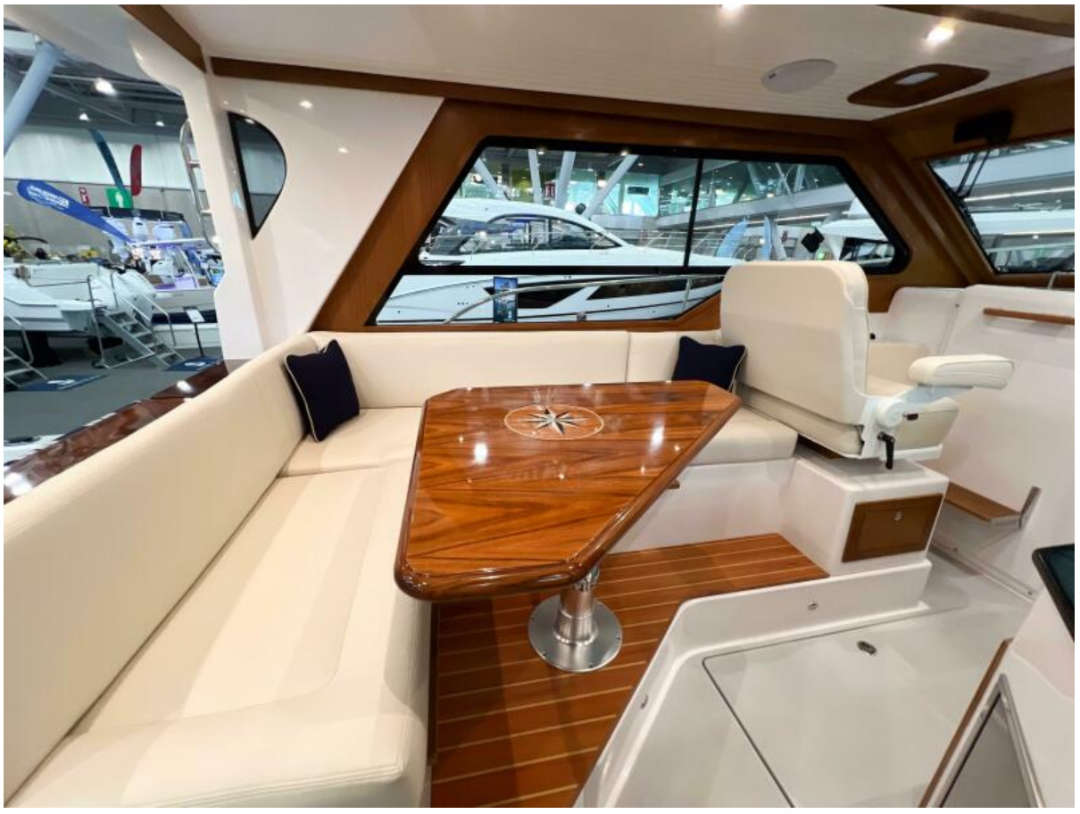
True North 34