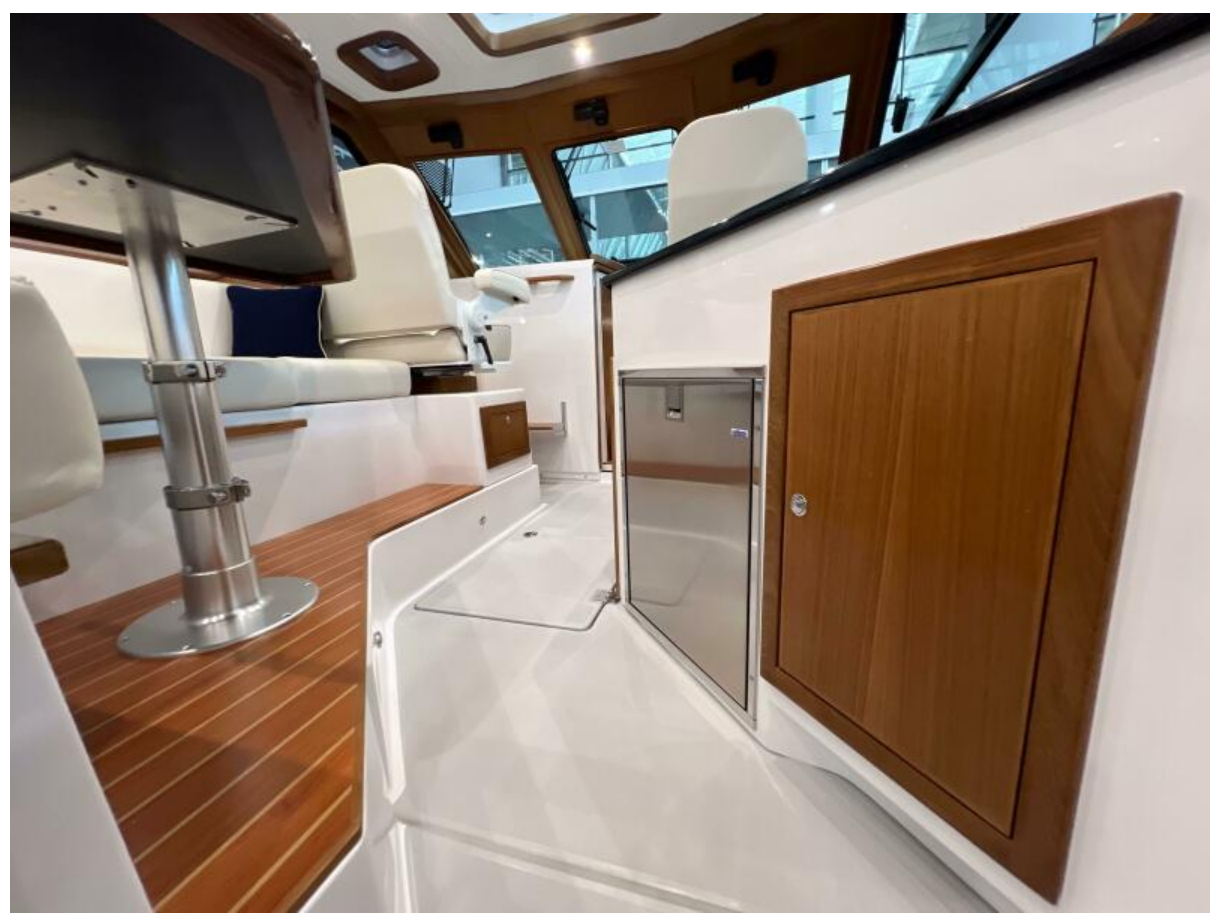
True North 34