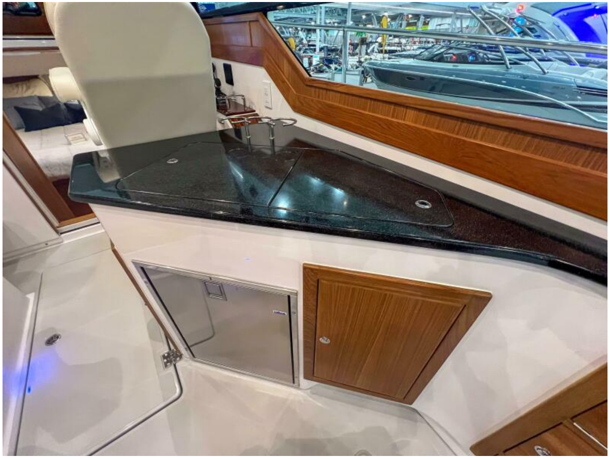
True North 34