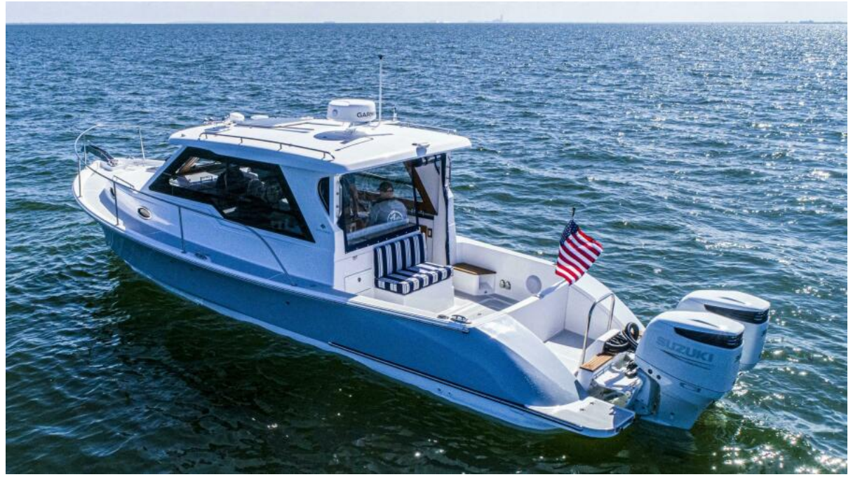
True North 34