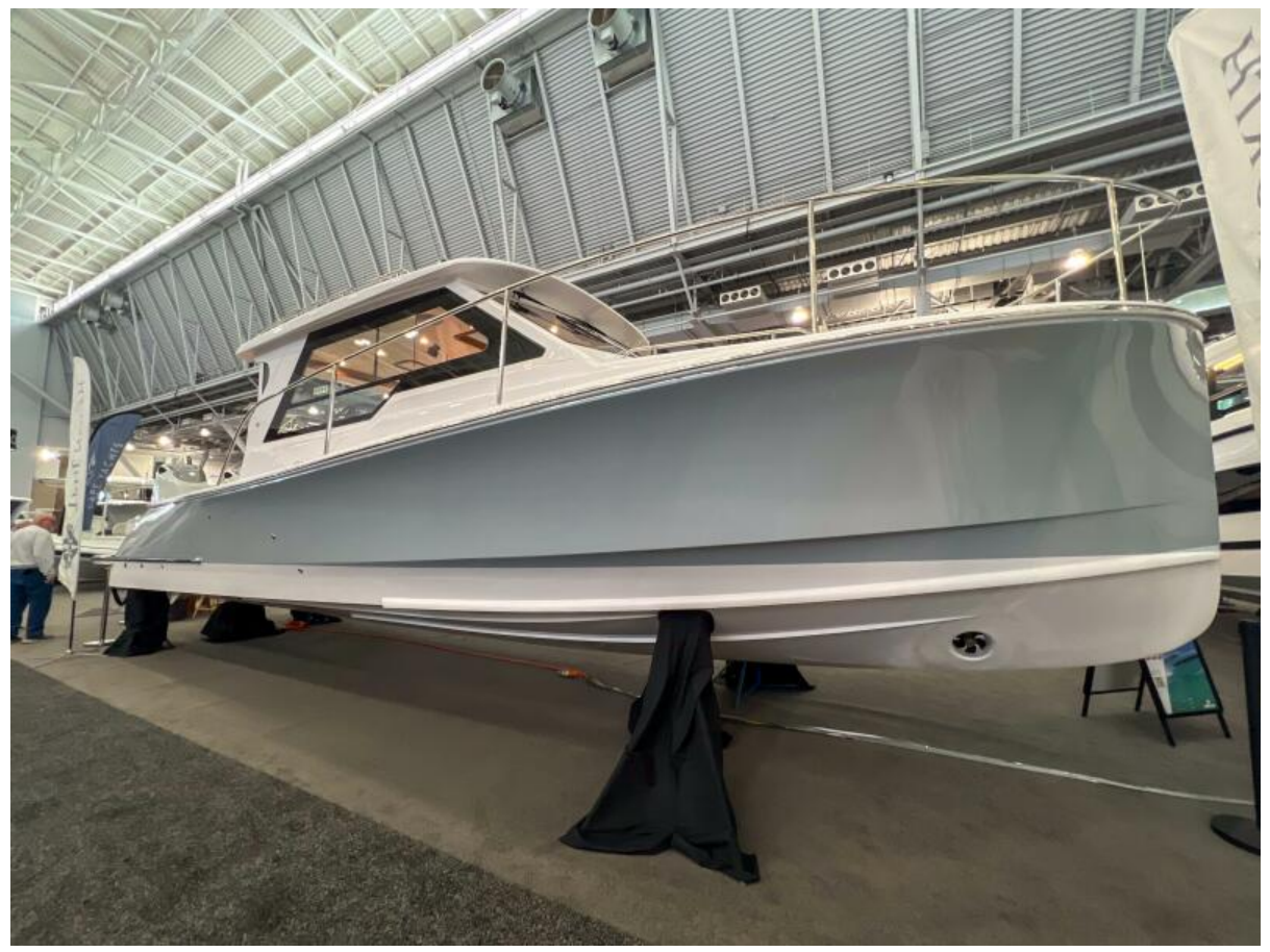
True North 34