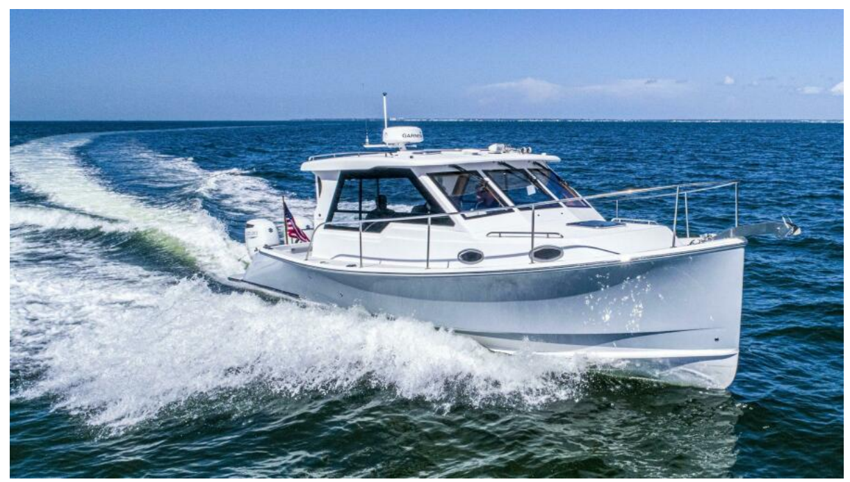
True North 34