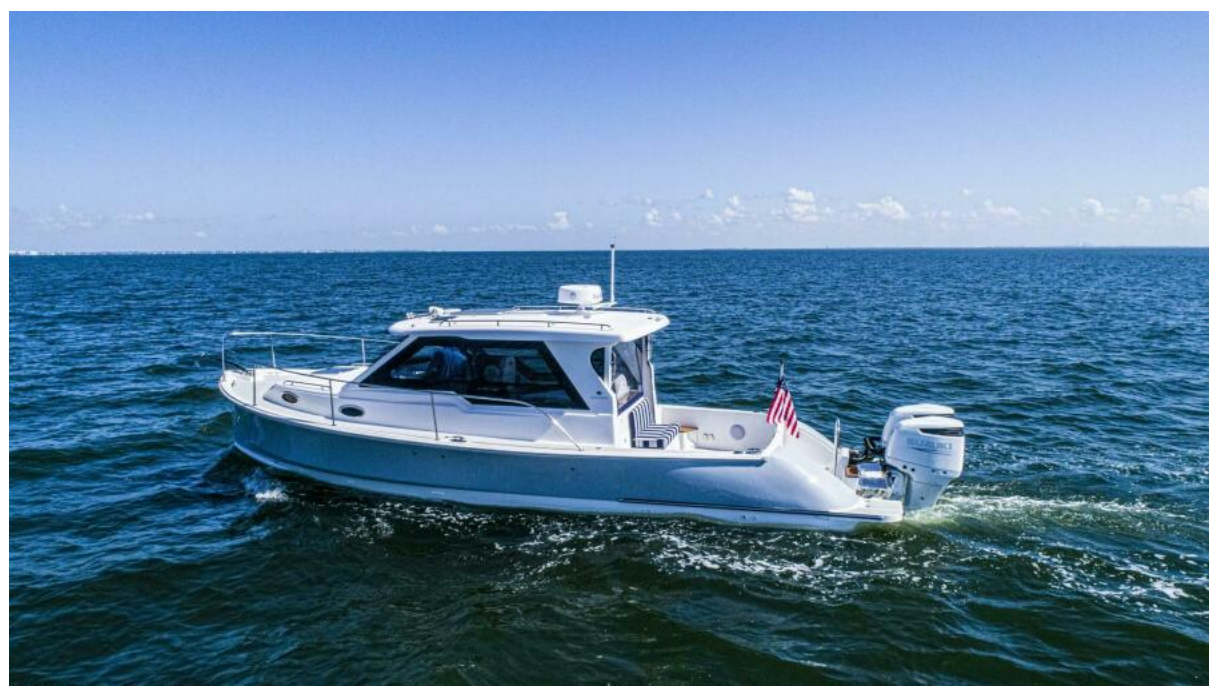
True North 34