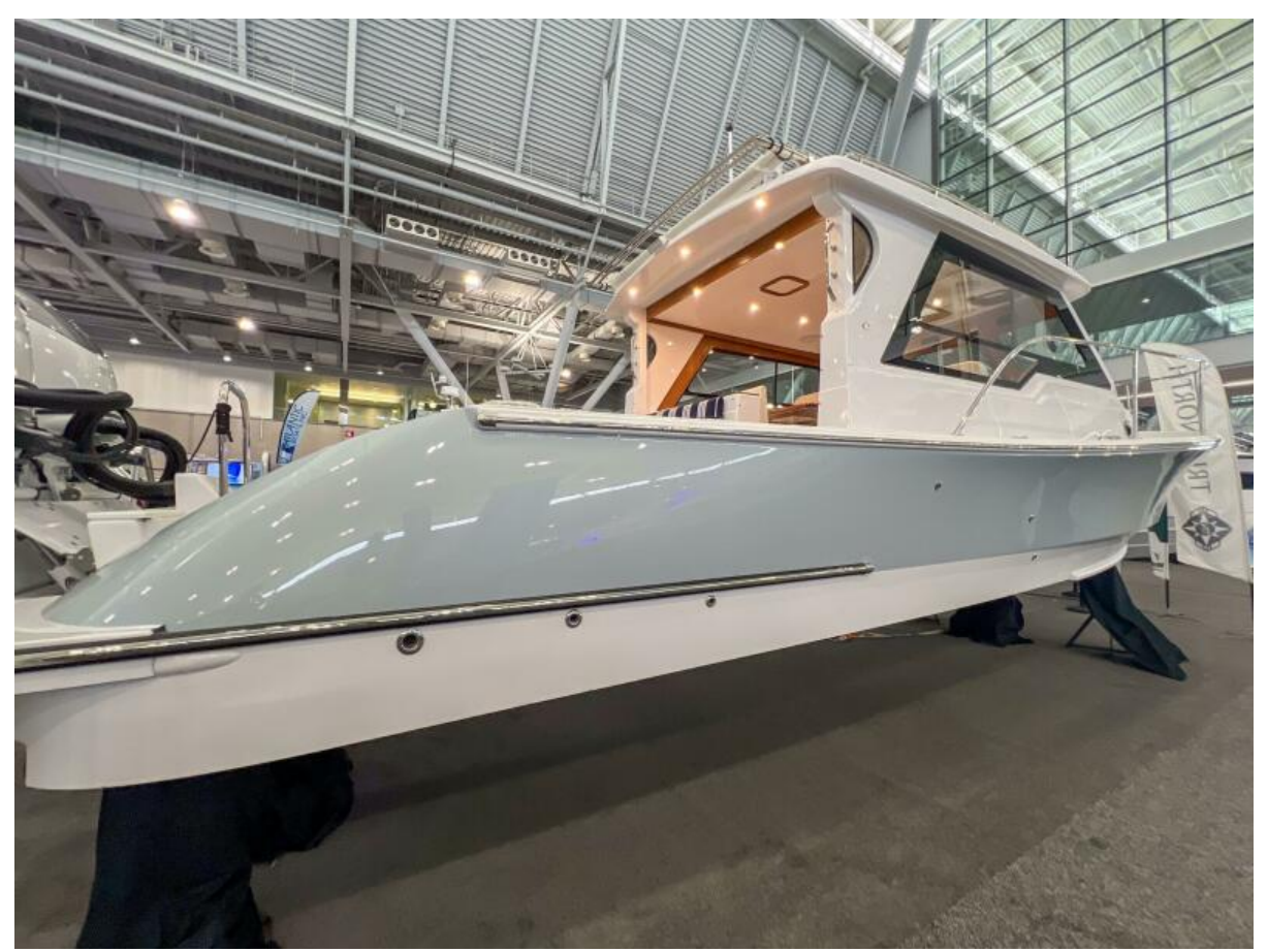
True North 34