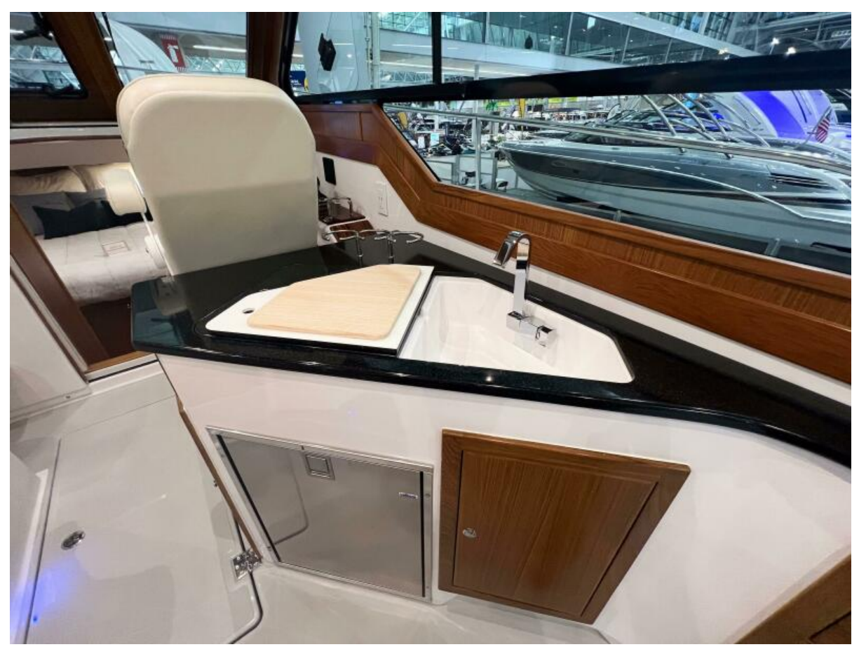
True North 34