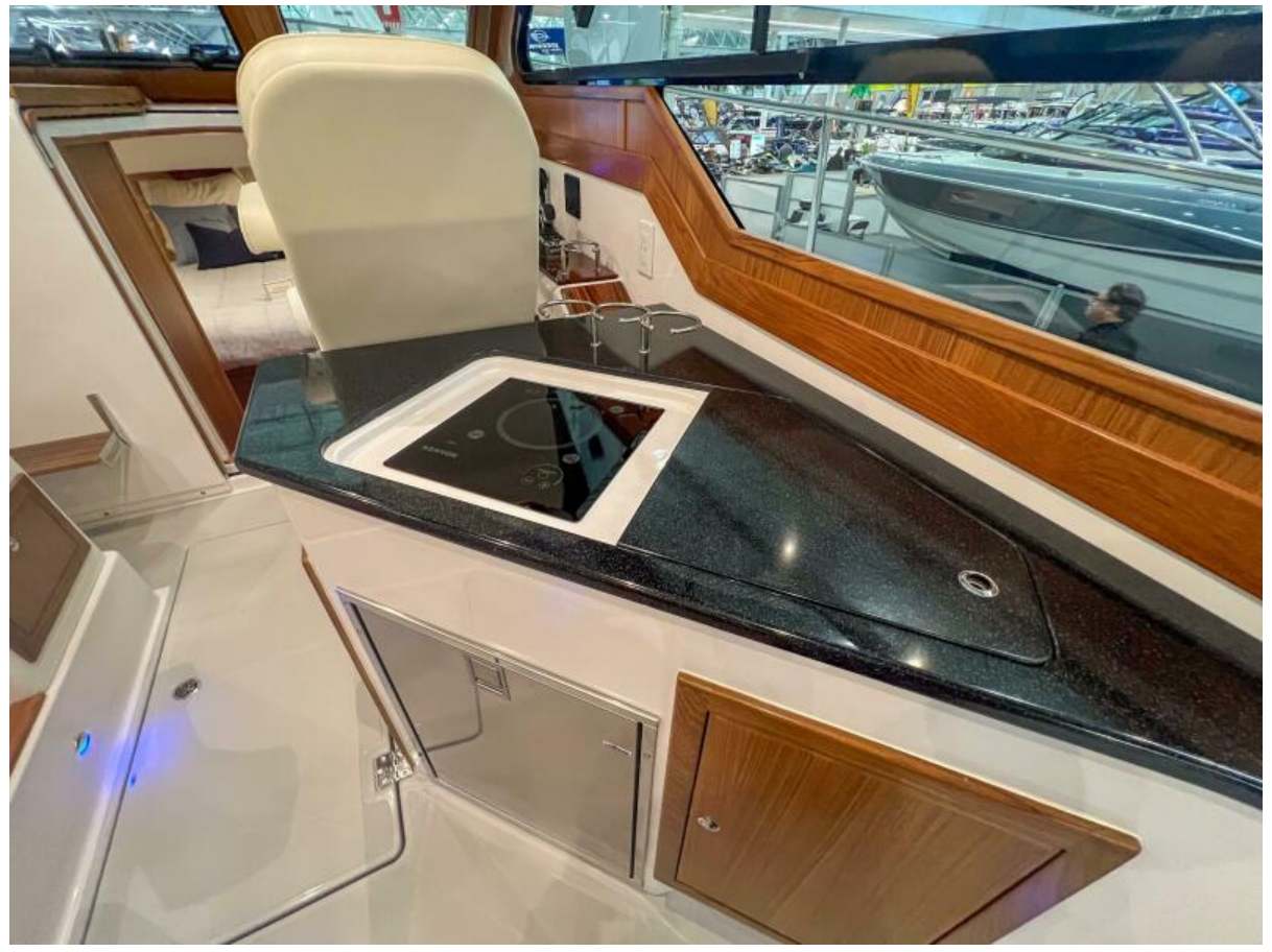
True North 34