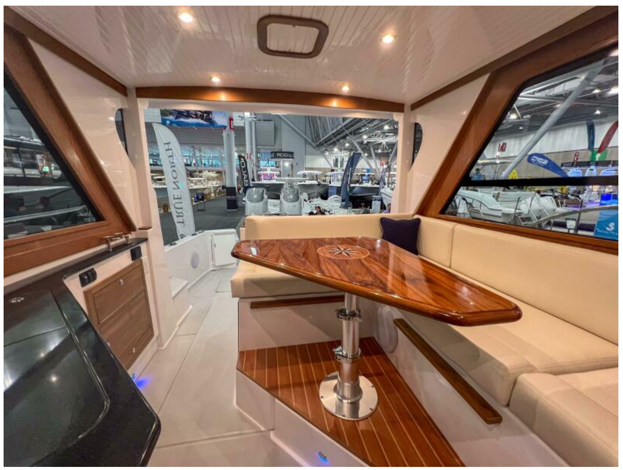
True North 34