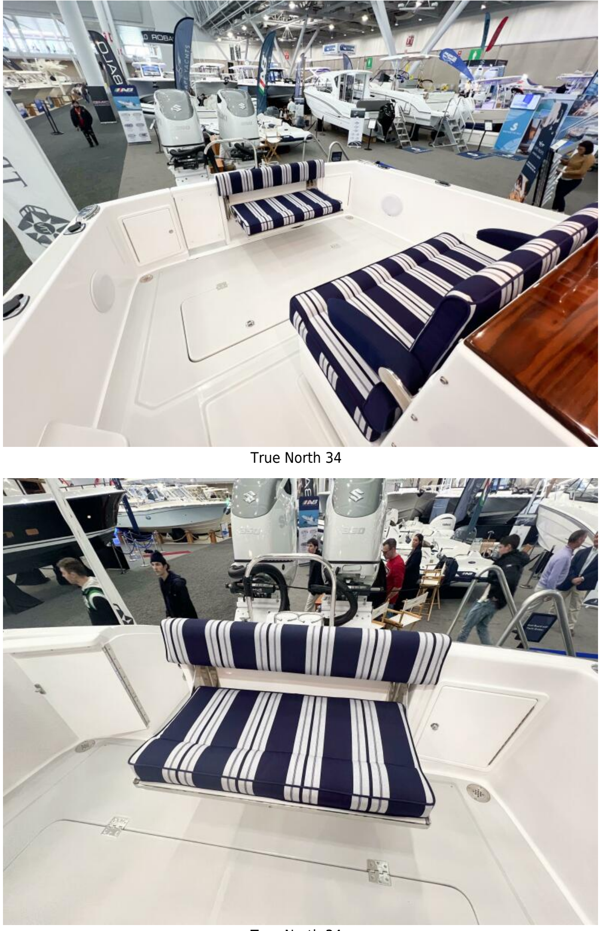
True North 34