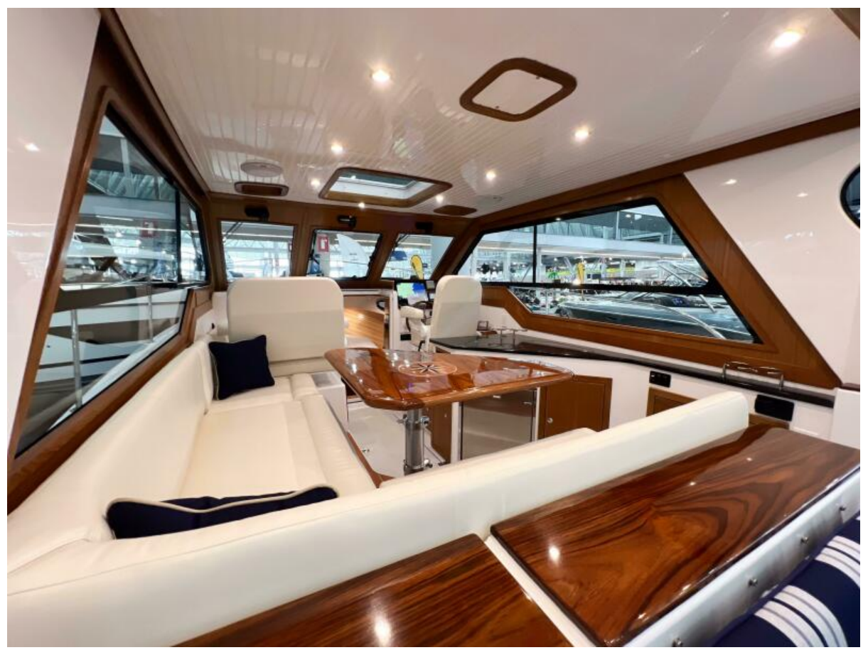
True North 34