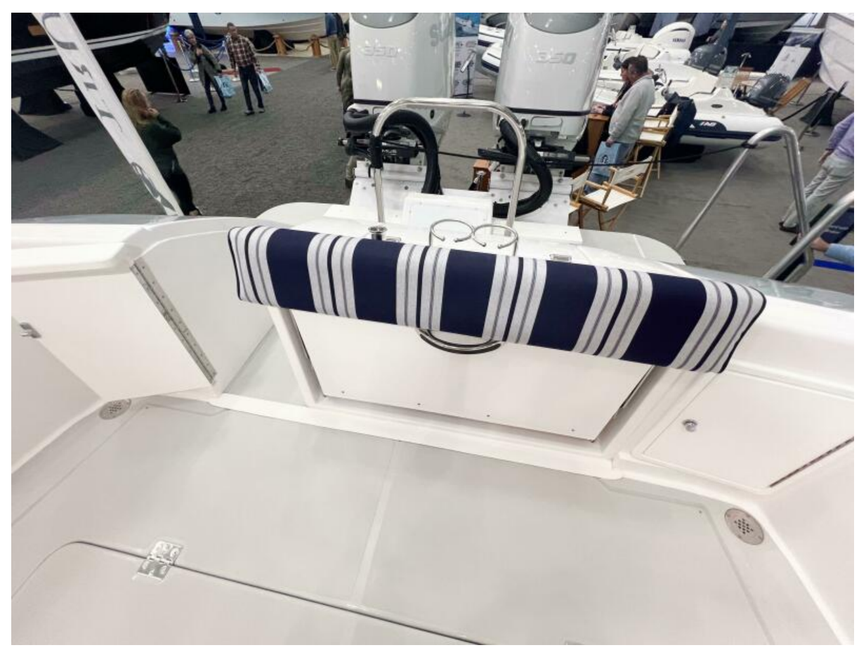
True North 34