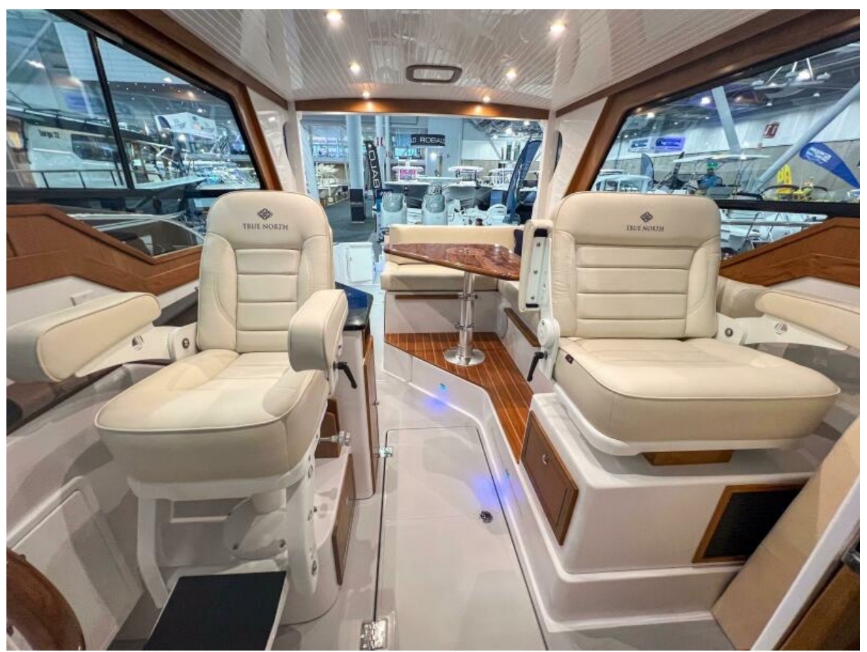
True North 34