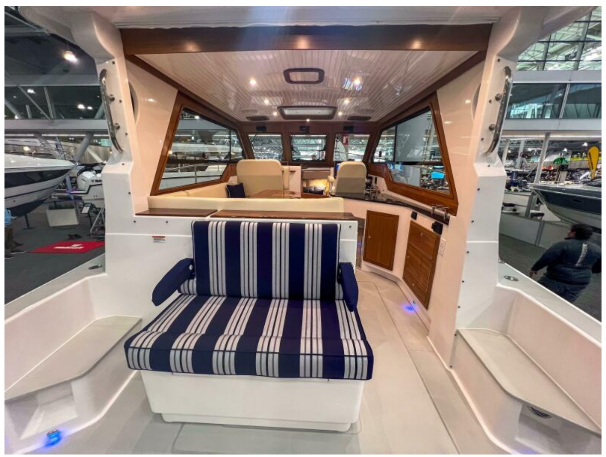
True North 34