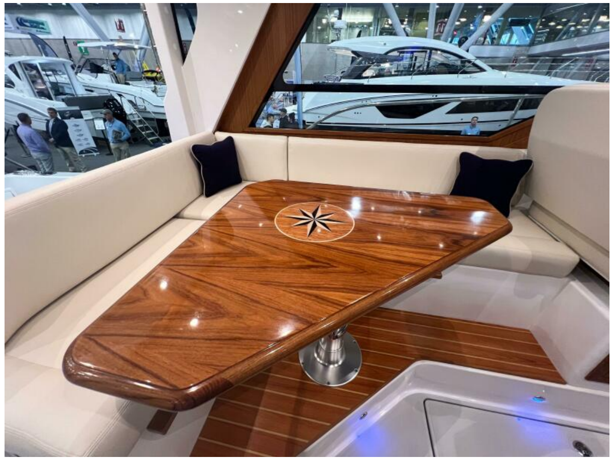
True North 34