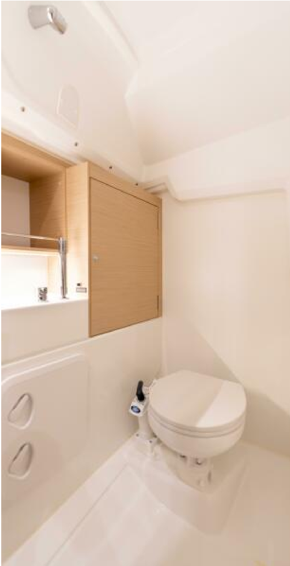
BENETEAU Oceanis 30.1