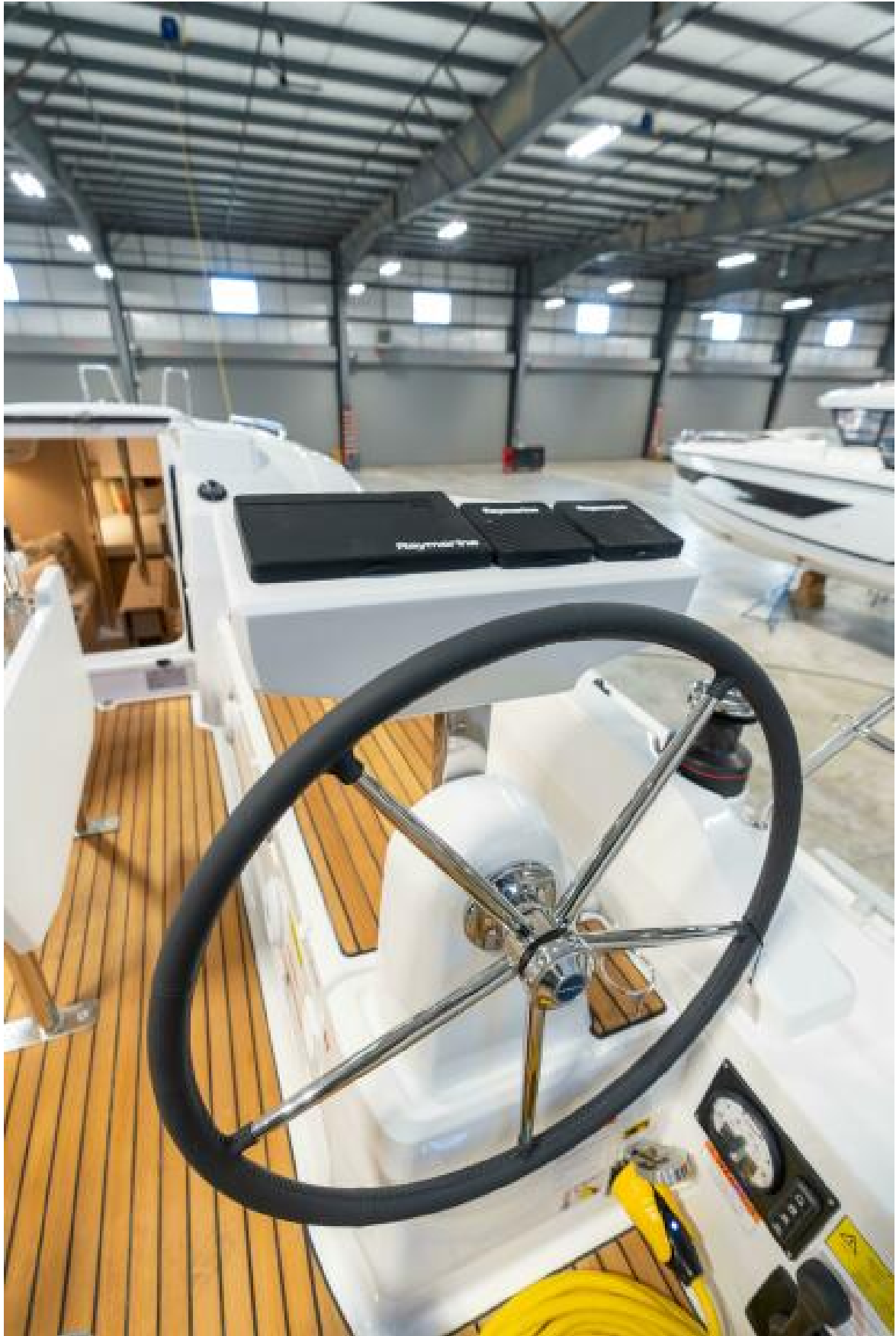
BENETEAU Oceanis 30.1