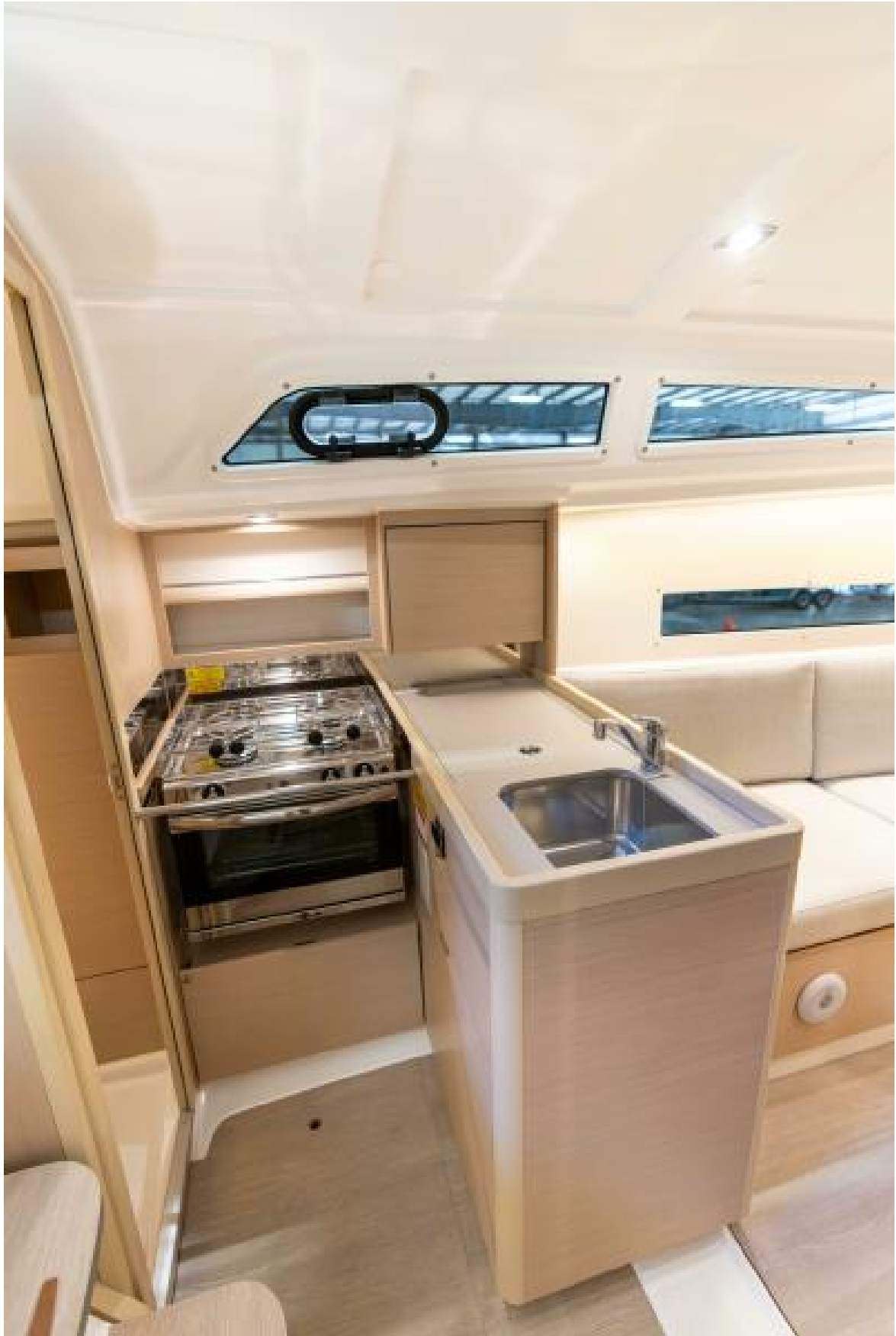
BENETEAU Oceanis 30.1