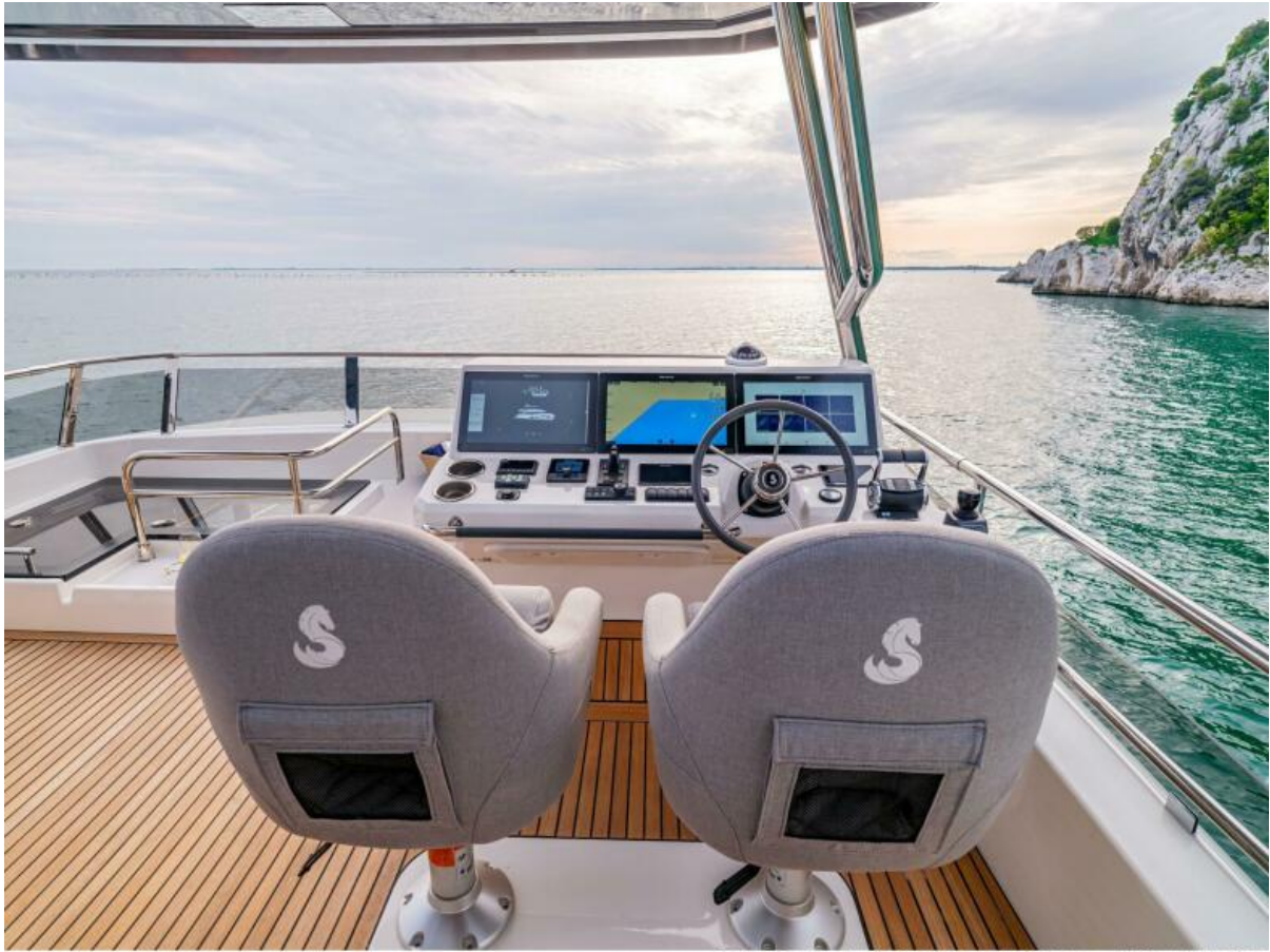
Bénéteau Grand Trawler 62 - Mention obligatoire / Mandatory credit: Photo Nicolas Claris