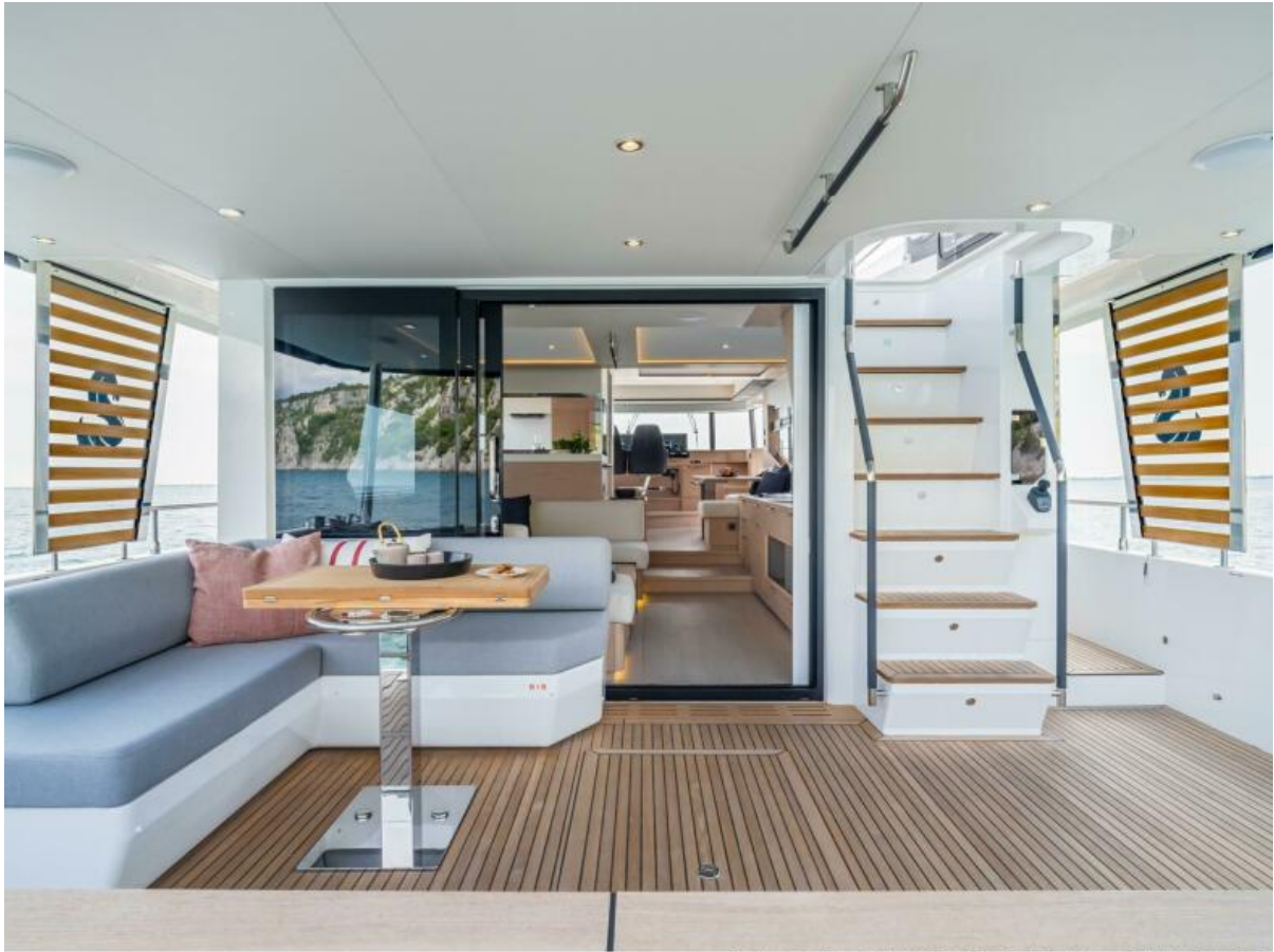
Bénéteau Grand Trawler 62