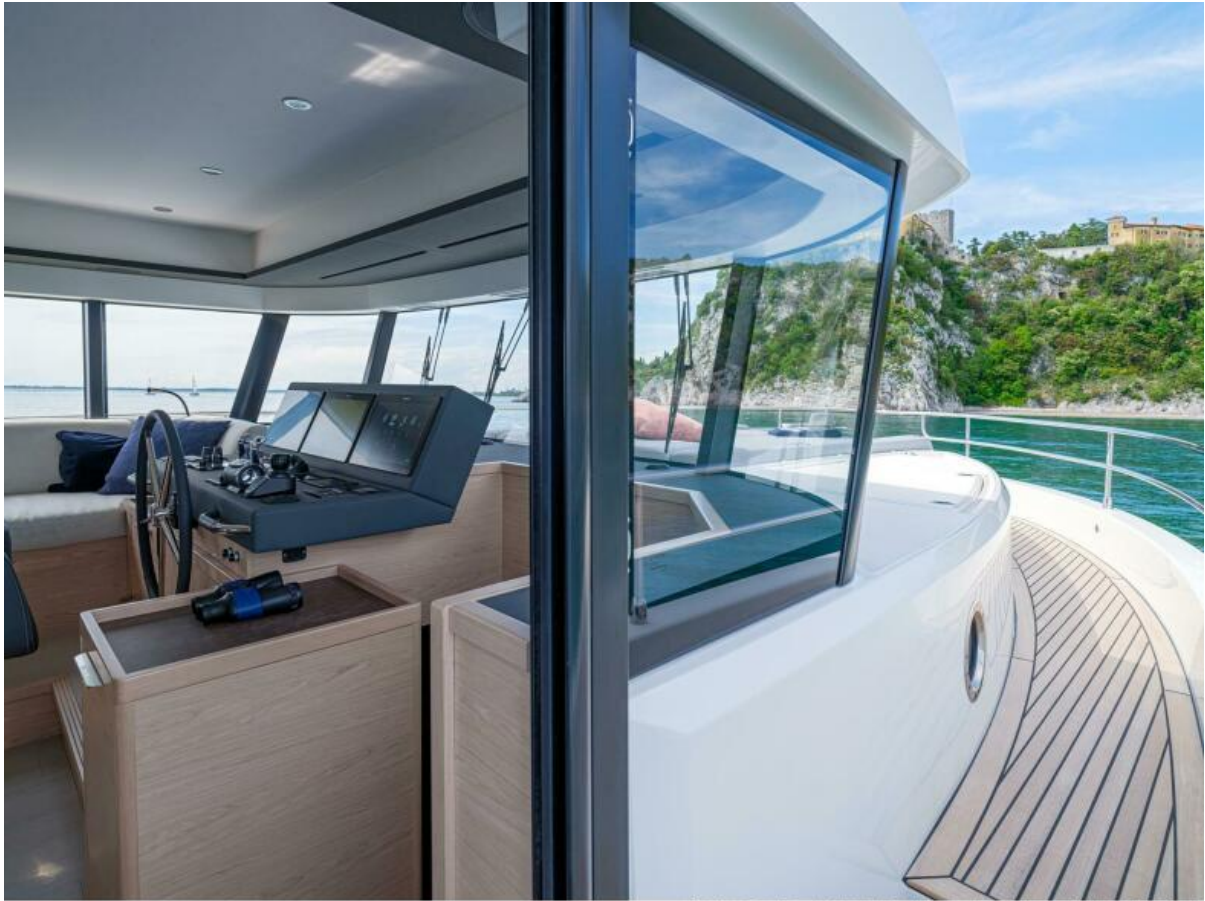
Bénéteau Grand Trawler 62