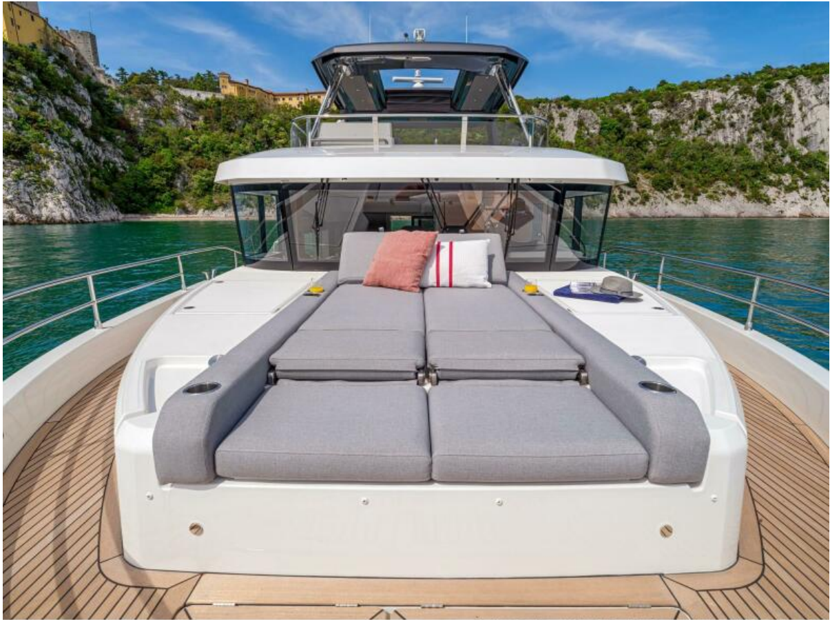
Bénéteau Grand Trawler 62 - Mention obligatoire / Mandatory credit: Photo Nicolas Claris