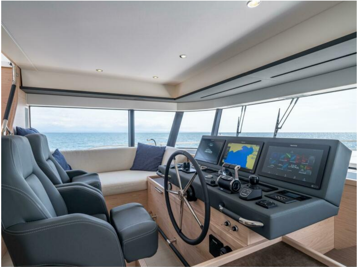
Bénéteau Grand Trawler 62