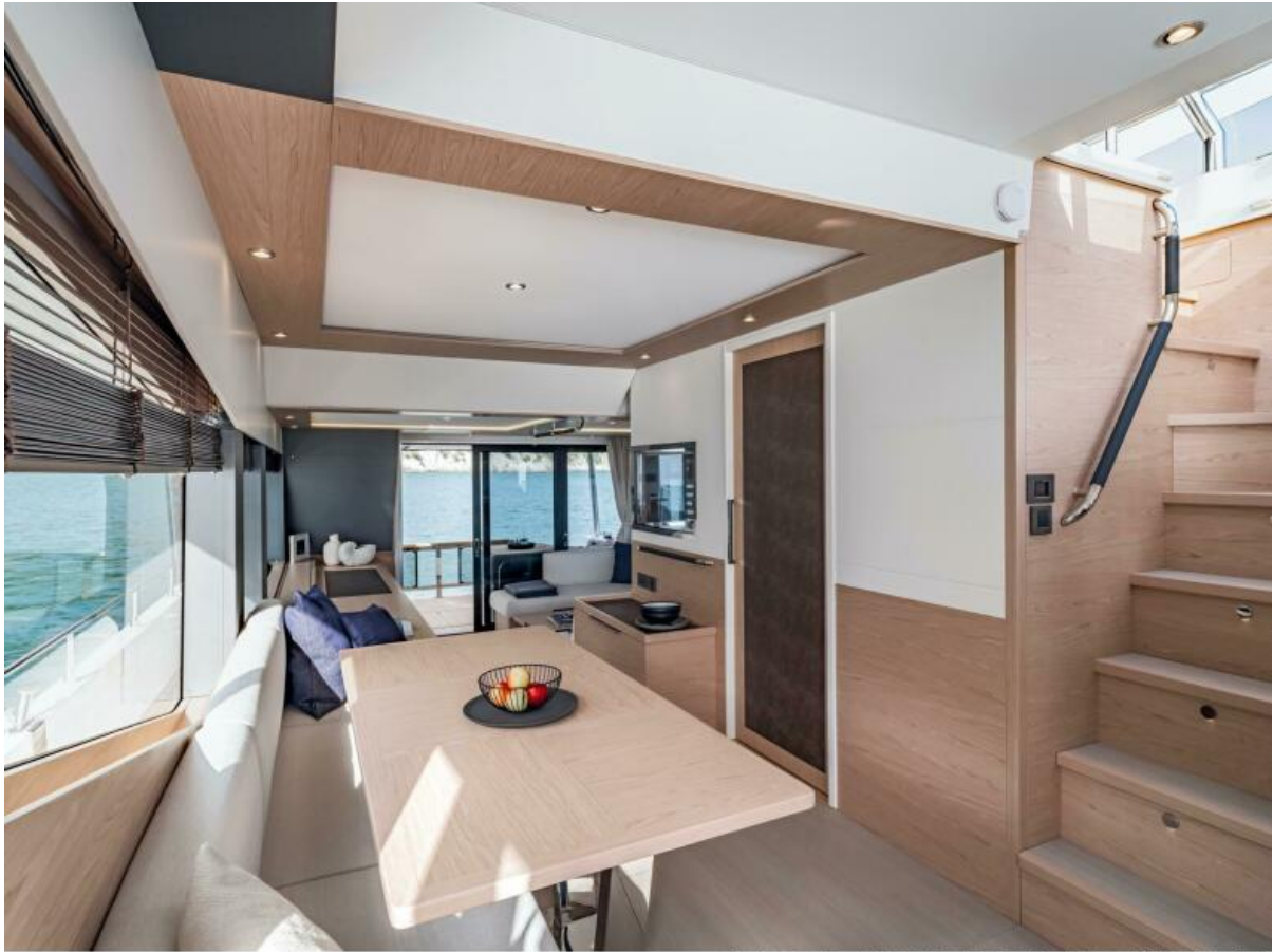
Bénéteau Grand Trawler 62 - Mention obligatoire / Mandatory credit: Photo Nicolas Claris