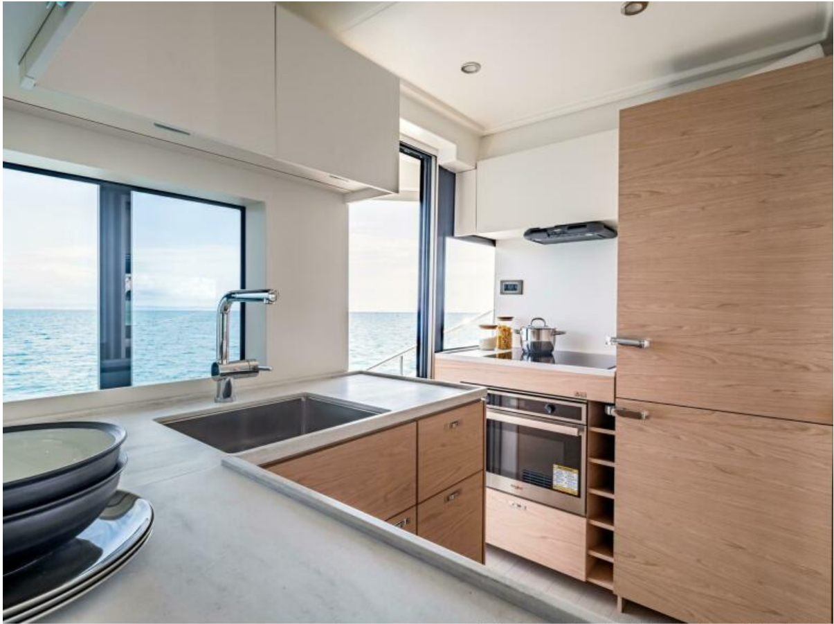
Bénéteau Grand Trawler 62