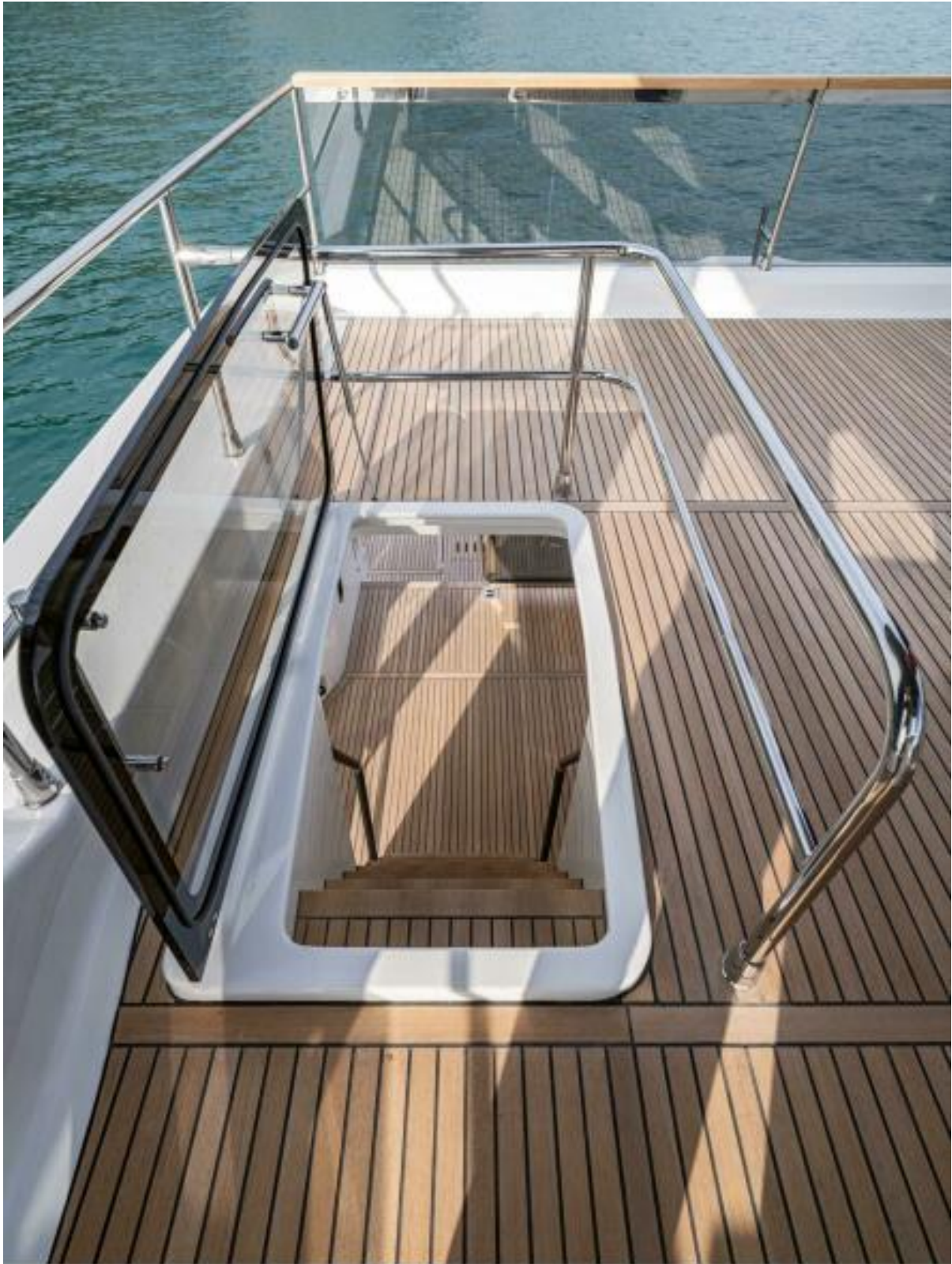
Bénéteau Grand Trawler 62