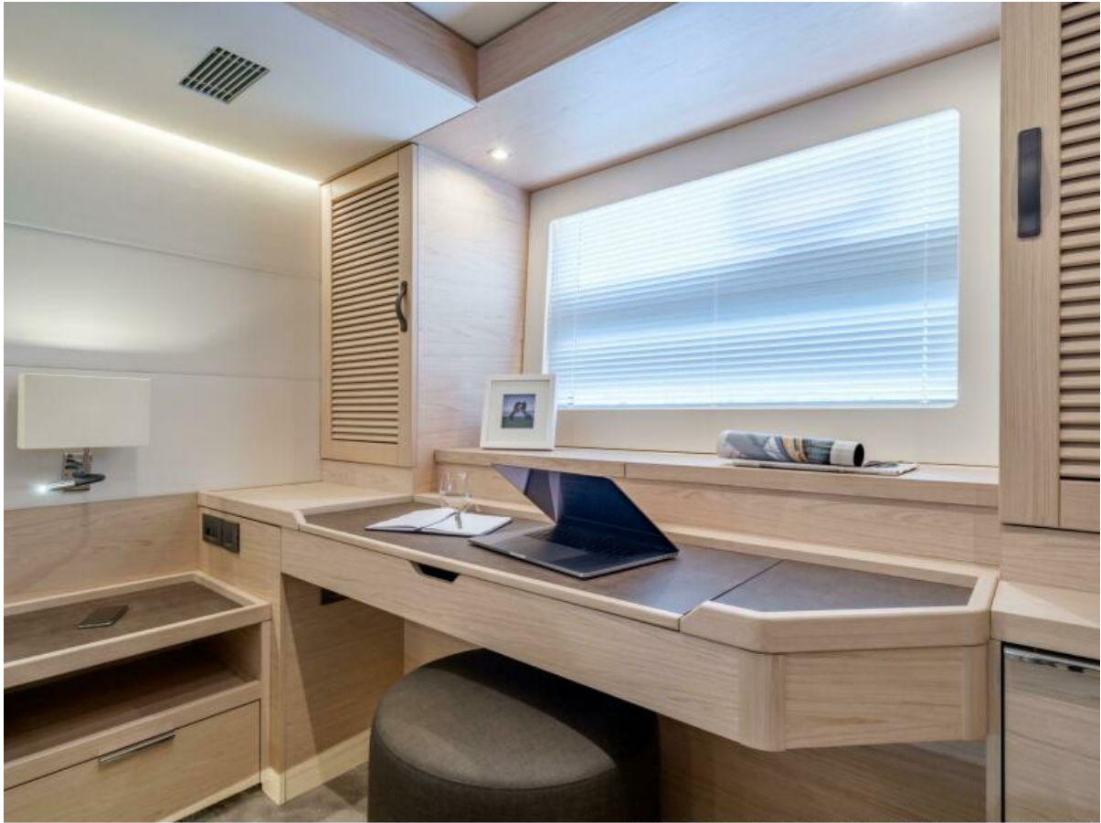
Beneteau Grand Trawler 62