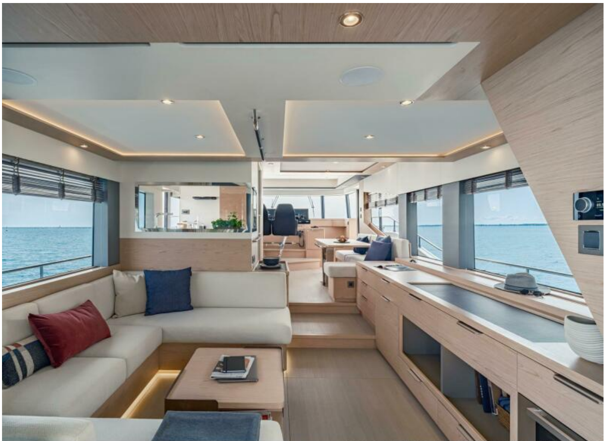
Bénéteau Grand Trawler 62