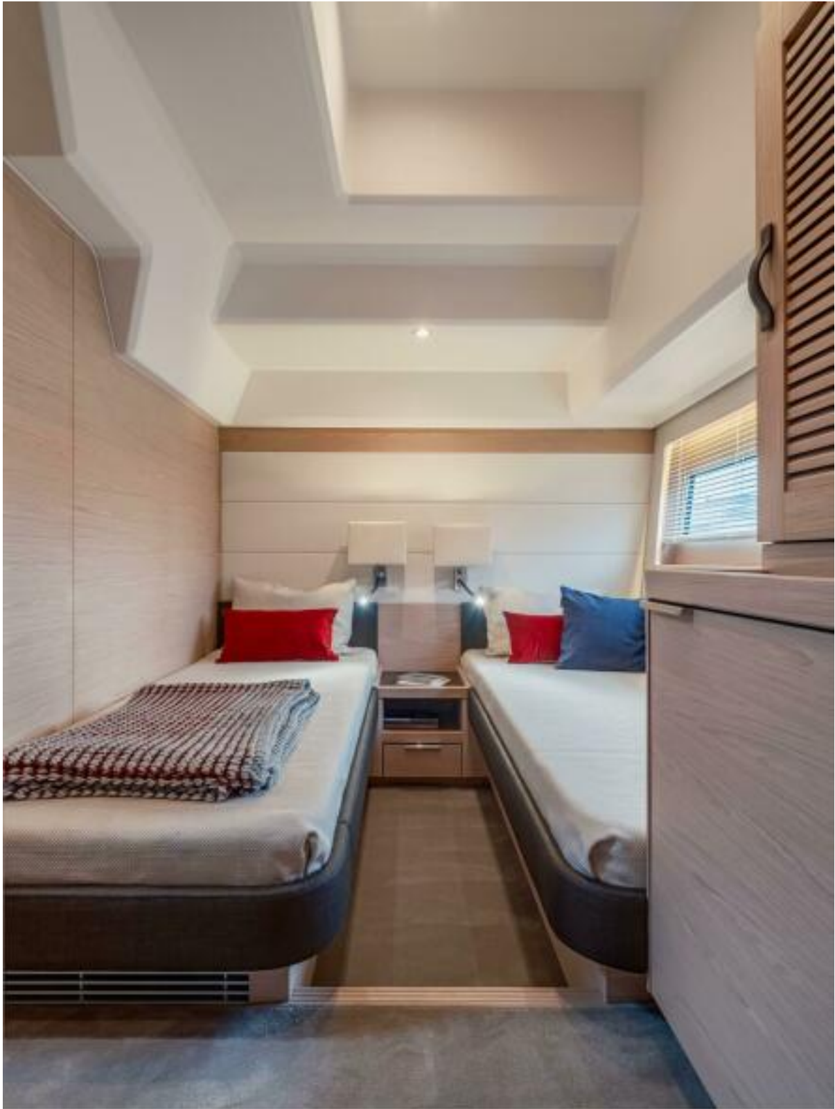
Bénéteau Grand Trawler 62