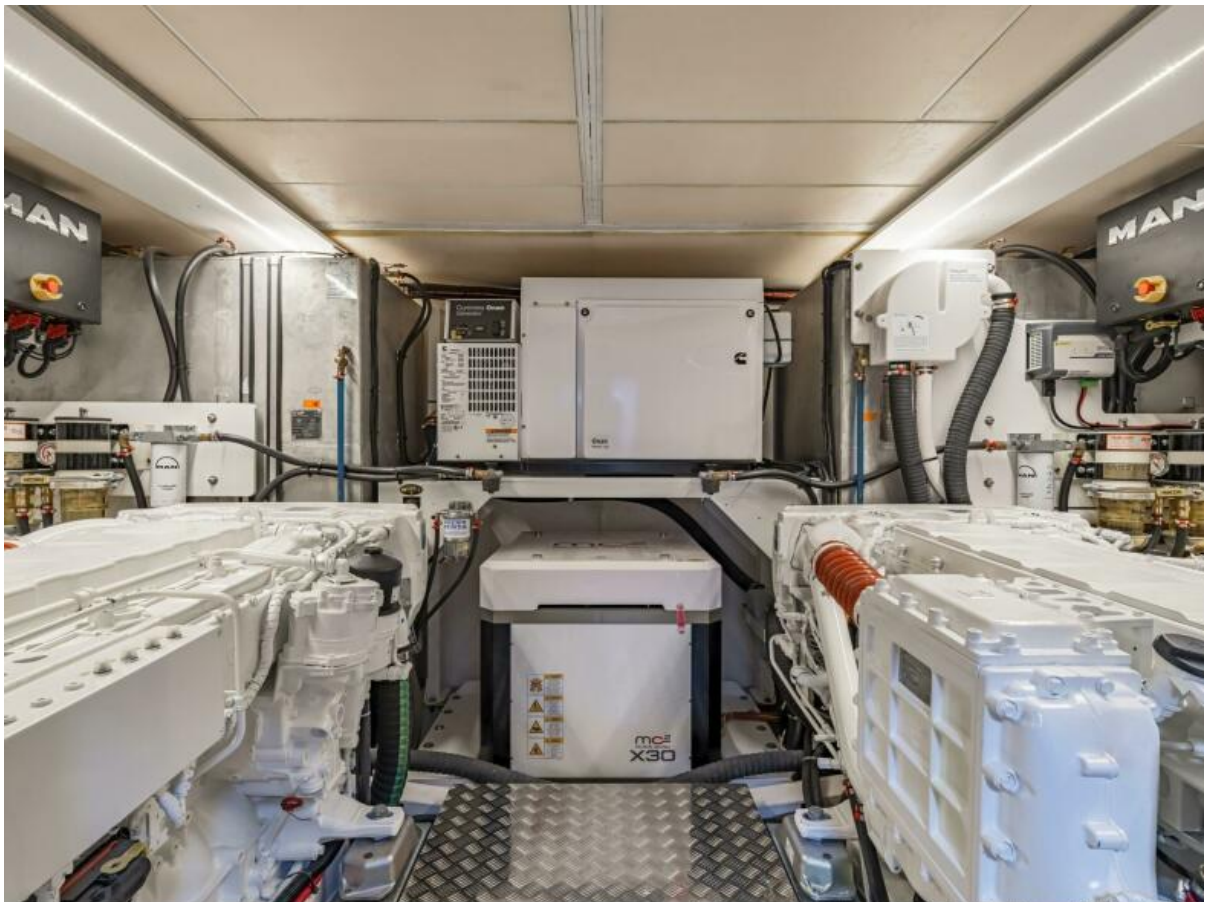
Bénéteau Grand Trawler 62 - Mention obligatoire / Mandatory credit: Photo Nicolas Claris