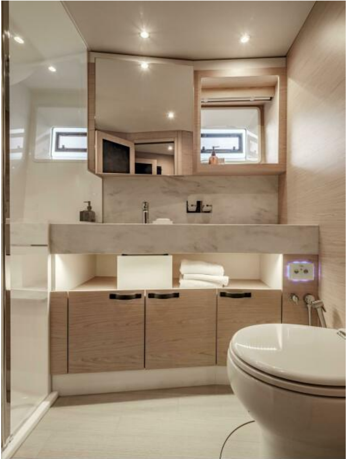
Bénéteau Grand Trawler 62