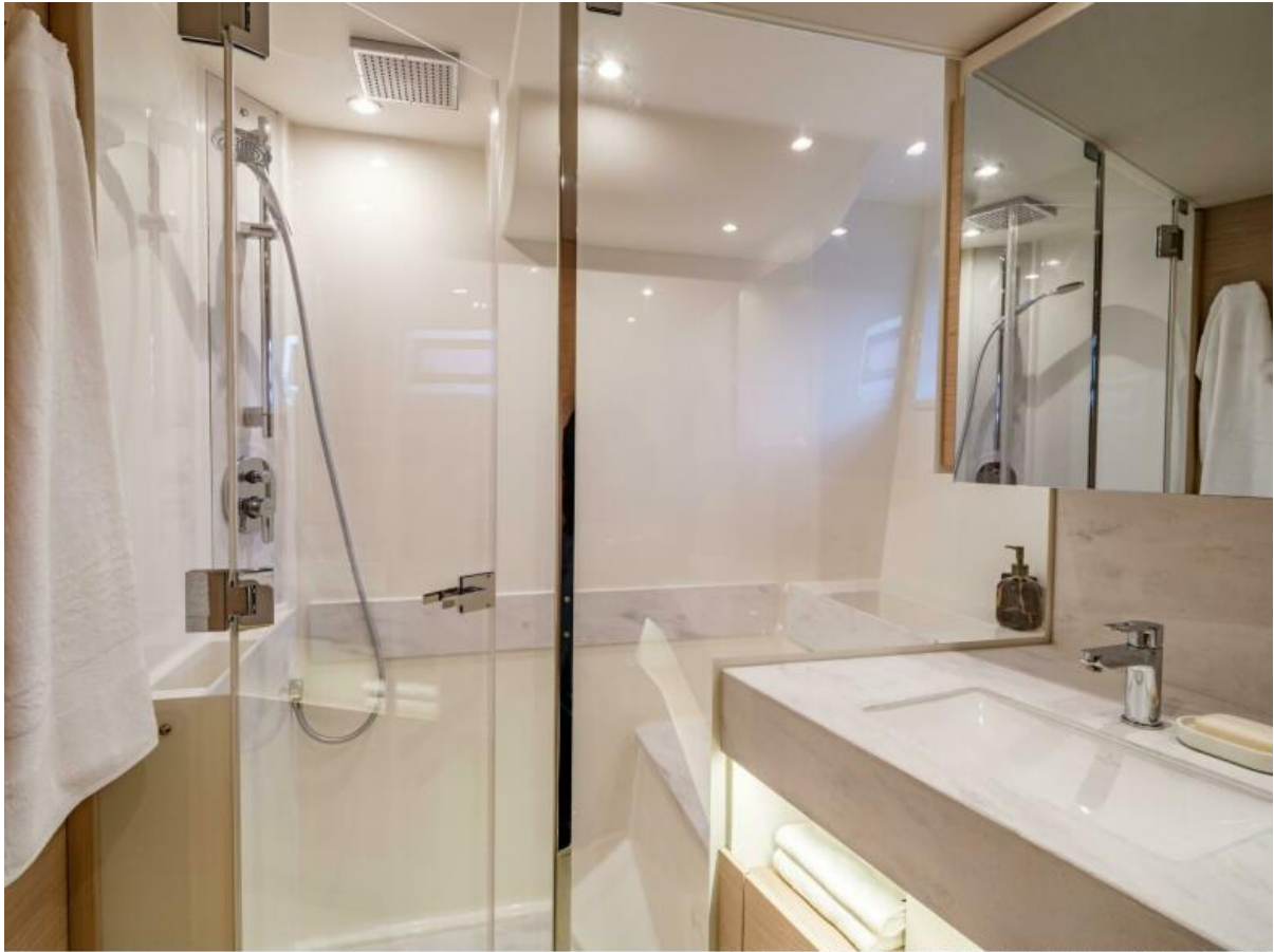
Bénéteau Grand Trawler 62