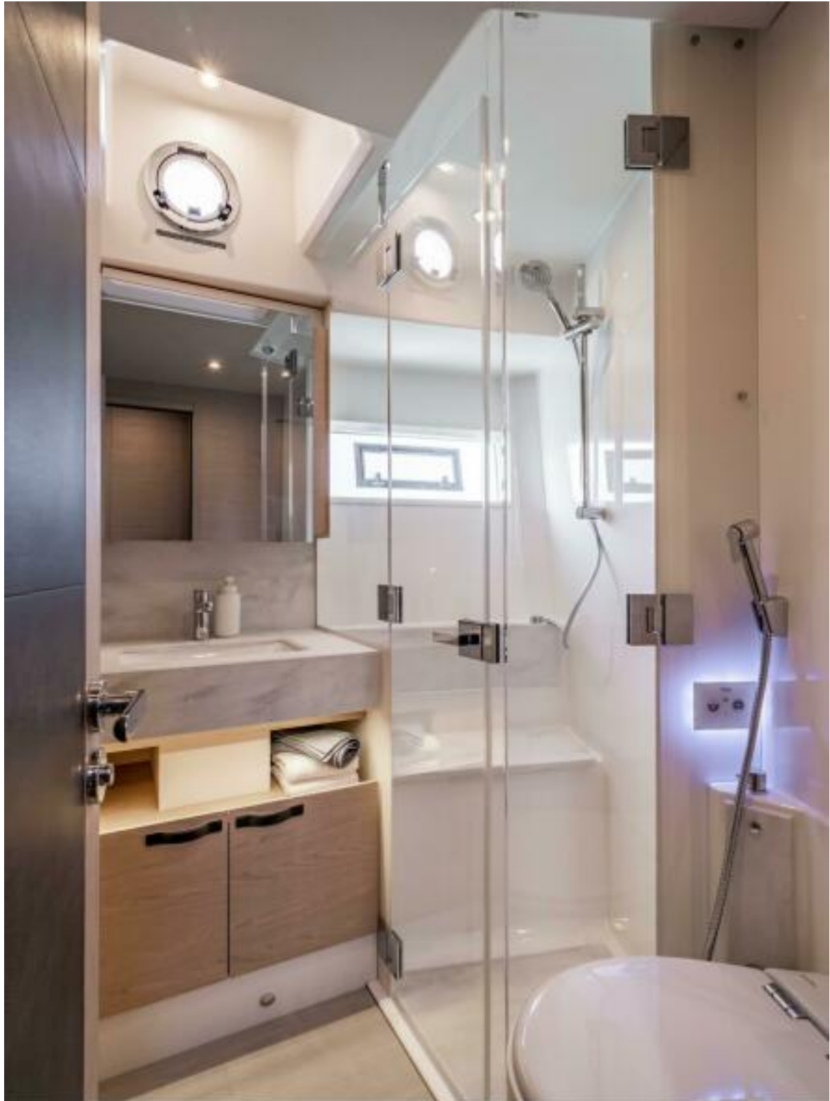
Bénéteau Grand Trawler 63