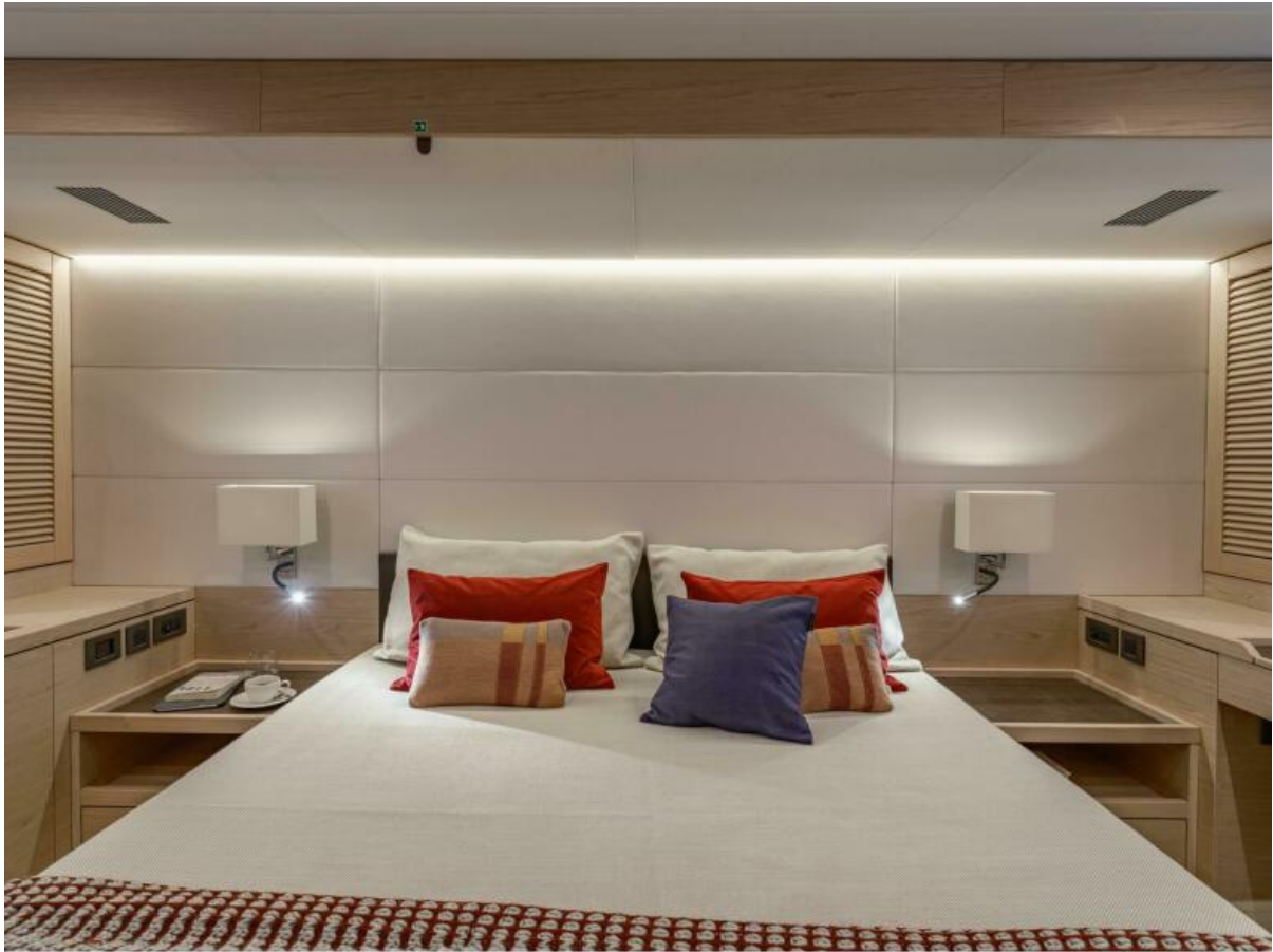
Beneteau Grand Trawler 62 - Mention obligatoire / Mandatory credit: Photo Nicolas Claris