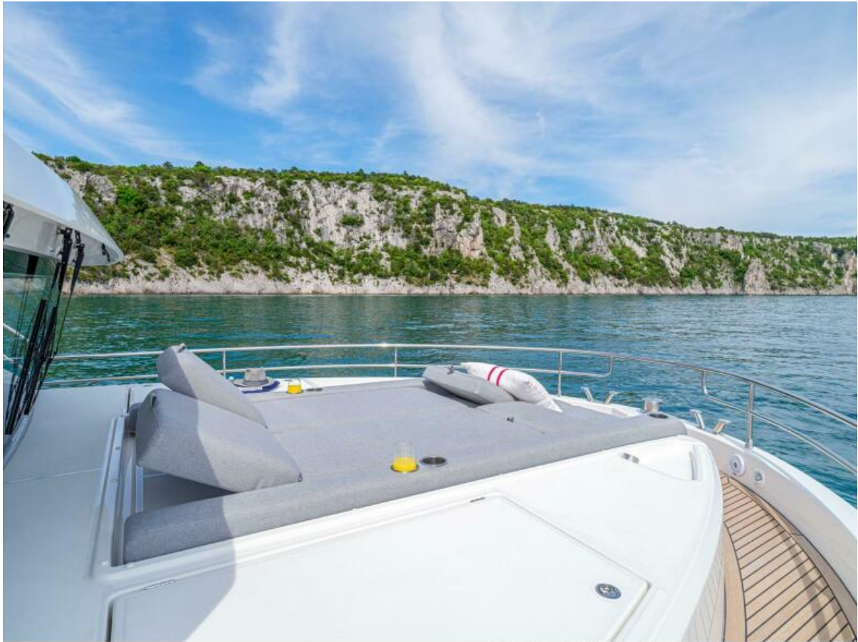
Bénéteau Grand Trawler 62