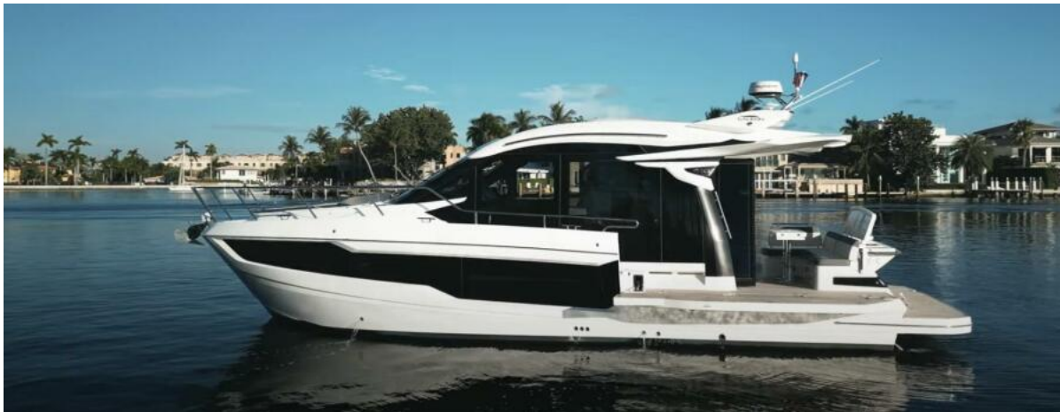
2022 Galeon 410HTC