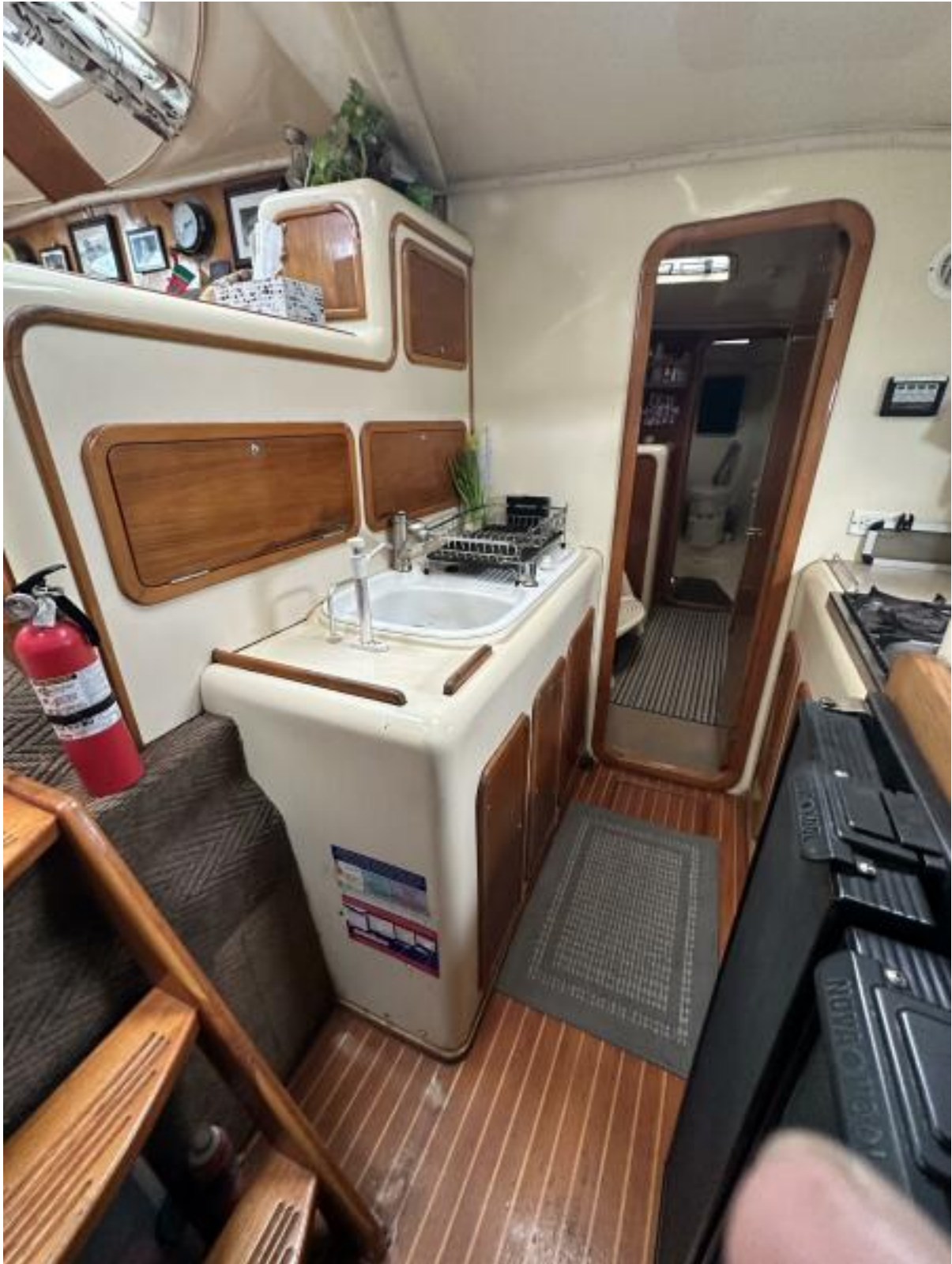
Starboard Galley 3