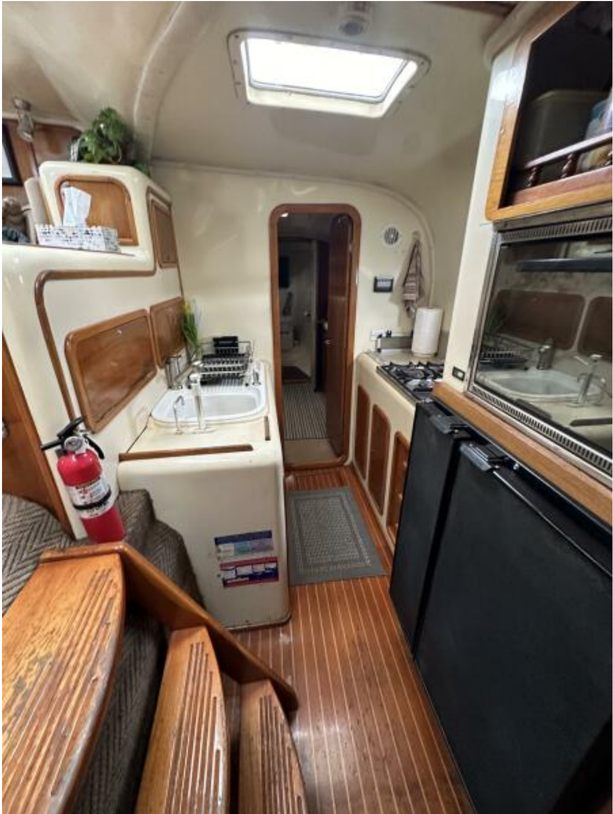
Starboard Galley 2