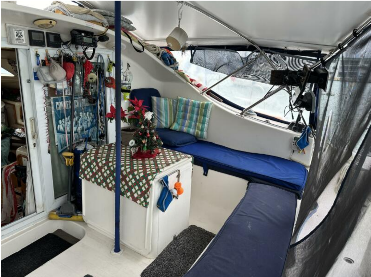
Aft Cockpit 2