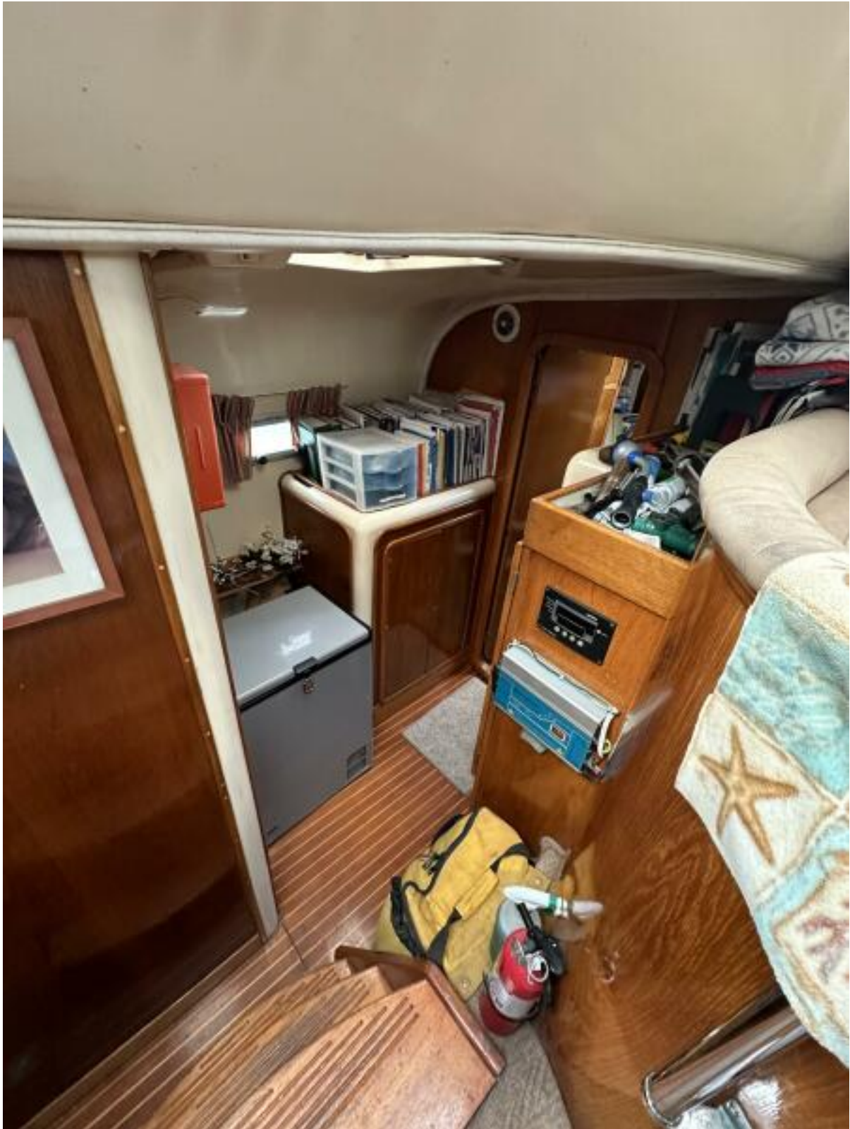
Port Forward Berth Hallway