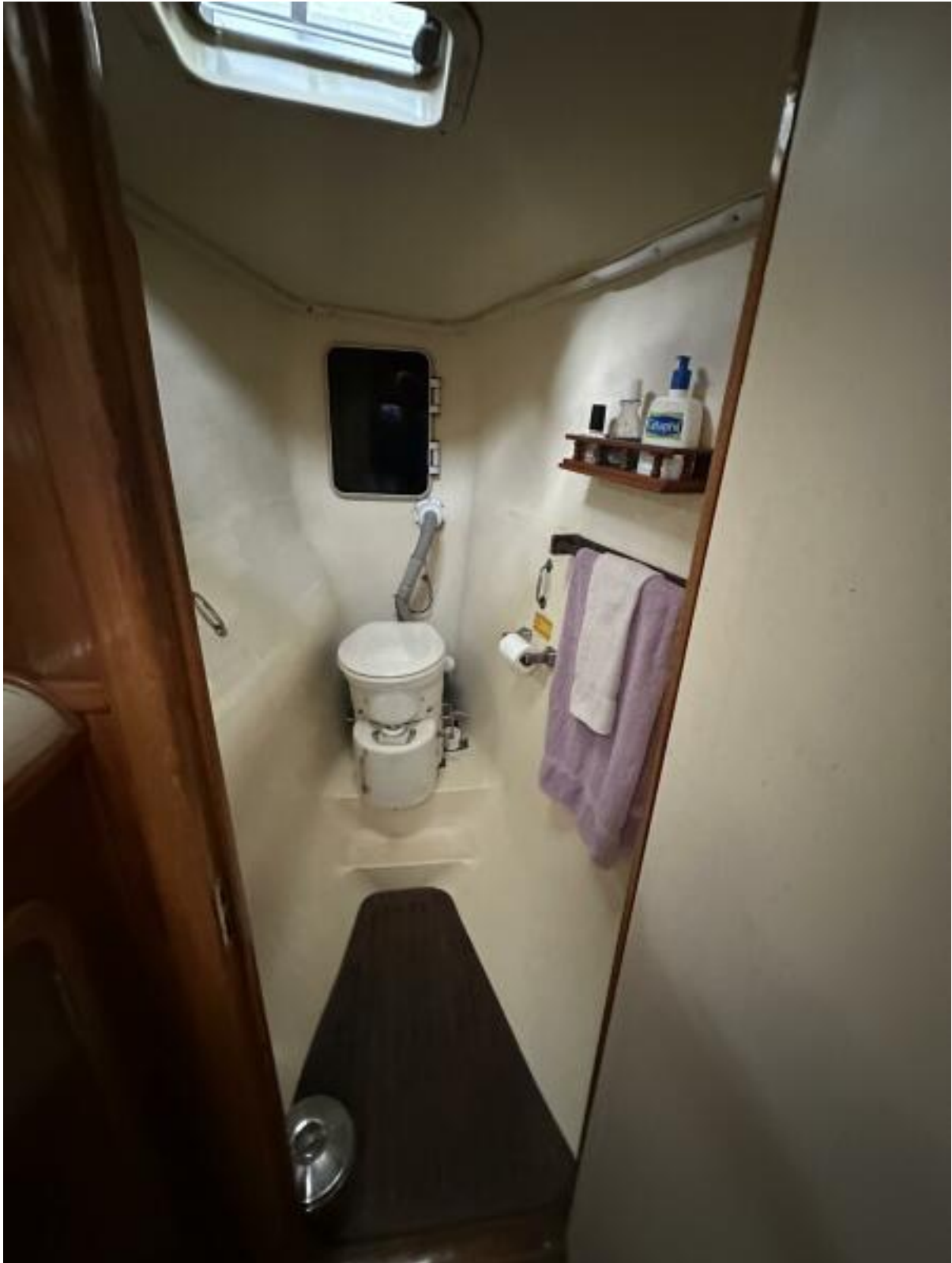
Starboard Owners Suite Head 1