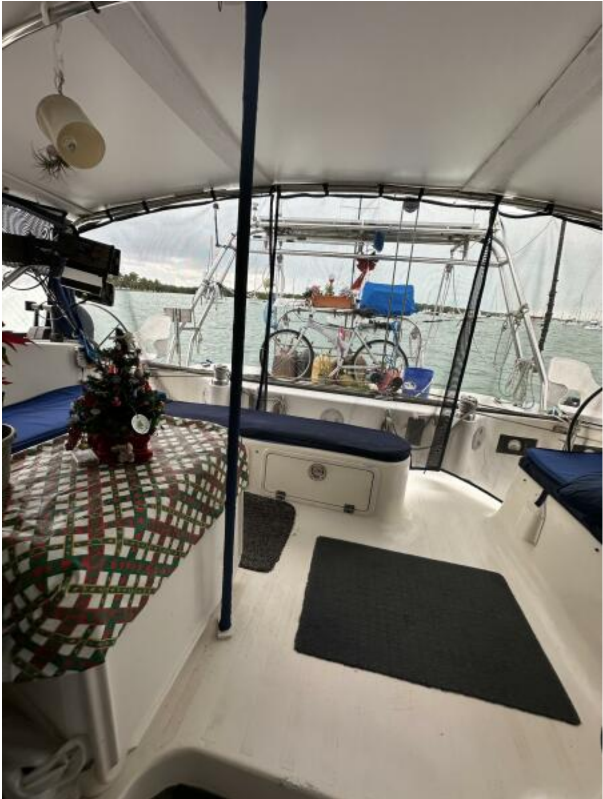
Aftt Cockpit 1