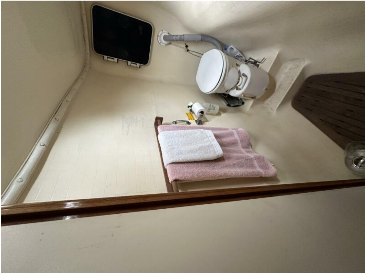
Port Forward Berth Head 1