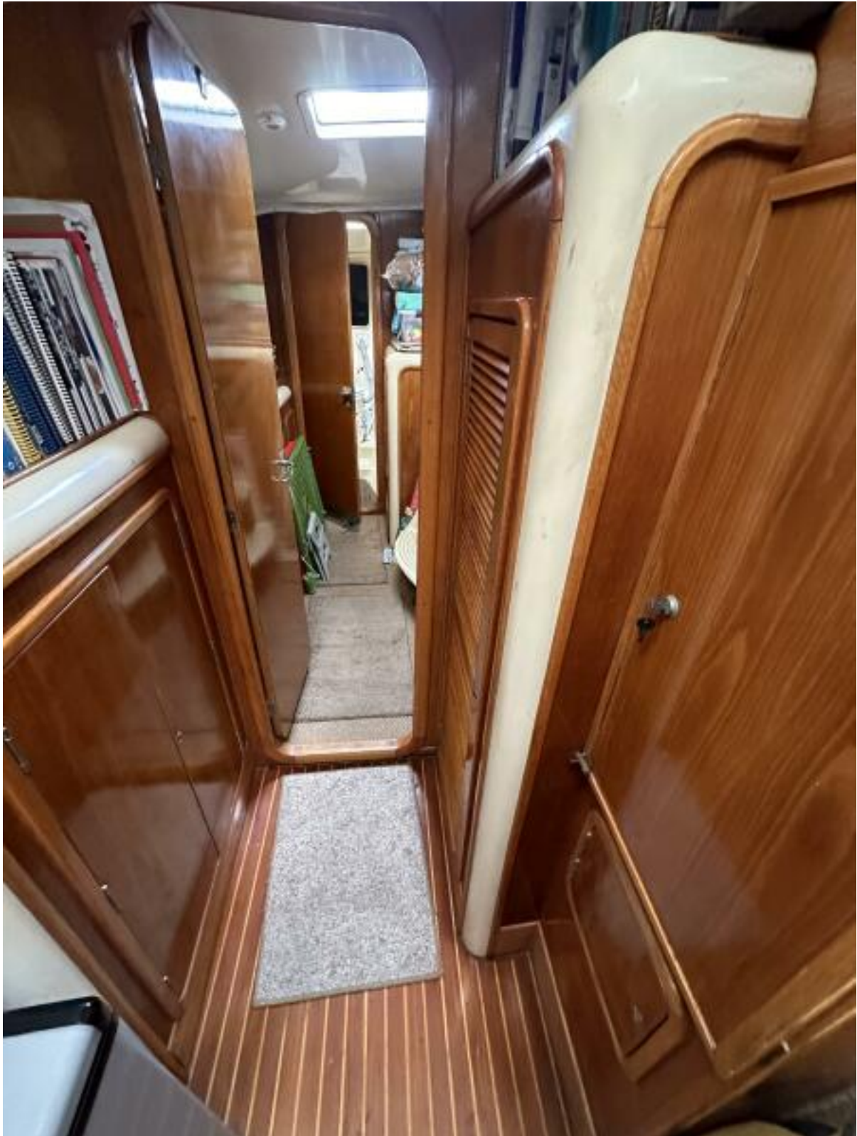
Port Hallway Facing 1