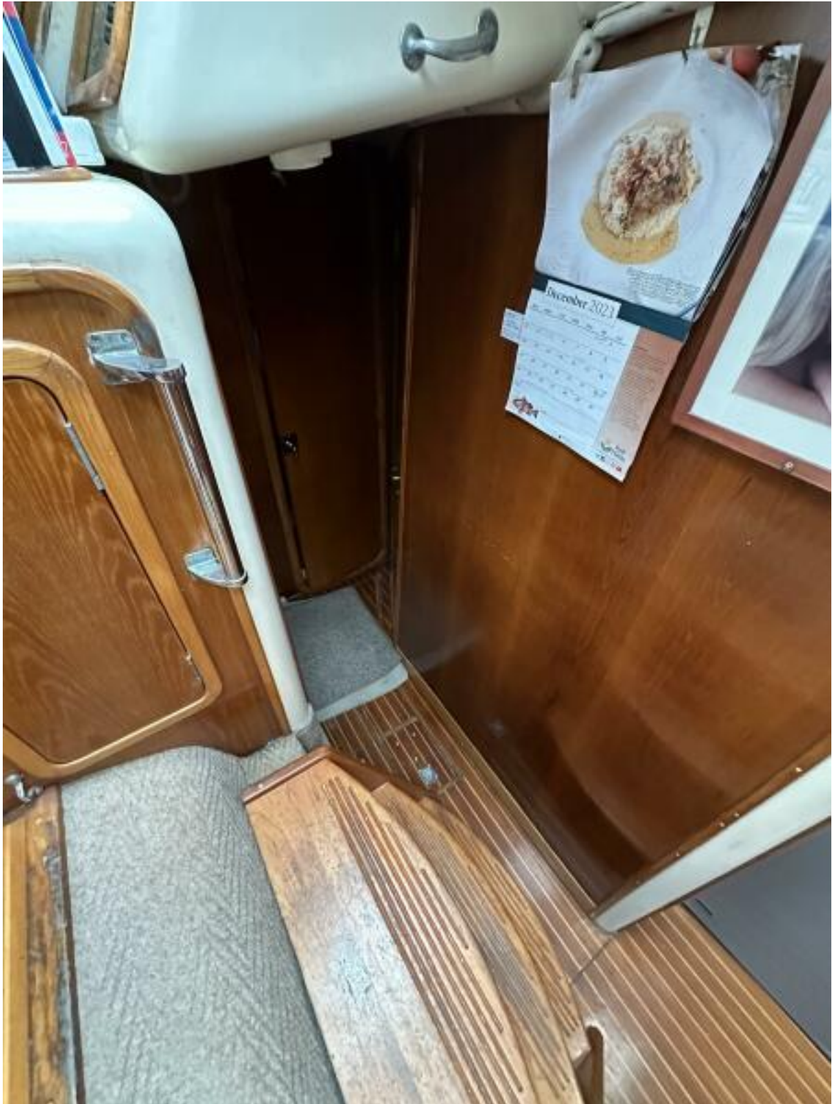
Port Hallway Facing Aft