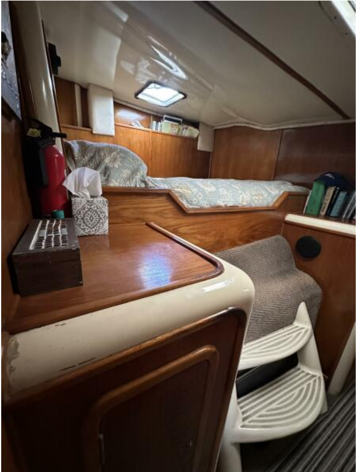
Starboard Owners Suite 3