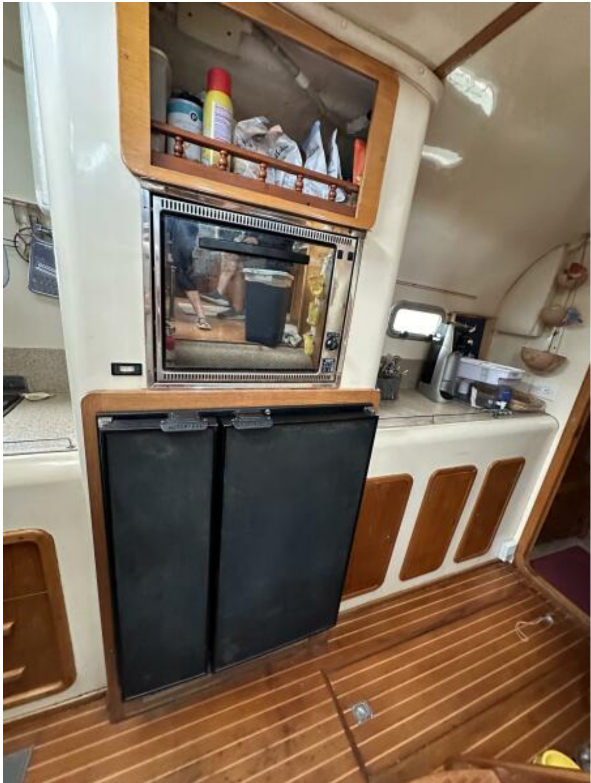
Starboard Galley 5