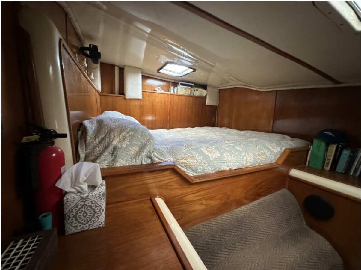
Starboard Owners Suite Head 5