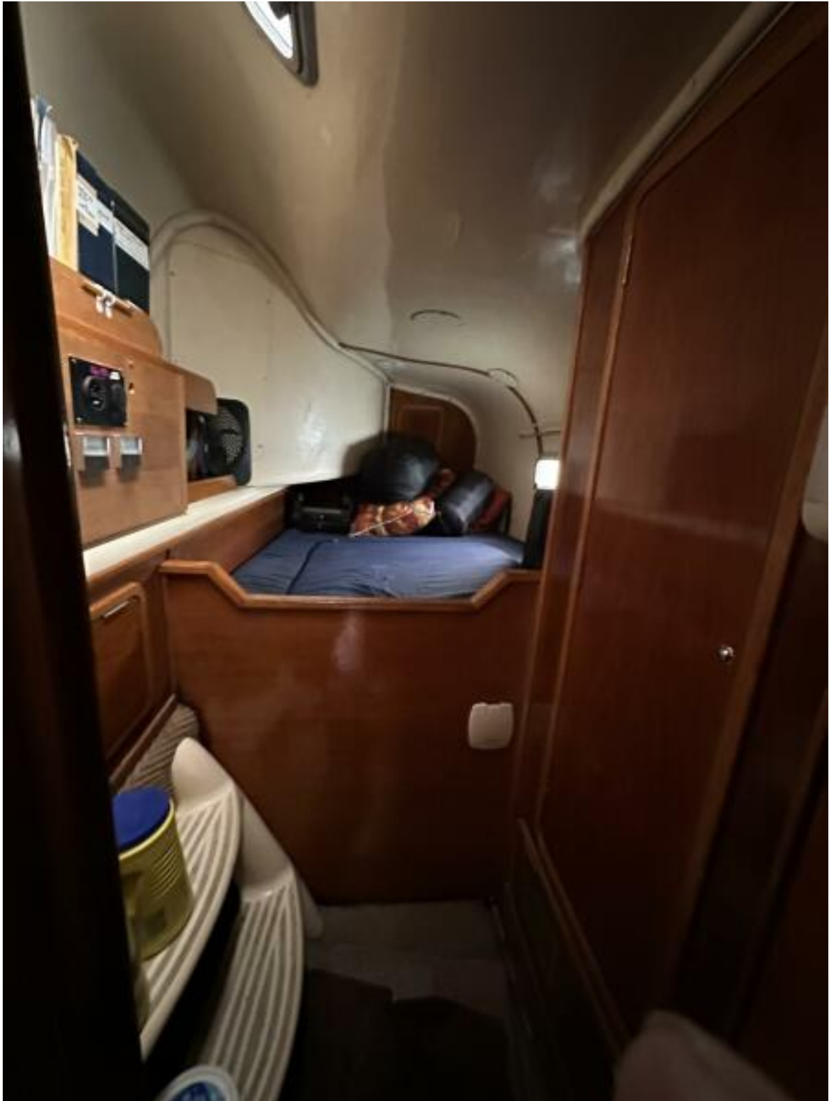
Port Aft Berth