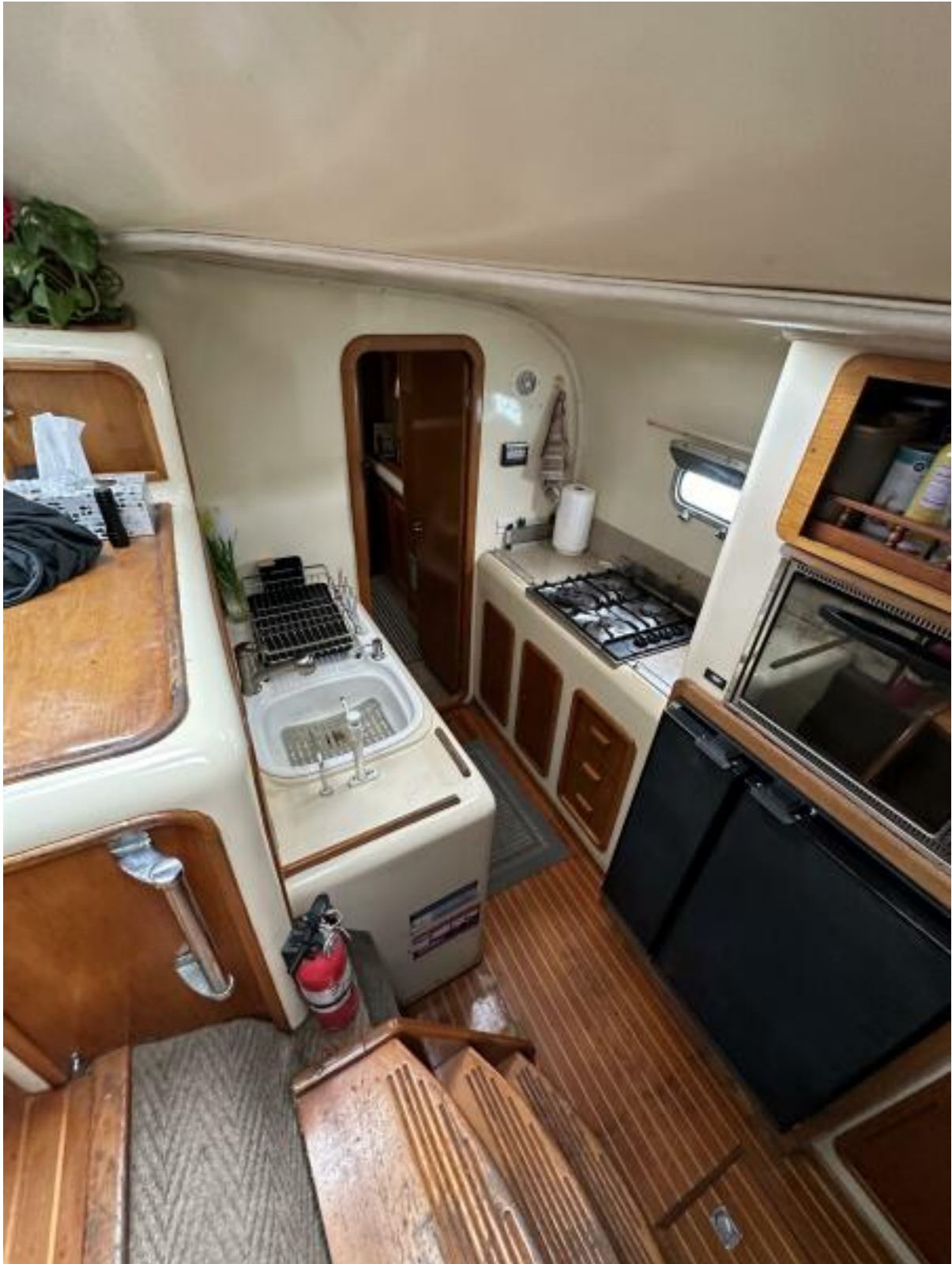
Starboard Galley 1