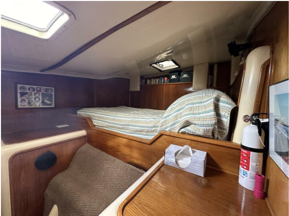
Port Forward Berth 1