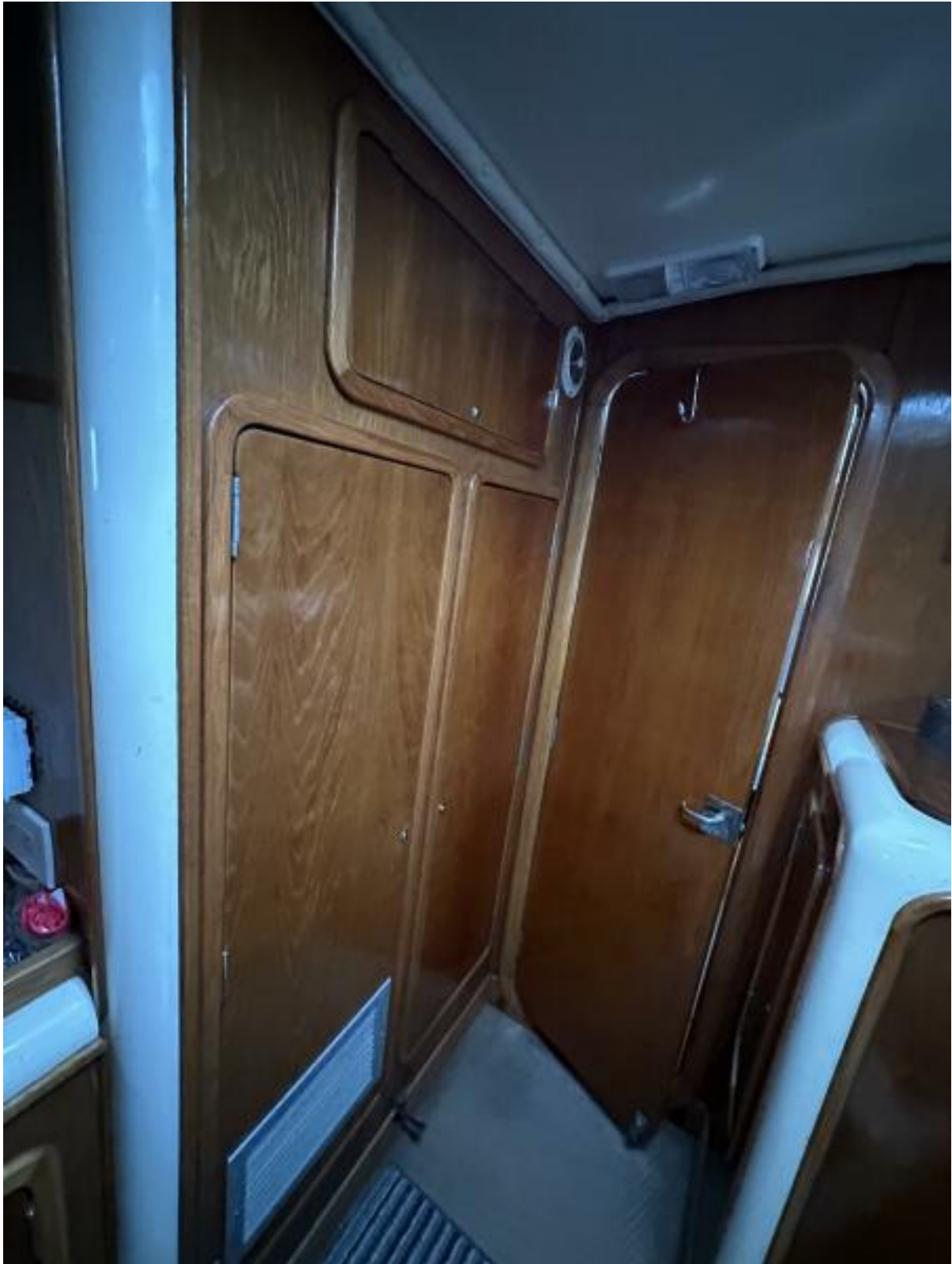
Starboard Owners Suite Hull Side 2