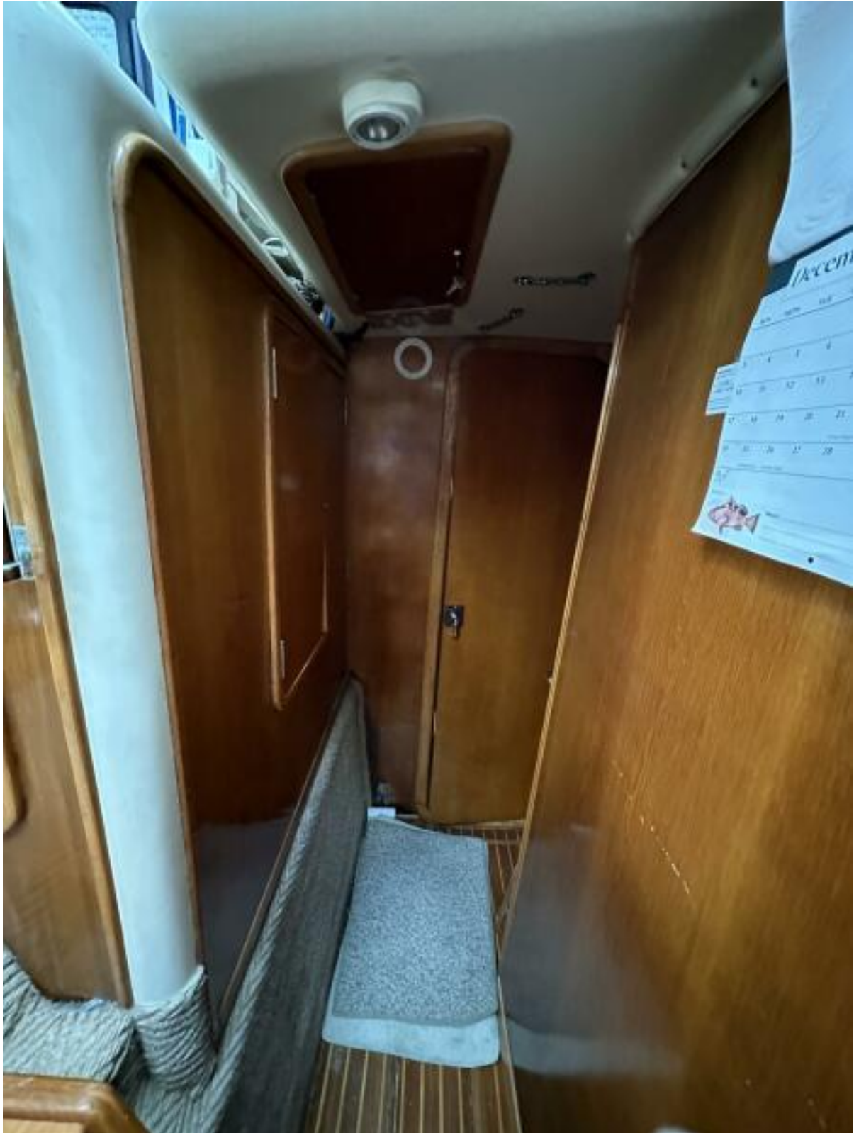
Port Hallway Facing Aft 2