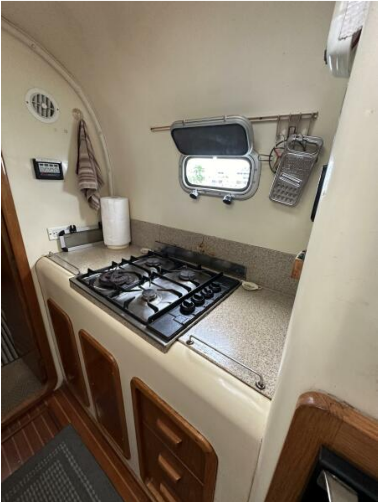
Starboard Galley 4