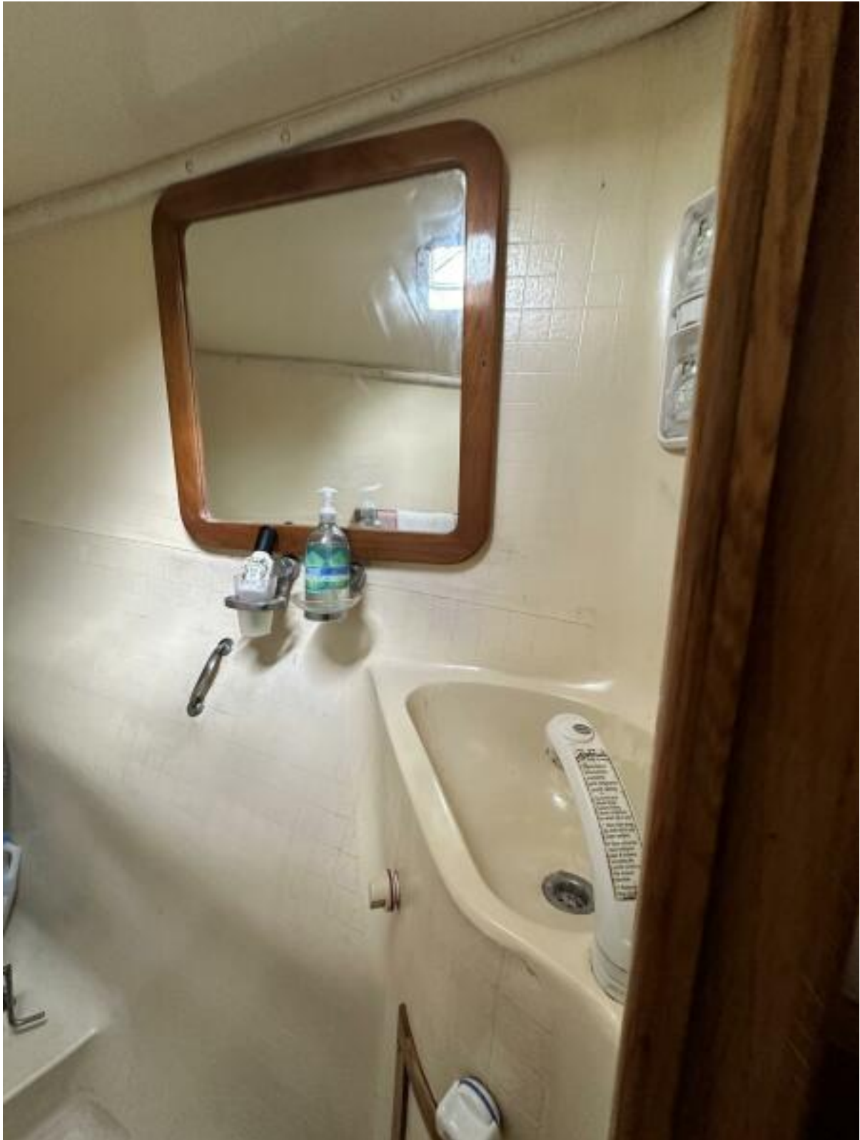
Port Forward Berth Head 2