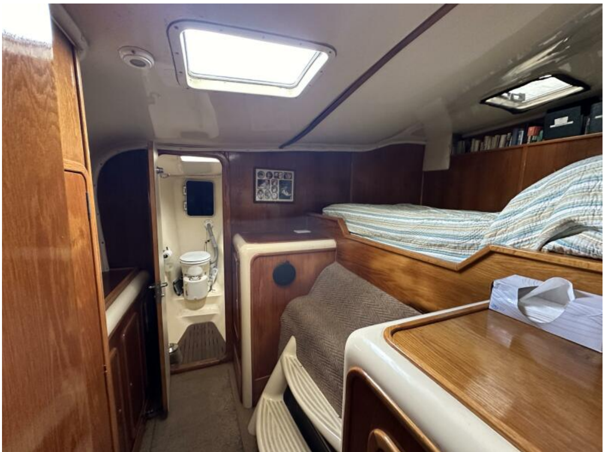
Port Forward Berth 2