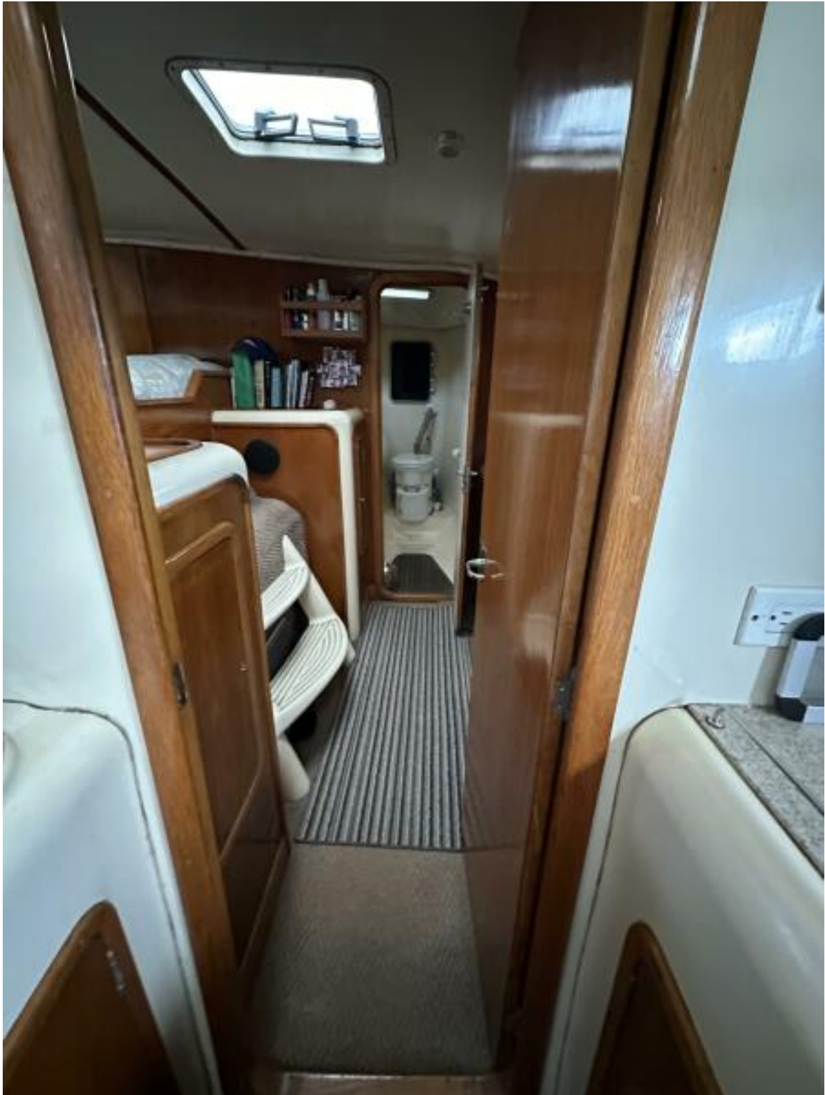
Starboard Entrance To Owners Suite 1