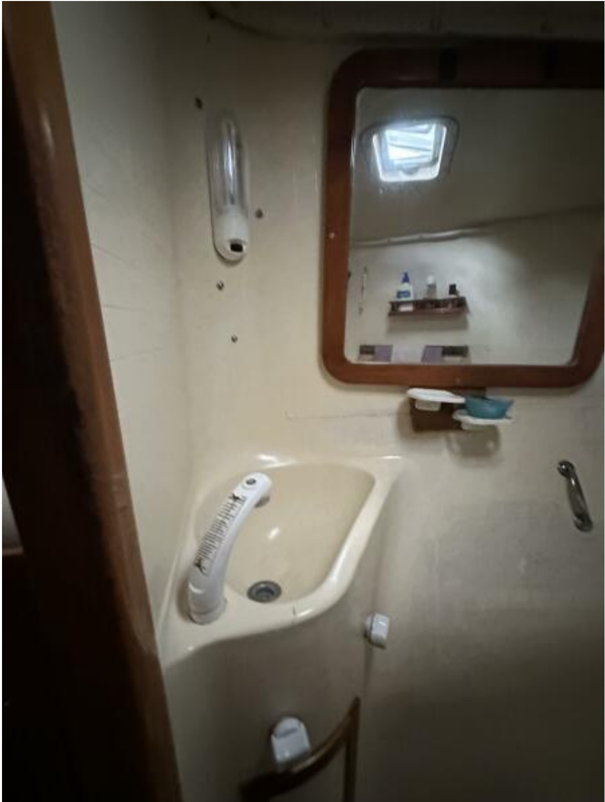
Starboard Owners Suite Head 2