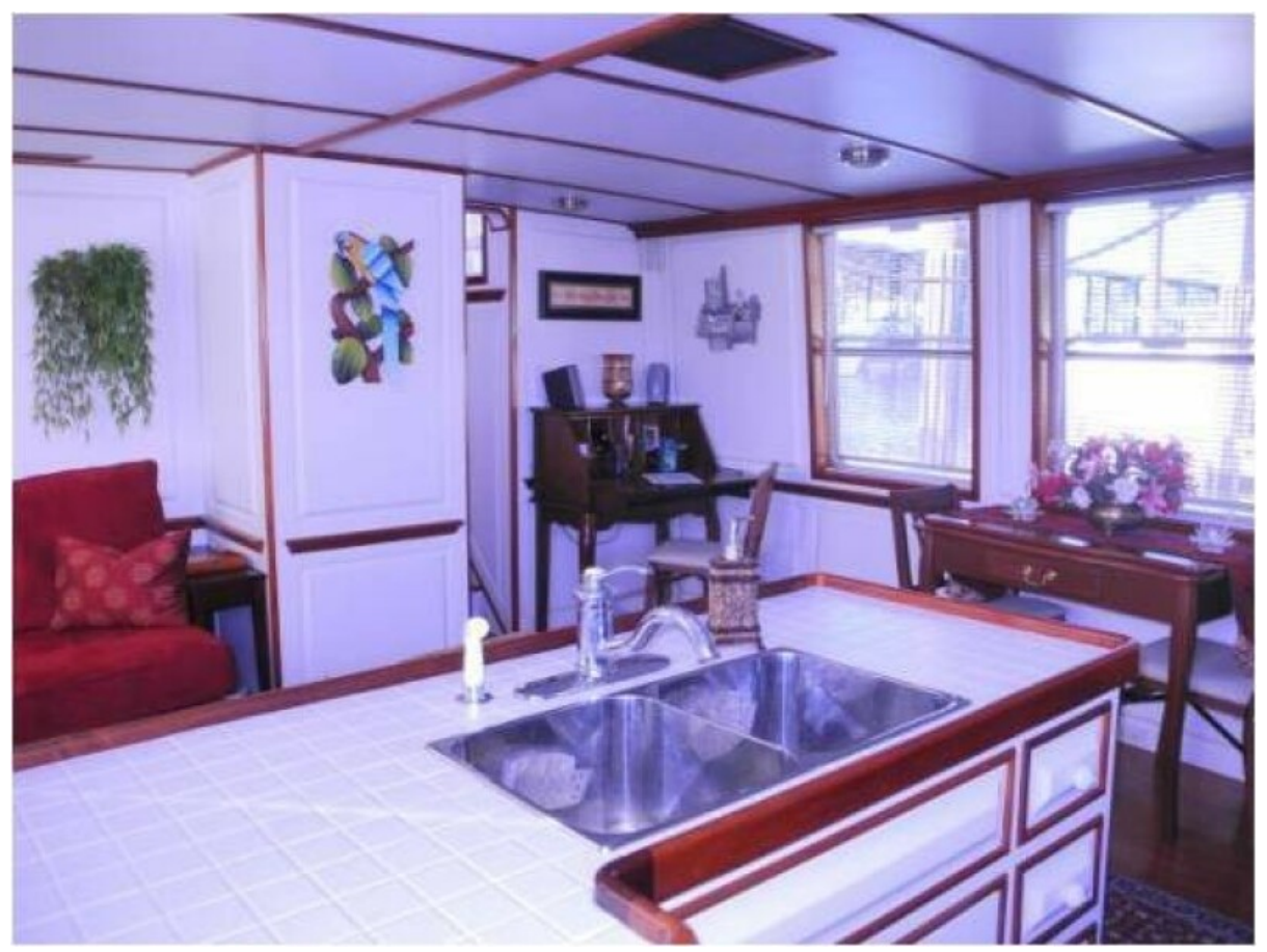
Used Power Monohull for sale 1997 CUSTOM Florida Bay Coaster - WATERLILLY