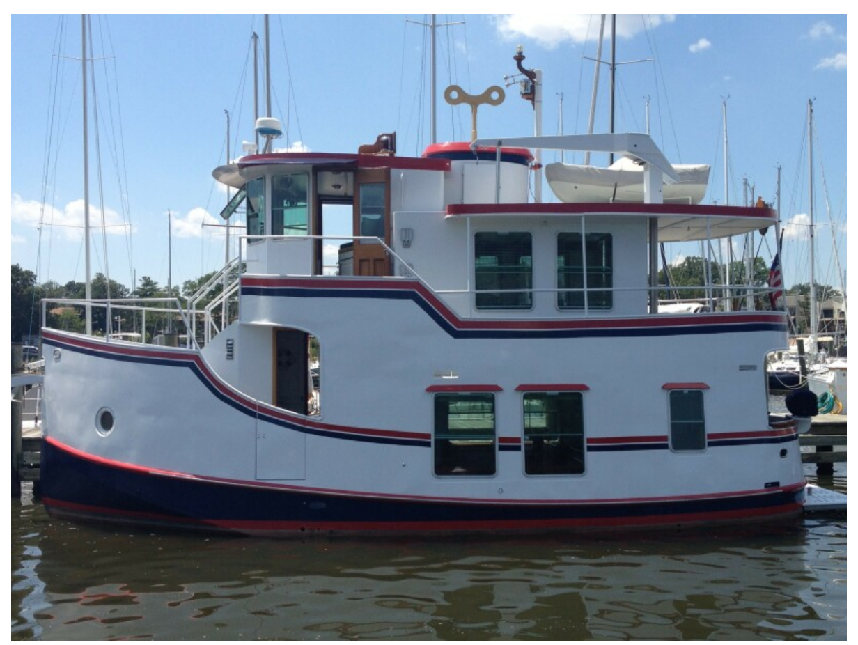
Used Power Monohull for sale 1997 CUSTOM Florida Bay Coaster - WATERLILLY