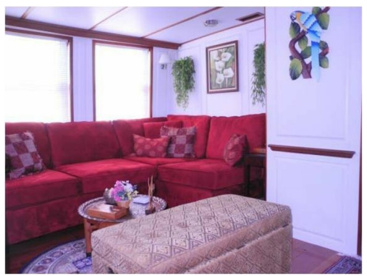
Used Power Monohull for sale 1997 CUSTOM Florida Bay Coaster - WATERLILLY