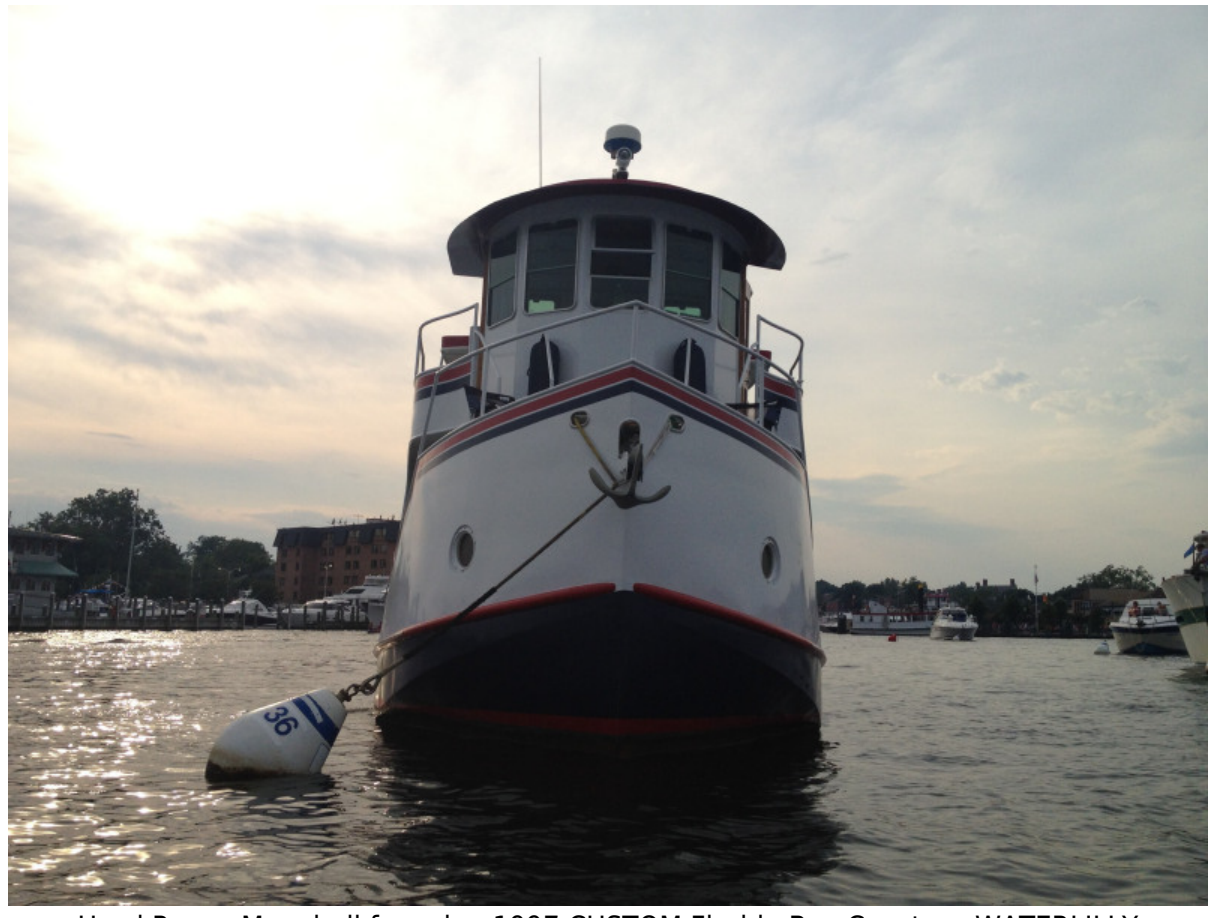
Used Power Monohull for sale 1997 CUSTOM Florida Bay Coaster - WATERLILLY