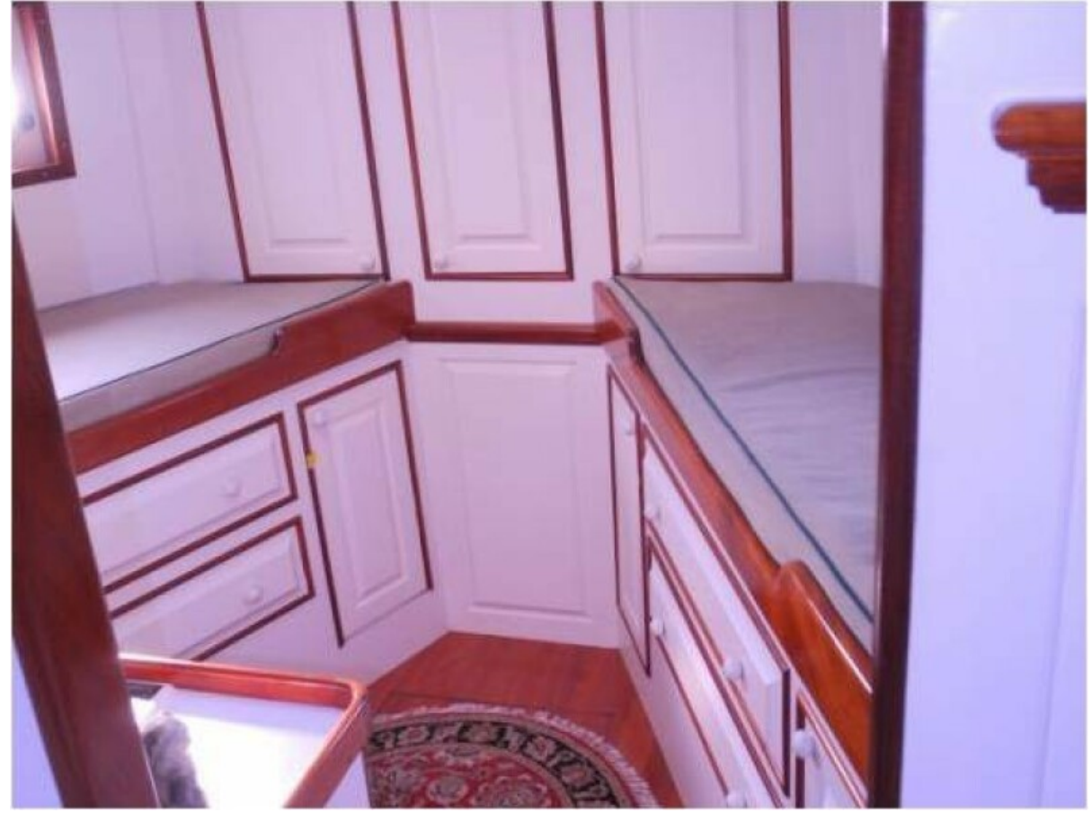
Used Power Monohull for sale 1997 CUSTOM Florida Bay Coaster - WATERLILLY