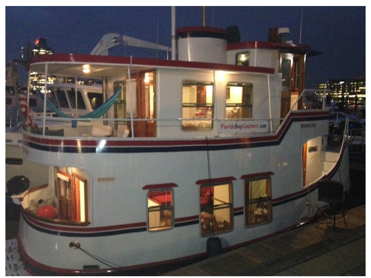
Used Power Monohull for sale 1997 CUSTOM Florida Bay Coaster - WATERLILLY