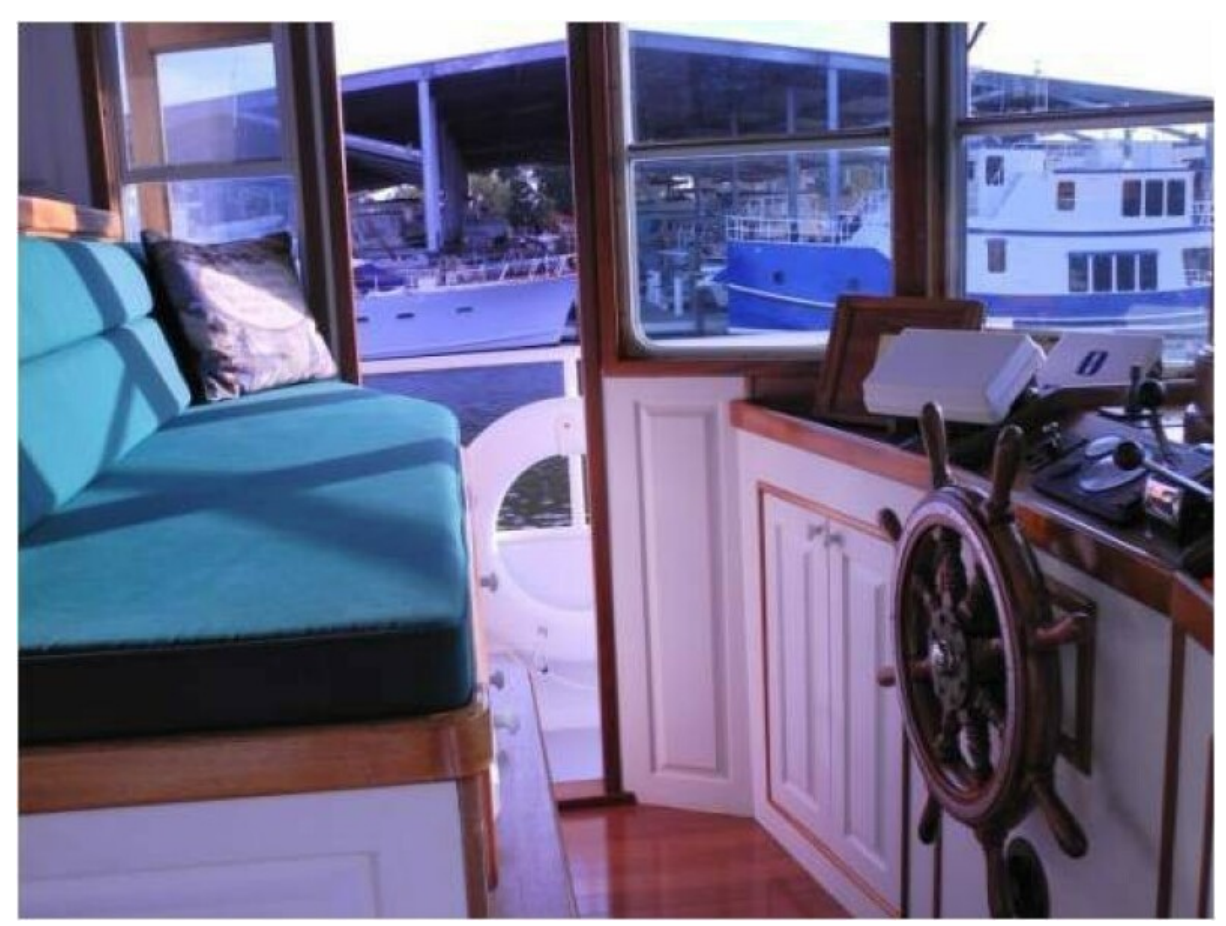
Used Power Monohull for sale 1997 CUSTOM Florida Bay Coaster - WATERLILLY