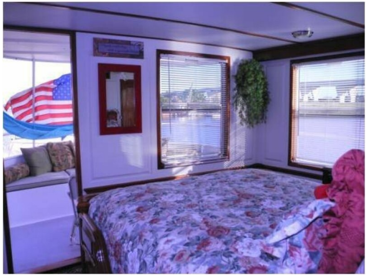
Used Power Monohull for sale 1997 CUSTOM Florida Bay Coaster - WATERLILLY