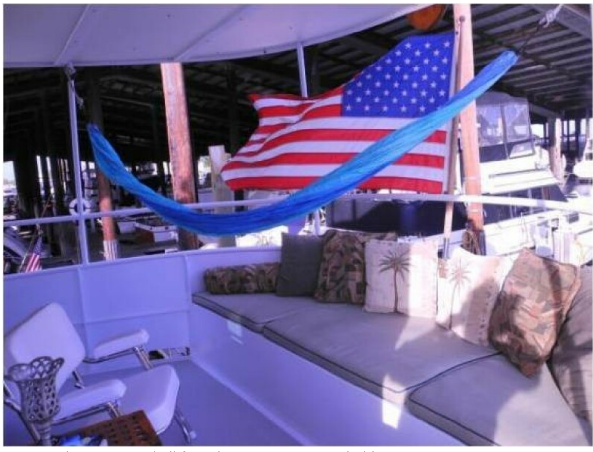
Used Power Monohull for sale 1997 CUSTOM Florida Bay Coaster - WATERLILLY