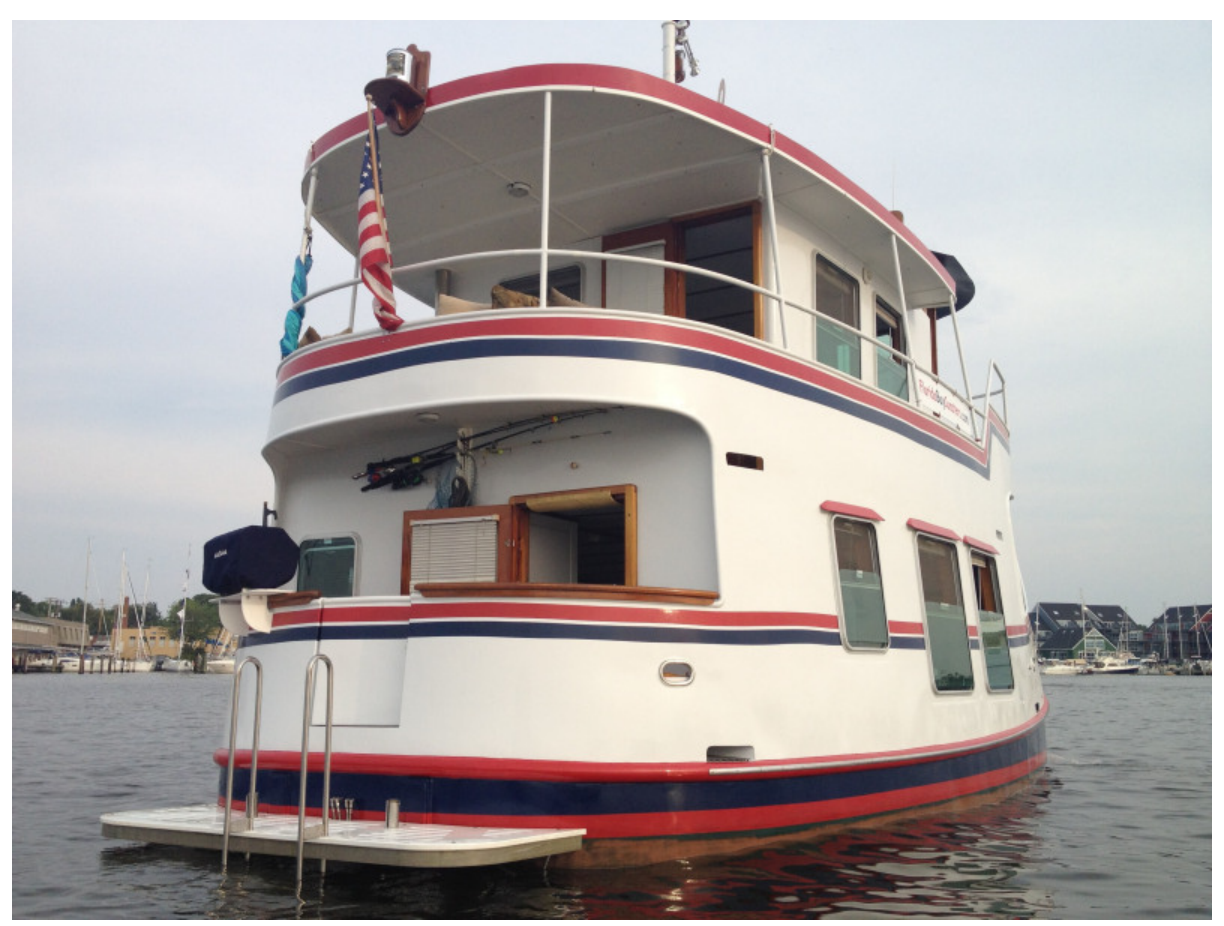
Used Power Monohull for sale 1997 CUSTOM Florida Bay Coaster - WATERLILLY