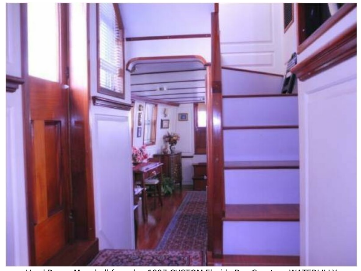
Used Power Monohull for sale 1997 CUSTOM Florida Bay Coaster - WATERLILLY