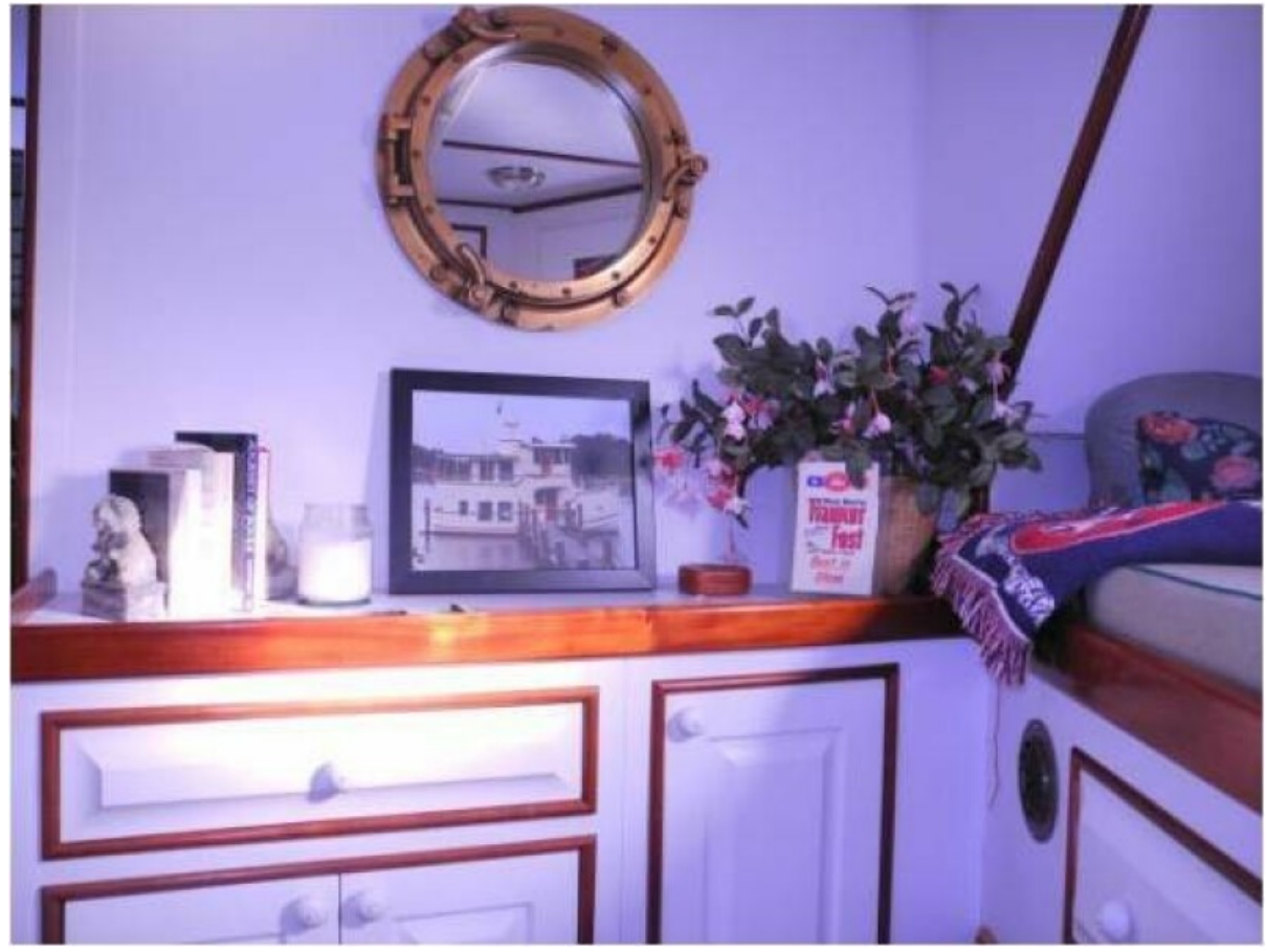
Used Power Monohull for sale 1997 CUSTOM Florida Bay Coaster - WATERLILLY