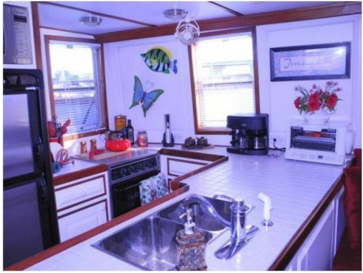
Used Power Monohull for sale 1997 CUSTOM Florida Bay Coaster - WATERLILLY