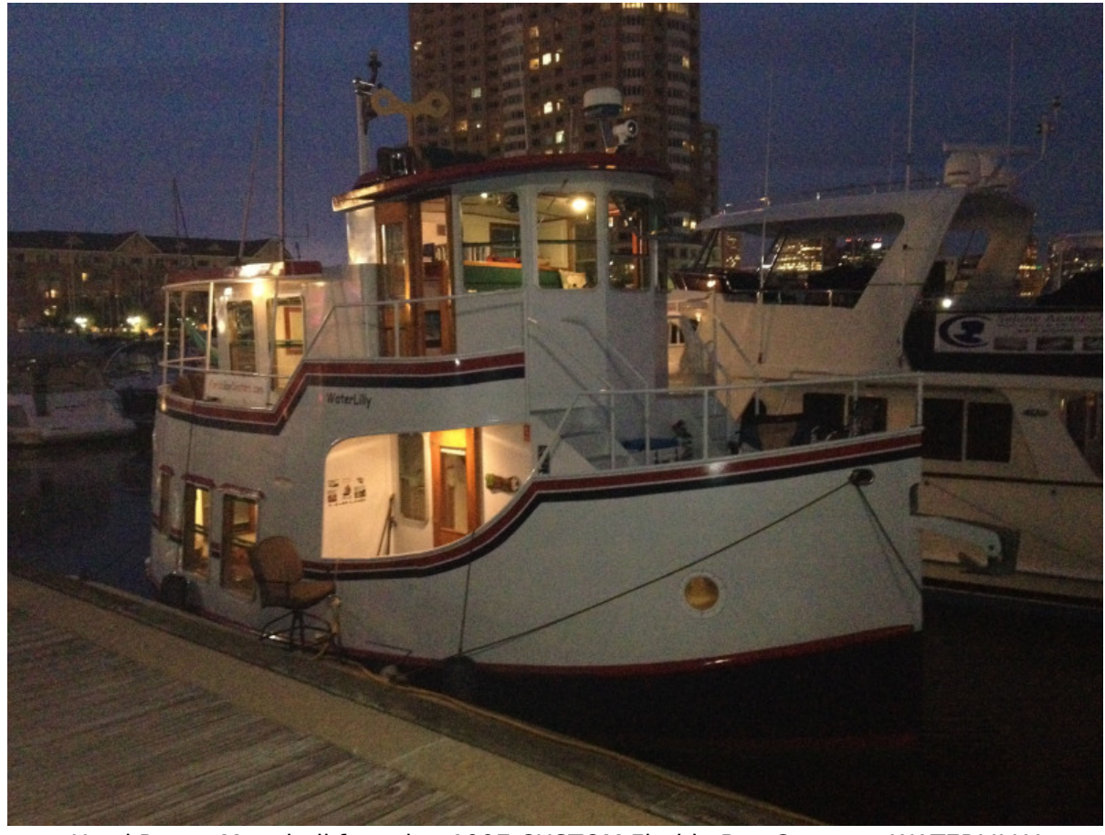
Used Power Monohull for sale 1997 CUSTOM Florida Bay Coaster - WATERLILLY