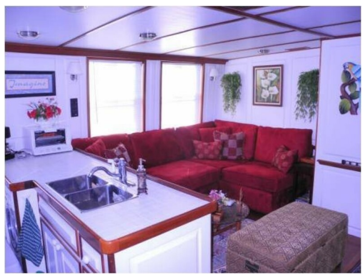
Used Power Monohull for sale 1997 CUSTOM Florida Bay Coaster - WATERLILLY