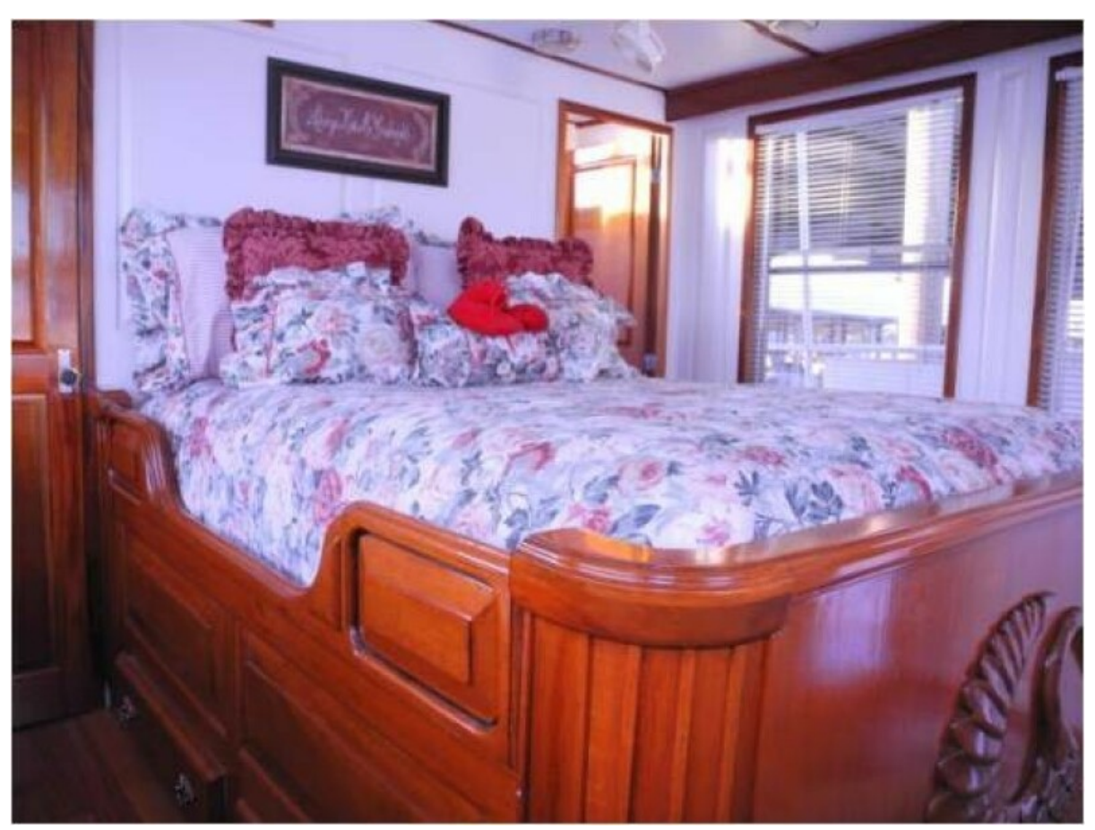
Used Power Monohull for sale 1997 CUSTOM Florida Bay Coaster - WATERLILLY