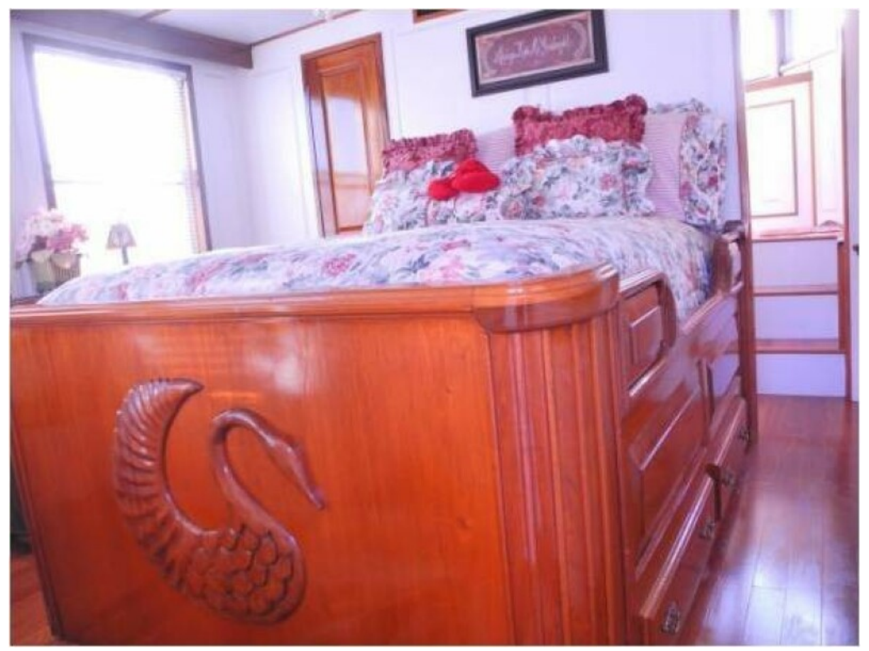
Used Power Monohull for sale 1997 CUSTOM Florida Bay Coaster - WATERLILLY