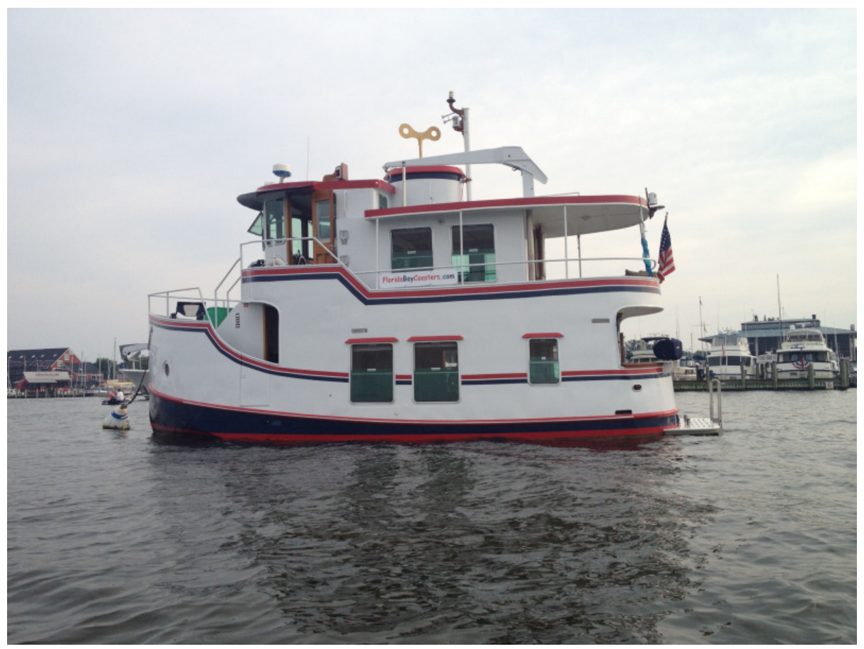
Used Power Monohull for sale 1997 CUSTOM Florida Bay Coaster - WATERLILLY