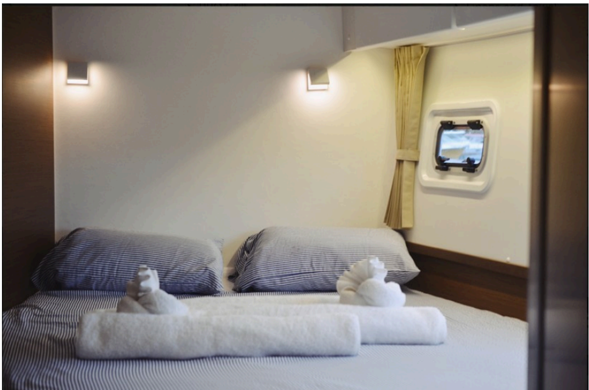
Used Sail Catamaran for sale 2018 Lagoon 42 - ORION