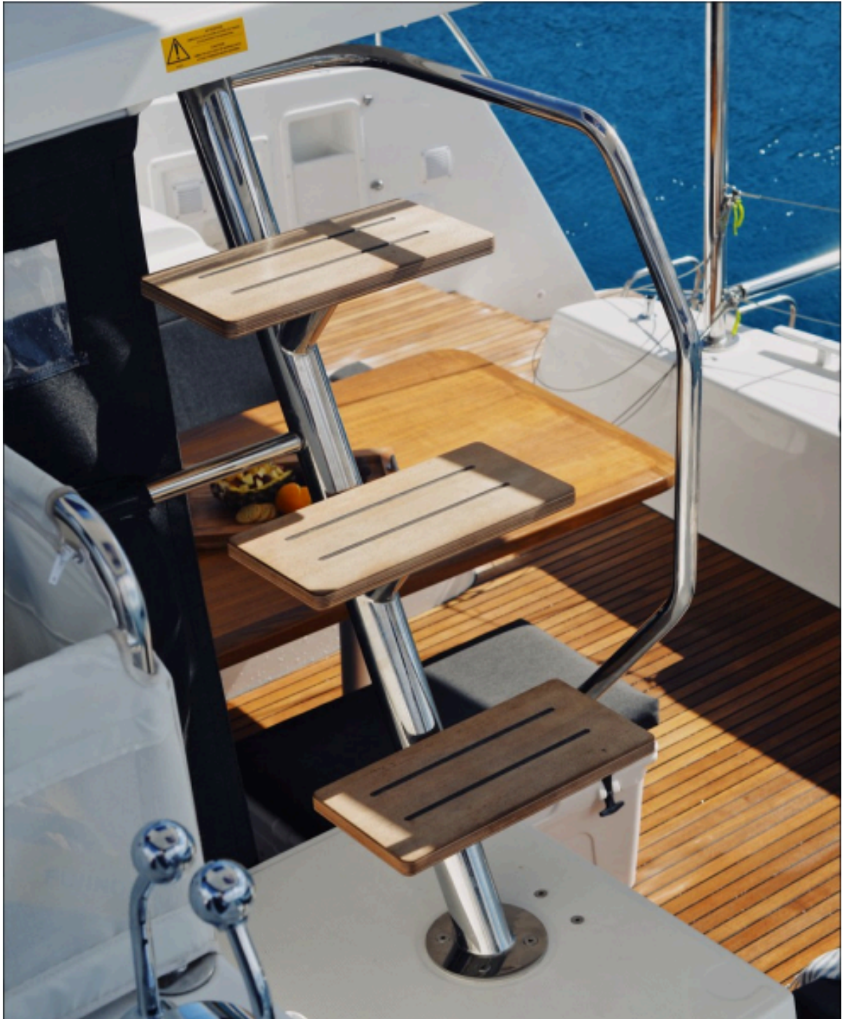
Used Sail Catamaran for sale 2018 Lagoon 42 - ORION