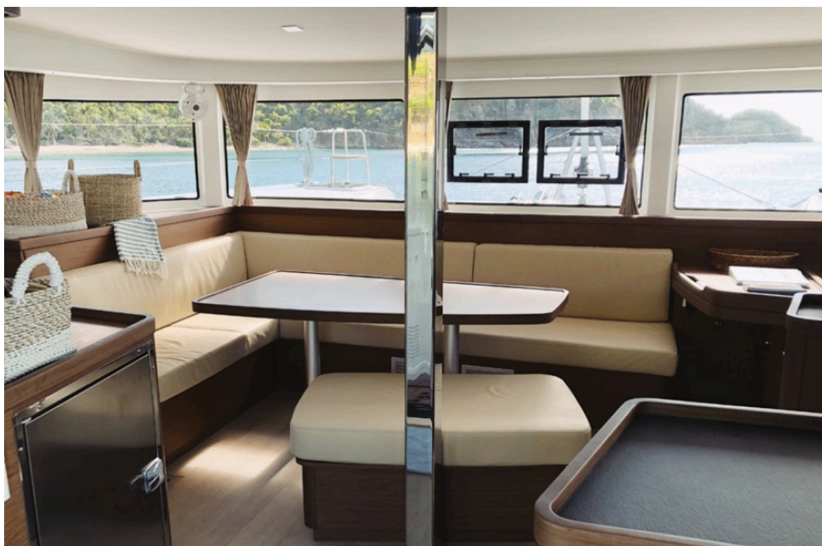
Used Sail Catamaran for sale 2018 Lagoon 42 - ORION