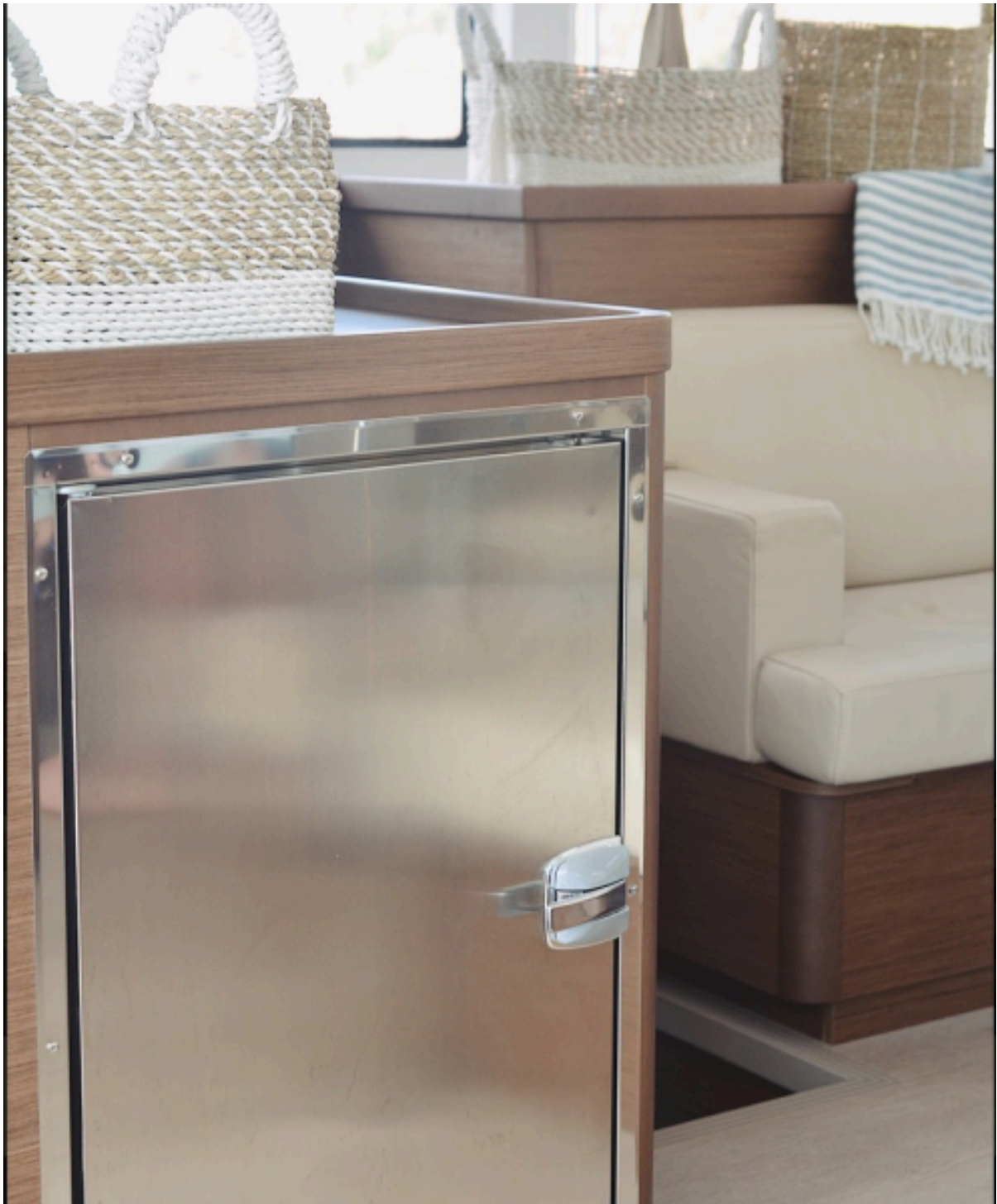
Used Sail Catamaran for sale 2018 Lagoon 42 - ORION