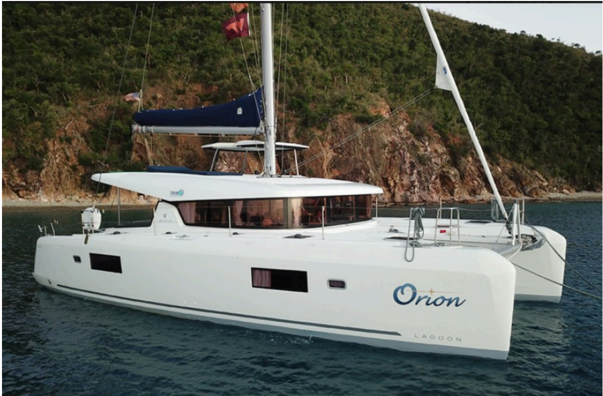
Used Sail Catamaran for sale 2018 Lagoon 42 - ORION