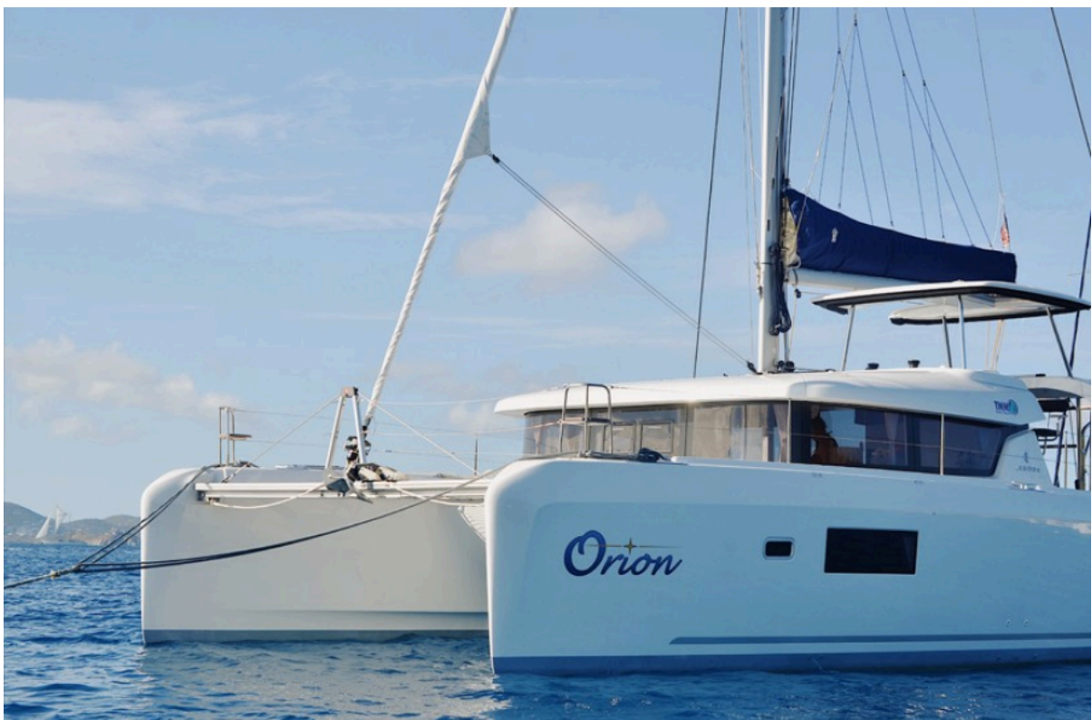
Used Sail Catamaran for sale 2018 Lagoon 42 - ORION