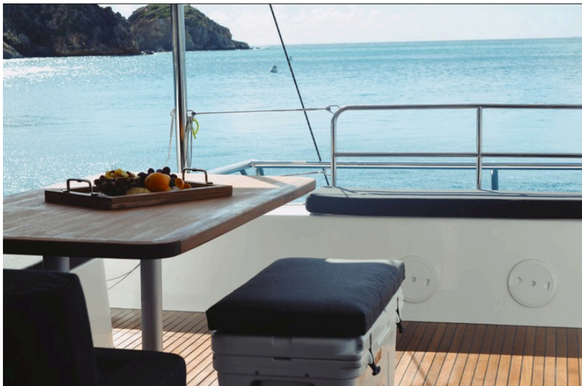
Used Sail Catamaran for sale 2018 Lagoon 42 - ORION