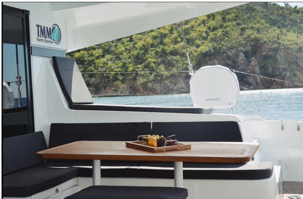
Used Sail Catamaran for sale 2018 Lagoon 42 - ORION