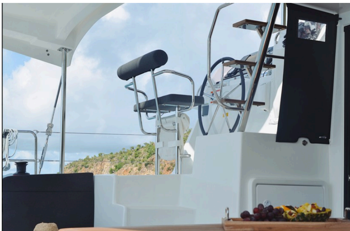
Used Sail Catamaran for sale 2018 Lagoon 42 - ORION