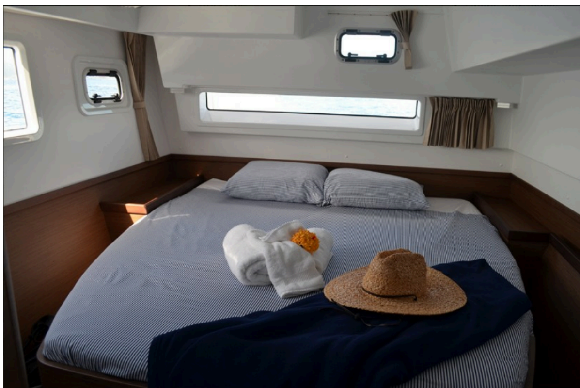
Used Sail Catamaran for sale 2018 Lagoon 42 - ORION