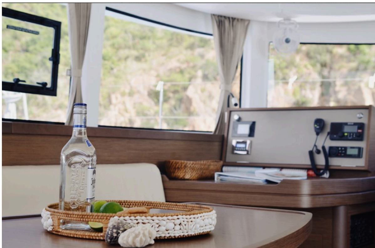
Used Sail Catamaran for sale 2018 Lagoon 42 - ORION