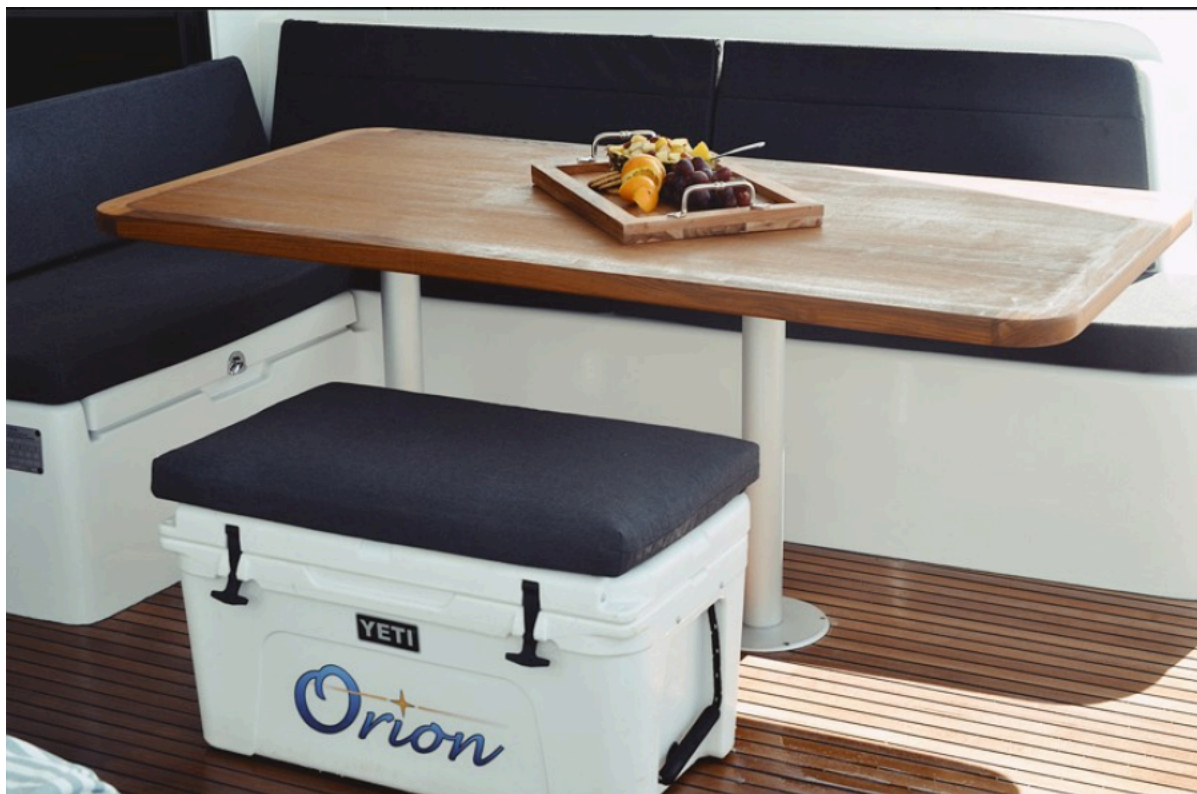
Used Sail Catamaran for sale 2018 Lagoon 42 - ORION