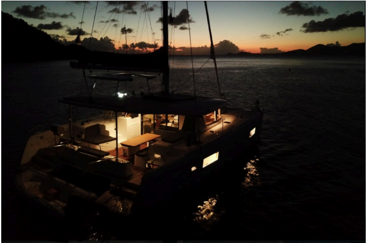
Used Sail Catamaran for sale 2018 Lagoon 42 - ORION