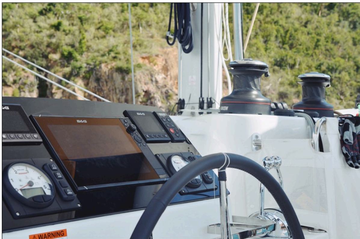
Used Sail Catamaran for sale 2018 Lagoon 42 - ORION