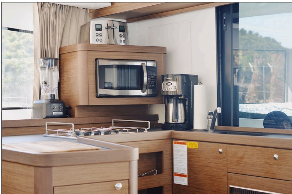
Used Sail Catamaran for sale 2018 Lagoon 42 - ORION