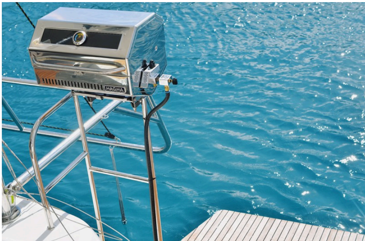
Used Sail Catamaran for sale 2018 Lagoon 42 - ORION