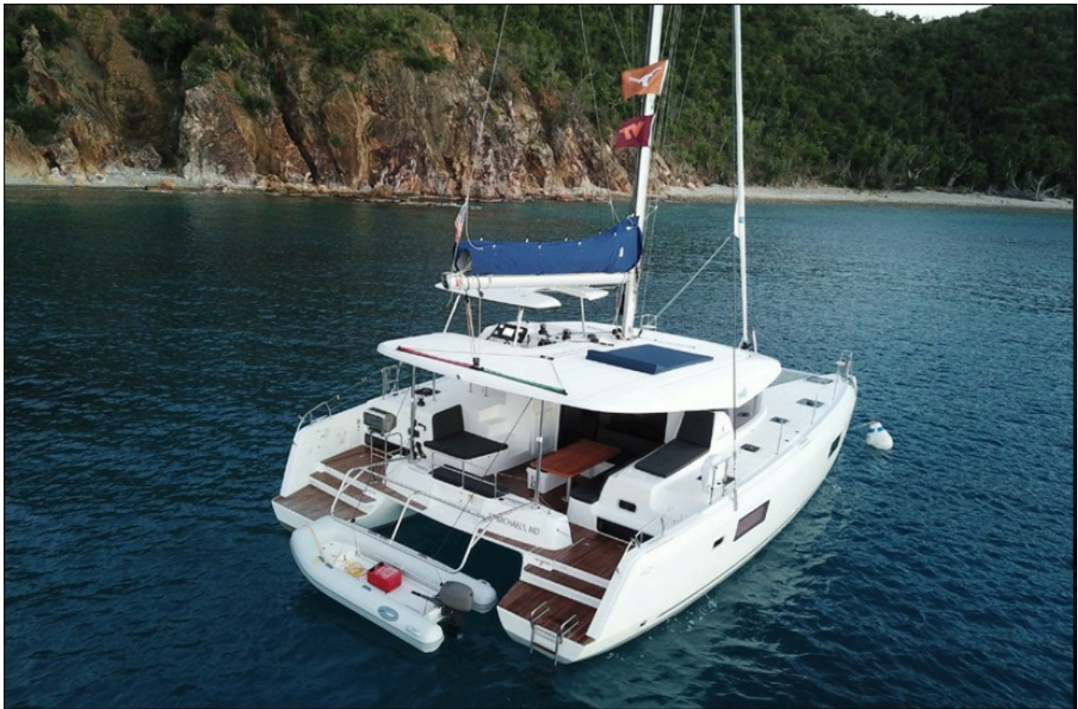
Used Sail Catamaran for sale 2018 Lagoon 42 - ORION