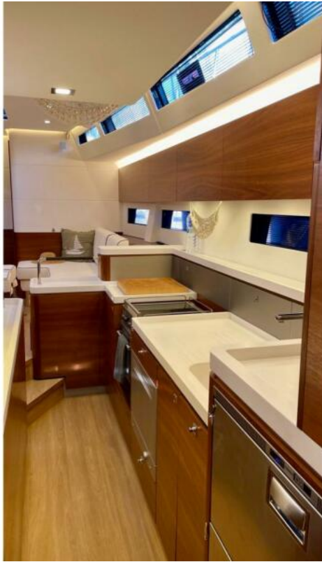
Galley Amel 50