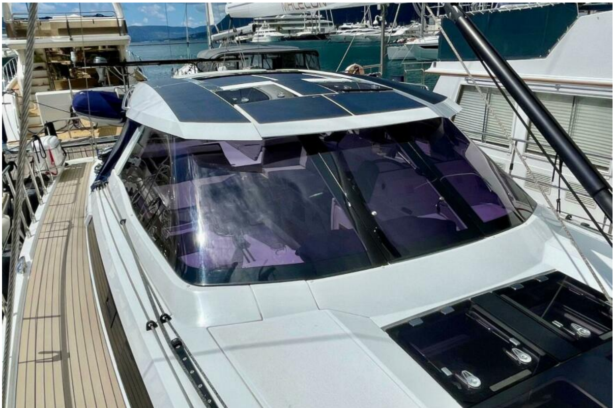
Deck Amel 50