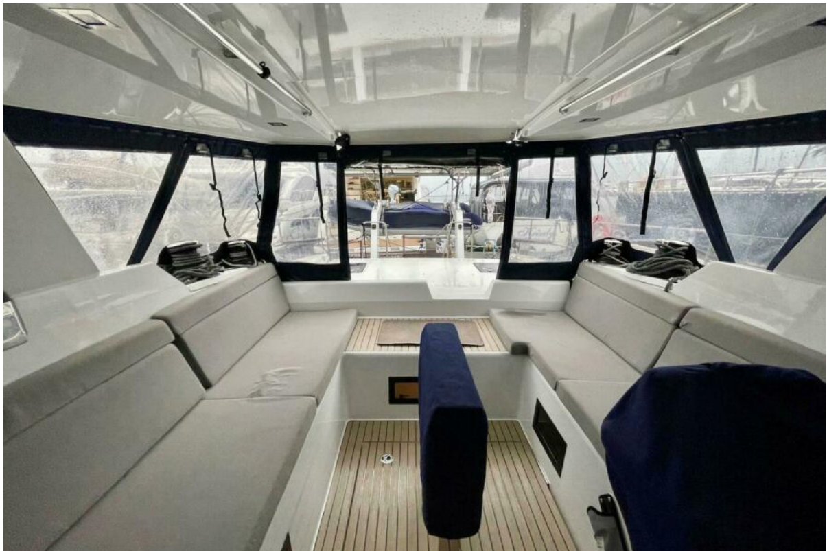
Cockpit Amel 50