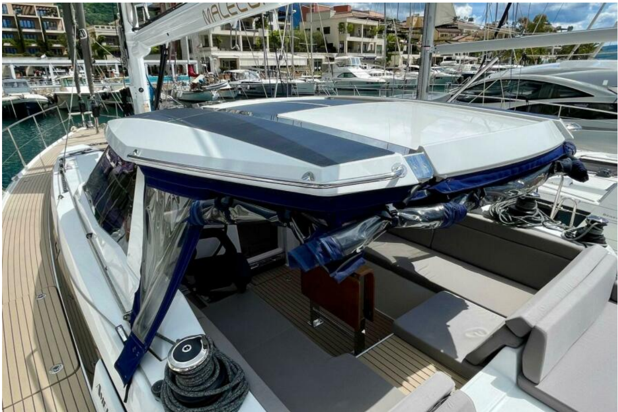
Hard Top Amel 50