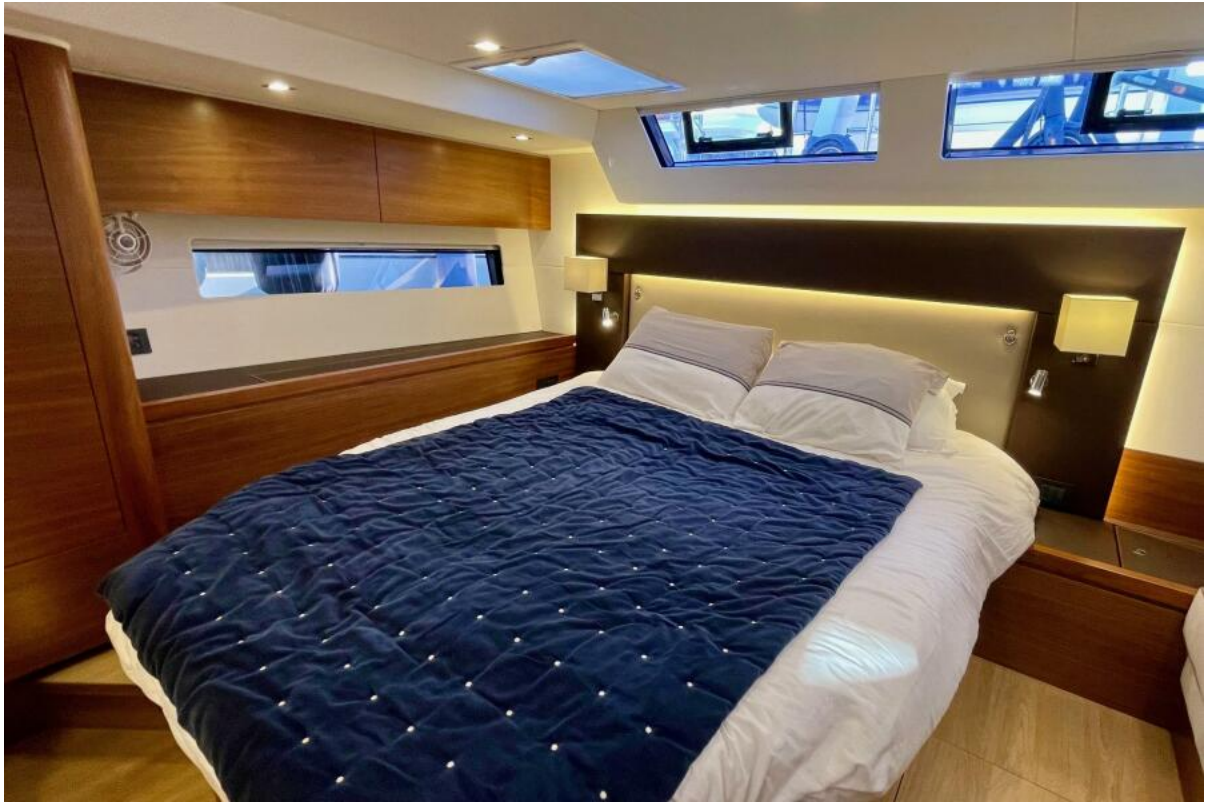
Primary Cabin Amel 50