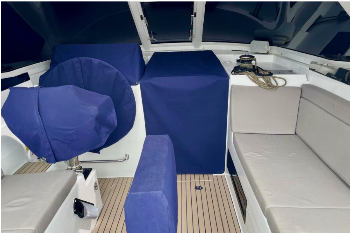
Covered Helm Amel 50