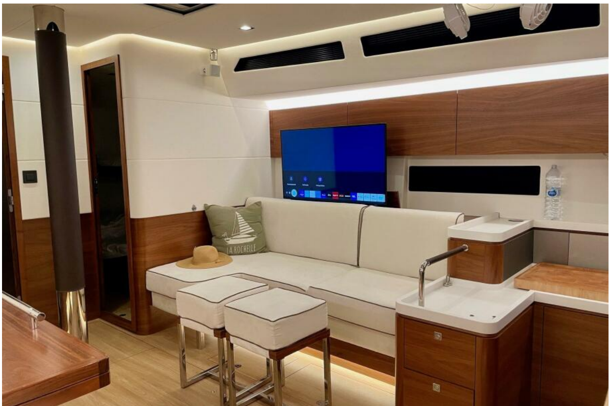
Saloon Amel 50