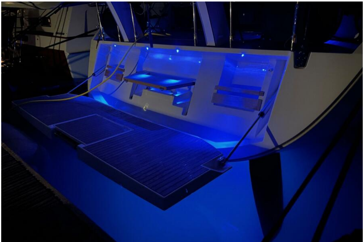
Underwater Lights Amel 50