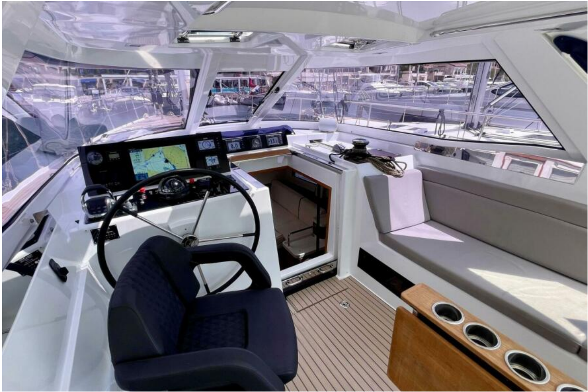
Helm Amel 50