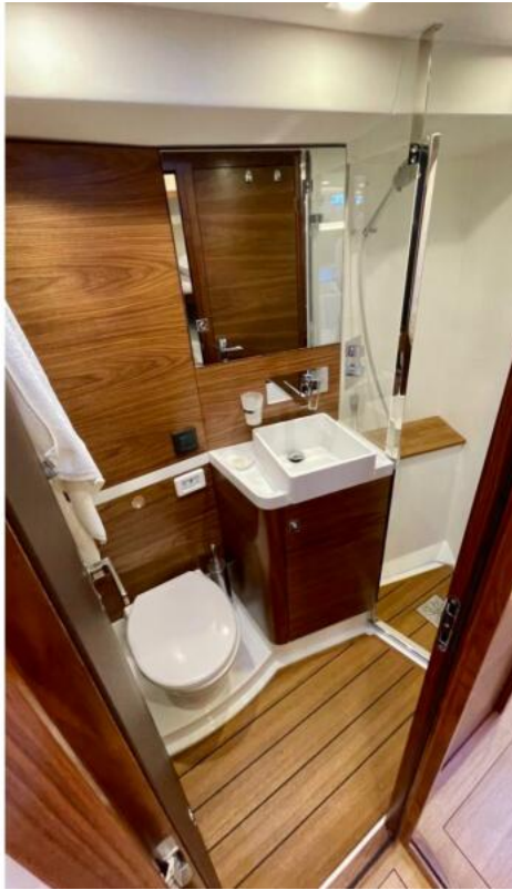
Forward Head Amel 50