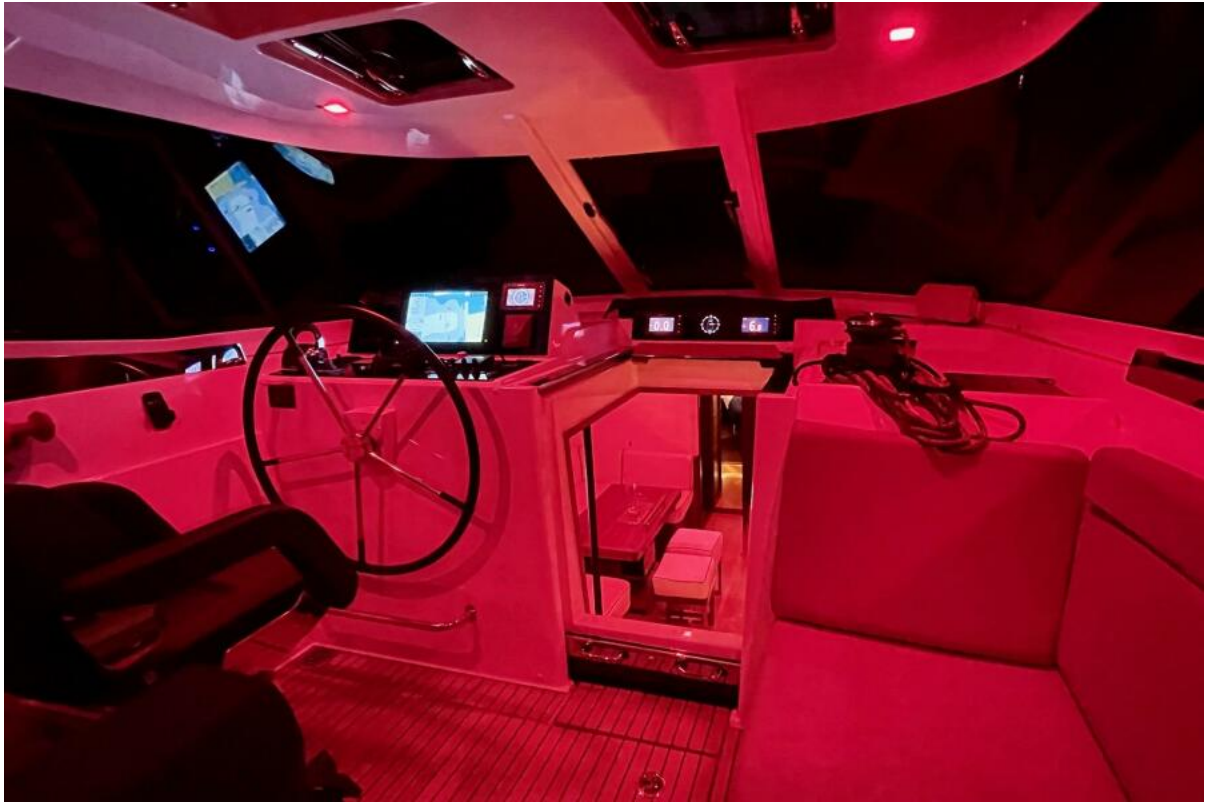
Night Lighting Amel 50