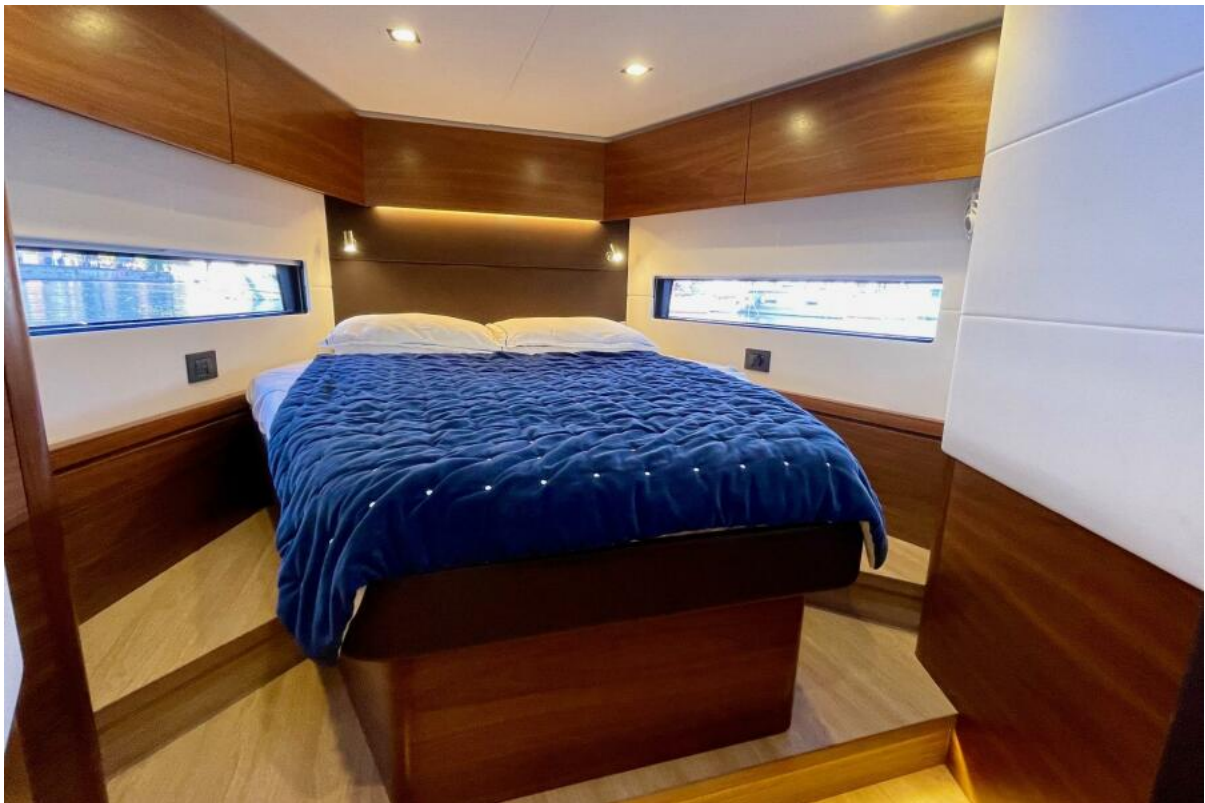
Guest Cabin Amel 50