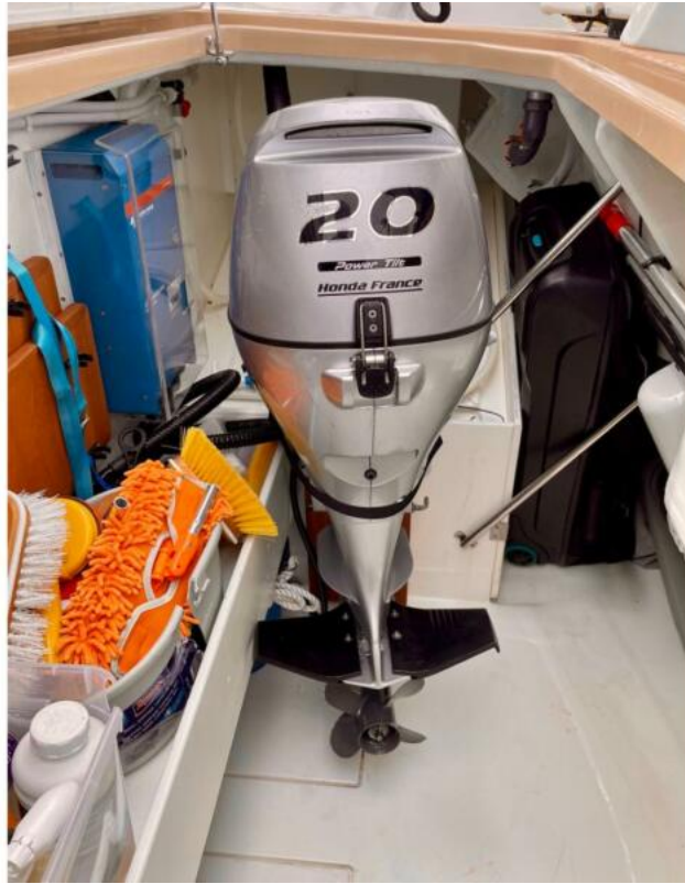
Dinghy Outboard Amel 50