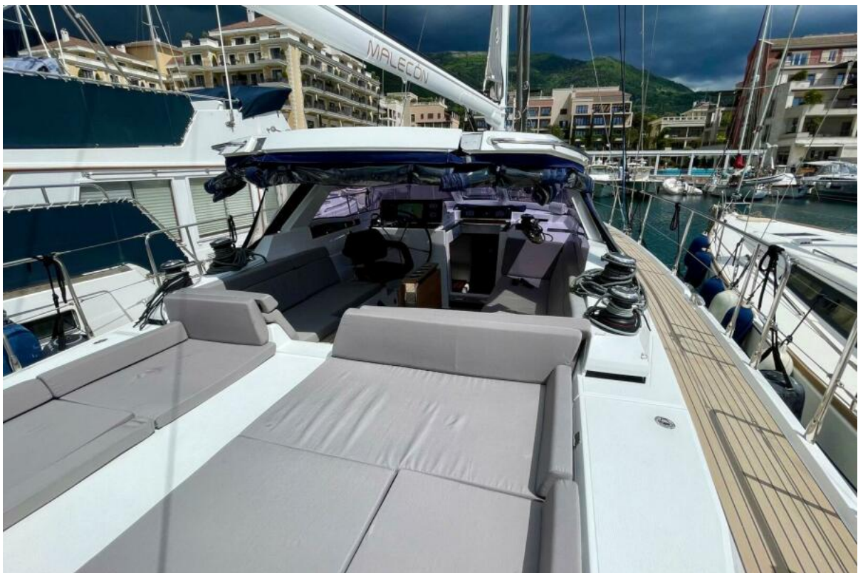
Sun Pad Amel 50