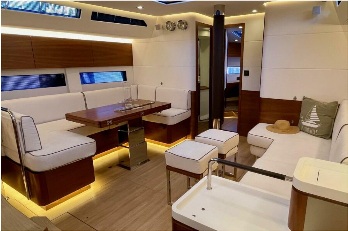
Saloon Amel 50