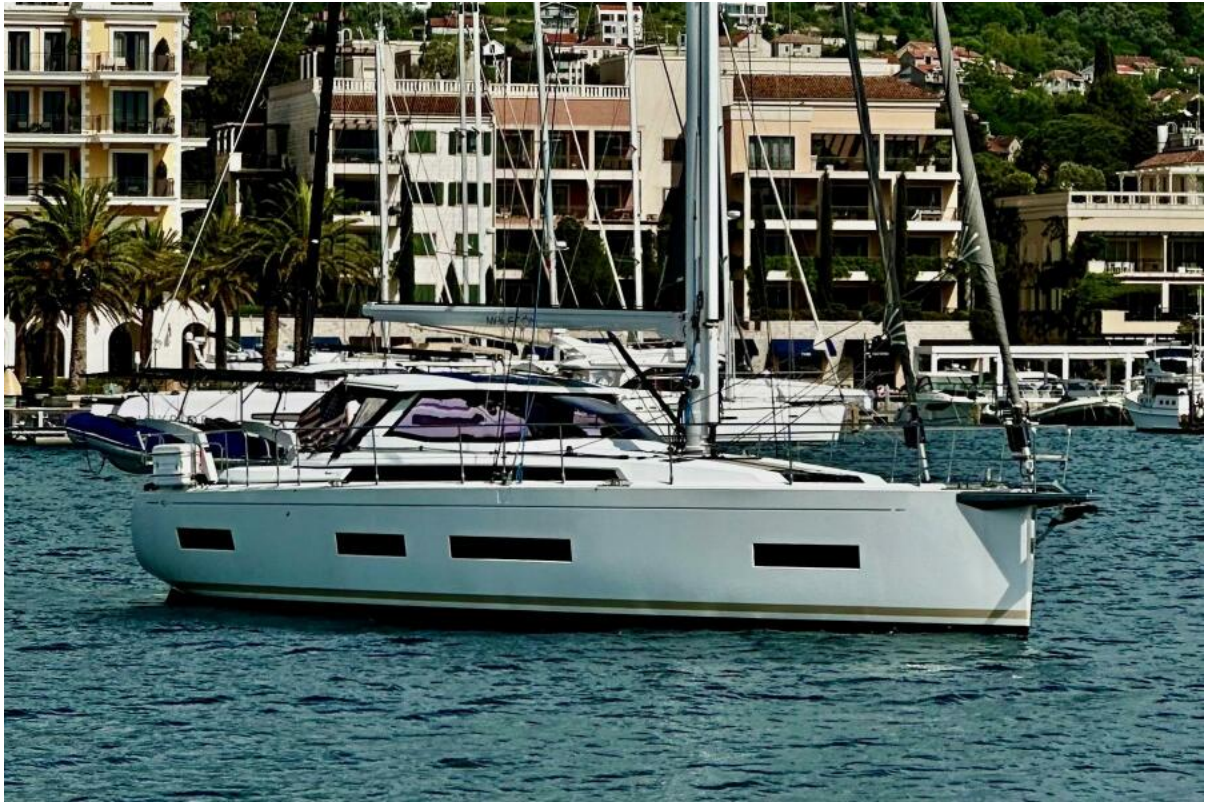
Cruising Amel 50