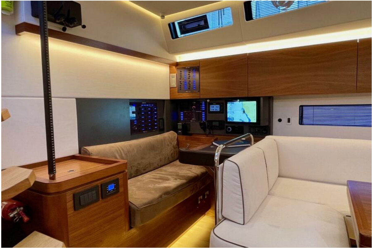
Nav Station Amel 50