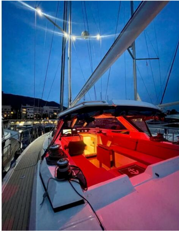
Night Lighting Amel 50