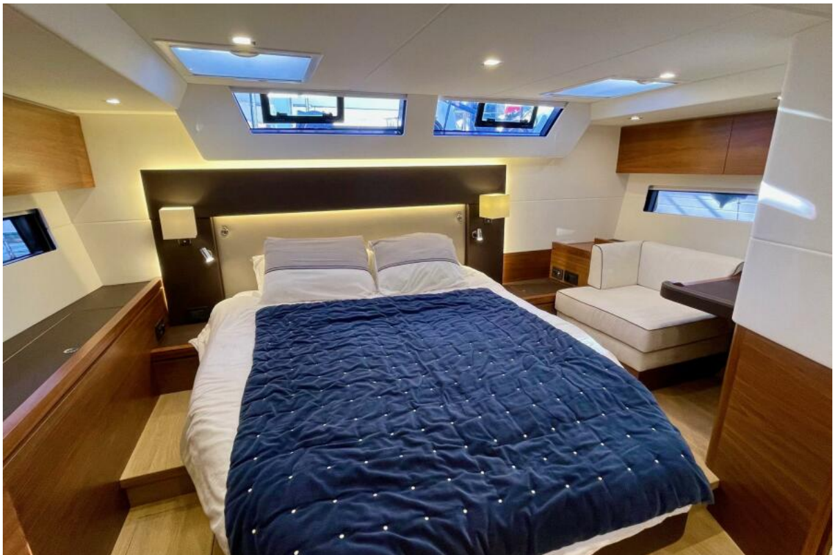
Primary Cabin Amel 50