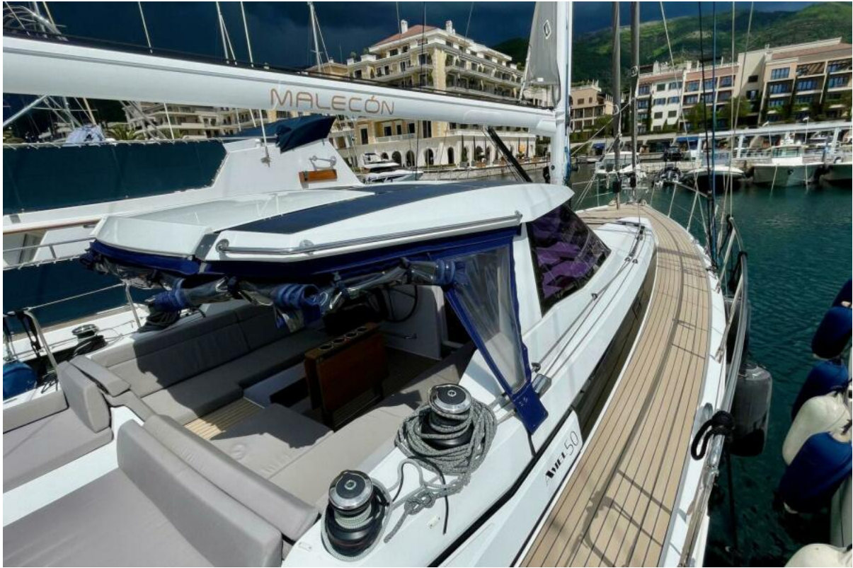
Deck Amel 50