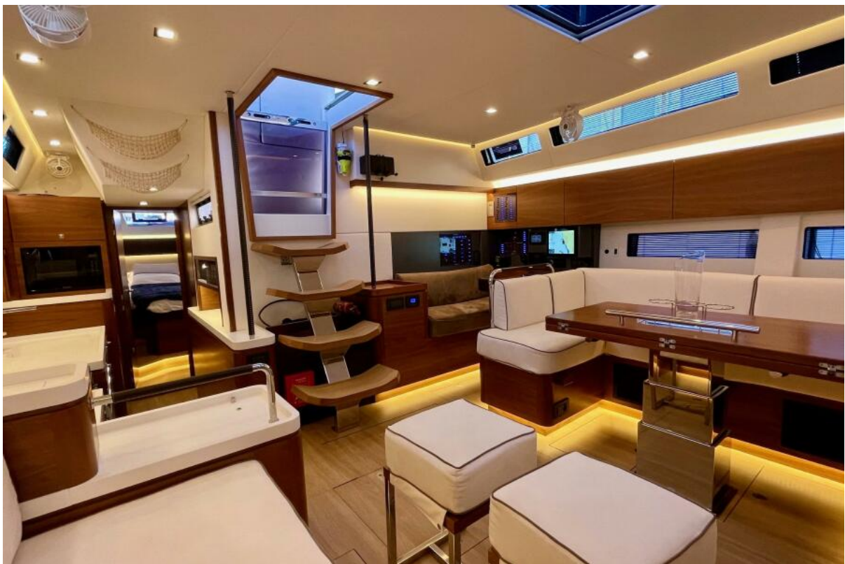
Saloon Amel 50