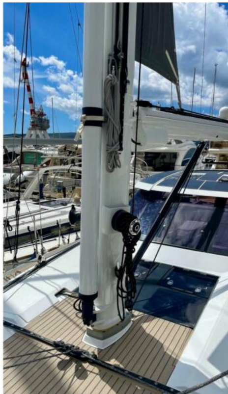
In-Mast Furling Amel 50