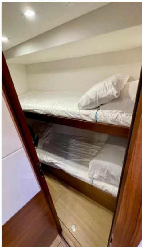
Bunk Cabin Amel 50