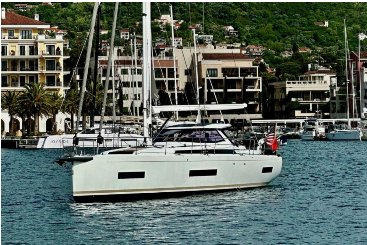
Cruising Amel 50