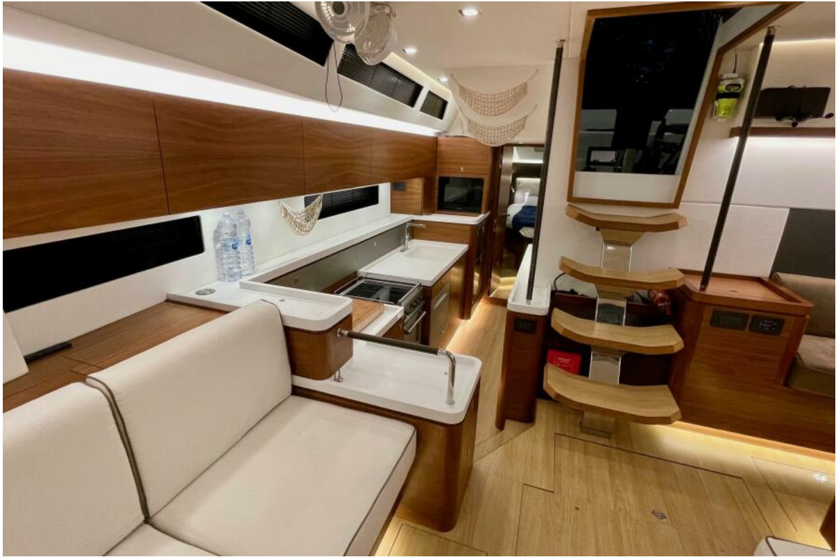
Galley Amel 50