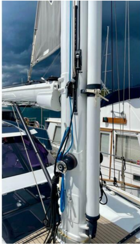
Spinnaker Pole Amel 50