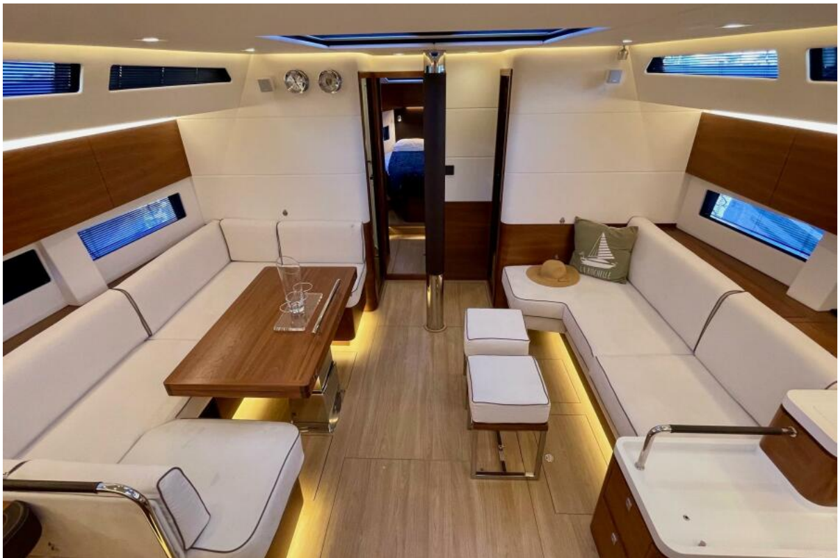
Saloon Amel 50