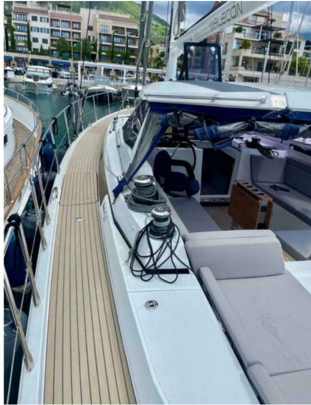
Deck Amel 50