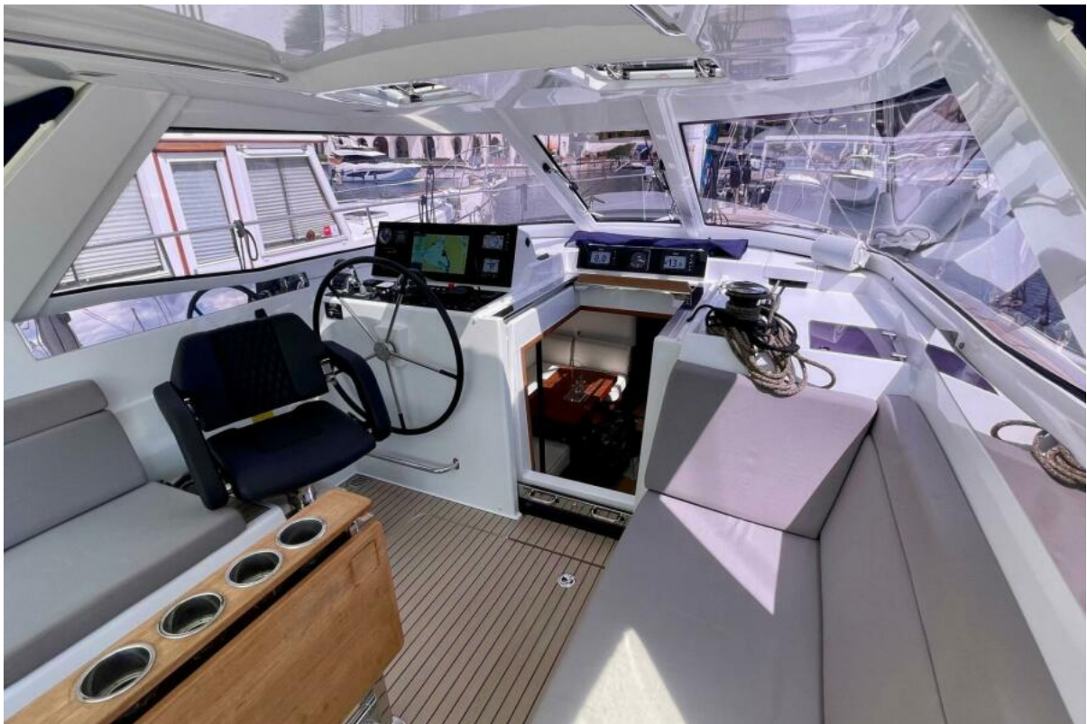
Helm Amel 50