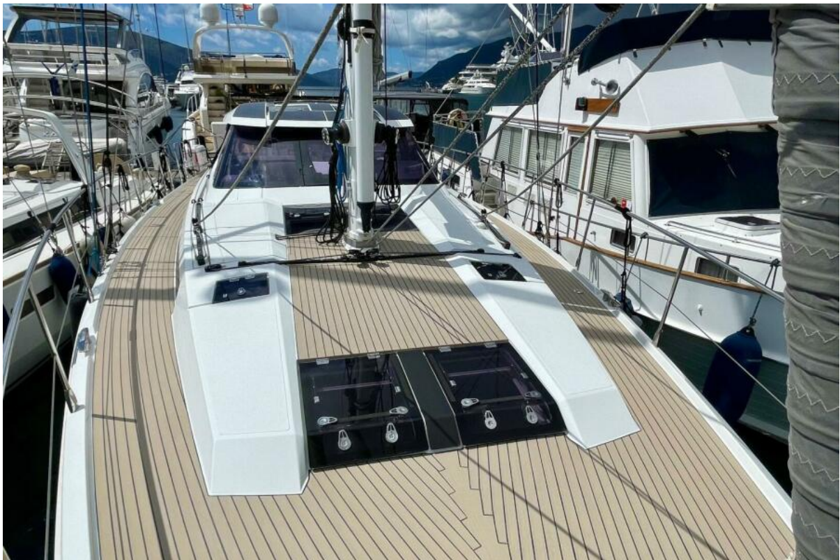
Deck Amel 50