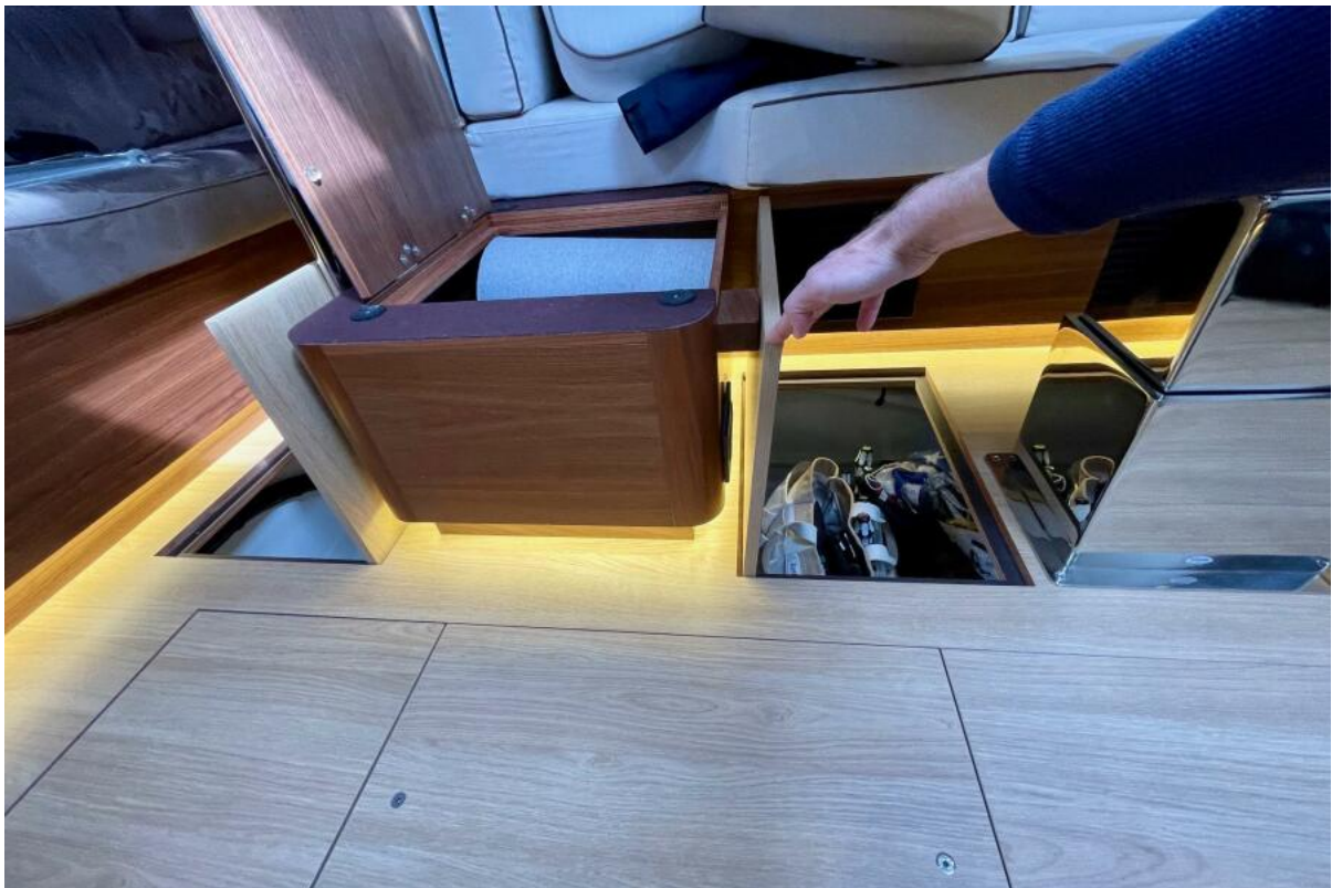
Hull Storage Amel 50