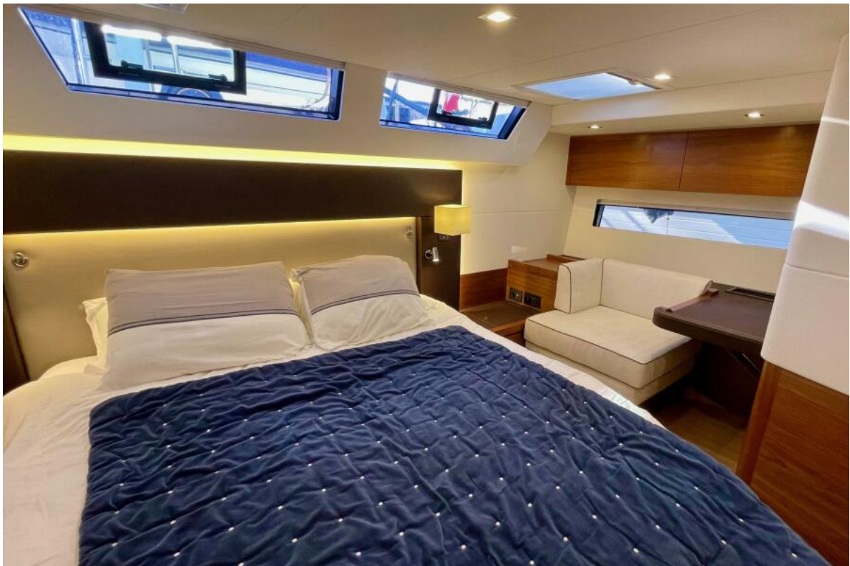
Primary Cabin Amel 50