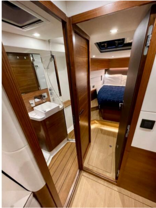
Forward Bulkhead Amel 50