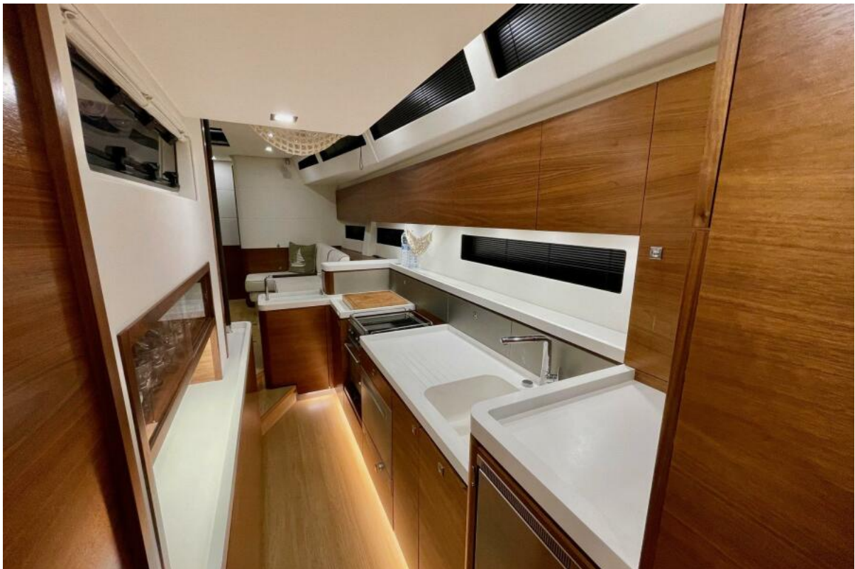
Galley Amel 50