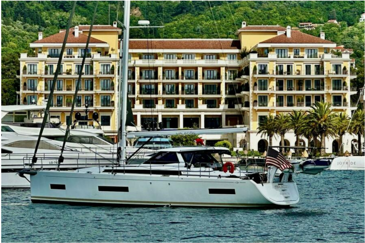
Cruising Amel 50