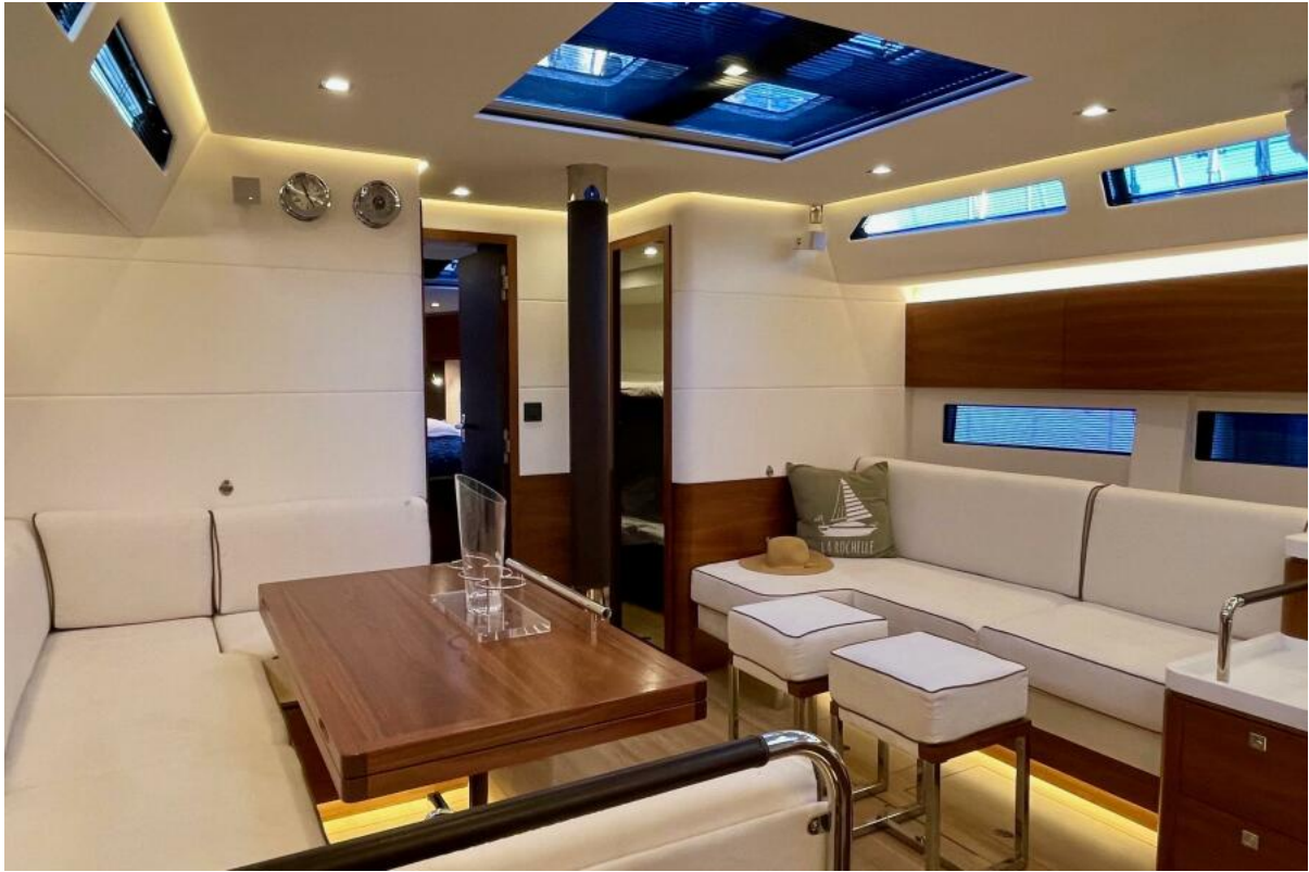
Saloon Amel 50