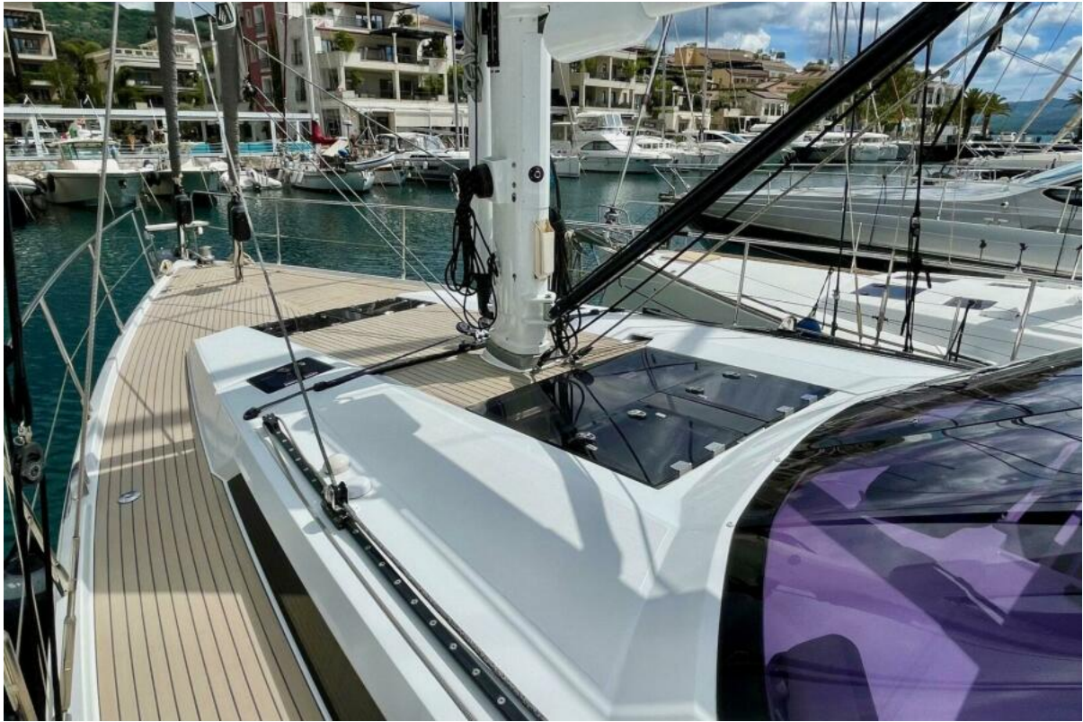
Deck Amel 50