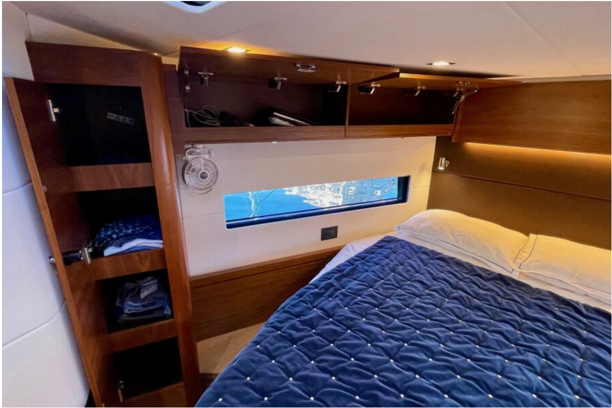
Primary Cabin Amel 50