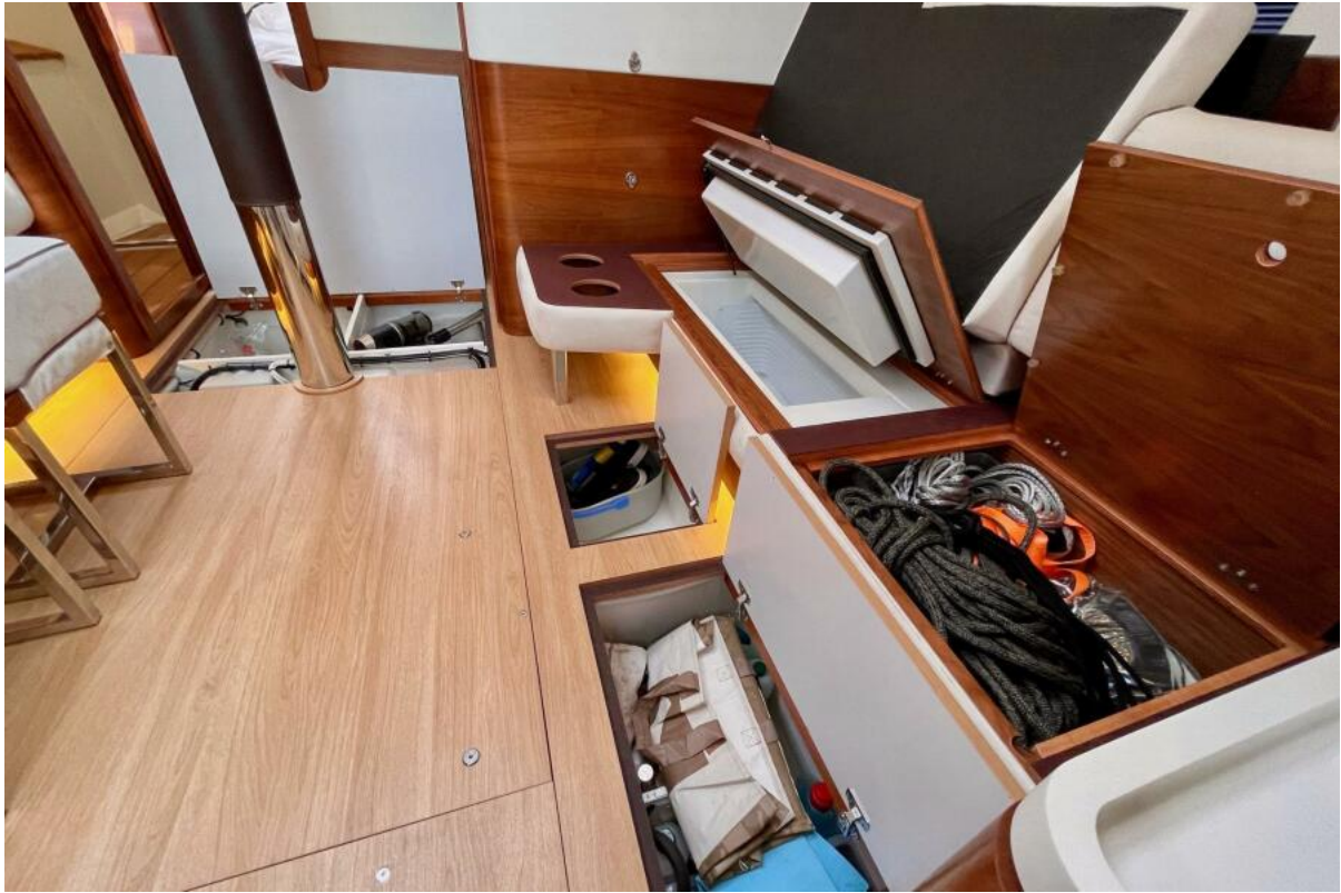
Hull Storage Amel 50