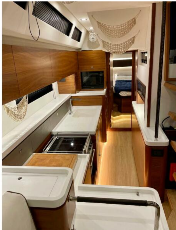
Galley Amel 50