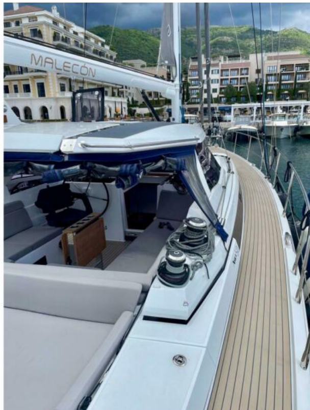
Deck Amel 50