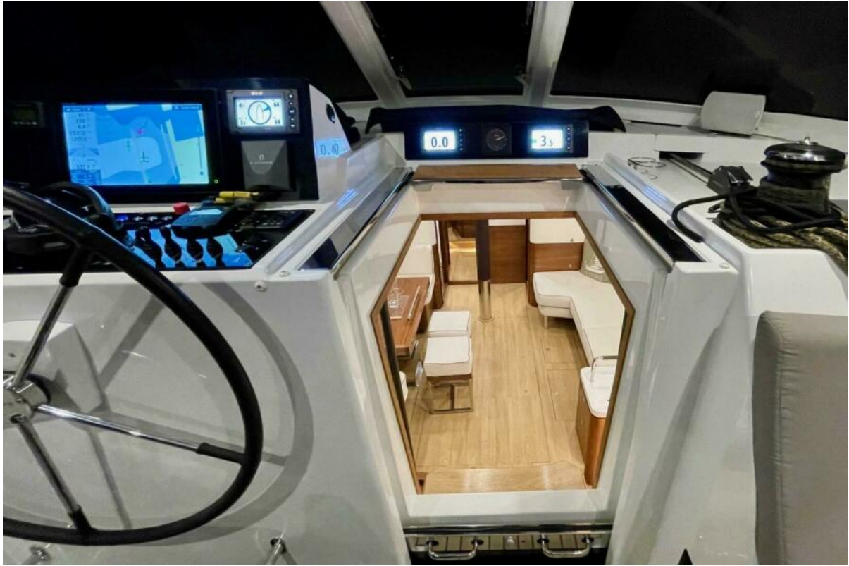
Companionway Amel 50