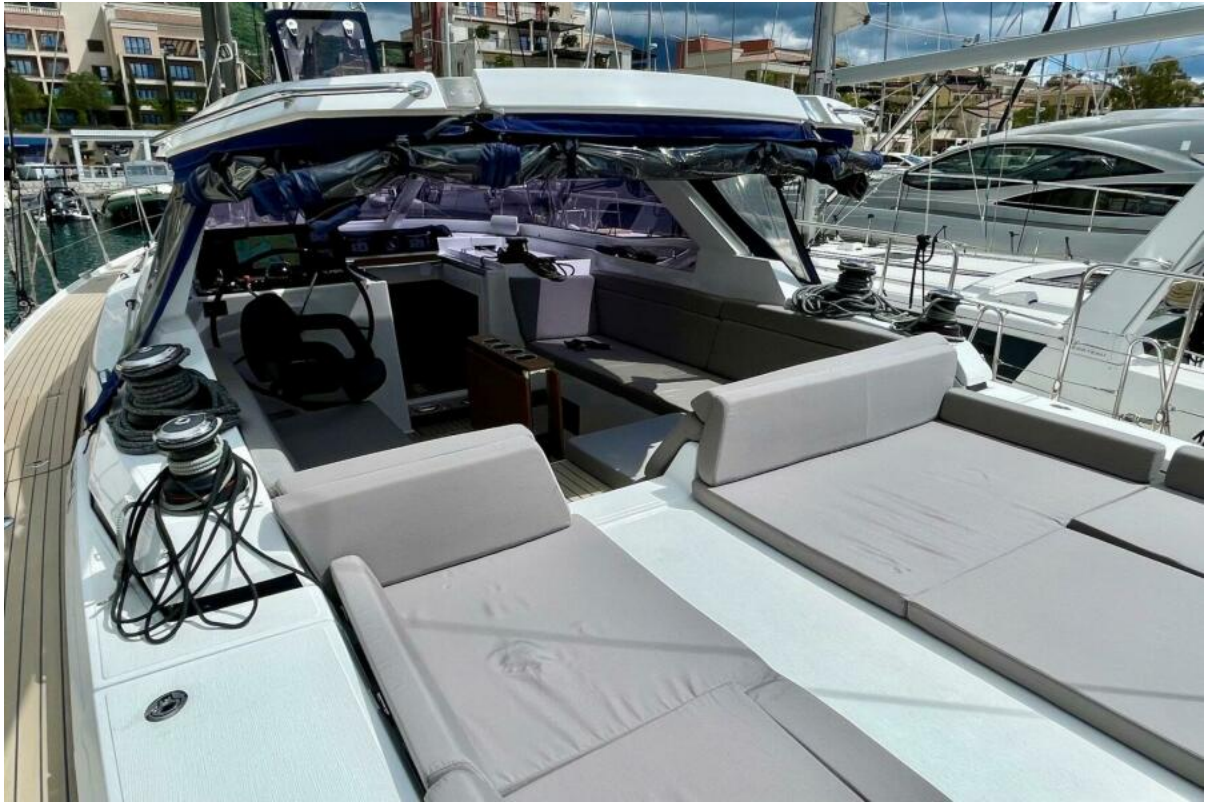
Sun Pad Amel 50