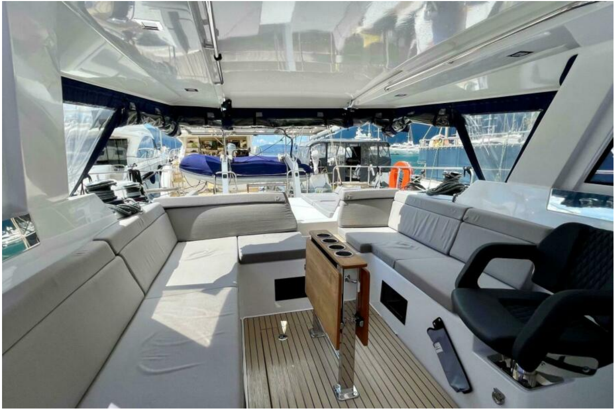
Cockpit Amel 50