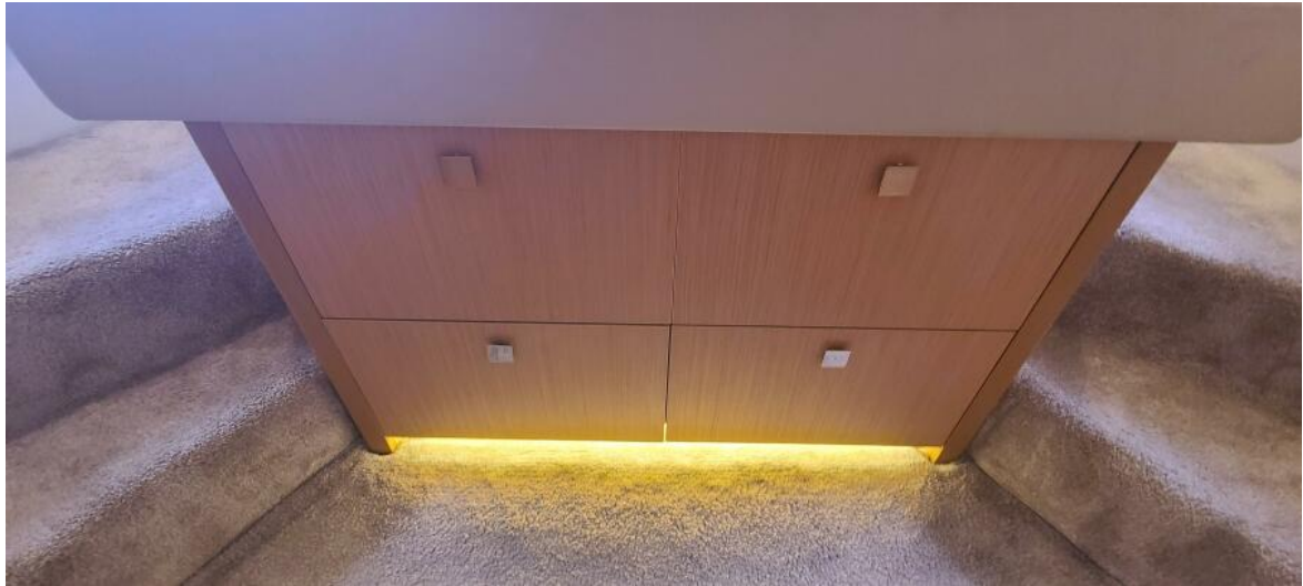
Storage Under Berth