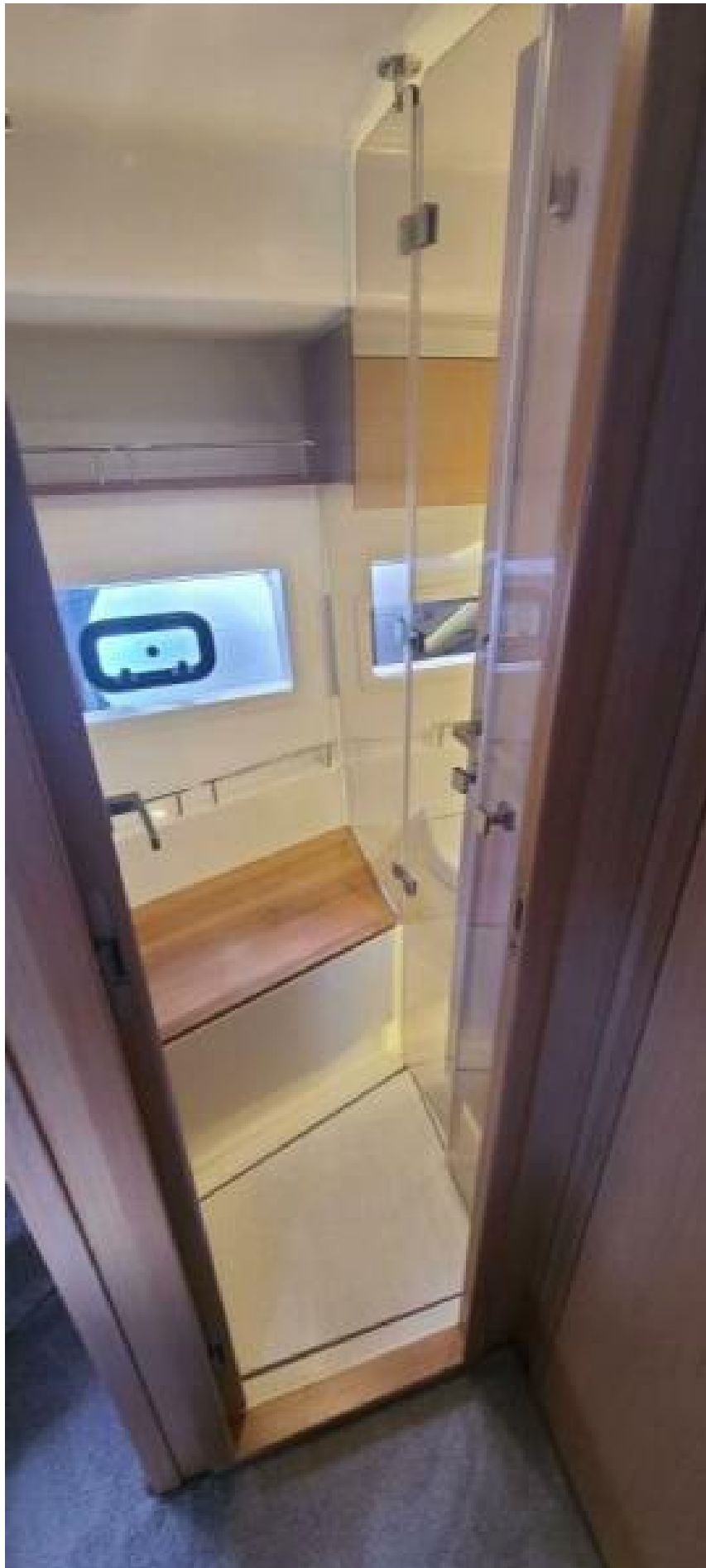
Full Shower w/Bench