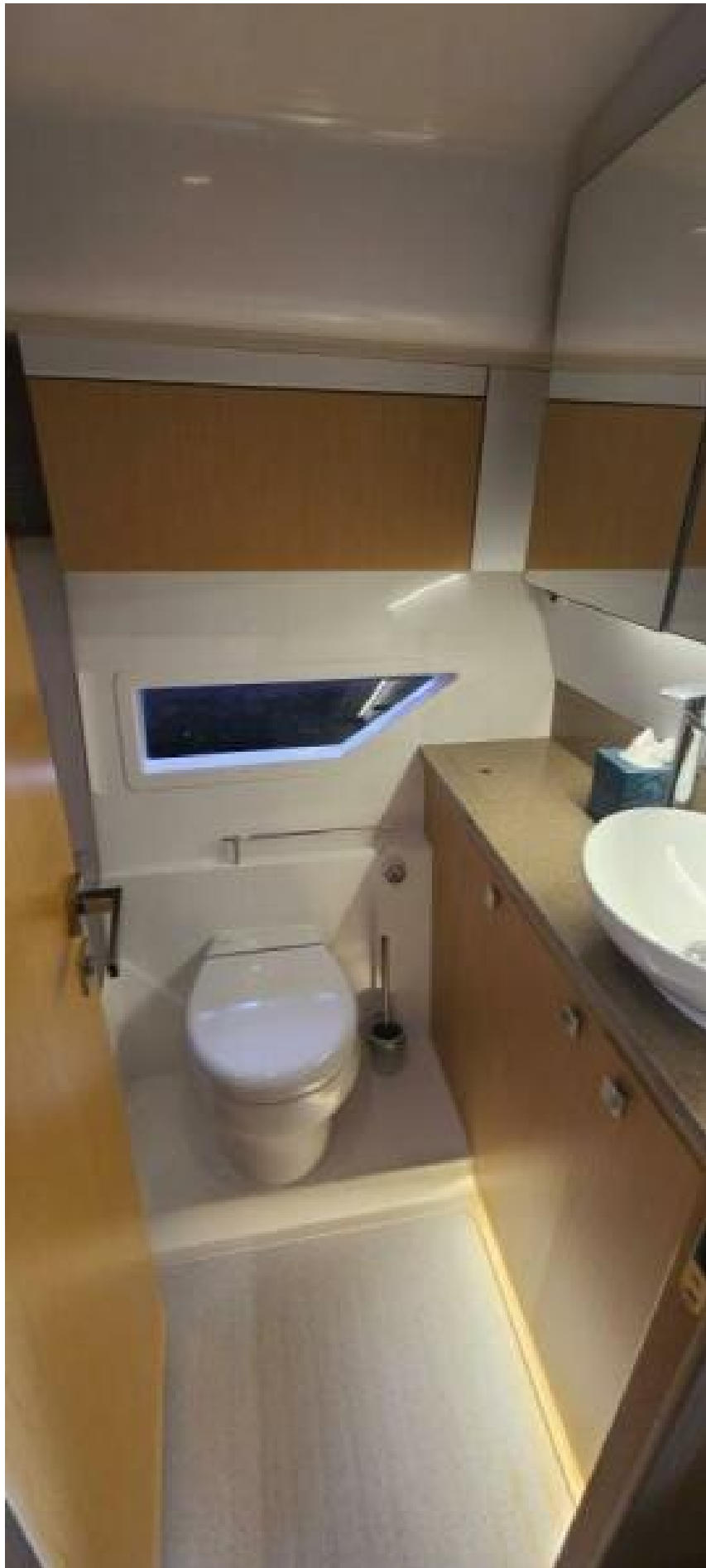
Electric Head and Counter Top Basin