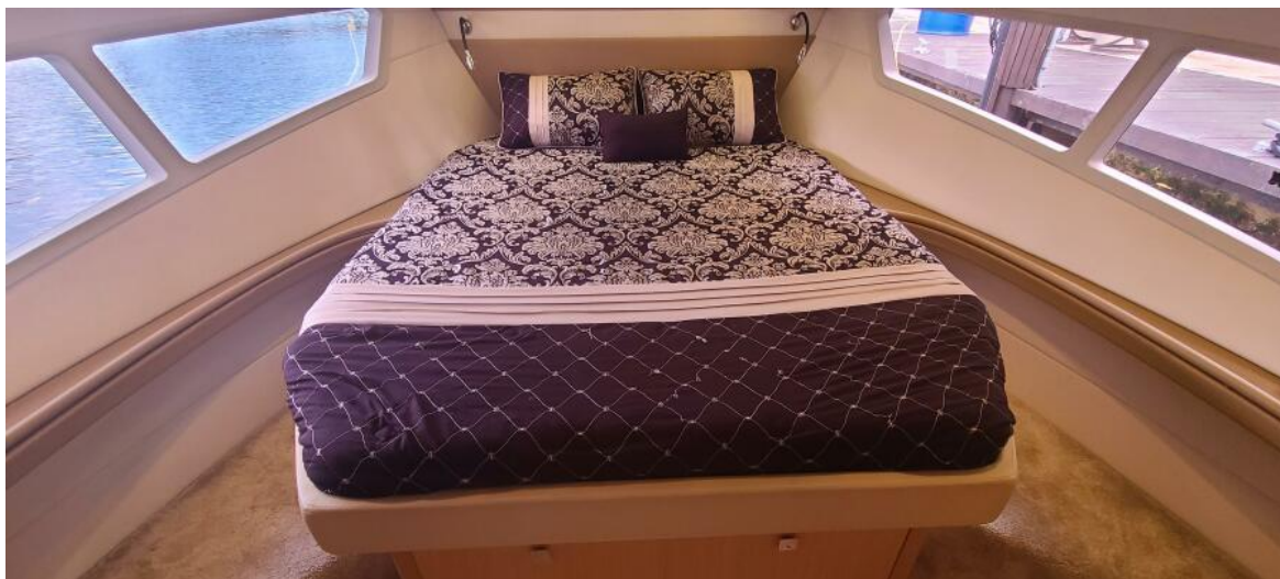
Large Forward Berth