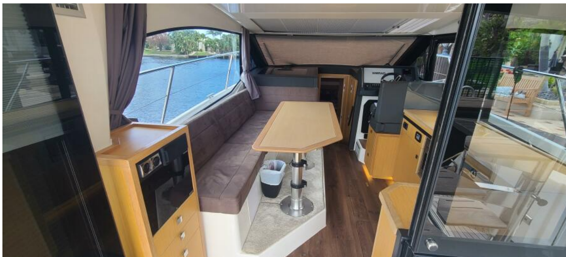
Settee Port Facing Forward