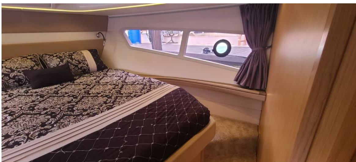
Easy Access to Berth (Starboard) w/Opening Port