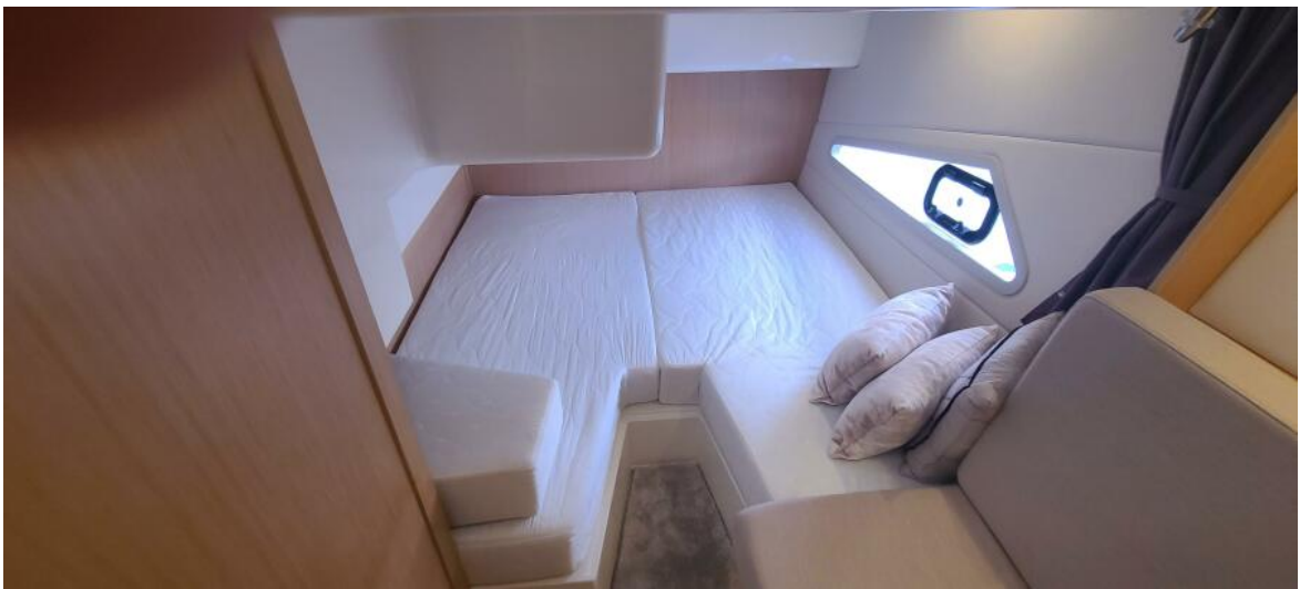
Guest Stateroom to port w/Filler berth