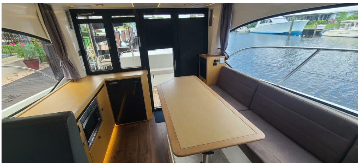
Settee Facing Aft Note Shades On Aft Cabin Doors and Windows are Adjustable