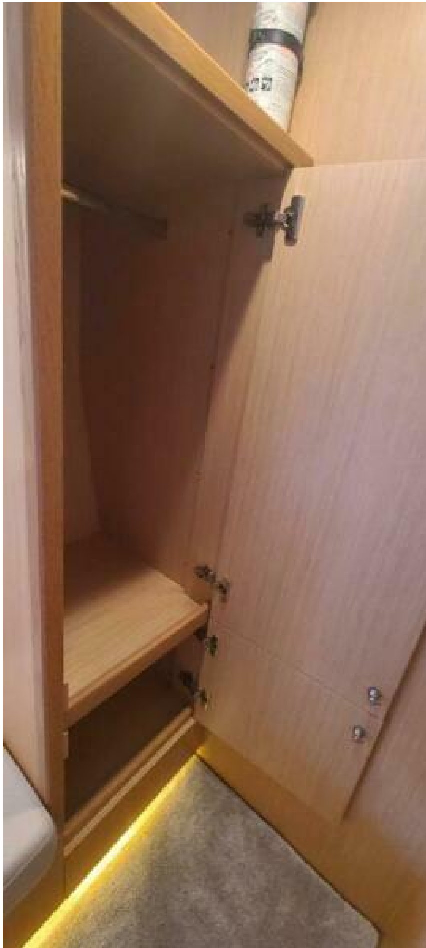
Closet w/Storage Under