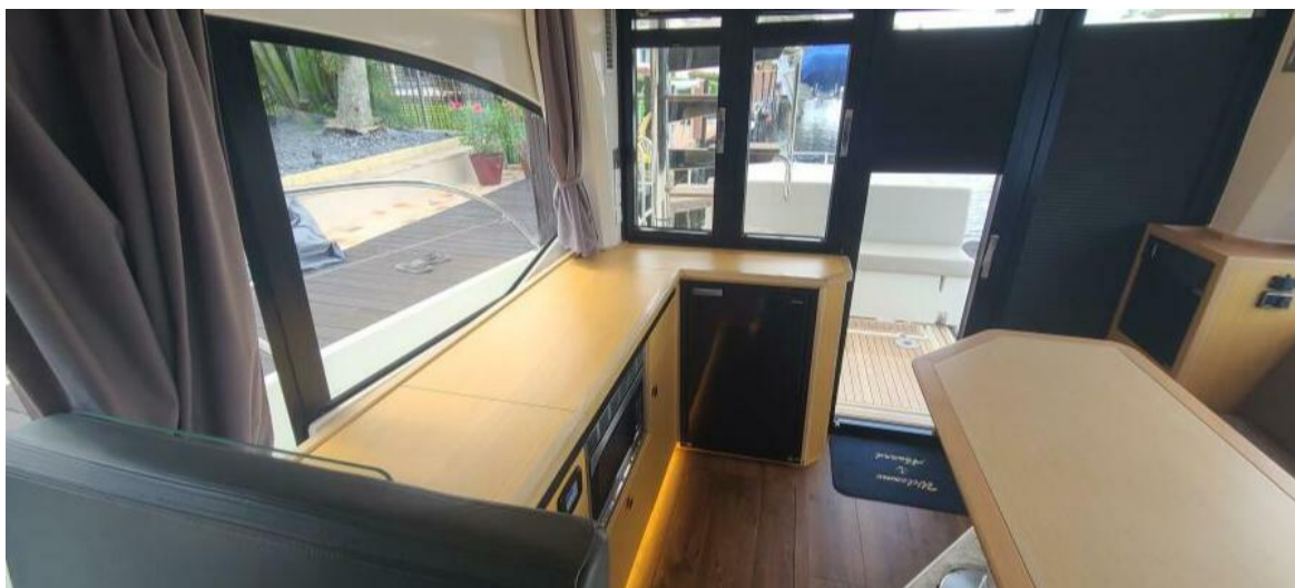
Galley To Port w/Covers Closed