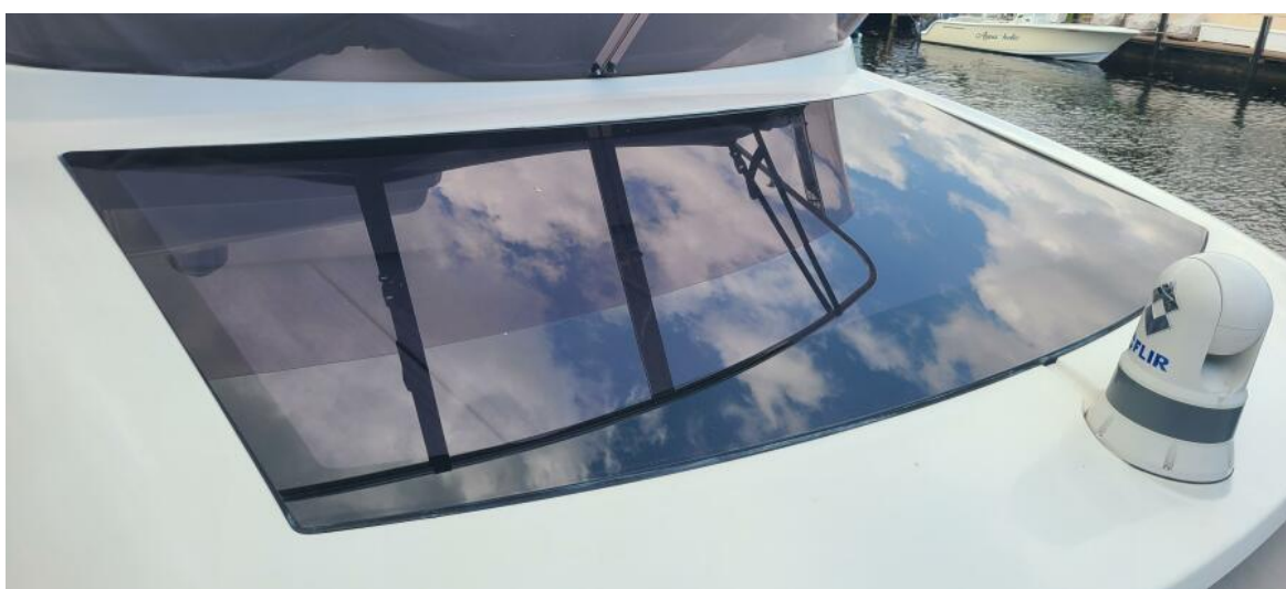
Large overhead Window at Helm & Seating