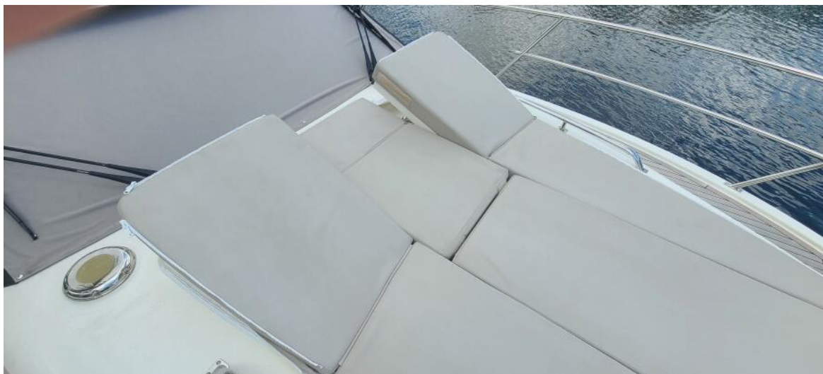
Forward Sun Pad