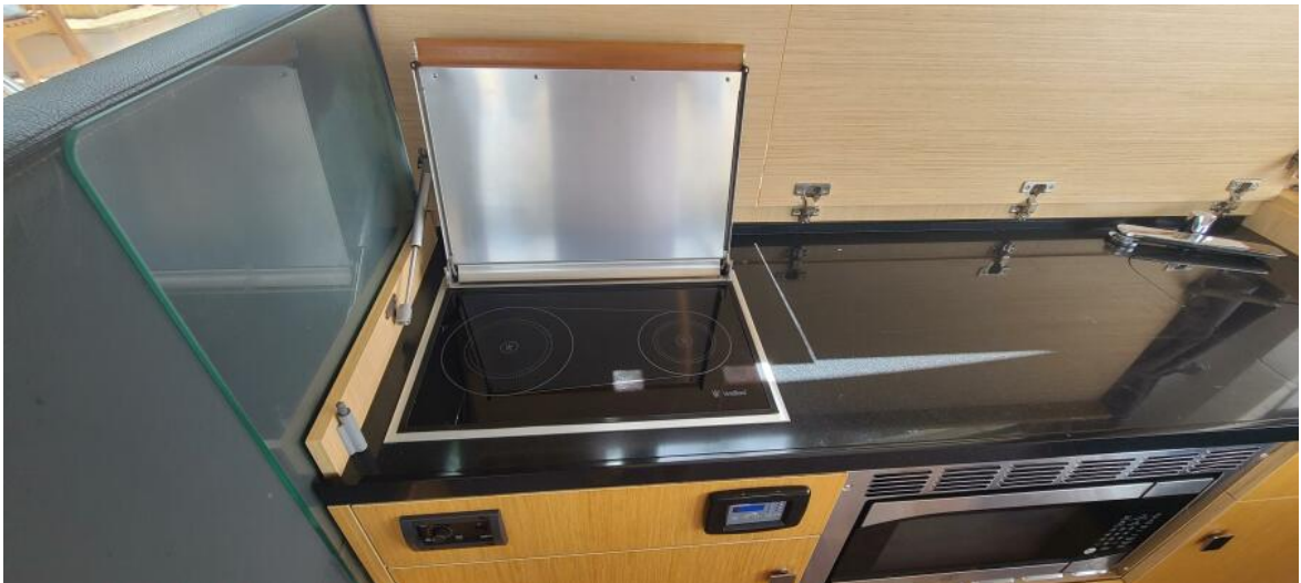
Diesel Cooker/Heater Great for cooler nights that you don't want to run a generator.