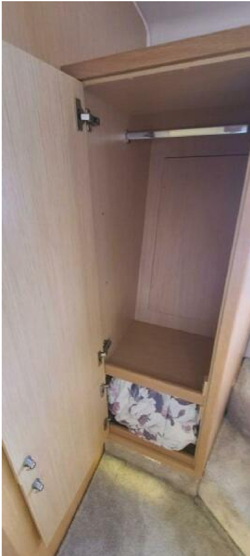
Hanging Locker to Port w/Storage Under