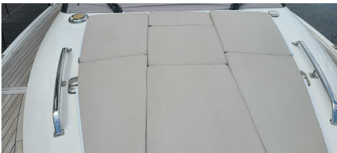
Forward Sun Pad