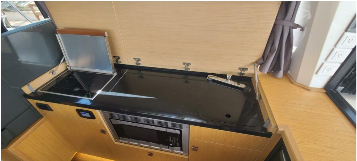
Galley w/Covers Opened