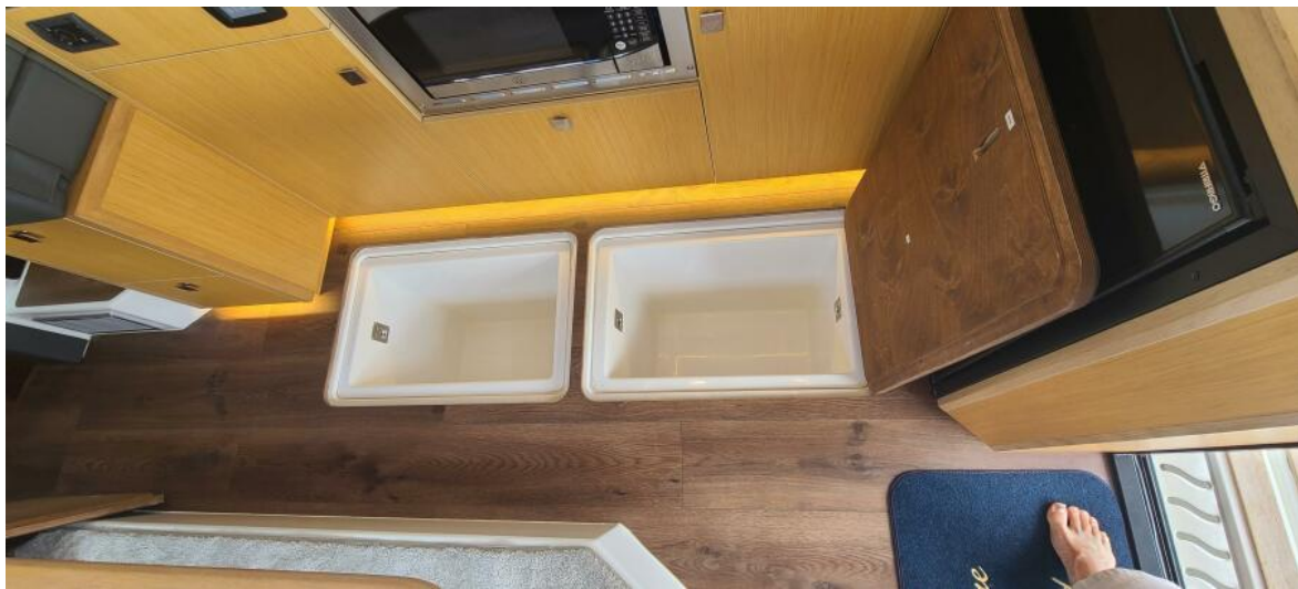
Storage Bins Under Galley Sole