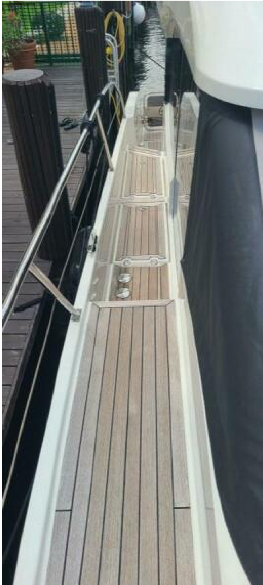
Wide side decks