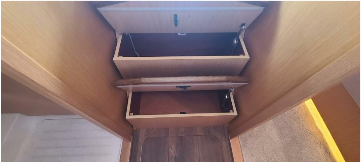
Storage under Companionway Stairs