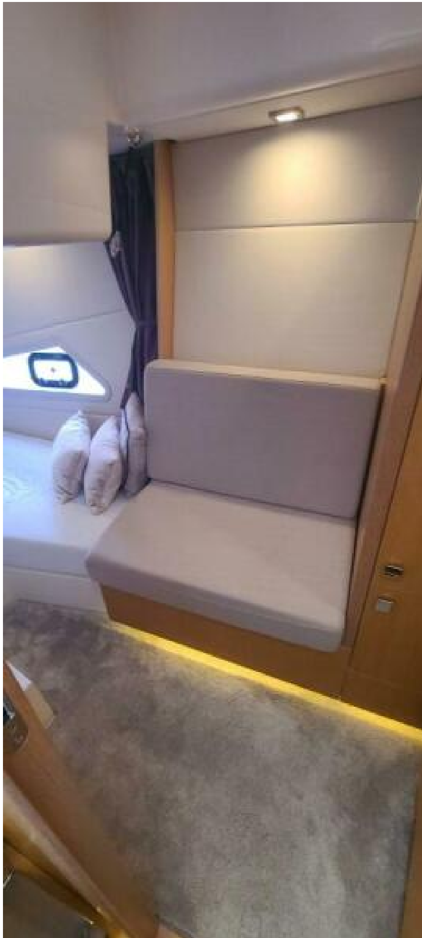
Settee Forward of the Berth