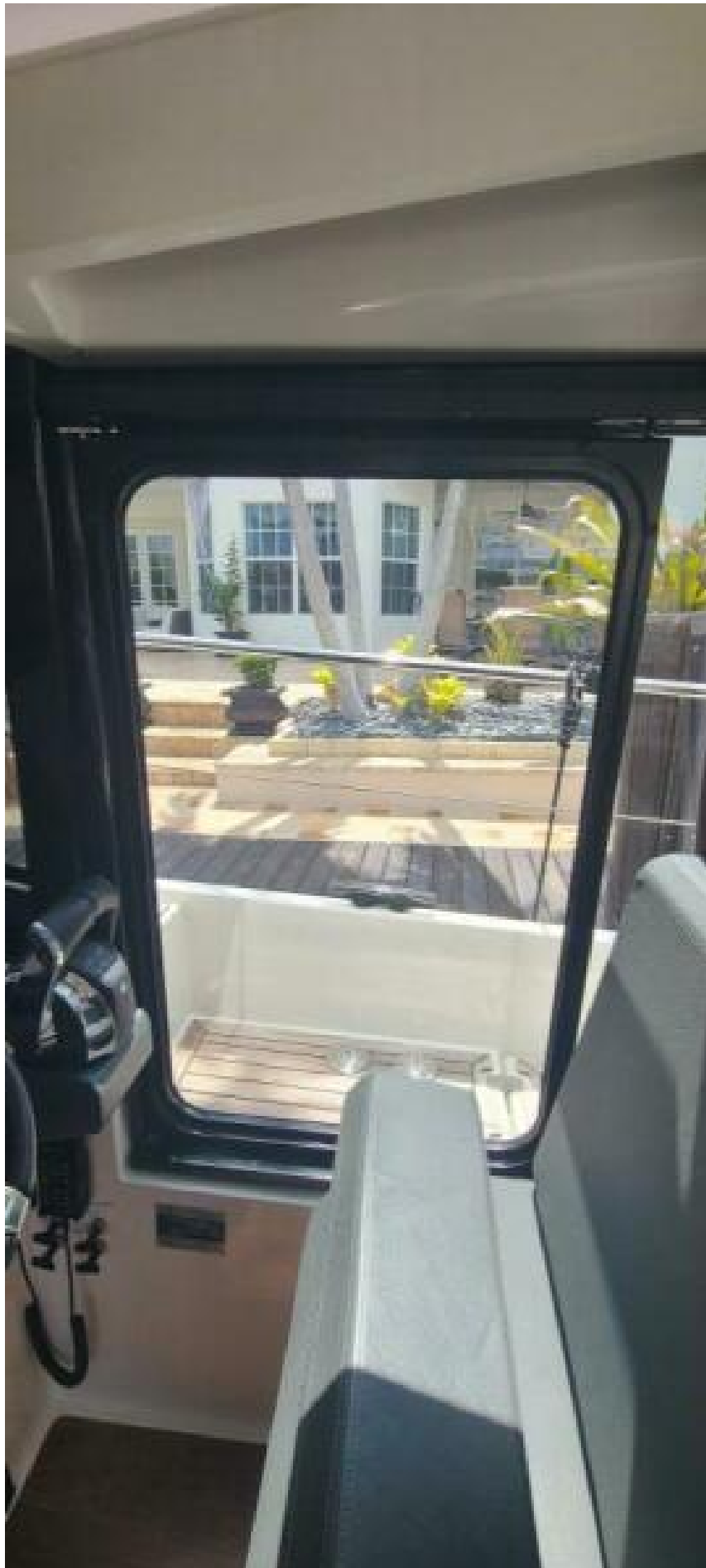
Large Deck Access from Lower Helm