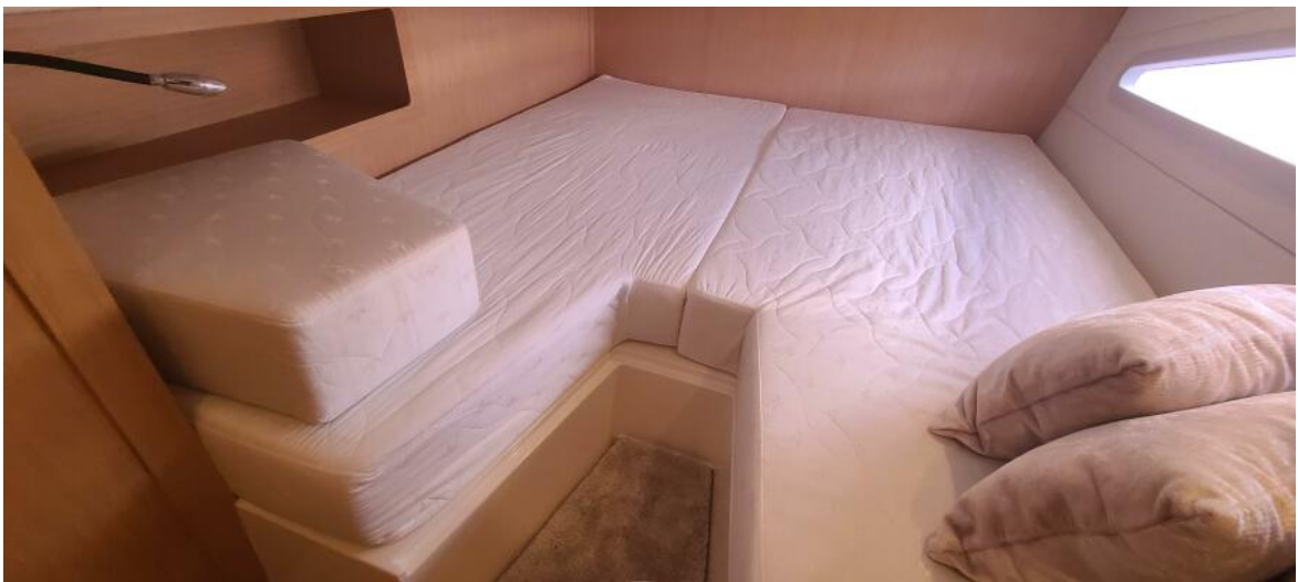
Storage and Reading Lights