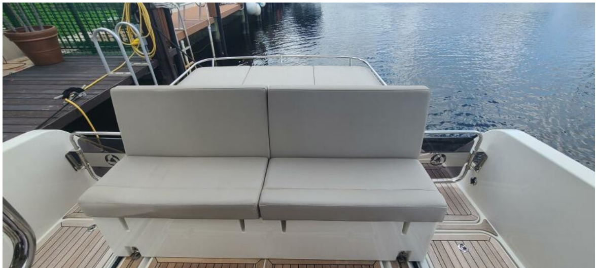
Aft Seating Aft Bench Seat (converts to full pad)