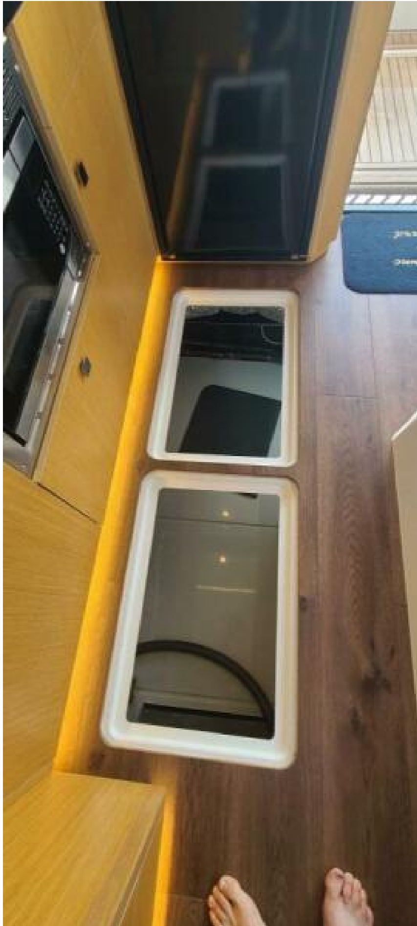
Mechanical Space Access Available When the Storage Bins are REMOVED - Also Good Storage Space