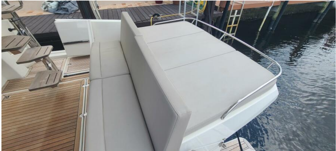
Aft Sun Pad