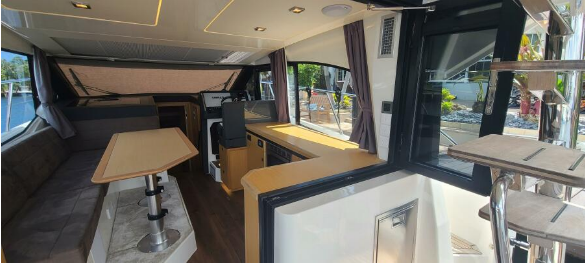
Galley Facing Forward - Note Open Folding Aft Windows Fully Open to Cockpit Area