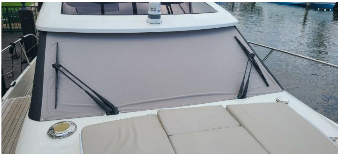
Full Window Covering w/Pantograph Wipers