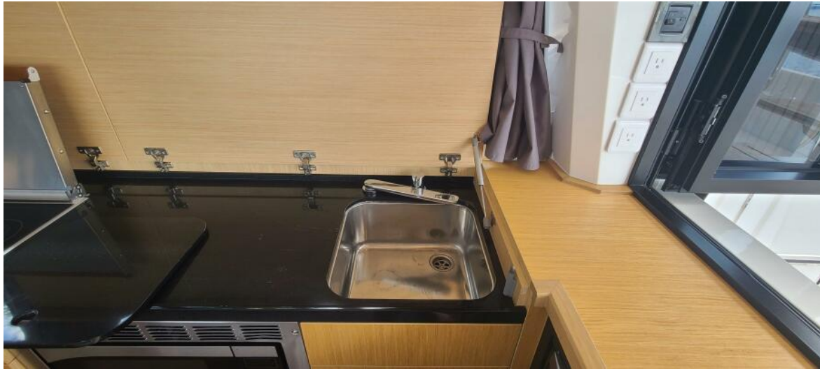
Single Basin Sink w/Retractable Faucet