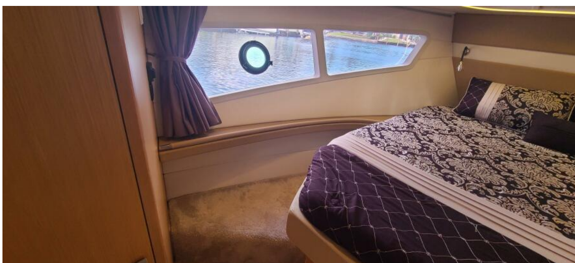
Easy Access to Bert (Port) and Opening Port