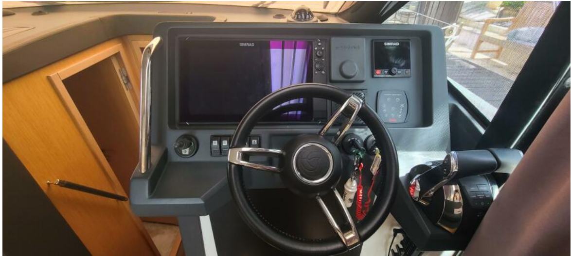
Lower Helm Station to Starboard