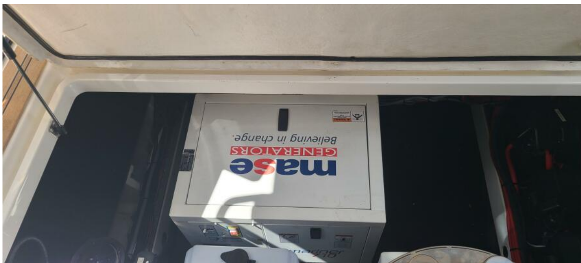
7.1Kw Gen Set in Lazarrete