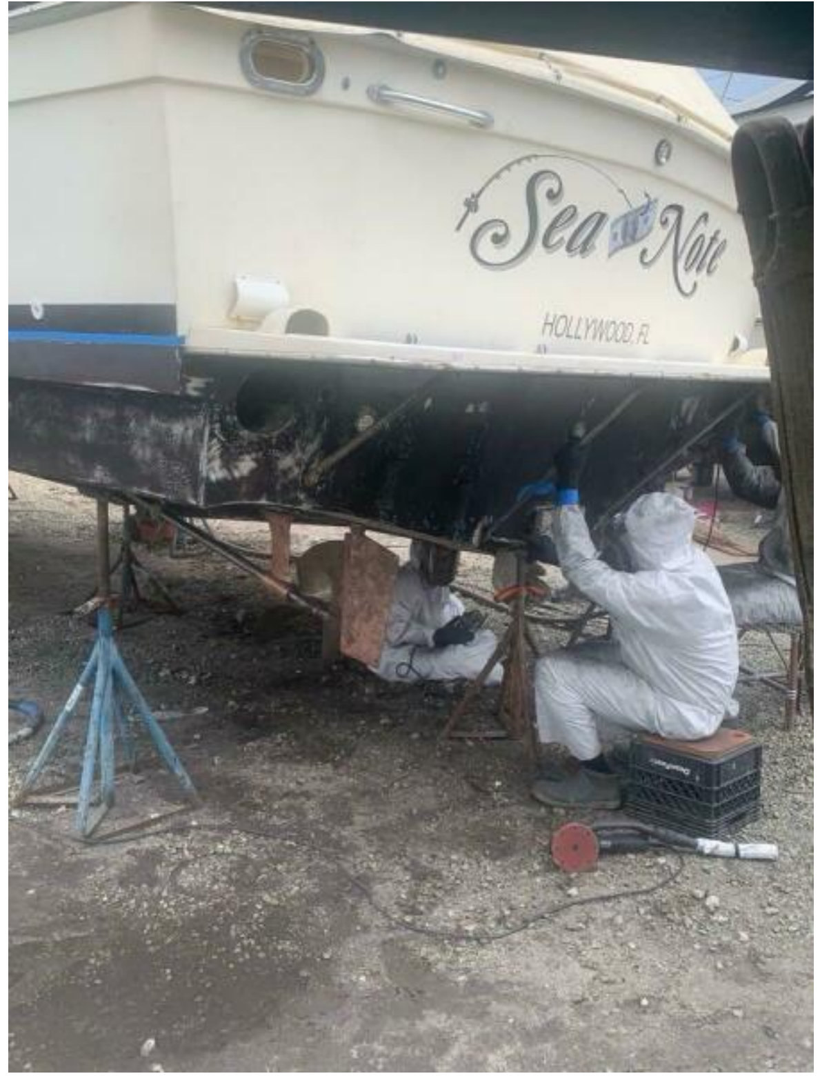
Full Bottom Job Fall 2023