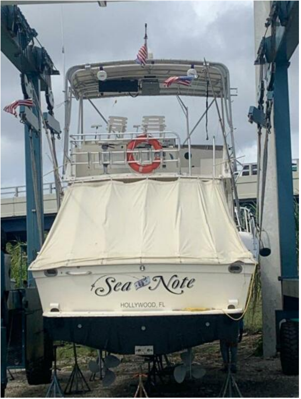
Haulout Fall 2023