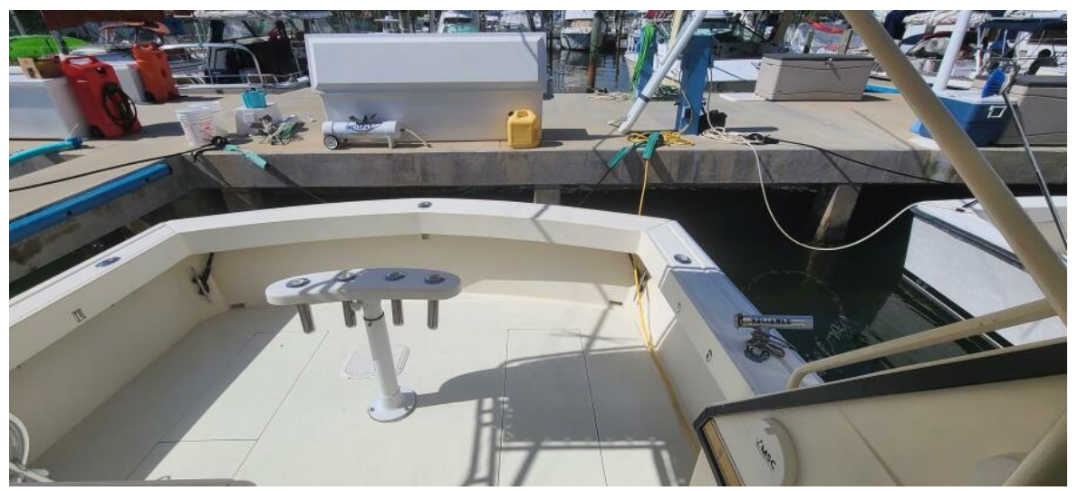
Cockpit To Aft