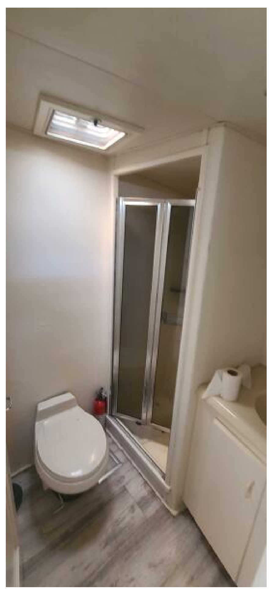
Head And Shower