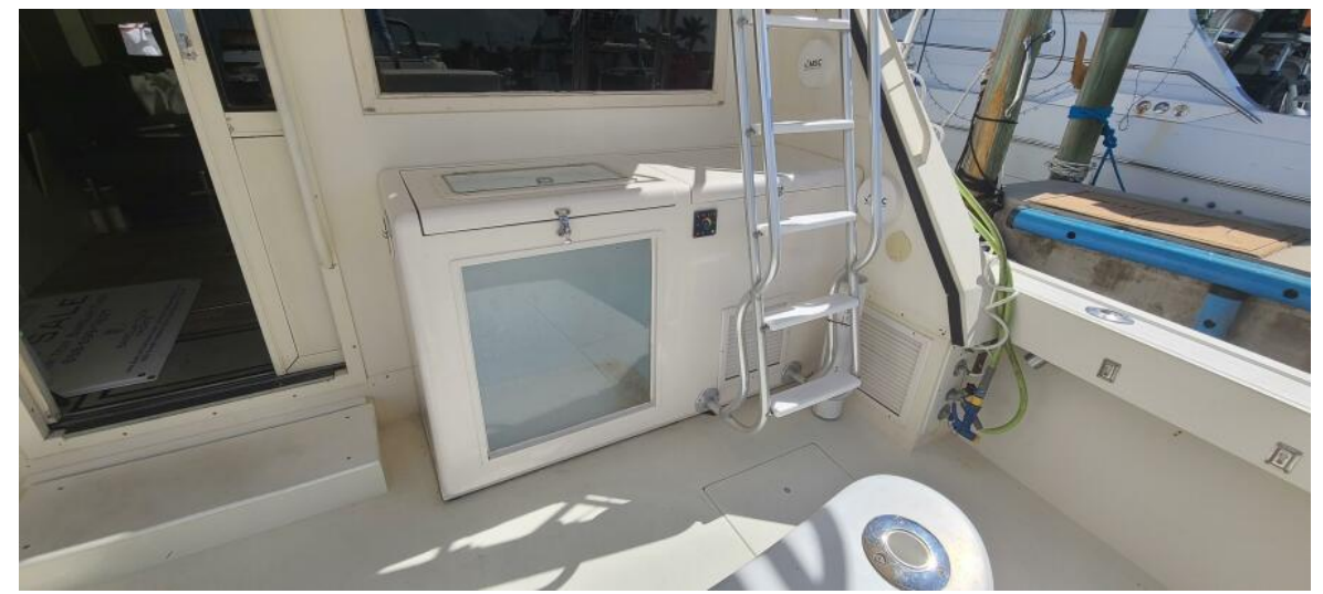
Cockpit Forward Starboard Bait Well And Storage