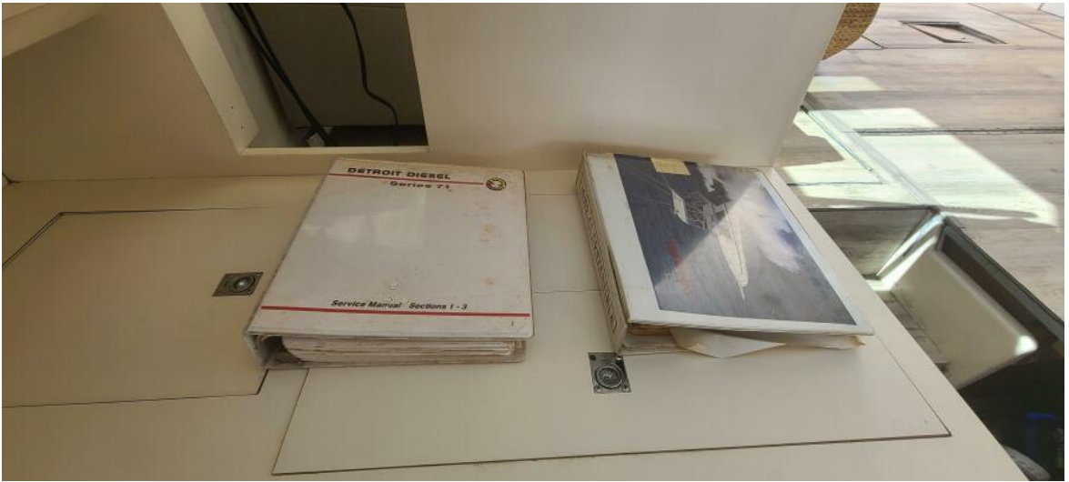
All Original Manuals