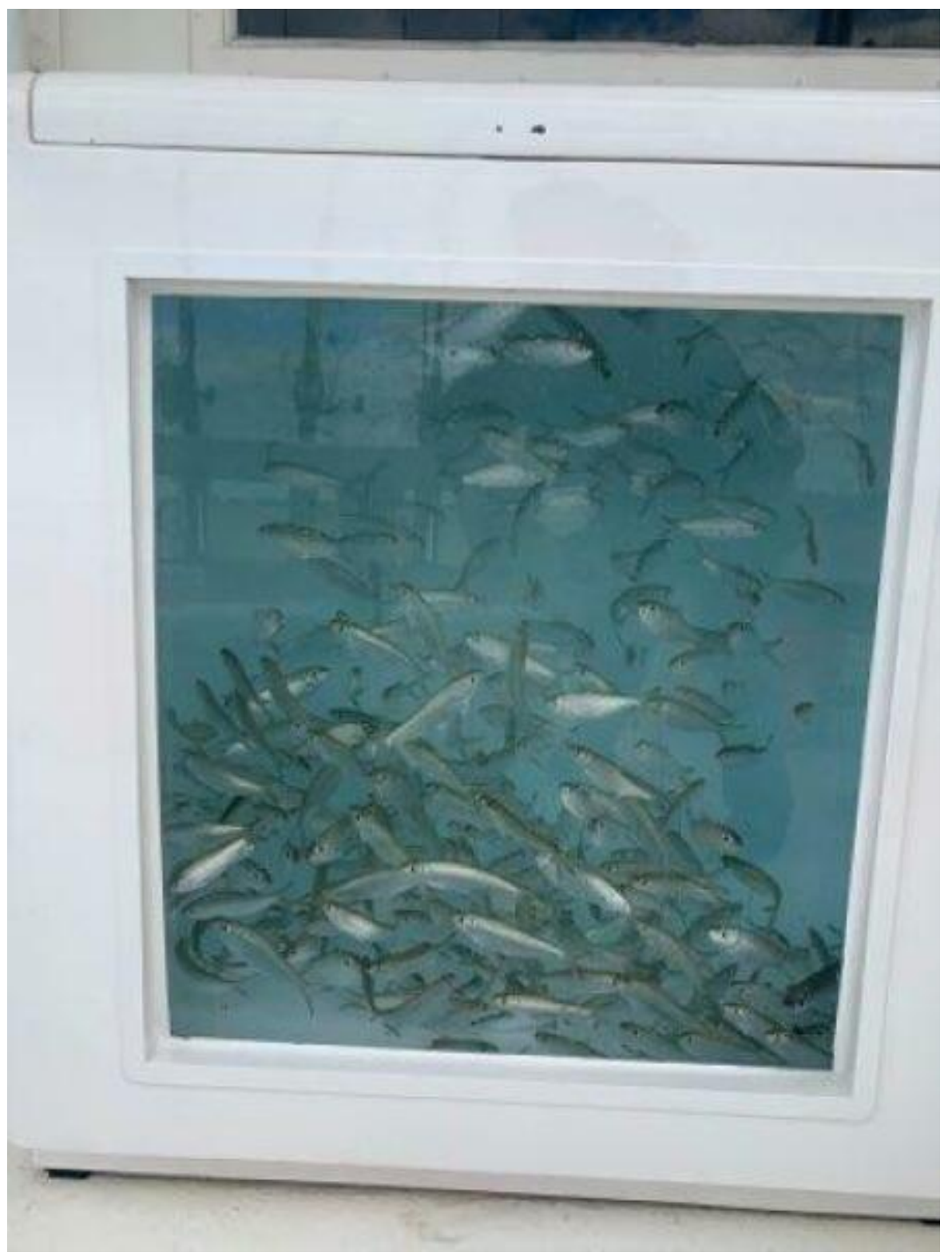
80 Gallon Live Well