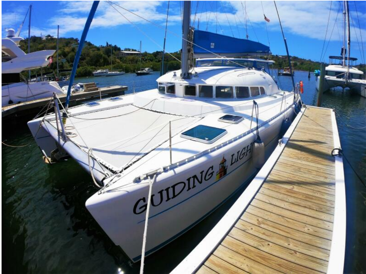
Sail Away Today Guiding Light - 1997 Lagoon 410