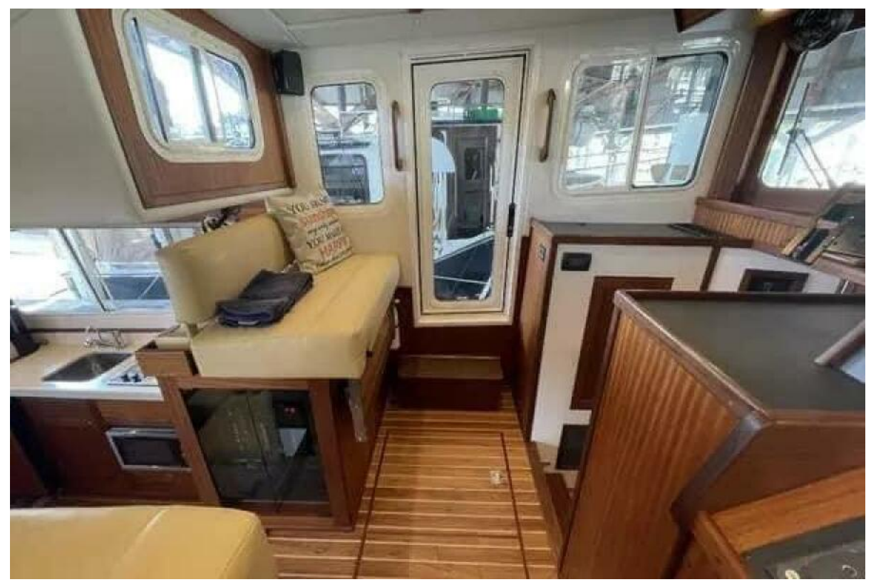
Pilot house Port door