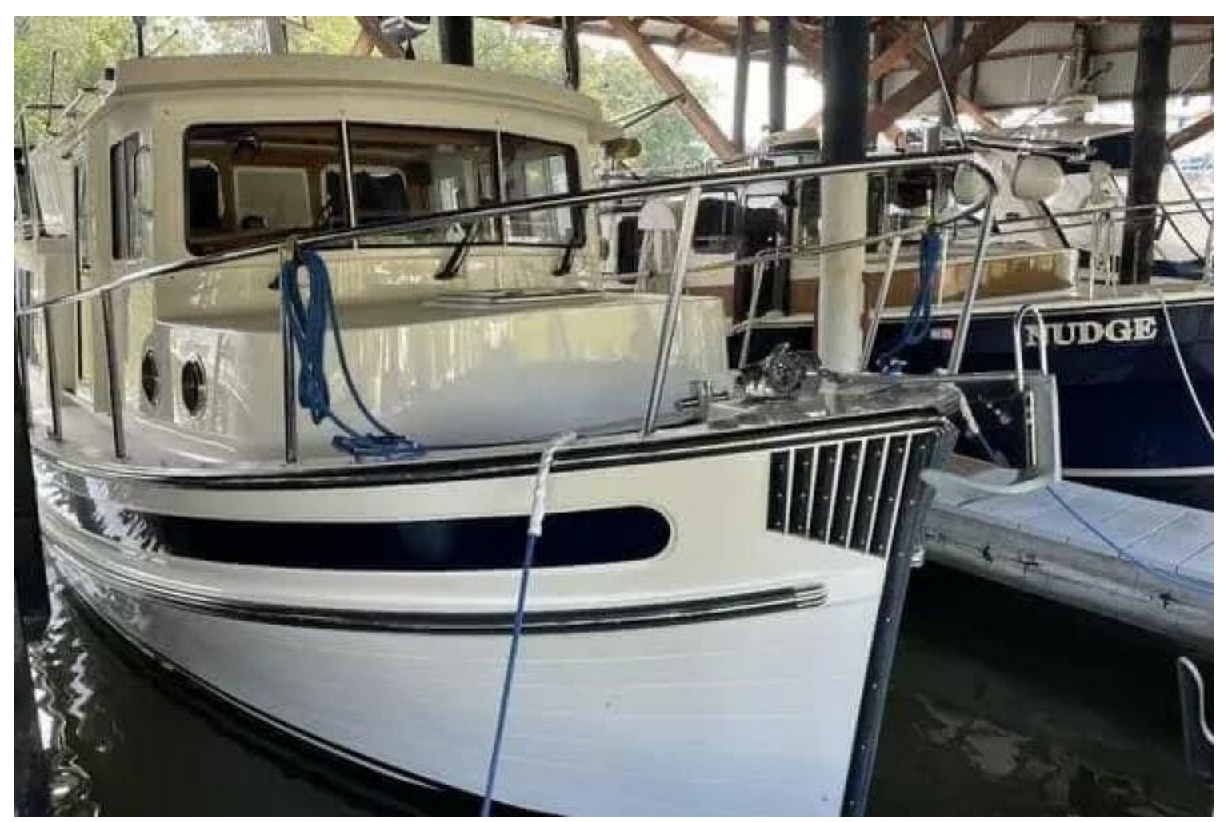
Bow Fiberglass shines like it just rolled out of the factory