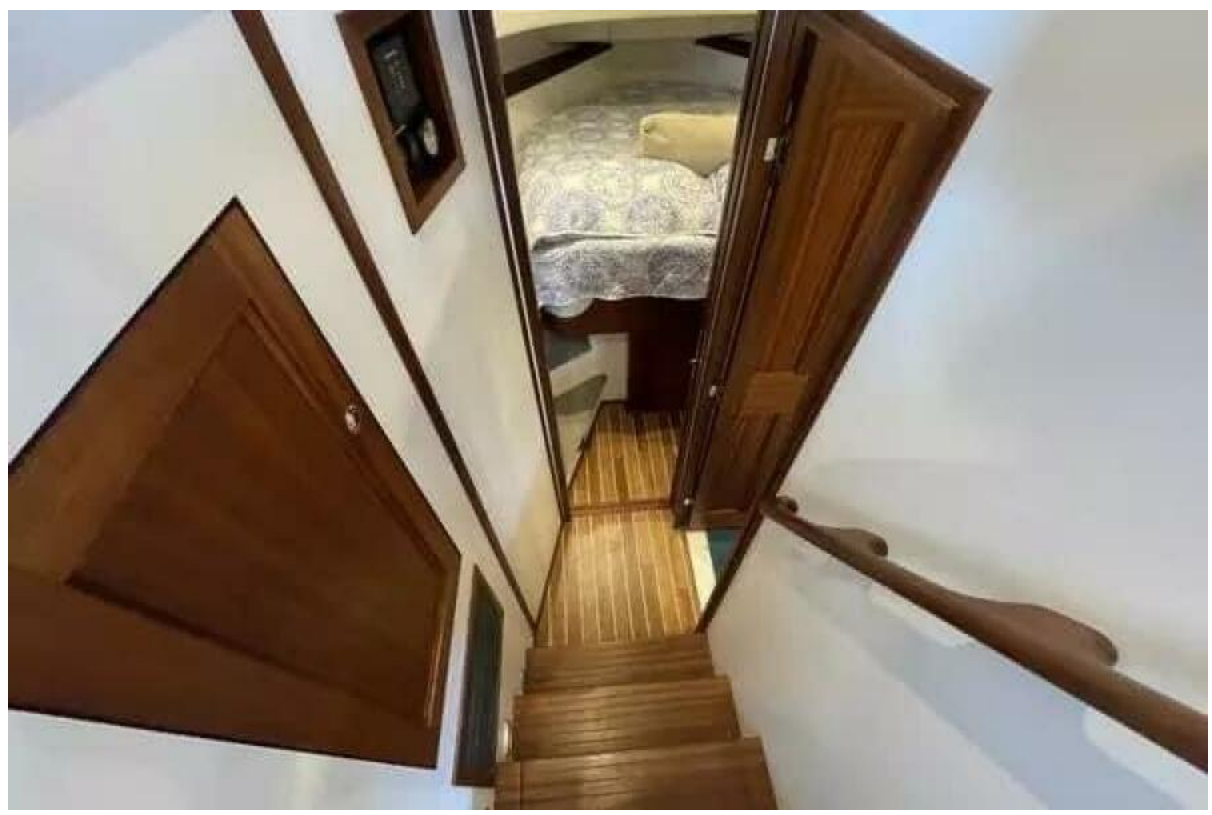
Main stateroom Storage to port, starboard head, main stateroom entrance with large forward berth.