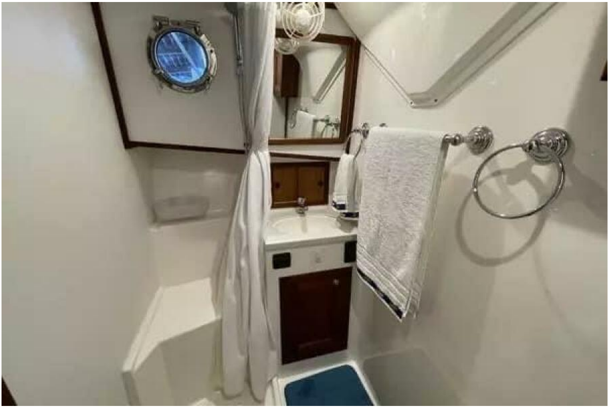
Head Nice shower with separation, hot cold pressure water, vacu flush system