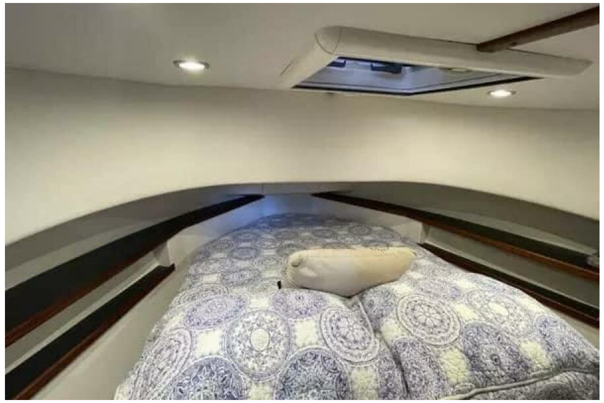
Main stateroom Queen size bed