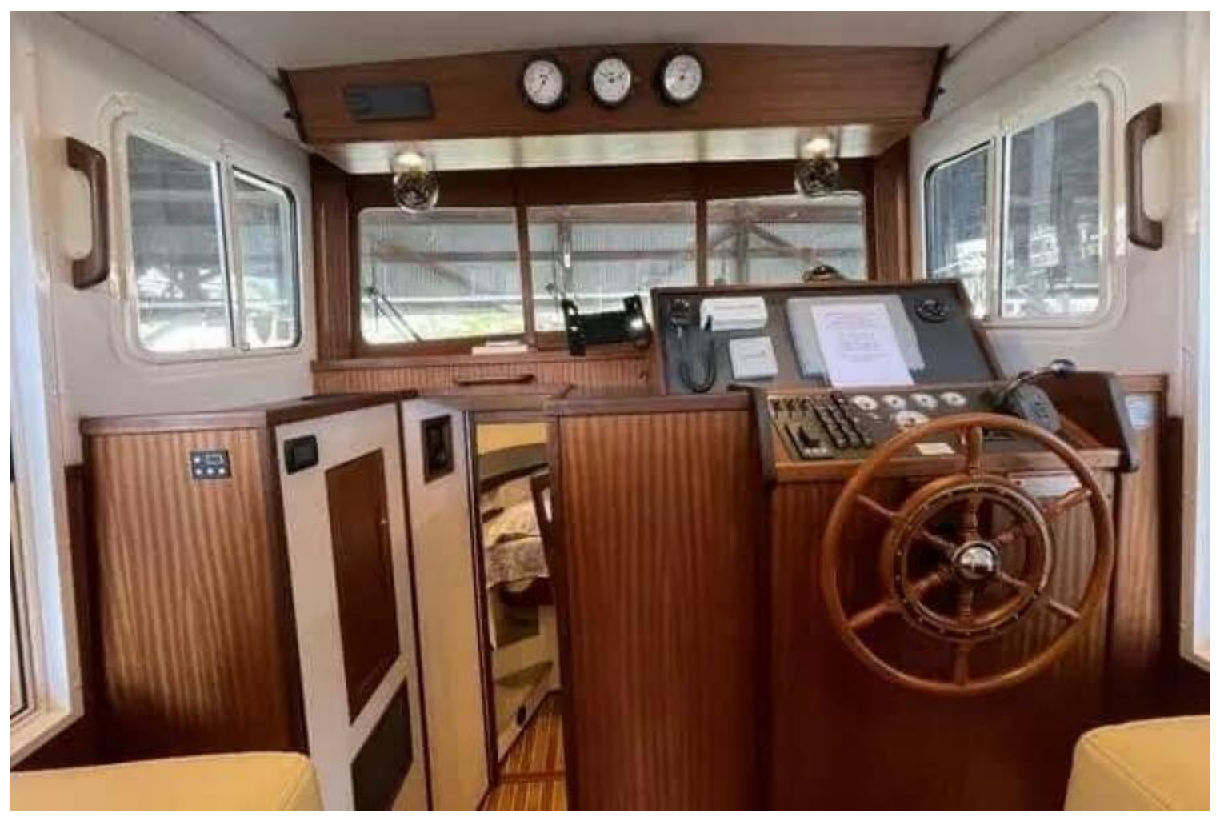
Pilot house Duel pilot house doors makes coming into dock much easier, especially with the bow and stern thrusters and with the port and starboard access to the deck.