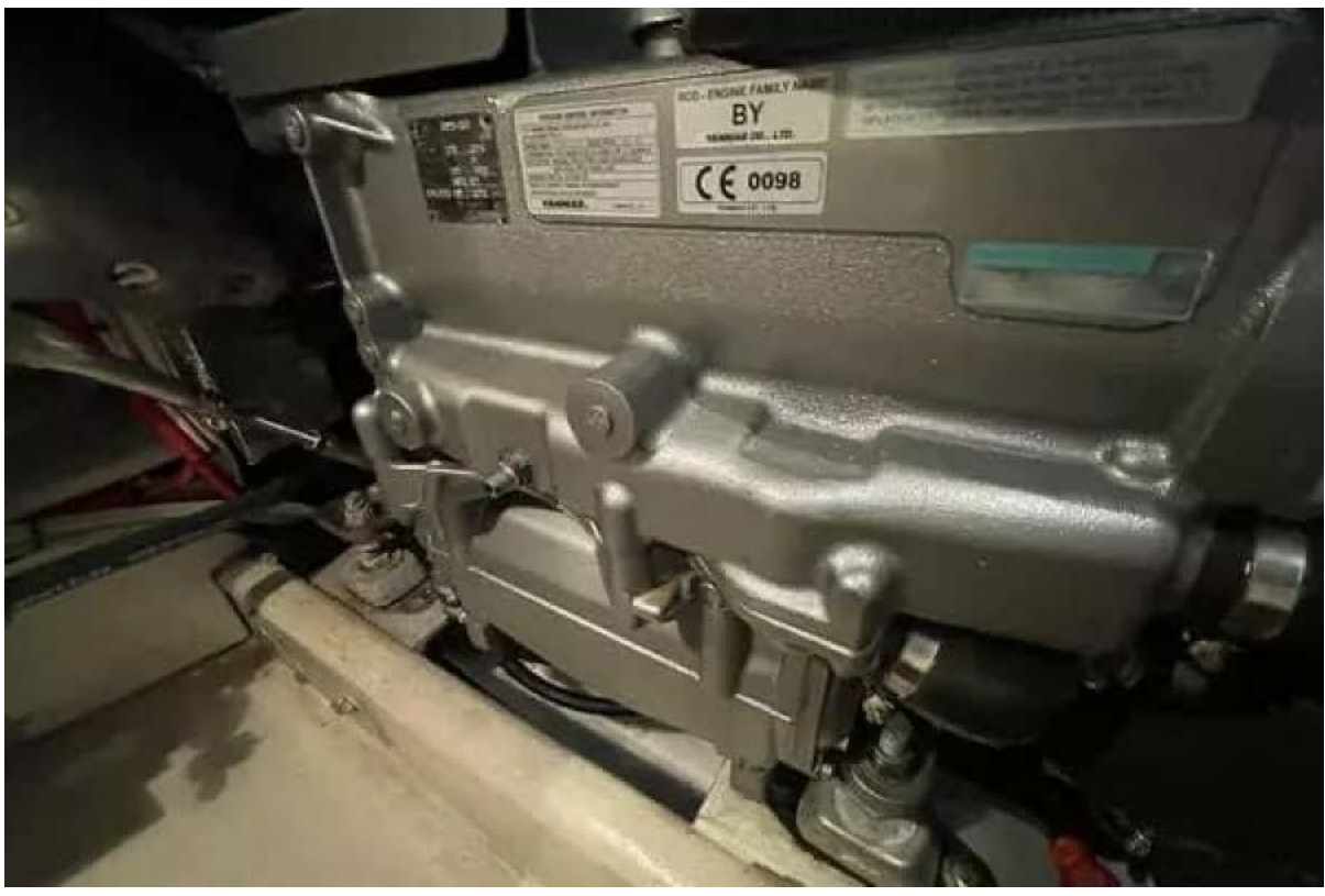
Yanmar Engine is low hour Yanmar