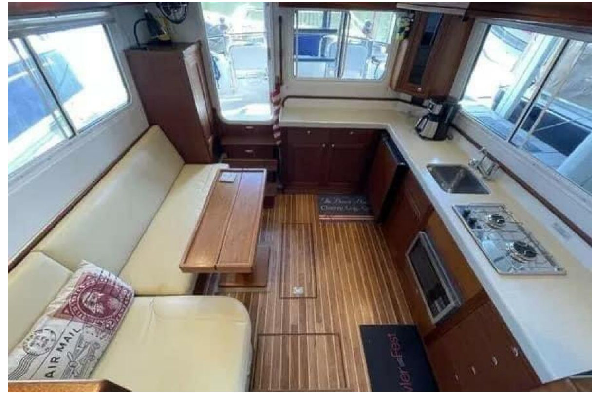
Main salon L shape settee that converts to a double

Galley Amtico Teak and Holly flooring throughout the boat Custom day/night shades Stainless opening ports Corian Countertops Stainless sink Two burner cooktop Convection/Microwave Nova Refrigerator Hot/Cold pressure water