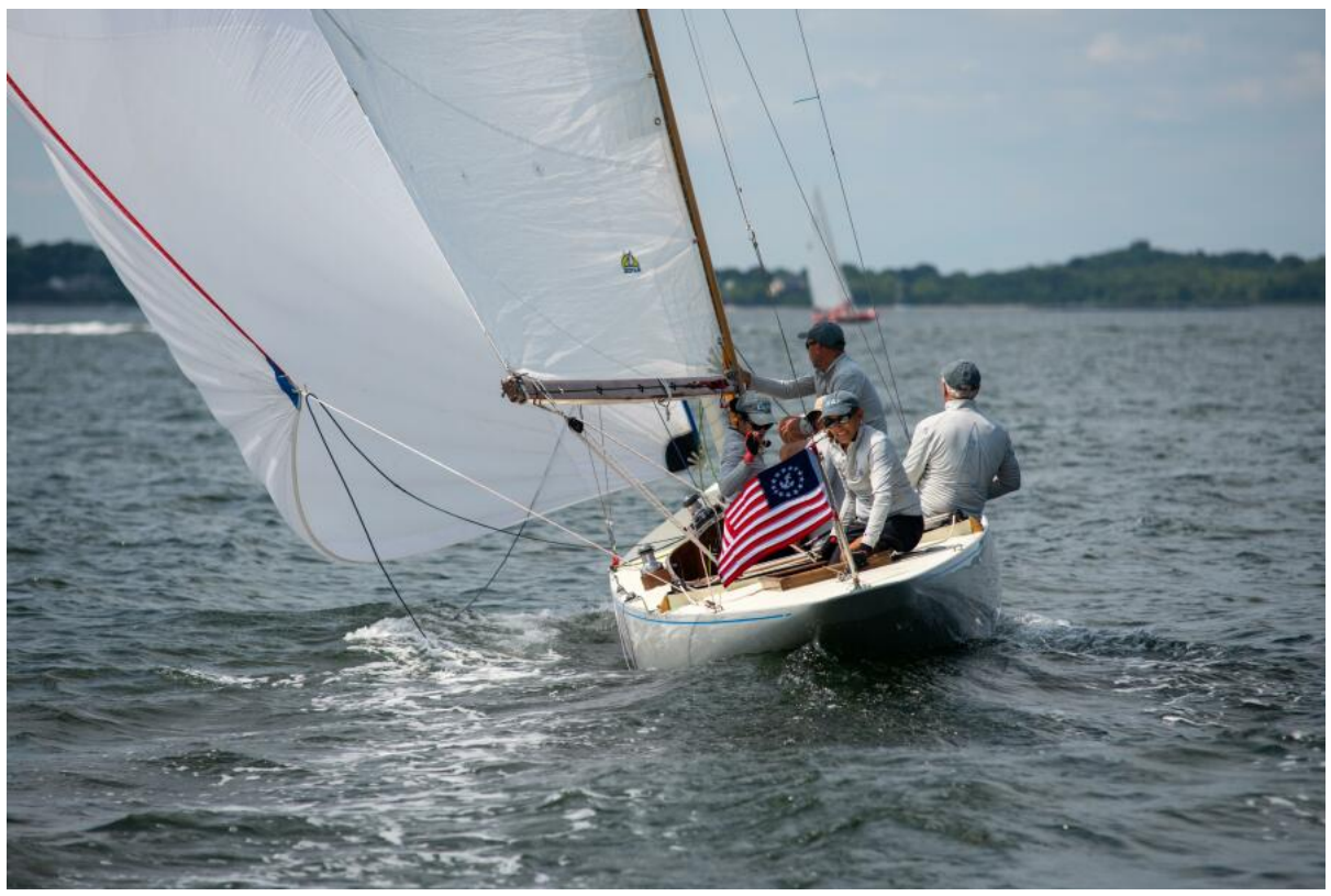
1944 L24 Leaf