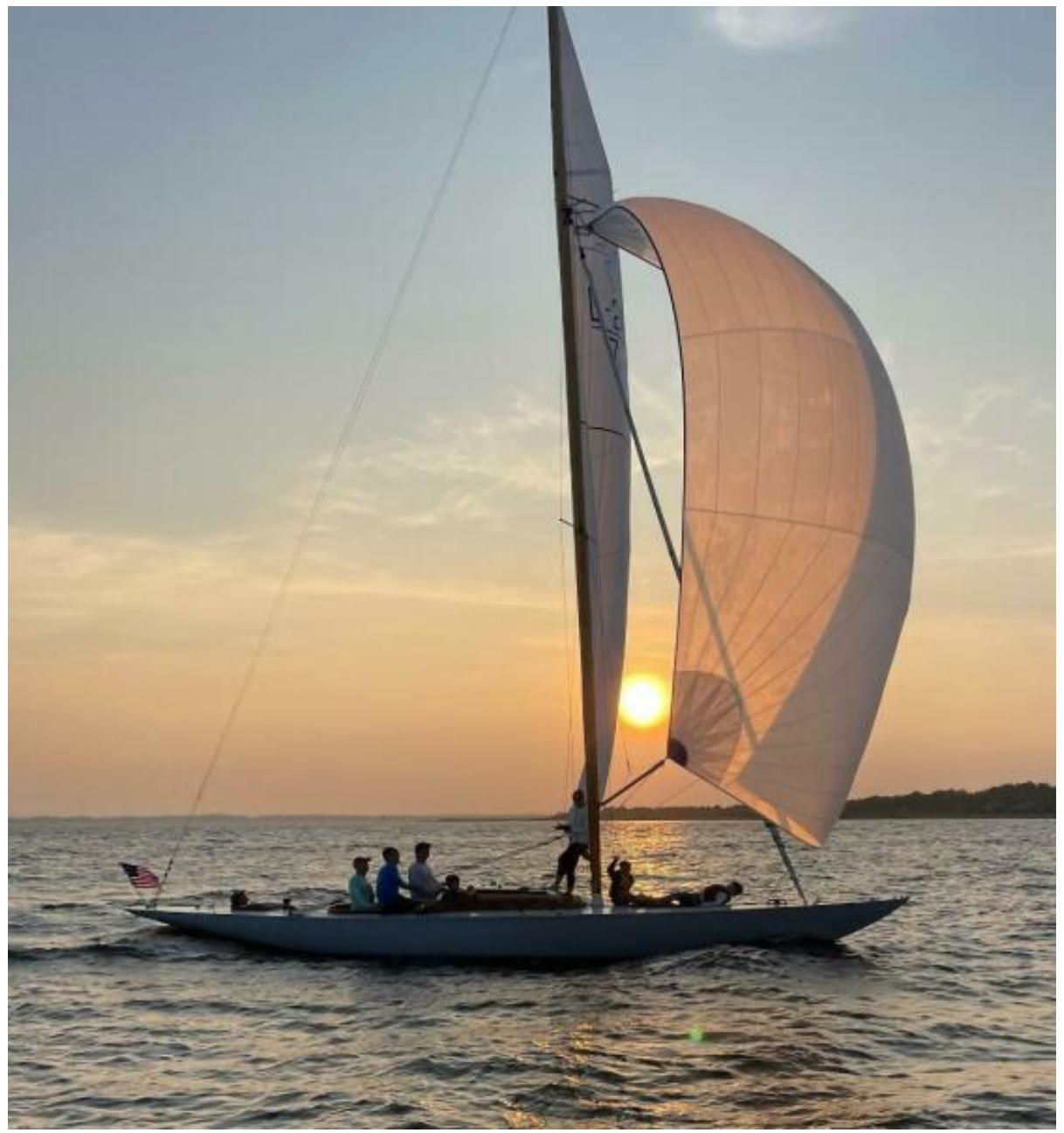
1944 L24 Leaf