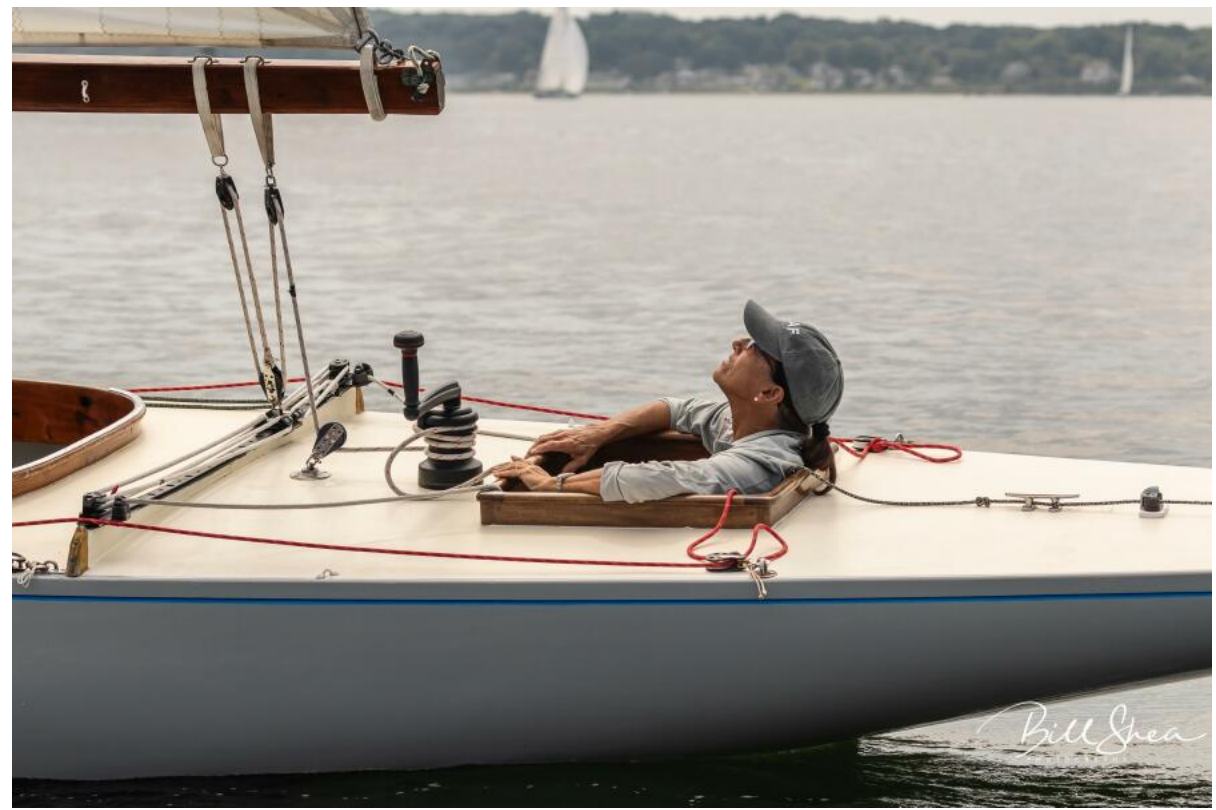
1944 L24 Leaf