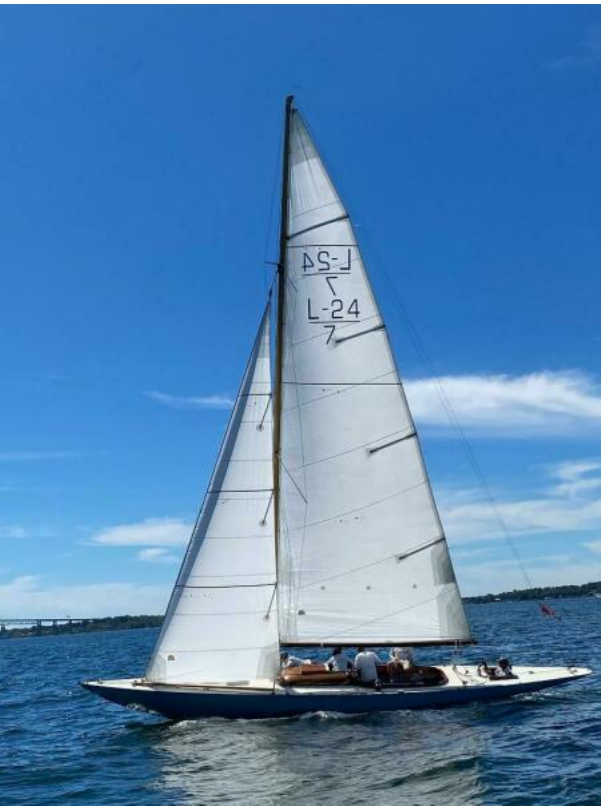
1944 L24 Leaf