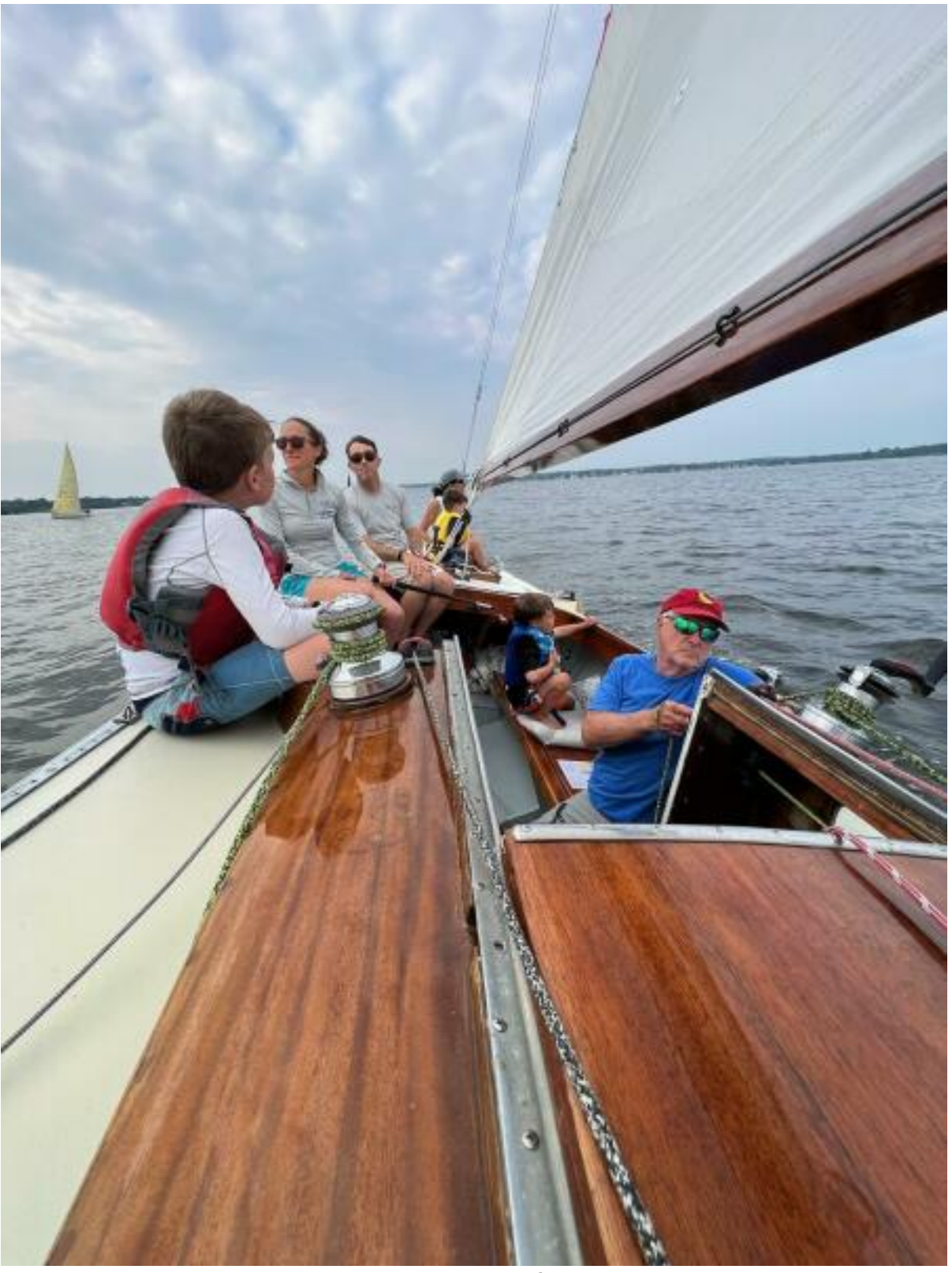
1944 L24 Leaf