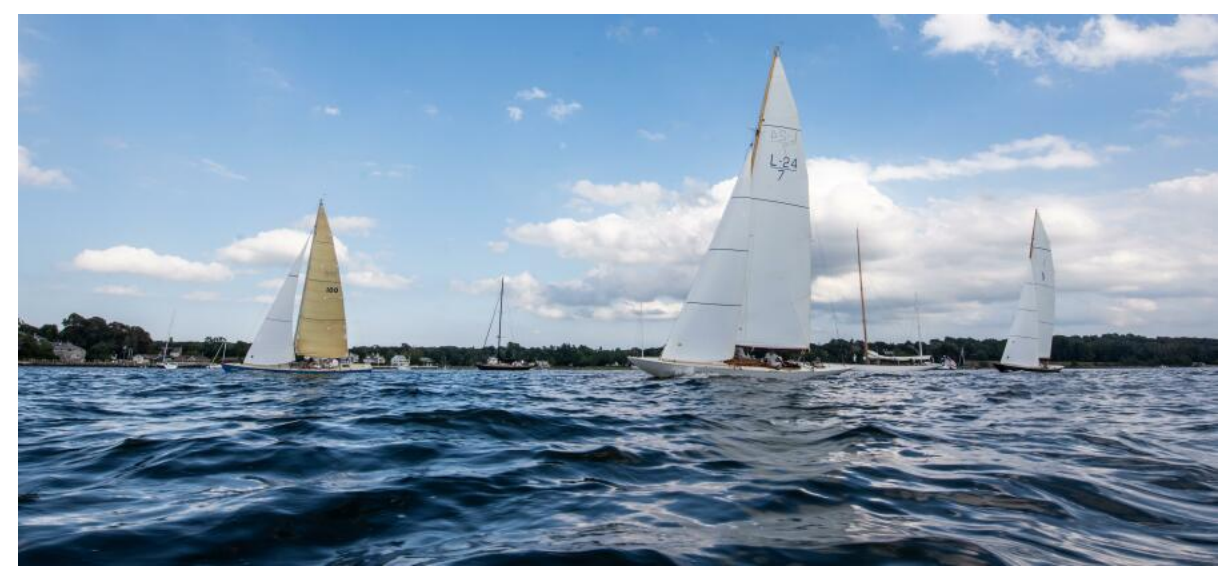
1944 L24 Leaf