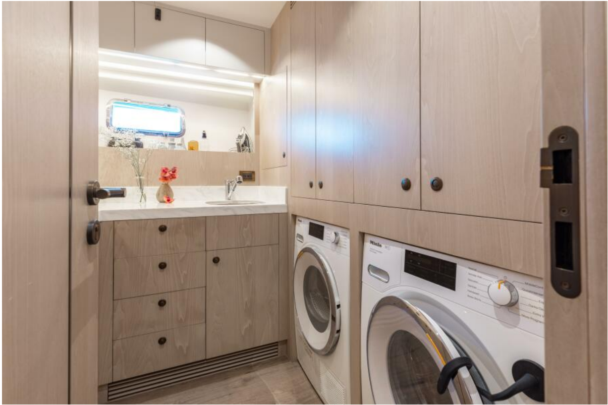
2021 Horizon FD110 (UNTETHERED) Laundry Room