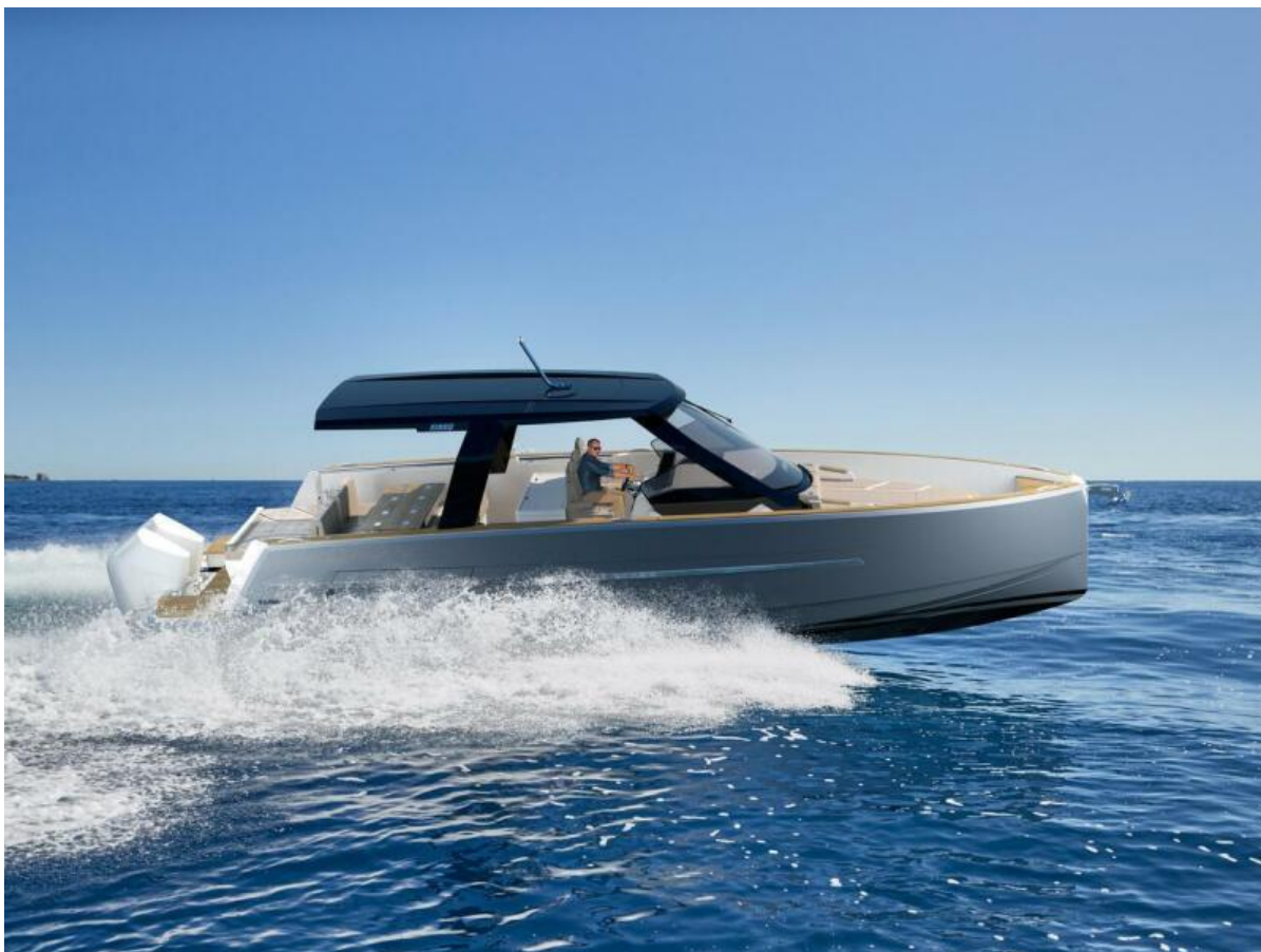
2024 FJORD 39 XP