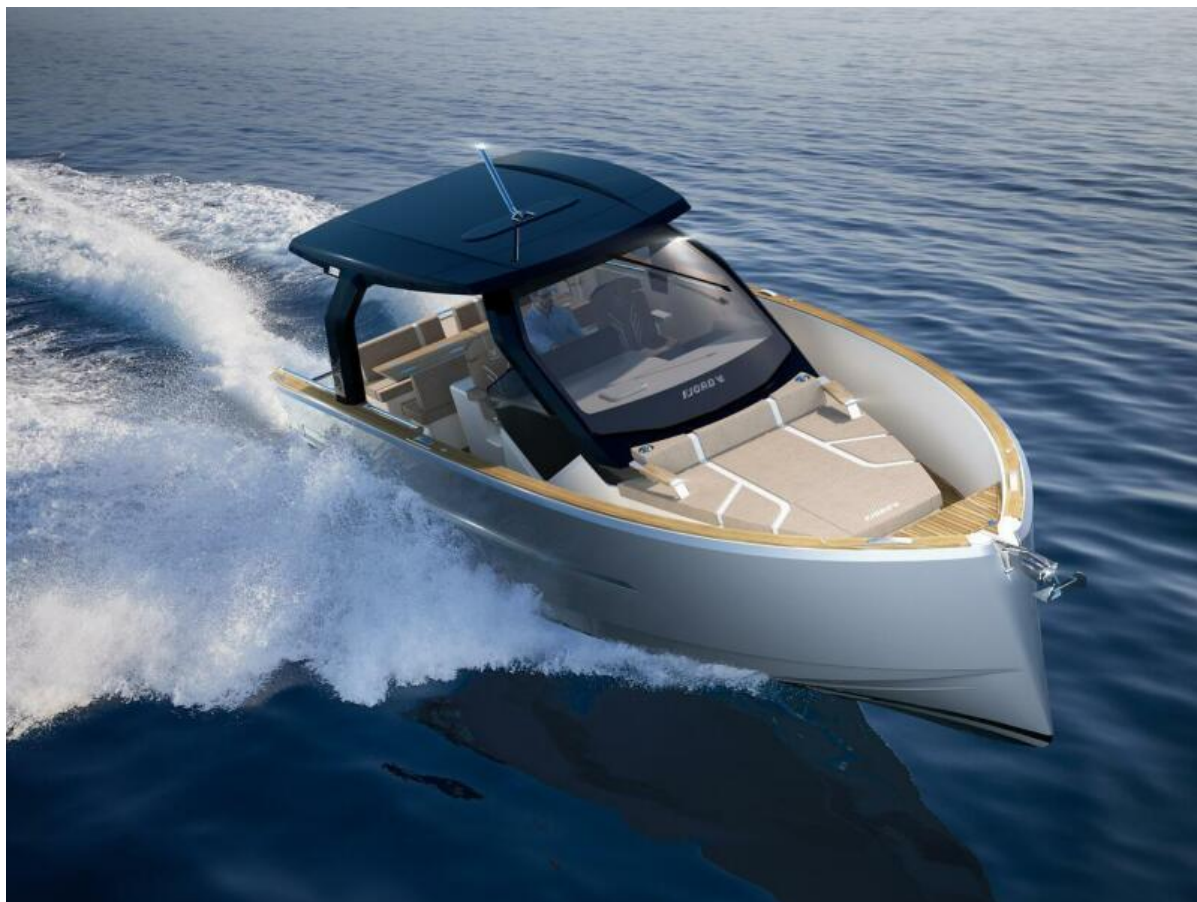
2024 FJORD 39 XL