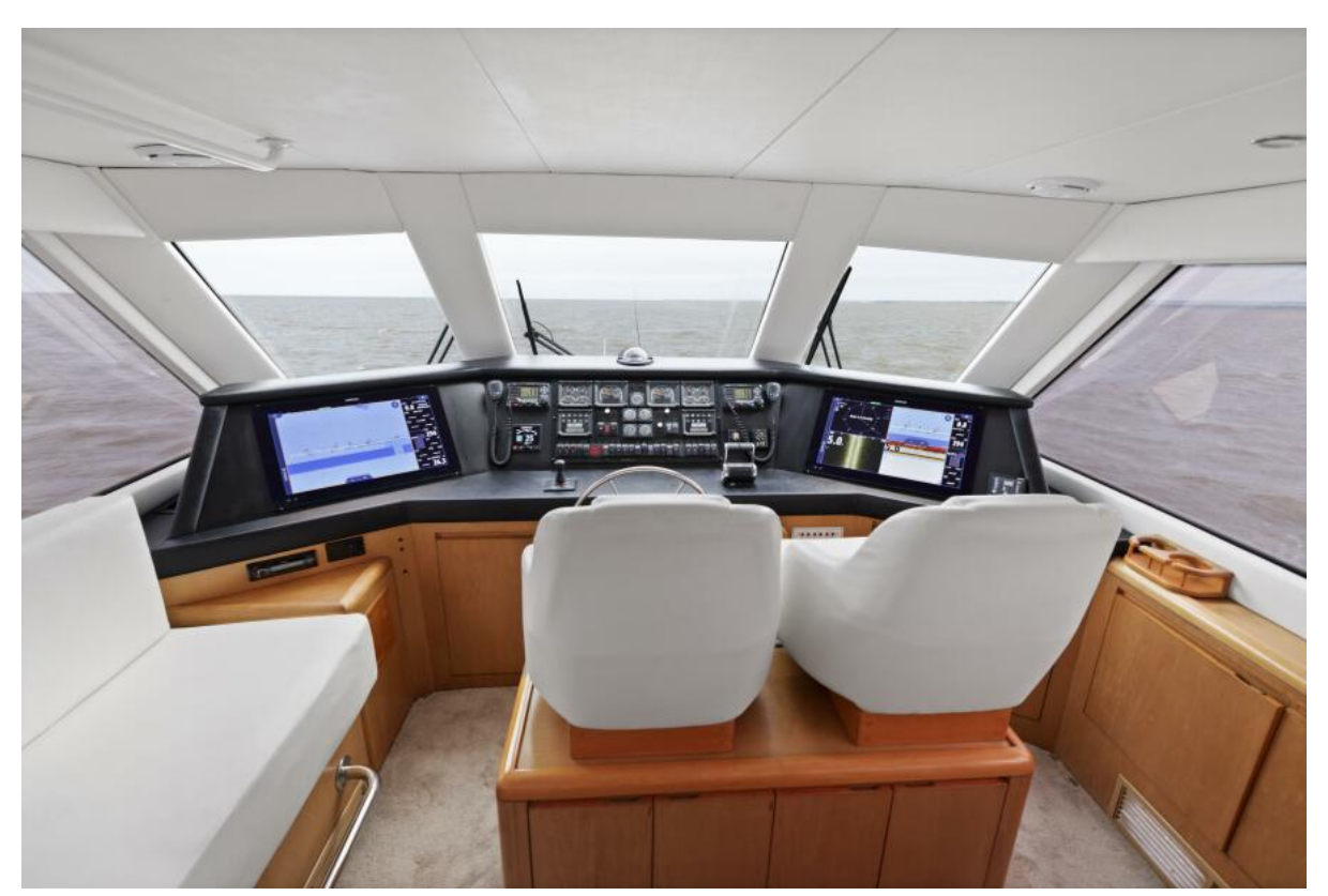
1999 Hatteras 60 Enclosed Bridge- REEL TIME- Helm