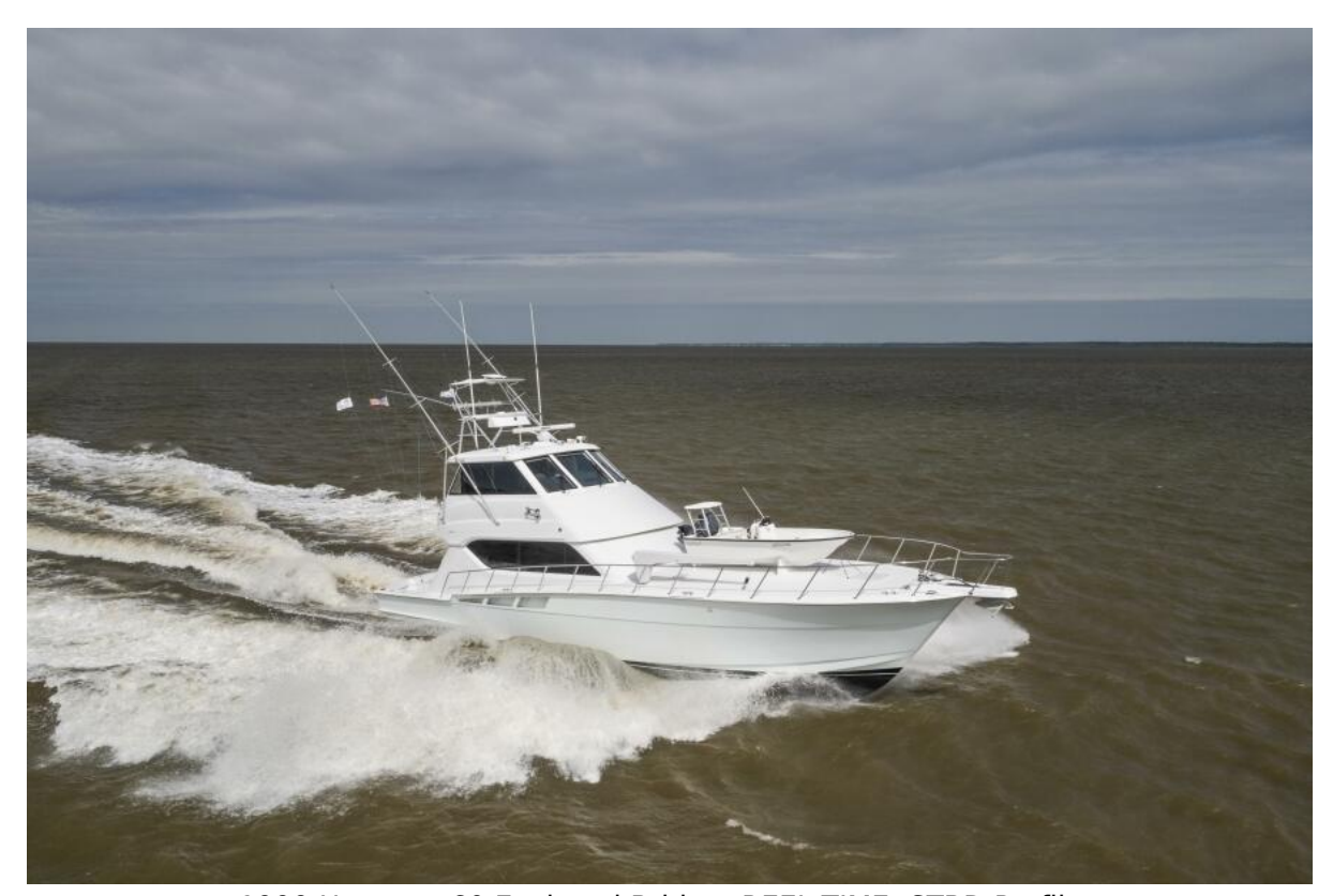
1999 Hatteras 60 Enclosed Bridge- REEL TIME- STBD Profile