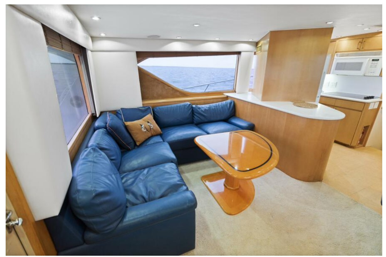
1999 Hatteras 60 Enclosed Bridge- REEL TIME- Salon