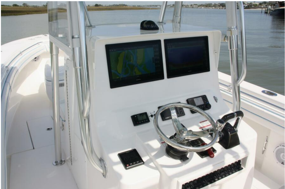
32 Contender 32ST- Helm 2017 Contender 32ST