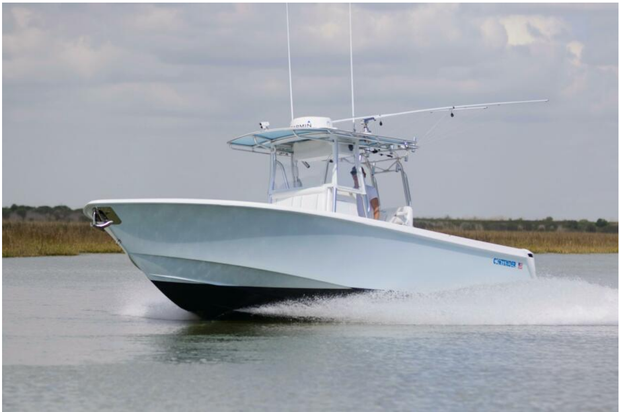
32 Contender 32ST- Profile 2017 Contender 32ST