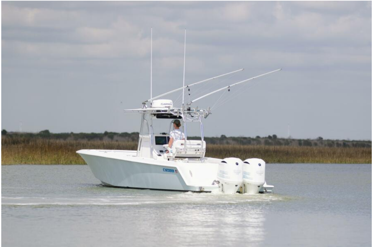
32 Contender 32ST- Profile 2017 Contender 32ST