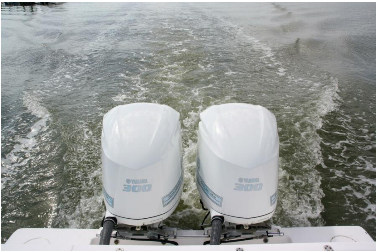
32 Contender 32ST- Engines 2017 Contender 32ST