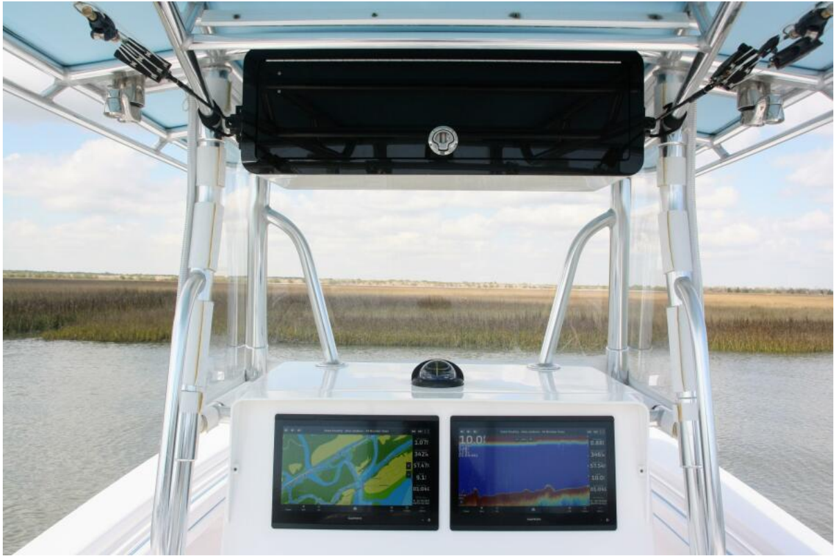
32 Contender 32ST- Helm 2017 Contender 32ST