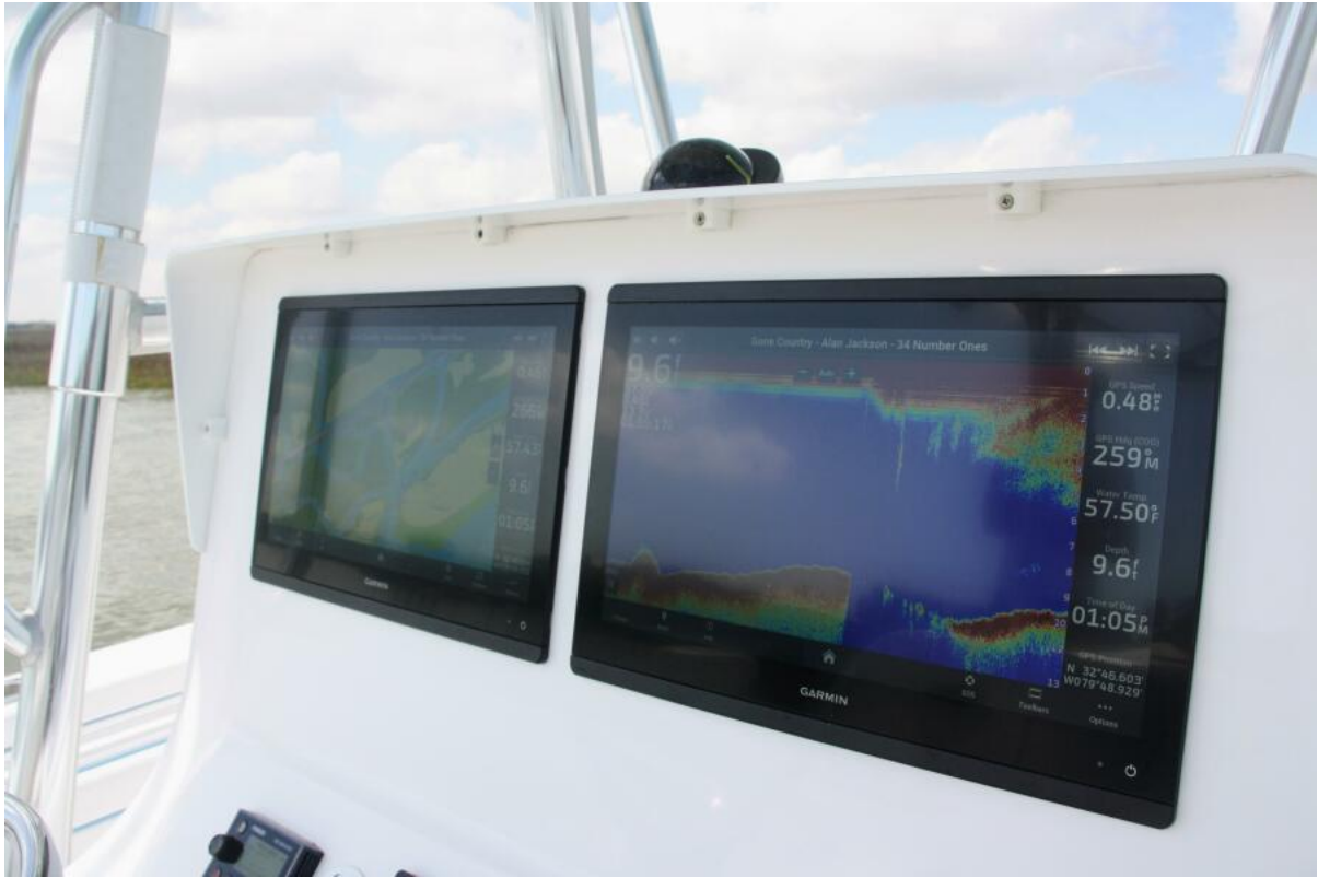
32 Contender 32ST- Helm 2017 Contender 32ST