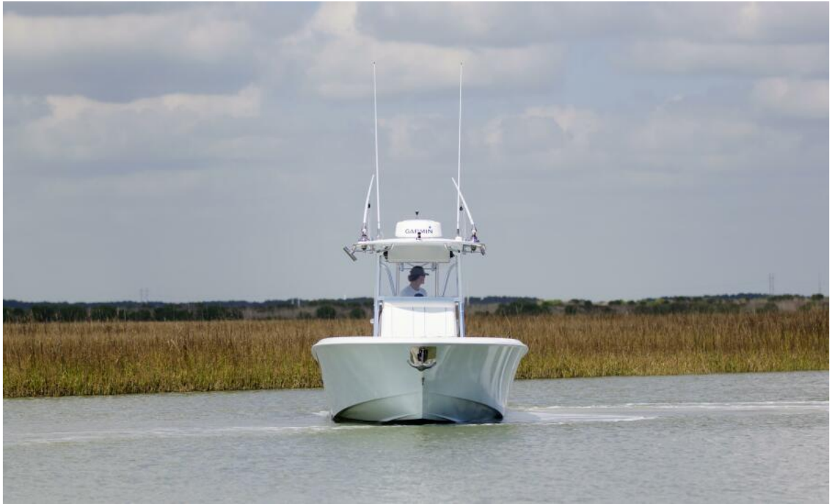
32 Contender 32ST- Profile 2017 Contender 32ST