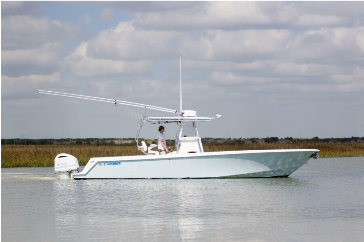
32 Contender 32ST- Profile 2017 Contender 32ST