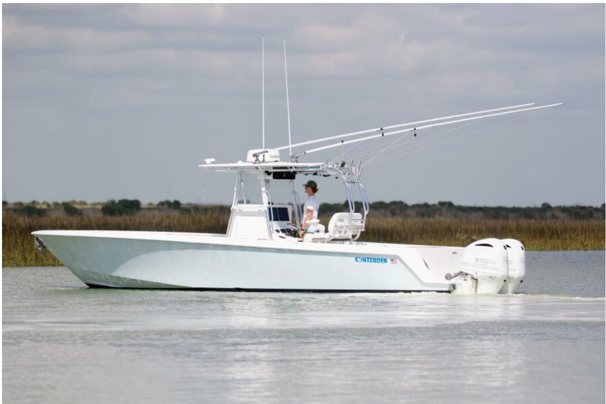
32 Contender 32ST- Profile 2017 Contender 32ST