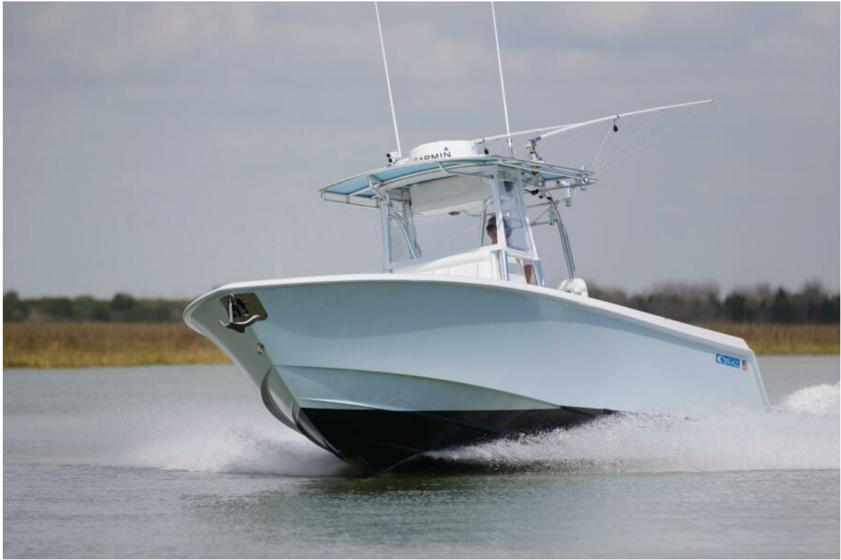
32 Contender 32ST- Profile 2017 Contender 32ST