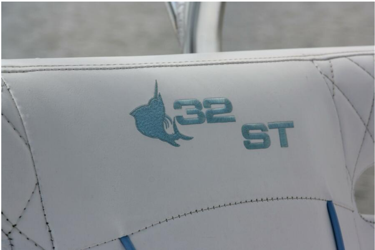
32 Contender 32ST- Seating 2017 Contender 32ST