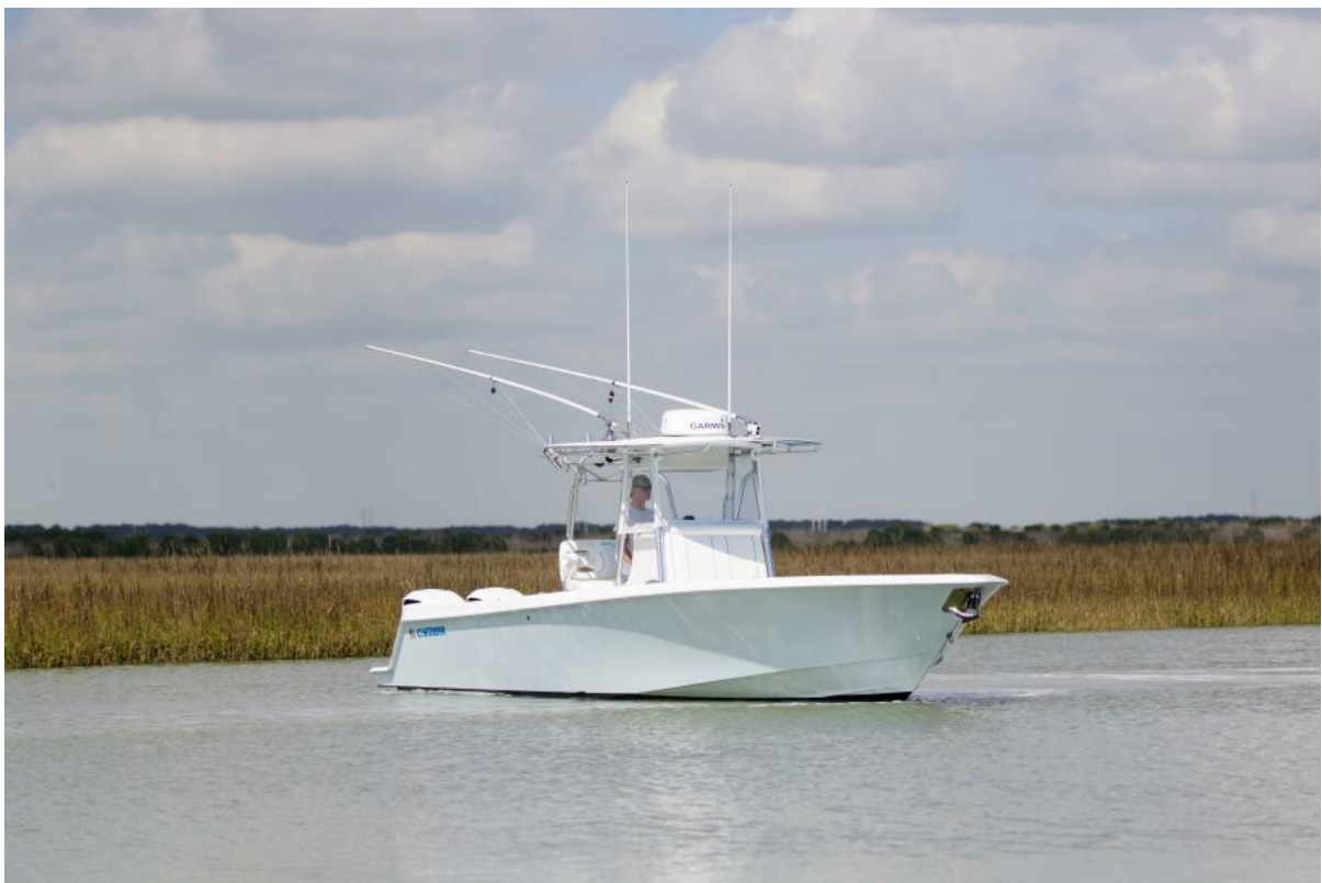
32 Contender 32ST- Profile 2017 Contender 32ST