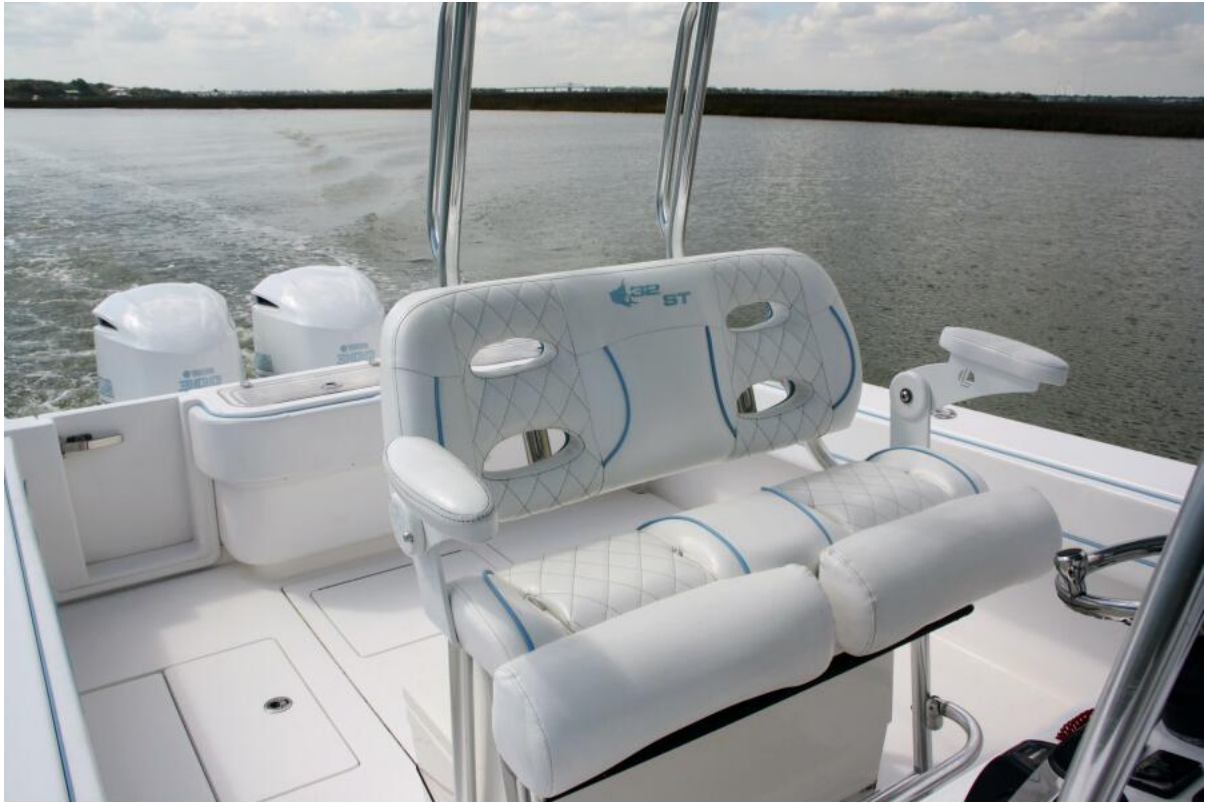
32 Contender 32ST- Cockpit 2017 Contender 32ST