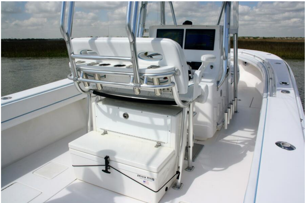
32 Contender 32ST- Helm 2017 Contender 32ST