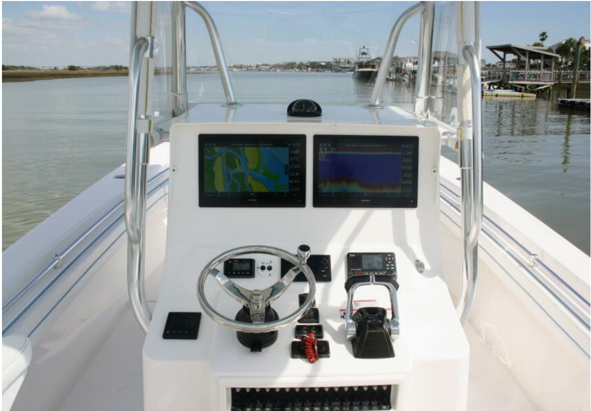
32 Contender 32ST- Helm 2017 Contender 32ST