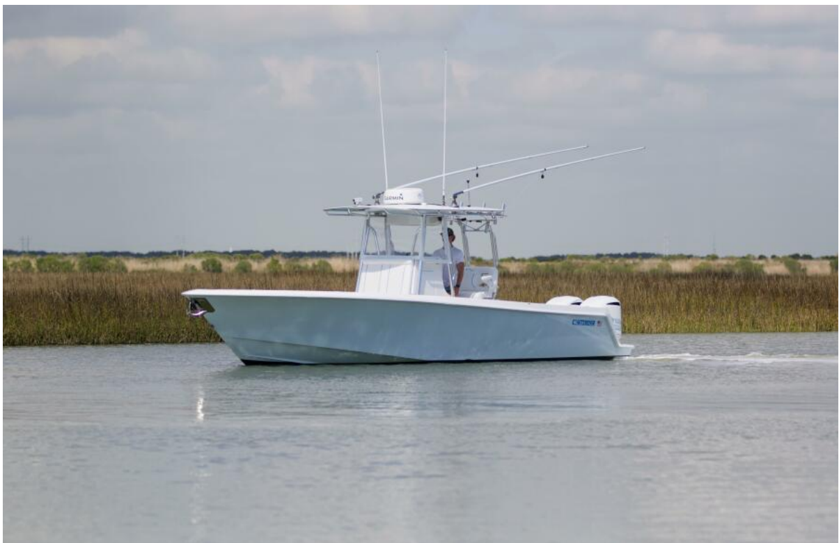
32 Contender 32ST- Profile 2017 Contender 32ST