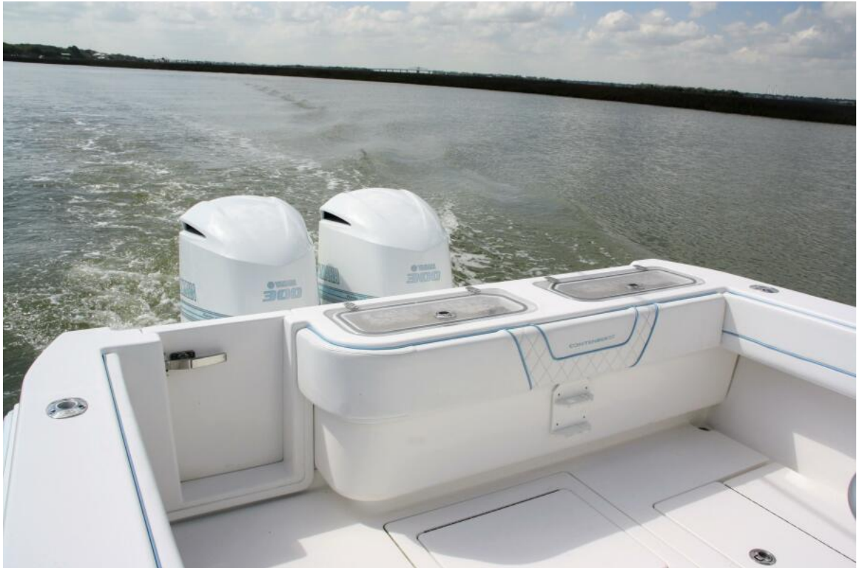
32 Contender 32ST- Cockpit 2017 Contender 32ST