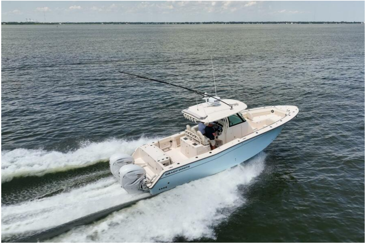
Grady-White 33 2022 Grady-White 33 Canyon 336