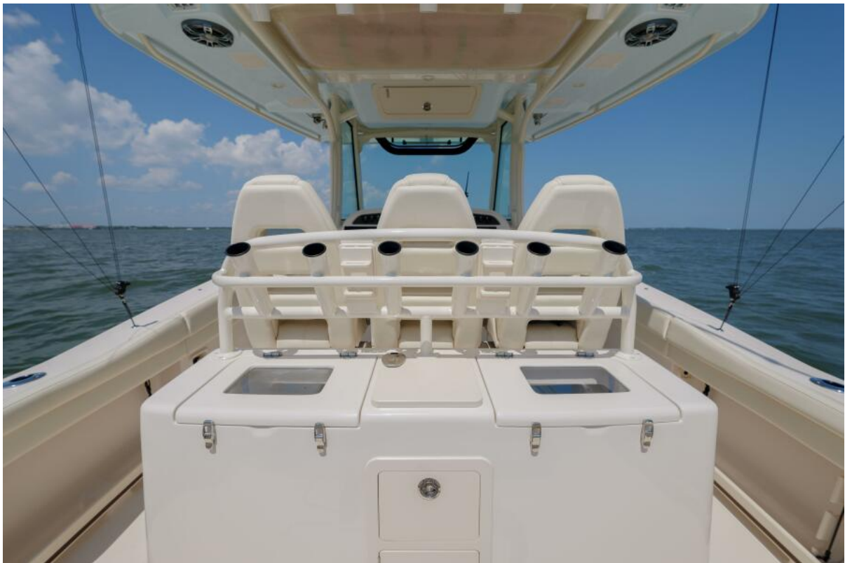
Grady-White 33 - Cockpit 2022 Grady-White 33 Canyon 336