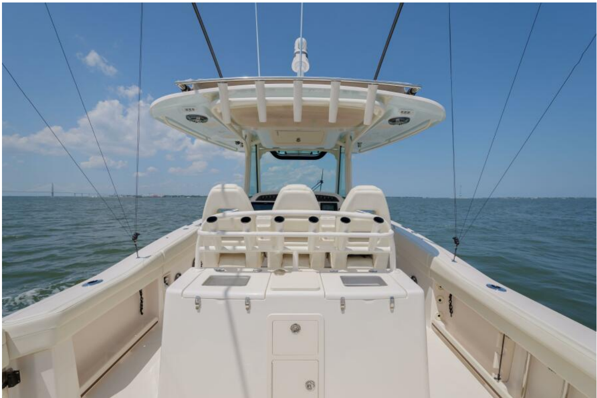
Grady-White 33 - Cockpit 2022 Grady-White 33 Canyon 336