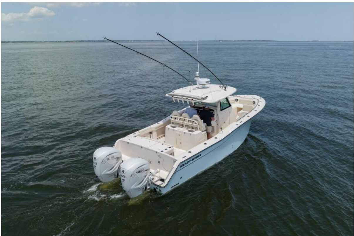
Grady-White 33- Profile 2022 Grady-White 33 Canyon 336