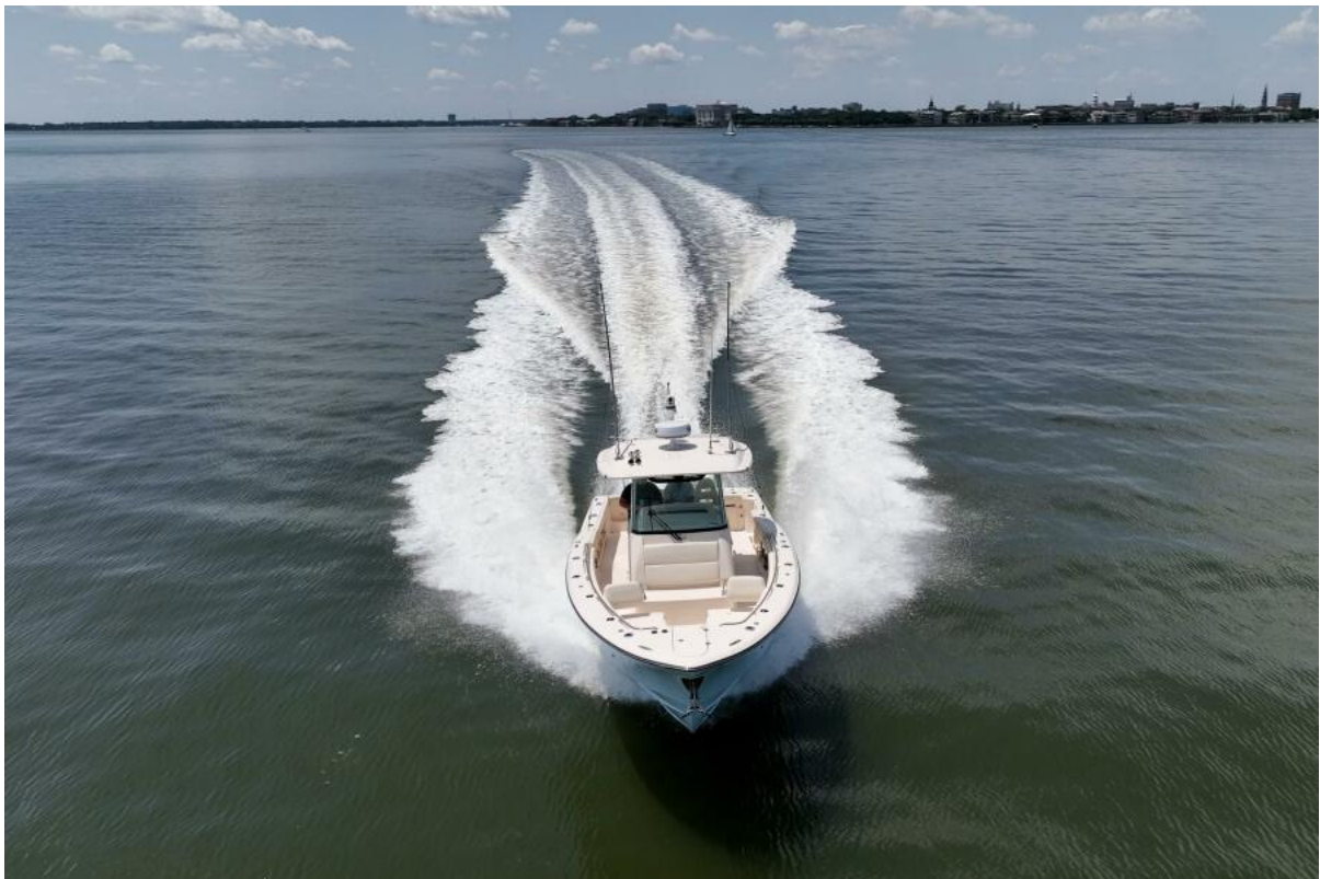
Grady-White 33 2022 Grady-White 33 Canyon 336