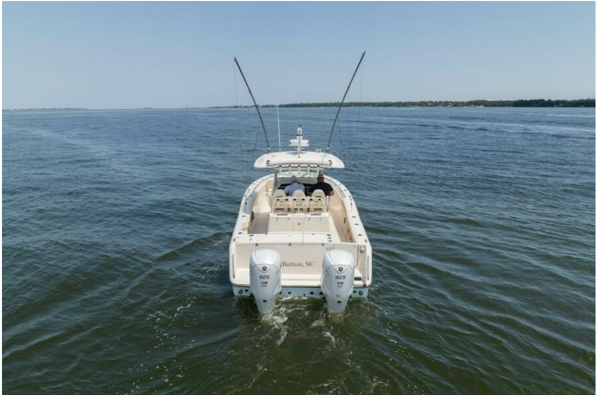
Grady-White 33- Profile 2022 Grady-White 33 Canyon 336