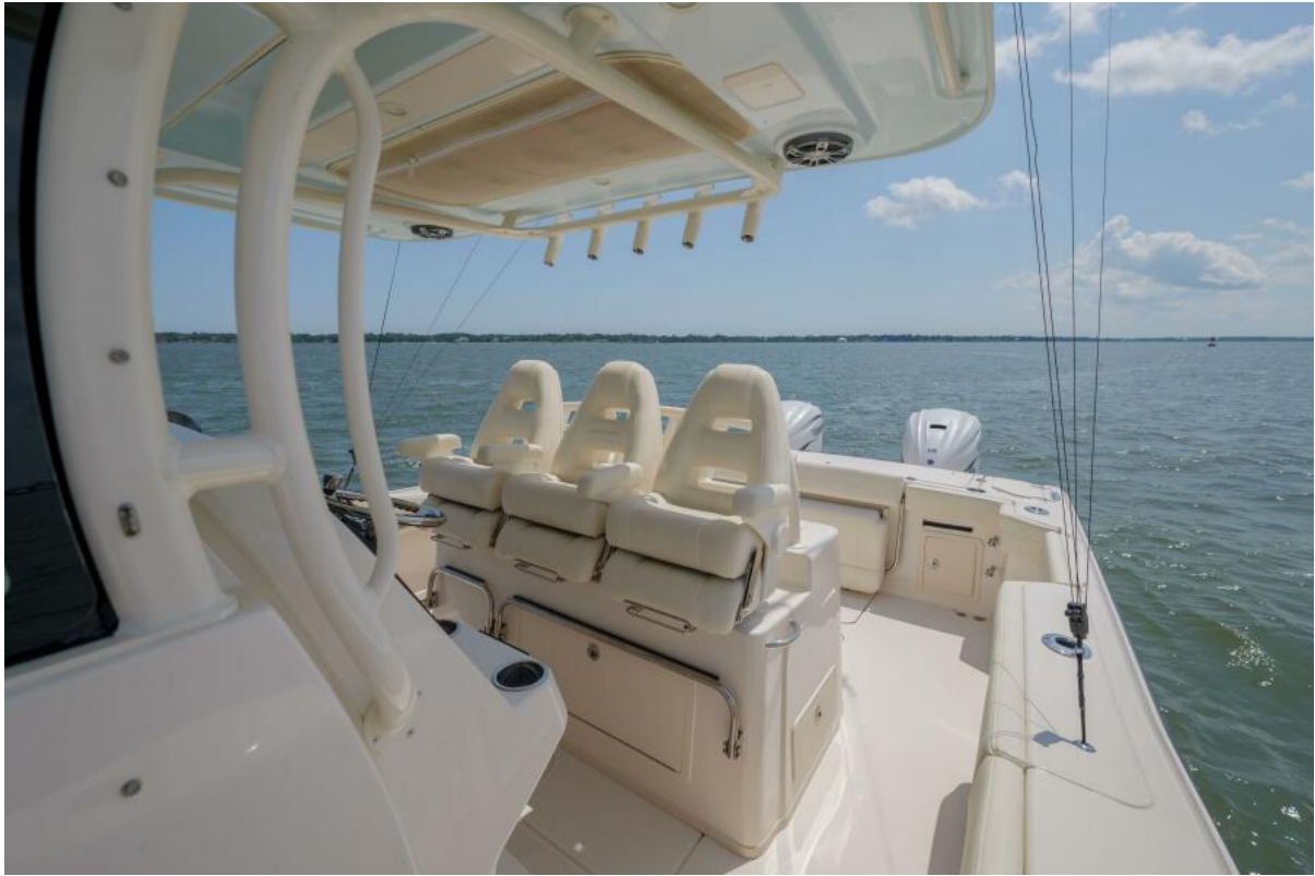
Grady-White 33 2022 Grady-White 33 Canyon 336