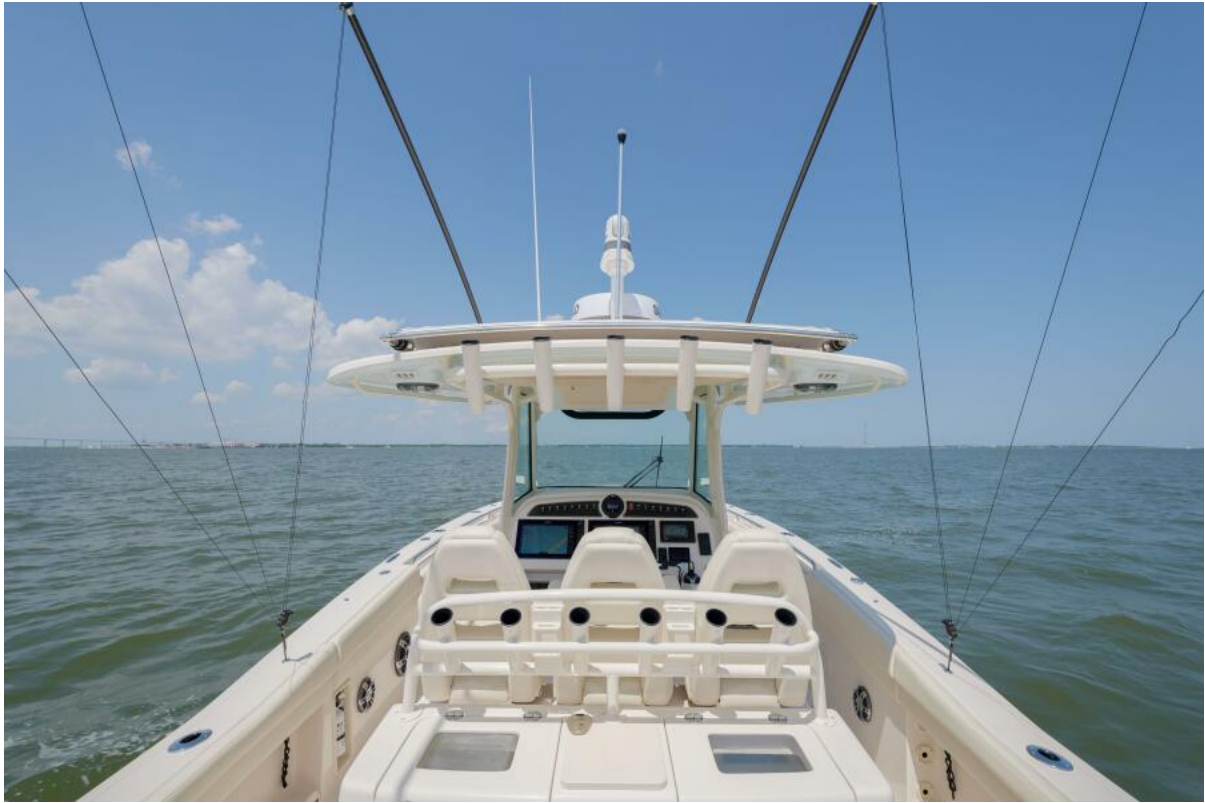
Grady-White 33 - Cockpit 2022 Grady-White 33 Canyon 336