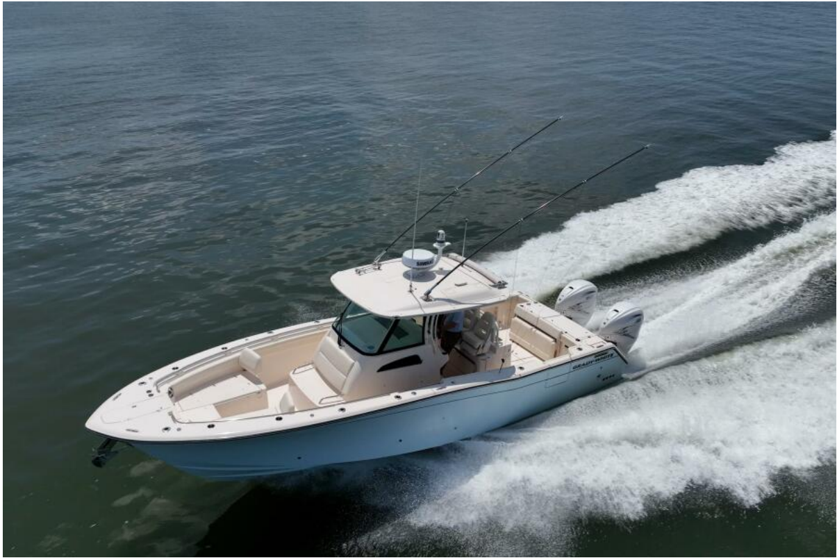
Grady-White 33 2022 Grady-White 33 Canyon 336