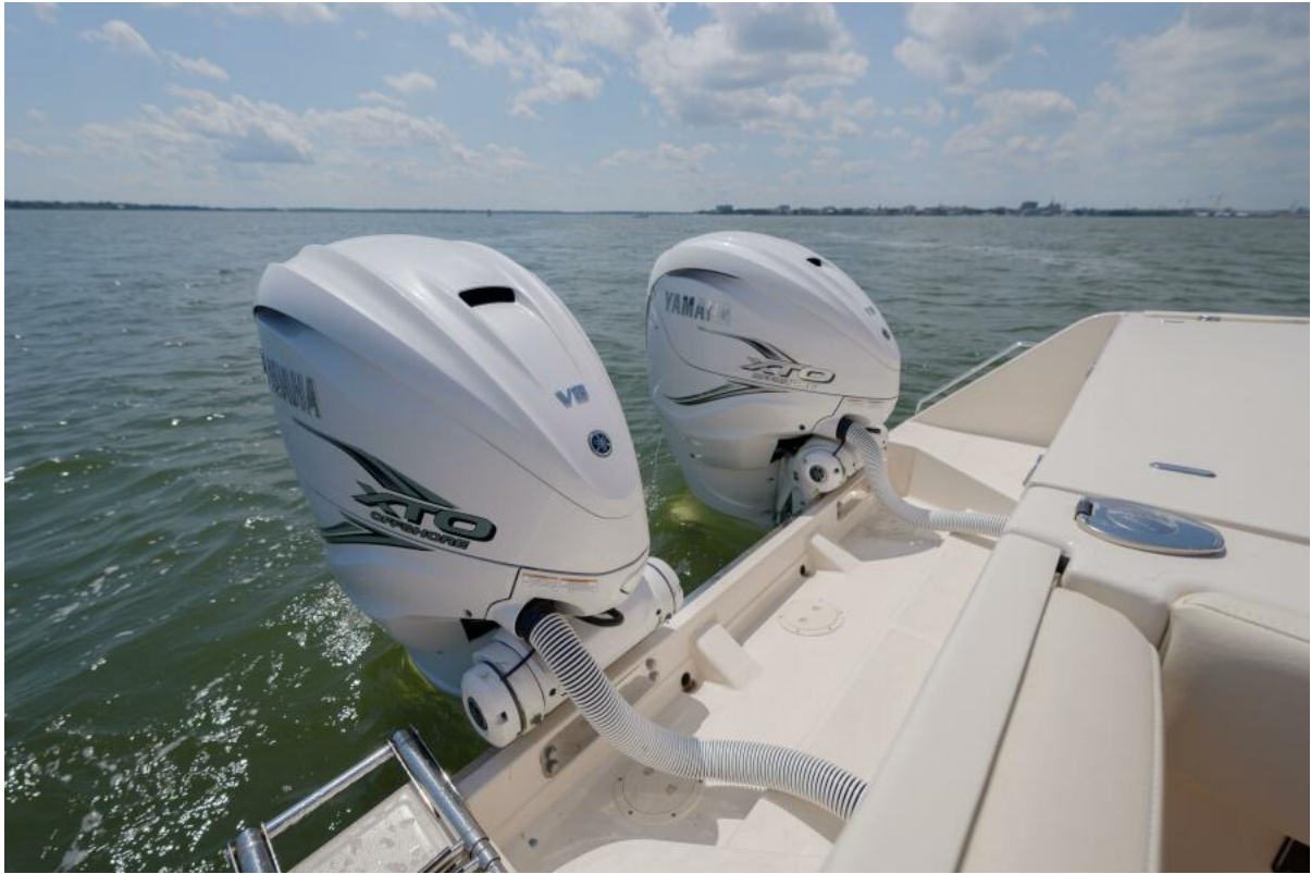
Grady-White 33 - Engines 2022 Grady-White 33 Canyon 336