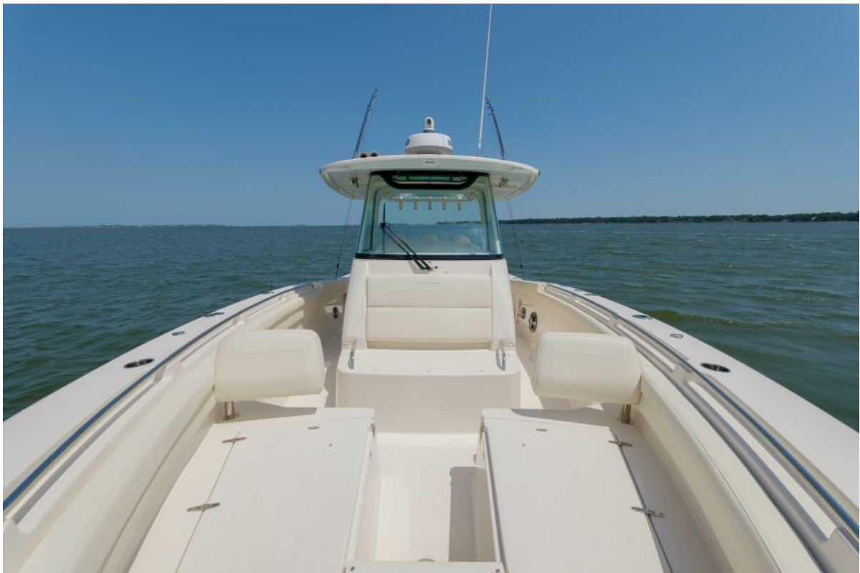
Grady-White 33 - Console 2022 Grady-White 33 Canyon 336