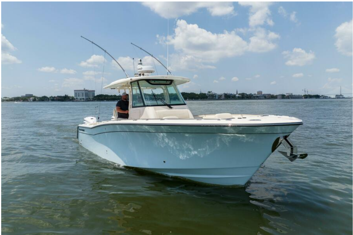
Grady-White 33- Profile 2022 Grady-White 33 Canyon 336