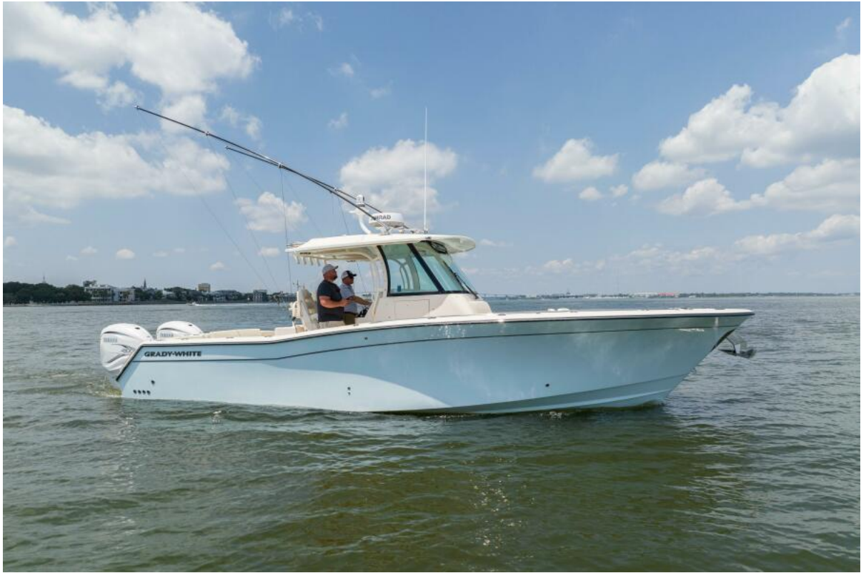
Grady-White 33- Profile 2022 Grady-White 33 Canyon 336