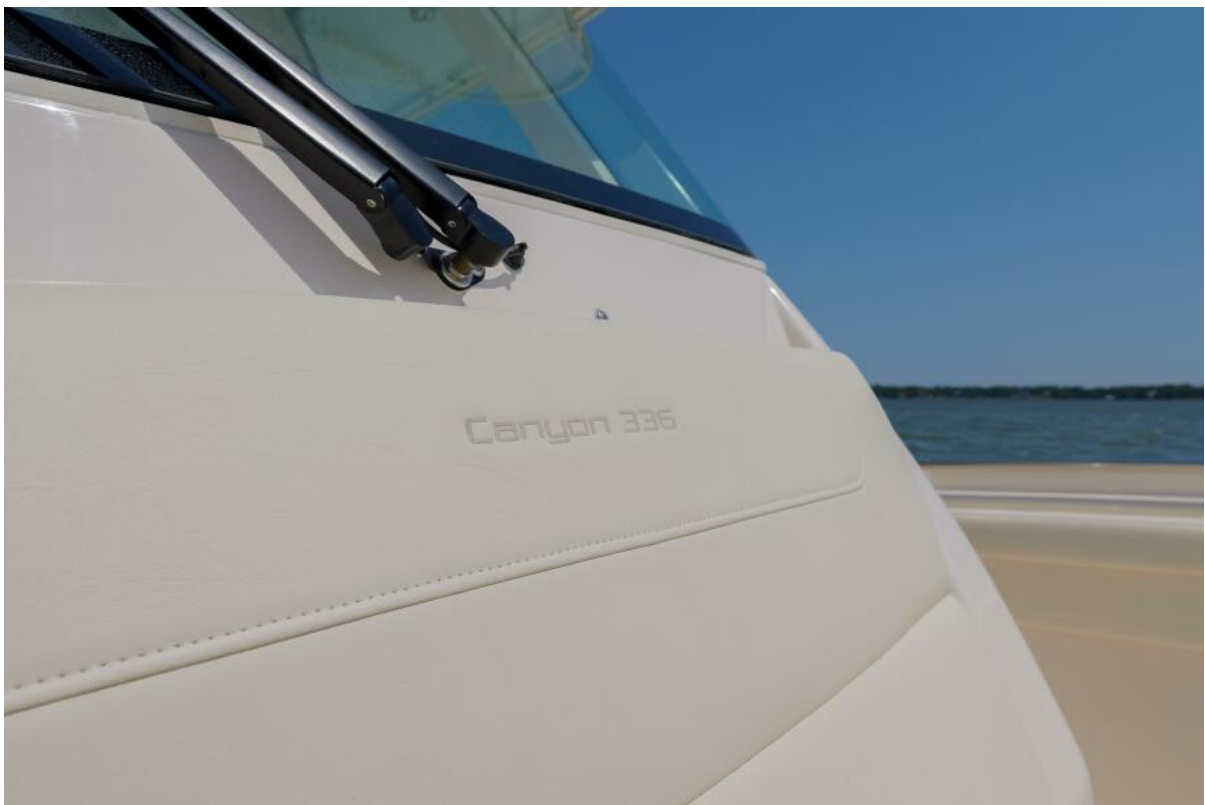
Grady-White 33 - Console 2022 Grady-White 33 Canyon 336