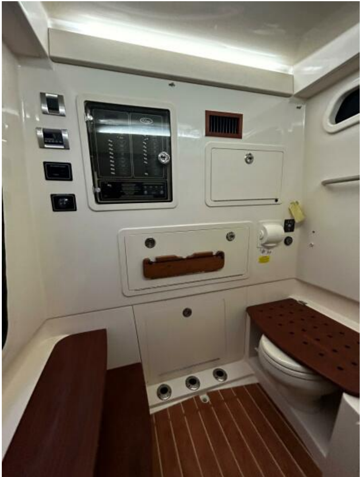
Grady-White 33 2022 Grady-White 33 Canyon 336