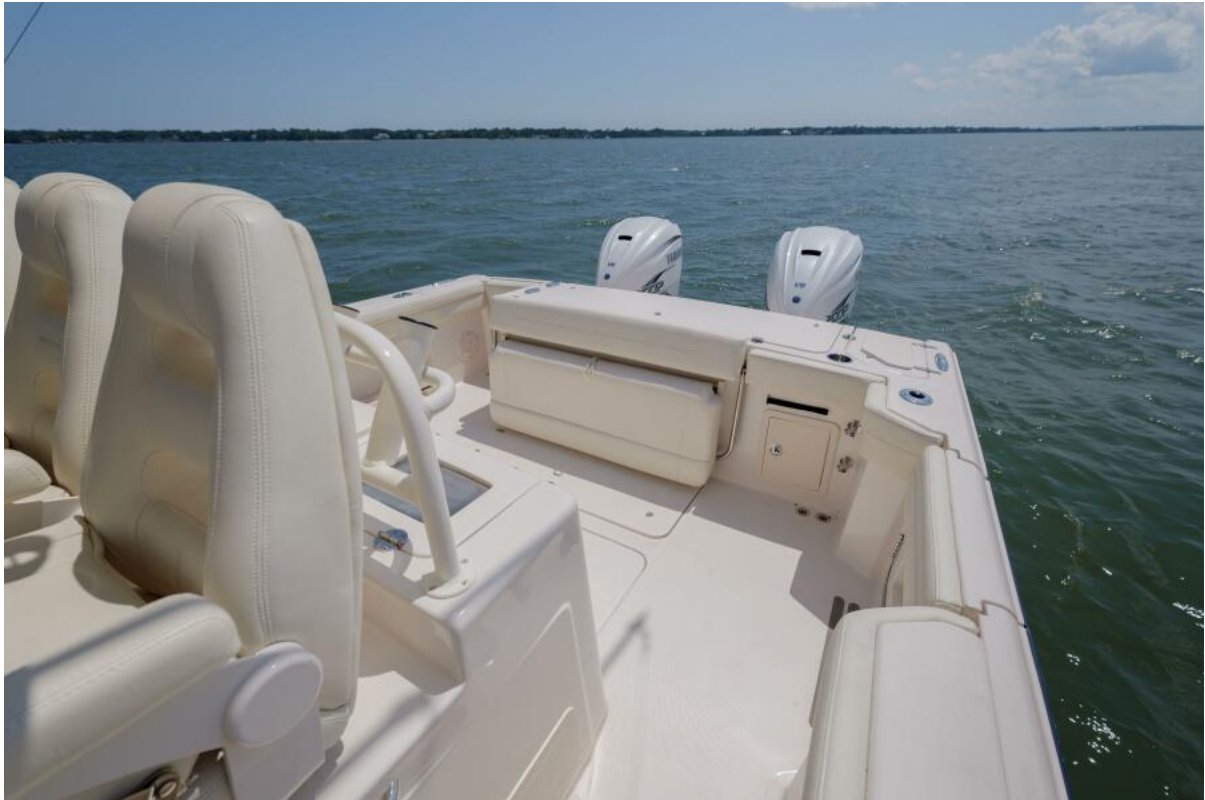
Grady-White 33 - Cockpit 2022 Grady-White 33 Canyon 336