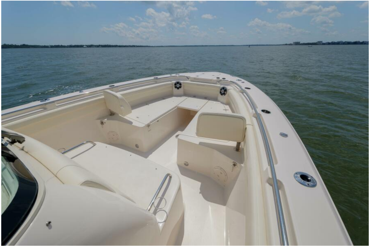
Grady-White 33 - Bow 2022 Grady-White 33 Canyon 336