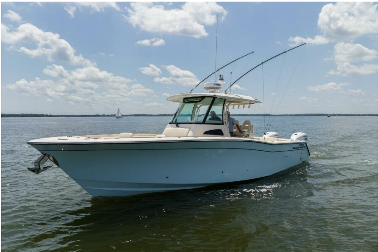
Grady-White 33 2022 Grady-White 33 Canyon 336