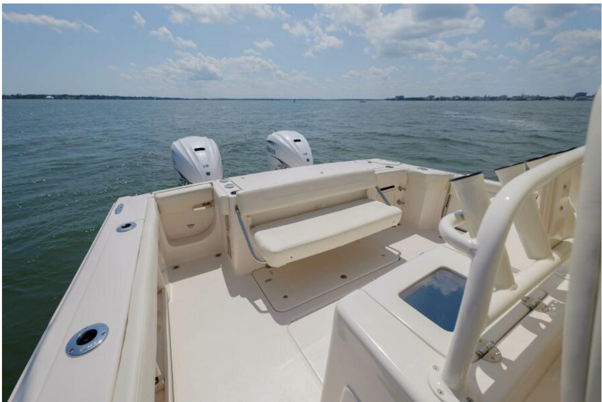
Grady-White 33 - Cockpit 2022 Grady-White 33 Canyon 336