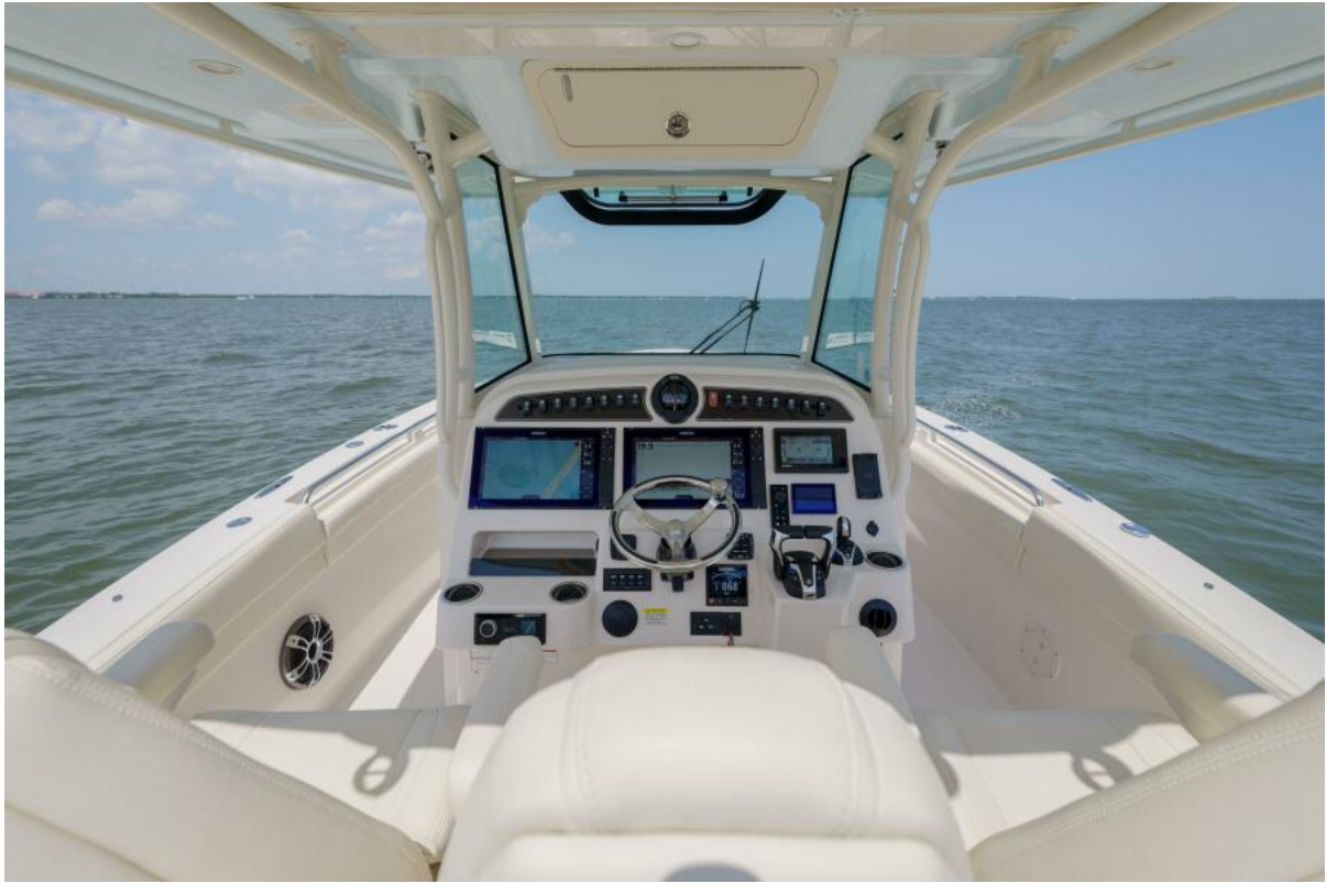
Grady-White 33 - Helm 2022 Grady-White 33 Canyon 336