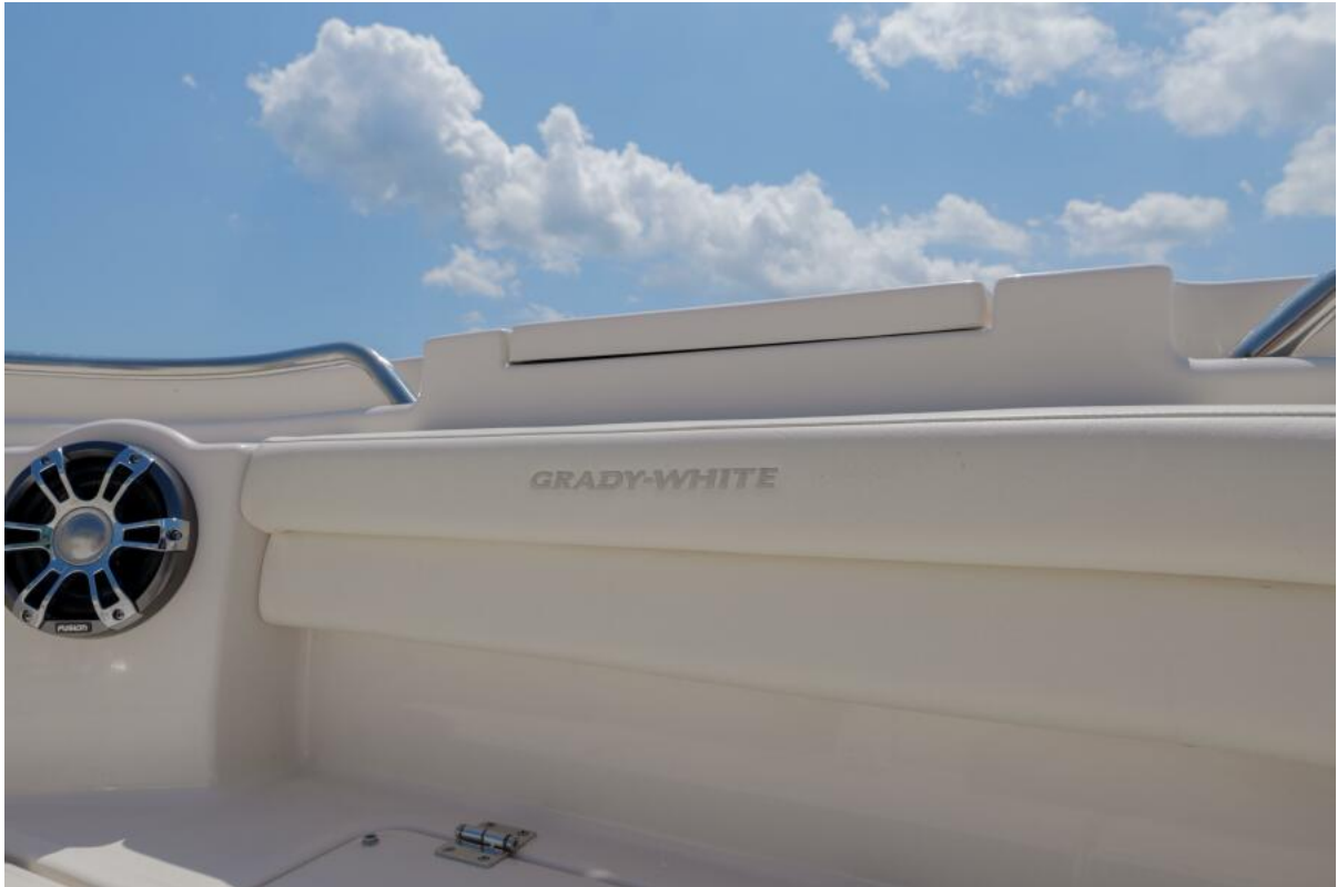
Grady-White 33 - Gunnel 2022 Grady-White 33 Canyon 336