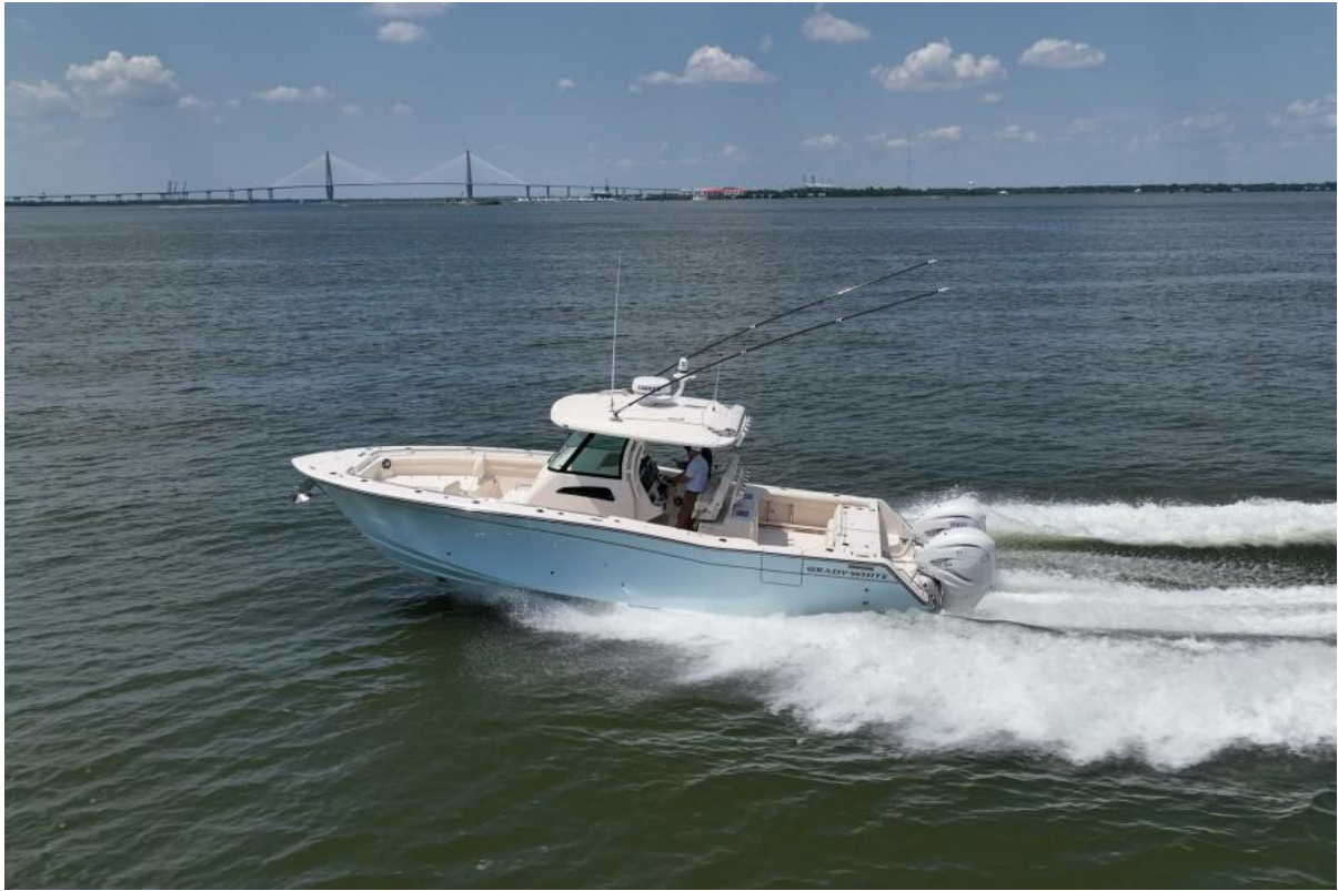
Grady-White 33 2022 Grady-White 33 Canyon 336