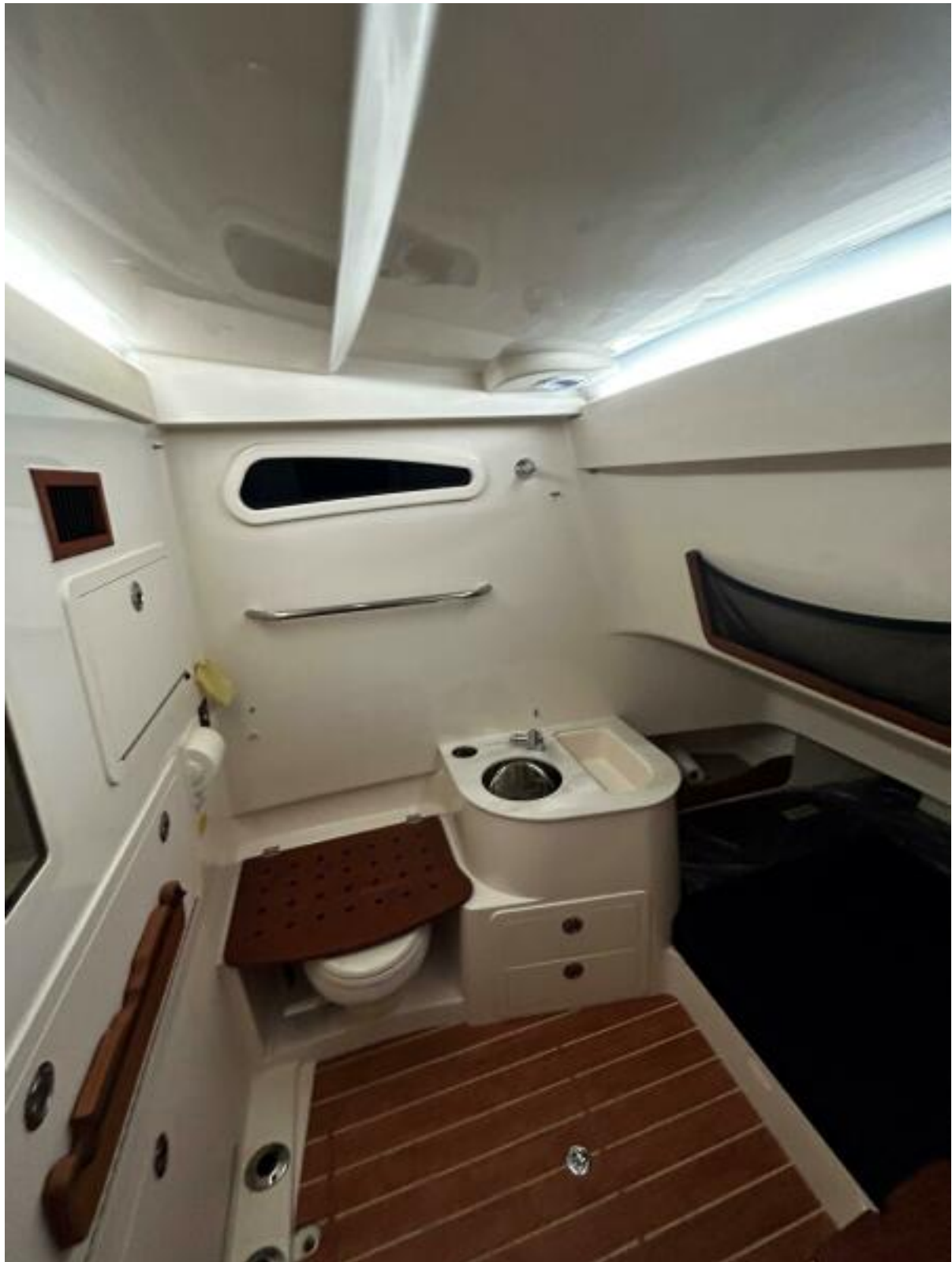
Grady-White 33 2022 Grady-White 33 Canyon 336