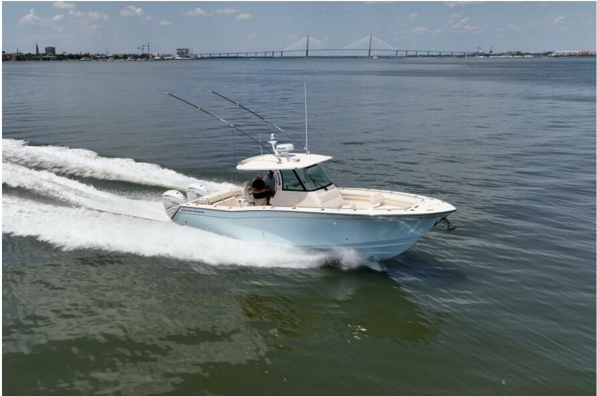
Grady-White 33 2022 Grady-White 33 Canyon 336