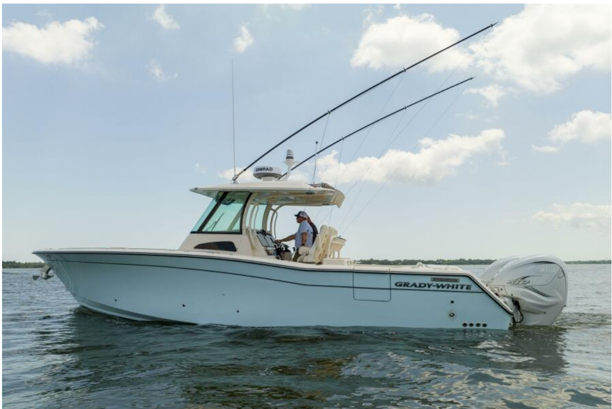
Grady-White 33 - Profile 2022 Grady-White 33 Canyon 336