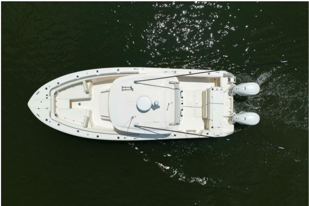
Grady-White 33 2022 Grady-White 33 Canyon 336