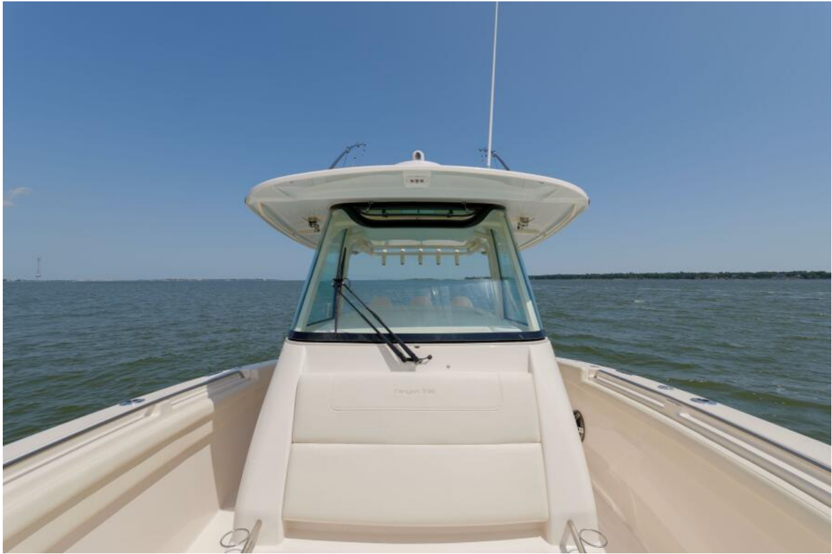
Grady-White 33 - Console 2022 Grady-White 33 Canyon 336