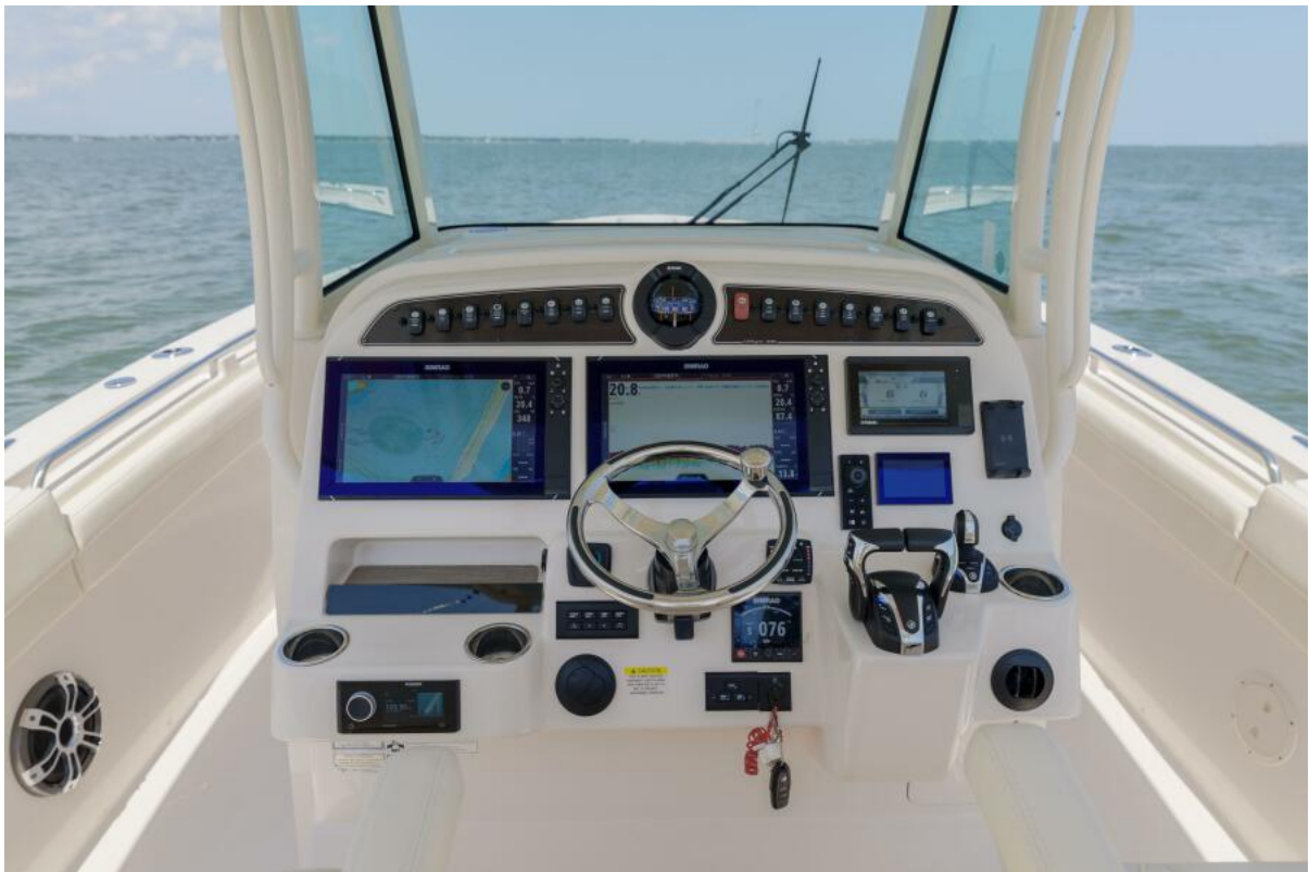
Grady-White 33 - Helm 2022 Grady-White 33 Canyon 336