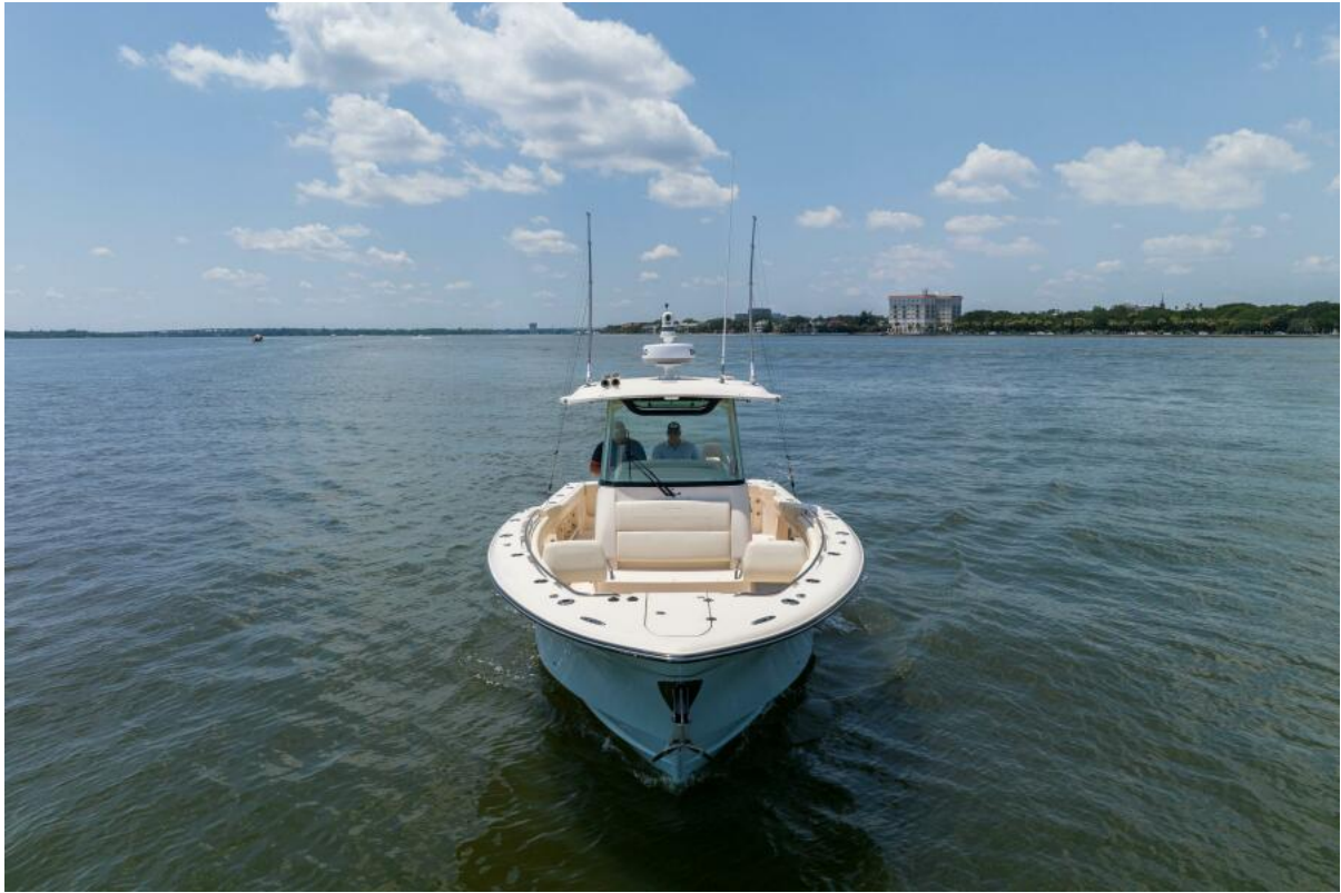
Grady-White 33 2022 Grady-White 33 Canyon 336