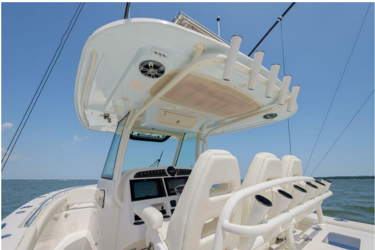
Grady-White 33 2022 Grady-White 33 Canyon 336