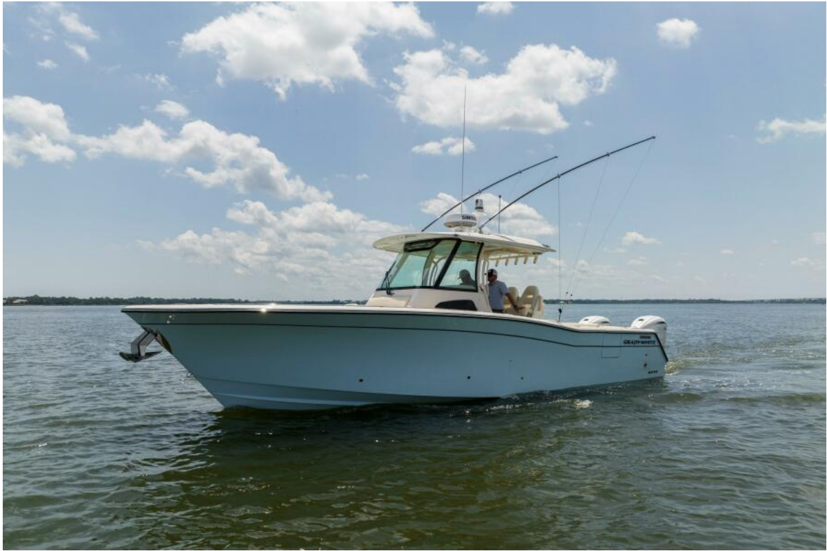
Grady-White 33 2022 Grady-White 33 Canyon 336