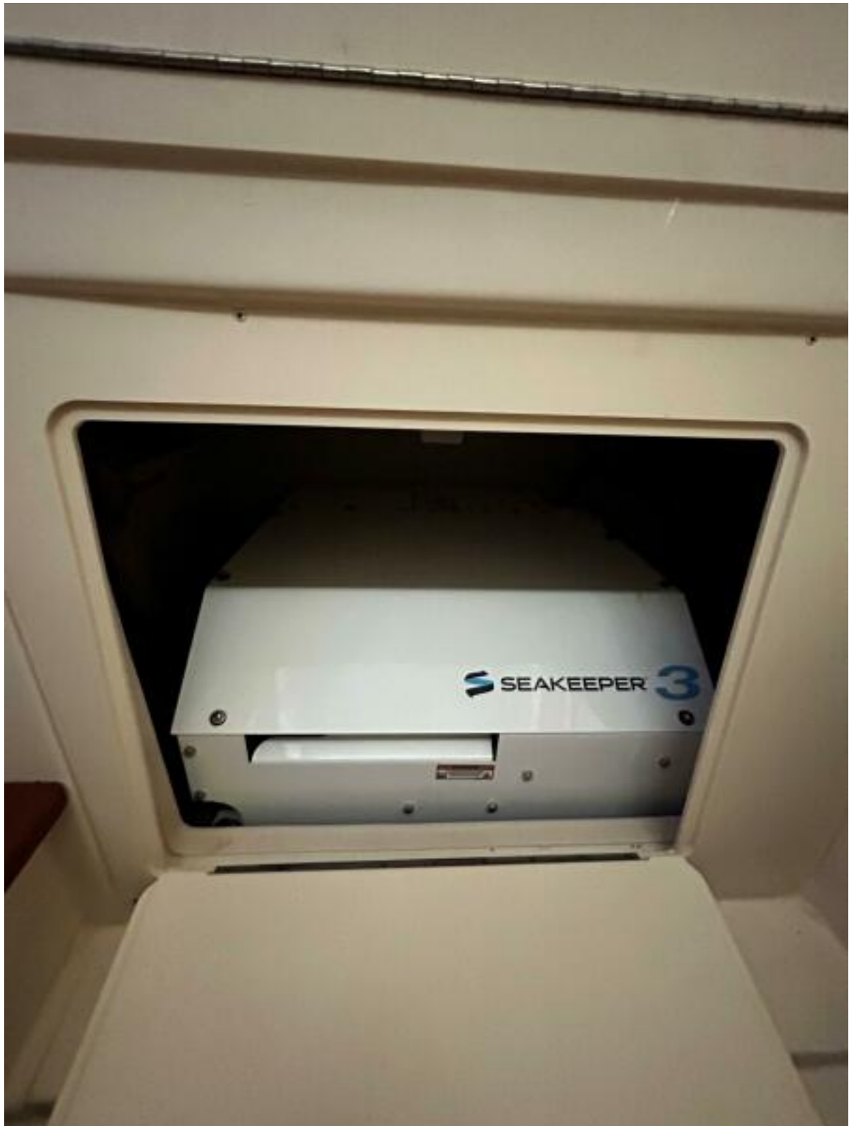
Grady-White 33 2022 Grady-White 33 Canyon 336