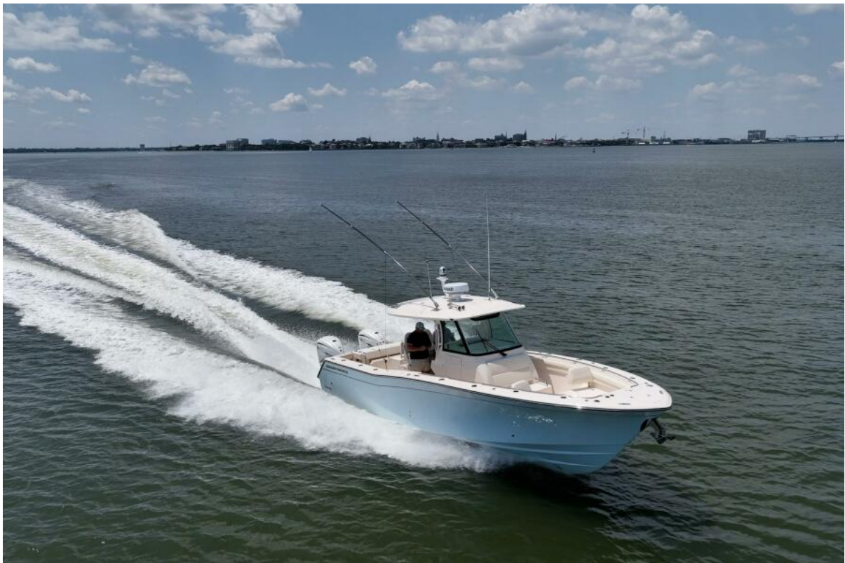
Grady-White 33 2022 Grady-White 33 Canyon 336