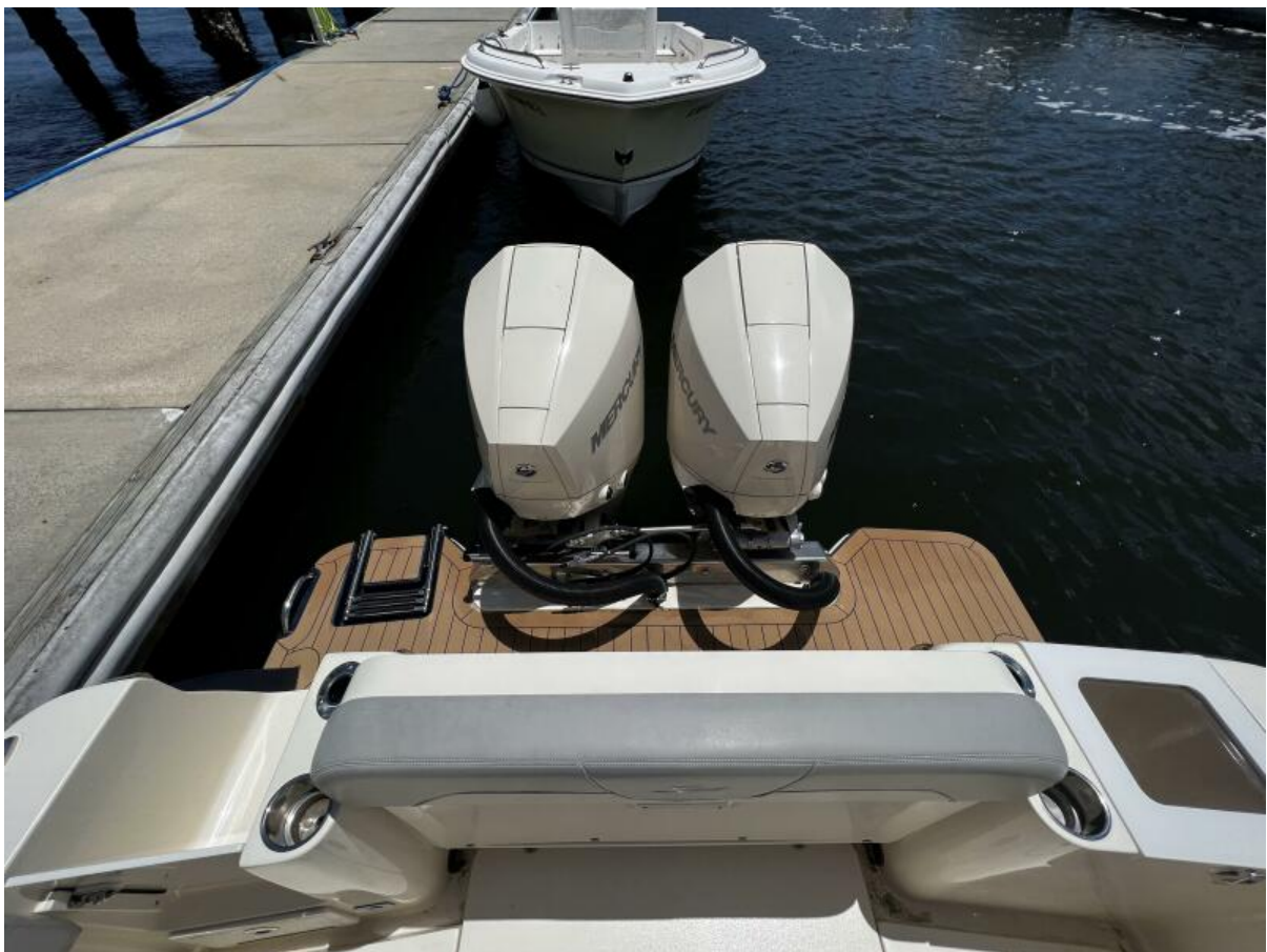
Scout 277 LXF - Engines 2021 Scout 277 LXF