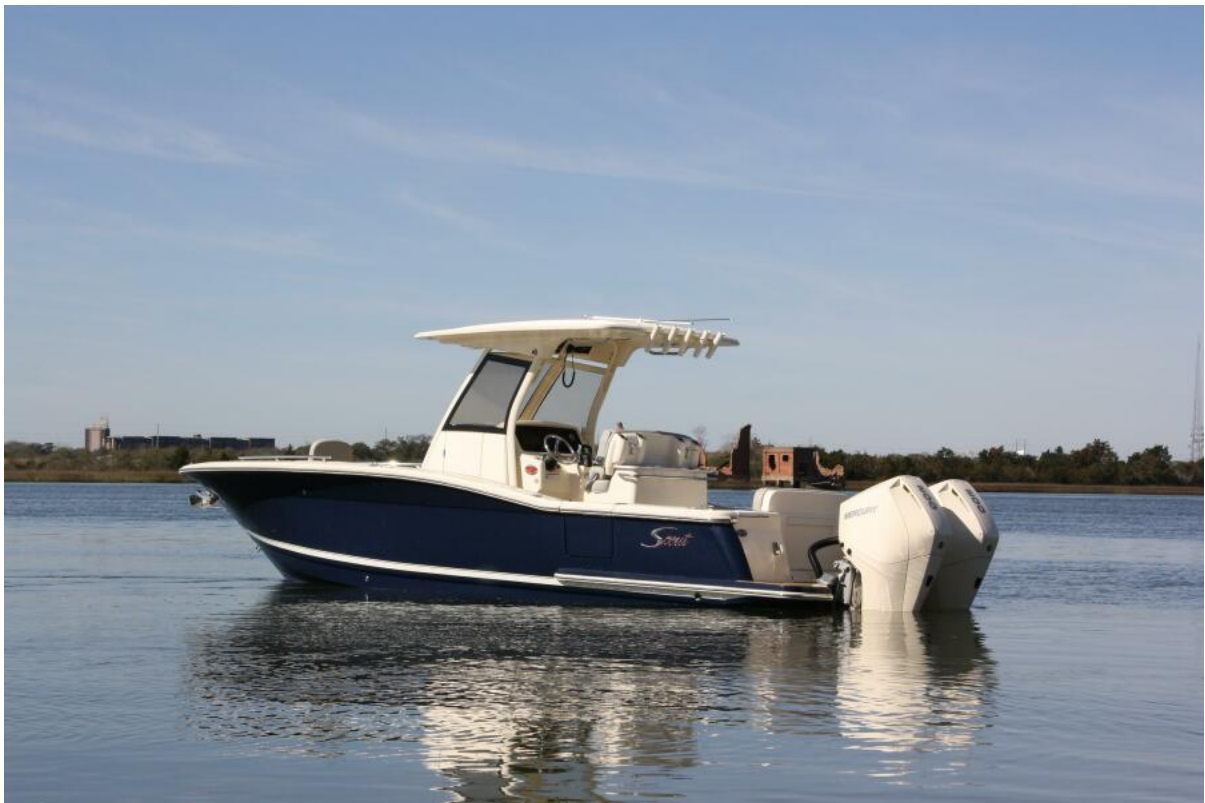
Scout 277 LXF - Profile 2021 Scout 277 LXF