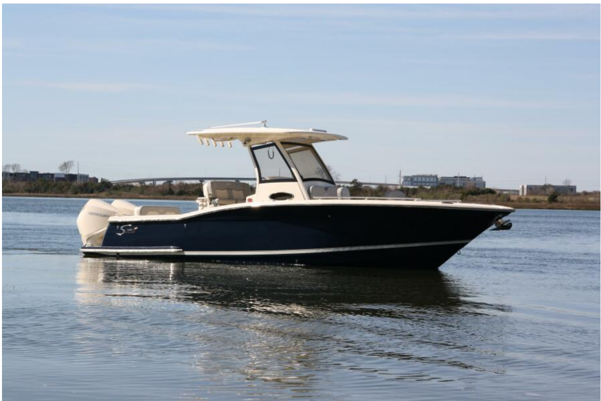
Scout 277 LXF - Profile 2021 Scout 277 LXF