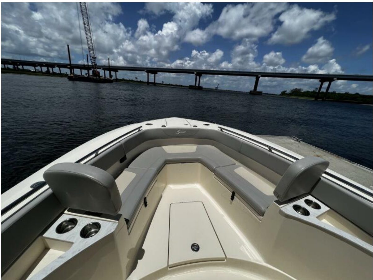
Scout 277 LXF - Forward Seating 2021 Scout 277 LXF