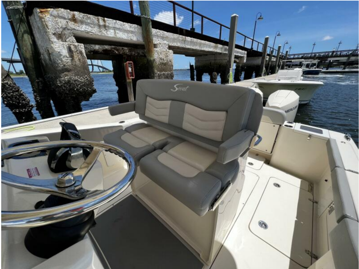
Scout 277 LXF - Helm 2021 Scout 277 LXF