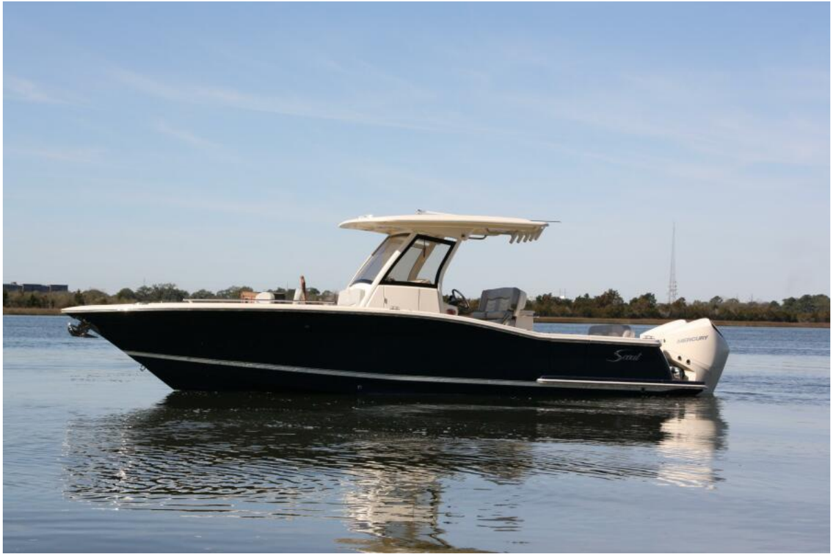
Scout 277 LXF - Profile 2021 Scout 277 LXF