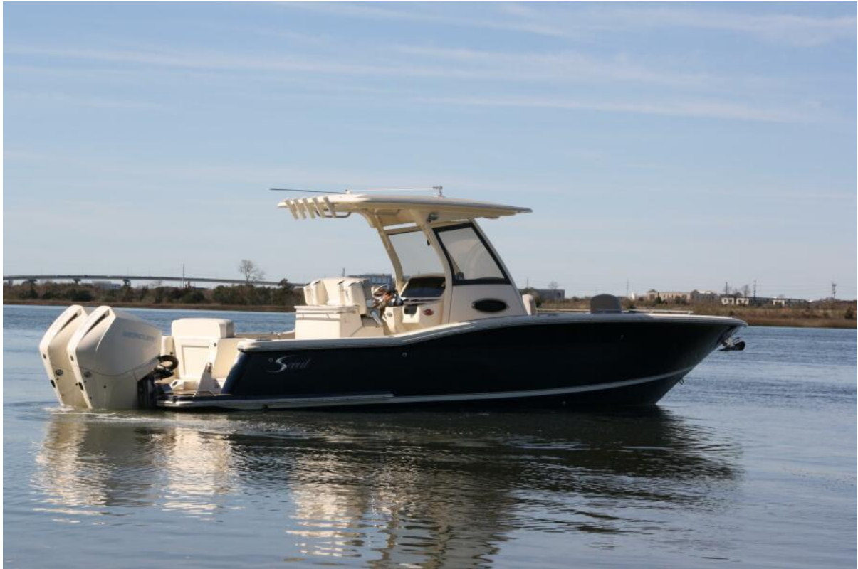
Scout 277 LXF - Profile 2021 Scout 277 LXF