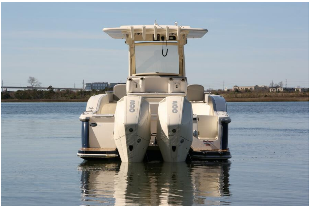
Scout 277 LXF - Profile 2021 Scout 277 LXF