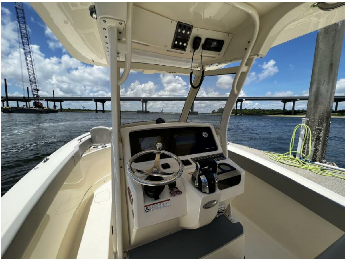
Scout 277 LXF - Helm 2021 Scout 277 LXF