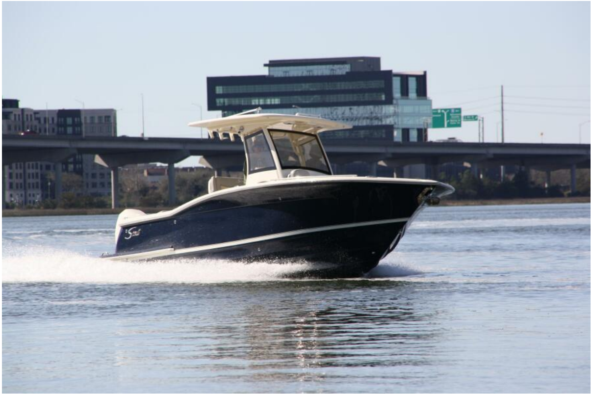
Scout 277 LXF - Profile 2021 Scout 277 LXF