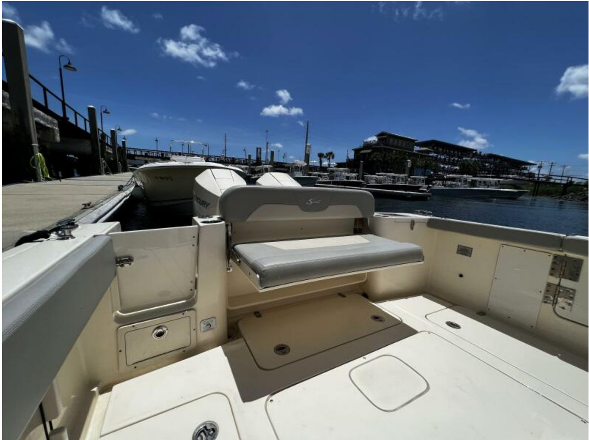
Scout 277 LXF - Aft 2021 Scout 277 LXF