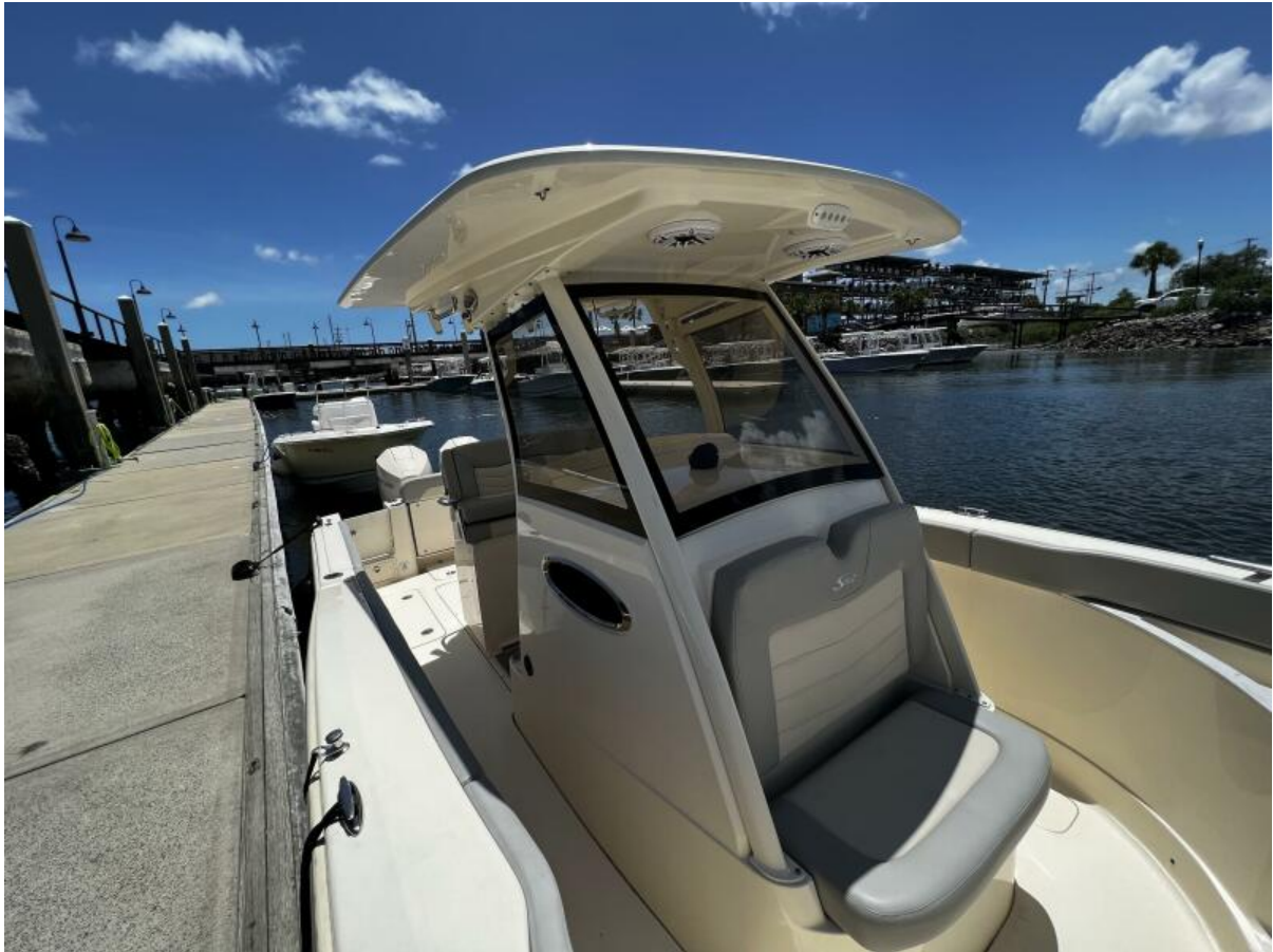
Scout 277 LXF - Center Console 2021 Scout 277 LXF