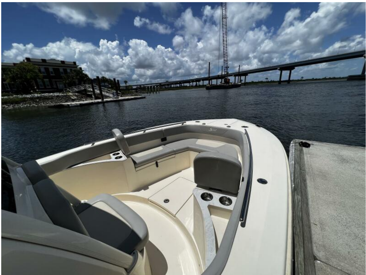
Scout 277 LXF - Bow 2021 Scout 277 LXF