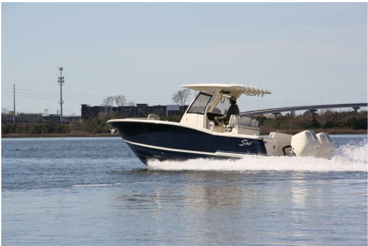
Scout 277 LXF - Profile 2021 Scout 277 LXF