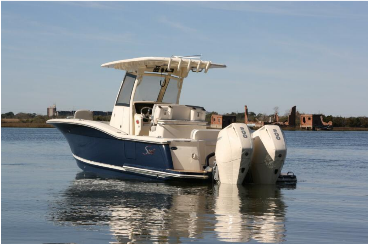
Scout 277 LXF - Profile 2021 Scout 277 LXF