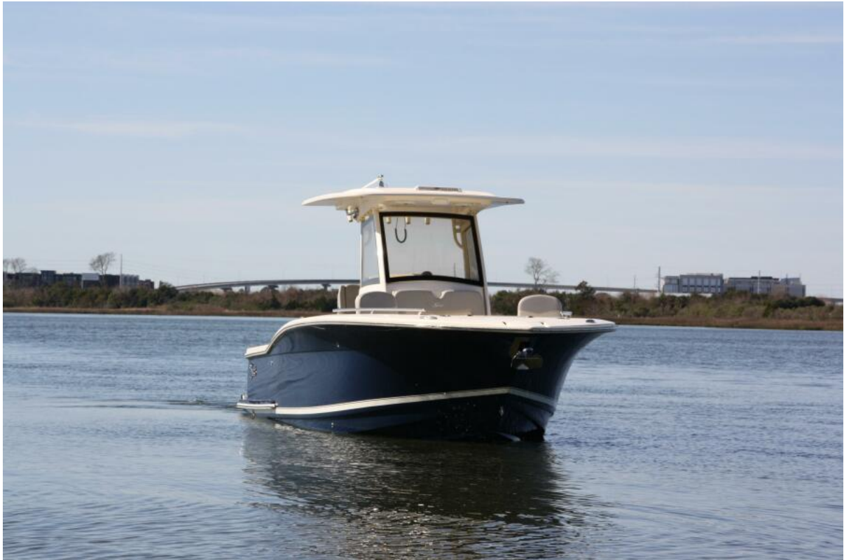
Scout 277 LXF - Profile 2021 Scout 277 LXF