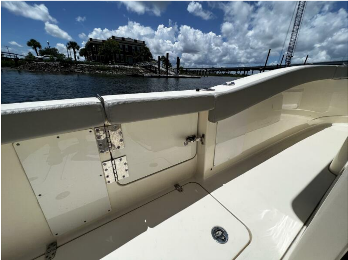
Scout 277 LXF - Dive Door 2021 Scout 277 LXF