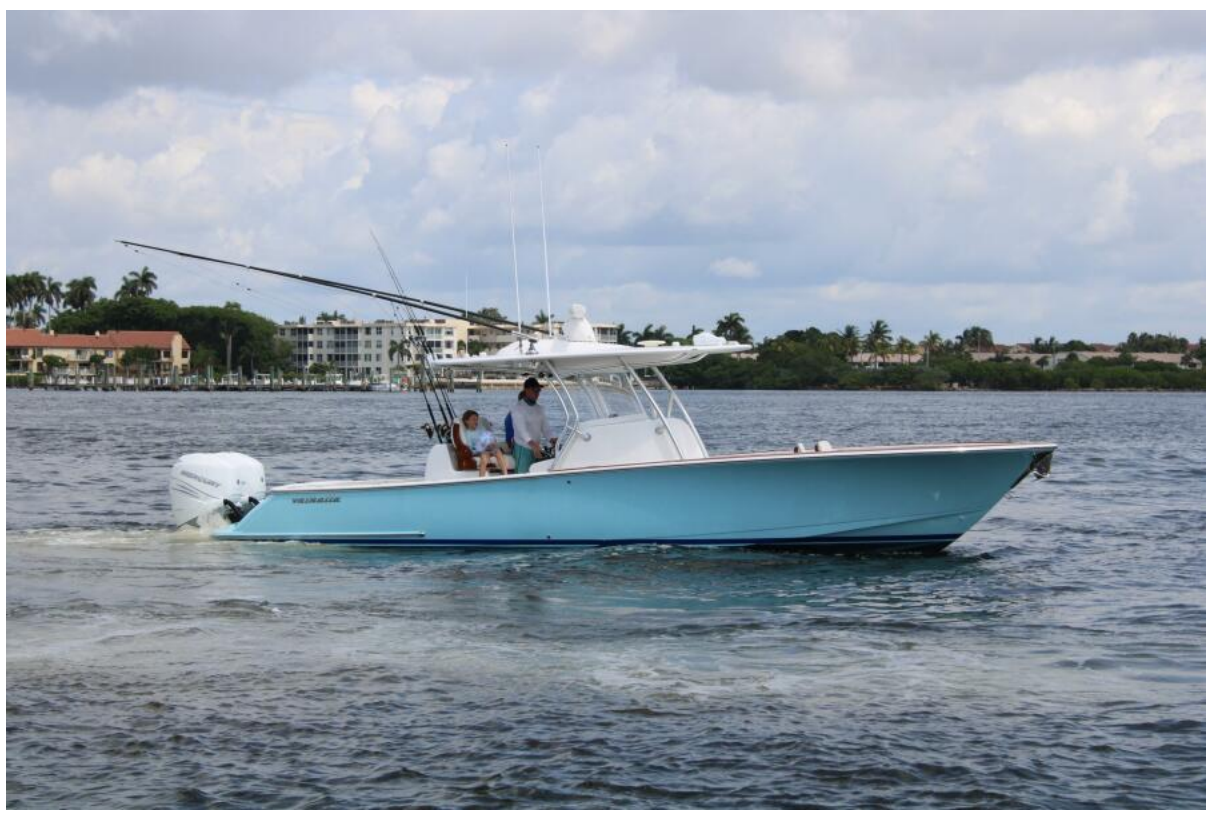
No Way Jose