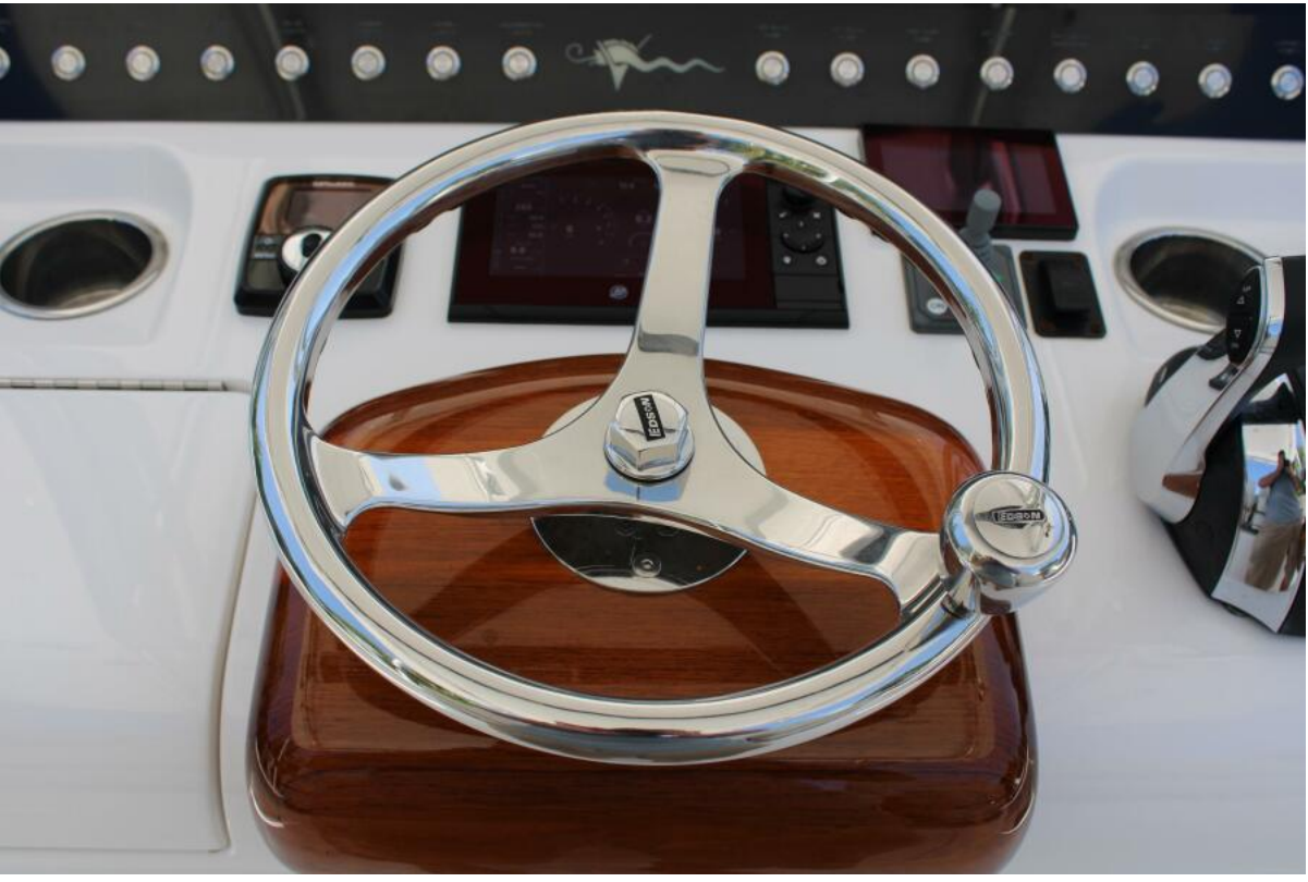
Edson Stainless Steel Steering Wheel with Power Knob