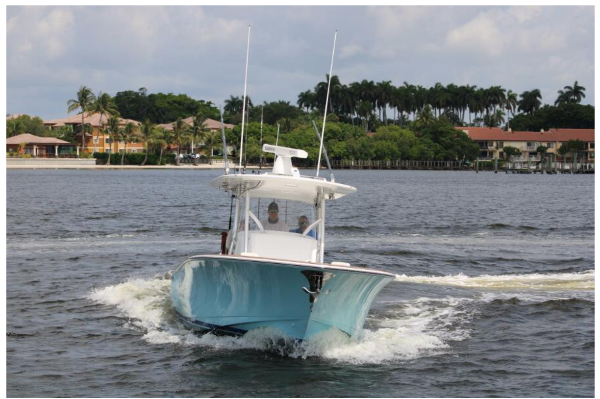
No Way Jose Running Shot