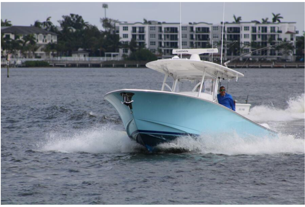
No Way Jose Running Shot