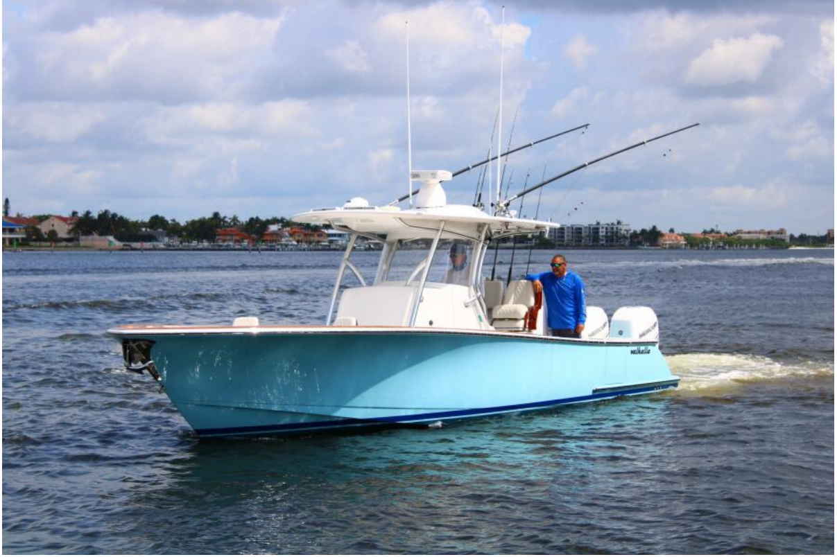
No Way Jose Port Profile