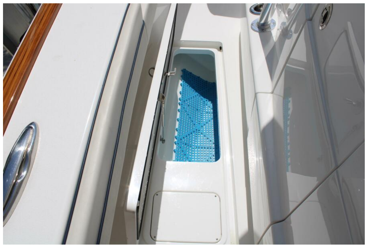
In Deck Storage