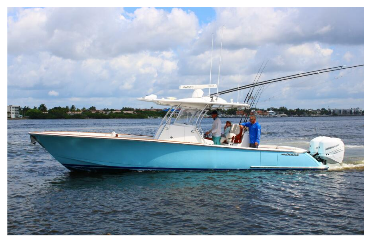
No Way Jose Port Profile