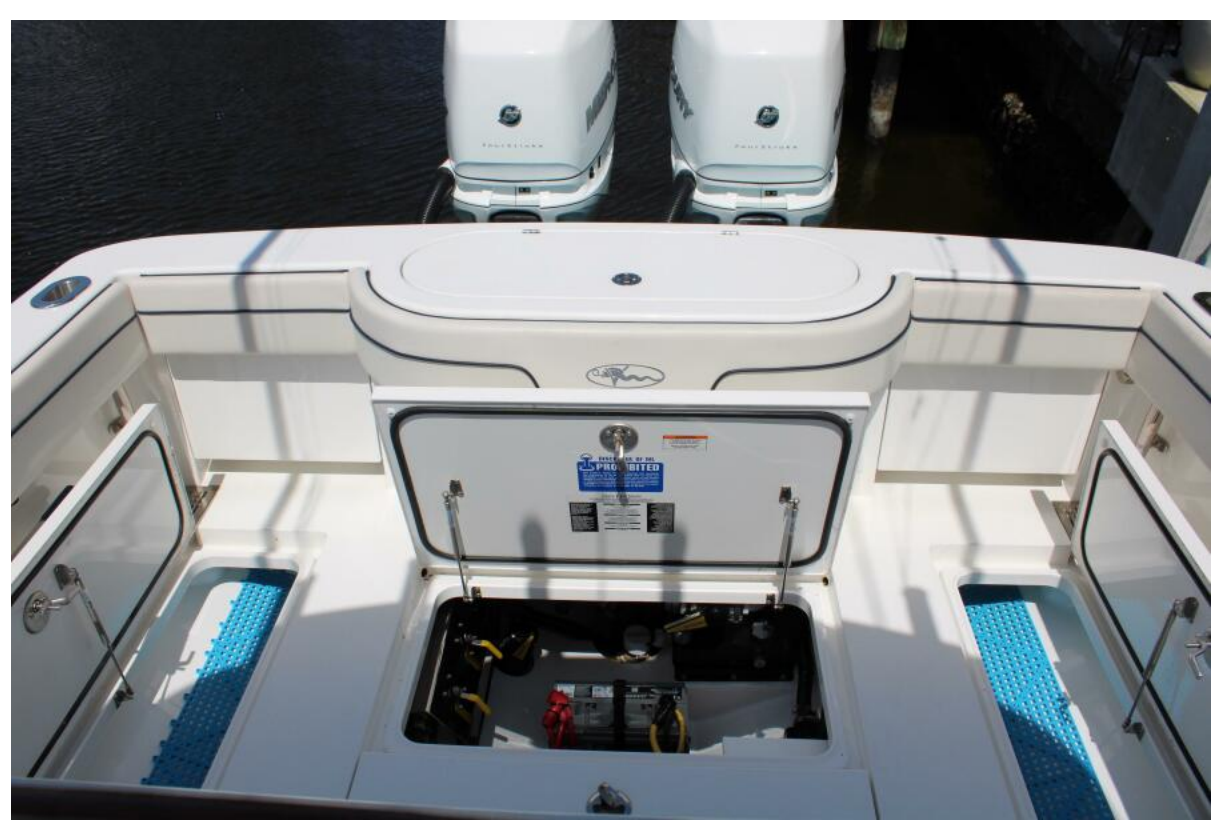
Deck Access to Batteries, Port and Starboard In Deck Storage