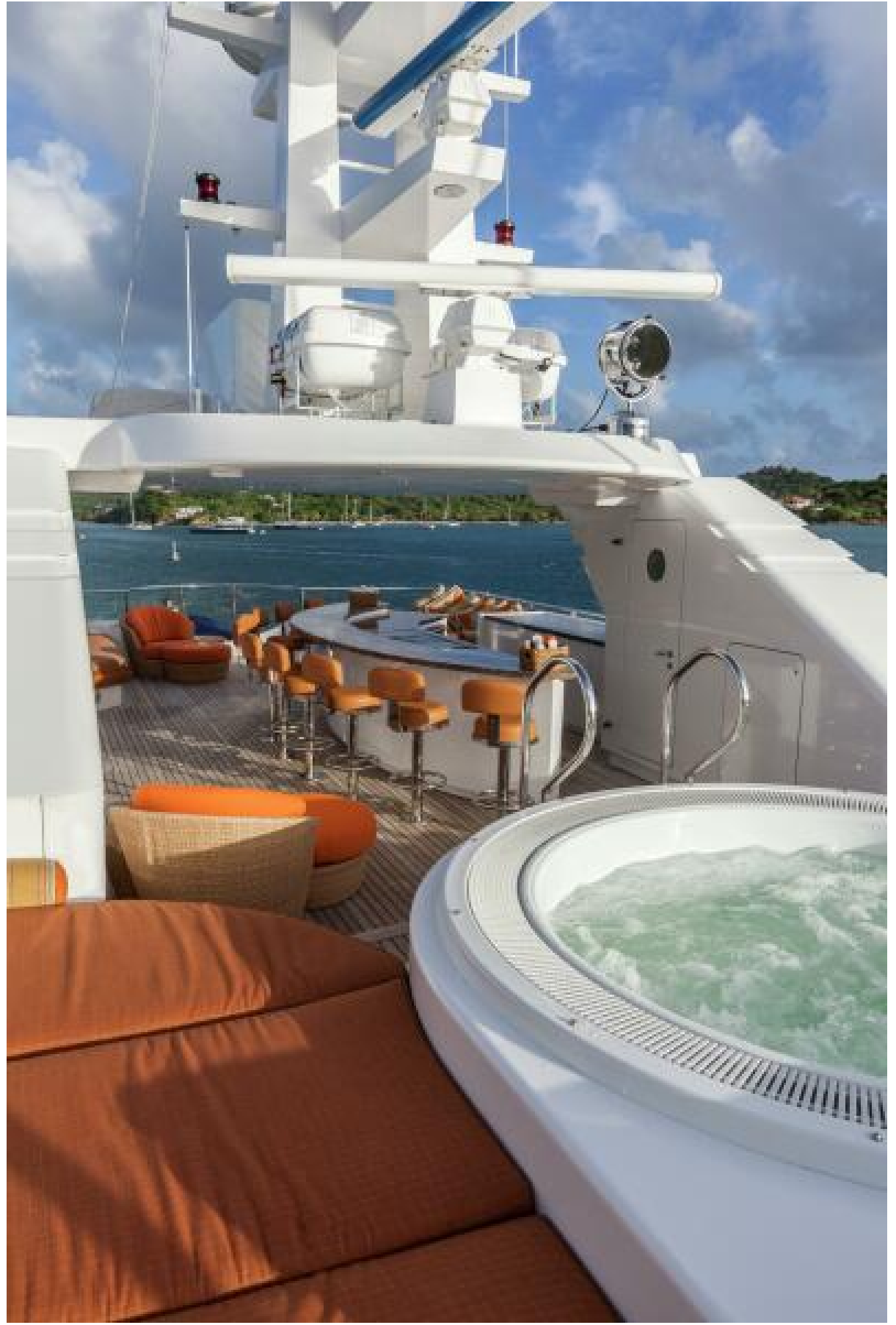
124' Hakvoort 2007 PERLE BLEUE Sundeck_2