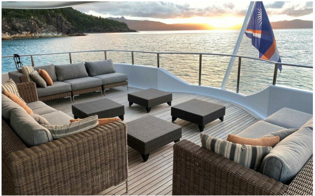
124' Hakvoort 2007 PERLE BLEUE Bridge Deck Aft_2