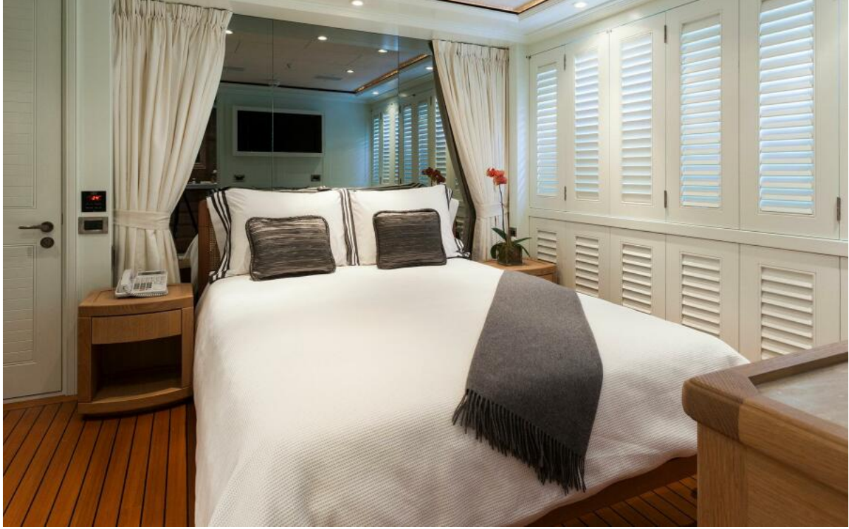
.124' Hakvoort 2007 PERLE BLEUE Guest Suite