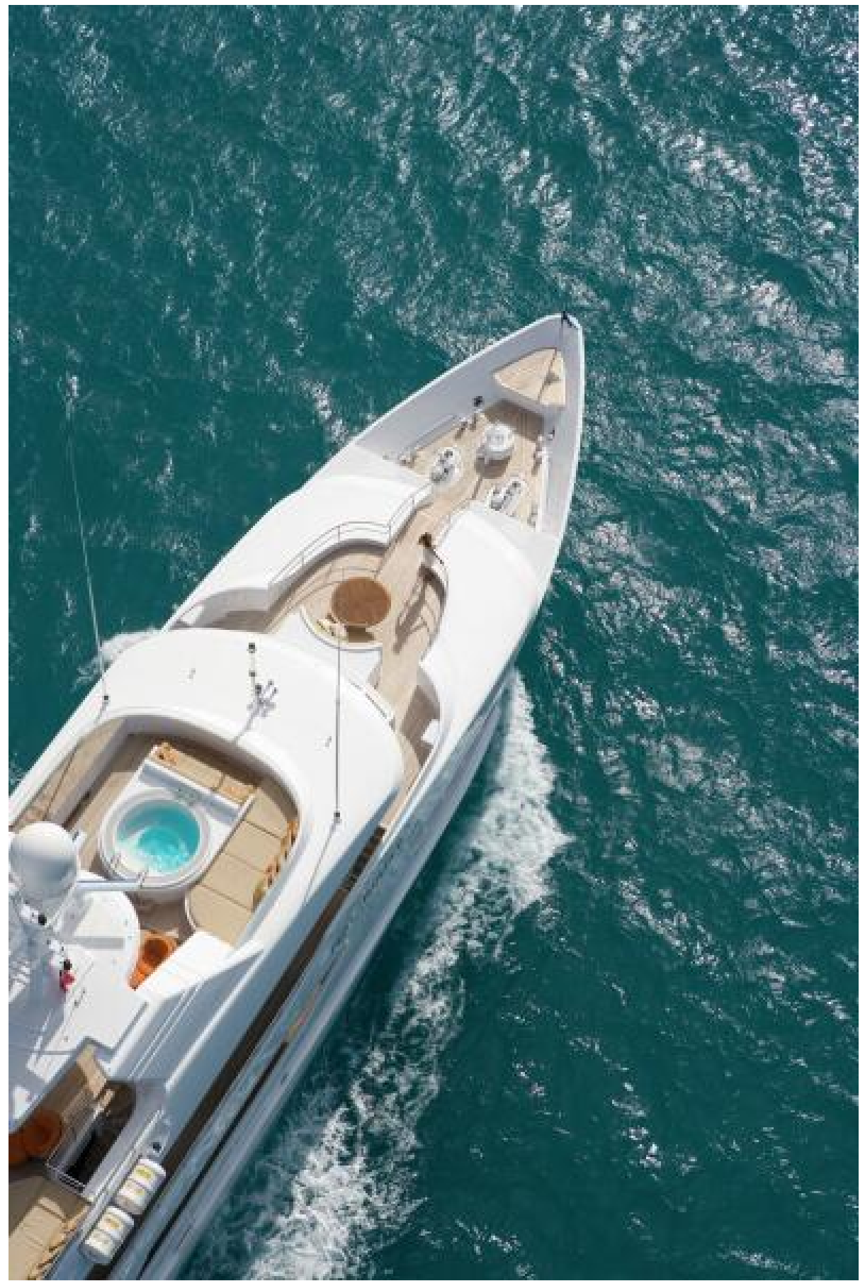
124' Hakvoort 2007 PERLE BLEUE Bow