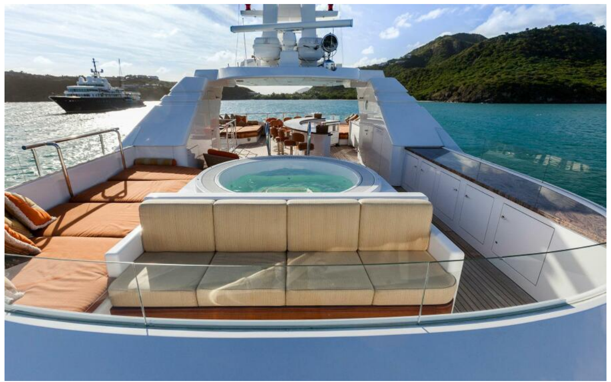
124' Hakvoort 2007 PERLE BLEUE Sundeck_1