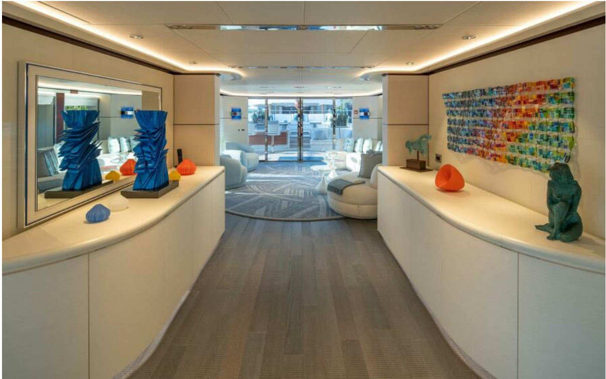
164' Heesen 2022 BOOK ENDS Main Salon_3