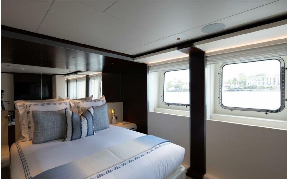
164' Heesen 2022 BOOK ENDS Guest Suite