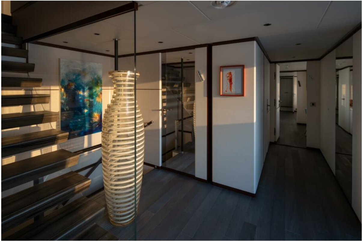
164' Heesen 2022 BOOK ENDS Foyer