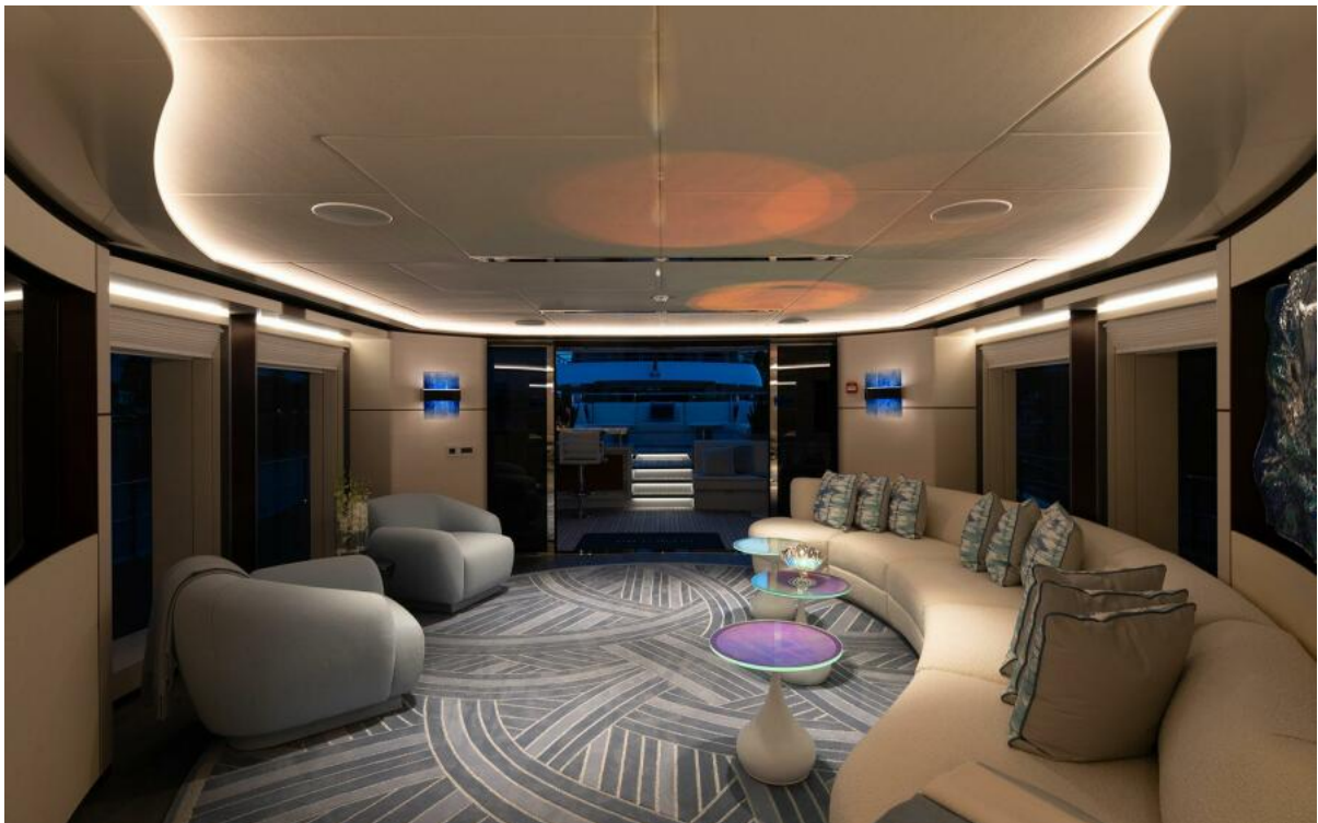
164' Heesen 2022 BOOK ENDS Main Salon_2