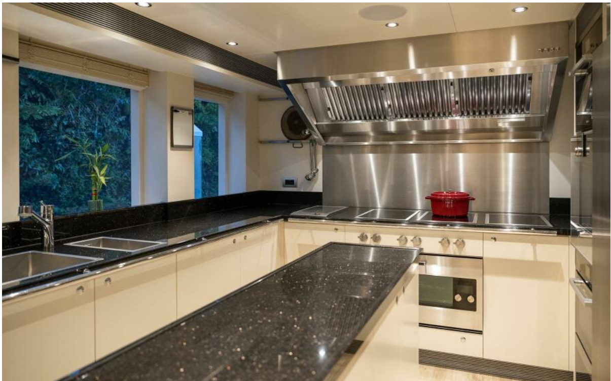
164' Heesen 2022 BOOK ENDS Galley