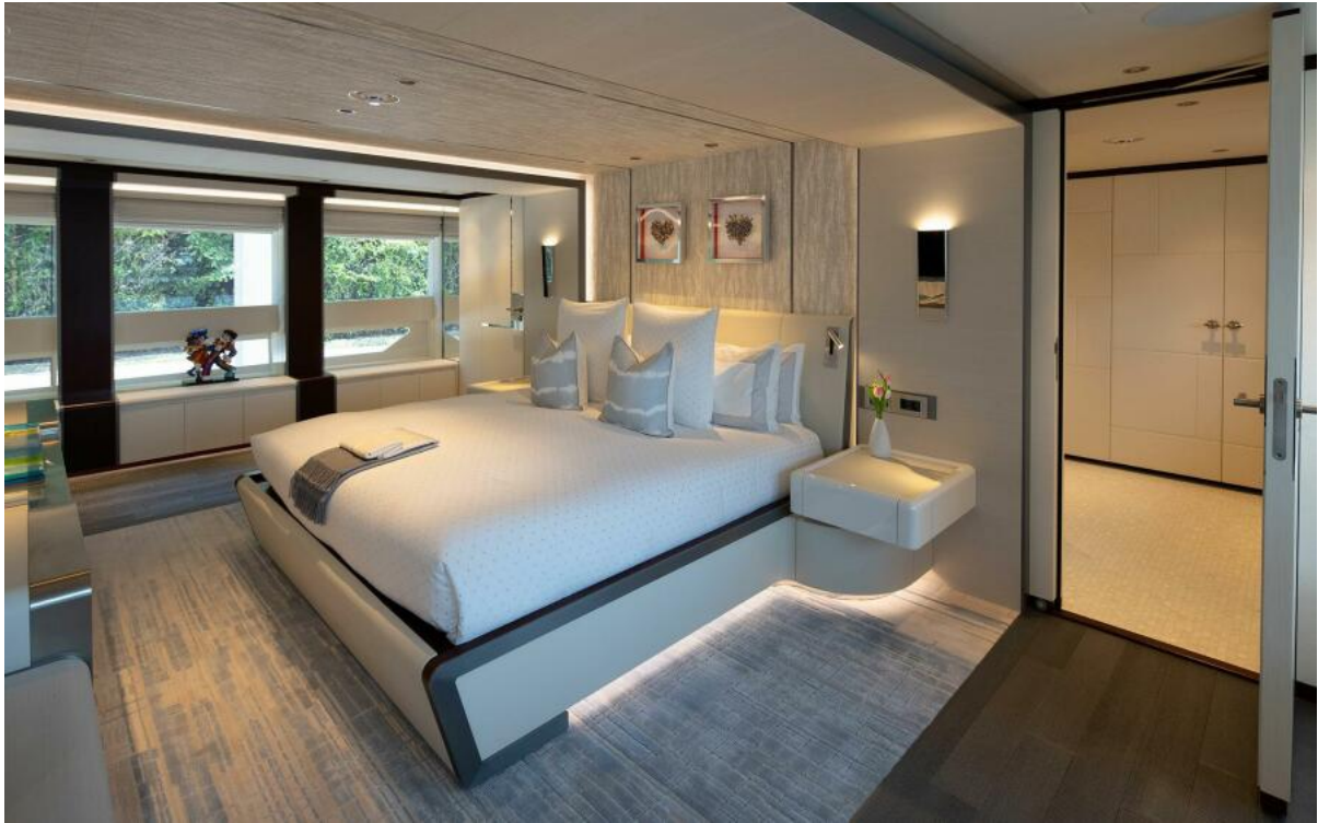
164' Heesen 2022 BOOK ENDS Owner's Suite