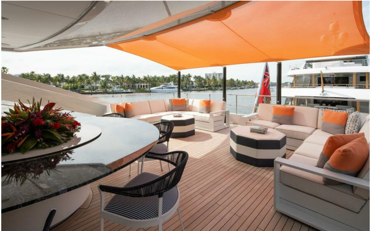
164' Heesen 2022 BOOK ENDS Bridge Deck Aft_2