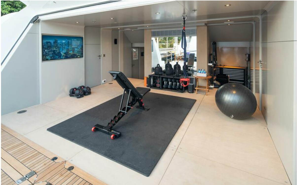
164' Heesen 2022 BOOK ENDS Beach Club