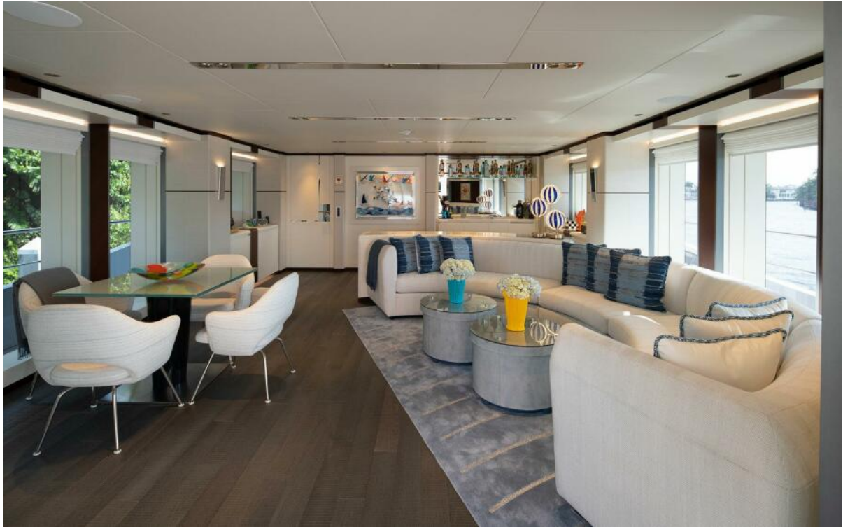
164' Heesen 2022 BOOK ENDS Sky Lounge