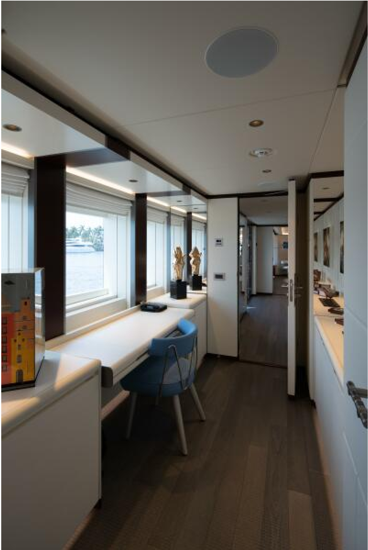
164' Heesen 2022 BOOK ENDS Owner's Suite_6