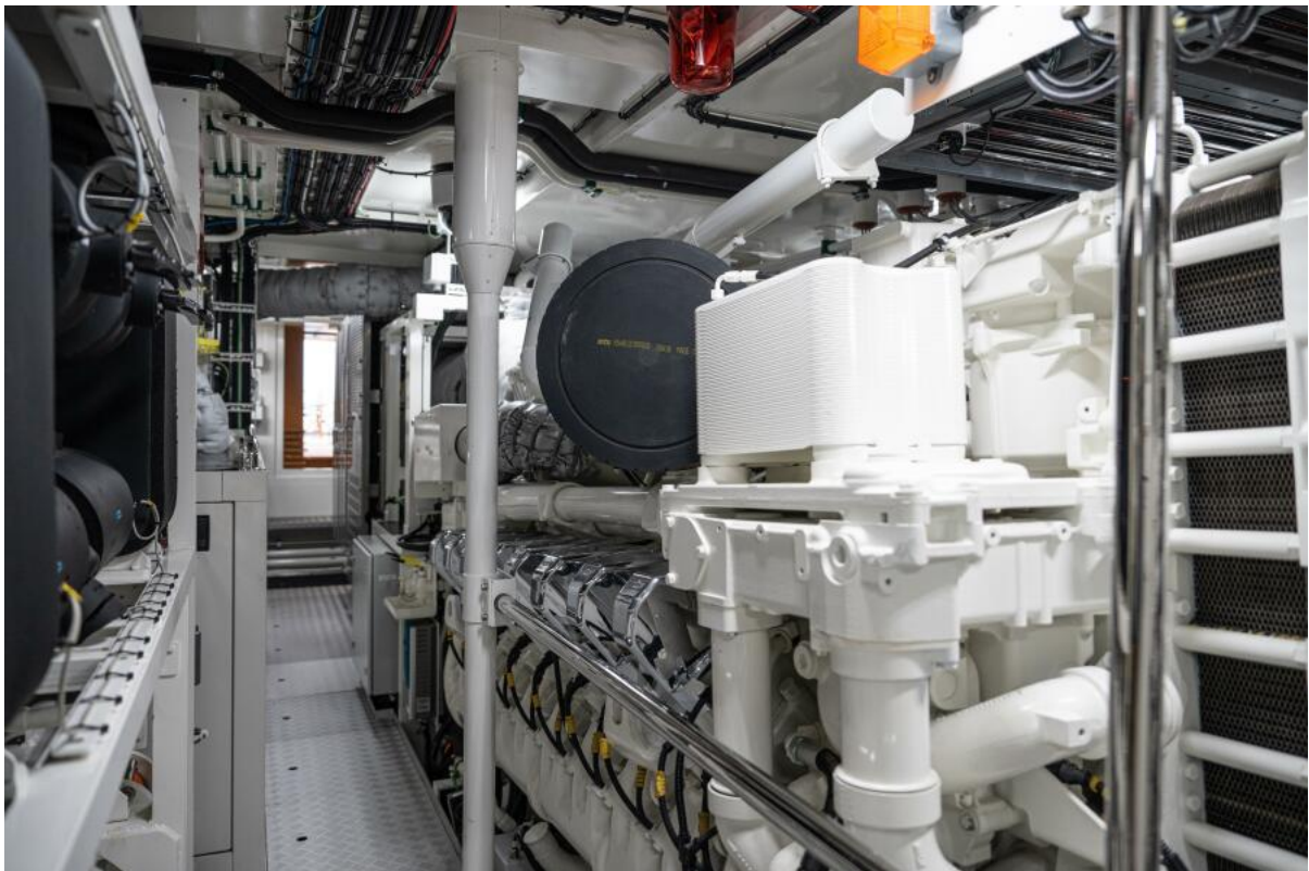
164' Heesen 2022 BOOK ENDS Engine Room