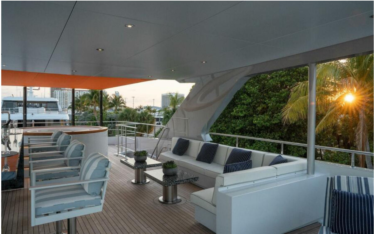
164' Heesen 2022 BOOK ENDS Sundeck_2