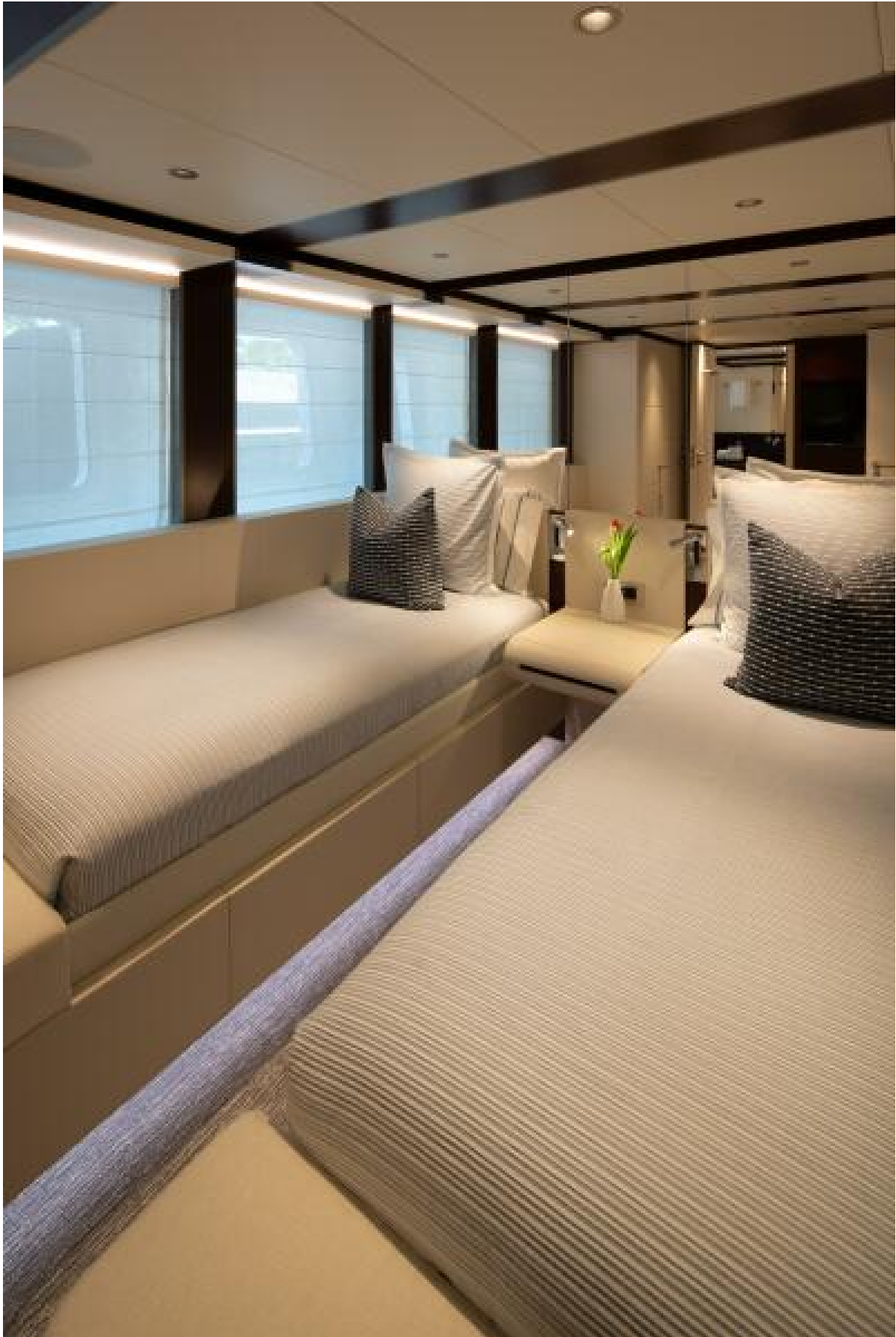
164' Heesen 2022 BOOK ENDS Guest Suite - Twin