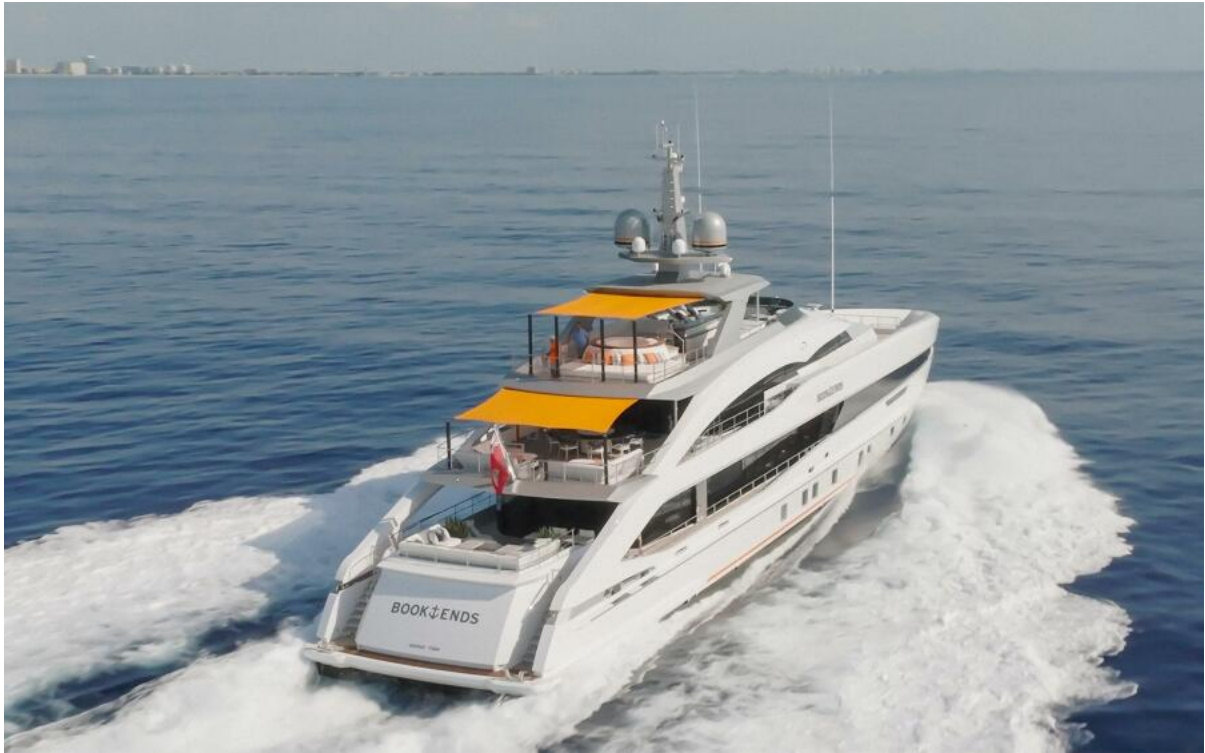
164' Heesen 2022 BOOK ENDS Aerial