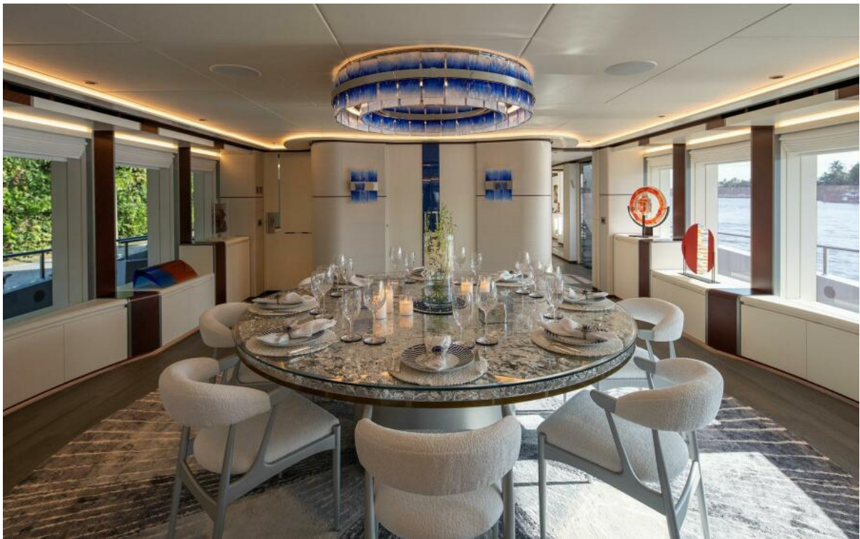
164' Heesen 2022 BOOK ENDS Dining Room