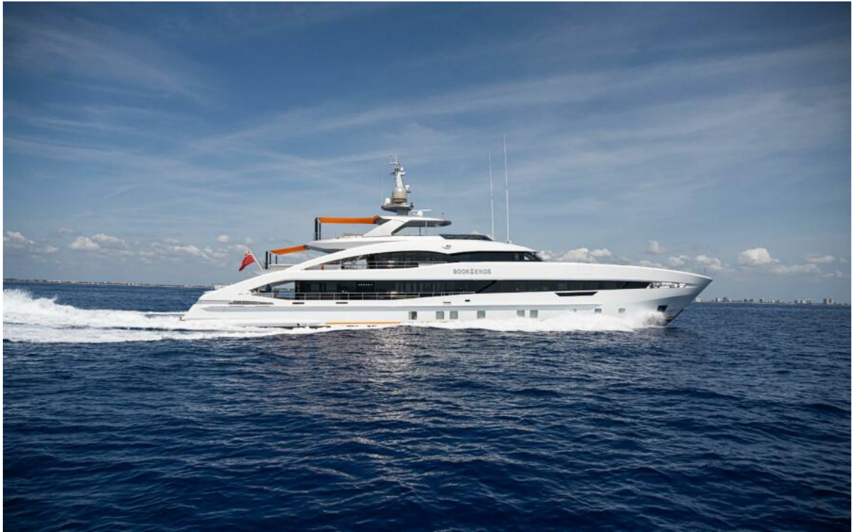
164' Heesen 2022 BOOK ENDS Profile