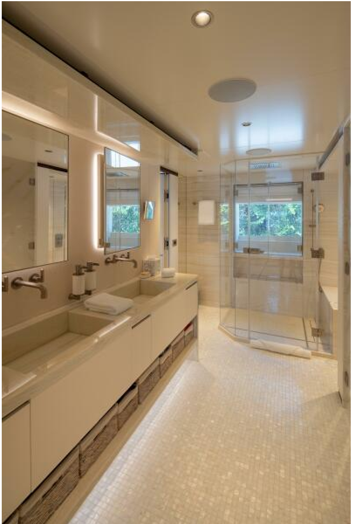
164' Heesen 2022 BOOK ENDS Owner's Suite_3