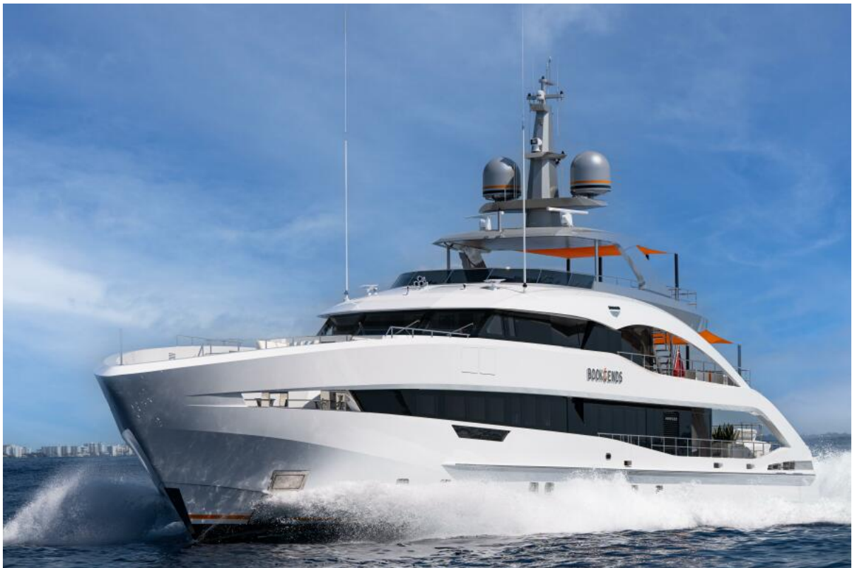
164' Heesen 2022 BOOK ENDS Profile_3