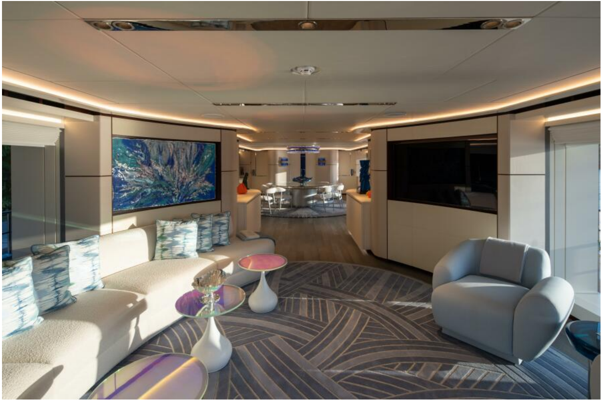
164' Heesen 2022 BOOK ENDS Main Salon