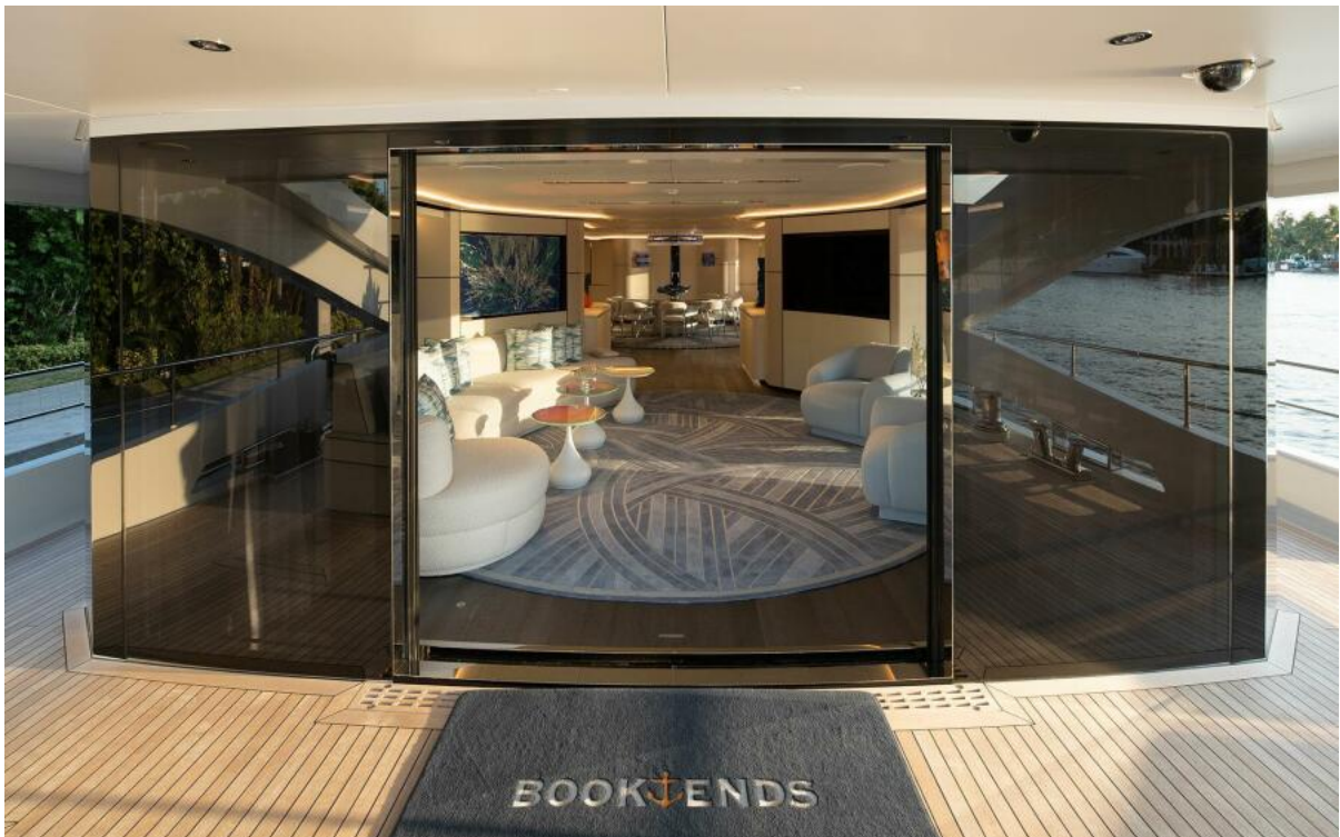
164' Heesen 2022 BOOK ENDS Main Deck