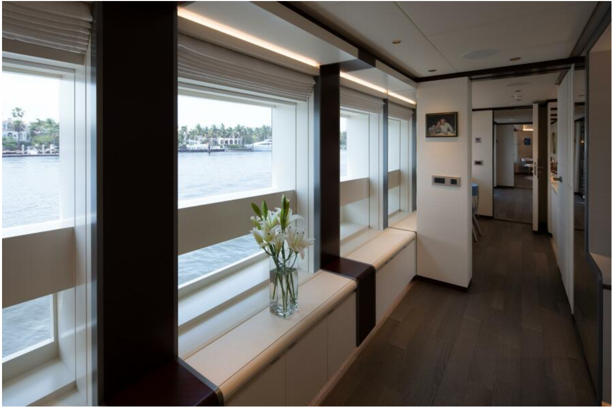
164' Heesen 2022 BOOK ENDS Owner's Suite_5