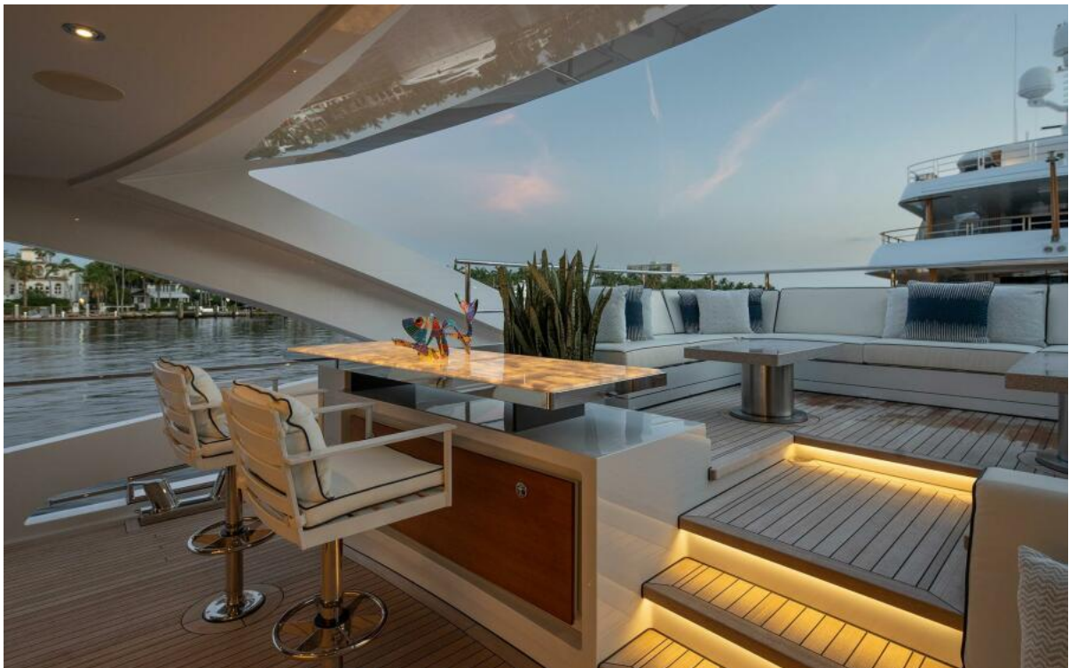
164' Heesen 2022 BOOK ENDS Main Deck Aft