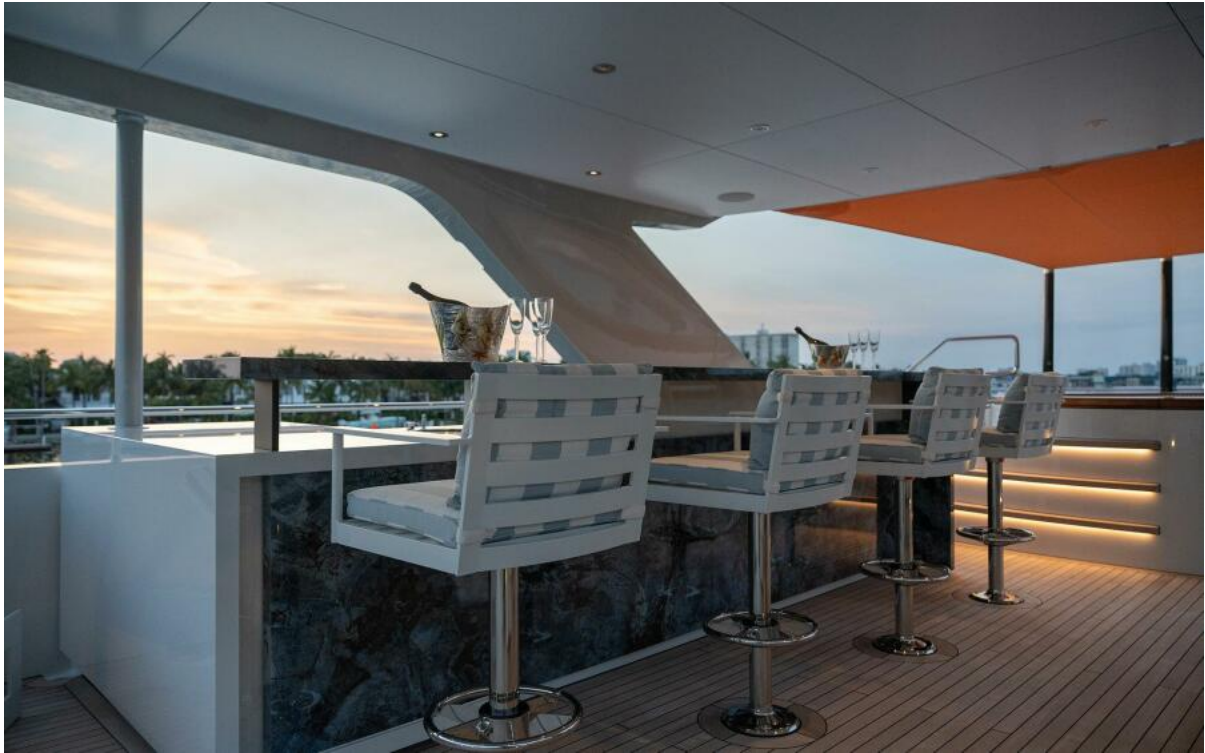
164' Heesen 2022 BOOK ENDS Sundeck_4