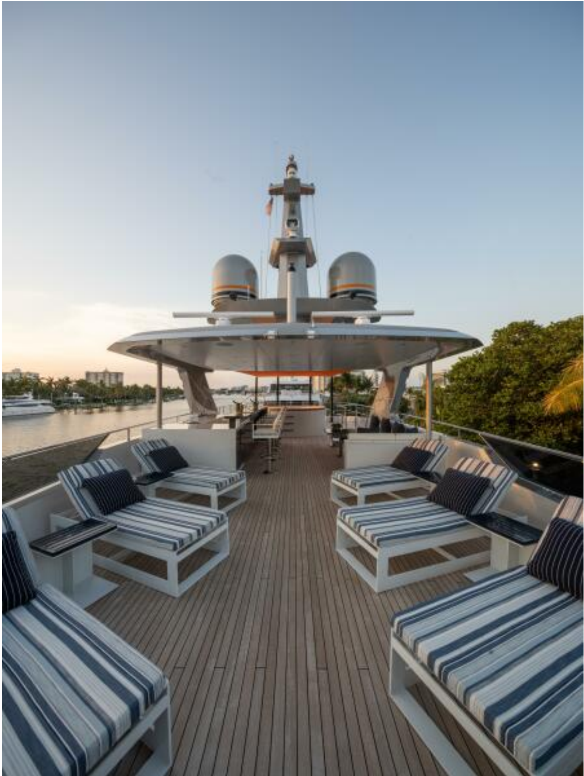
164' Heesen 2022 BOOK ENDS Sundeck