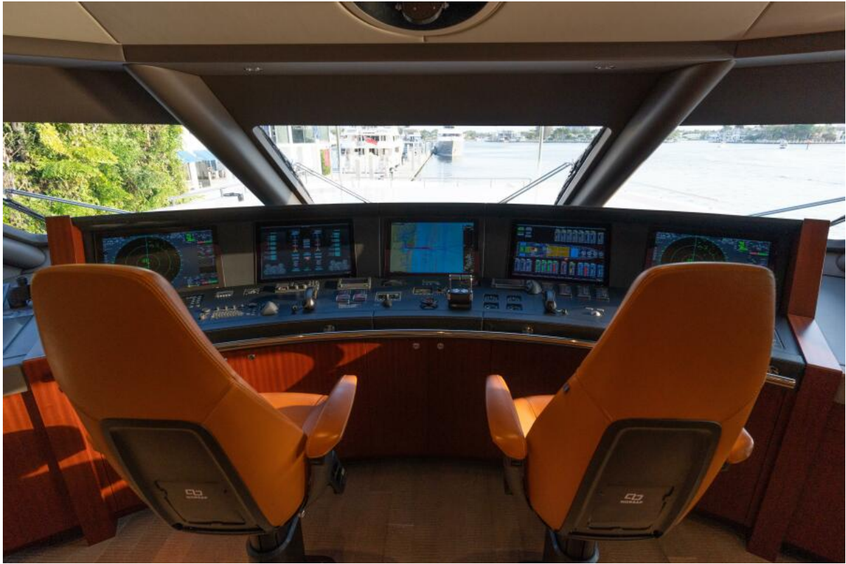
164' Heesen 2022 BOOK ENDS Bridge