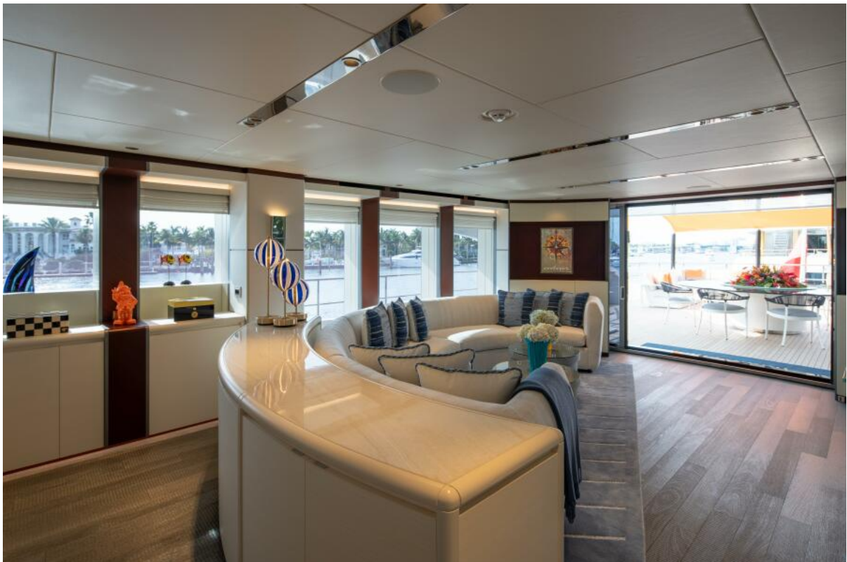
164' Heesen 2022 BOOK ENDS Sky Lounge_2