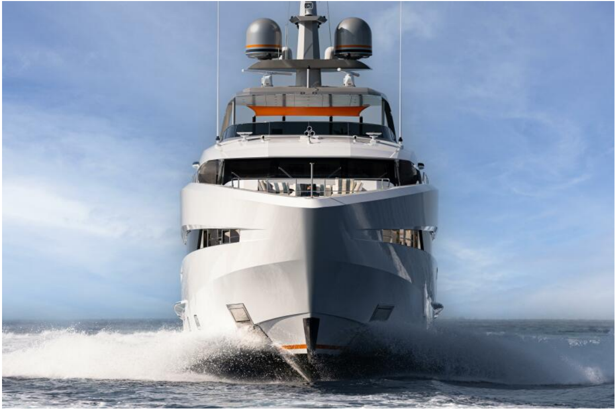
164' Heesen 2022 BOOK ENDS Profile_2