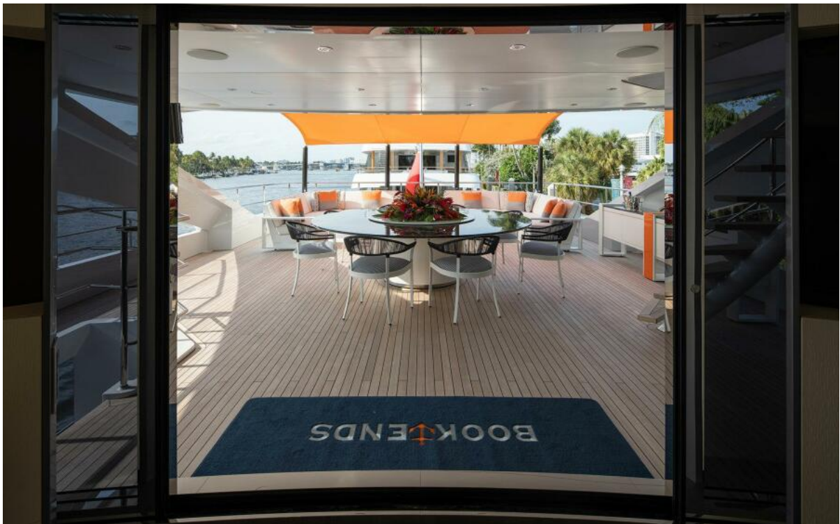
164' Heesen 2022 BOOK ENDS Bridge Deck Aft