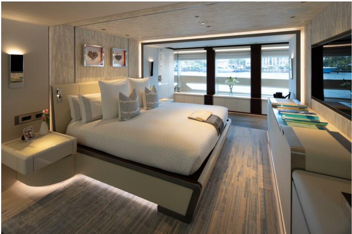
164' Heesen 2022 BOOK ENDS Owner's Suite_2