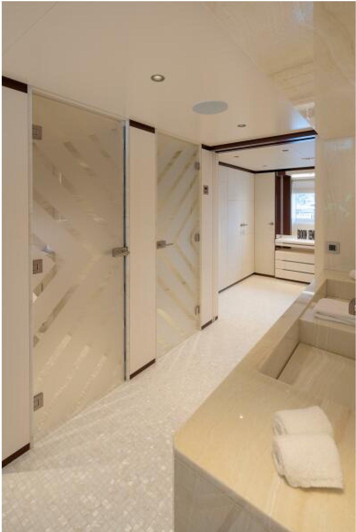
164' Heesen 2022 BOOK ENDS Owner's Suite_4