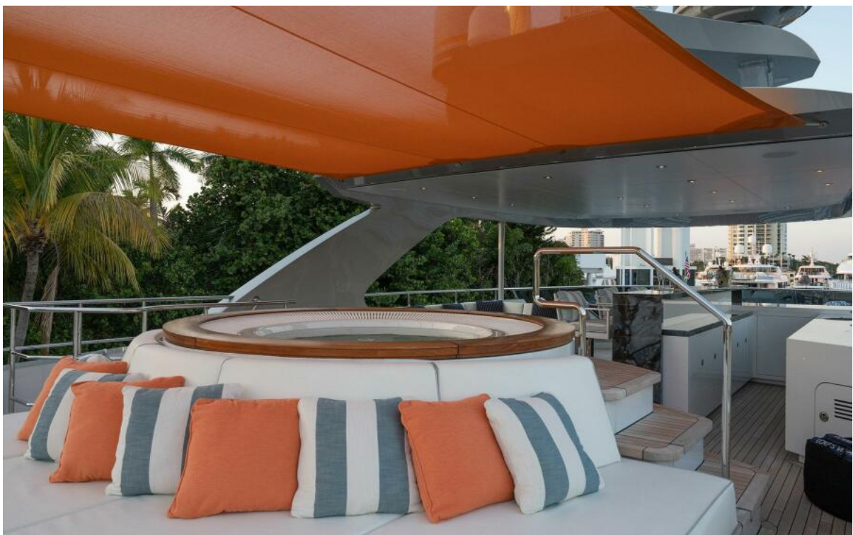
164' Heesen 2022 BOOK ENDS Sundeck_3