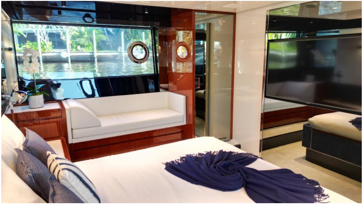
66' Riva Ribelle 2021 (CAVALLO) Master Stateroom_2