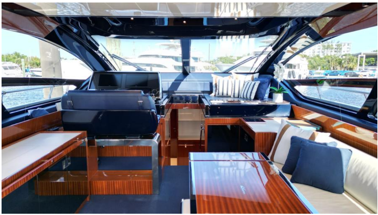
66' Riva Ribelle 2021 (CAVALLO) Salon_1