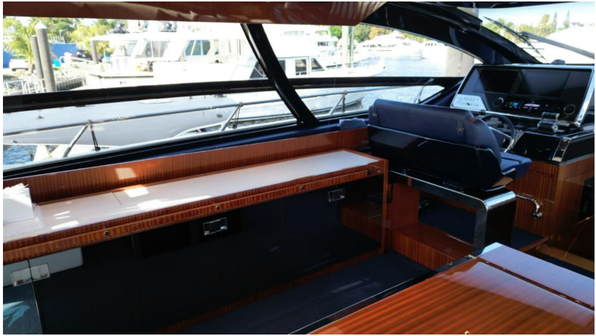
66' Riva Ribelle 2021 (CAVALLO) Salon_3