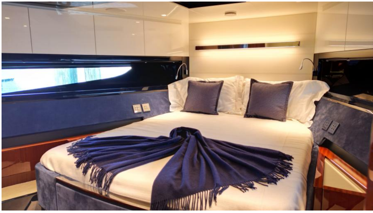
66' Riva Ribelle 2021 (CAVALLO) VIP Stateroom