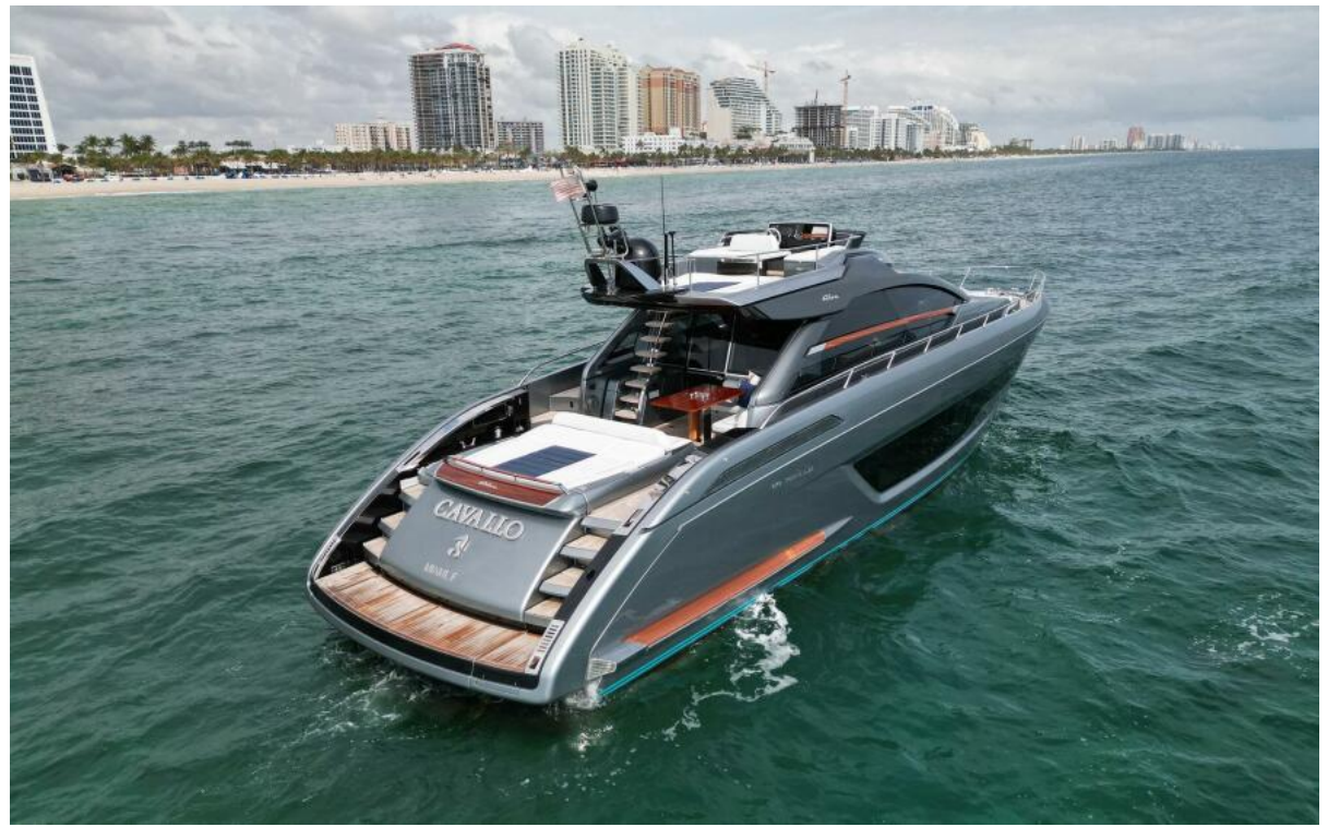
66' Riva Ribelle 2021 (CAVALLO) Profile_3