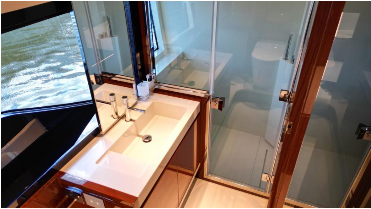
66' Riva Ribelle 2021 (CAVALLO) Head