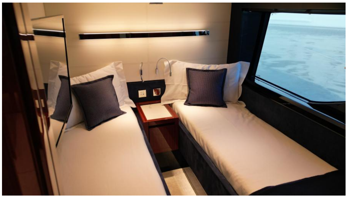
66' Riva Ribelle 2021 (CAVALLO) Twin Stateroom