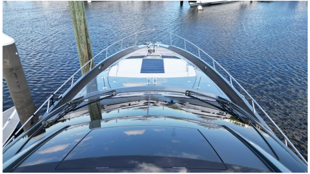
66' Riva Ribelle 2021 (CAVALLO) Foredeck