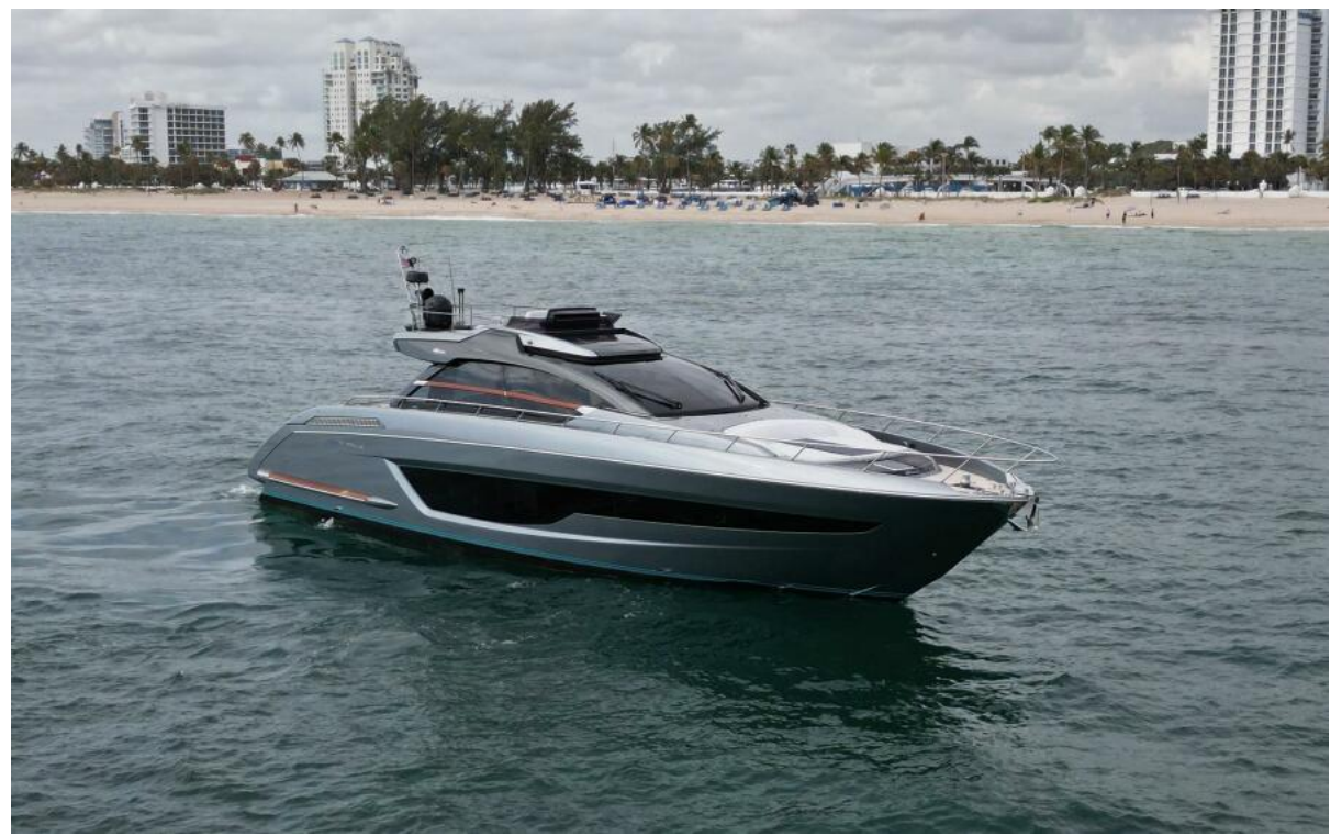
66' Riva Ribelle 2021 (CAVALLO) Profile