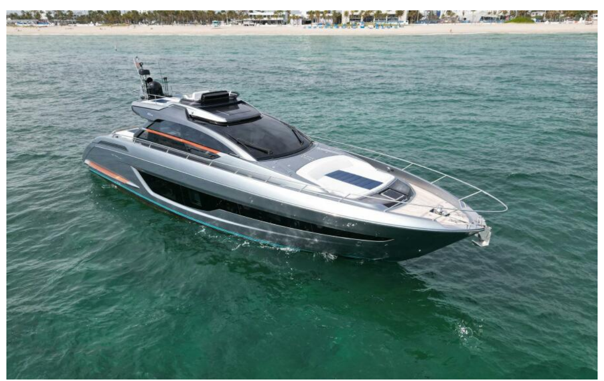
66' Riva Ribelle 2021 (CAVALLO) Profile_2