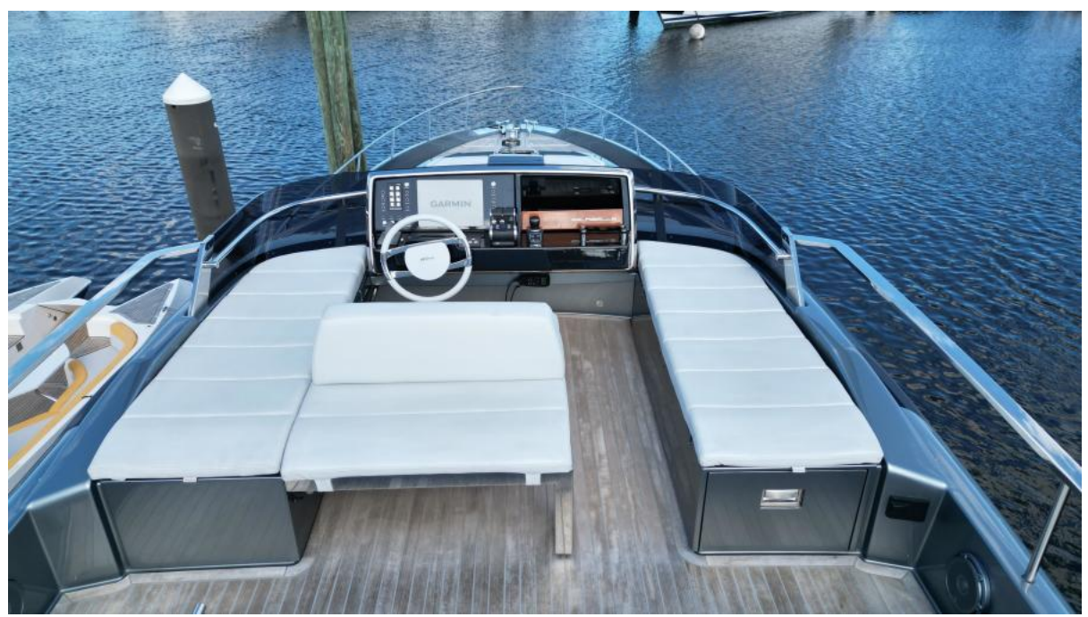
66' Riva Ribelle 2021 (CAVALLO) Fly Deck