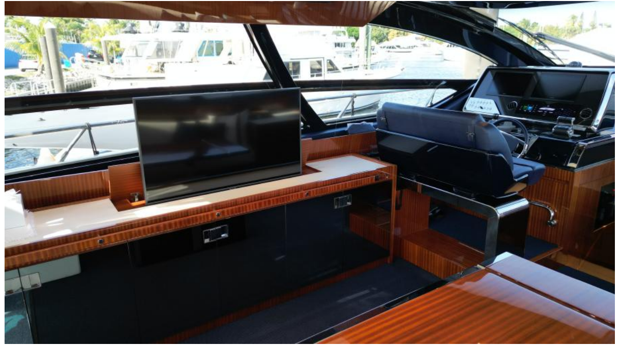
66' Riva Ribelle 2021 (CAVALLO) Salon_2