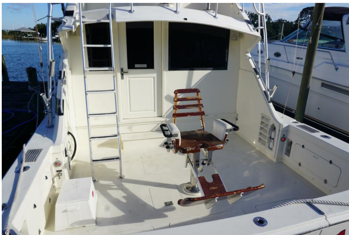
1987 37 Bertram 37 Convertible RIDGEBACK Cockpit (2)