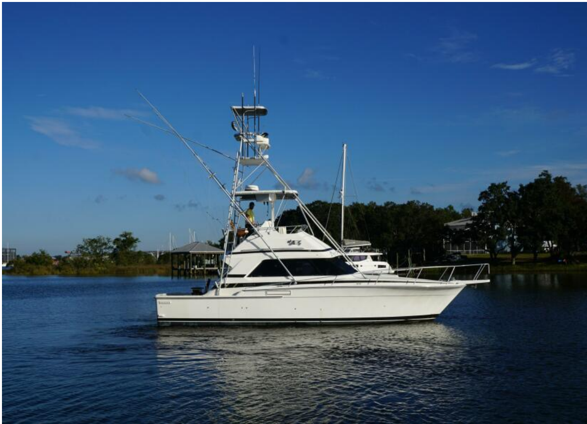
1987 37 Bertram 37 Convertible RIDGEBACK Profile (12)