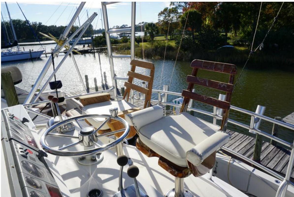
1987 37 Bertram 37 Convertible RIDGEBACK Helm (2)