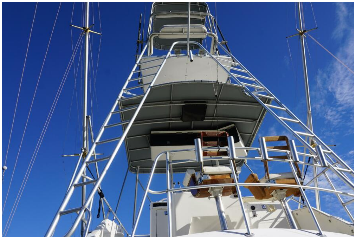
1987 37 Bertram 37 Convertible RIDGEBACK Tower