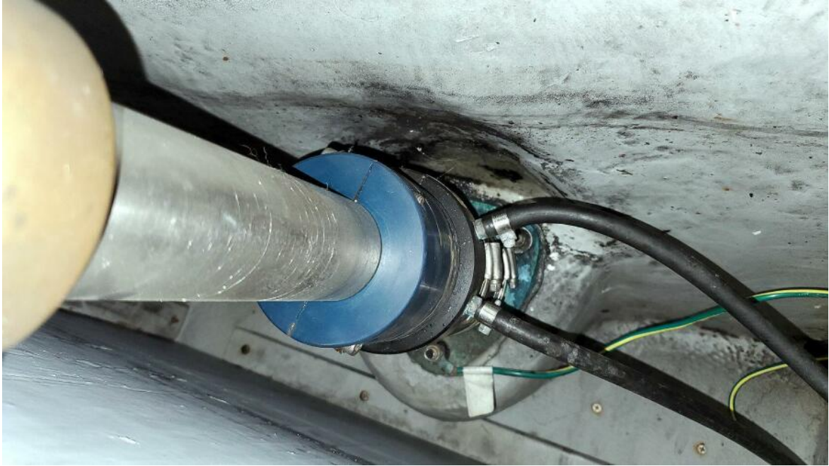
Dripless Shaft Seals