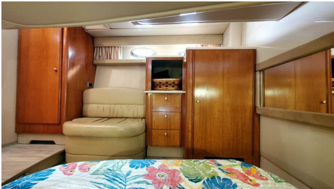
VIP Stateroom Starboard