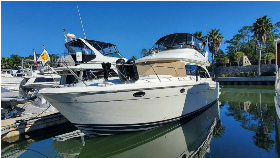
Port Bow Profile