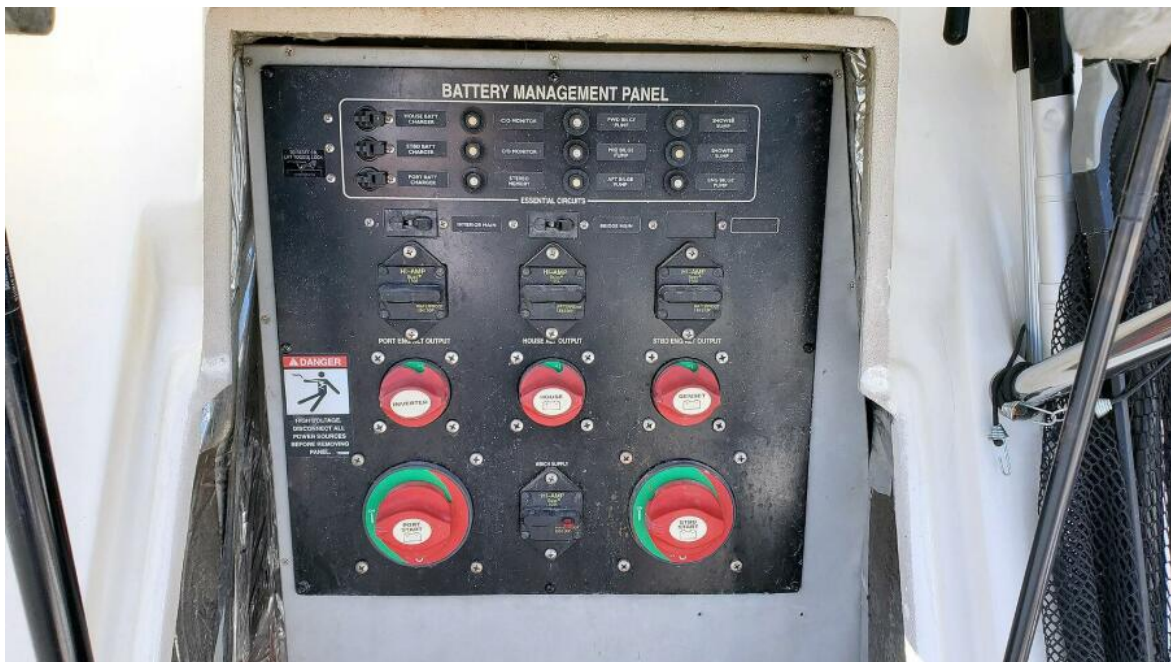
Battery Management Panel