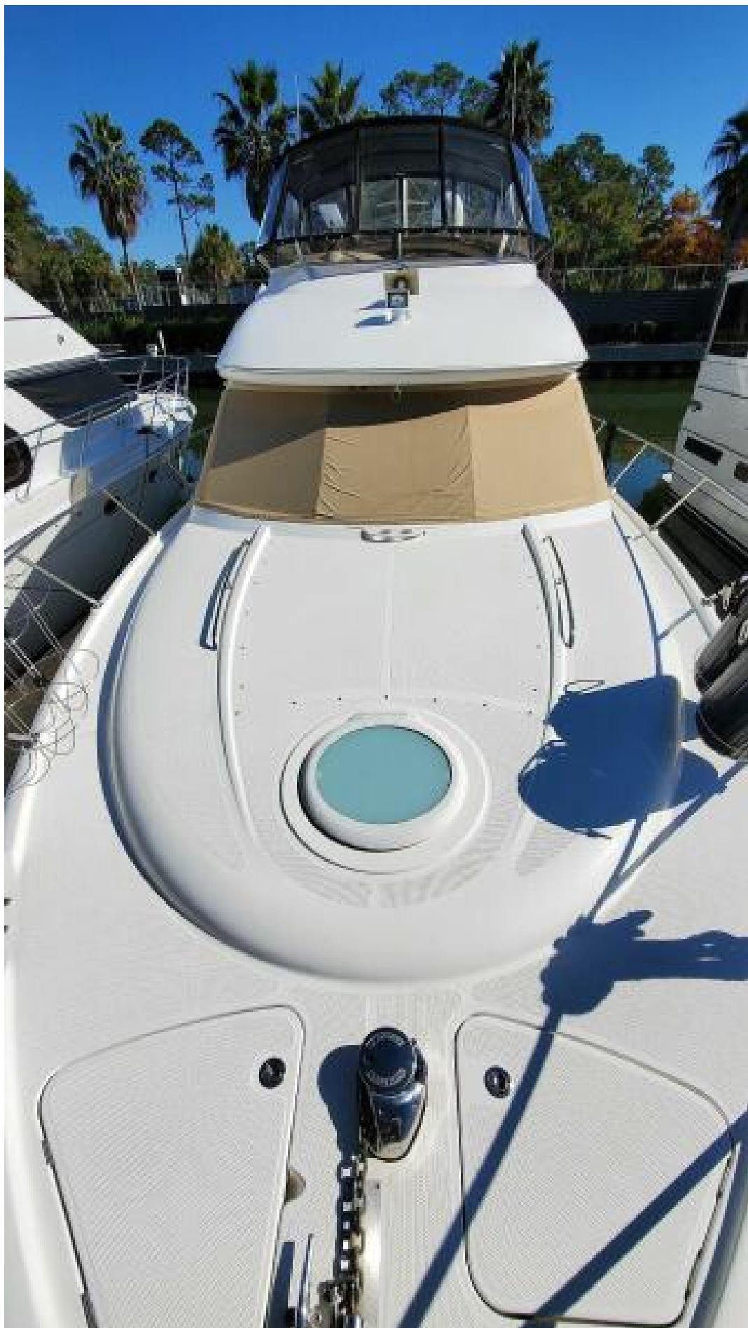
Fore Deck Aft