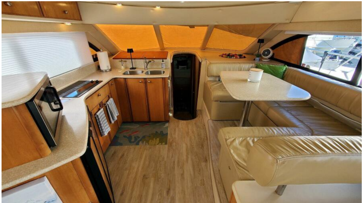
Galley and Dinette Forward