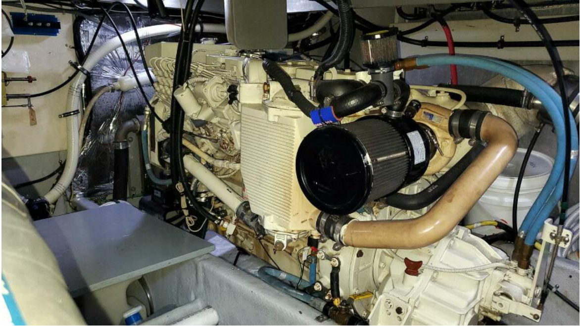
Starboard Main Engine Forward