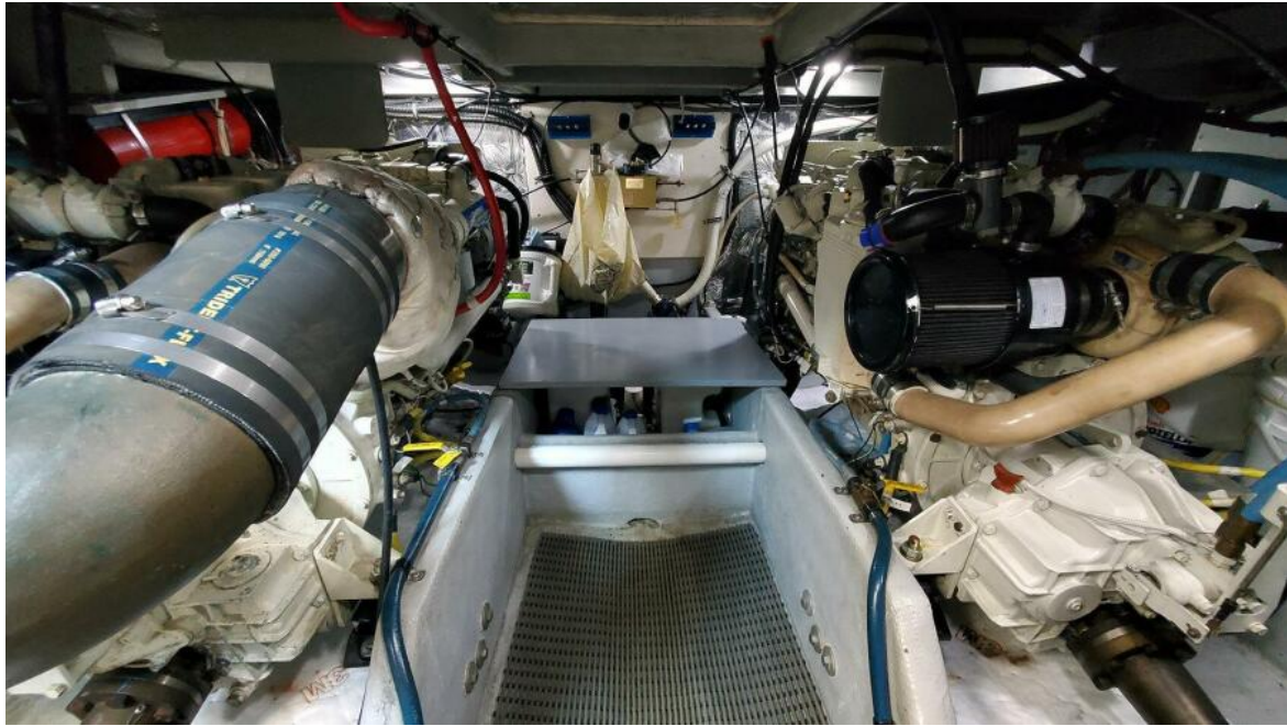
Engine Room Forward