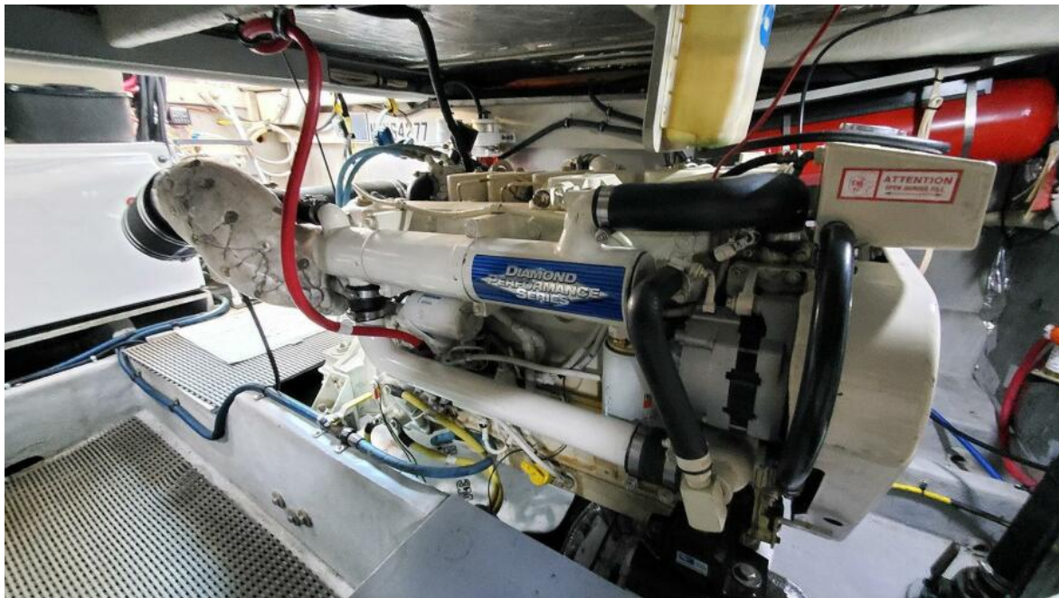
Port Main Engine Aft