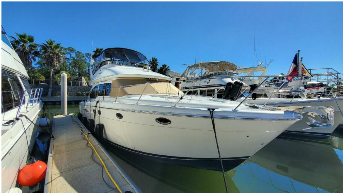
Starboard Bow Profile