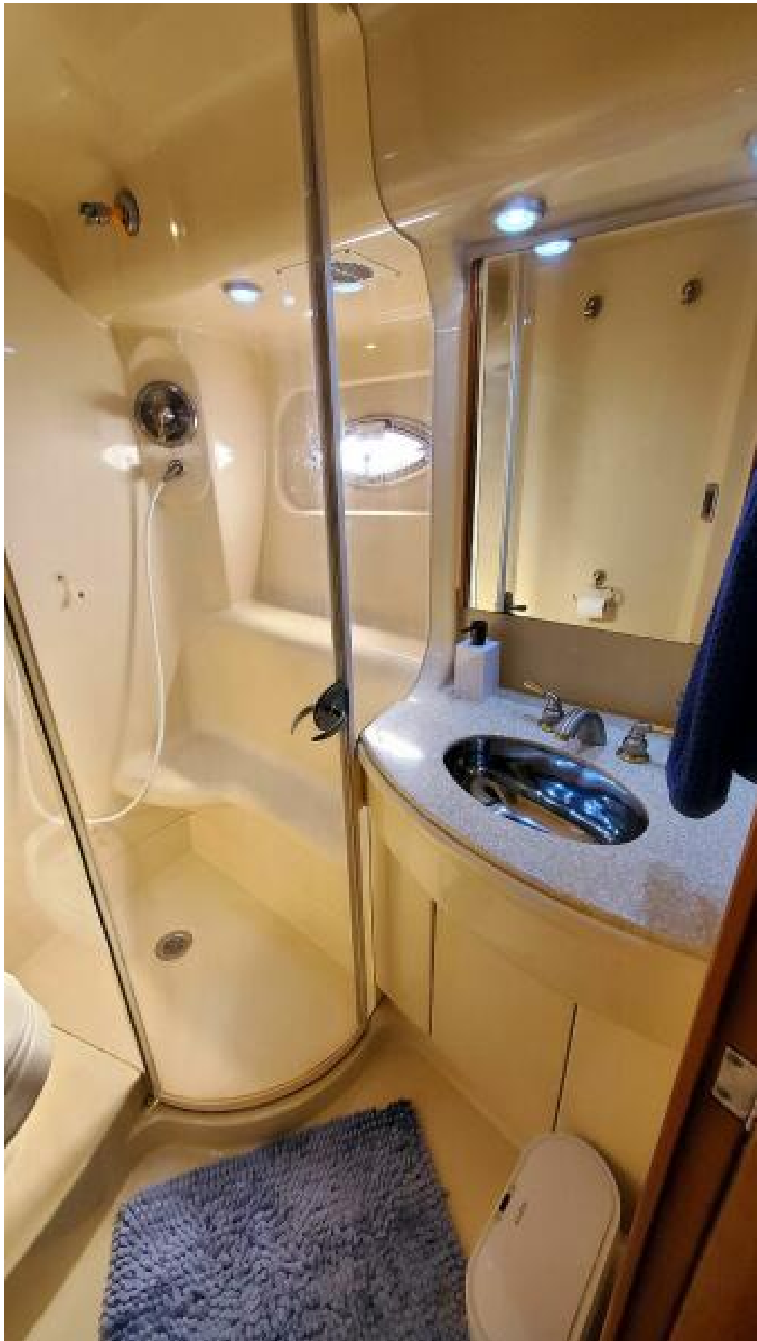
Master Head Vanity and Shower