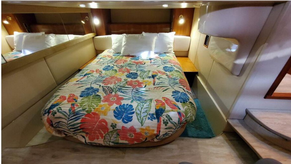
VIP Stateroom Port