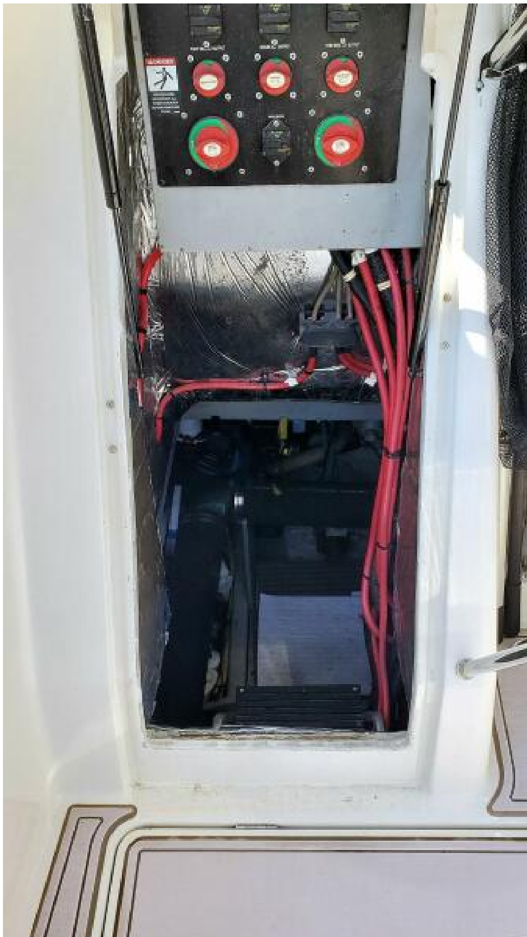
Engine Room Companionway