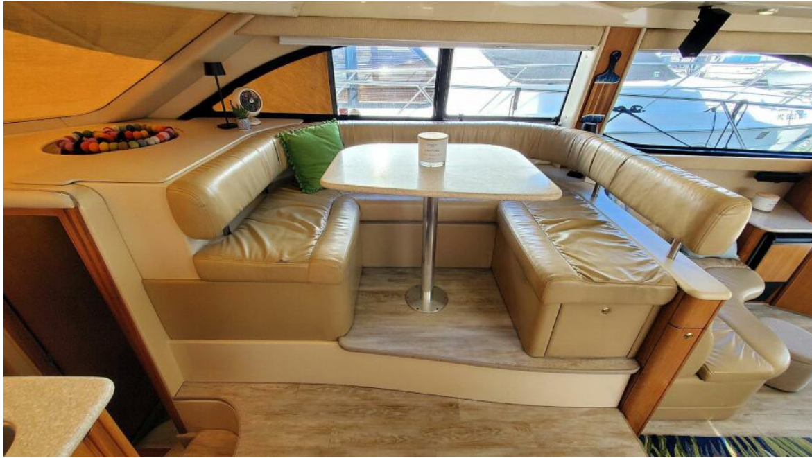
Galley and Dinette Starboard