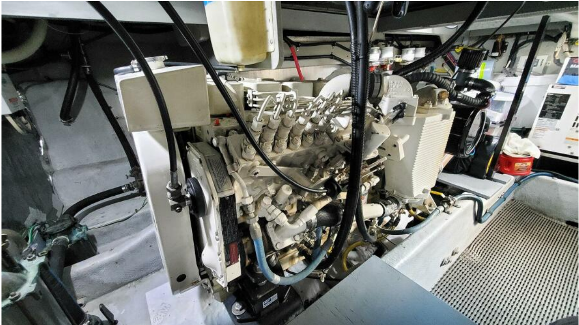
Starboard Main Engine Aft