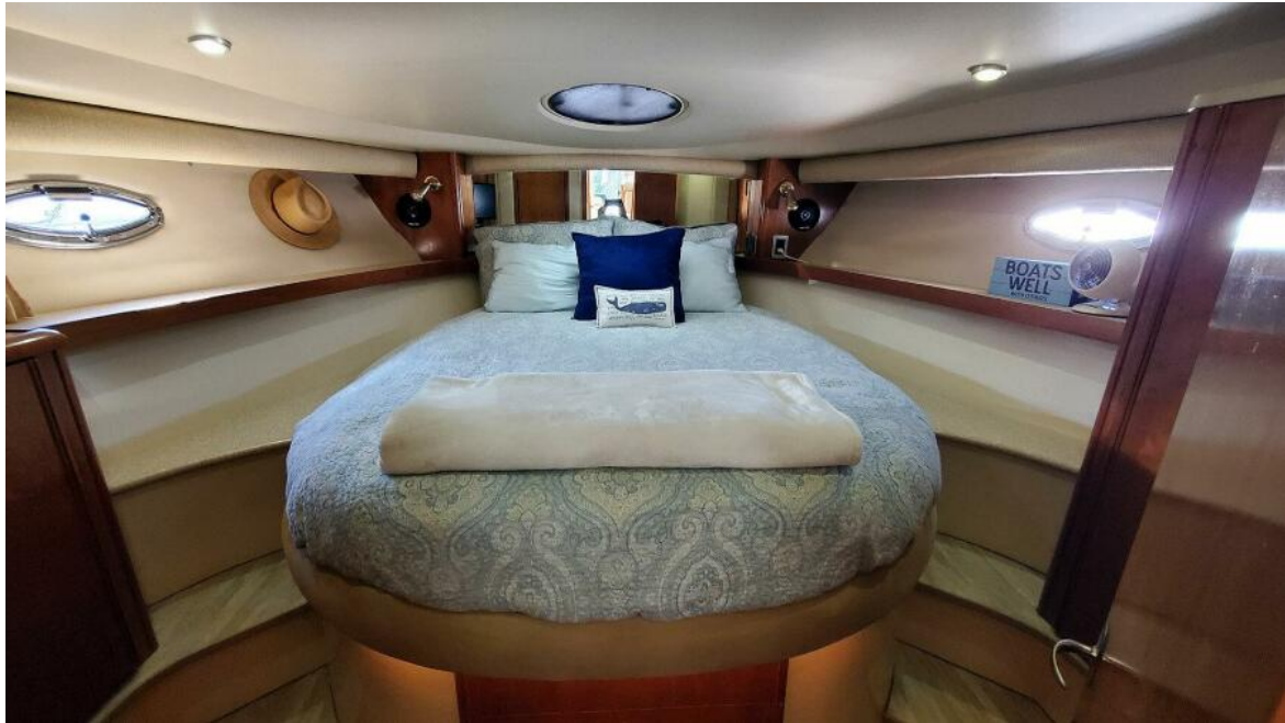
Master Stateroom Forward