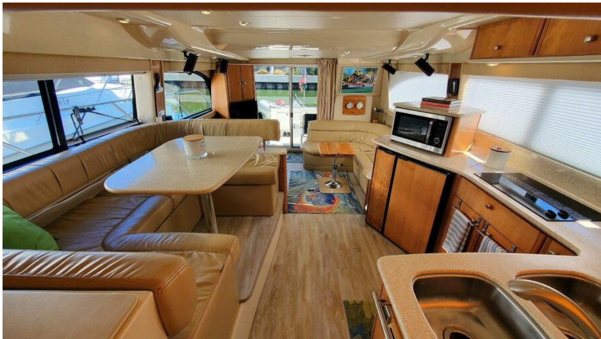
Galley and Dinette Aft