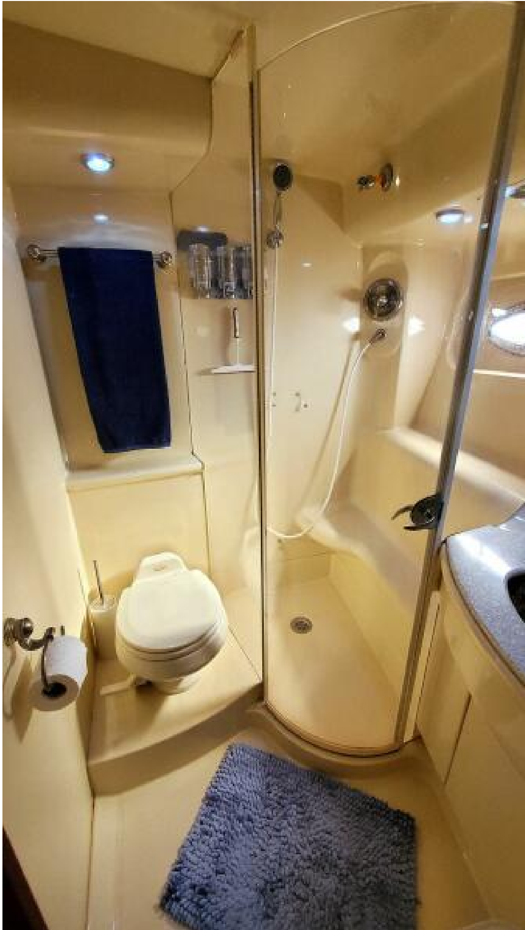
Master Head Toilet and Shower