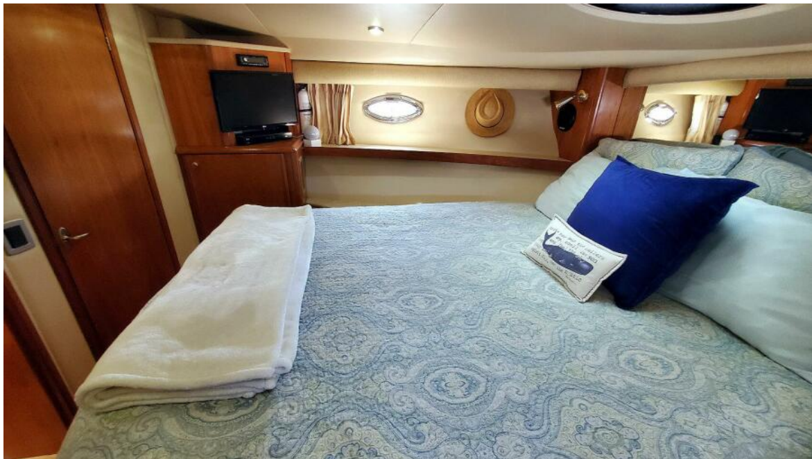
Master Stateroom Port