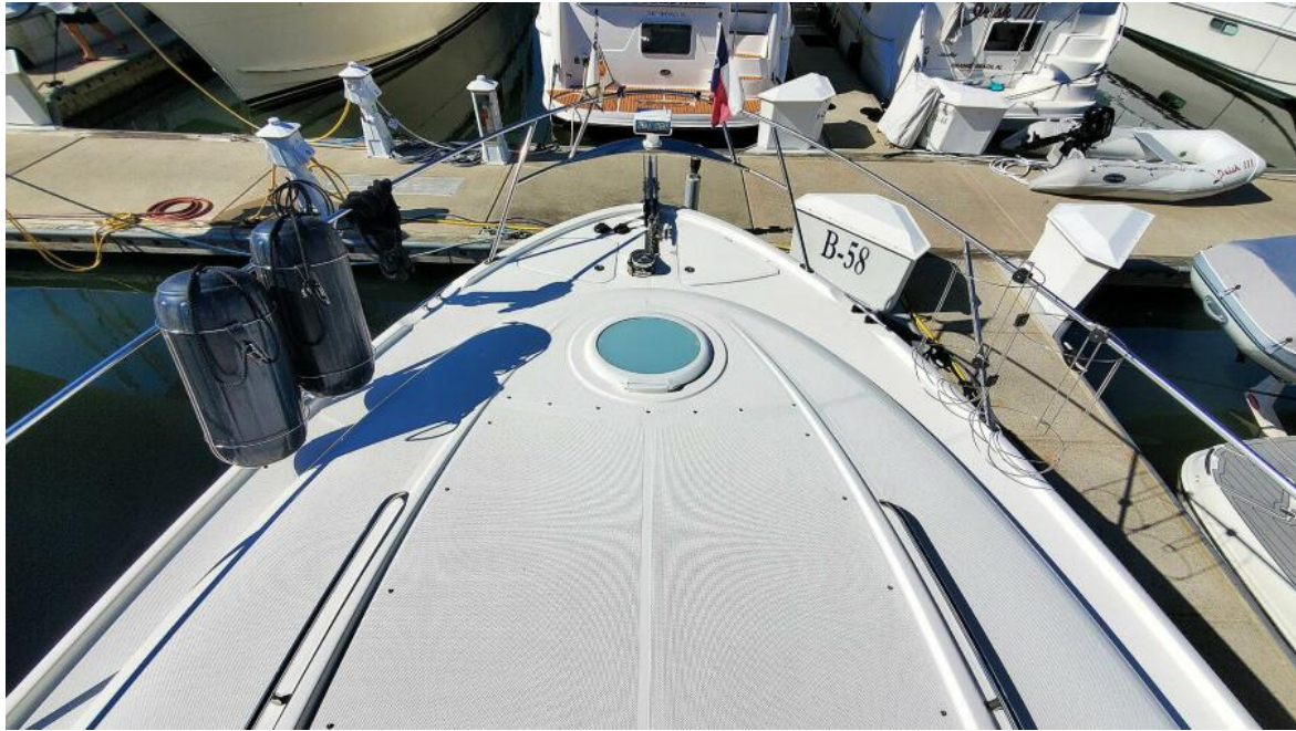
Fore Deck Forward