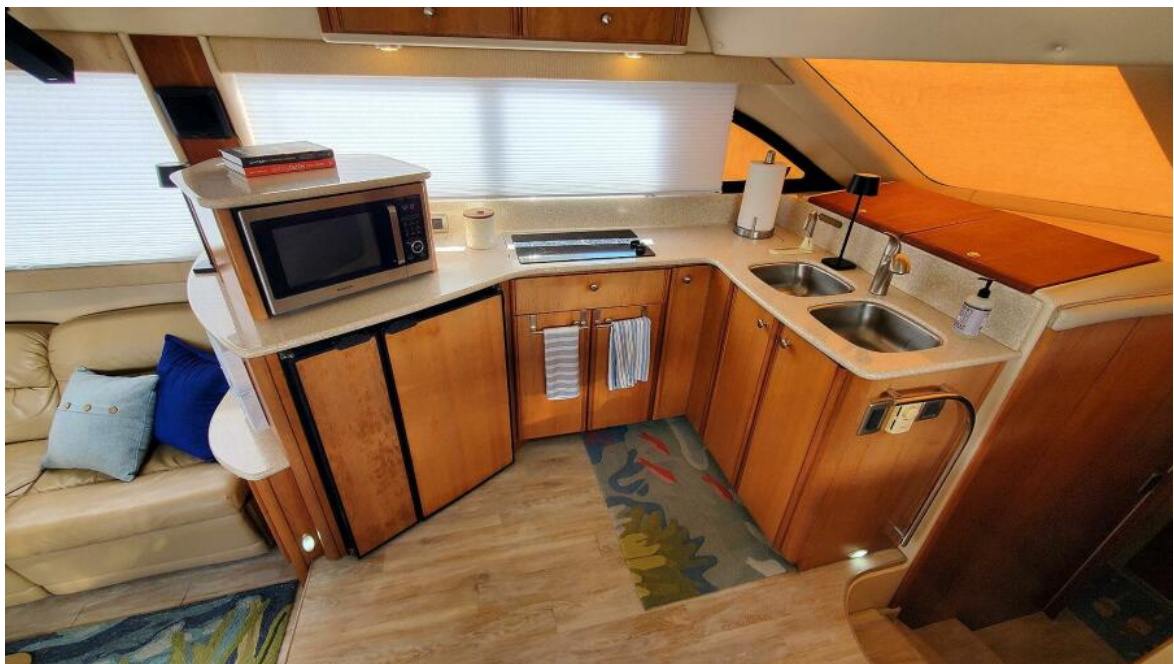
Galley and Dinette Port