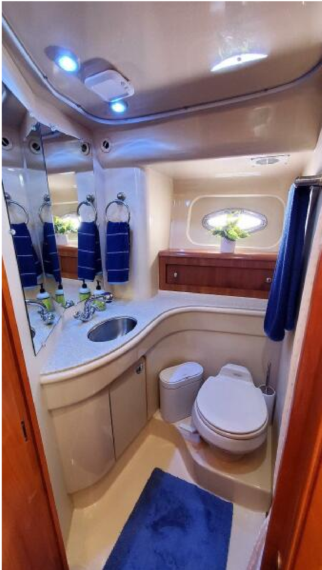
VIP Wet Head