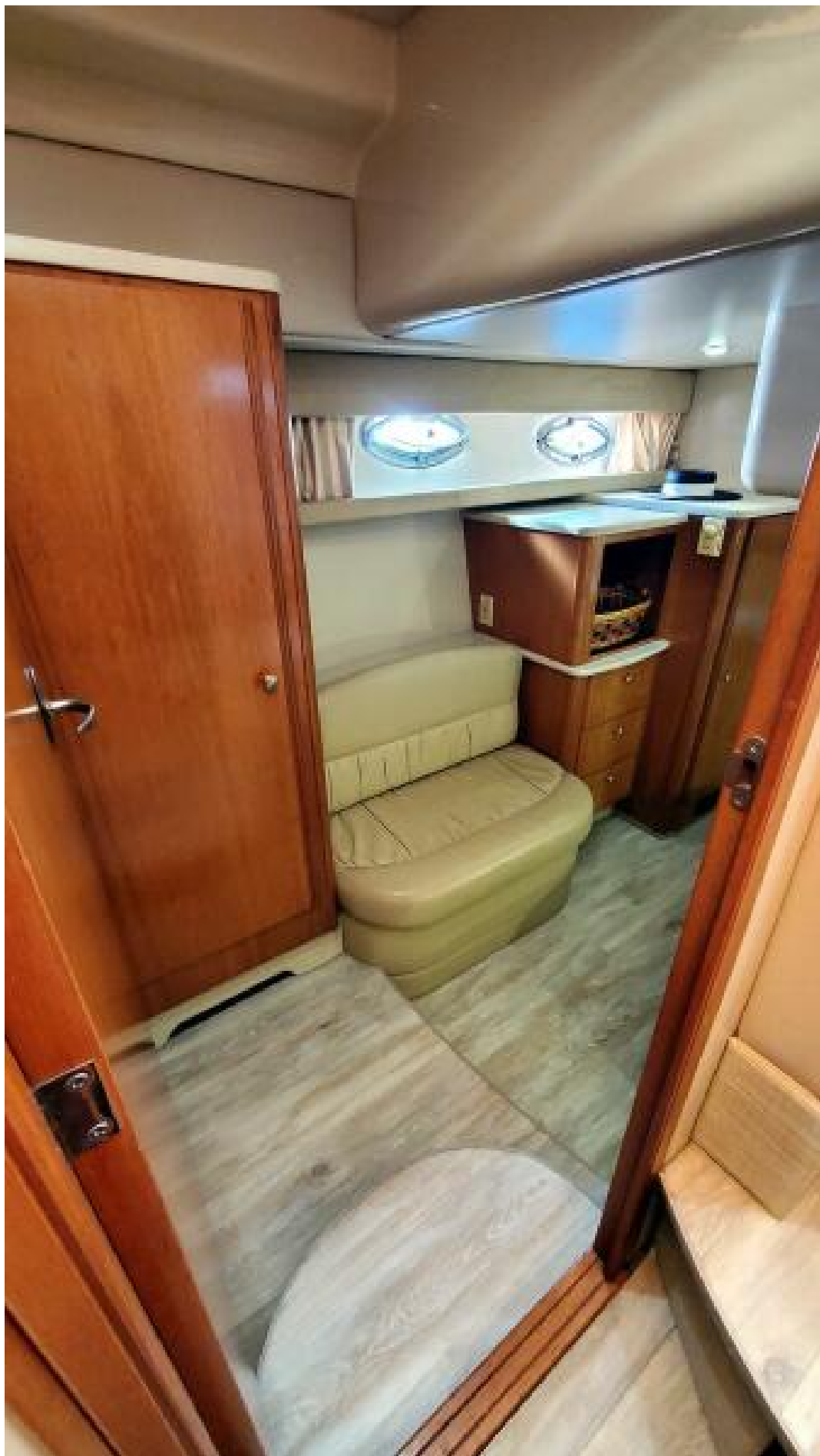
VIP Stateroom Entryway