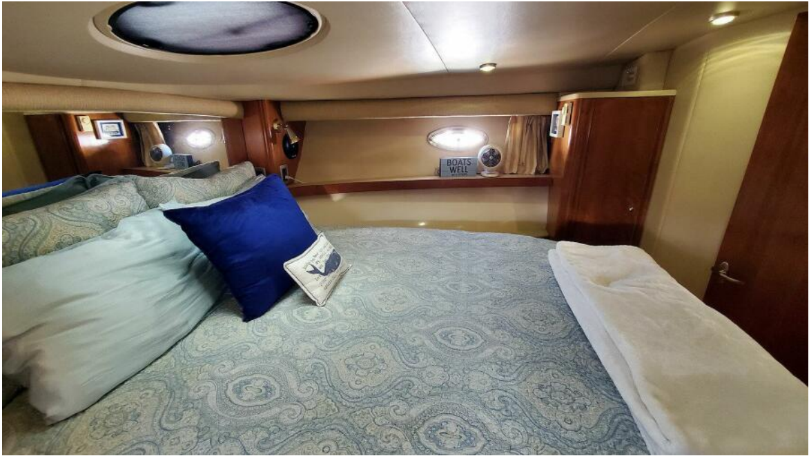
Master Stateroom Starboard