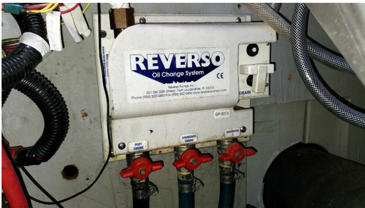
Oil Change System