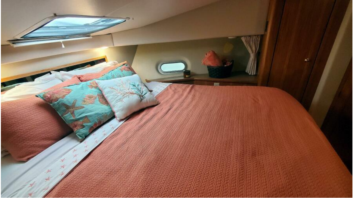
VIP Stateroom Starboard