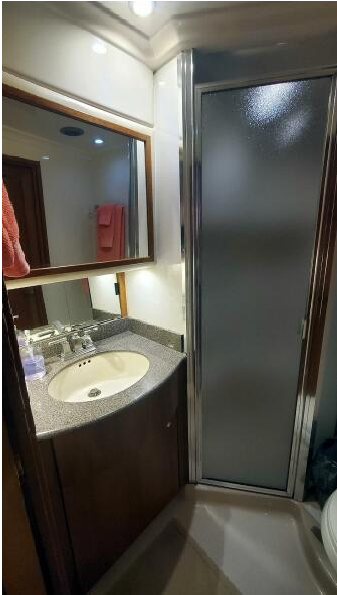
Guest Head Vanity and Shower