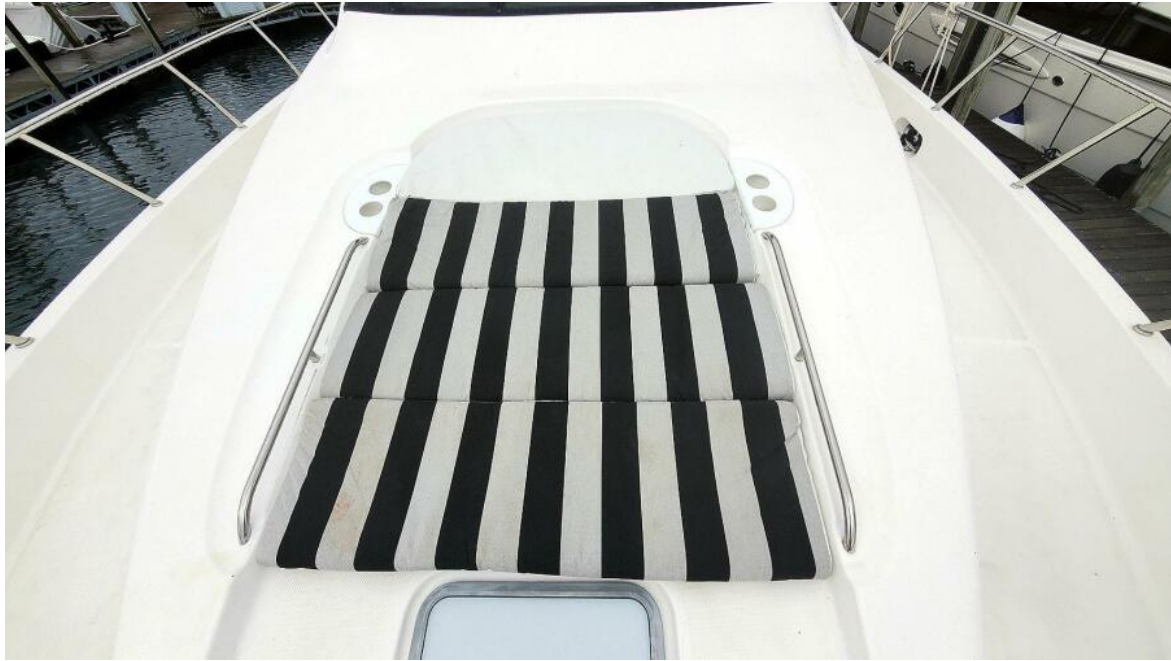
Bow Sun Pads