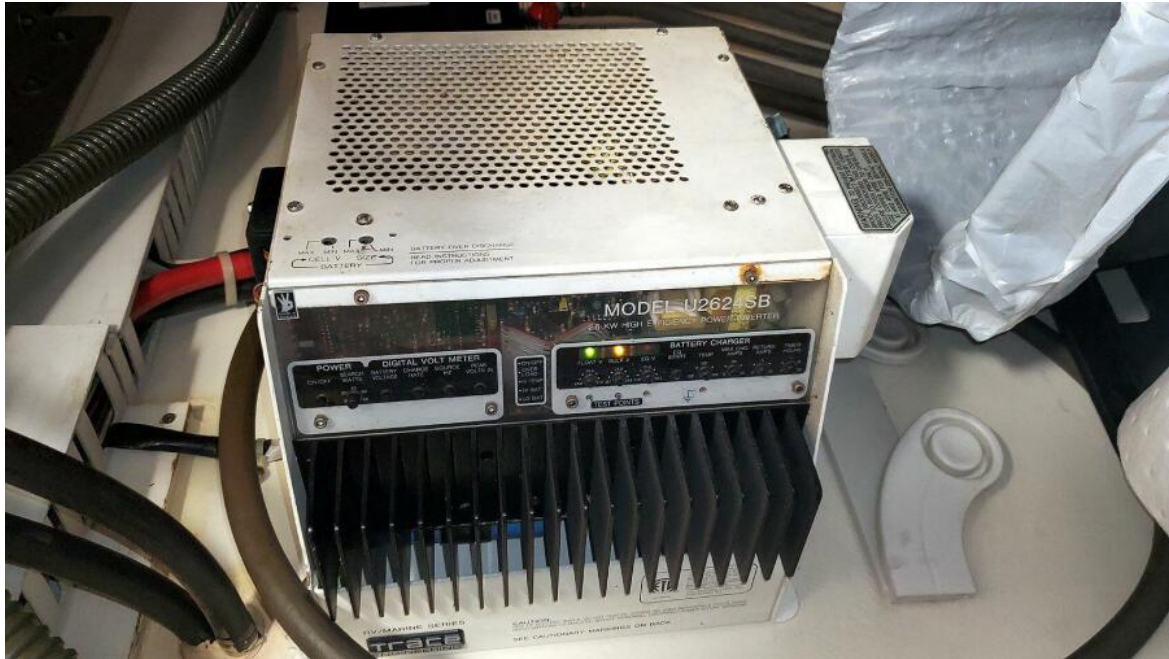
Battery Charger and Inverter