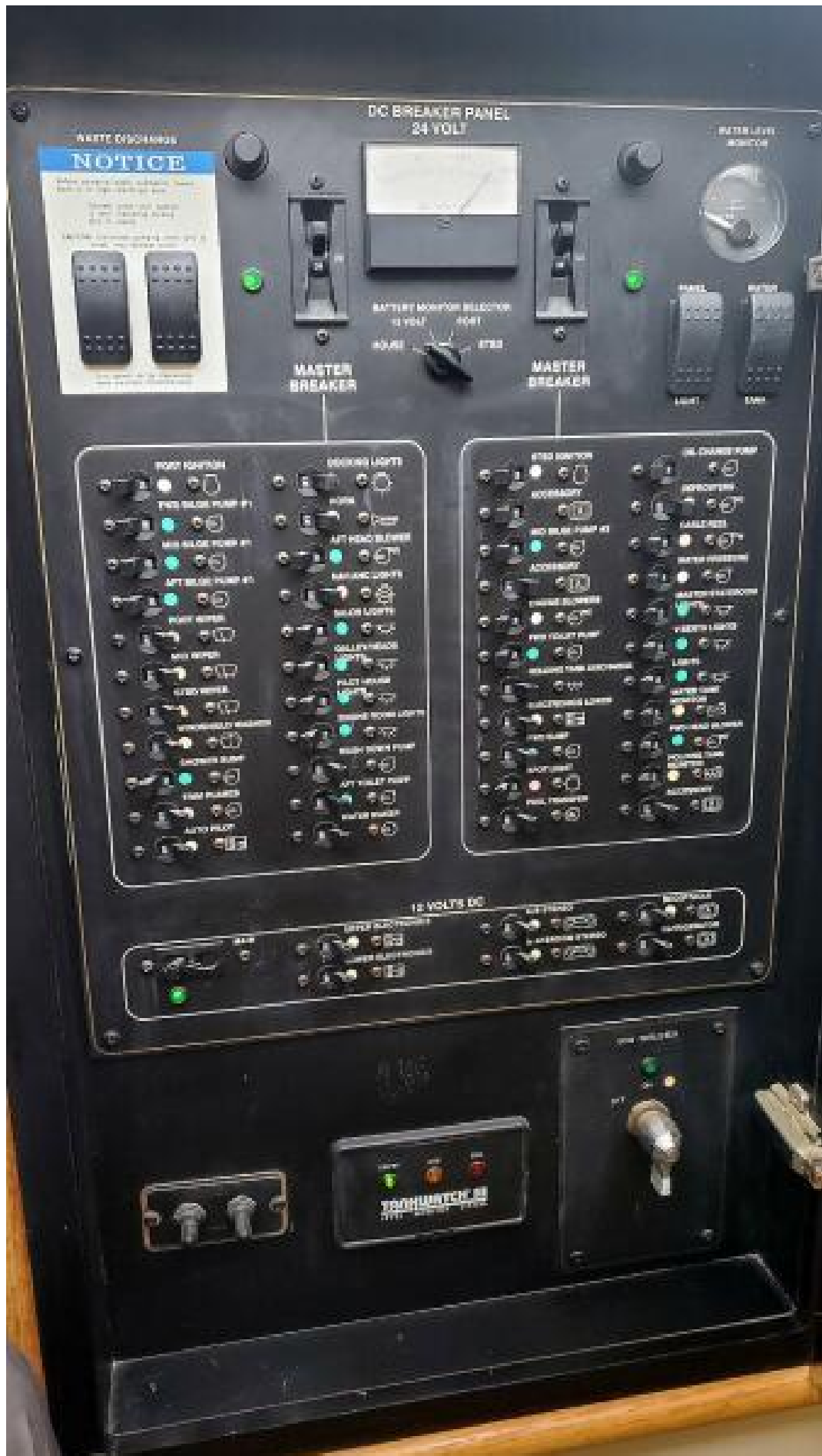
DC Electrical Panel