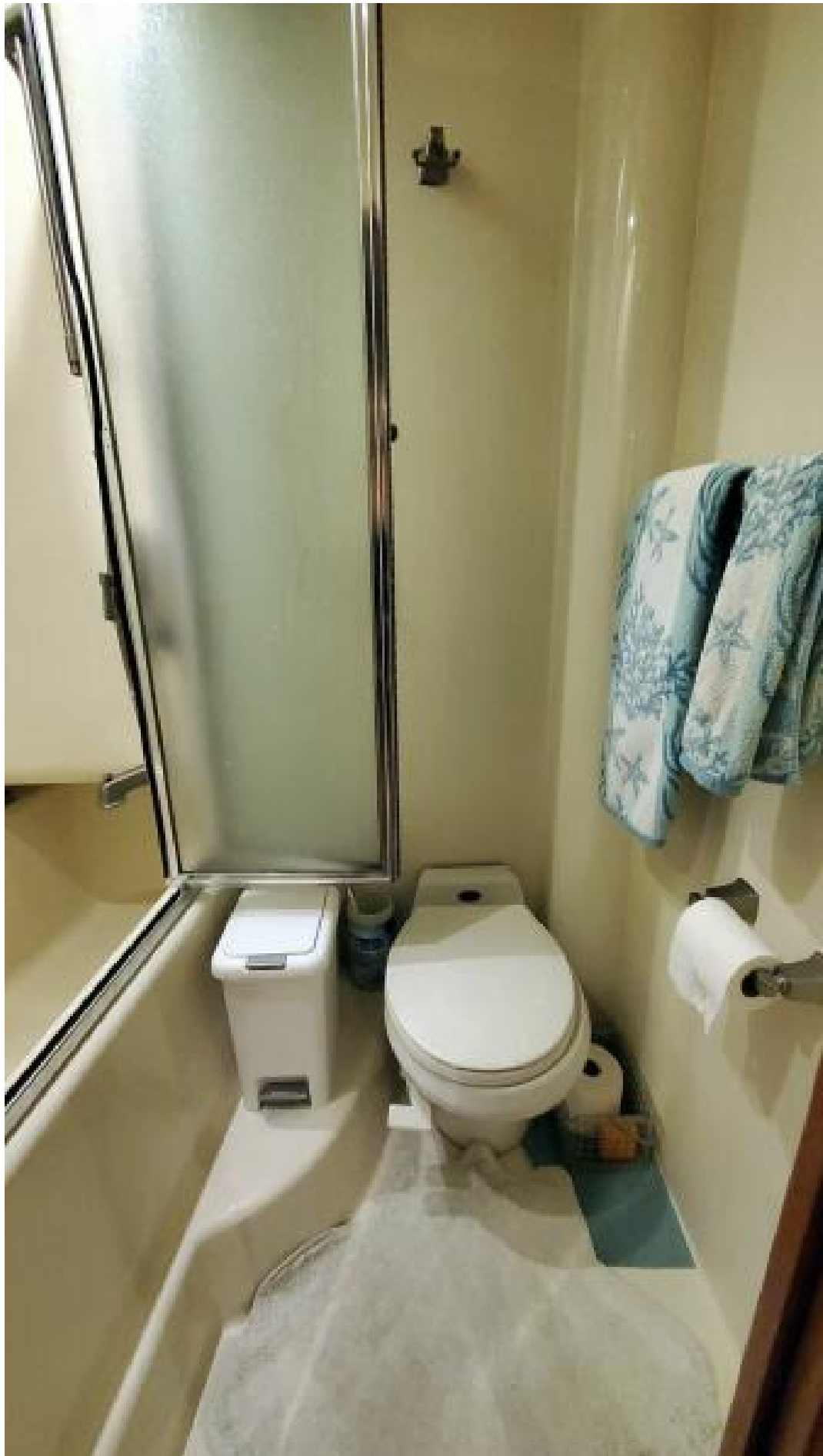
Master Head Toilet