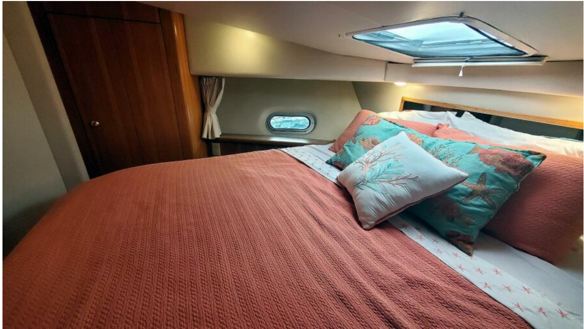
VIP Stateroom Port