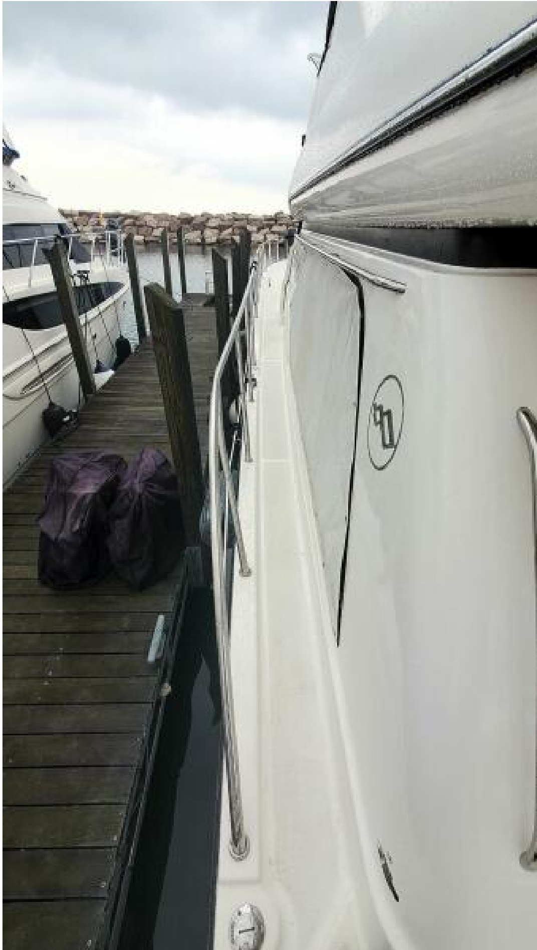
Port Side Walkway