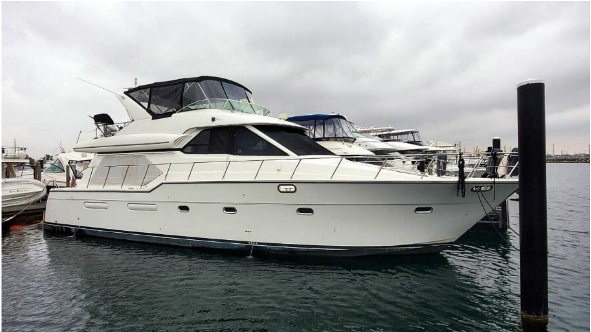
Starboard Bow Profile