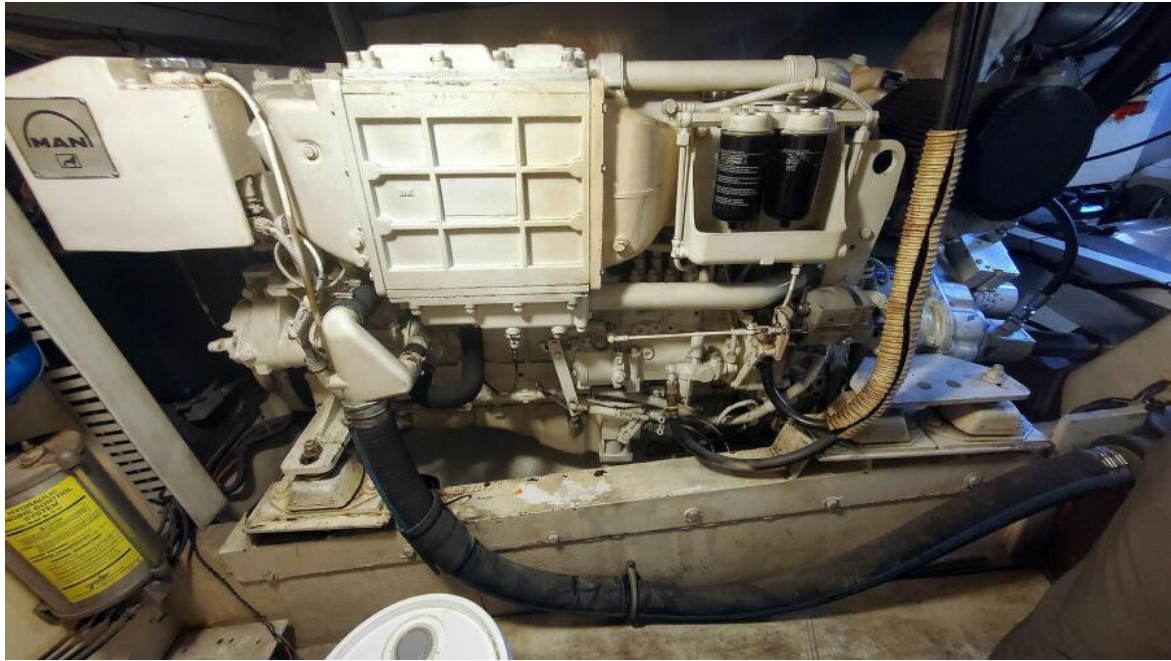
Starboard Main Engine