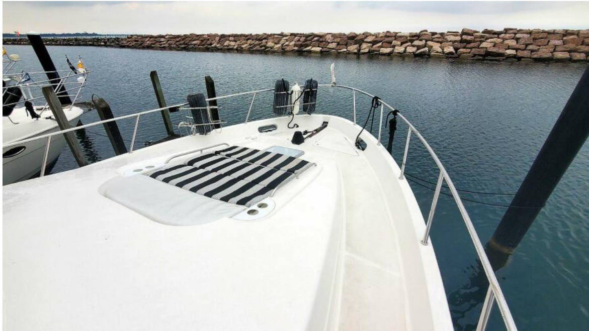
Fore Deck Forward