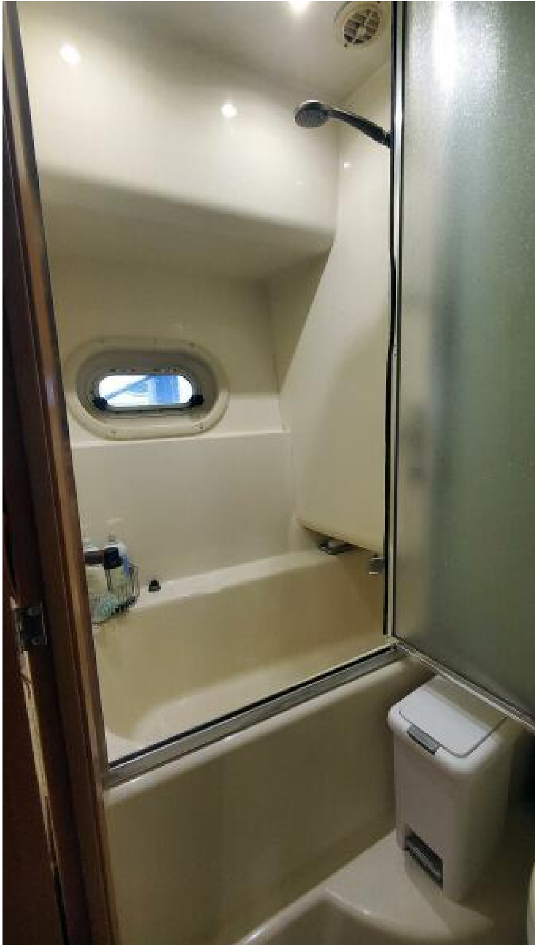
Master Head Tub and Shower