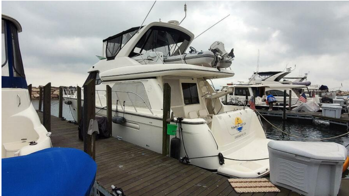
Port Stern Profile