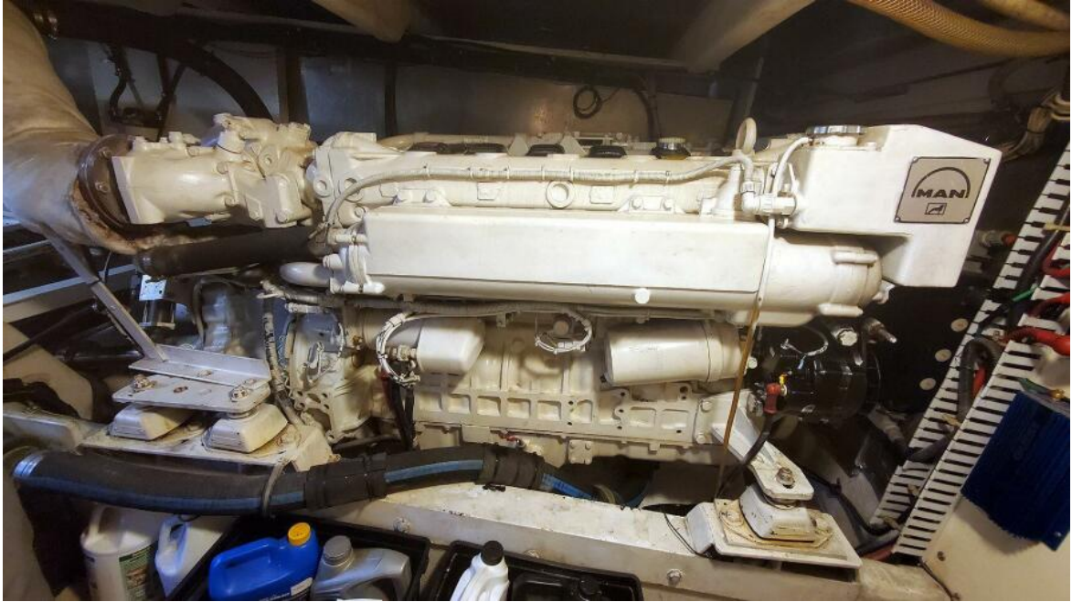
Port Main Engine