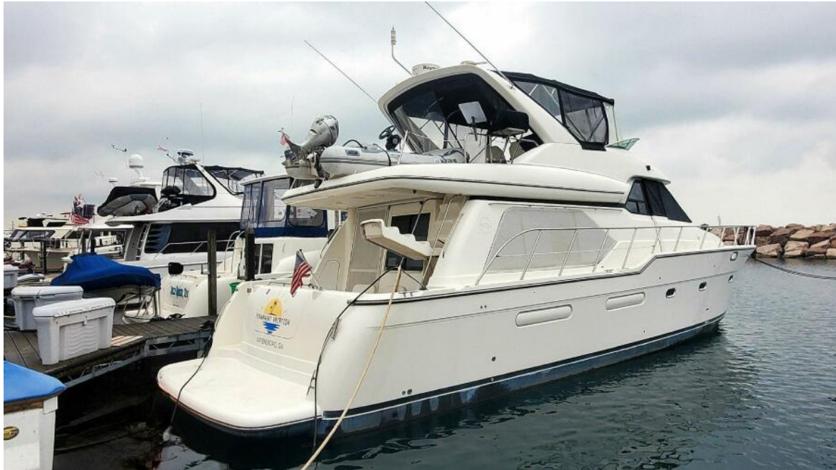
Starboard Stern Profile