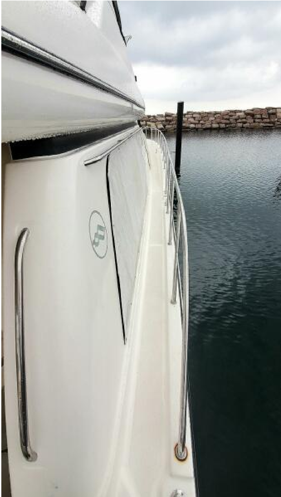
Starboard Side Walkway