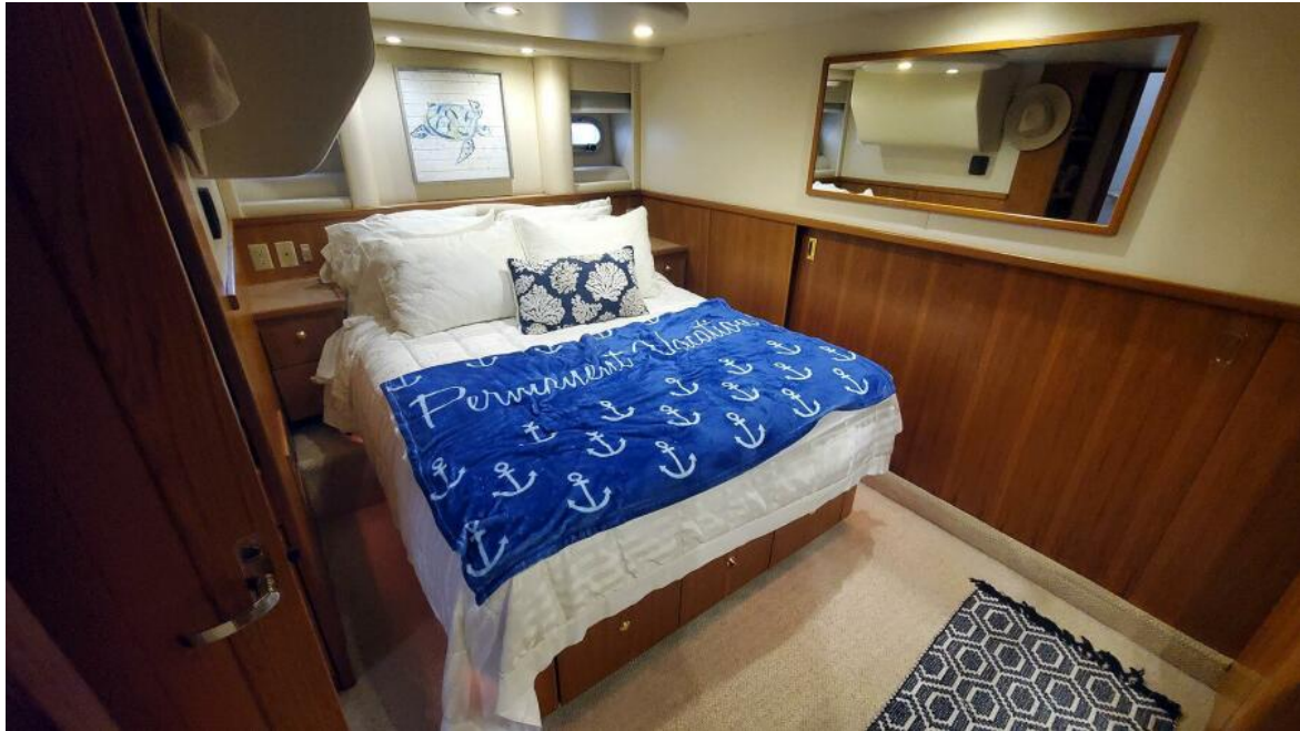
Master Stateroom Starboard Aft