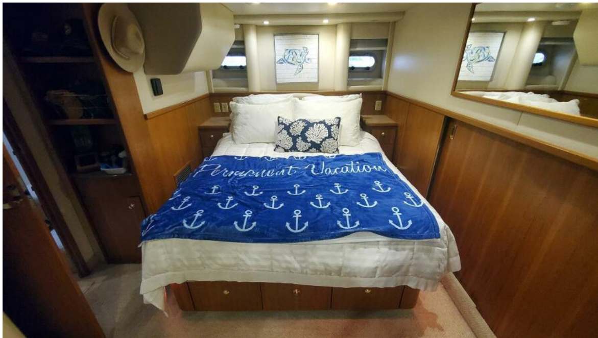
Master Stateroom Starboard