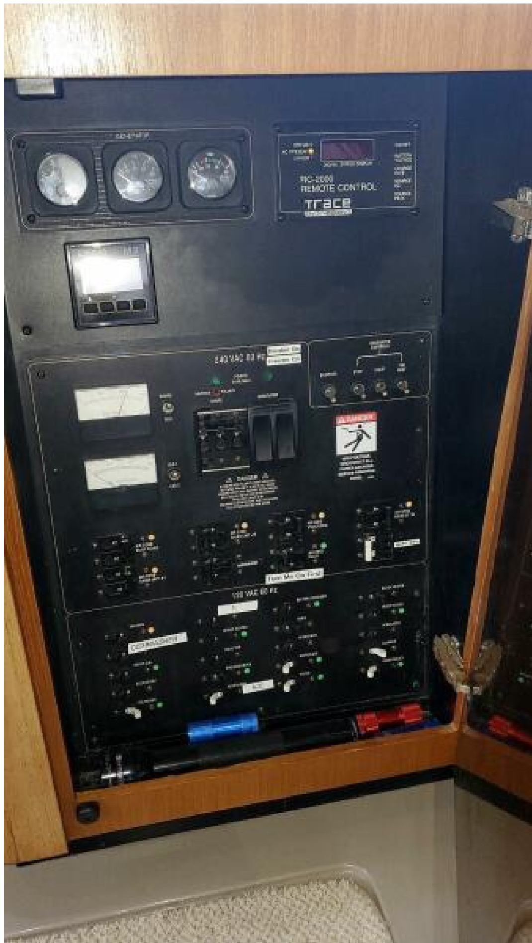
AC Electrical Panel