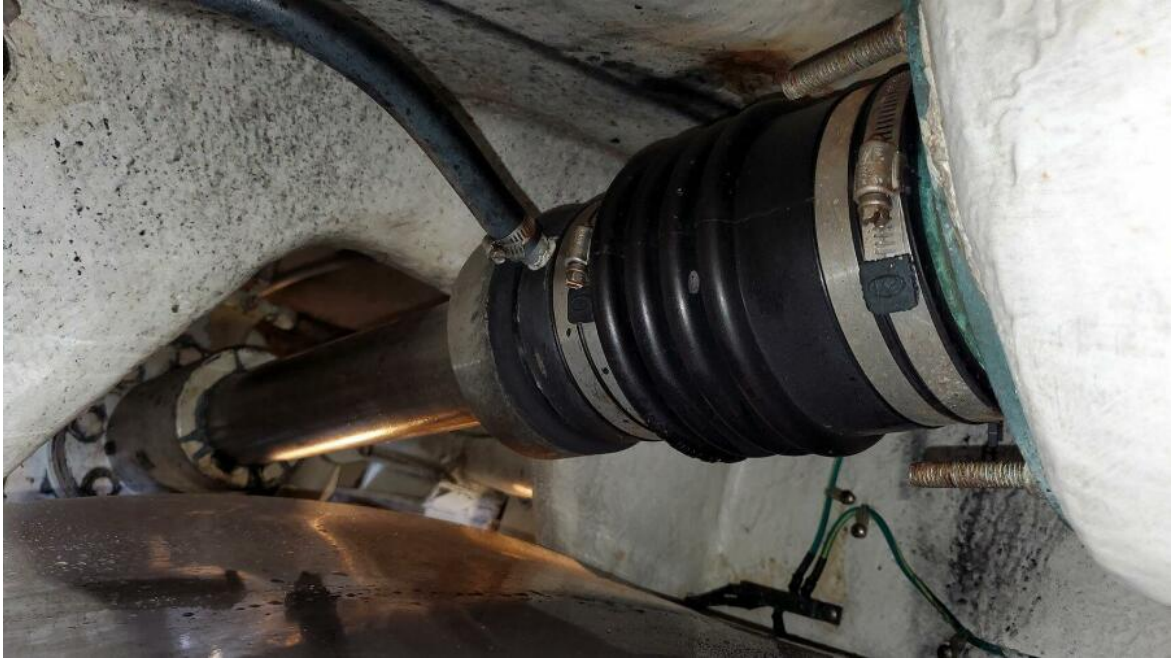
Dripless Shaft Seal