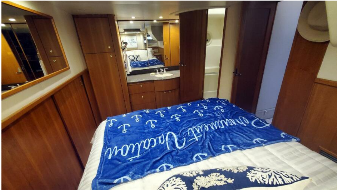
Master Stateroom Port