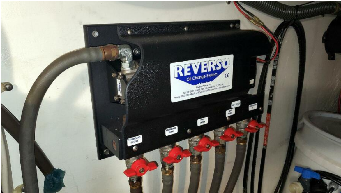
Oil Change System