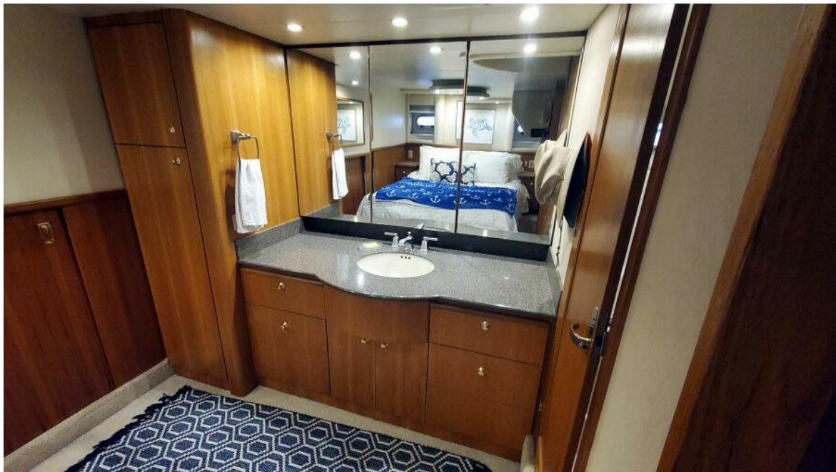
Master Head Vanity