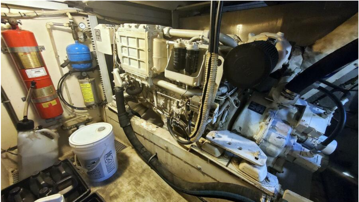
Engine Room Starboard