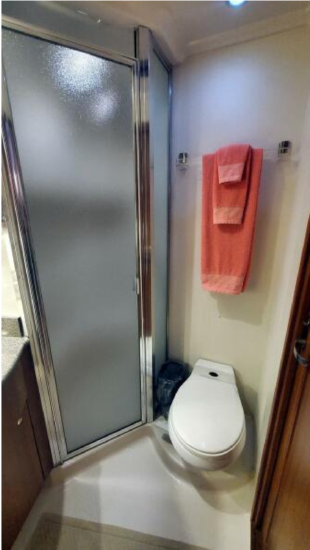
Guest Head Shower and Toilet