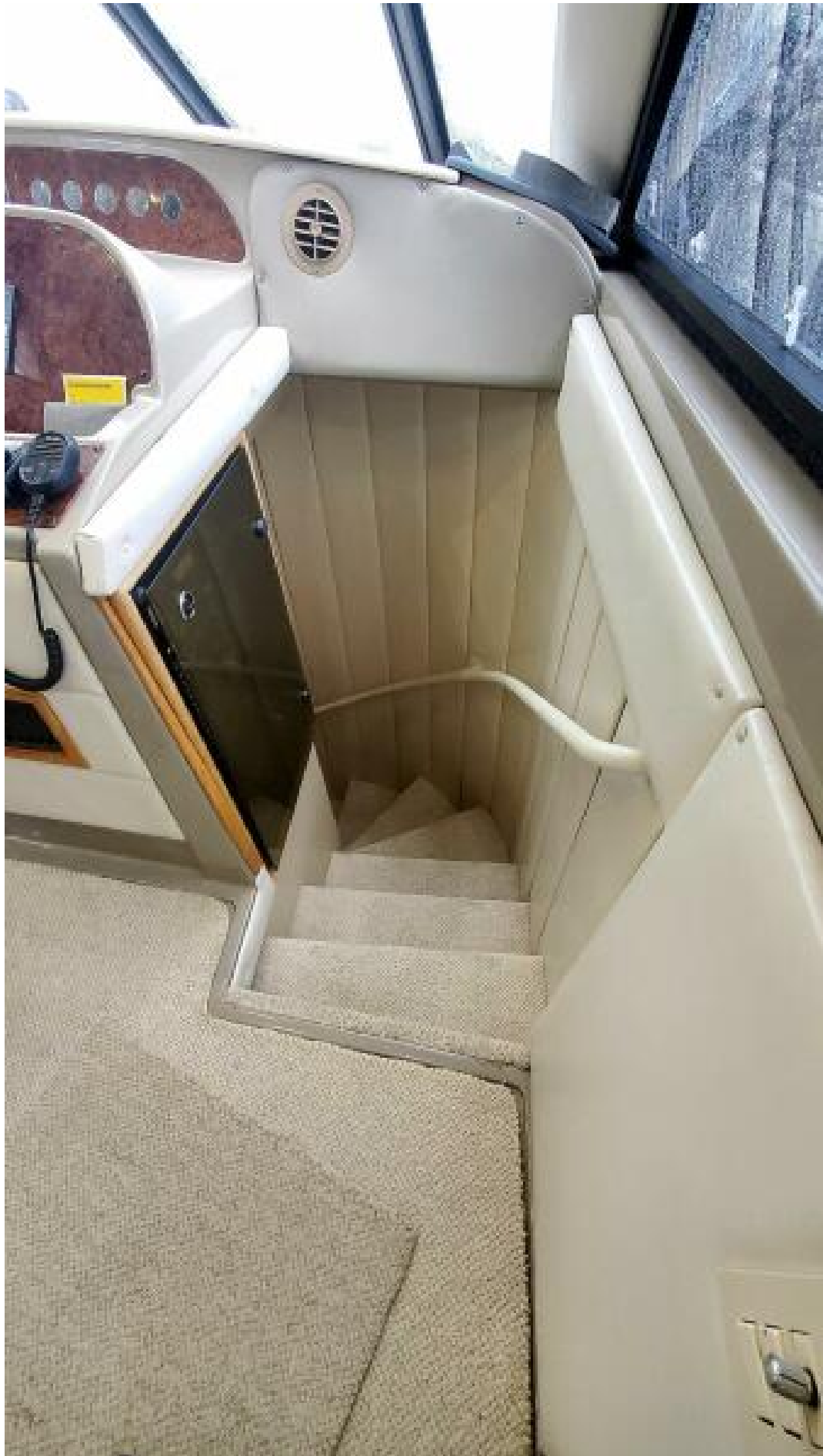
Pilothouse Berthing Companionway