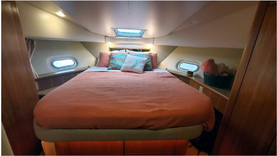
VIP Stateroom Forward