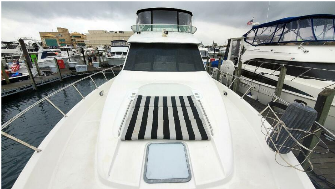
Fore Deck Aft