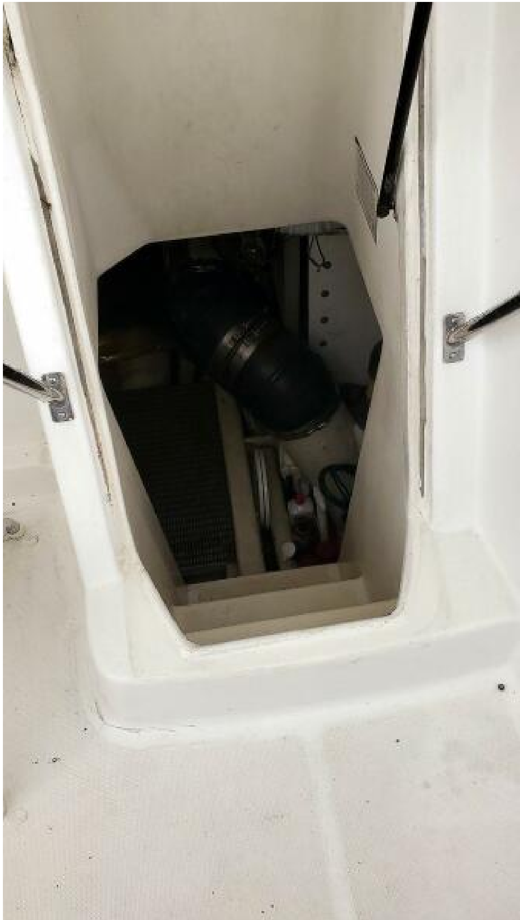
Engine Room Companionway