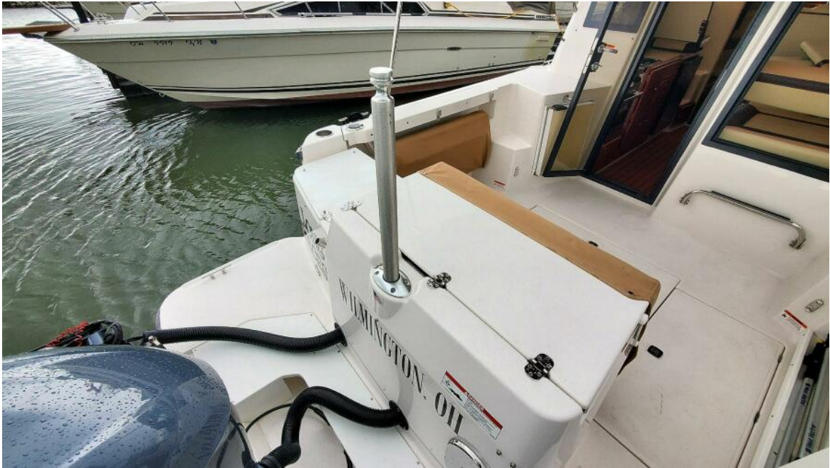
Retractable Tow Pole