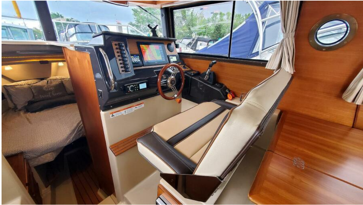
Main Cabin Helm