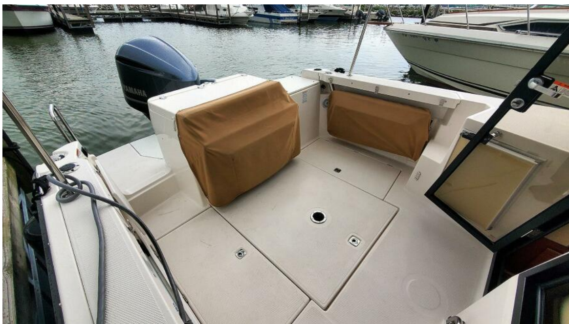
Cockpit Seating Covers