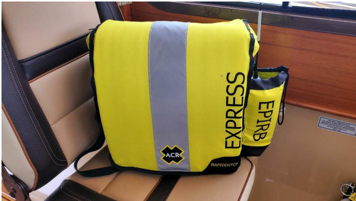
Ditch Bag and EPIRB