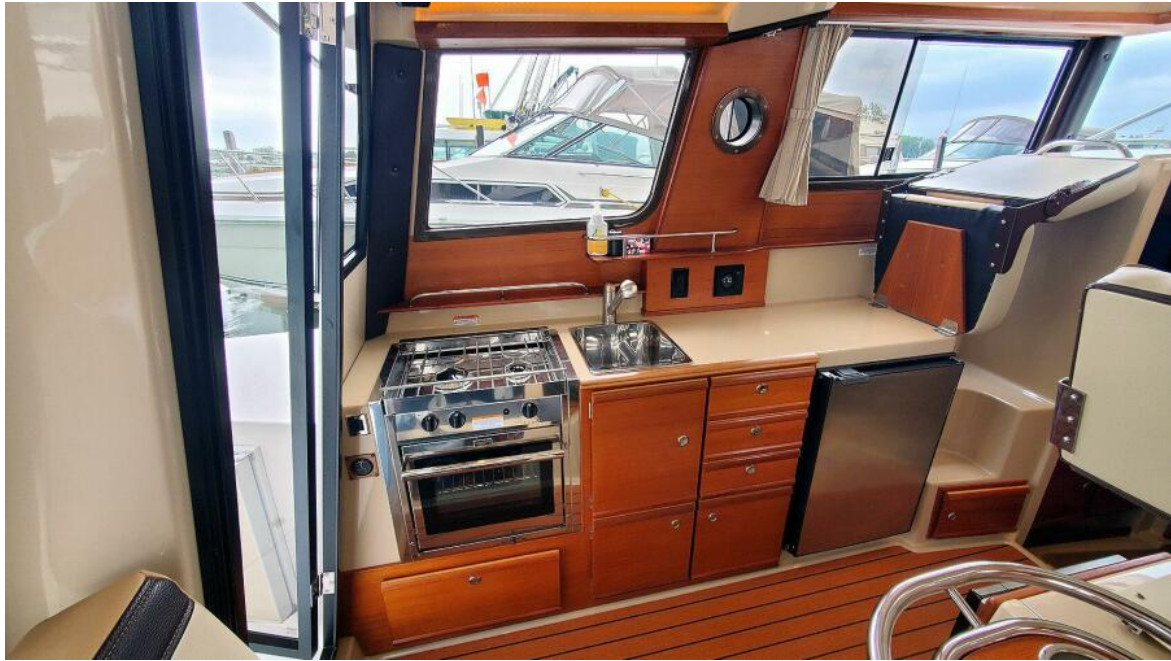
Main Cabin Galley