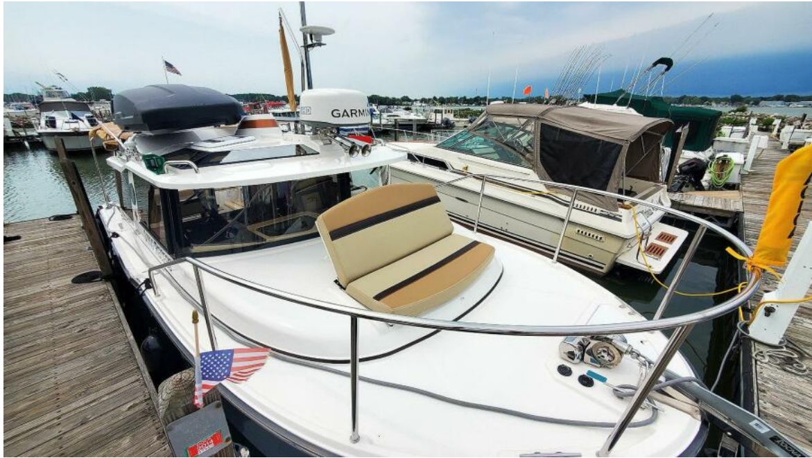
Fore Deck Seating