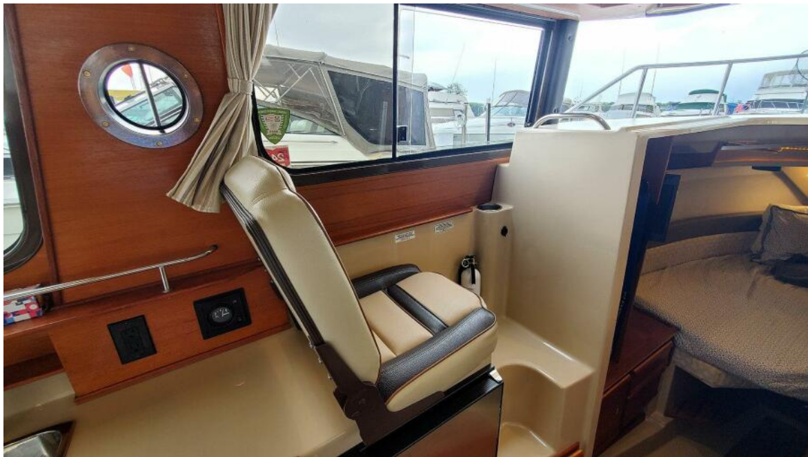
Main Cabin Navigators Chair