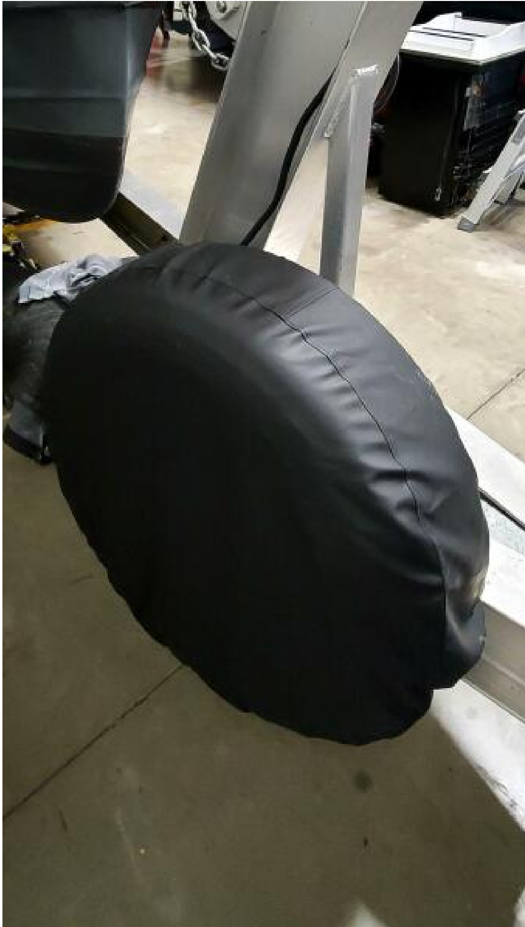
Trailer Spare Tire with Cover