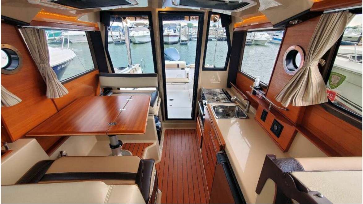
Main Cabin Aft