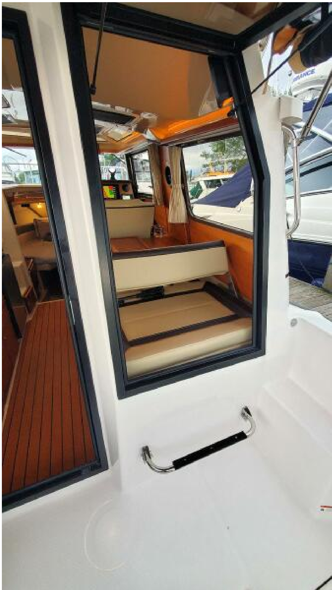
Cockpit Main Cabin Seating