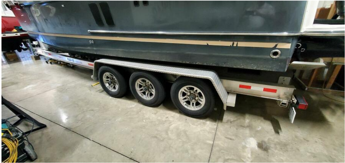
Triple Axle Trailer