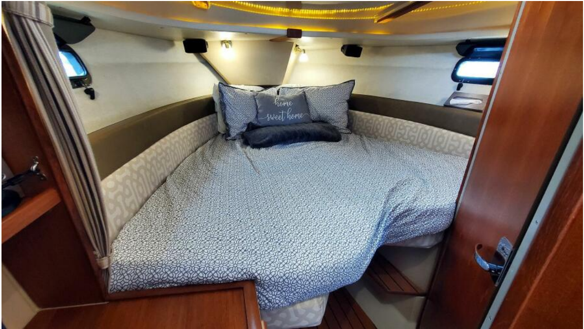
Master Stateroom Forward