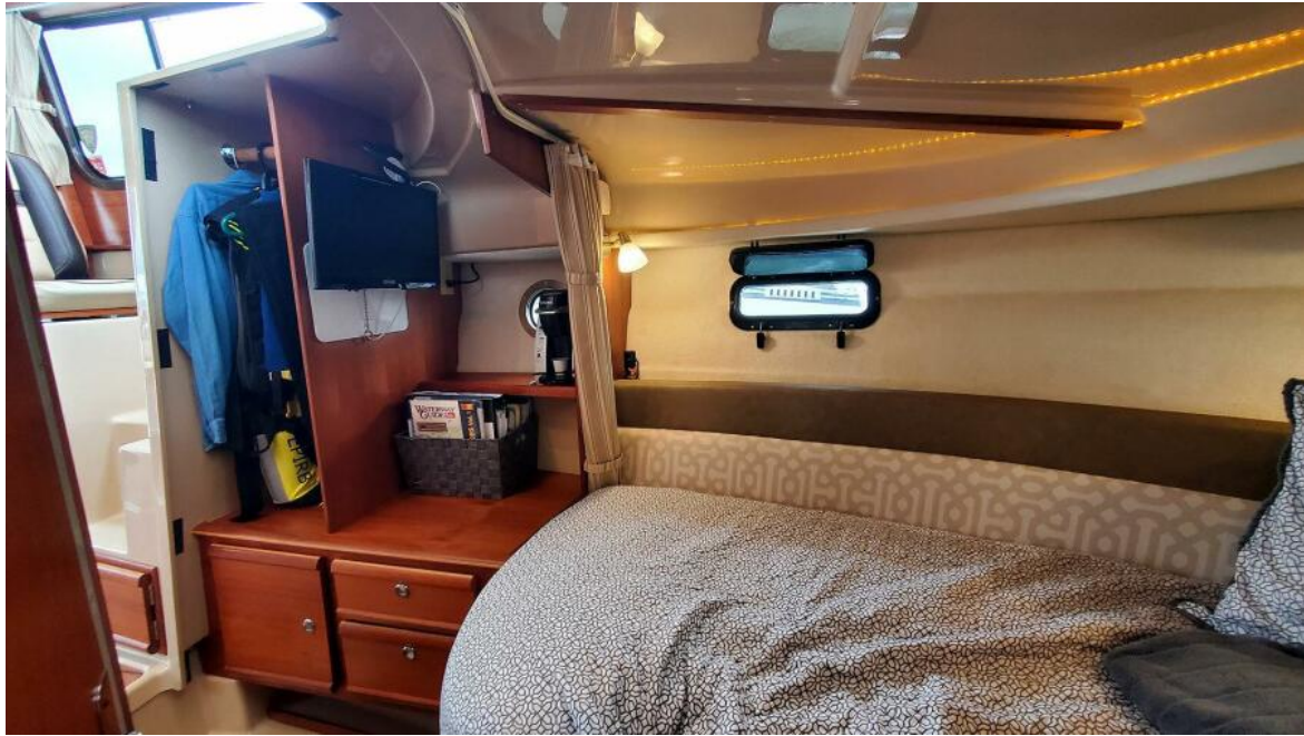
Master Stateroom Port