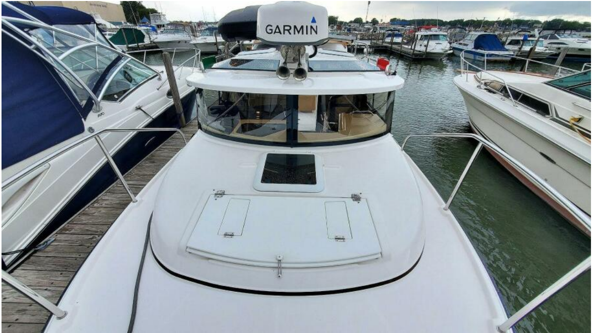
Fore Deck Aft