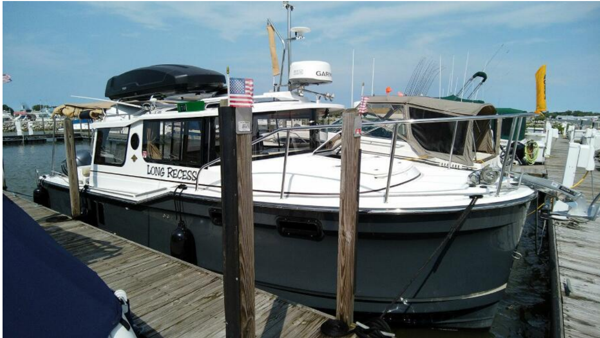
Starboard Bow Profile