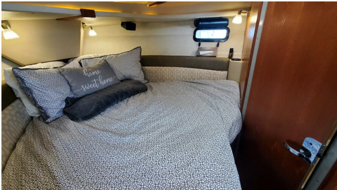
Master Stateroom Starboard