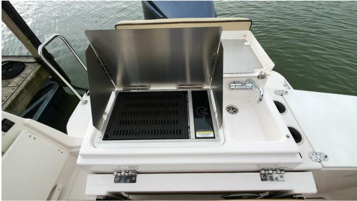
Cockpit Summer Kitchen