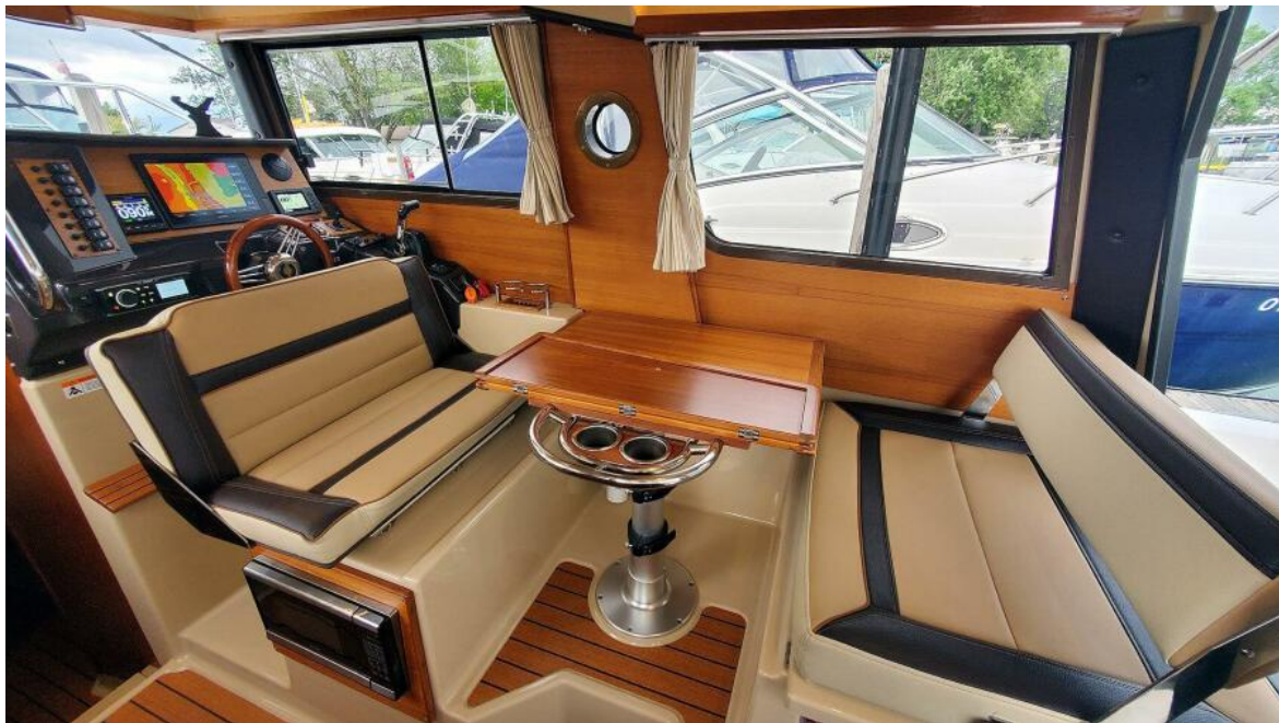
Main Cabin Dinette