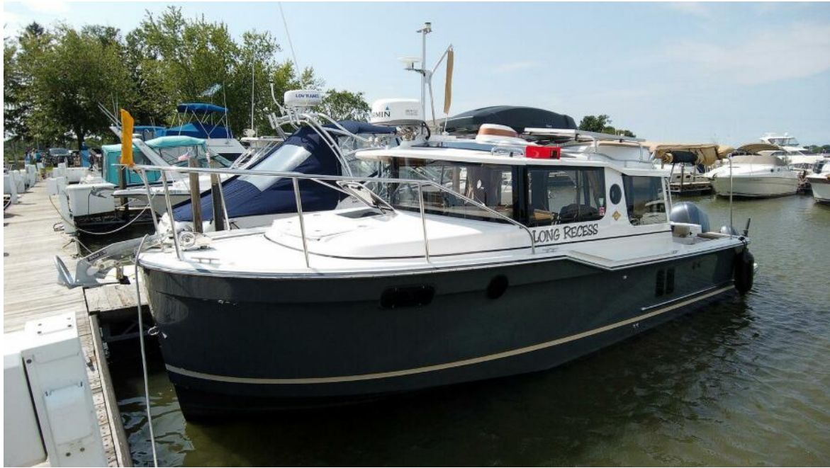
Port Bow Profile