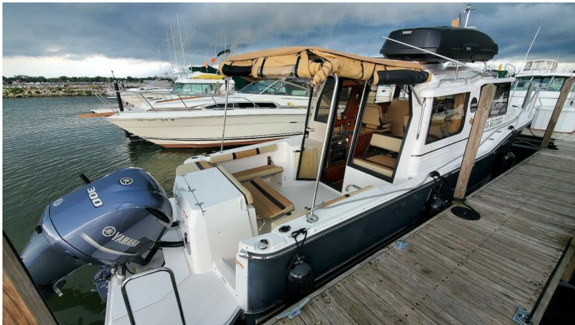
Starboard Stern Profile