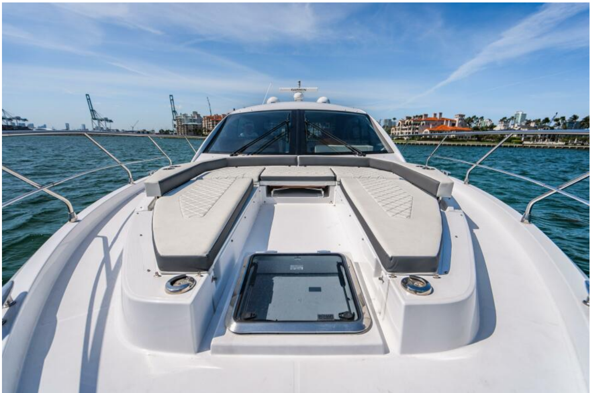
Main deck forward lounge