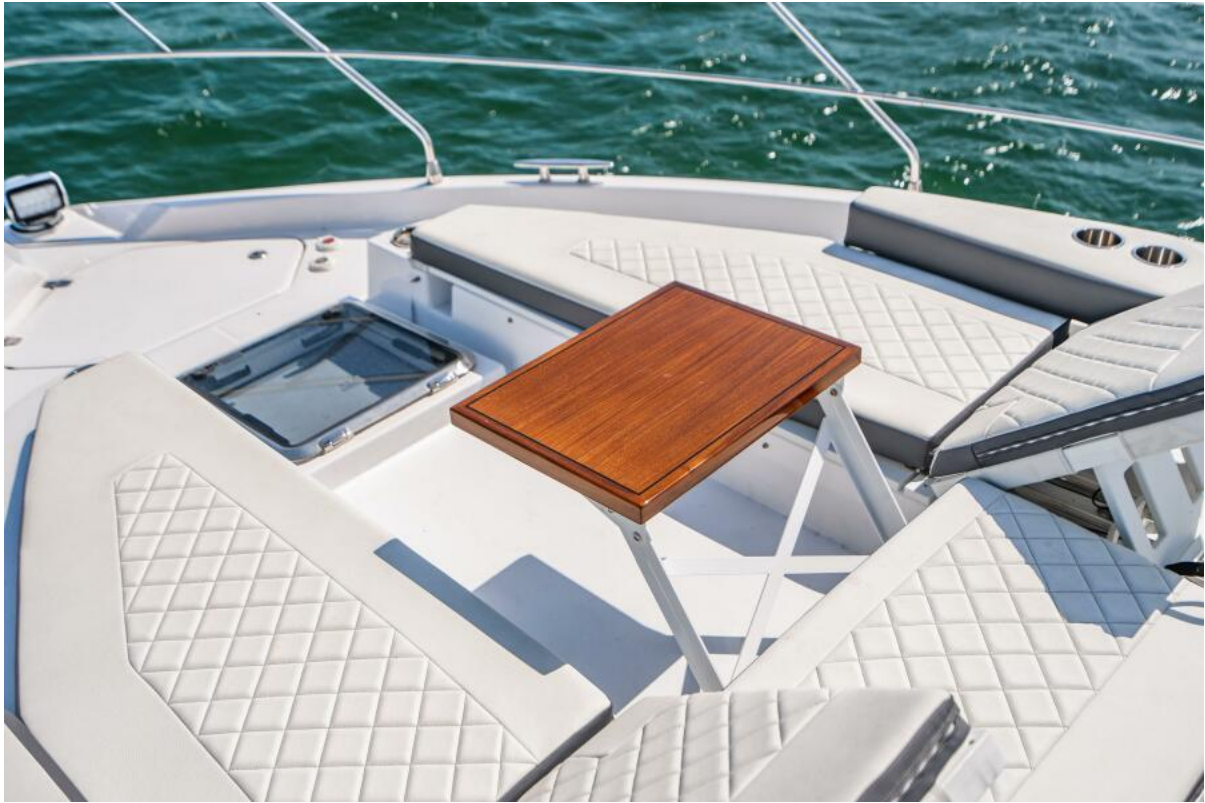
Main deck forward lounge