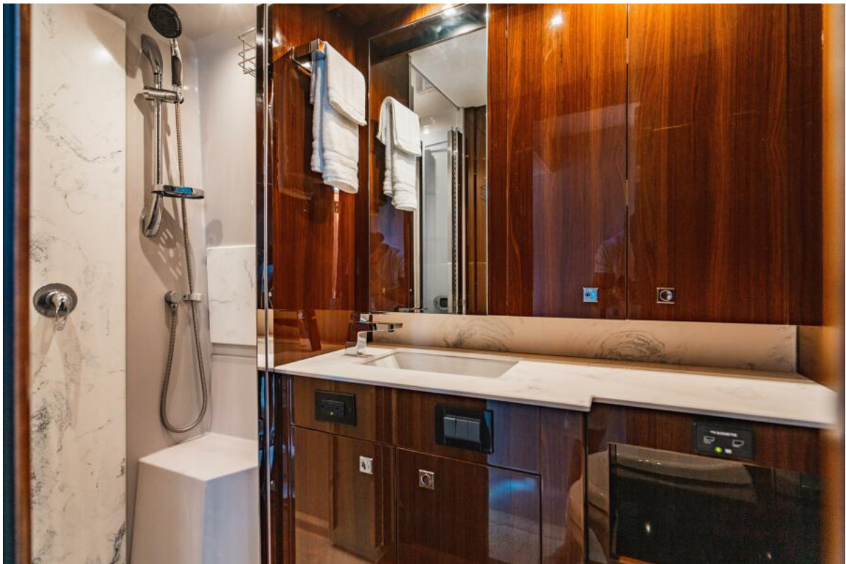
Lower deck master bath