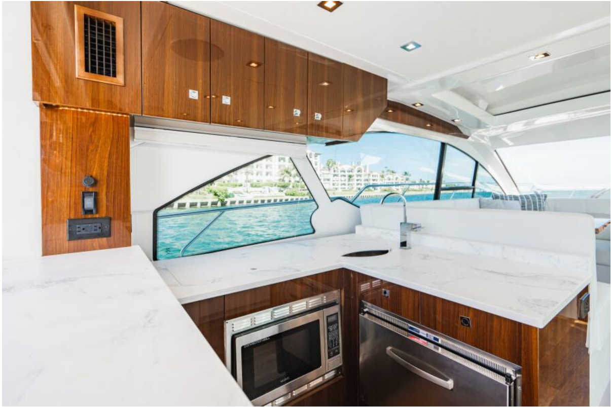
Main deck galley