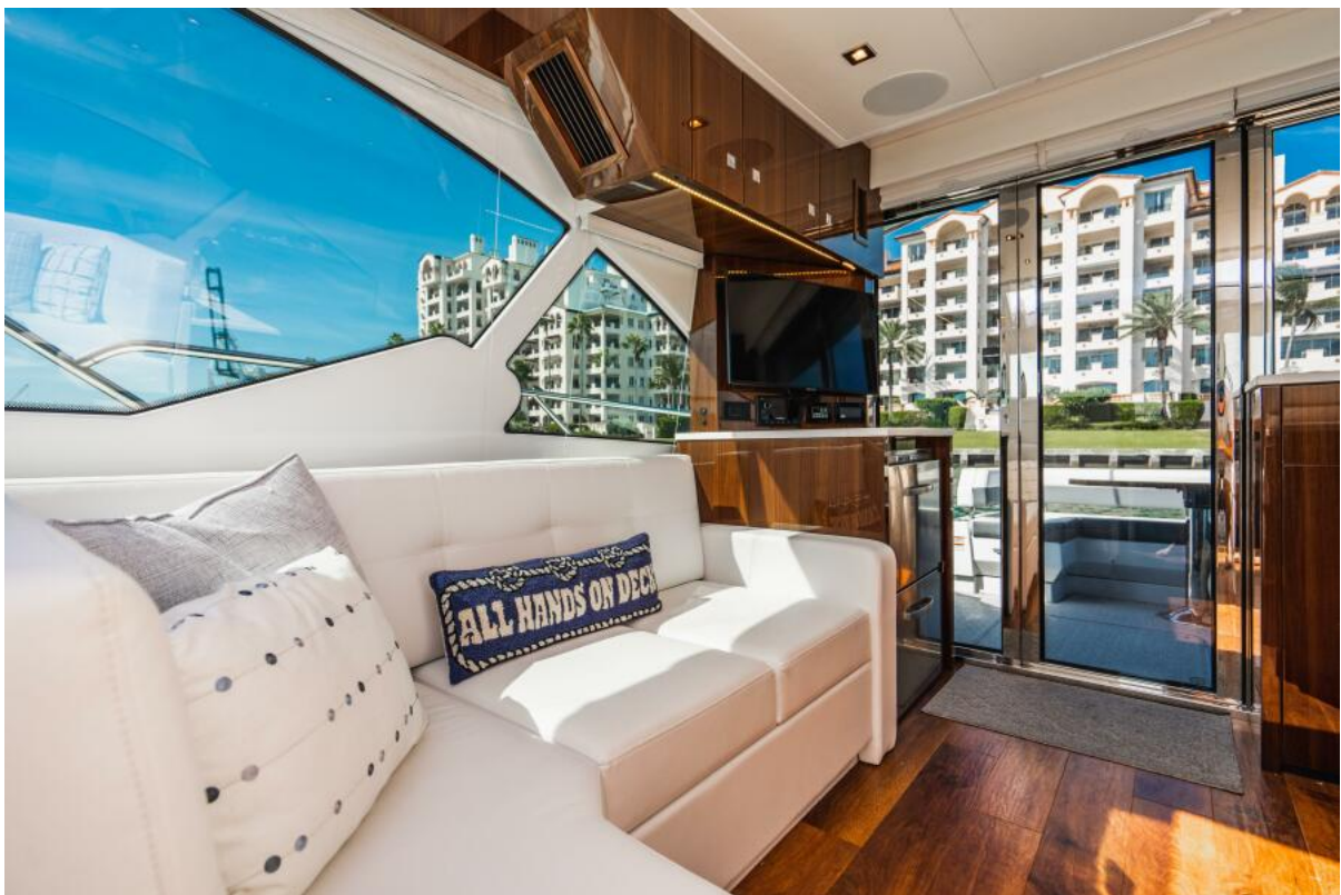
Main deck salon