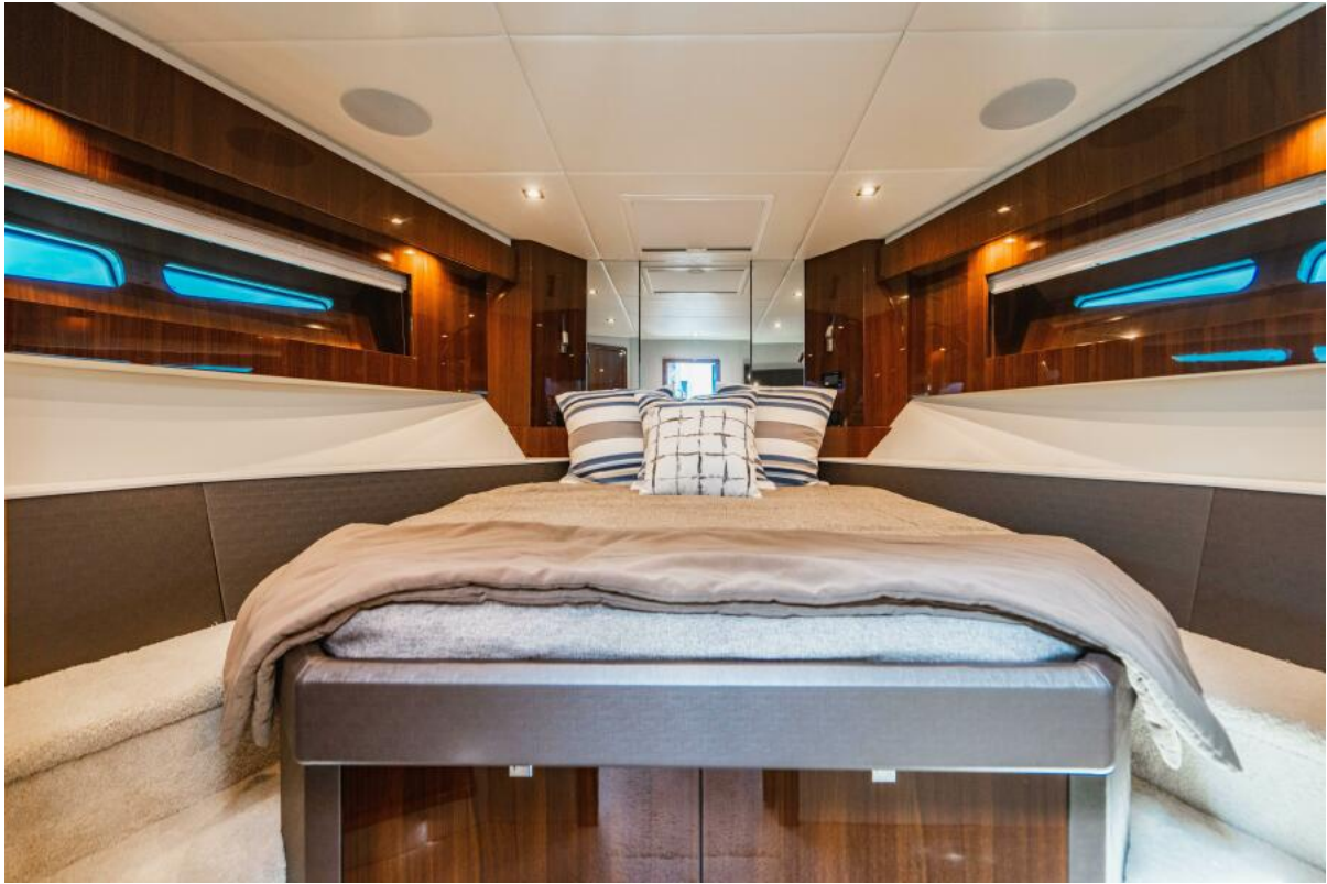
Lower deck VIP