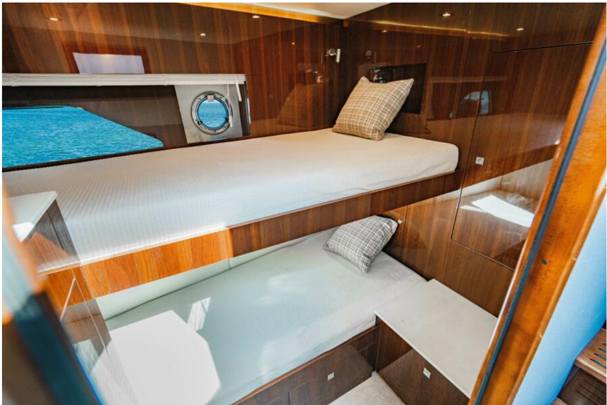
Lower deck guest