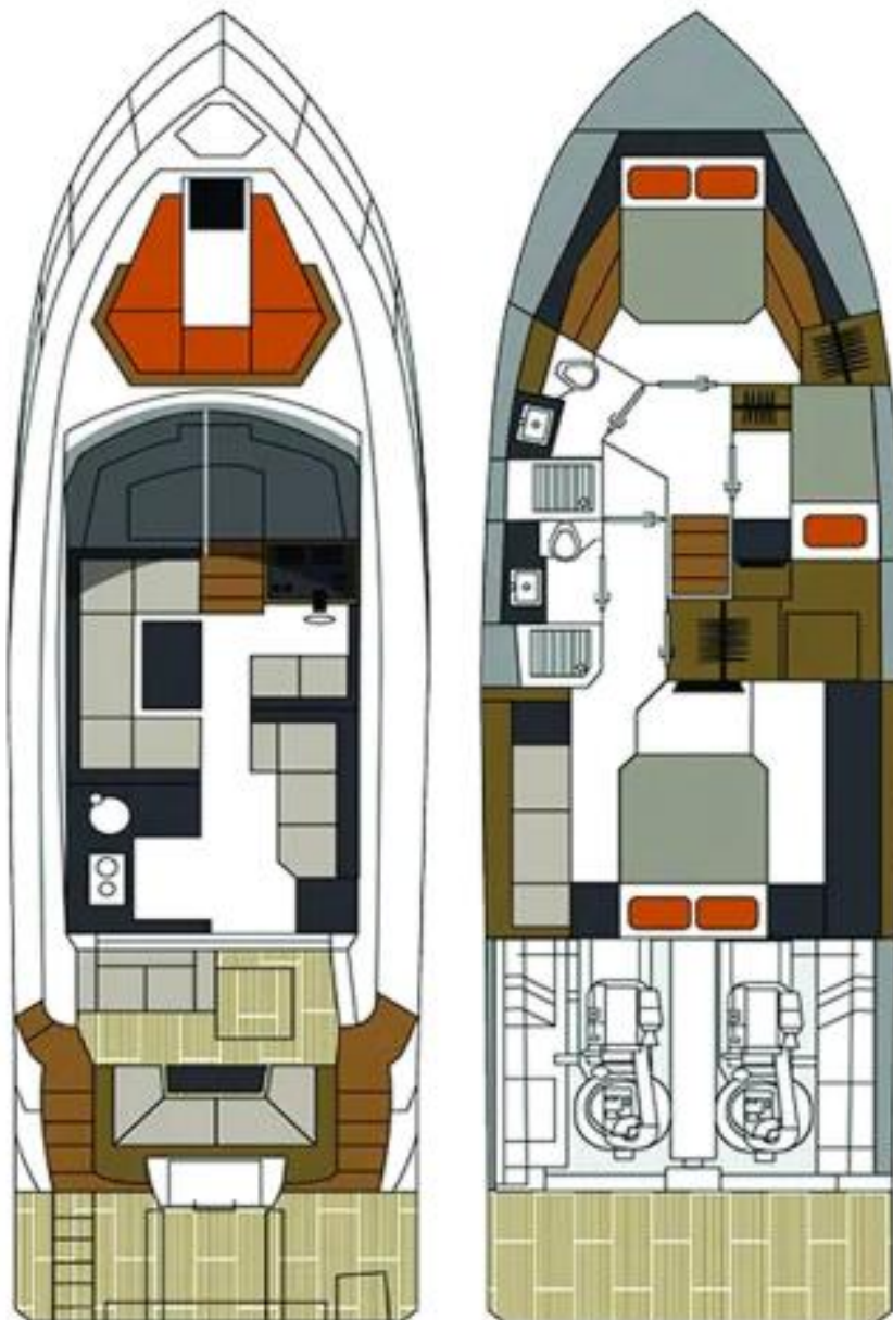
50' (15.06m) Cruisers 50 Cantius Express Cruiser, 2022