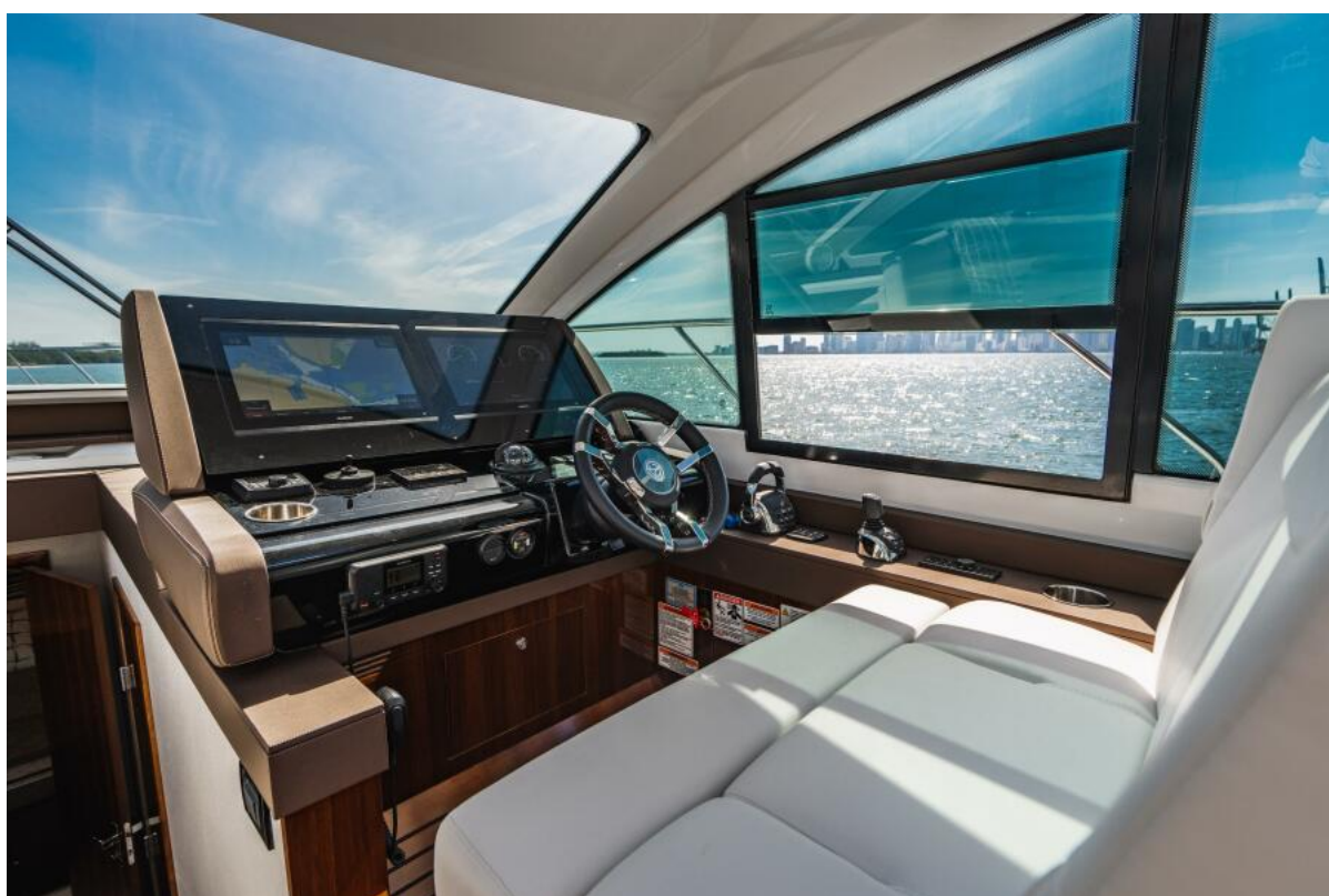
Main deck helm