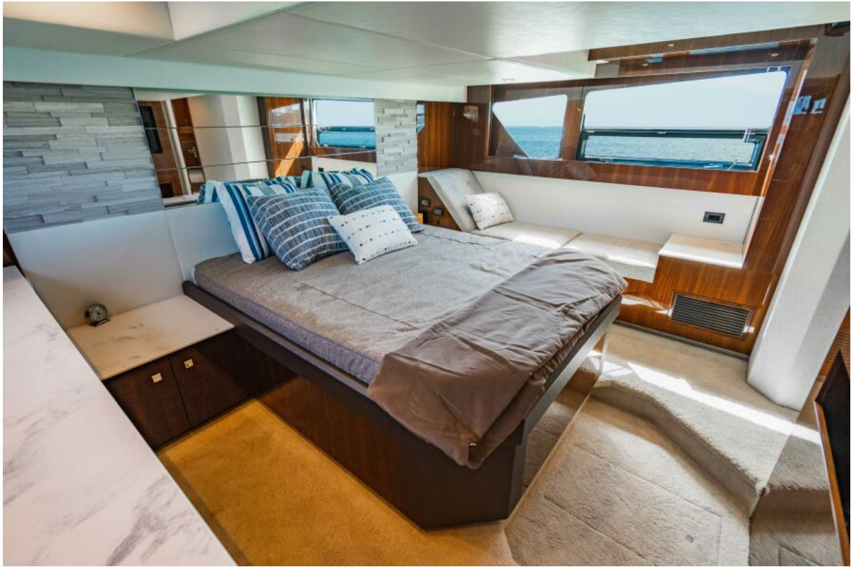
Lower deck master