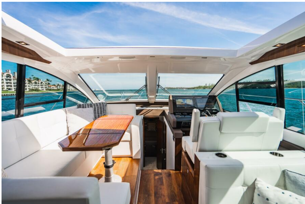
Main deck dining