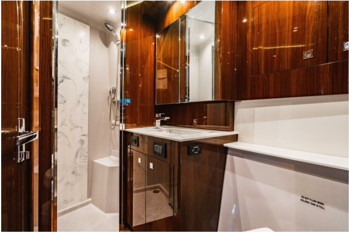
Lower deck guest bath