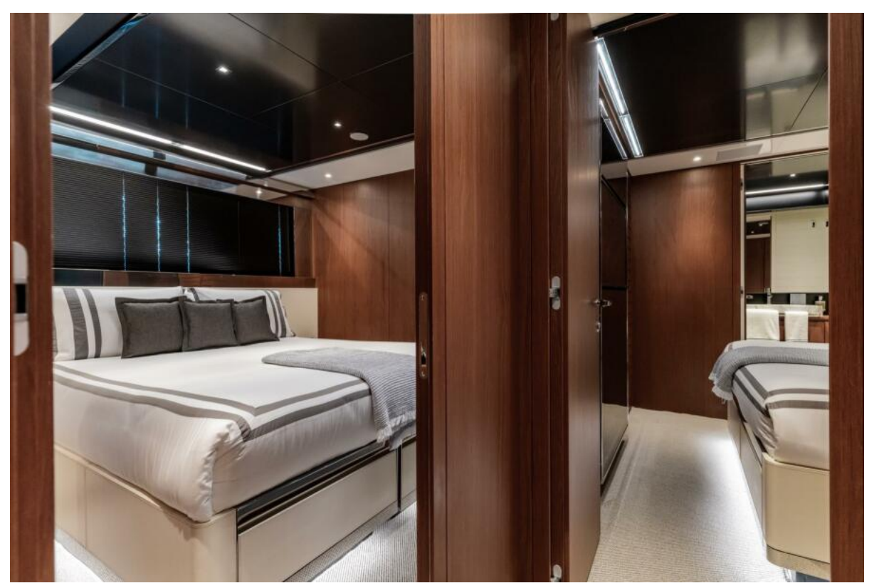
Lower Deck Guest Stateroom