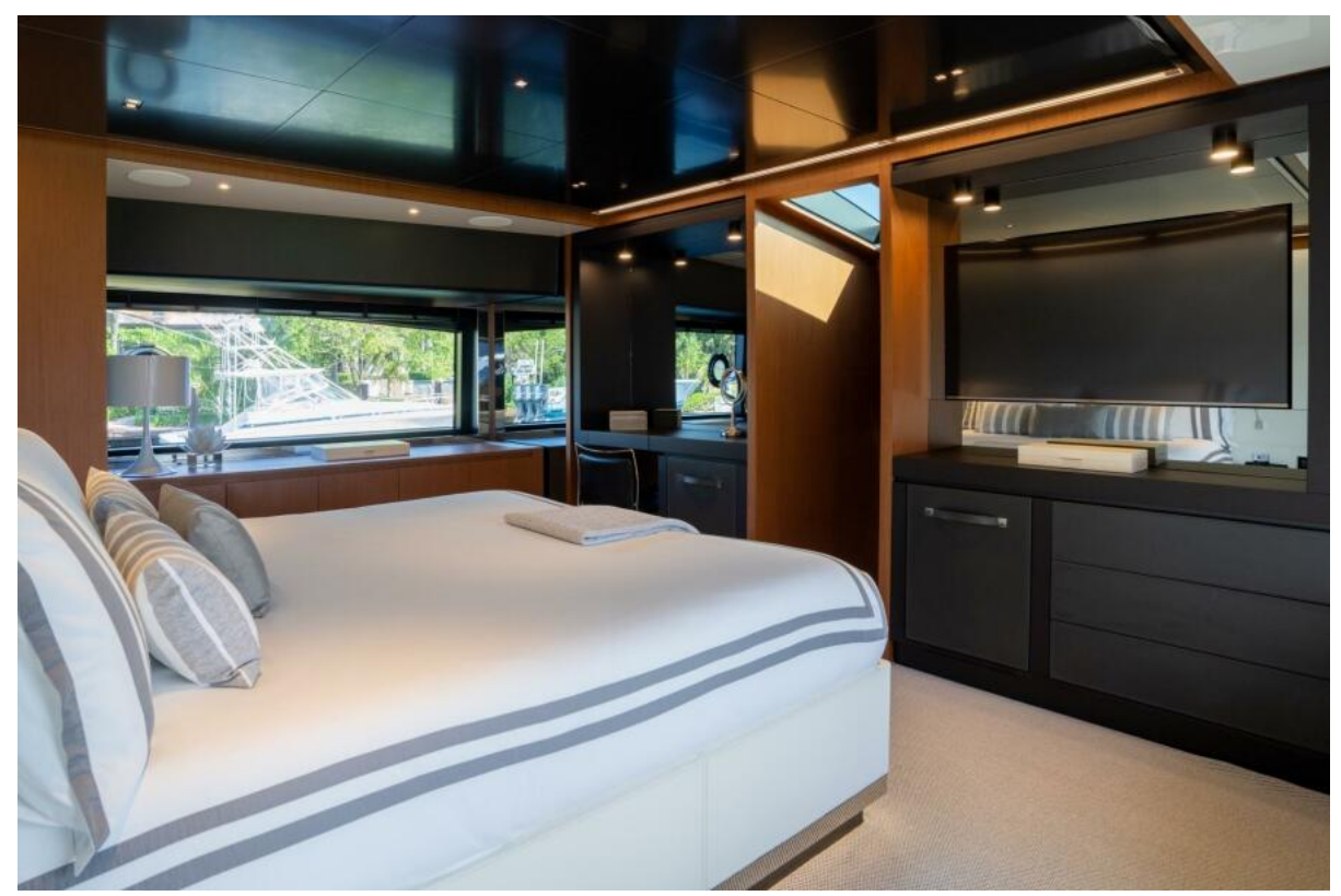
Main Deck Master Stateroom