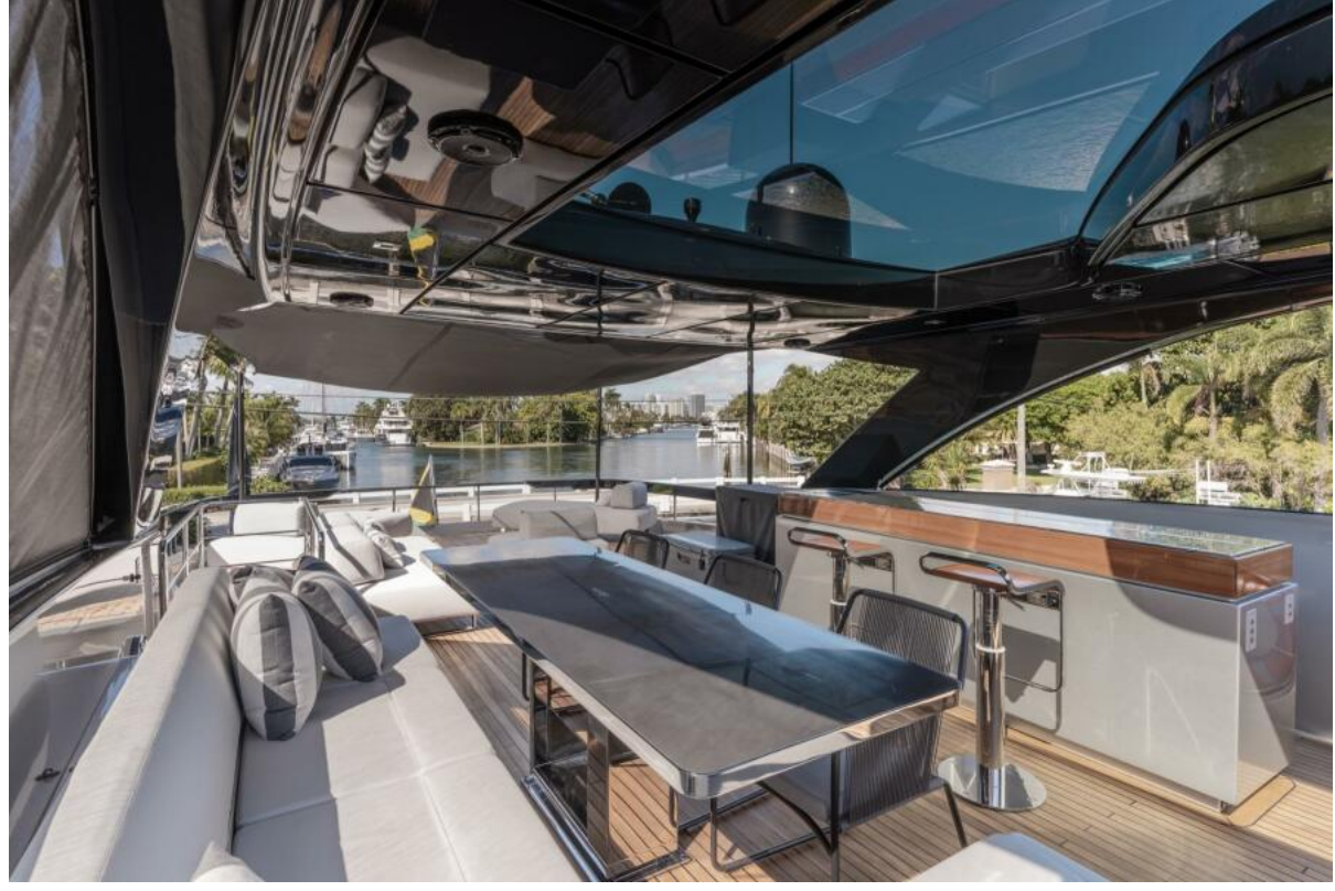
Flybridge Dining & Bar