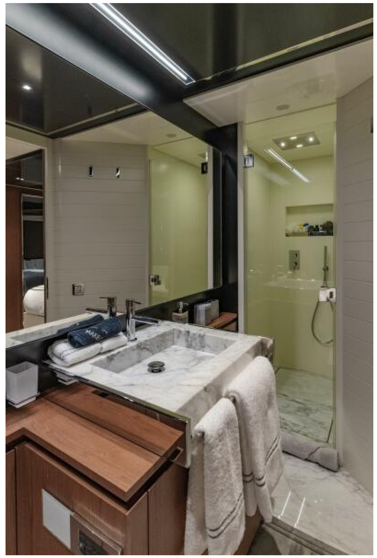
Lower Deck Guest Ensuite