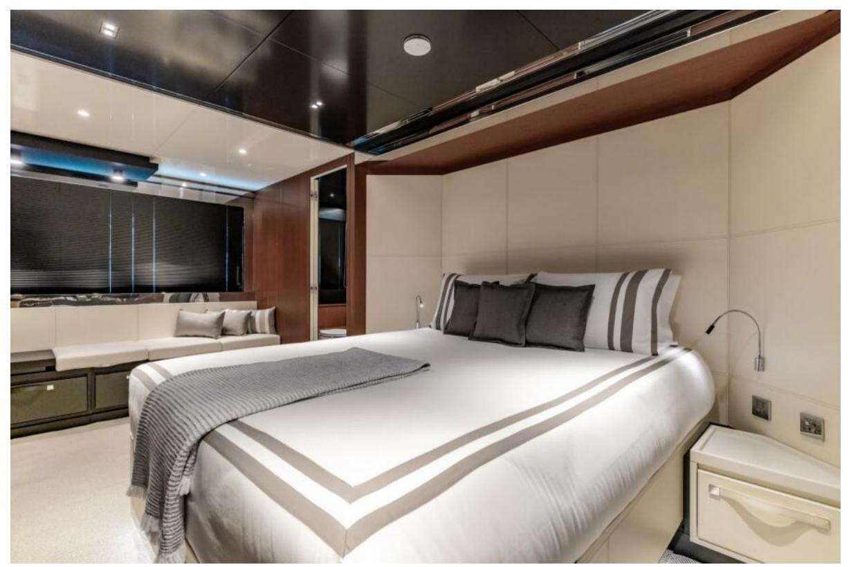
Lower Deck Guest Stateroom

Jeff Gonos jgonos@merlewood.com +1 (954) 290-6323