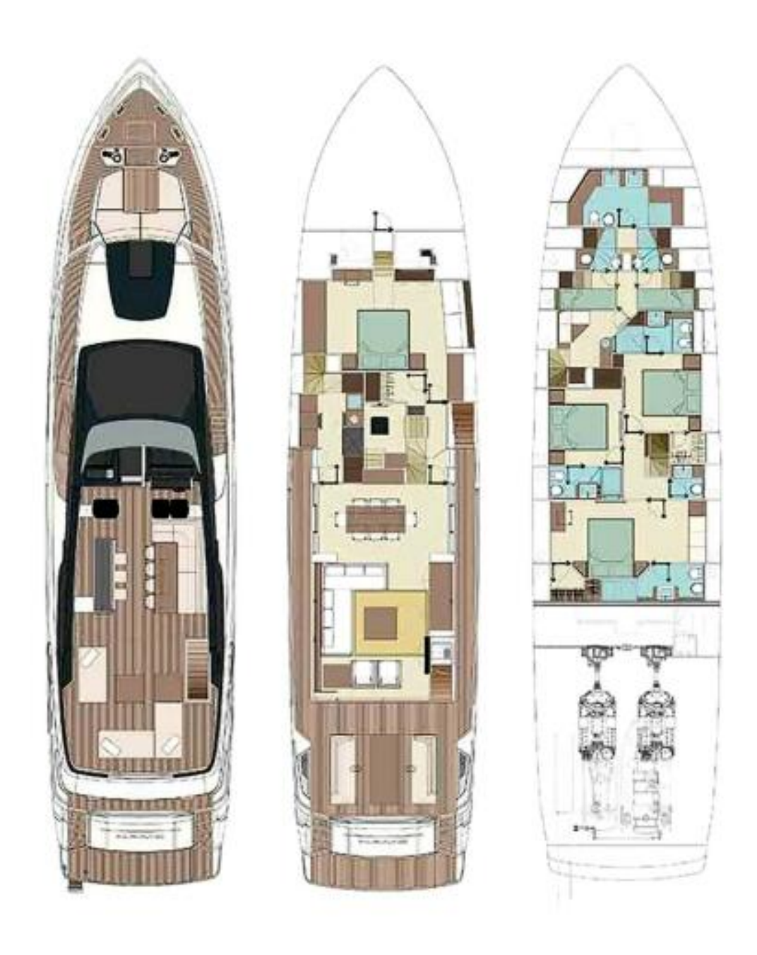
BEYOND BEYOND, 90' (28.50m) Riva Argo Motoryacht, 2019

Jeff Gonos jgonos@merlewood.com +1 (954) 290-6323