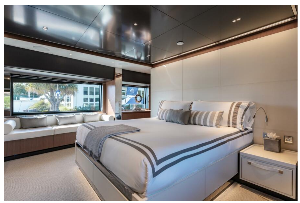
Main Deck Master Stateroom