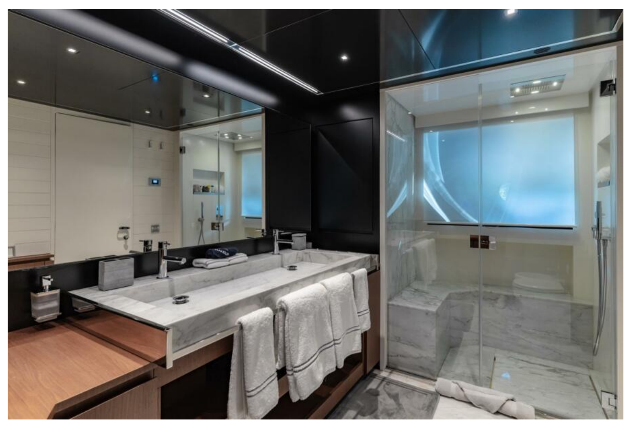
Main Deck Master Ensuite