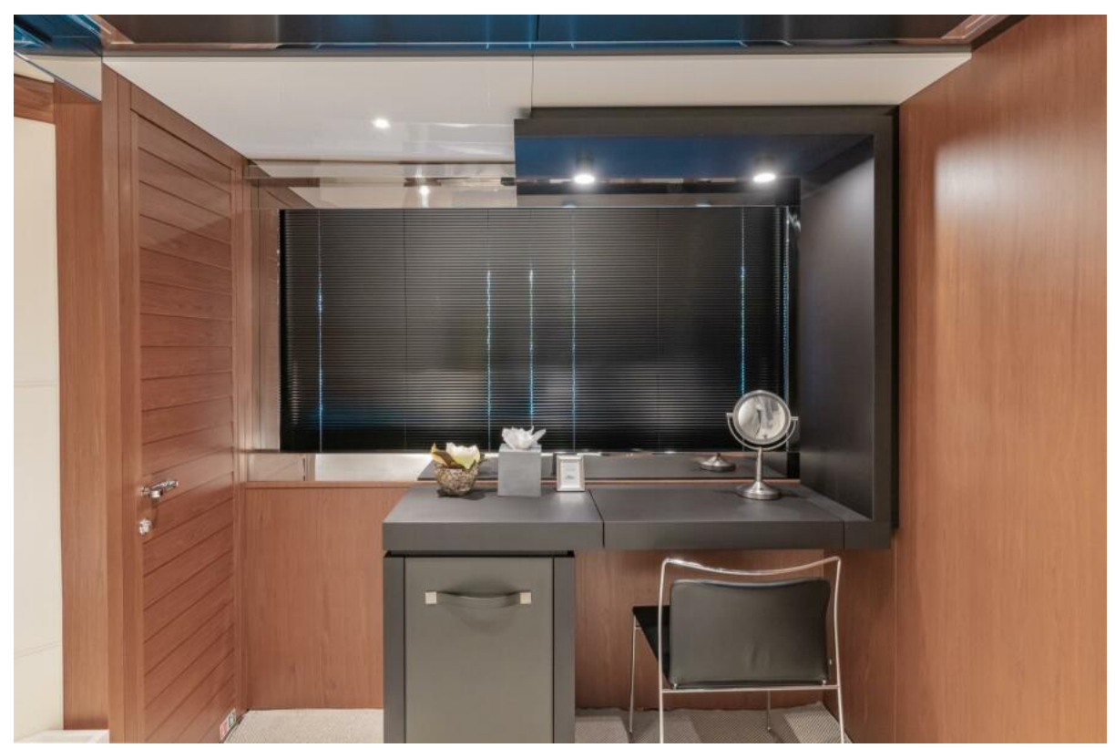
Lower Deck Guest Stateroom Study