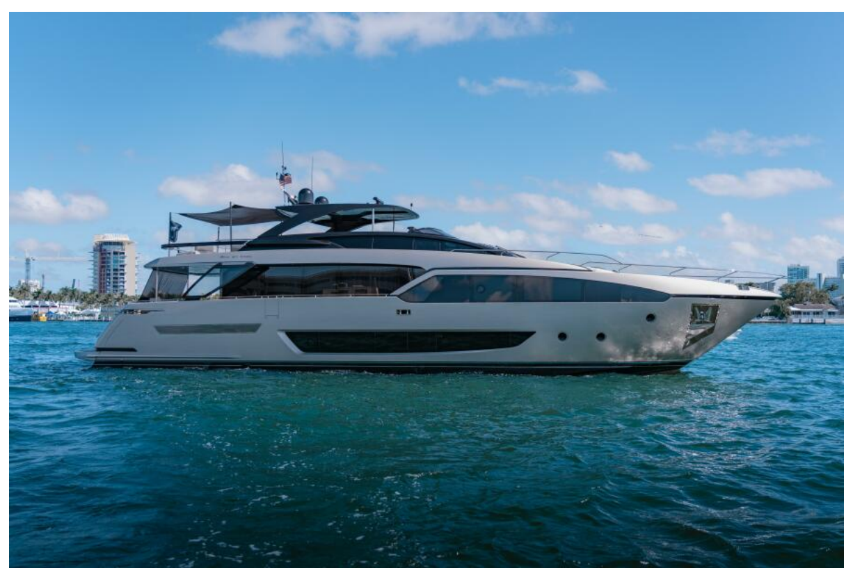
90' BEYOND BEYOND Riva, 2019