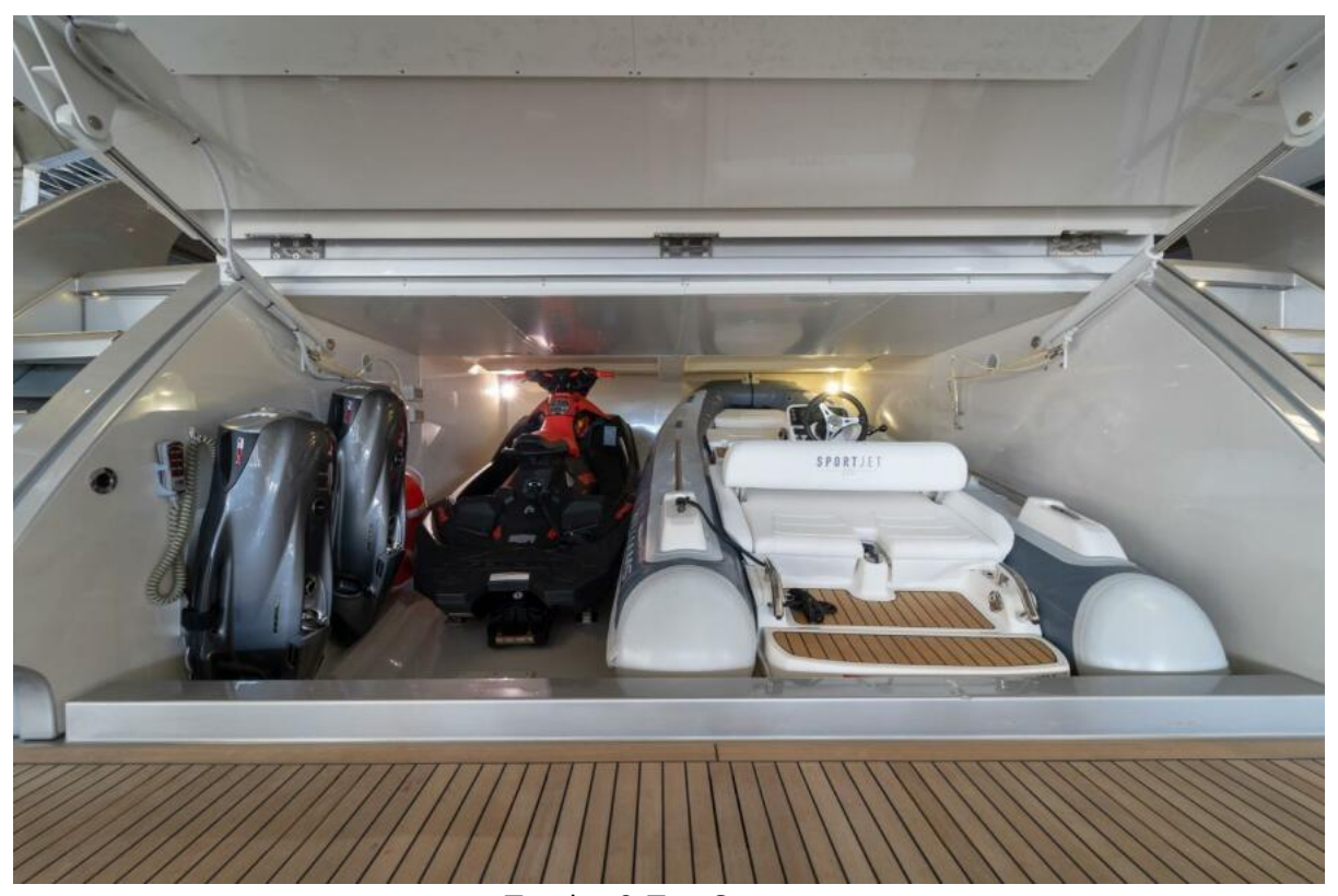
Tender & Toy Garage