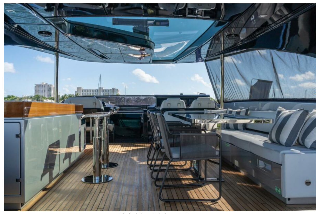
Flybridge Dining & Bar