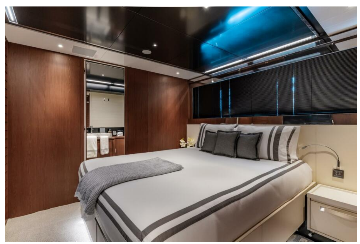
Lower Deck Guest Stateroom