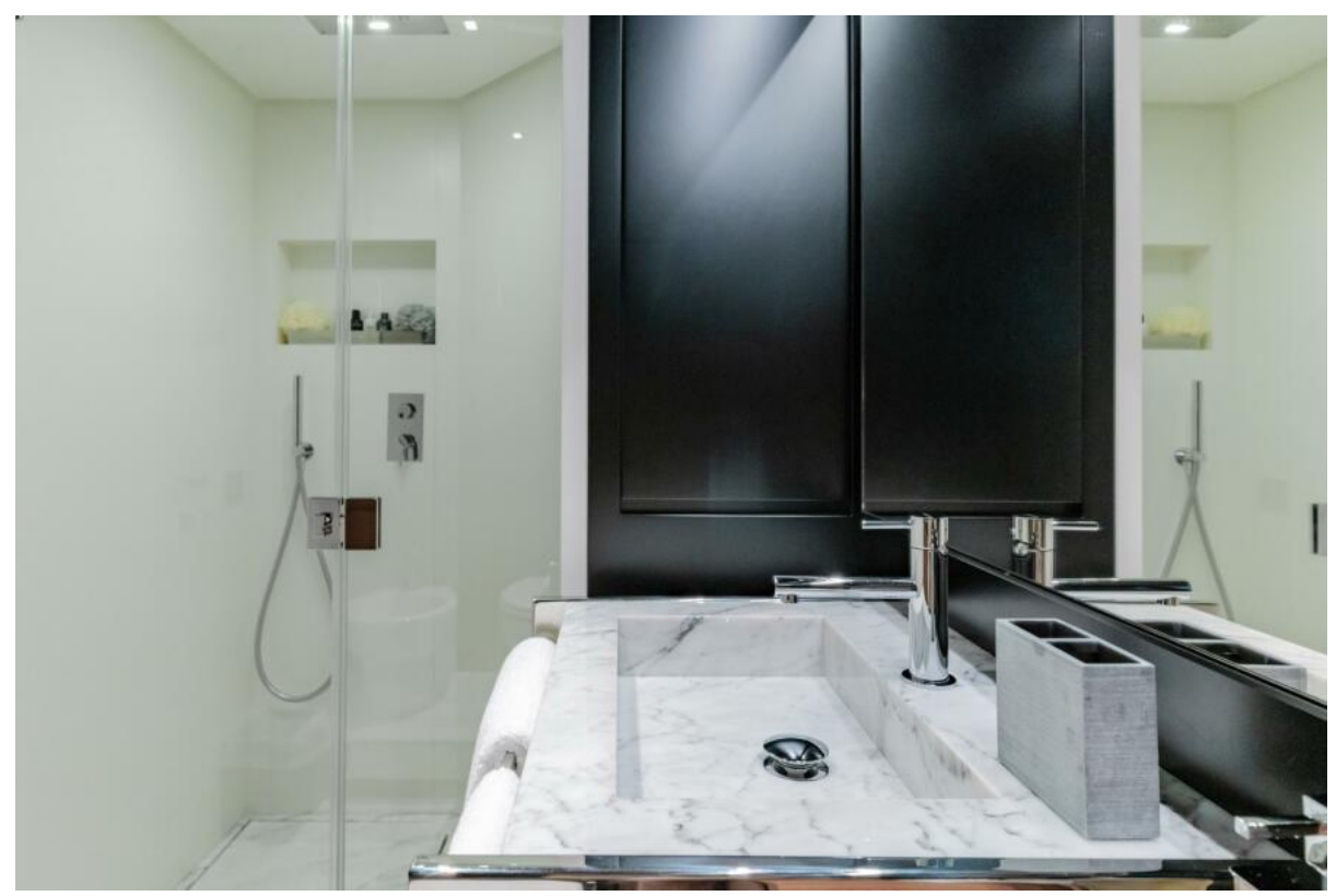
Lower Deck Guest Ensuite