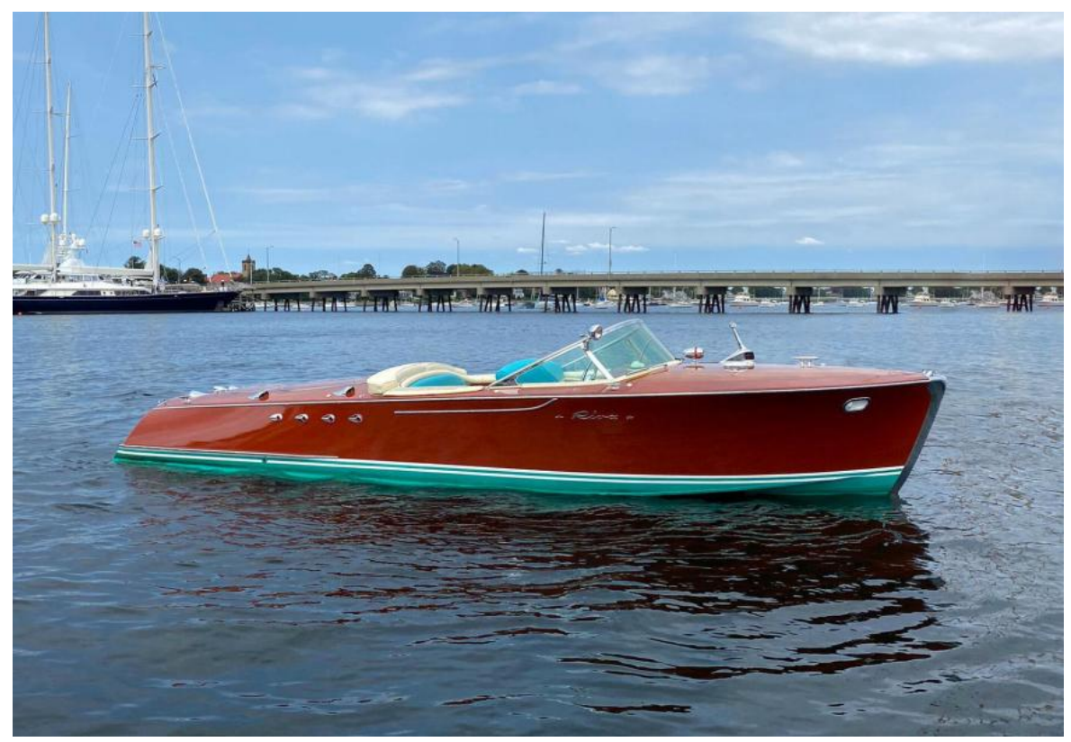
BERKELEY SQUARE 26'