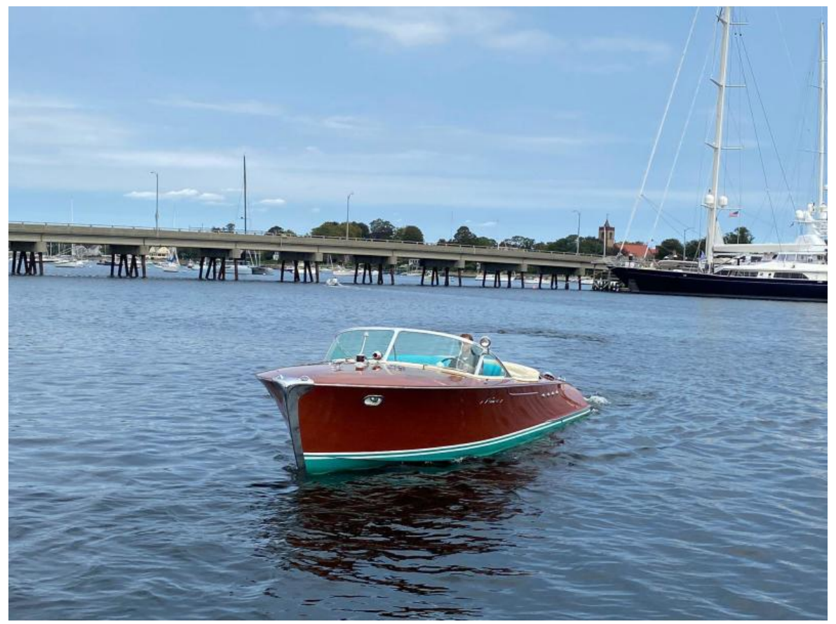
BERKELEY SQUARE 26'