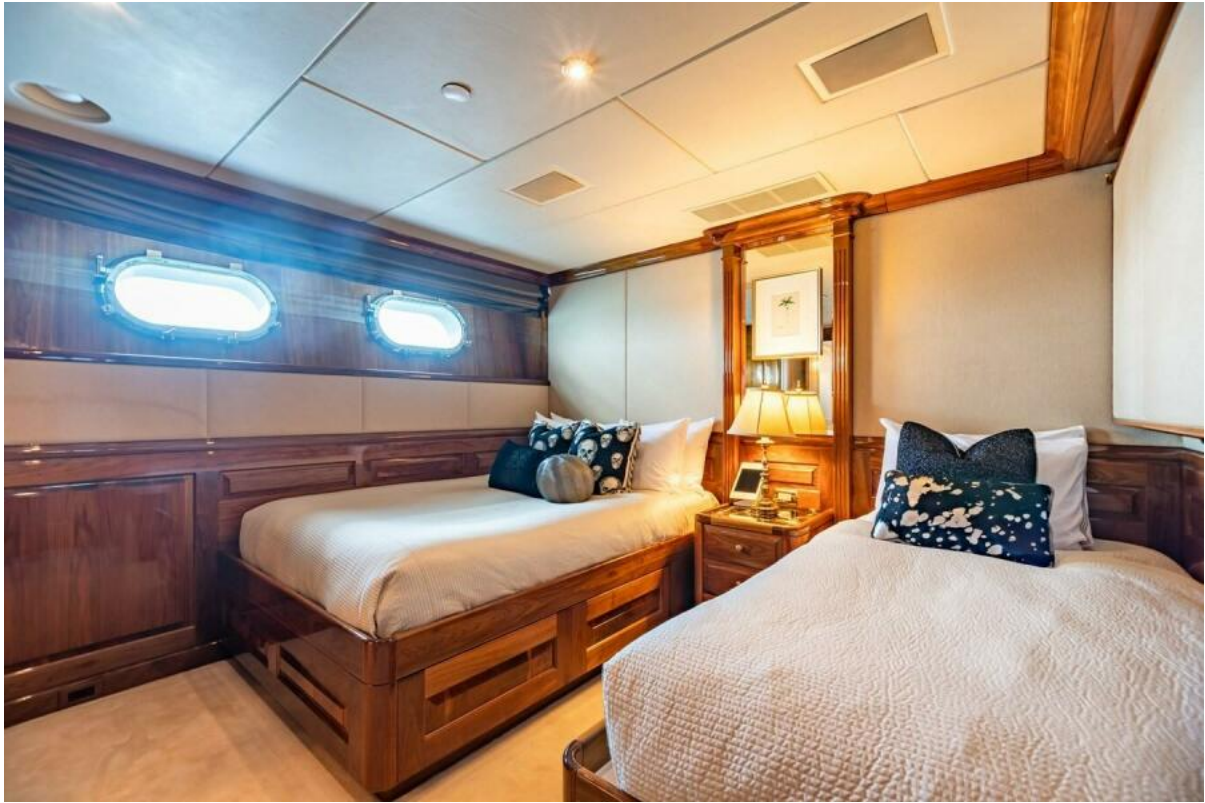
Lower Deck Guest Stateroom