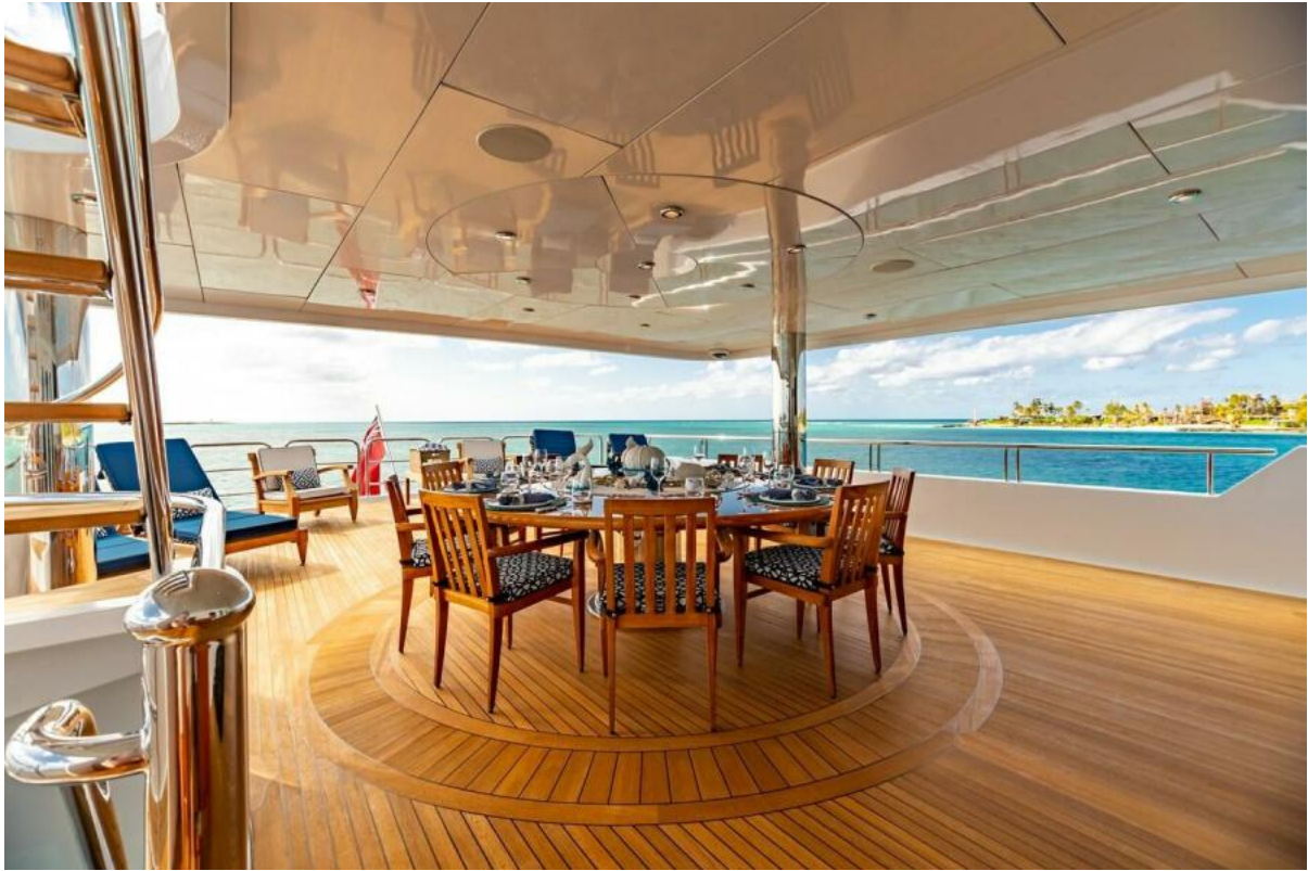
Bridge Deck Aft Dining