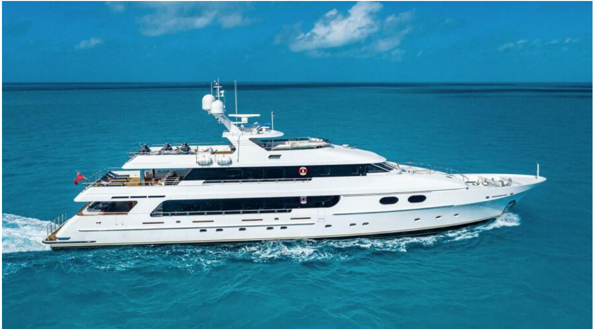
157' (47.85m) AMORE Christensen, 2005/2022