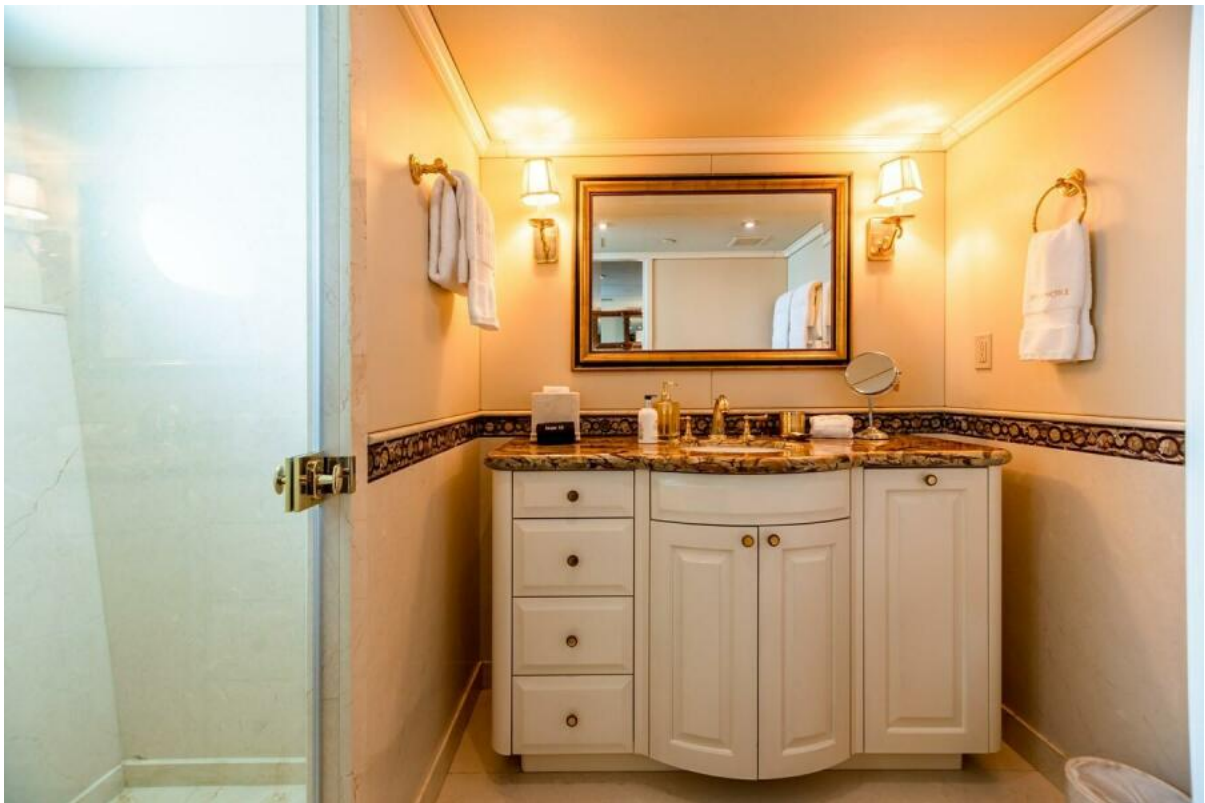
Lower Deck Guest Ensuite