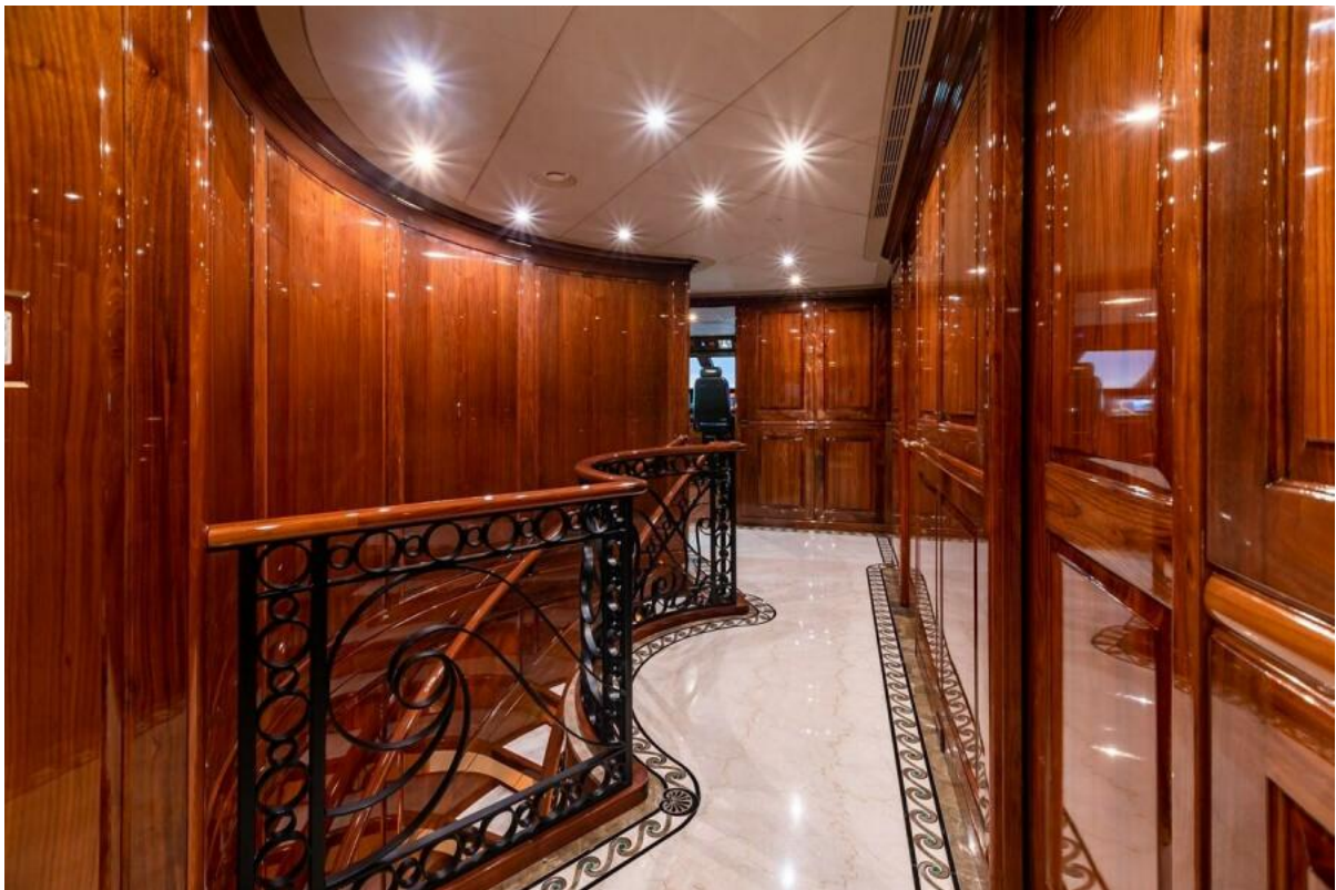
Bridge Deck Foyer