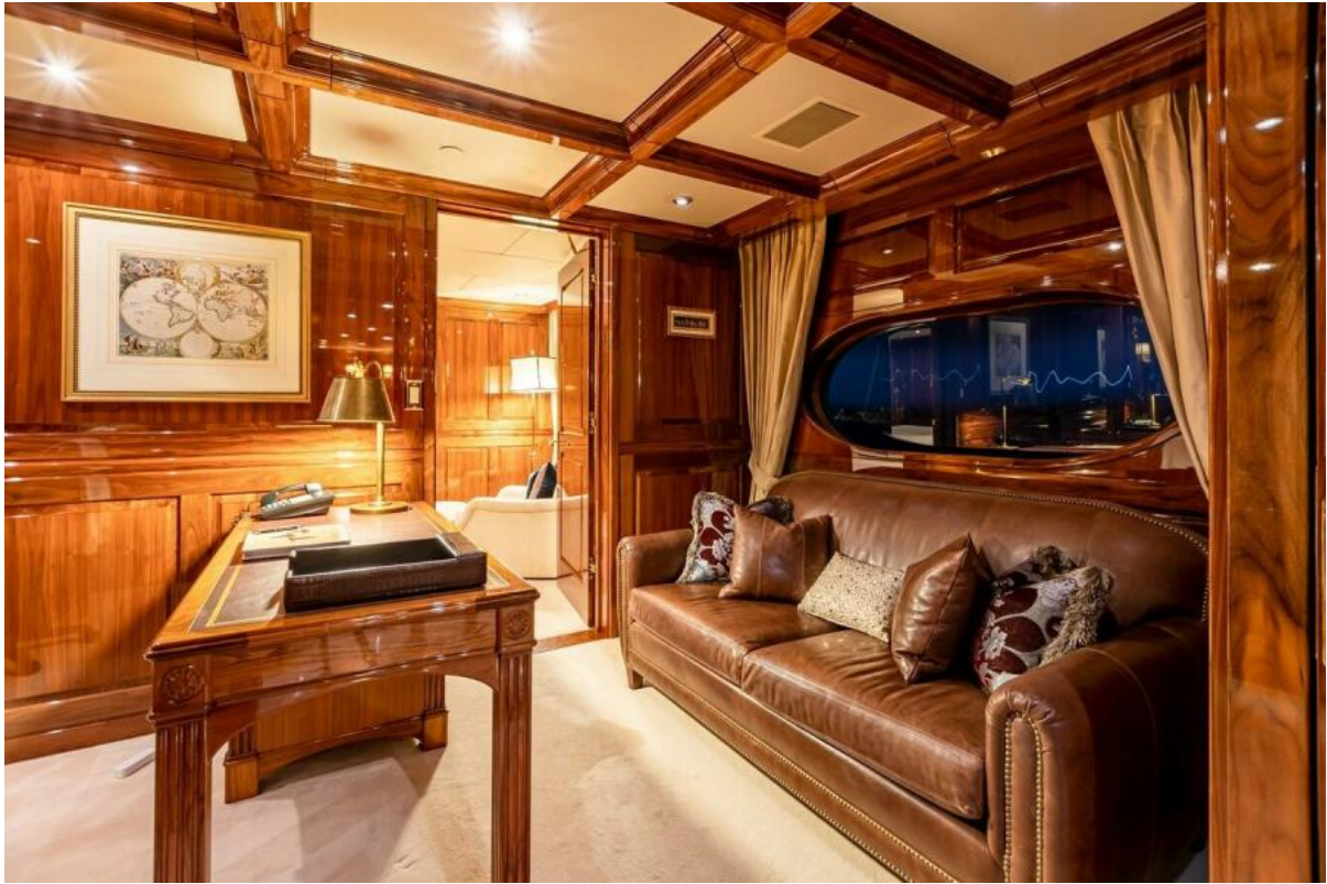
Main Deck Master Stateroom Study