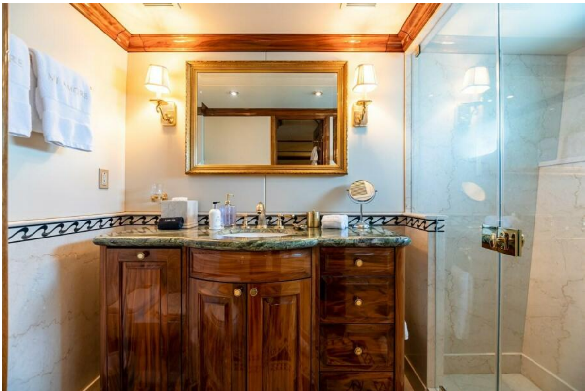
Lower Deck Guest Ensuite