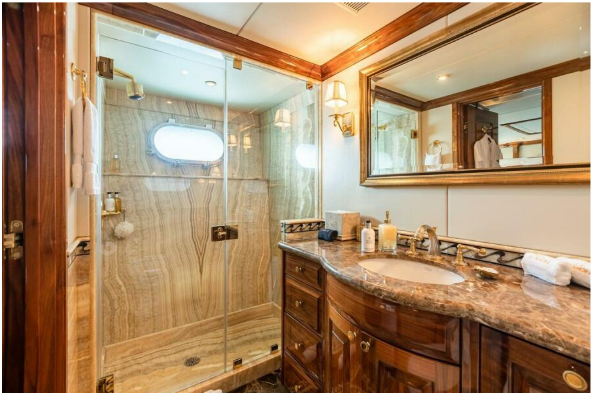
Lower Deck Guest Ensuite