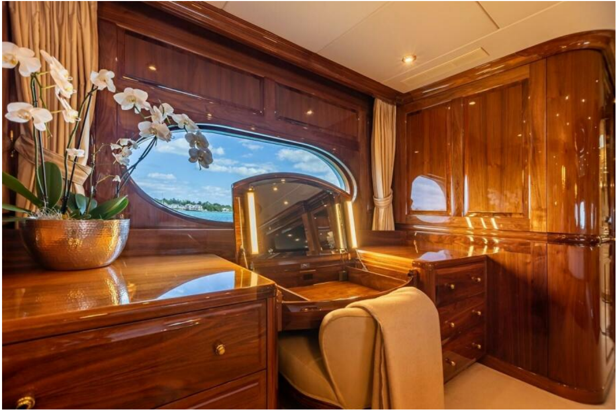
Main Deck Master Stateroom