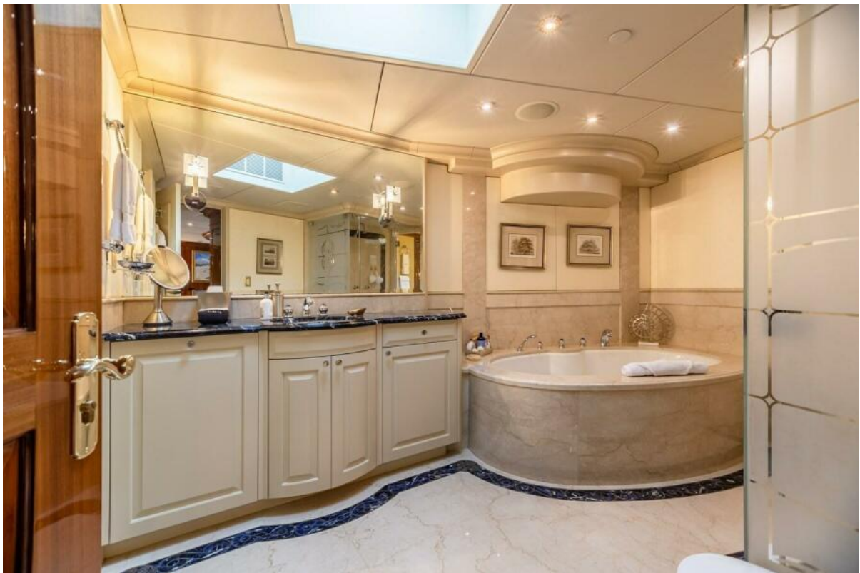
Main Deck Master Ensuite