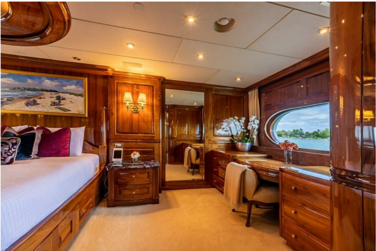
Main Deck Master Stateroom