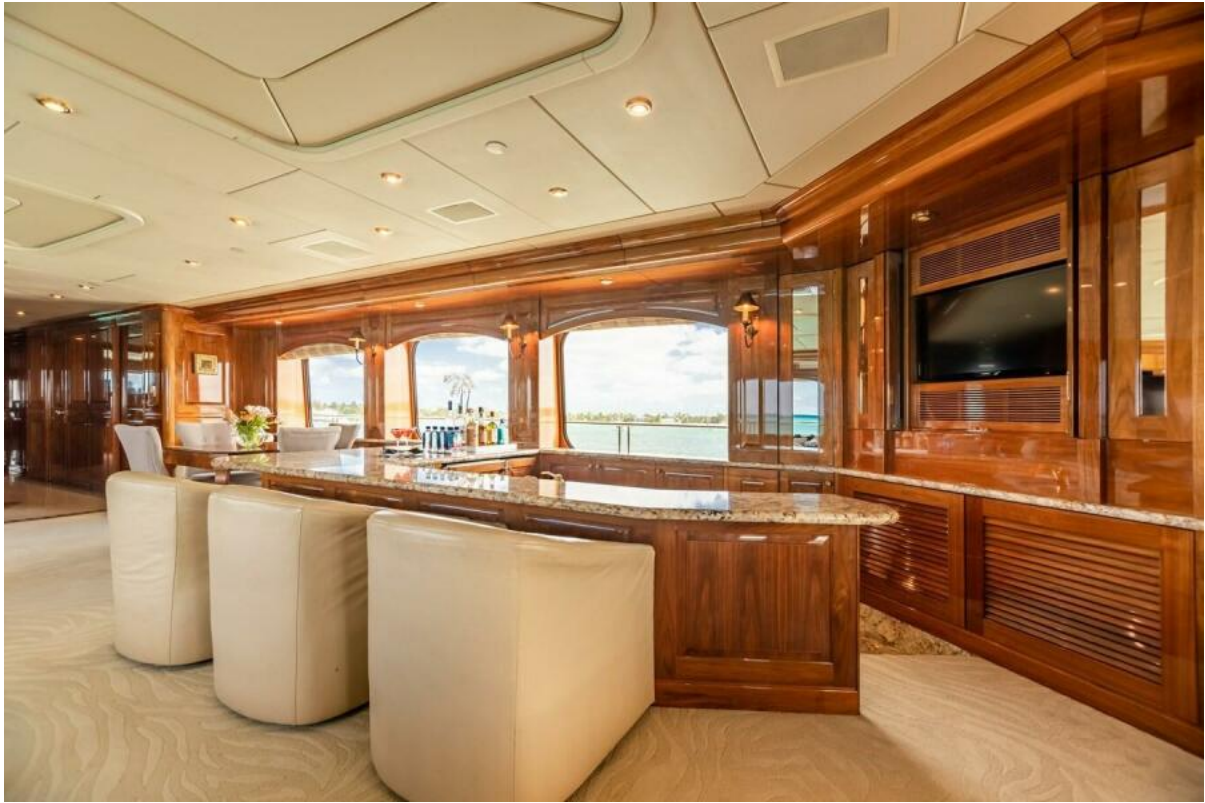
Bridge Deck Skylounge Bar