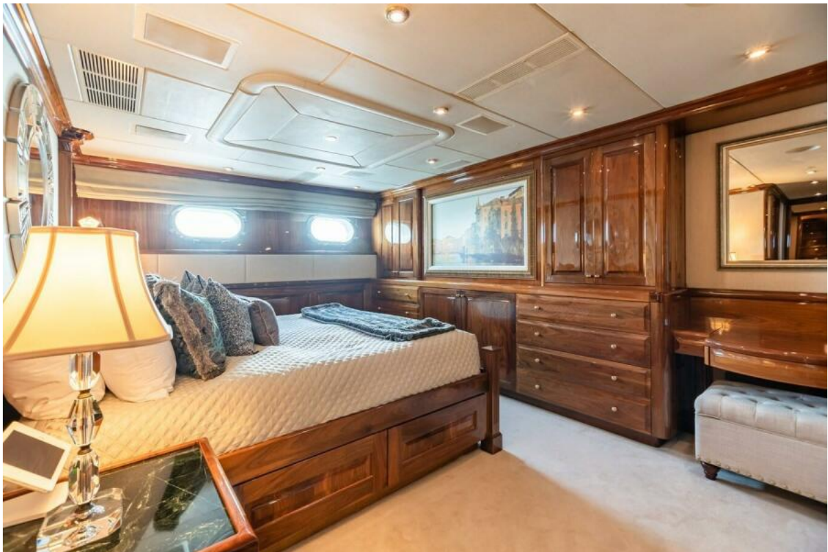
Lower Deck VIP Stateroom