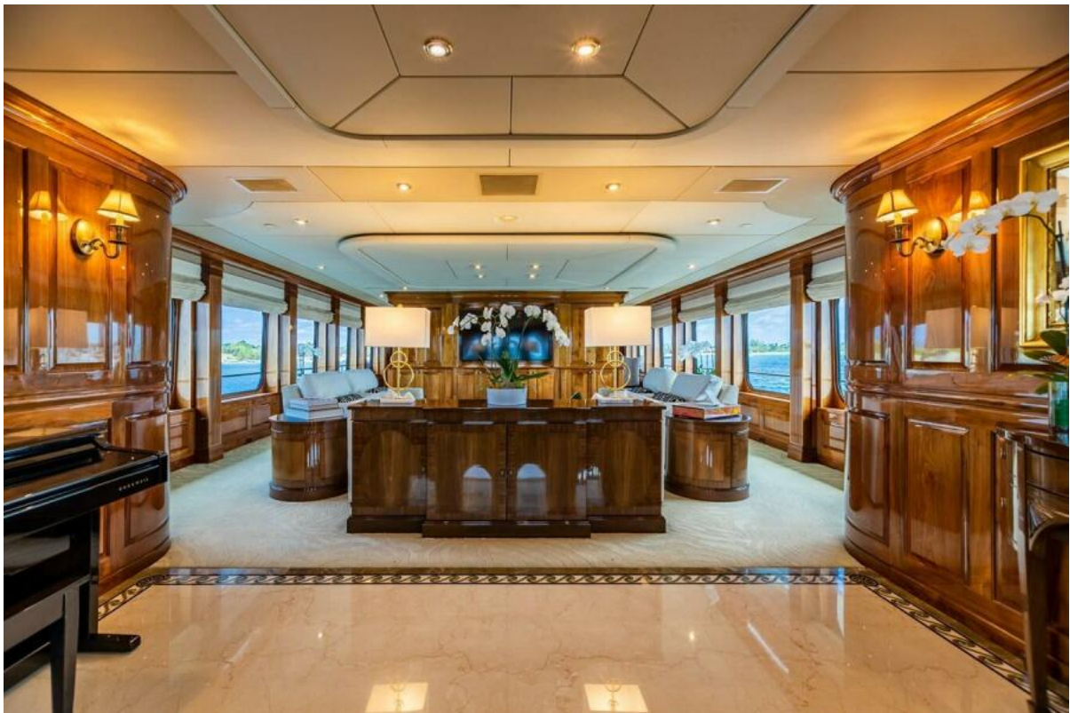
Main Deck Entrance