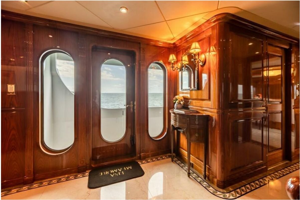
Main Deck Foyer