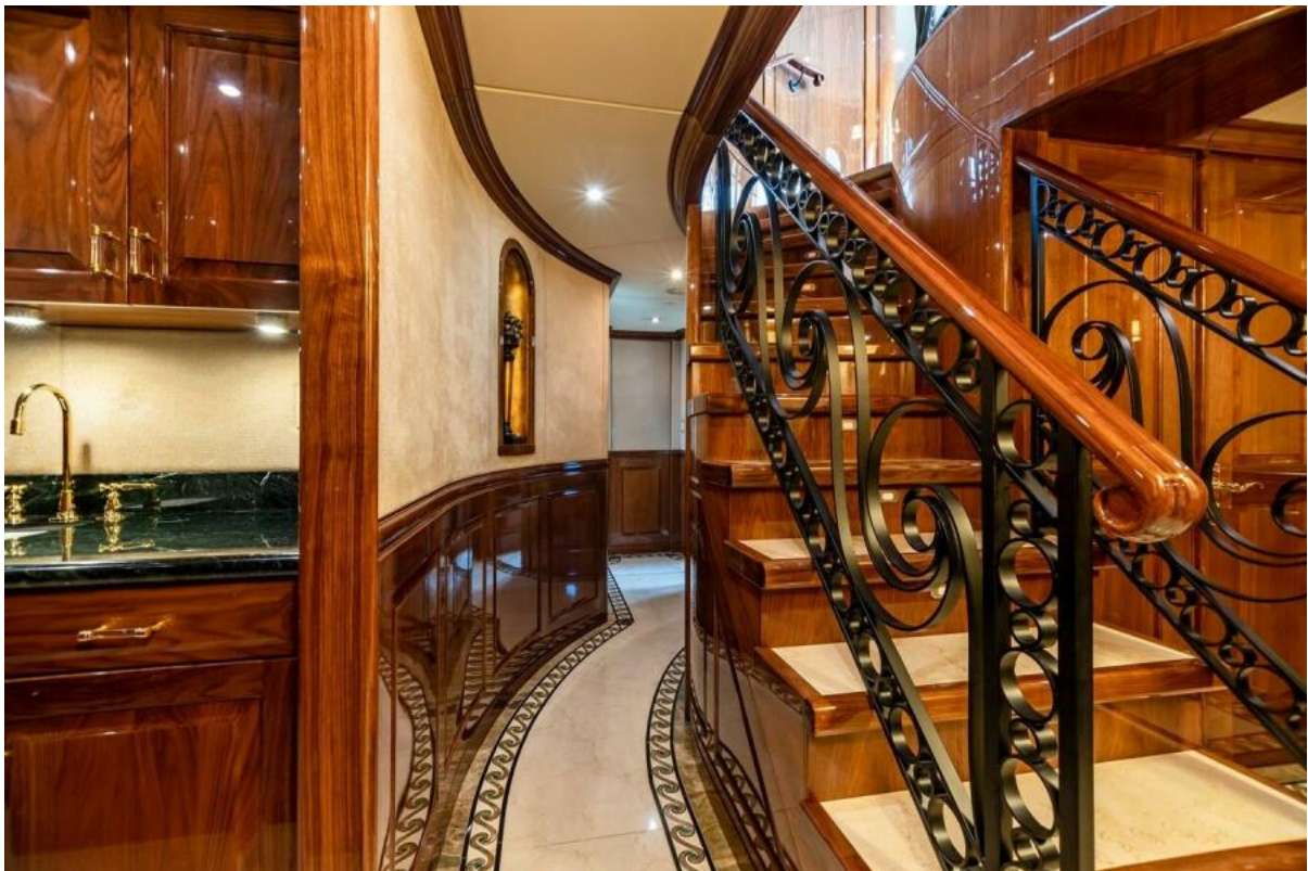
Lower Deck Foyer