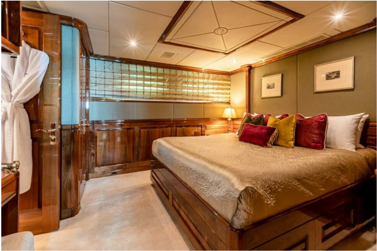
Lower Deck Guest Stateroom