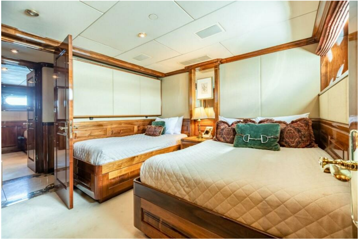
Lower Deck Guest Stateroom