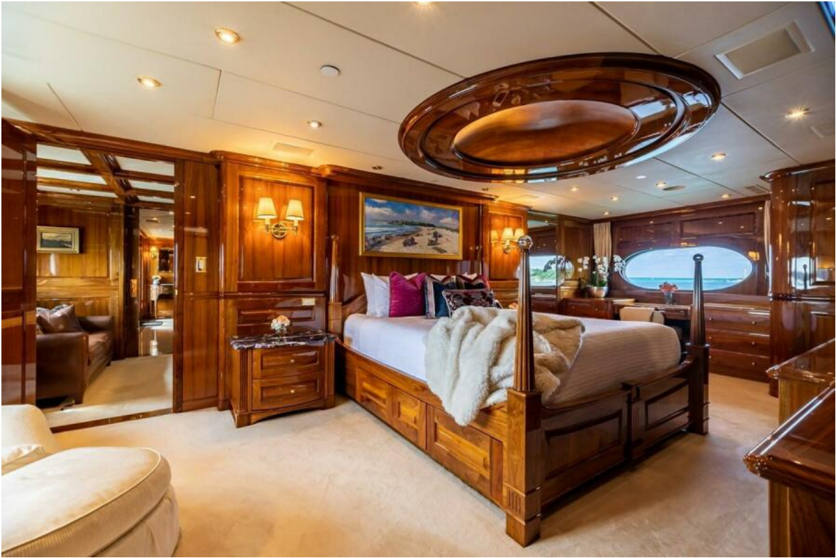
Main Deck Master Stateroom