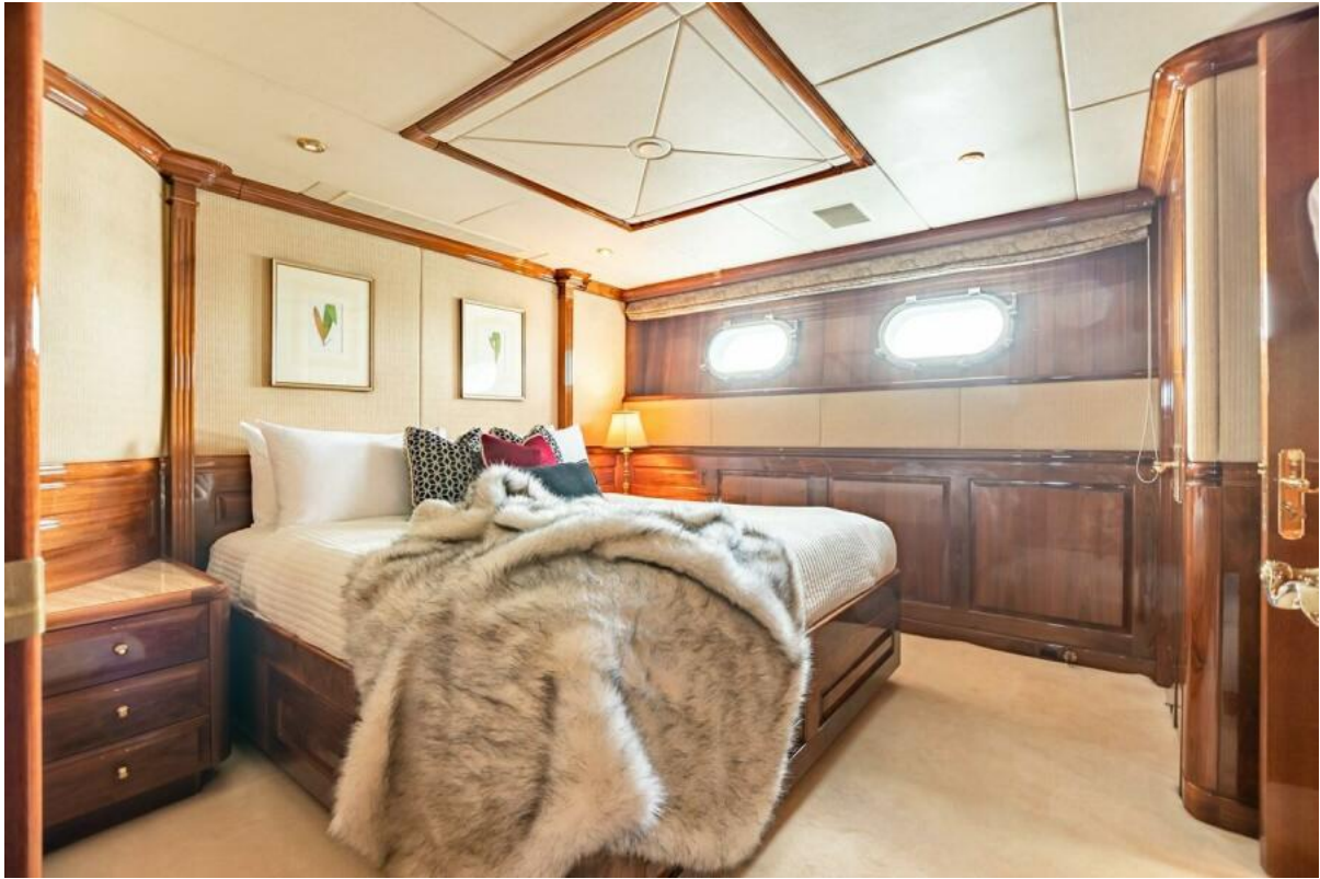
Lower Deck Guest Stateroom