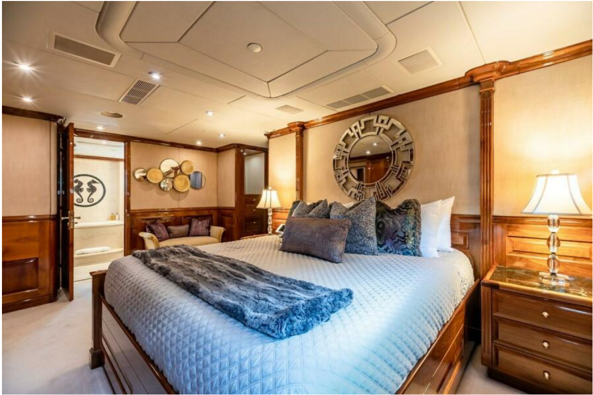
Lower Deck VIP Stateroom