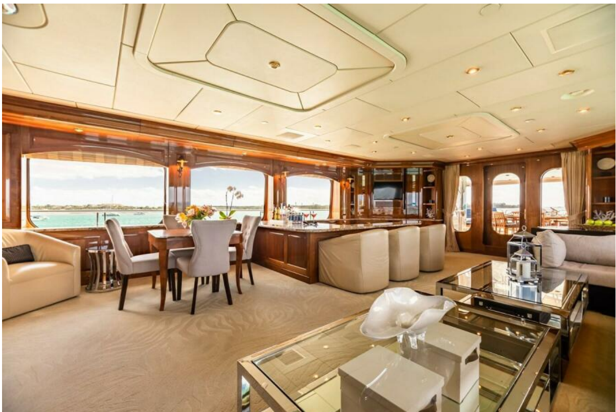
Bridge Deck Skylounge Dining & Bar