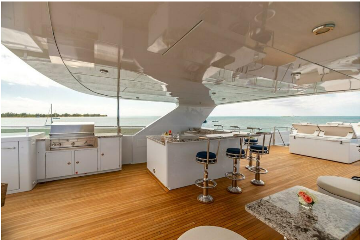
Sun Deck Bar