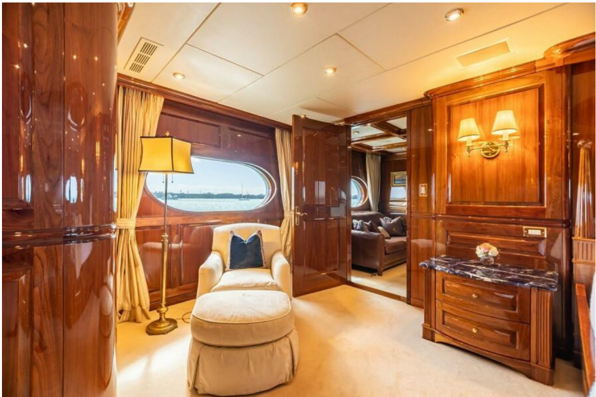
Main Deck Master Stateroom