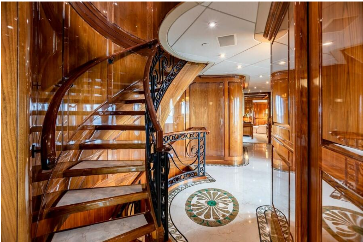
Main Deck Foyer