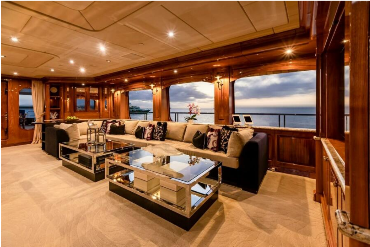
Bridge Deck Skylounge