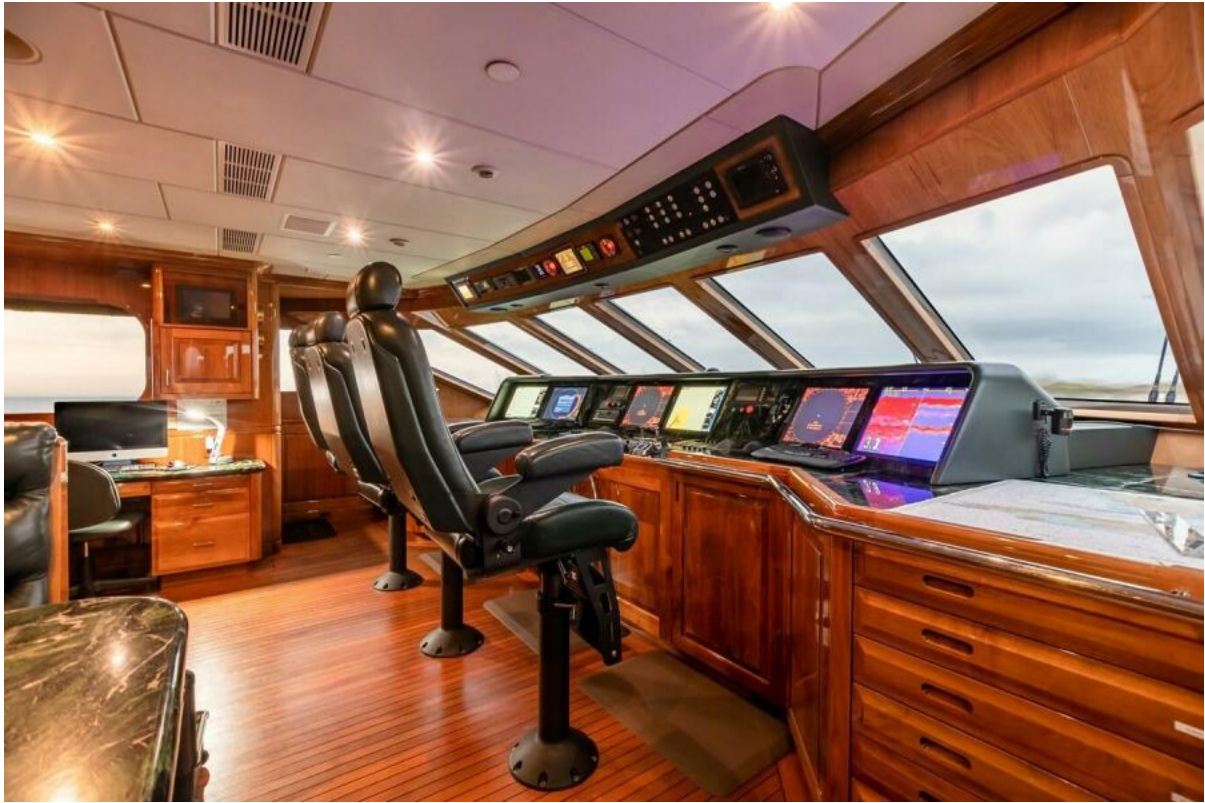
Bridge Deck Pilothouse