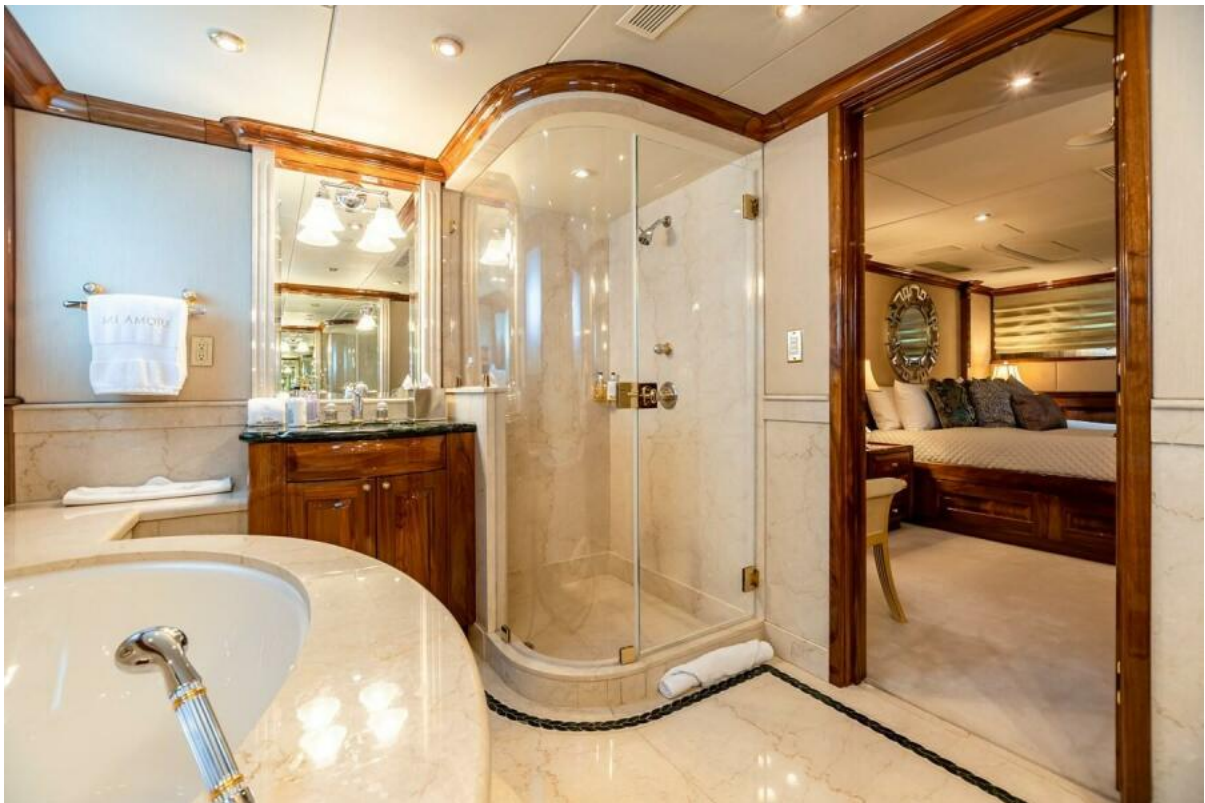
Lower Deck VIP Ensuite