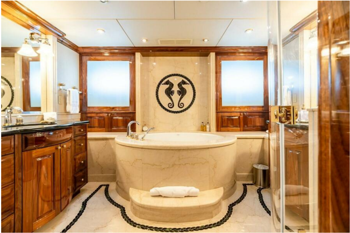
Lower Deck VIP Ensuite