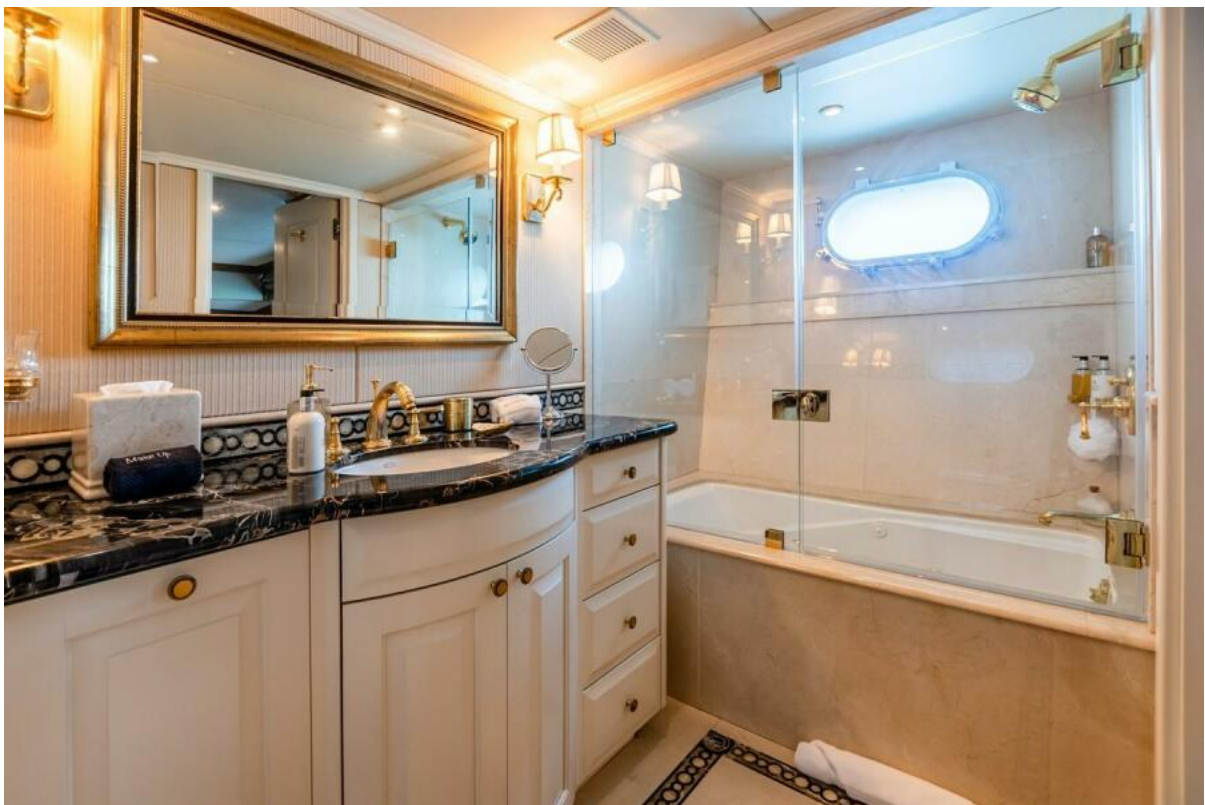
Lower Deck Guest Ensuite