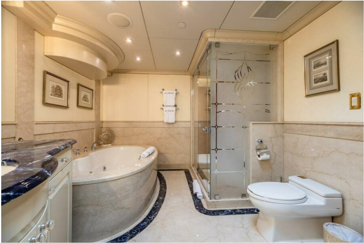
Main Deck Master Ensuite