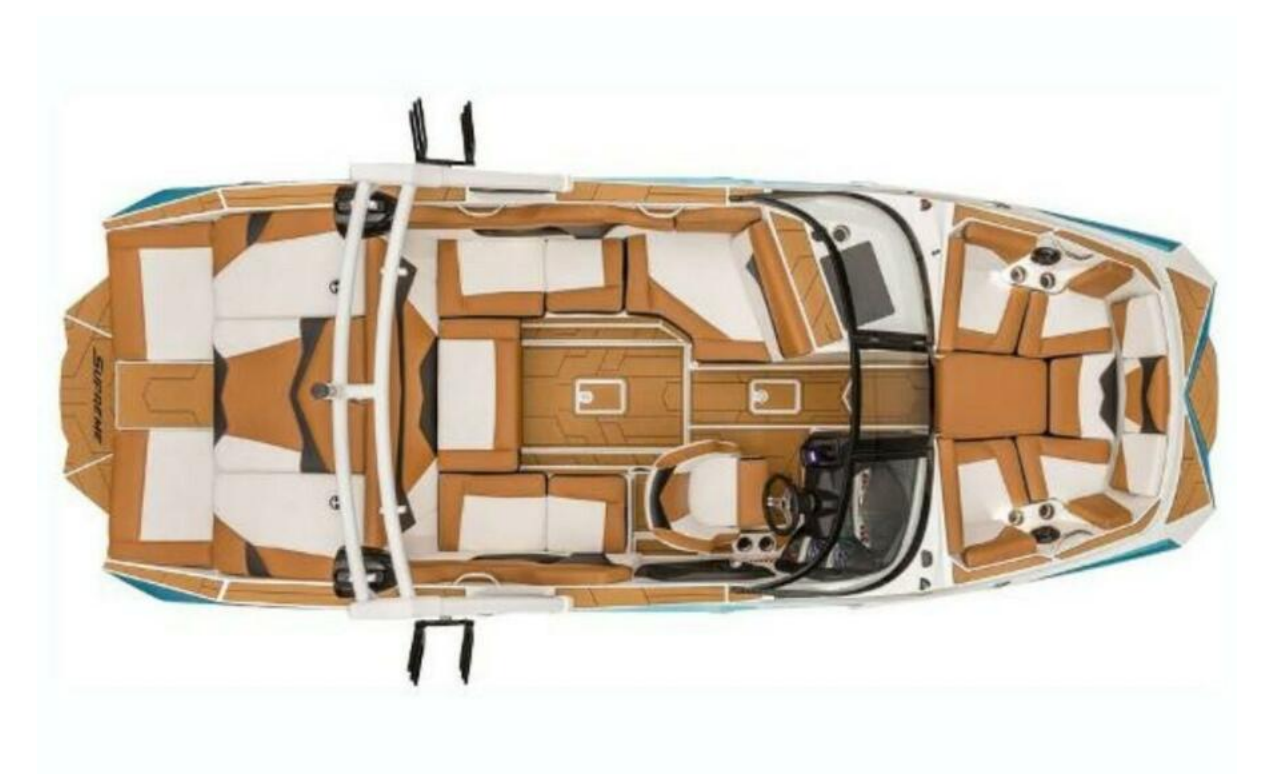
Manufacturer Provided Layout