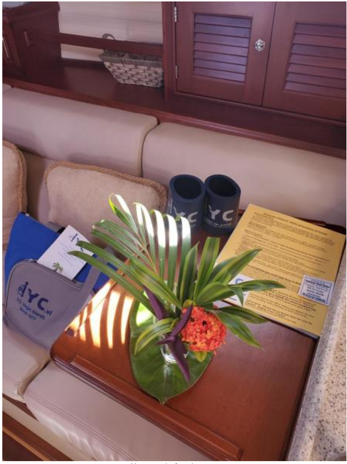
Skye ready for charter