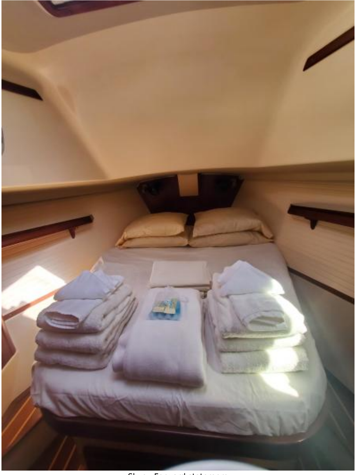
Skye Forward stateroom