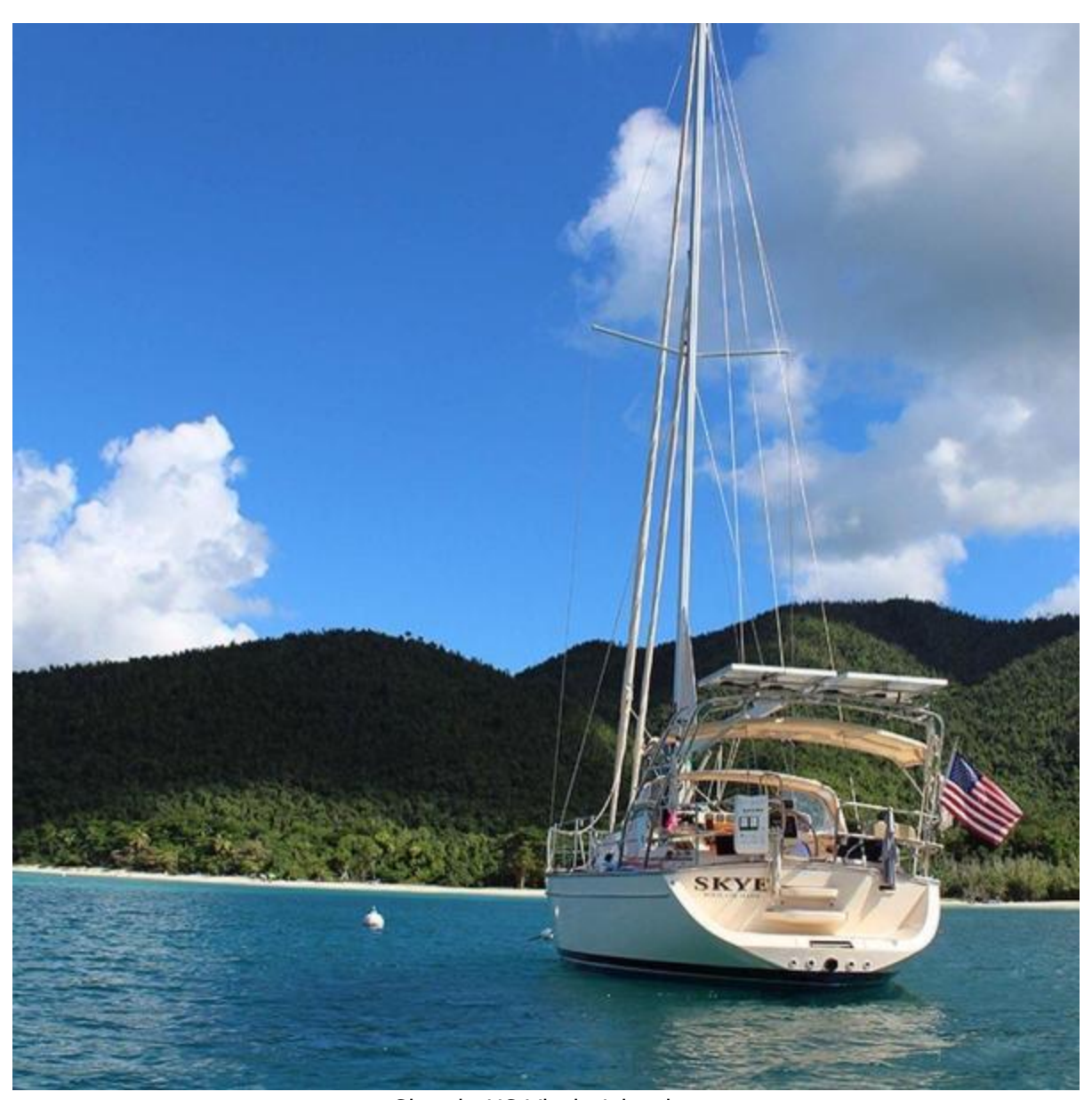
Skye in US Virgin Islands