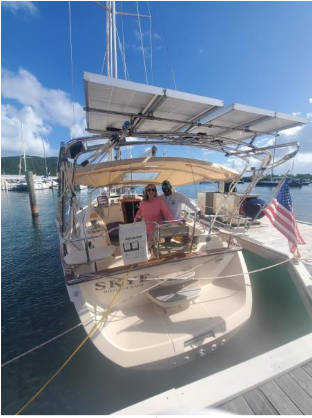
Skye Happy Charter guests