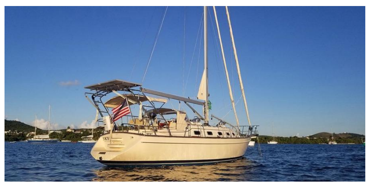
Skye exterior starboard