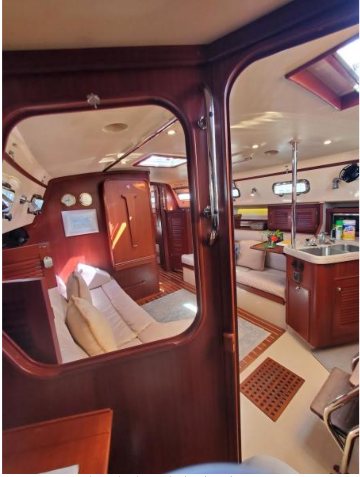
Skye main salon Facing bow from aft statreoom