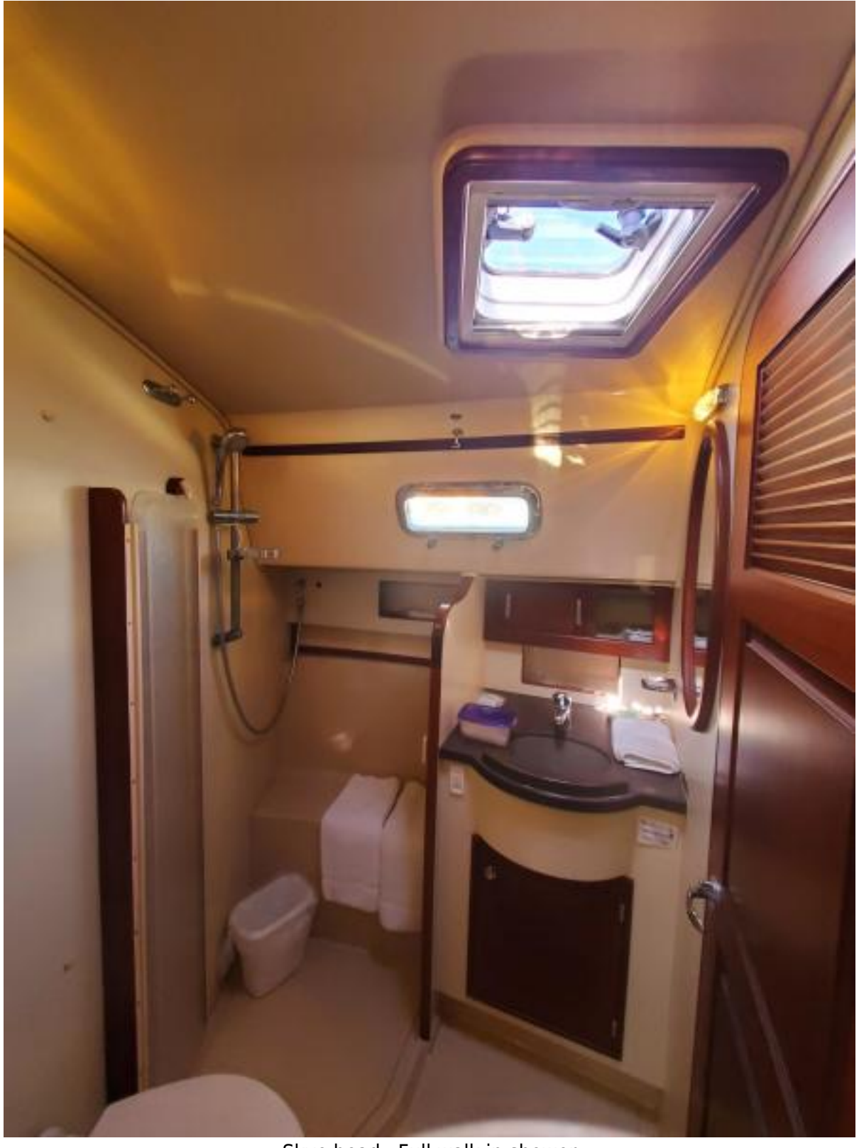
Skye head Full walk in shower