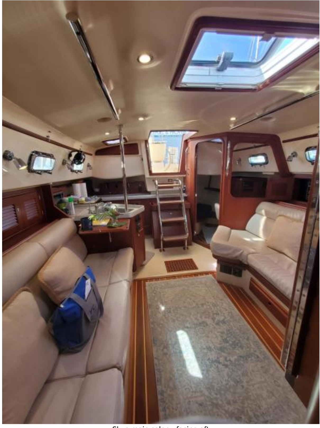
Skye main salon facing aft

Skip and Andrea King sailing@iyc.vi 340-344-2143