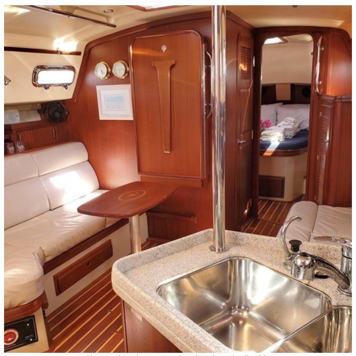
Skye main salon w/ optional teak cocktail table

Skip and Andrea King sailing@iyc.vi 340-344-2143