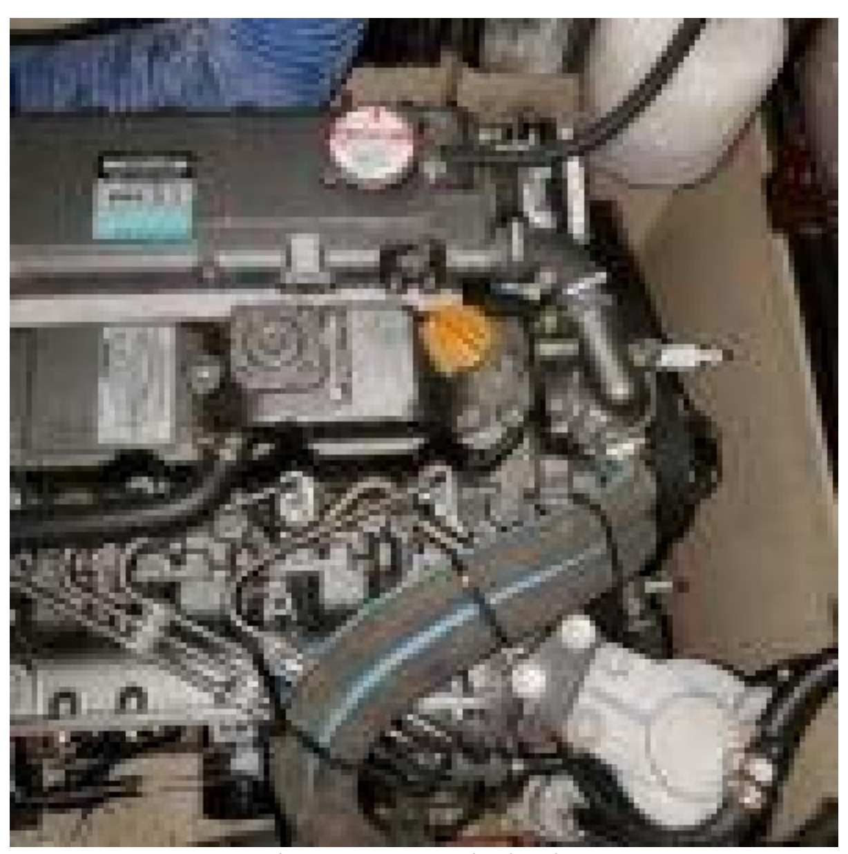
Skye 54HP Yanmar Diesel engine